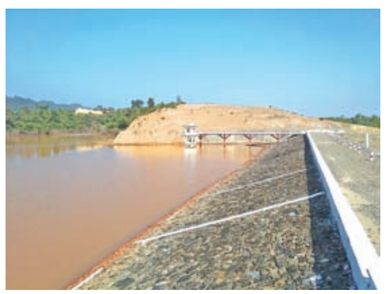
The State government has spared no effort to take measures against bank erosion and to build retaining walls.