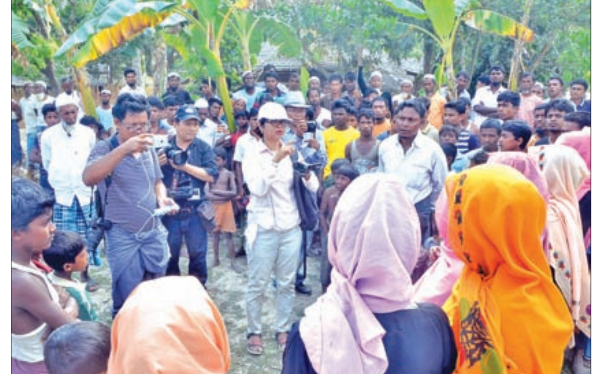
Members of media interview local women in Maungtaw, Rakhine State on 30th March 2017.

The media group conducted by the Ministry of Information will independently cover news from 28 March to 1 April. The media are TV Asahi, the BBC, the VOA, EPA, Nippon, Fuji