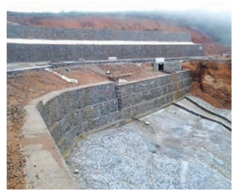
Retaining wall along the Minbu-An-Sittway Road.