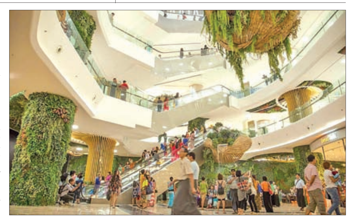
Visitors are seen at Junction City Shopping Centre in Yangon.

YCDC granted permits to the previous owners of the shops after redevelopment of new Bogyoke market.-Ko Htet