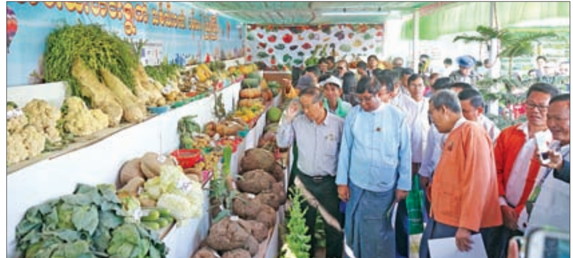
Rakhine State Chief Minister U Nyi Pu inspects vegetables exhibited at the Fruits and Vegetables Exhibition.