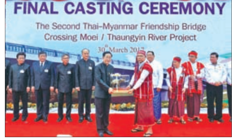
Amyotha Hluttaw Speaker Mahn Win Khaing Than presents souvenir to Thai official at final casting of the 2nd Thai-Myanmar friendship bridge.

The Kayin State Hluttaw speaker, state-level ministers and officials from the Ministry of Construction cut the ribbon to open the new concrete road. Similarly, they opened Eindu-Zarthapyin Road and posed for documentary photo before strolling along the road. —Myanmar News Agency