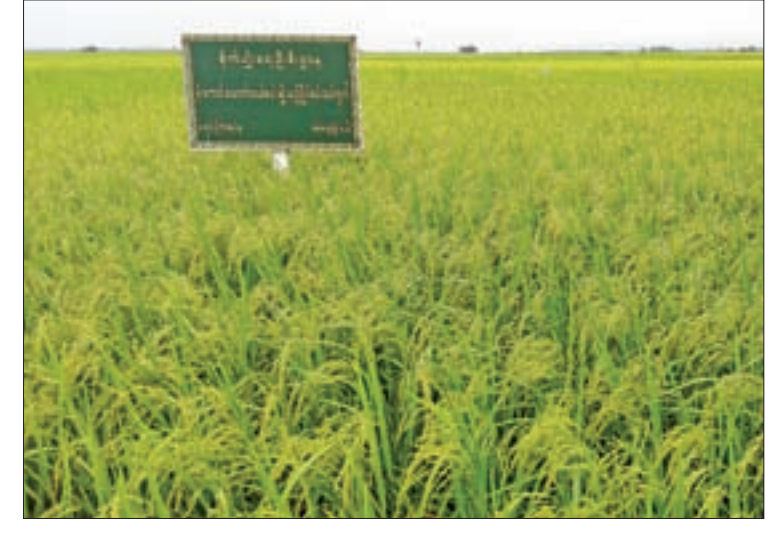
Pilot plantation of paddy in rain-fed field in Sittway.

Government pays special attention to stability and law enforcement in Maungtaw area. SEE PAGE 12 >>