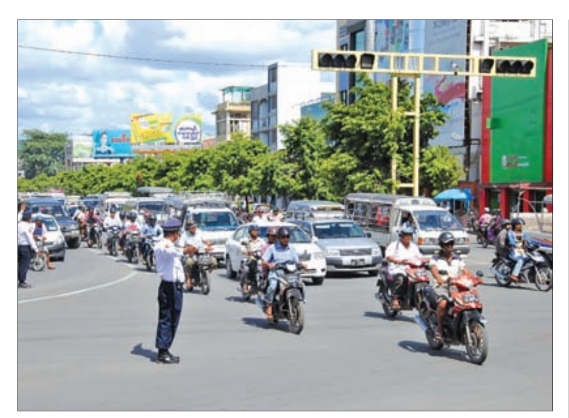
A traffic police directs vehicles and mortorcycles in Mandalay.