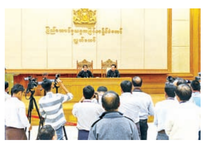
Speaker of Pyithu Hluttaw speaks to media.