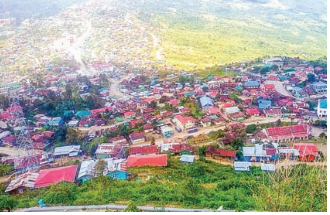
The aerial view of Haka City, Chin State. PHOTO: MYITMAKHA News AGENCY

Normally water is available only from the mountain stream in old Haka town . The water sellers are carrying the water from Old Haka town and Thi river and sell them back.-Myitmakha News Agency