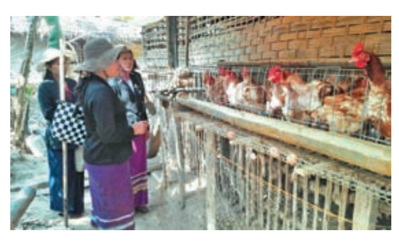
Officials from the Veterinary Department inspect chicken farm. PHOTO: MNA

Yarmaung Suspension Bridge on the Yangon-Sittway Road. PHOTO: MNA