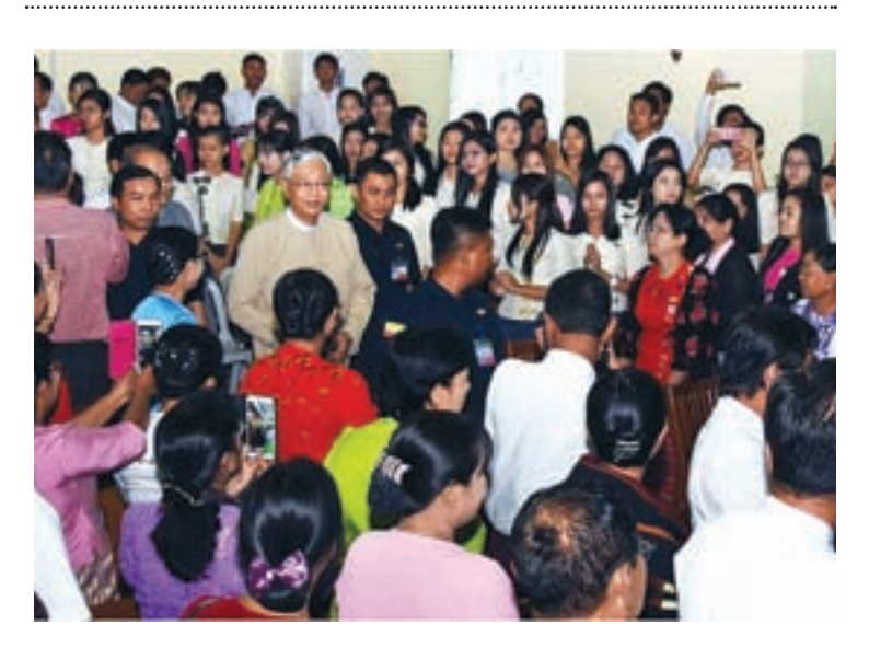
President U Htin Kyaw greets warmly with the people.

(Excerpt from the message sent by President U Htin Kyaw on the occasion of the New Year on 1 January 2017.)