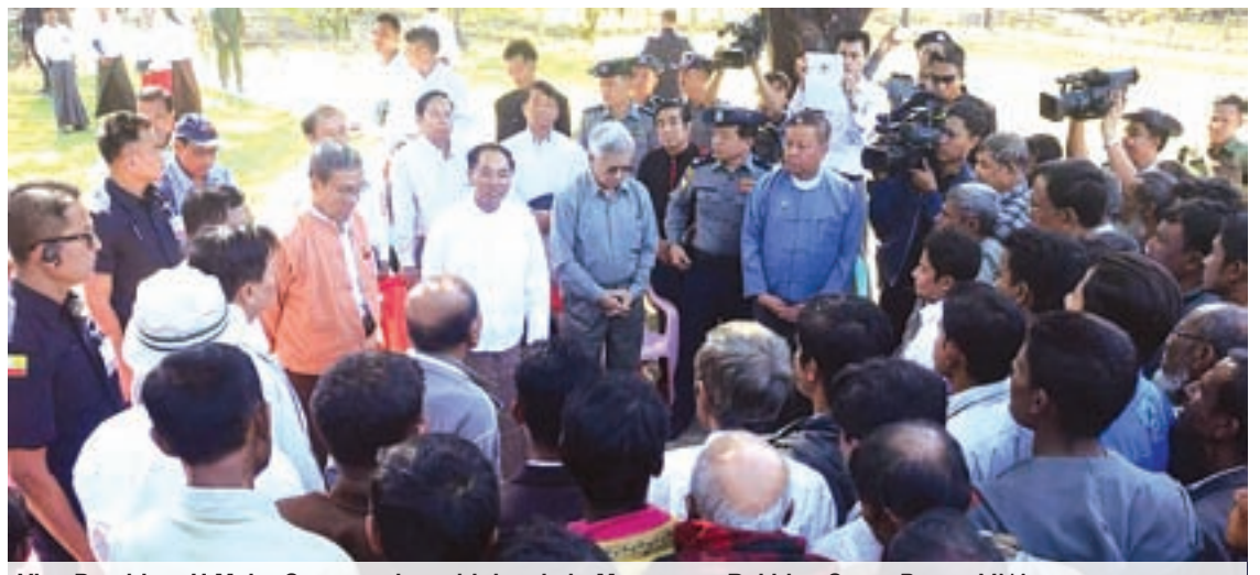
Vice President U Myint Swe meeting with locals in Maungtaw, Rakhine State.