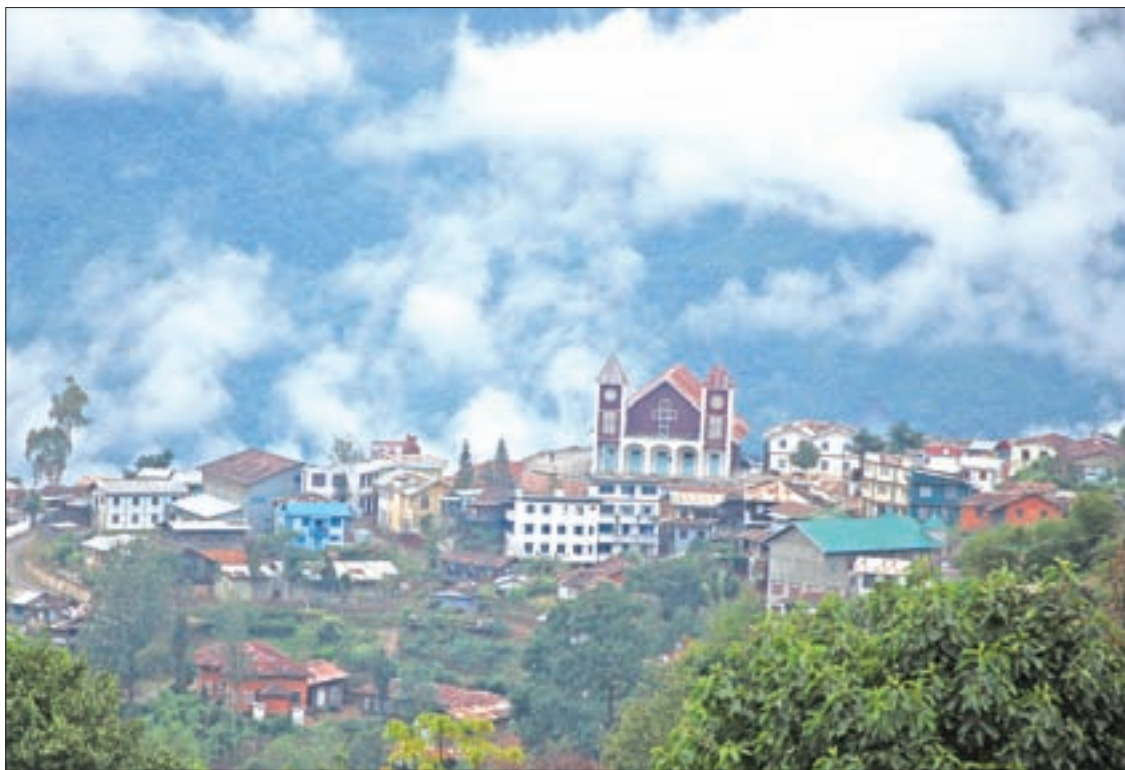
A file photo shows an aerial view of Tiddim Township, Chin State.