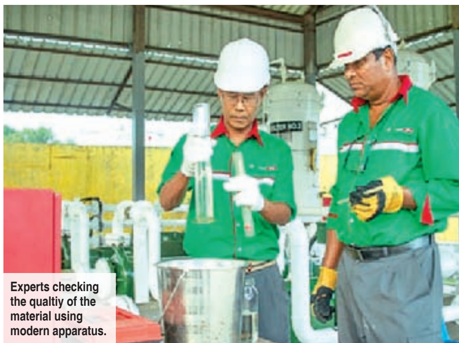
Experts checking the quality of the material using modern apparatus.