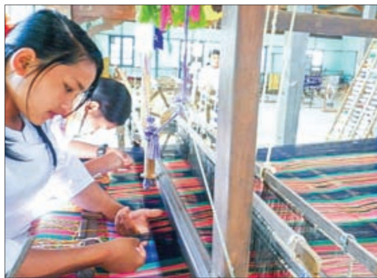
Trainees weaving traditional Chin garments.

The Chin State Government aims to develop highland farming and production of organic crops, development of livestock breeding, development of inner state roads and inner state roads connecting with other regions, boosting development of small and medium enterprises, supplying adequate electricity to the region, boosting tourism, uplifting city development efforts, boosting the potential of human resources, elevating education, health and other sectors, reducing poverty and unemployment and increasing job opportunities, increasing investment and trade within the region and the border, and encouraging research into Chin State's socio-economic development.