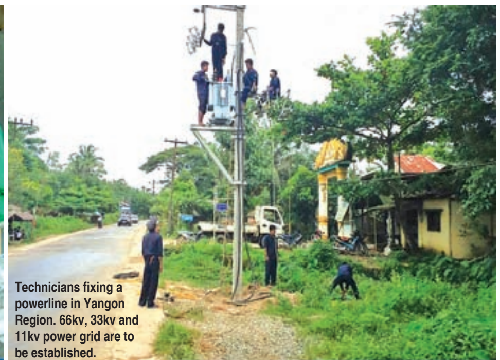
Technicians fixing a powerline in Yangon Region. 66kv, 33kv and 11kv power grid are to be established.