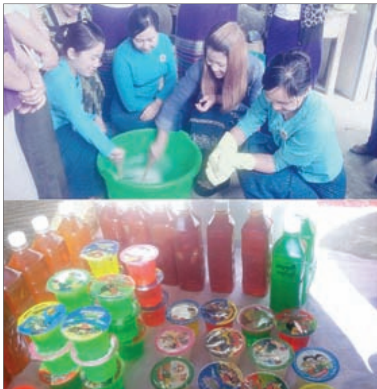
Vocational training in Haka City.