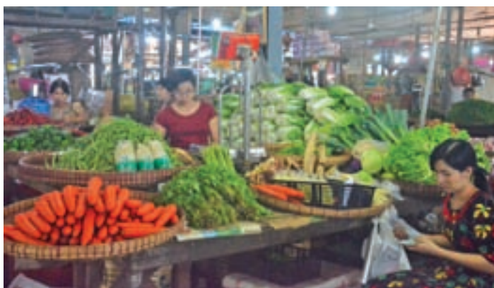
A grocer selling fresh vegetable in Yangon.