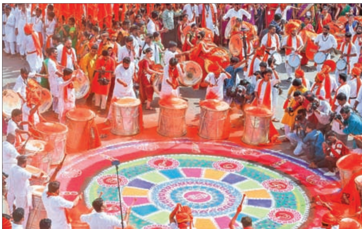
People play drums as they attend celebrations to mark the Gudi Padwa festival, the beginning of the New Year for Maharashtrians, in Mumbai, India, on 28 March, 2017.

“Picasso Primitif” runs from Tuesday until July. —Reuters