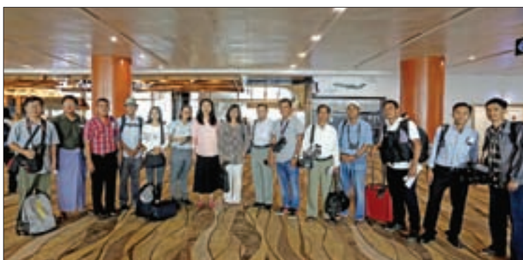
Local and foreign correspondents are seen at Yangon International Airport before their departure for Rakhine State.

A media group visited Maungdaw previously in December 2016 for the first time since the October attacks on border outposts that killed nine policemen.— Myanmar News Agency