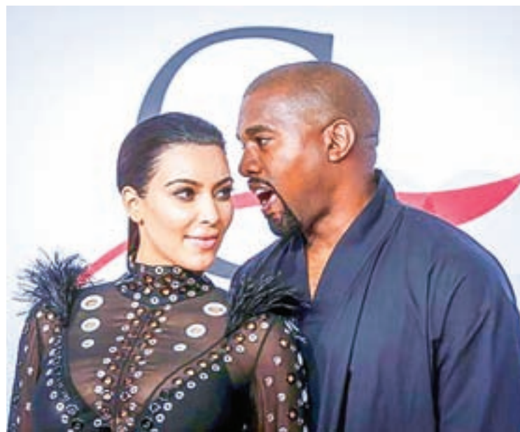
Kim Kardashian and Kanye West .PHOTO: REUTERS

“Kim and Kanye were seated in a private room with several other tables, but the room was reserved just for the two of them,” a source said, before adding, “they sat on the same side of the table and talked very quietly.” —PTI