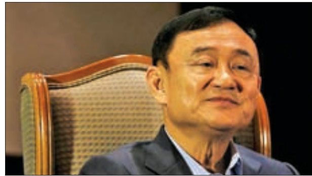
Former Thai Prime Minister Thaksin Shinawatra looks on as he speaks to Reuters during an interview in Singapore on 23 February, 2016.

“We need to exercise our right to appeal to show that no legal miracle can happen to collect tax from Dr Thaksin,” he said.