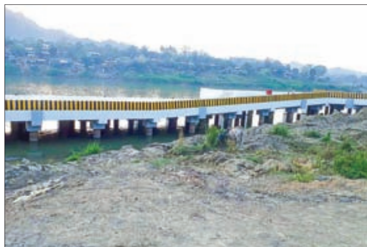
Walkway constructed near a jetty in Paletwa.