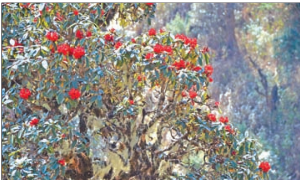
Symbol of Chin State, Taungzalat flowers (rhododendron) in full bloom.

The state experienced the shortage of food in the past. Therefore, the Chin State Government is working to build an international airport in northern Chin State and to build a jetty in the southern part.