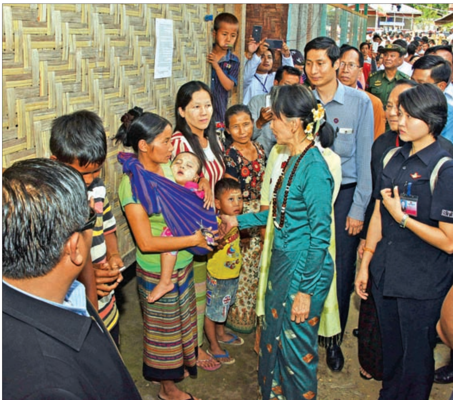
State Counsellor Daw Aung San Suu Kyi, centre, meets with inhabitants of an IDP camp outside of Myitkyina, Kachin State yesterday.