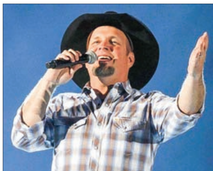
Country singer Garth Brooks .