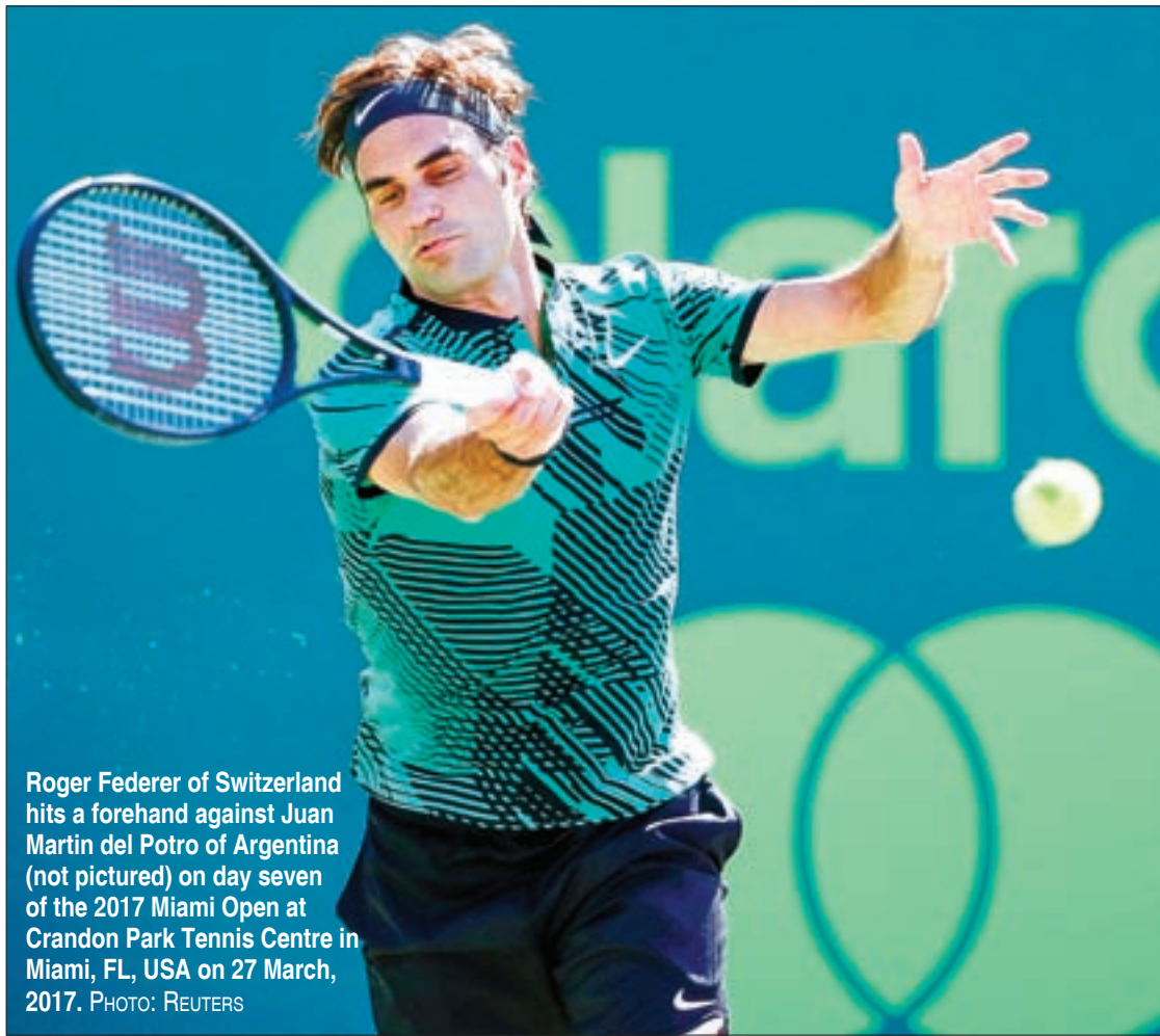
Roger Federer of Switzerland hits a forehand against Juan Martin del Potro of Argentina (not pictured) on day seven of the 2017 Miami Open at Crandon Park Tennis Centre in Miami, FL, USA on 27 March, 2017.

Czech 10 th seed Tomas Berdych beat 24 th seed Gilles Muller of Luxembourg 6-3, 6-4, while Adrian Mannarino of France edged Croatian Borna Coric 6-4, 2-6, 7-6(3).—Reuters