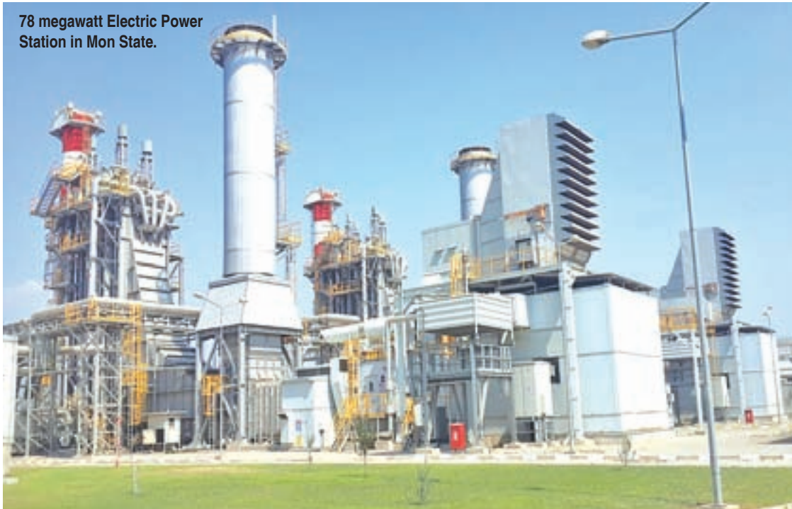
78 megawatt Electric Power Station in Mon State.

Out of 10.87 million households in Myanmar, 3.69 million (34% of the national populace) consumed power in the financial year 2015-2016, while in 2016-2017 4.05 million (37.24% of the whole populace) consumed power. It is learnt that power consumption rose by 3.24%.