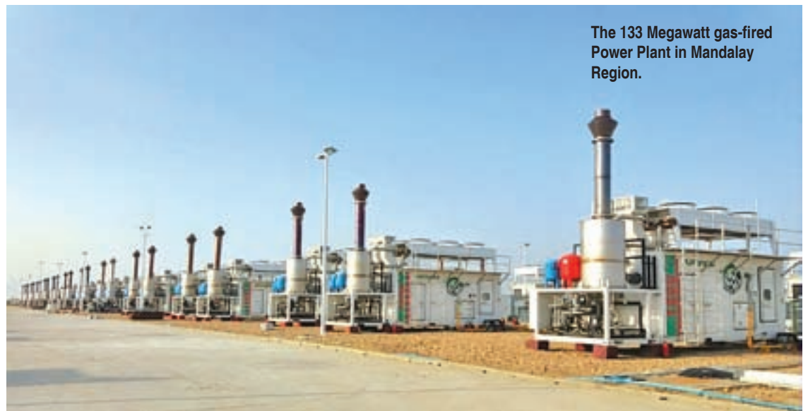
The 133 Megawatt gas-fired Power Plant in Mandalay Region.

In the day-time, the busiest hours of power consumption, making factories and mills stop their operations, reducing the production in state and privately-owned steels and melting factories, stopping water pumping from rivers can save 100 mega