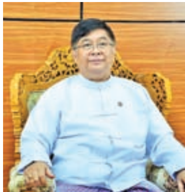
U Pe Zin Tun, Union Minister

During one-year period, extension and renovation of power plants, building upgraded power grid lines, implementing distribution of power with stable voltage & power-wastage-proof system and clearing away complicated service-wires were carried out, according to the Ministry.