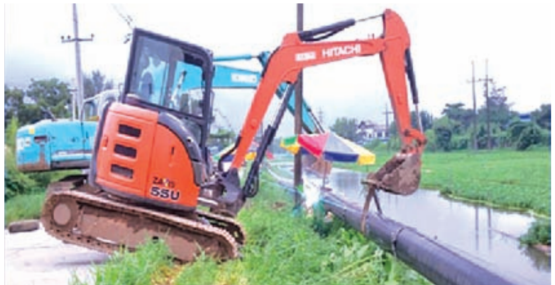
Fixing and replacing of natural gas pipelines along the Yangon and Mandalay Region.

U Pe Zin Tun, Union Minister for Electric Power and Energy said, “There have been many performances for the development of electricity and energy sectors in one-year-period. But I did not hope for people’s complete satisfaction over it. As for us who are serving people, we will perform our duties to the best of our calibre in our respective sectors.”