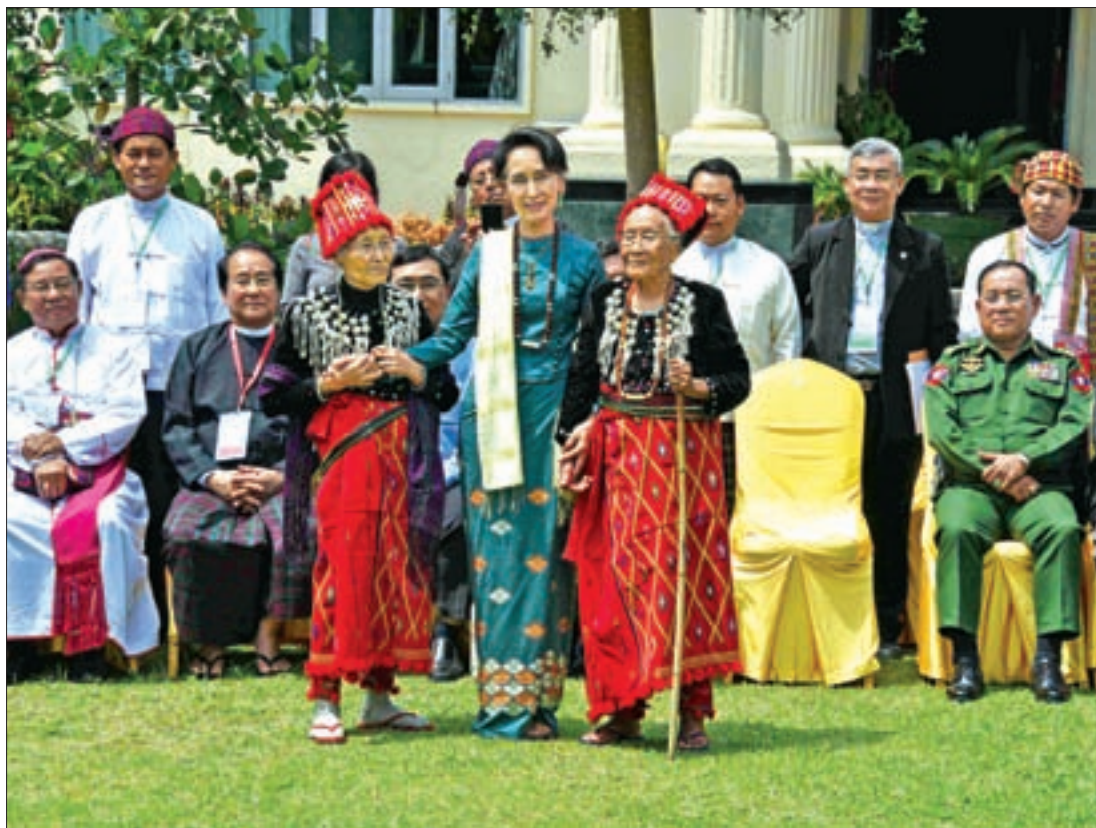
Daw Aung San Suu Kyi, centre, poses for a photo with two women who had a photo taken with Bogyoke Aung San, the father of State Counsellor, many years ago.