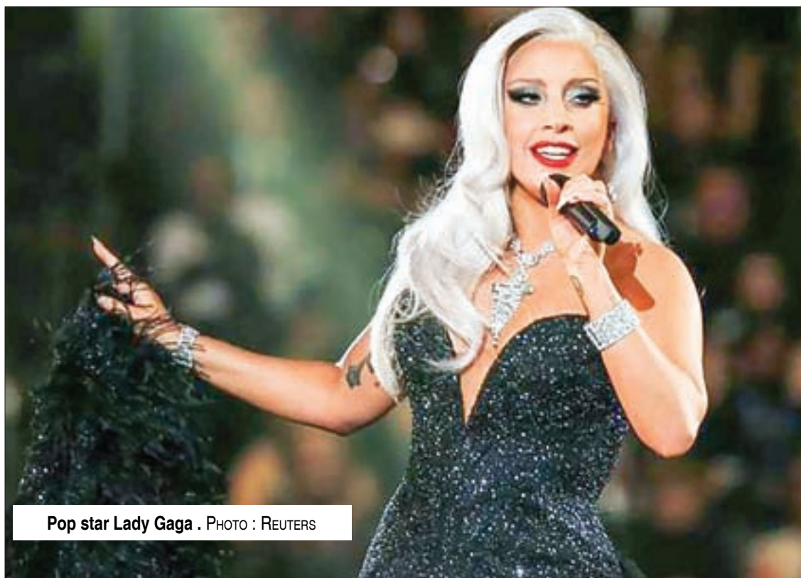
Pop star Lady Gaga .