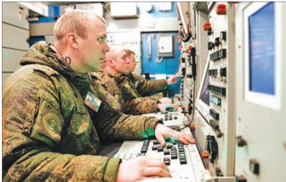
The Russian Army is also expecting a promising short-range anti-aircraft missile system by 2030-2035.