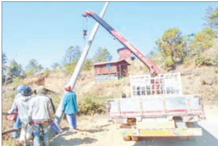
A concrete post for the 11Kv powerline in Haka erected.