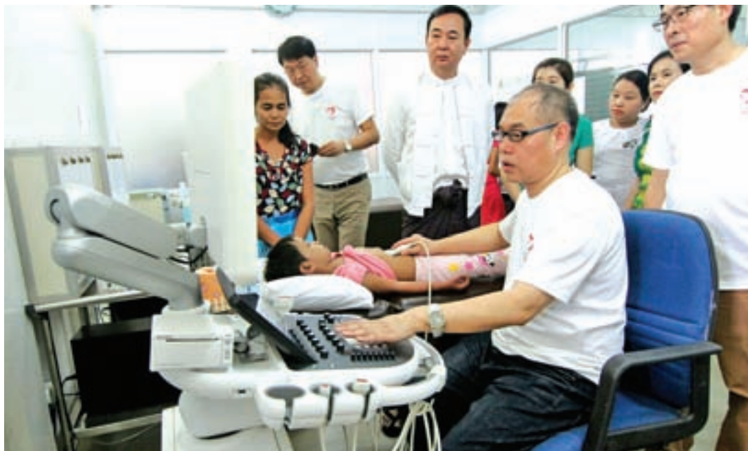
A cardiac specialist examines a child at Yankin Children's Hospital.