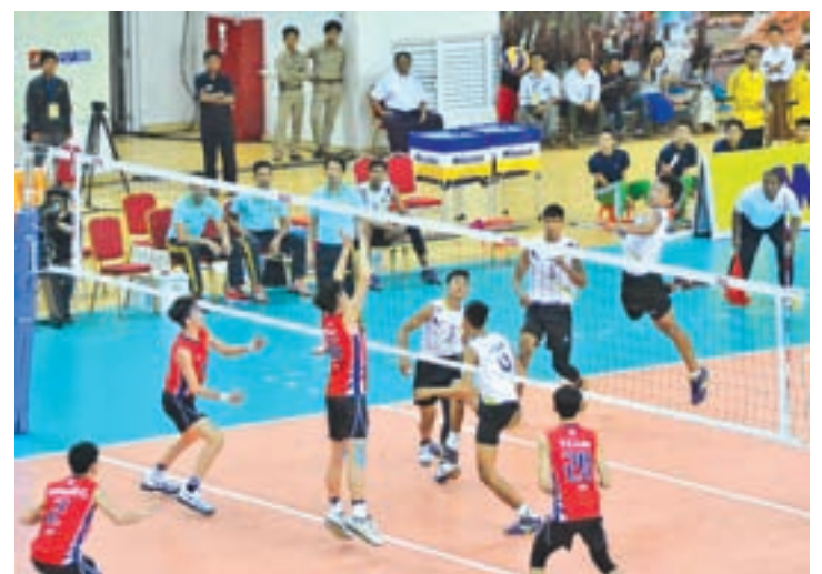
Myanmar vs Hong Kong compete at an opening match of the 11 th Asian Men's U-19 Volleyball Championship tournament.

The 11th Asian Men Under-19 volleyball championship tourney is an important event for the World U-19 Men's U-19 Volleyball Championship, which will be held in Bahrain in August. — Thura Zaw (MNA)