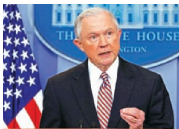
US Attorney General Jeff Sessions joins White House Press Secretary Sean Spicer for the daily press briefing at the White House in Washington, US on 27 March, 2017.

Sanctuary cities help illegal immigrants avoid deportation by limiting coop-