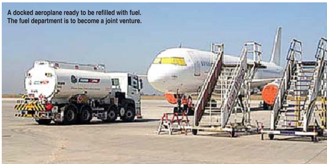
A docked aeroplane ready to be refilled with fuel. The fuel department is to become a joint venture.