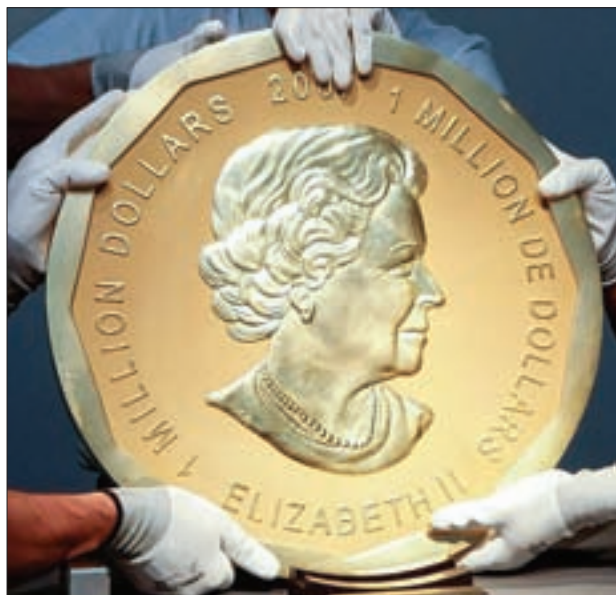
Picture taken in Vienna, Austria on 25 June, 2010 shows experts of an Austrian art forwarding company holding one of the world’s largest gold coins, a 2007 Canadian $1,000,000 “Big Maple Leaf”.

Police said it was probably stolen by a group of thieves who entered the museum undetected through a window, pos-