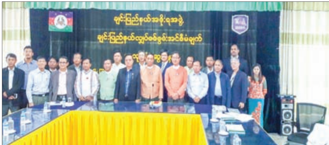
Documentary photo of Chin State's meeting for dispersing electricity 11 to 12 October 2016.