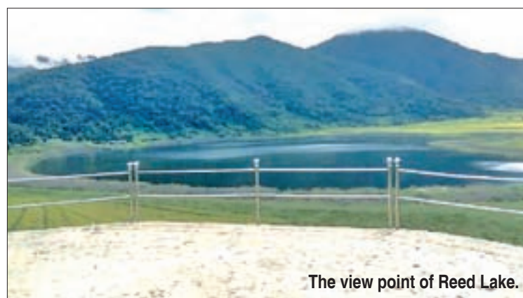
The view point of Reed Lake.

Students from Haka, Falam, Htantalan are now able to study academic disciplines in the arts and sciences. Haka Education College is under construction and is expected to be opened in the 2017-2018 academic Year.