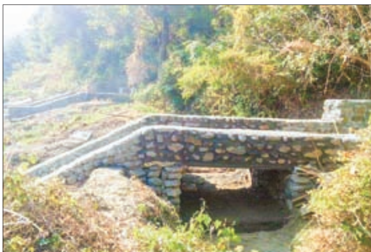
Canal bridges in Thinchang Village in Mindat Township.