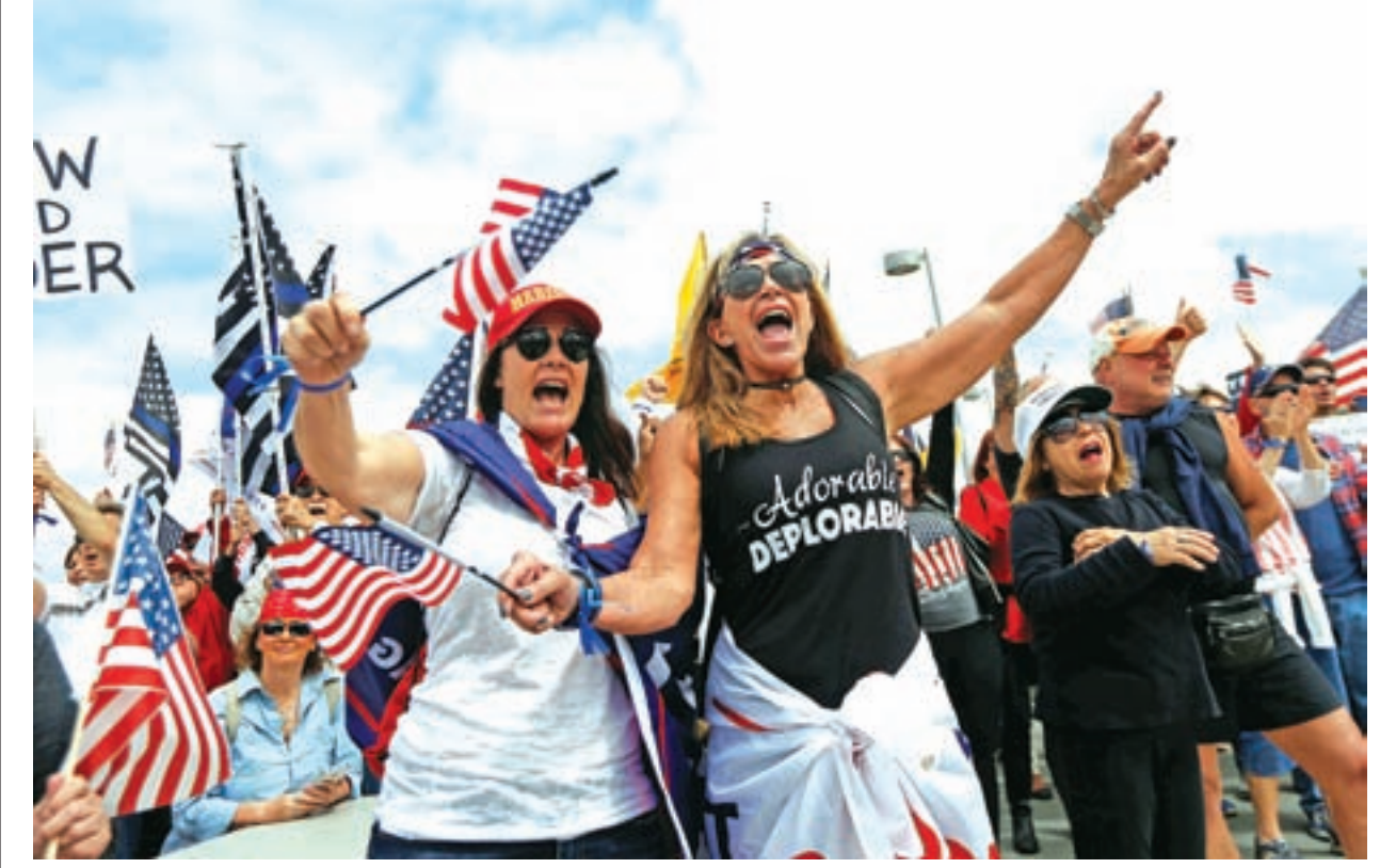
Demonstrators protest at the beach in support of US President Donald Trump during a rally in Huntington Beach, California, US on 25 March, 2017.

HUNTINGTON BEACH, Calif — Supporters of President Donald Trump holding a rally on a popular southern California beach clashed with counter-protesters on Saturday and four people were arrested, law enforcement said.