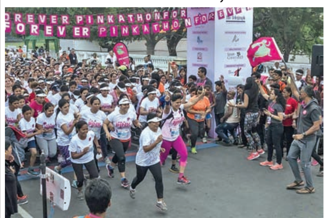
People participate in Pinkathon in Kolkata, India on 26 March, 2017. Pinkathon is a women's running event aiming to encourage women's health and fitness and create awareness for breast cancer.

People participate in Pinkathon in Kolkata, India