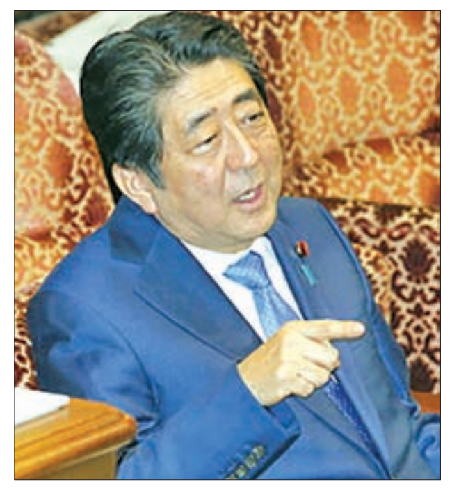
Japanese Prime Minister Shinzo Abe attends a session of the House of Councillors budget committee in Tokyo on 24 March 2017. The approval rating of his Cabinet slipped 3.3 percentage points to 52.4 per cent, falling only slightly despite a growing political scandal involving alleged influence-peddling in a cut-price land deal, a Kyodo News poll showed on 26 March.

The poll found that 58.7 per cent said they cannot understand the explanation given by Abe, while