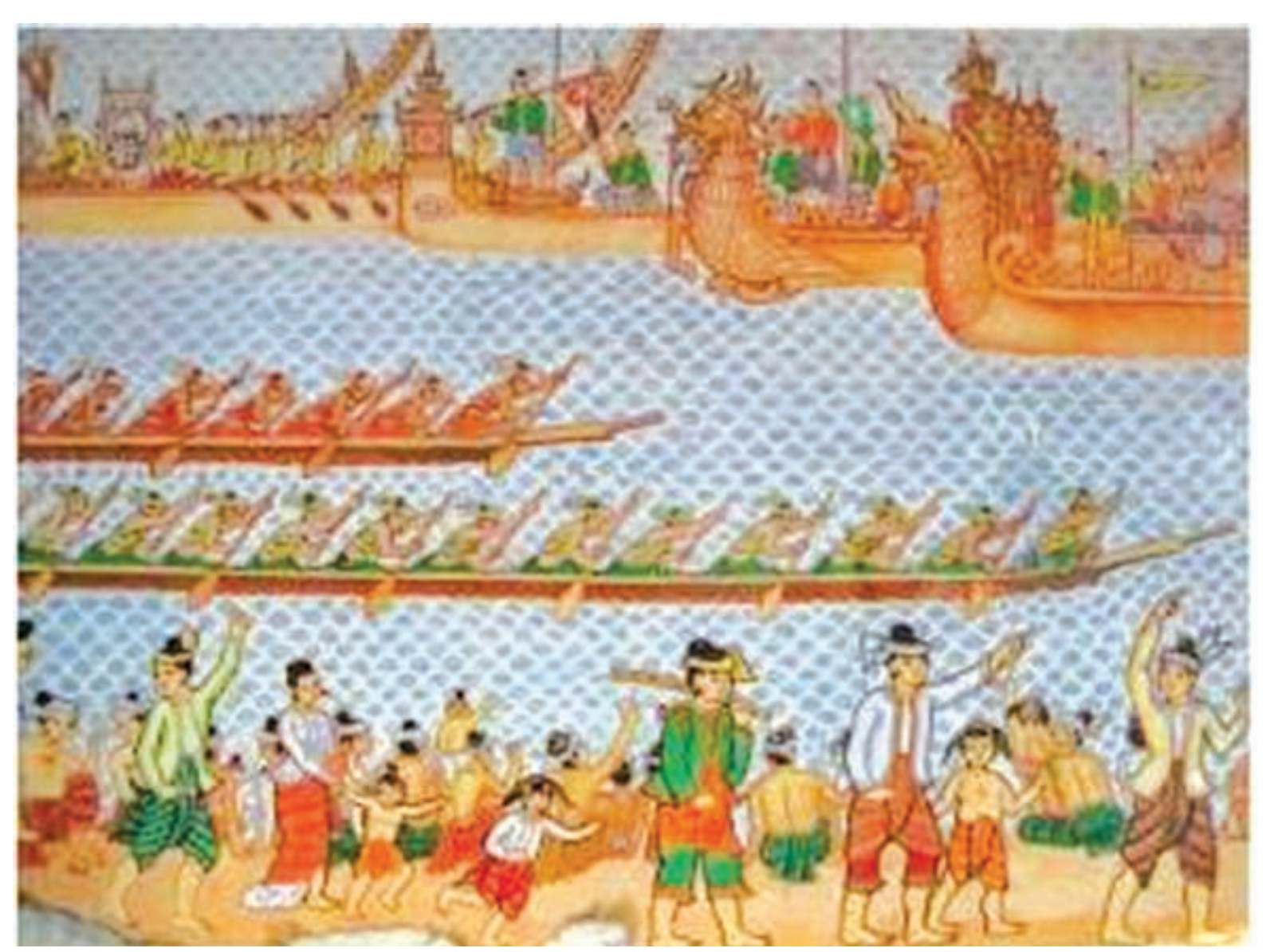
Boat racing plays an important role in the recruitment of soldiers during the time of kings.

Although the Portuguese galleons were equipped with strong sails and oars they could not withstand Hurricane and Cyclone. Sea routes in those days were fraught with piracies in which the Portuguese themselves participated largely. Therefore stations for guese tried to secure them either nates. On the coastlines around the Bay of Bengal, the Rakhine Province, Myanmar deltas, and along the Teninthayy strip were a chain of Portuguese bases either