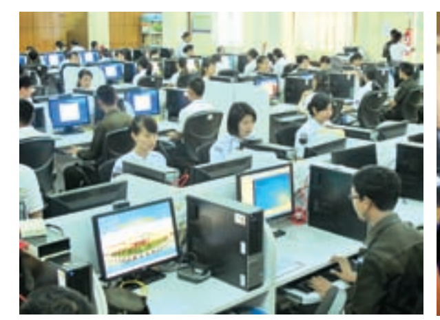
Careful evaluation in process after viewing the results of the 2014 census.

Under the registration card issuance program, 41,892 migrant workers in Thailand have received the card so far up to 23-2-2017.