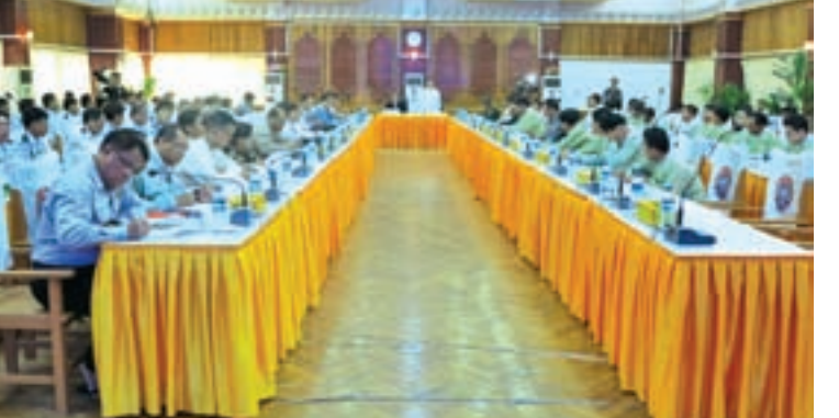
Union Minister U Thein Swe meets with members of Rakhine's Immigration and National Registration Committee in Sittway.