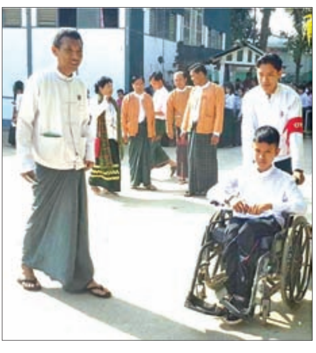
The volunteer assists a disable student.

Ethnic language, literature and culture associations have compiled syllabus for 49 ethnic languages that will be taught at schools under the supervision of region.