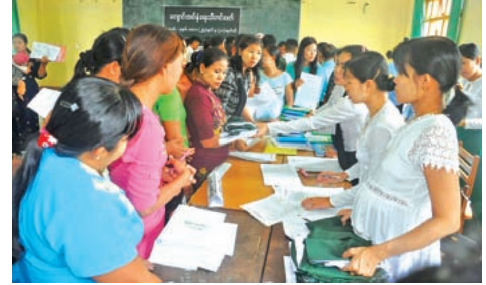
Teachers taking part in school entrolment week in May 2016.