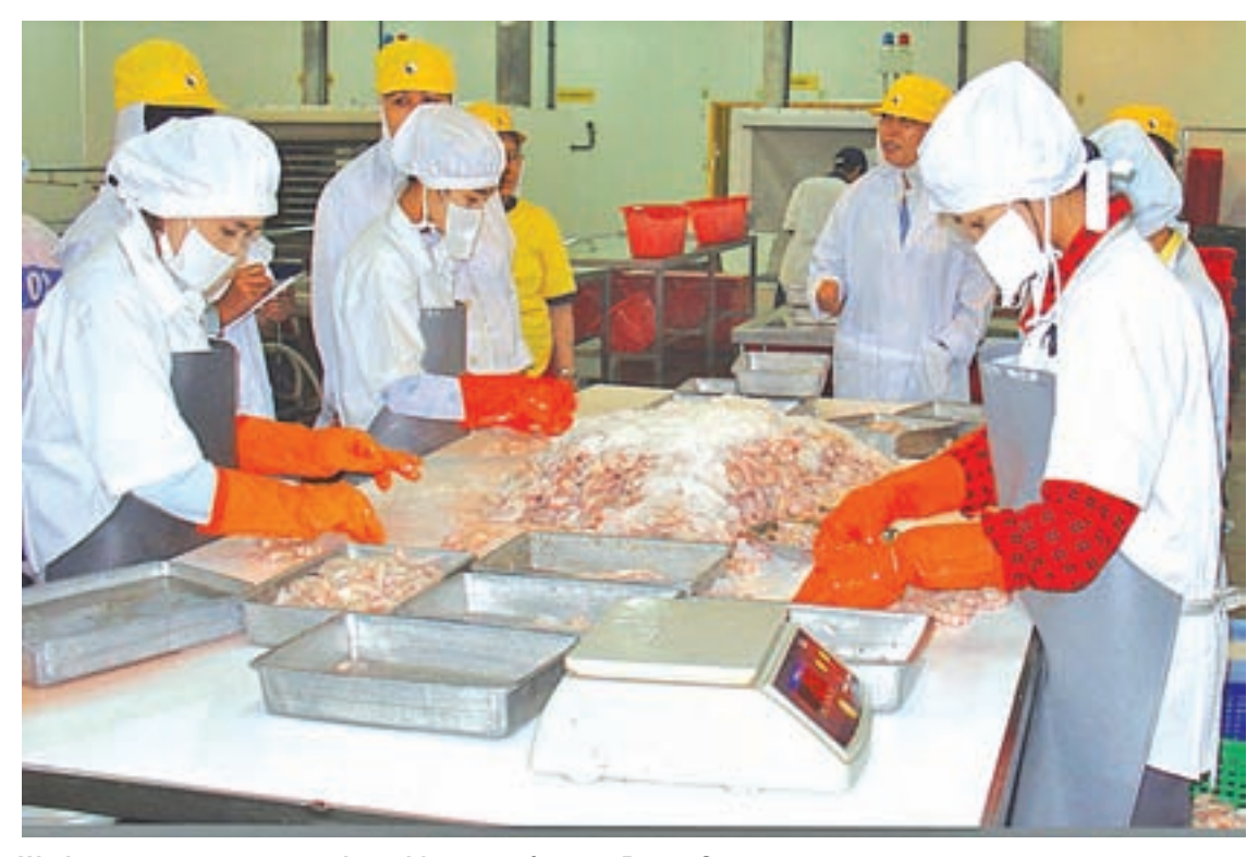
Workers sort out prawns at the cold-storage factory.

THE export of fishery products as of 10th March this Fiscal Year hit US$525.986million, which is an increase of US$93.929million from that of the similar point last FY, according to statistics released by the Commerce Ministry.