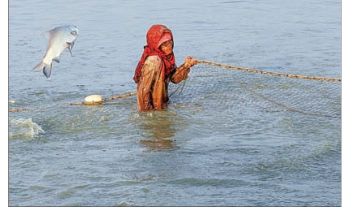
A fish jumps over a net as a boy works in a fish farm at Htantapin township in Yangon, on 18 February 2016.

Over 22 million euros to be spent on Myanmar aquaculture