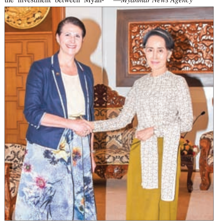
State Counsellor Daw Aung San Suu Kyi shakes hands with Australian Senator at the Ministry of Foreign Affairs.

And, the Australian senator disclosed that Australia would stand up for the Myanmar's effort towards Rakhine State affairs and peace process. -Myanmar News Agency