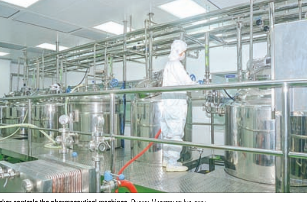
Worker controls the pharmaceutical machines.

The upgrade factory is now producing quality glass with Myanmar floral designs to be used in making furniture and glass tables. In addition, the ministry is in coordination with relevant individuals for manufacturing buses based on Korean technology for public transport.