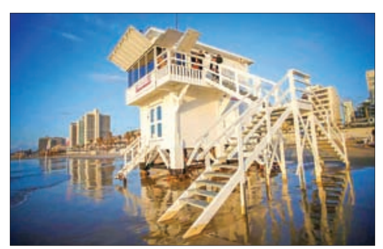
People help decorate a lifeguard tower as it is renovated into a luxury hotel suite, as part of an international online competition, at Frishman Beach in Tel Aviv, Israel on 13 March, 2017.

Fifteen winners from Europe will stay in the suite before it is taken down in two weeks. Plans are in the works for a similar pop-up hotel in Jerusalem's Old City, Halevi said.— Reuters