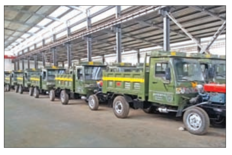
Tractors produced by the Ministry of Industry. Photo: MINISTRY OF INDUSTRY A worker assembles the vehicle. Photo: MINISTRY OF INDUSTRY