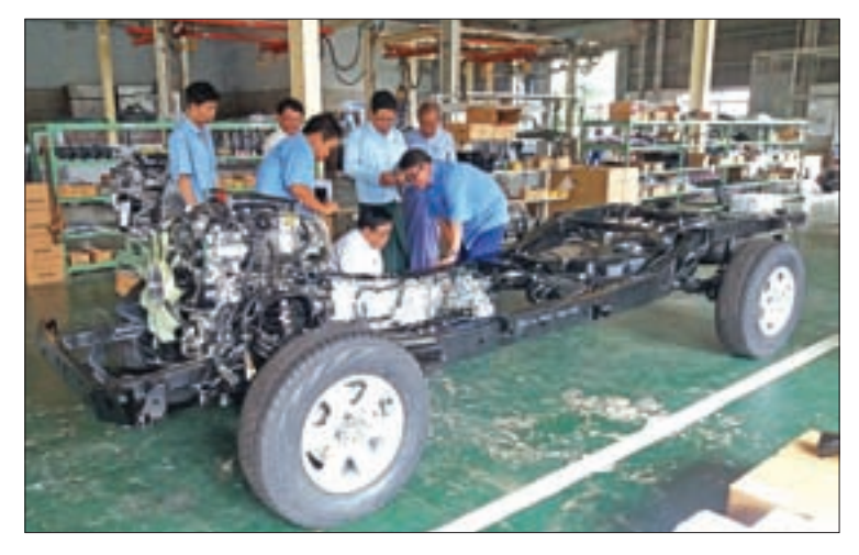
Technicians assemble a tractor.

As arrangements are being made to recognize as Testing Centers by National Skill