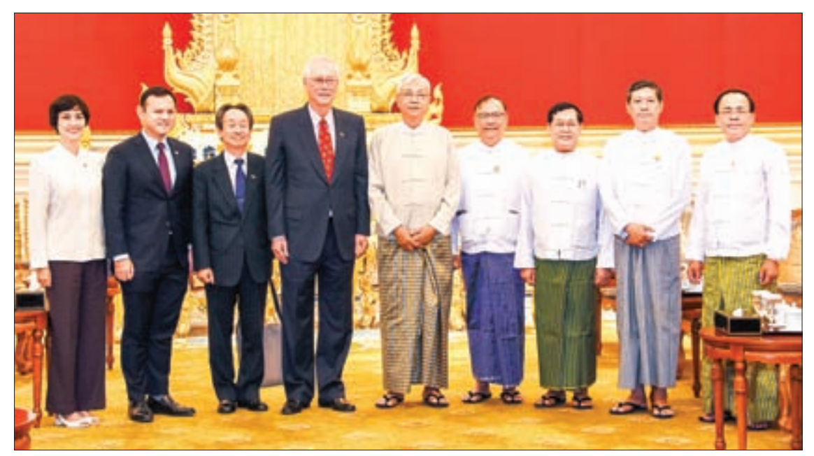
President U Htin Kyaw poses for a documentary photo with Singapore's Emeritus Senior Minister Goh Chok Tong and delegation in Nay Pyi Taw.