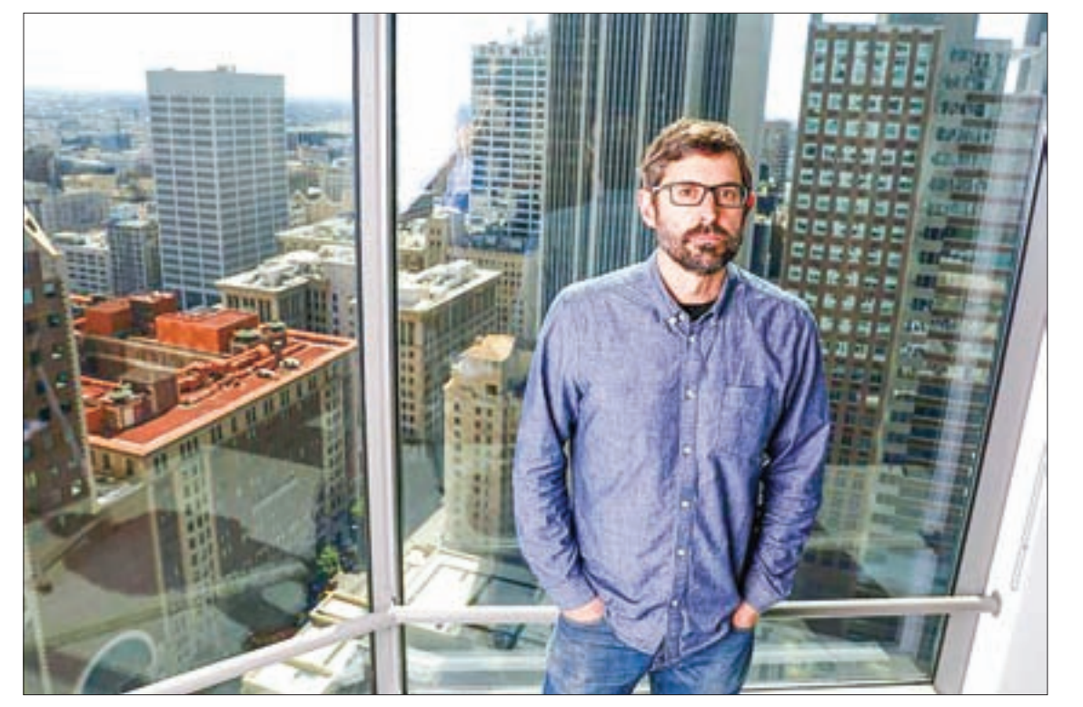
Louis Theroux, writer and star of documentary "My Scientology Movie," poses for a portrait in Los Angeles, California, US on 7 March, 2017.