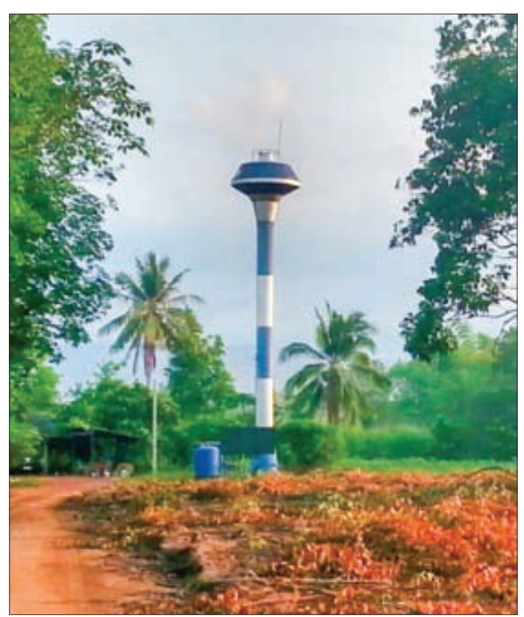
Village water supply system in rural Thailand.

At first, that situation struck me with awe and confusion, because it was totally different from what I had learned from my geography lessons. However, I later realized the truth. It was due to the well thought out and planned water resources engineering pro-