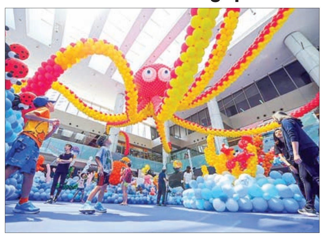
Children play among balloons in the balloon exhibition "Sea of Wonder" at the Marina Square in Singapore on 15 March, 2017. The "Sea of Wonder" balloon exhibiton, to last till 19 March, displayed 10,000 balloons.