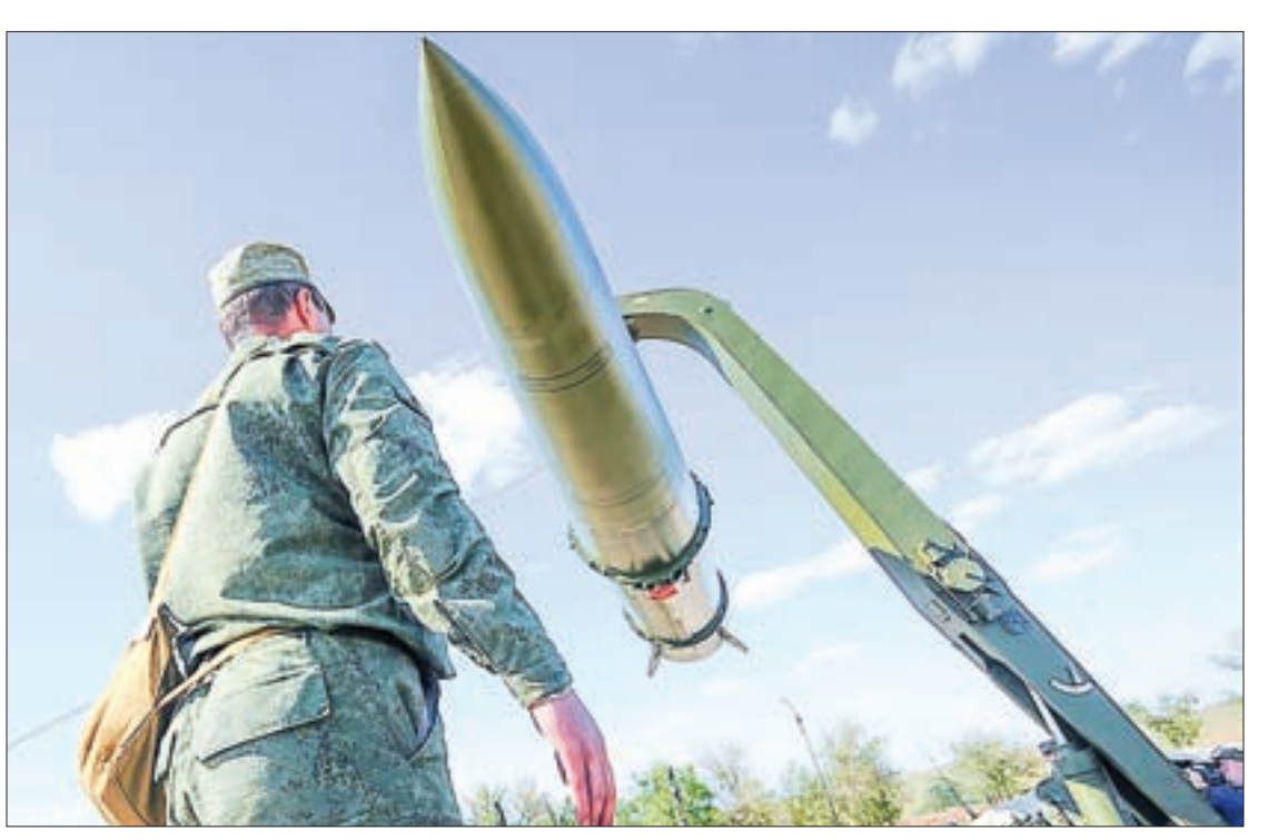
Russia's Aerospace Force plans to carry out 15 launches of carrier rockets in 2017.

Printed and published at the Global New Light of Myanmar Printing Factory at No.150, Nga Htat Kyee Pagoda Road, Bahan Township, Yangon, by the Global New Light of Myanmar Daily under Printing Permit No. 00510 and Publishing Permit No. 00629.