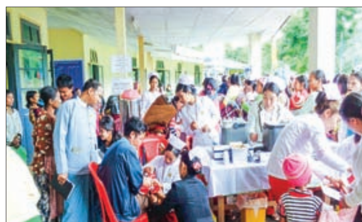
Nurses vaccinates children in the Naga Self-administered Zone.

Gale (strong wind) also occurred in the region and caused damages in which 836 houses