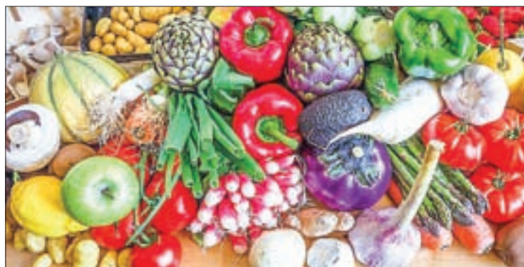
Eating more vegetables and less meat benefits the planet as well as our health.

Researchers have repeatedly linked some health risks to a diet of red and processed meats, and environmental scientists have repeatedly identified cattle and other livestock as an expensive way – in