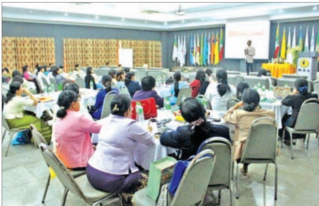
Workshop at a bank informing the change in the national auditing process in 2016.