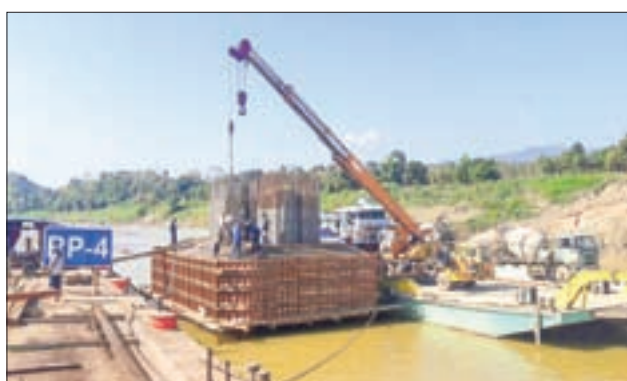
Chindwin Bridge (Kamti) is under construction.