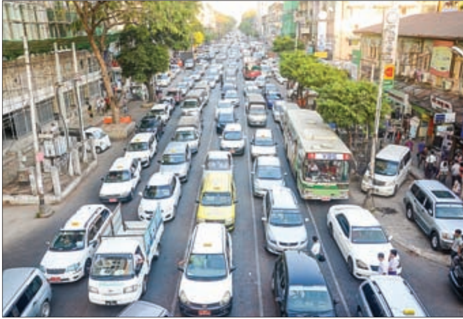
Vehicles are seen in a traffic jam on a road in Yangon.

The initial vehicle registration will be issued in the presence of advanced income tax receipts beginning 1st April. Previously, there were 50 cars applying for registration a day, at