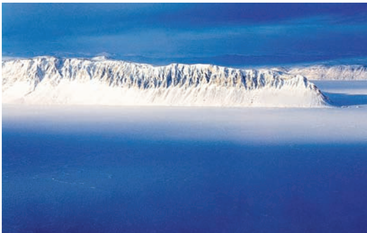
Eureka Sound on Ellesmere Island in the Canadian Arctic is seen in a NASA Operation IceBridge survey picture taken on 25 March, 2014.

The study, separating man-made from natural influences in the Arctic atmospheric circulation, said that a decades-long natural warming of the