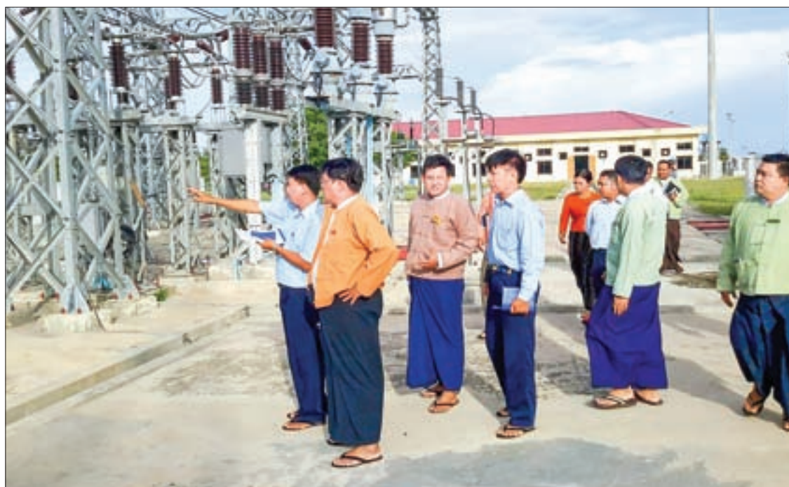
Sagaing Region Chief Minister Dr Myint Naing inspects the sub-power station in Monywa.

With new six sub-power stations, expansion of nine sub-pow-