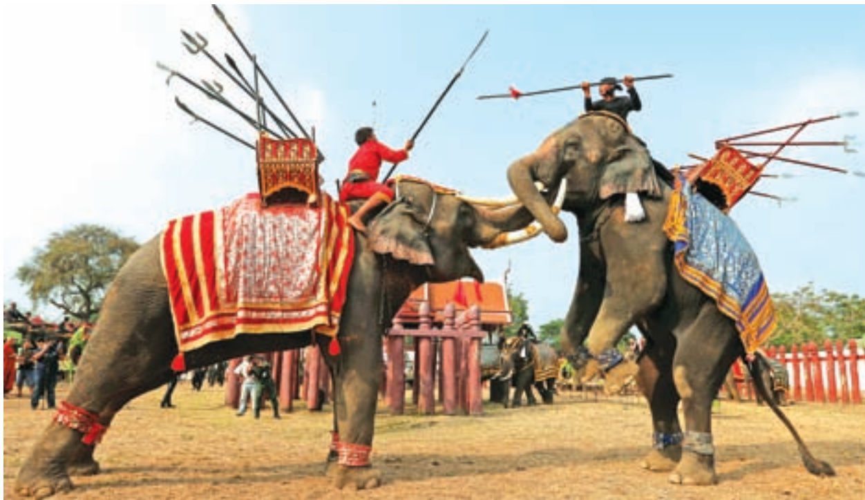
Thai mahouts take part in an elephant fighting demonstration during Thailand's national elephant day celebration in the ancient city of Ayutthaya, on 13 March 2017.

BANGKOK — Five dozen elephants used their trunks on Monday to scoop up bananas, melons and pineapples from baskets at a special buffet laid on in Thailand's ancient capital of Ayutthaya to celebrate the national animal.