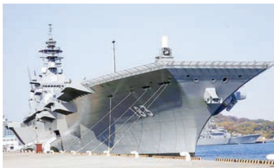
Japan Maritime Self Defense Force's helicopter carrier Izumo is seen at JMSDF Yokosuka base in Yokosuka, south of Tokyo, Japan on 6 December, 2016.

Park and Choi both denied wrongdoing and while she was president, Park declined to answer prosecutors' questions.— Reuters