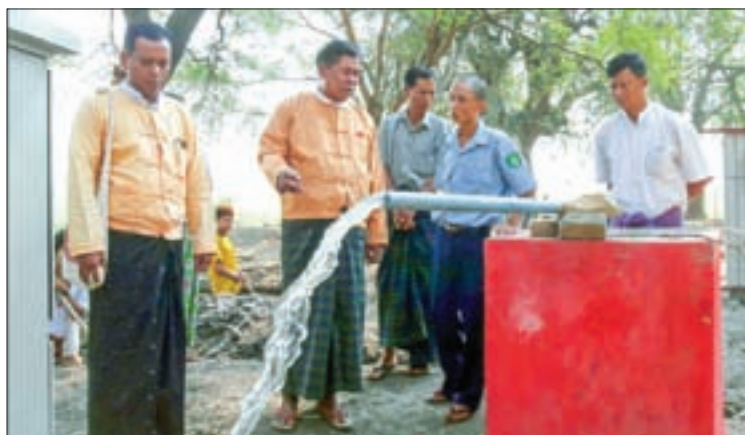
MPs inspect water supply in Salingyi.