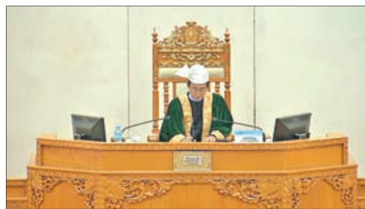
Speaker of Pyithu Hluttaw U Win Myint.

He continued that the ministries concerned presented the