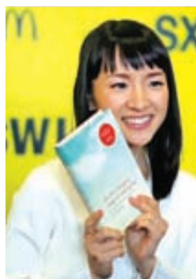
Japanese author and creator of the KonMari Method to declutter, Marie Kondo, poses with one of books for a fan's photograph during a book signing at the South by Southwest (SXSW) Music Film Interactive Festival 2017 in Austin, Texas, US, on 11 March 11, 2017.

AUSTIN (Texas) — The newest tool for internationally acclaimed organizing guru Marie Kondo in her global battle against messy rooms is an app.