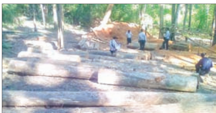
Authorities inspect illegal timber seized in Sagaing Region.