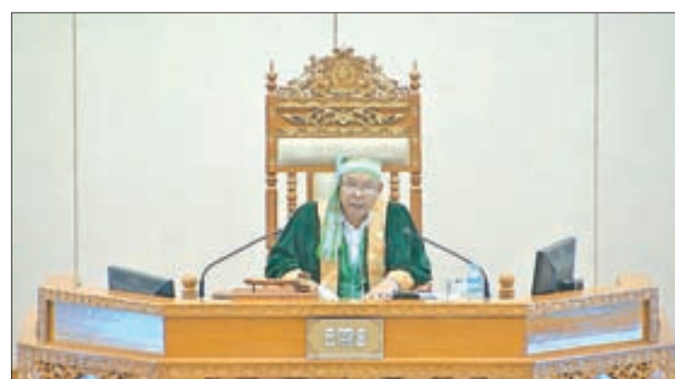
Speaker of Amyotha Hluttaw Mahn Win Khaing Than.

The committee submitted its findings, analyses and advice for the cases to the speaker of Amyotha Hluttaw and transferred the case letters to the Land Scrutiny Committee for the confiscated lands in States and Regions. There were seven letters about Kachin State, one letter about Kayah State, one letter about Taninthayi Region, nine letters about the Sagaing Region, 10 letters to Bago Region, 11 letters