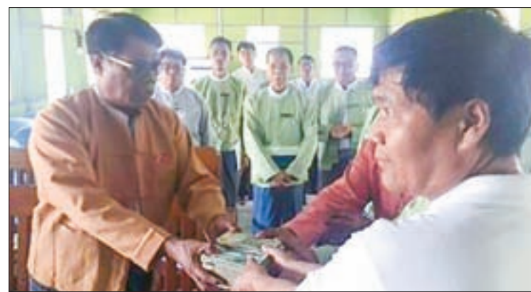
Sagaing Region Chief Minister Dr Myint Naing presents cash assistance to the people affected by strong wind and hailstones.

Chindwin River water pumping station and purifying plant are currently constructed in Monywa to supply clean water to the people. Besides, in the 2016-2017 Fiscal Year, the government drilled tube-wells and built lakes and water supply facilities.