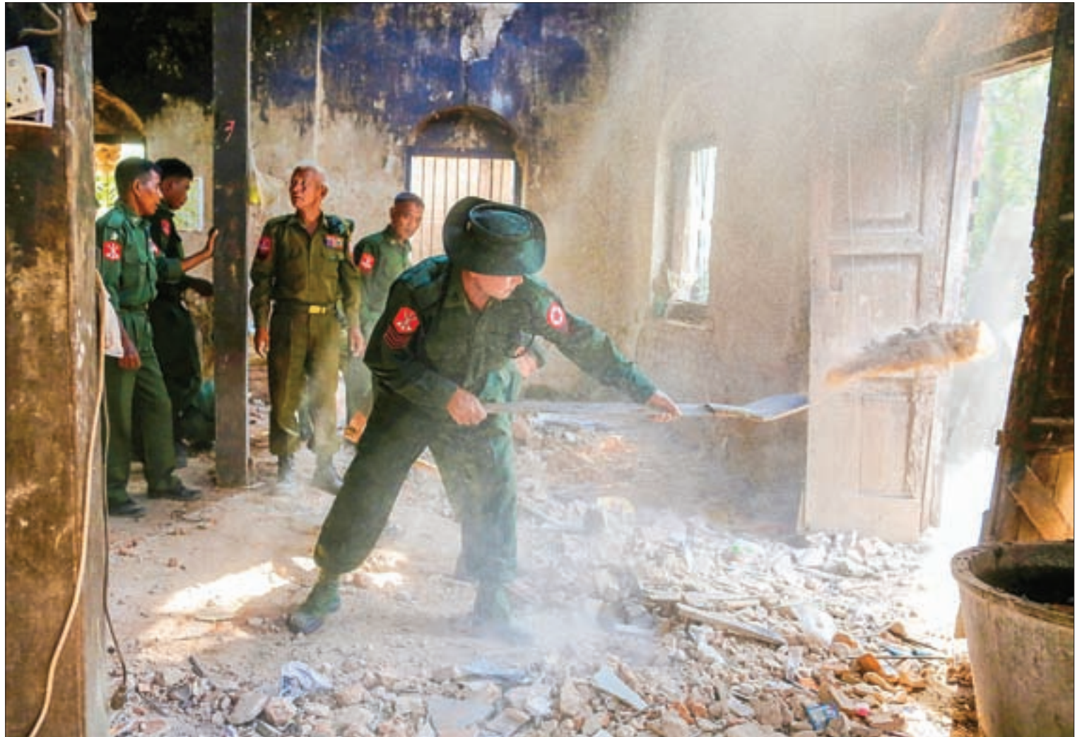
Soldiers remove debris from a damaged building after an earthquake at Taikkyi township in Yangon Region on Monday.