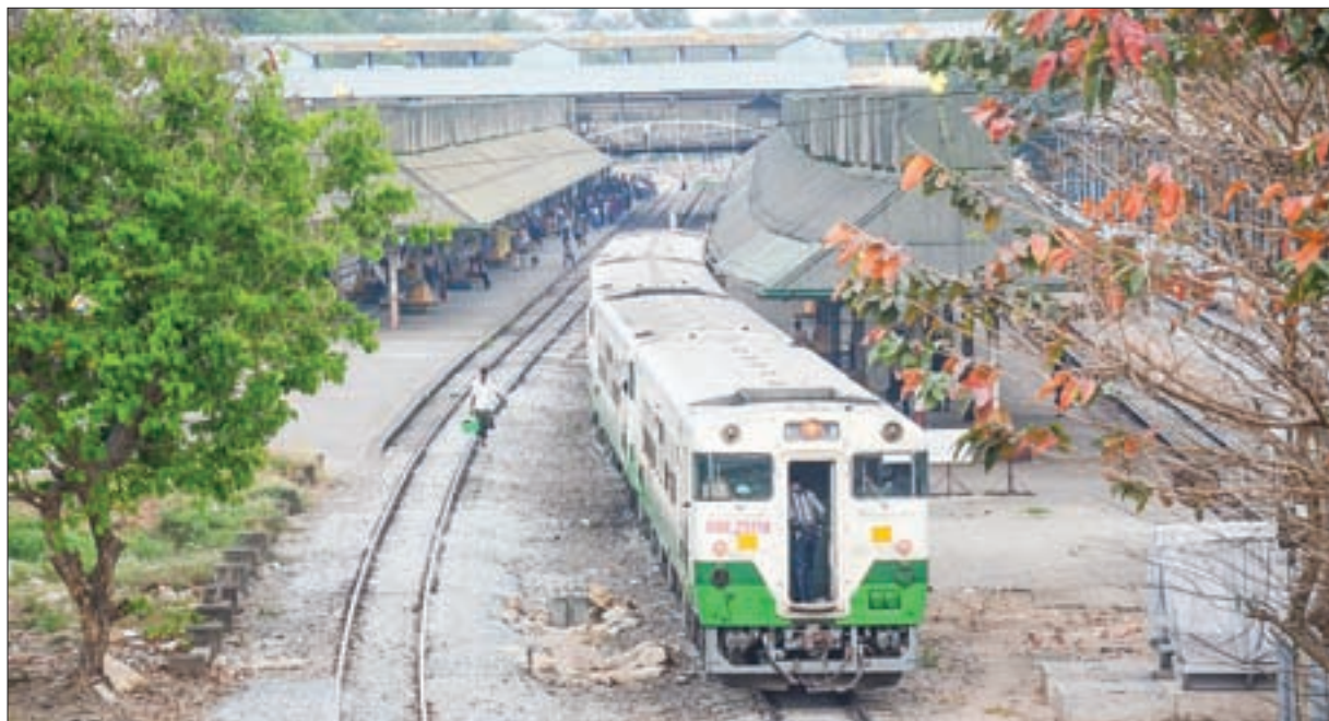
Myanma Railways will halt services during Thingyan Water Festival.

MYANMA Railways plans to stop operating of some Rail Bus Engine (RBE) trains in the circular and suburban rail-road sections during the Thingyan Water Festival, the most widely celebrated public holiday in Myanmar.