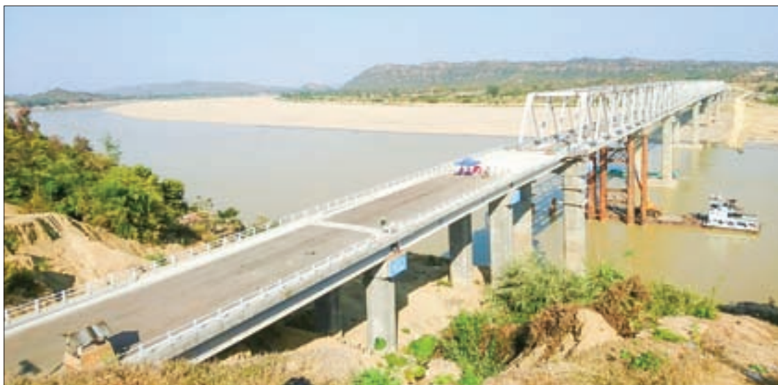
Chindwin Bridge (Kalaywa) is seen when it is underconstruction.

If someone wants to see the most extended Region embellished with gloomy and overcastted Naga Ranges, lush green meadow and tropical plain, Sagaing Region is the perfect example of the sort.