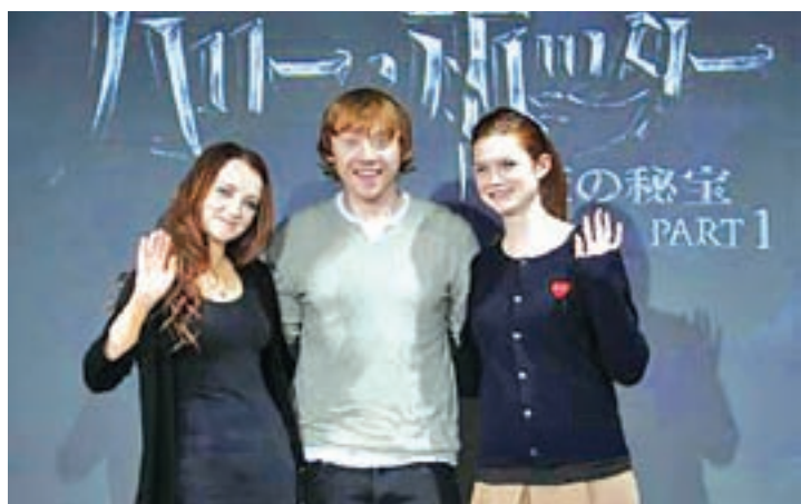
Cast members (L-R) Evanna Lynch, Rupert Grint and Bonnie Wright pose at a news conference for “Harry Potter and the Deathly Hallows: Part 1” in Japan on 18 November, 2010.

“Being in that adult environment from such an early age, it was nice to just be away from it and not have any kind of commitments at all, and just be a bit free,” says the actor.—PTI