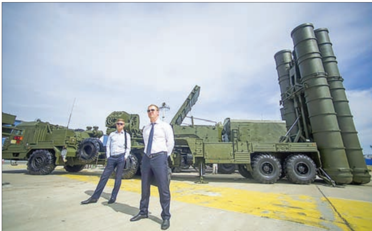
The aerospace show will be held on Langkawi Island on 21-25 March.

MOSCOW — The Russian defence contractor Almaz-Antey Group will feature military and civil products at the LIMA-2017 international maritime and aerospace exhibition in Malaysia, the Group’s press office said in a statement obtained by TASS on Tuesday. “The Asian market was and continues to be extremely important for the Group,” Almaz-Antey Deputy CEO for Foreign Economic Activity