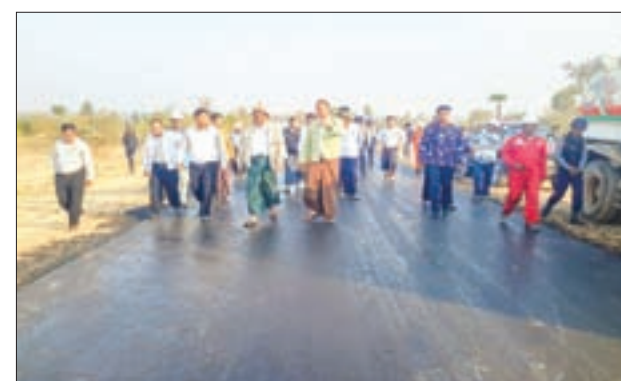
Sagaing Region Chief Minister Dr Myint Naing and officials inspect the upgraded road in Sagaing.