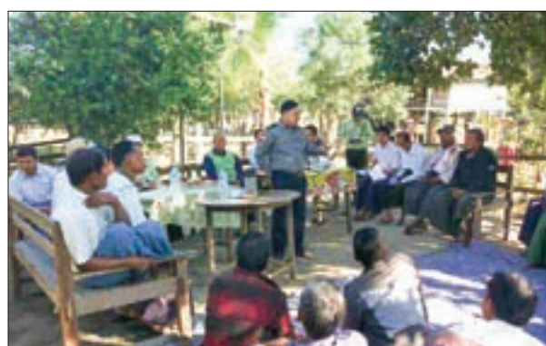
Local police raises awareness against crime.

While carrying out development works and settling issues including land disputes in the region with transparency and accountability, the Sagaing Region Government continues its reforms.