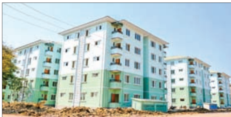
Nandawun Housing Project in Sagaing.