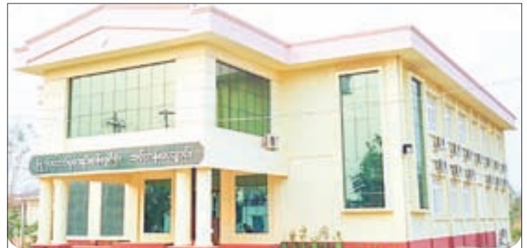
Training School for OAGU in Nay Pyi Taw.

time. Hence, the OAGU must take time to be on the right path that will change Cash Basis to Accrual Basis in accord with the International Public Sector Accounting Standard.