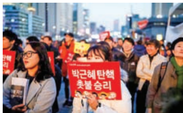
People attend a rally calling for impeached President Park Geun-hye's arrest in central Seoul, South Korea on 10 March, 2017. The sign reads 'Park Geun-hye is impeached, We won'.

The Constitutional Court dismissed Park from office on Friday when it upheld a parliamentary im-