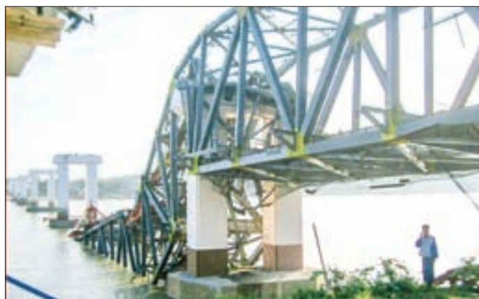
File photo shows the Yadanatheinkha Bridge that was destroyed in 2012 by an earthquake in Thabeikkyin.