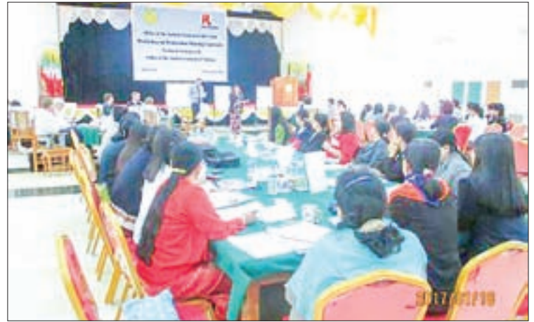
Workshop on Production Sharing Contract between OAGU and Norwegian OAG.

Basically, the OAGU is dealing with the particulars needed for transferring Cash Basic into Accrual Basis. According to the study of experiences encountered in implementing the system in other countries, it took