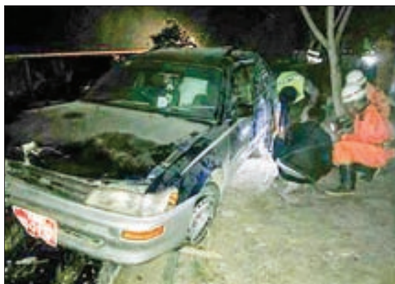
Highway traffic police at the accident inspect the scene.

No one was injured but the vehicle sustained damage. Ohn Shit Kone Highway Police filed charges against the reckless driver under section 279 of the Penal Code.— Than Oo (Lemyethna)