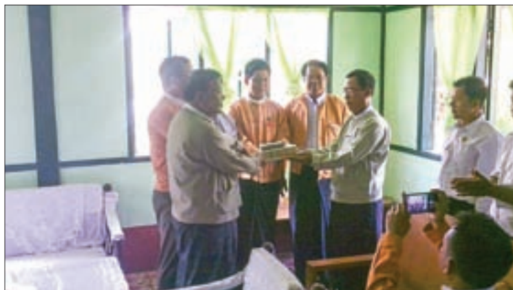
Sagaing Region Chief Minister presents cash assistance for socio-economic development in Kalaywa Township.