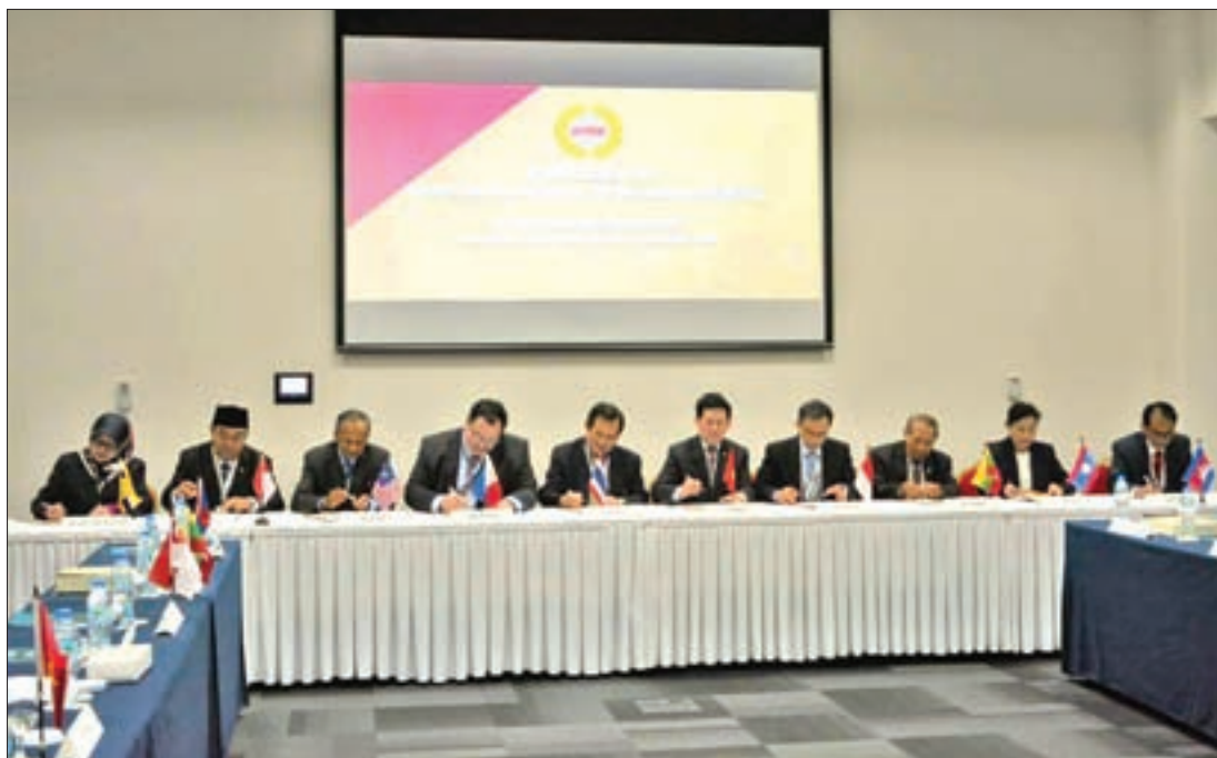
Auditor General of the Union at the signing ceremony for amending the ASEANSAL agreement in Abu Dhabi.