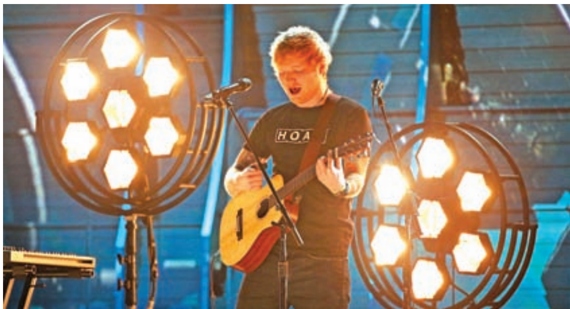
Ed Sheeran performs at the 59th Annual Grammy Awards in Los Angeles, California, US.