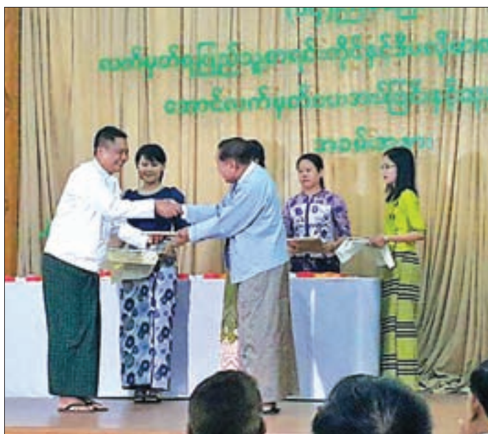
Registered auditors receiving certificates.

The Auditor General of the Union had formed 386 offices in all, including OAGU across the nation, employing staff amounting to more than 6500 to examine.