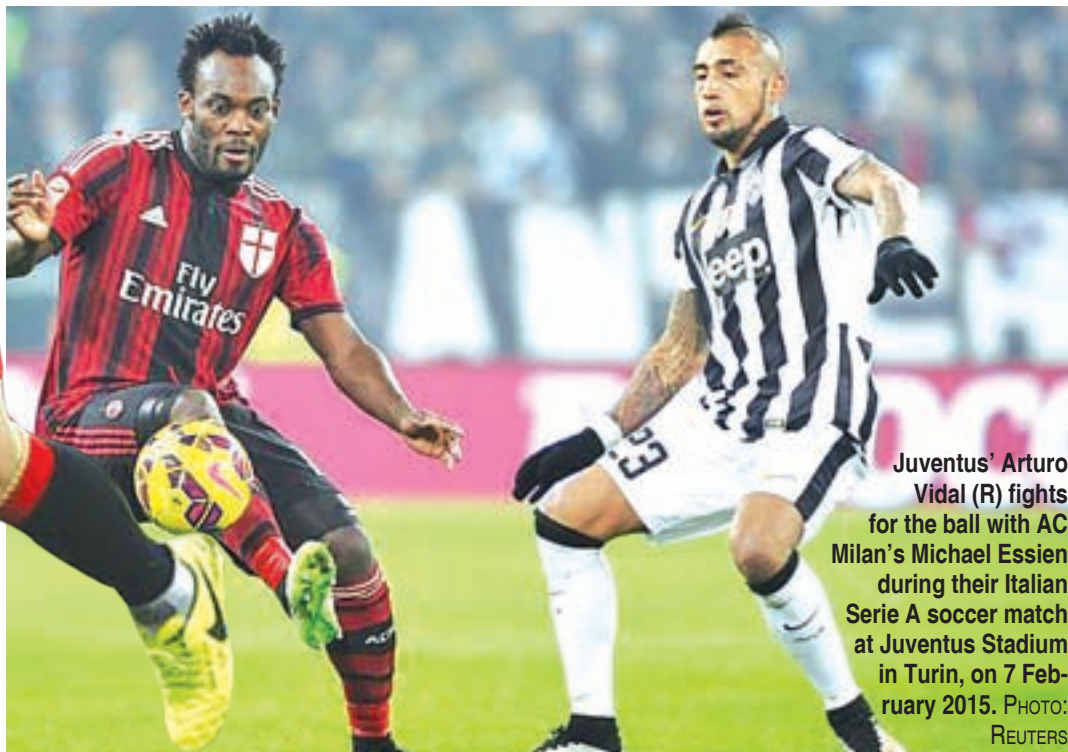
Juventus’ Arturo Vidal (R) fights for the ball with AC Milan’s Michael Essien during their Italian Serie A soccer match at Juventus Stadium in Turin, on 7 February 2015.

The start date for the new league season in Indonesia has yet to be announced.—Reuters