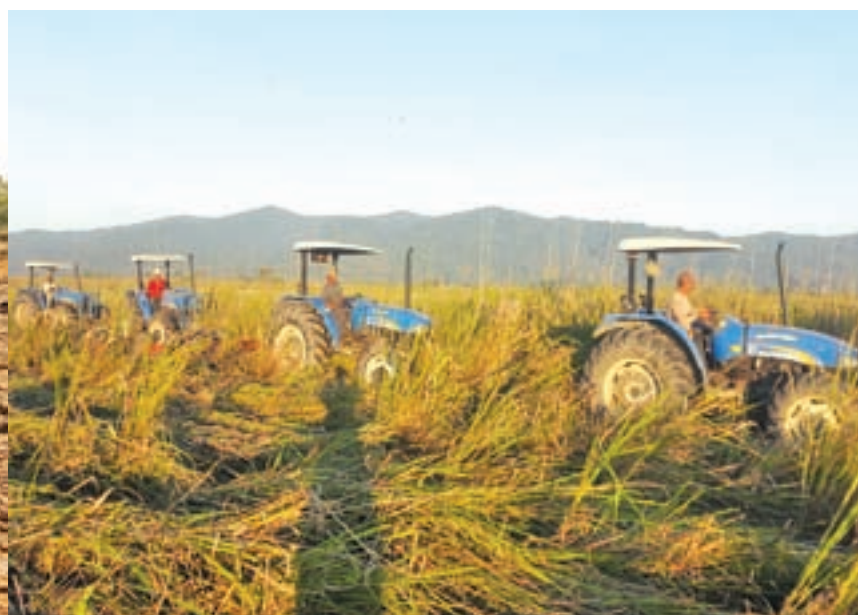
Regional development tasks are being undertaken with the use of heavy machinery in Kachin State.