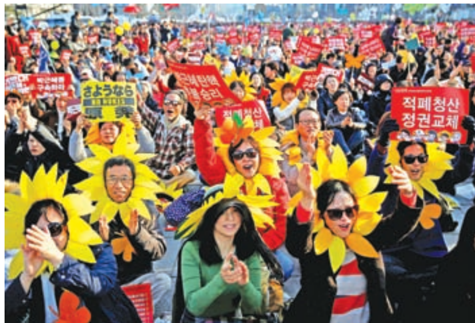
People react at a rally against South Korea's ousted leader Park Geun-hye in Seoul, South Korea on 11 March, 2017.

"She's a citizen now. If she's done something wrong, she has to be arrested."