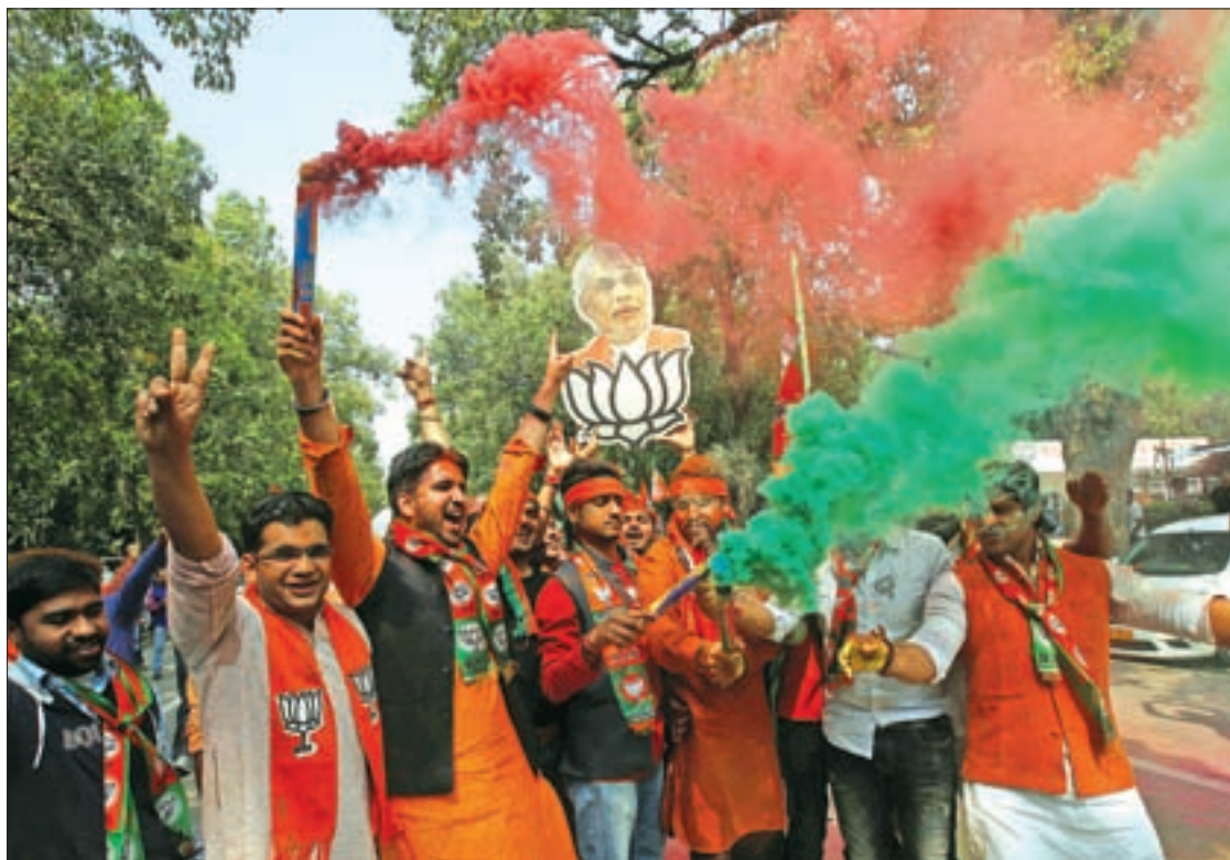
Supporters of India's Bharatiya Janata Party (BJP) celebrate after learning of the initial poll results outside the party headquarters in New Delhi, India, on 11 March, 2017.

Investors hope victory will embolden Modi to embark on more reforms, including the launch of a national sales tax, to boost economic growth.