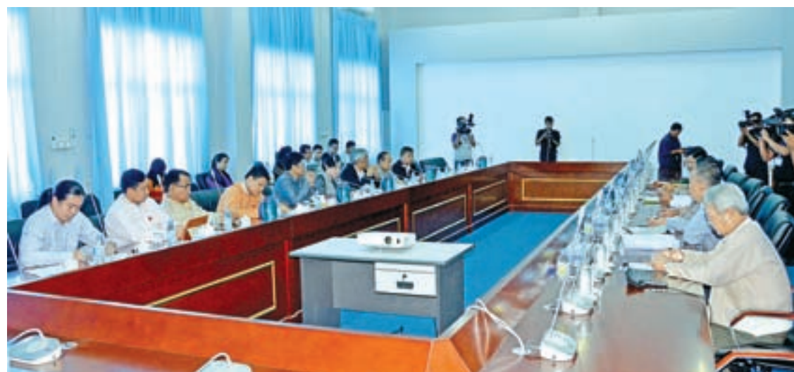
UPDJC secretary's group hold its meeting at National Reconciliation and Peace Center in Nay Pyi Taw.

During the meeting, the members discussed about the meetings of working committee, preparation for Union Peace Conference, office tasks of UPDJC and general issues.— Thurazaw, Phyothant(MNA)