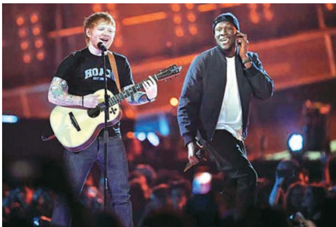
Ed Sheeran performs at the 59th Annual Grammy Awards in Los Angeles, California, US, on 12 February 2017.