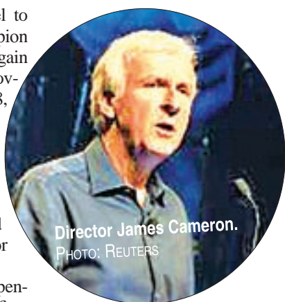
Director James Cameron.

The sequel was first set for a 2014 release and has been de-