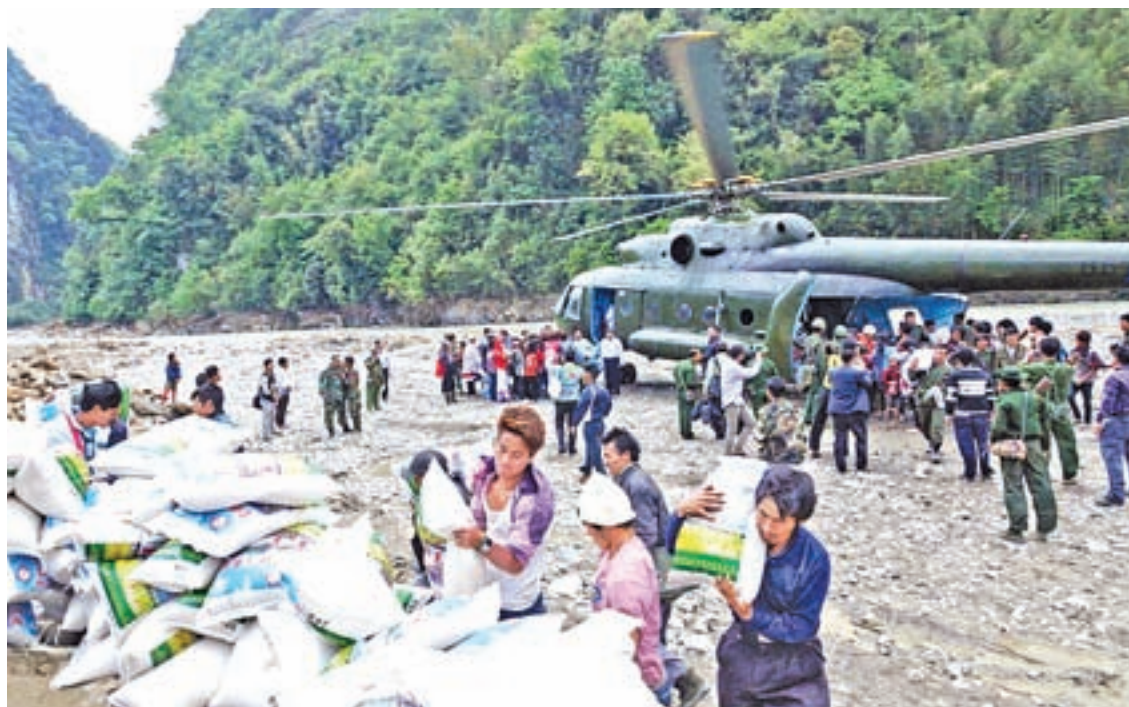
Arrival of relief items for local people in Kachin State are seen.

There are ten major crops grown in Kachin State which is made up of over 440,000 acres of farmland. As the per acre yield stands at 68.72 baskets, the region has been able to produce over 25 million baskets of paddy annually on average, ensuring 122.43 per cent of food security. The whole Kachin State is in a position of enjoying food security. As far as edible oil is concerned, the demand is 16096 metric tons and the supply is 17622.65 metric tons, ensuring