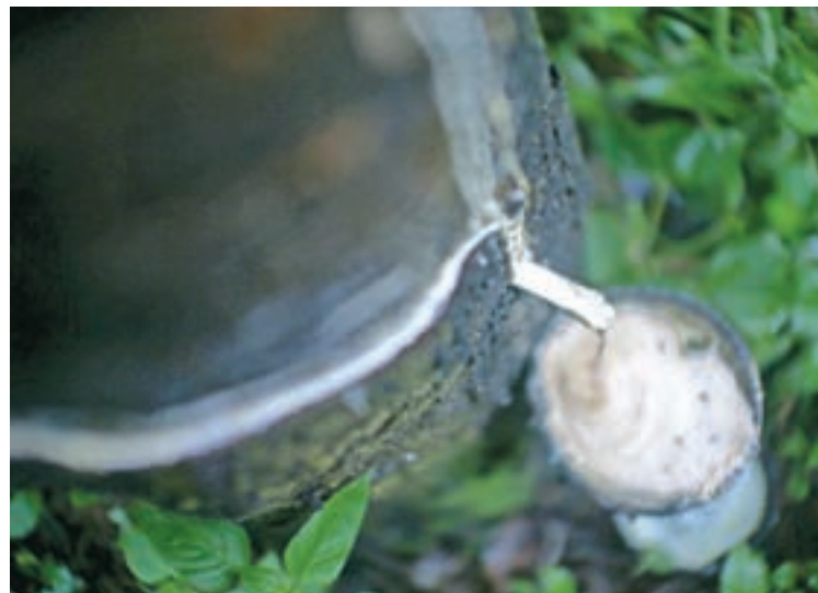
The latex of the rubber tree is the main source of natural rubber.

According to the Ministry of Commerce, Japan and India have made an offer to purchase Myanmar's rubber.—Myitmakha News Agency