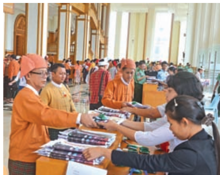
Photo shows Pyithu Hluttaw representatives attending Hluttaw session. PHOTO: MNA