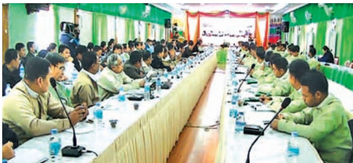
Kachin State government holds first four-month cabinet meeting.