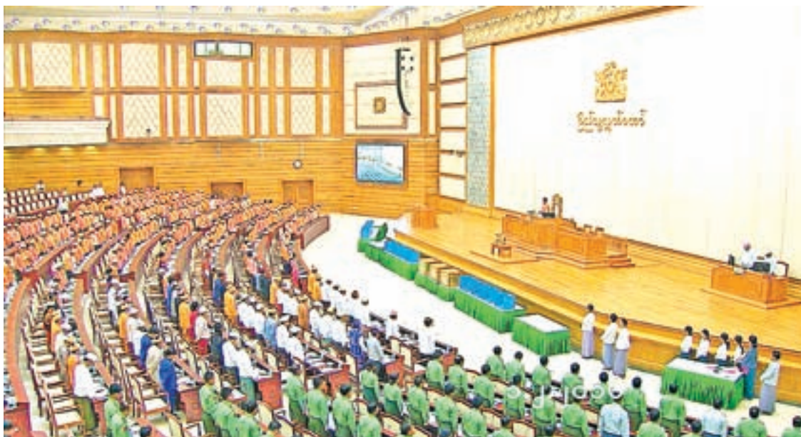
Photo taken on 1 February 2016 shows Pyithu Hluttaw session in Nay Pyi Taw.

According to the constitution that states "The three branches of the sovereign power namely legislative power, executive power and judicial power are separated, to the extent possible and exert reciprocal control, check and balance among them.", it can be said that Pyithu Hluttaw is a watchdog in the country practicing check and balances system. Its committees through coordination with Union level organizations also attend to the needs of people who make complaints or submit reports.