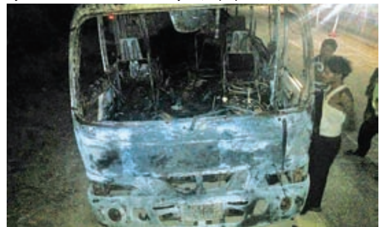
Car caught by fire is seen.

The driver was filed a suit by the MyoChanung High Way Police Station under the criminal law's act 279/285 for vehicle (Pa) 12/17.—Than Oo (Laymyathnar)