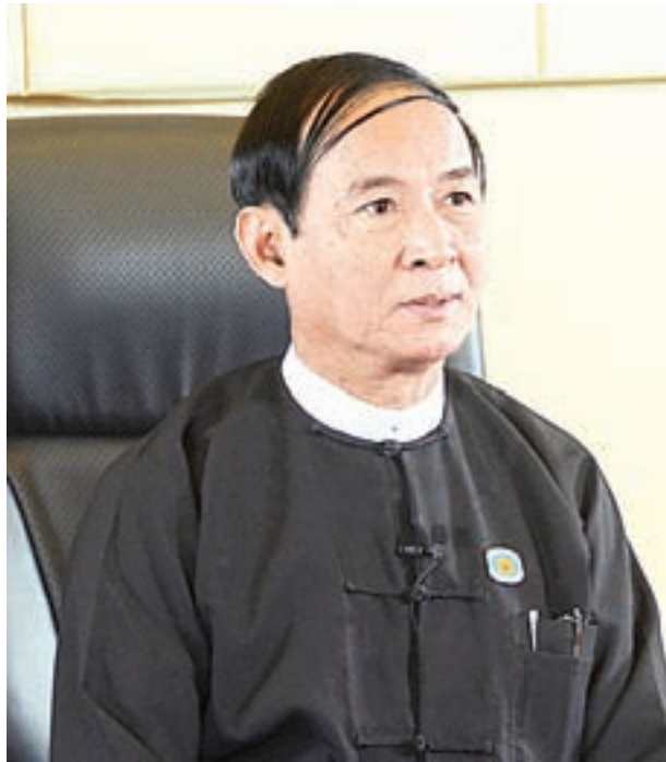
Pyithu Hluttaw Speaker U Win Myint.

A: Health budget was increased to reduce the burden of cost suffered by people and to be able to provide them with effective health care services. Similarly, to uplift the education standard and not to cause burden on parents education budget was also increased. Regarding scrutinizing, work projects are scrutinized thoroughly with the National Planning Bill for 2017-2018