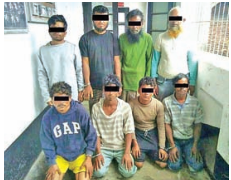
Eight Bengalis captured on illegal boat on Myanmar Sea Territory are seen.

Under the Myanmar Immigration Law, the eight Bengali were filed in lawsuit.—Myanmar New Agency