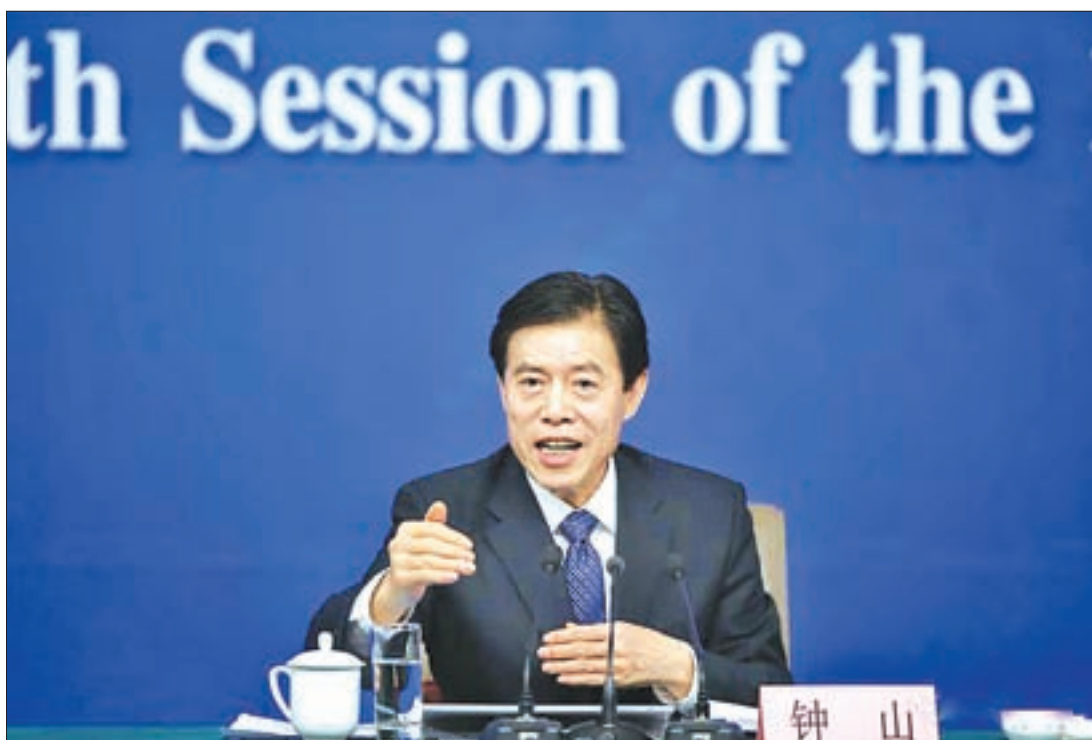
Chinese Minister of Commerce Zhong Shan answers questions at a press conference on structural adjustments and innovation for the fifth session of the 12th National People's Congress in Beijing, capital of China, on 11 March, 2017.

Zhong said he looks forward to meeting his US counterpart Wilbur Ross, who became secretary of commerce