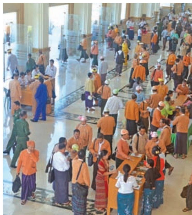
Pyithu Hluttaw representatives sign attendance books before Hluttaw session.