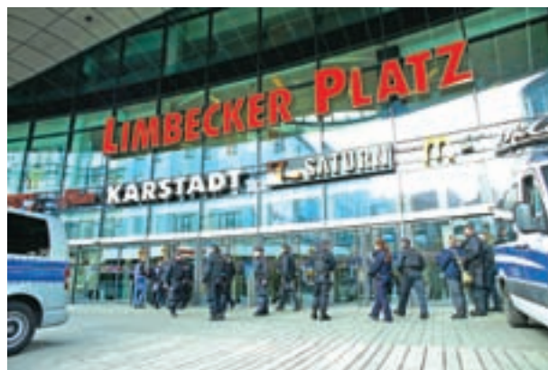
Police at the entrance of Limbecker Platz shopping mall in Essen, Germany, on 11 March 2017, after it was shut due to attack threat.

Germany is on high alert following major radical Islamist attacks in France and Belgium and after a failed asylum seeker from Tunisia drove a truck into a Christmas market in December, killing 12 people.—Reuters