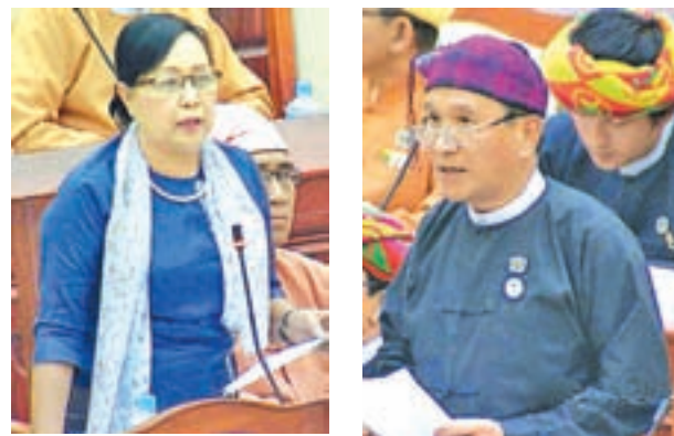
MPs of Pyithu Hluttaw participate in debates at the parliament.

fiscal year focuses on minimizing loss and wastage, ensuring firm and strong investment and serving the state and the people.