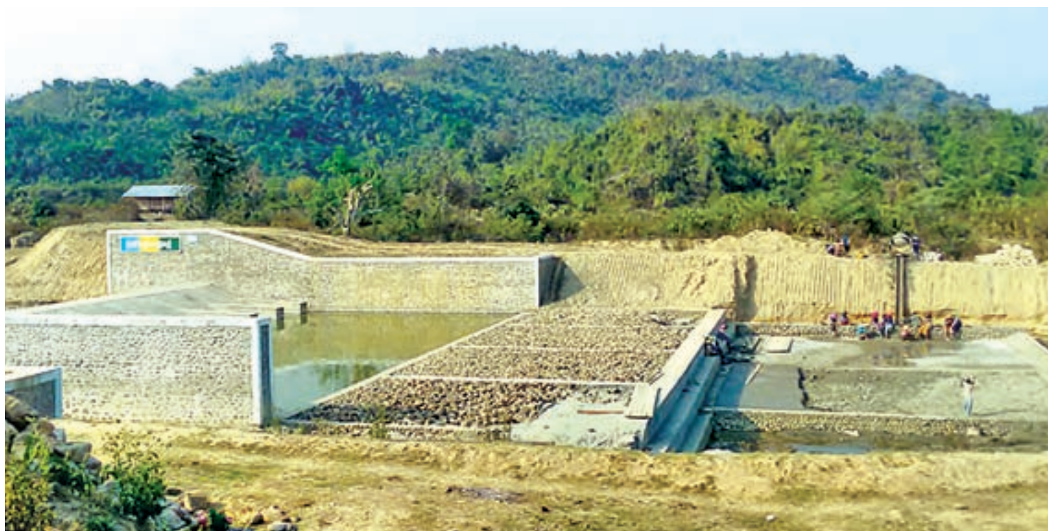
Construction site of Kyargyikwin Diversion Weir in Mohnyin Township, Kachin State.

With regard to electric power distribution, 12 66/11 KV sub-power stations and two 132/66/11 power stations were constructed in Kachin State and the 66/11 KV sub-power station in Phakant Township and the 33/11 Nyaungpin sub-power station in Mohnyin Township are under construction. Altogether 798 villages in 30 townships in Kachin State have been facilitated with electricity and 1755 villages have been without electricity. In a bid to supply sufficient electricity to dwell-