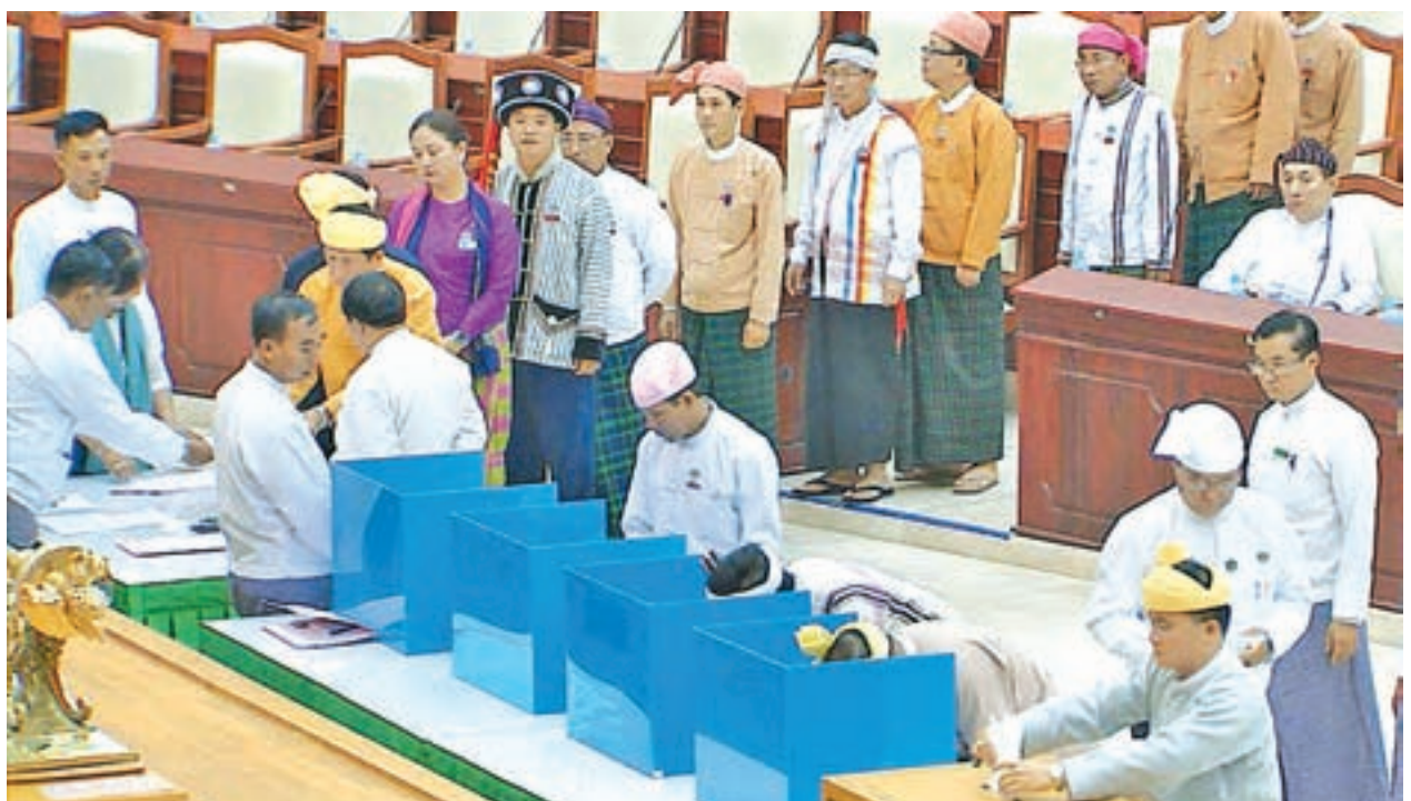
Pyithu Hluttaw representatives vote down secret ballot to elect Vice President during a parliament session in Nay Pyi Taw.

A: As the main duty of the Hluttaw is to make legislation, Hluttaw is engaged in making legislation that will be beneficial to people and the state; and amending and repealing laws which are not in conformity with the current age and which are not up to the mark of democratic norms. Hluttaw is also supporting national reconciliation and internal peace.