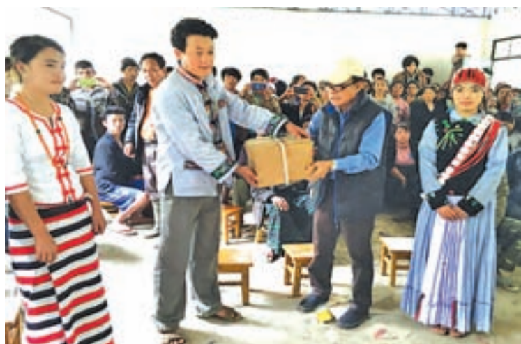
An official presents relief items to a flood victim in Sotlaw Township.

The people in Kachin State need to cooperate with the local government as regional development tasks will be undertaken only when peace and stability prevailed in the region. The Kachin State government has been making earnest efforts to promote education, health and road transportation sectors with the aim of nurturing outstanding people and improving socioeconomic status of the local people.