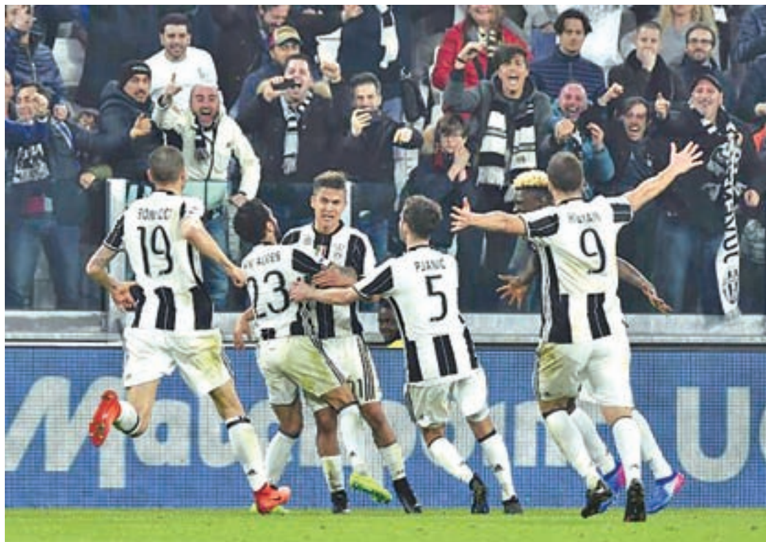
Juventus' Paulo Dybala celebrates with teammates after scoring against AC Milan during the match of Italian Serie A between Juventus and AC Milan at the Juventus stadium in Turin, Italy on 10 March, 2017.

ond half but could not seem to find a way past Gianluigi Donnarumma.