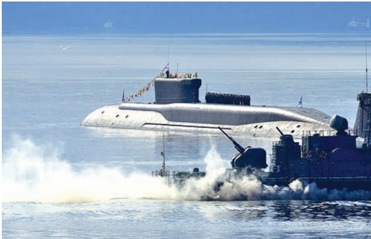
Yuri Dolgoruky submarine.