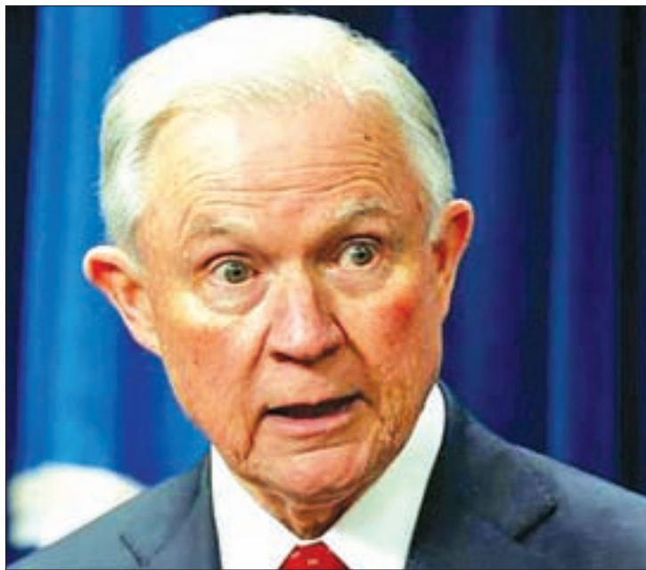
US Attorney General Jeff Sessions in Washington, US on 6 March, 2017.

Bharara, appointed by Democratic President Barack Obama in 2009, has pursued an aggressive push against corruption in state and city politics and is known for his prosecution of white-collar criminal cases. He