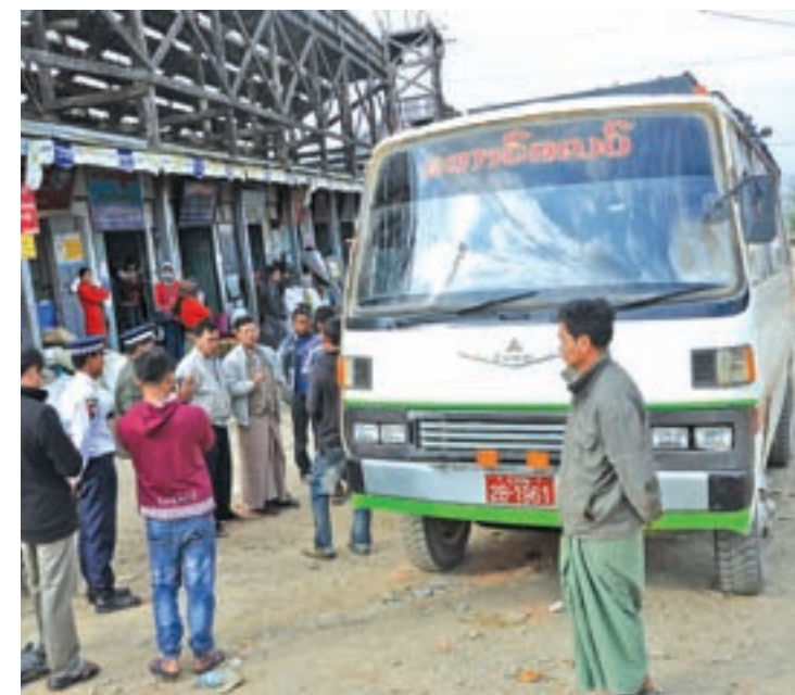
Members of combined team check the passenger vehicle in Haka. PHOTO: HAKA DISTRICT IPRD

The combined team has also conducted awareness training courses for the drivers and bus conductors including travelers to wear the seat belts.— Haka district IPRD