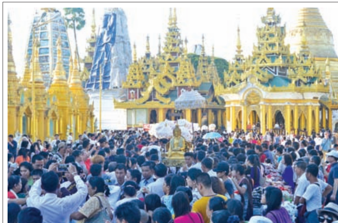
Buddhist devotees participate in Tabaung Festival at the Shwedagon Pagoda in Yangon yesterday, donating provisions to 177 Buddhist monks and 27 Buddhist nuns. The festival will end today at the pagoda, with a ceremony to share merits gained.