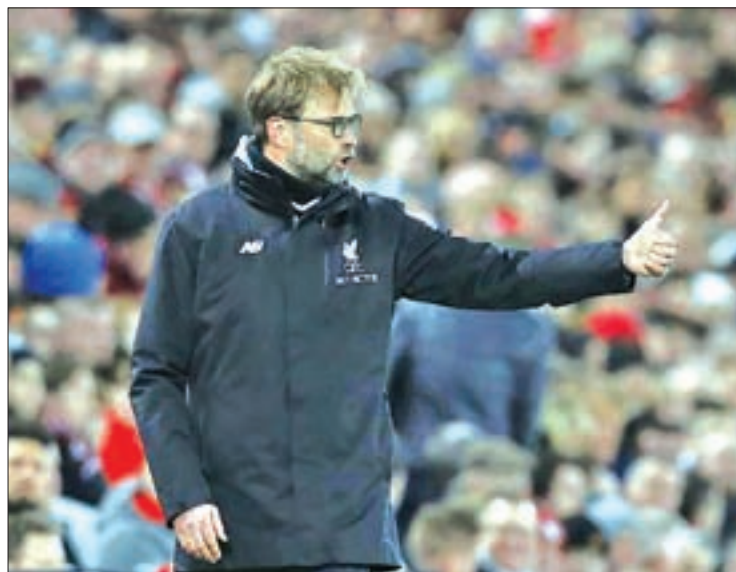
Liverpool manager Juergen Klopp.

LONDON — Liverpool manager Juergen Klopp said he will not have a back-up plan in case things go wrong in Sunday's Premier League clash against Burnley at Anfield despite his side struggling against teams near the foot of the table.