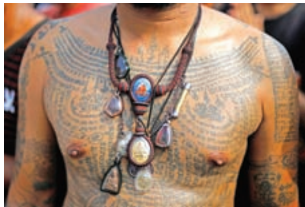
A devotee attends the religious tattoo festival at Wat Bang Phra, where they come to recharge the power of their sacred tattoos, in Nakhon Pathom province, Thailand on 11 March, 2017.