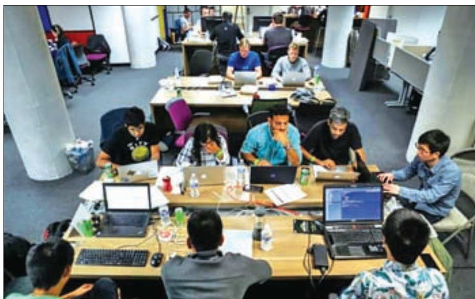
People work on their computers during a weekend Hackathon event in San Francisco, California, US, on 16 July 2016.

in New York, graduated last year with a degree in computer science and math from McGill University. Unemployed, he moved to California six months ago and found his room at The Negev on Craigslist.