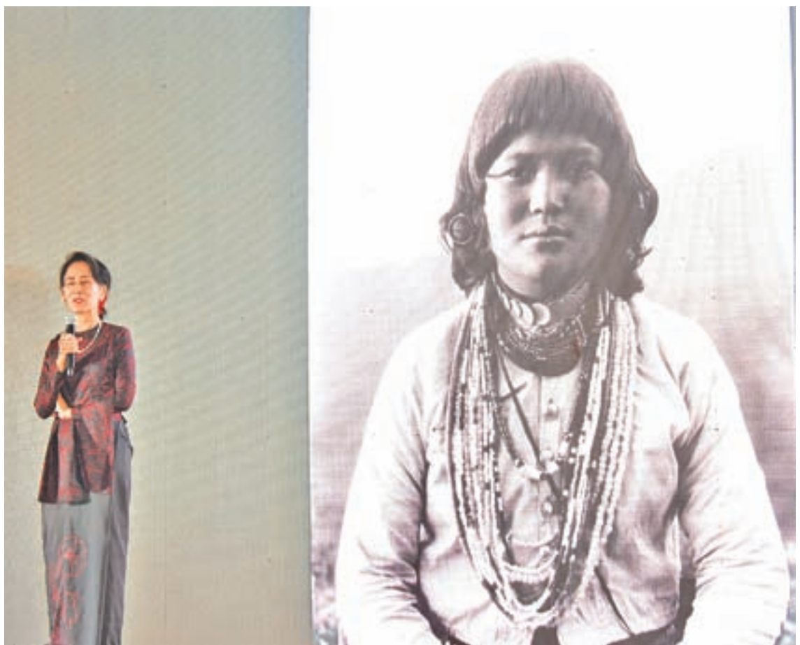
State Counsellor Daw Aung San Suu Kyi delivering an address at the prize-presentation ceremony of the 9th Yangon Photo Night 2017 which depicts the ethnic peoples and the freedom of expression.

The best 2016-2017 Myanmar photo-stories were selected by a panel of judges who were expert photographers with years of international experience. —Myanmar News Agency