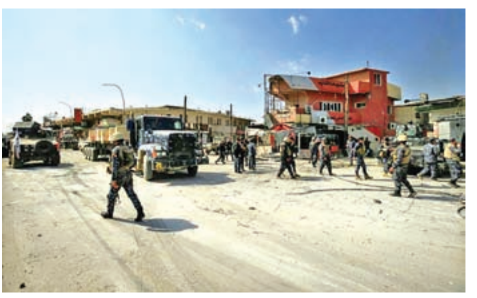
Federal police members gather during a battle with Islamic State militants at Dawasa neighbourhood in Mosul, Iraq, on 8 March 2017.

and white headdress, hobbled around his home pointing at damage the Islamic State fighters had done to his property — a children's cupboard smashed up to use as barricades and to rest rifles on, a basket upturned to stand on while they fired at the enemy.