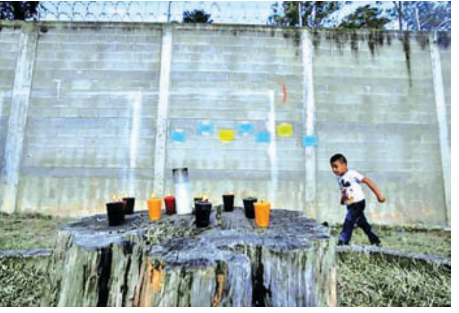
Candles are lit for victims after a fire broke out at the Virgen de Asuncion home in San Jose Pinula on the outskirts of Guatemala City, on 8 March 2017.

"What happened is extremely serious, and even more so for the fact that it could have been avoided," Anabella Morfin, Guatemala's solicitor general,