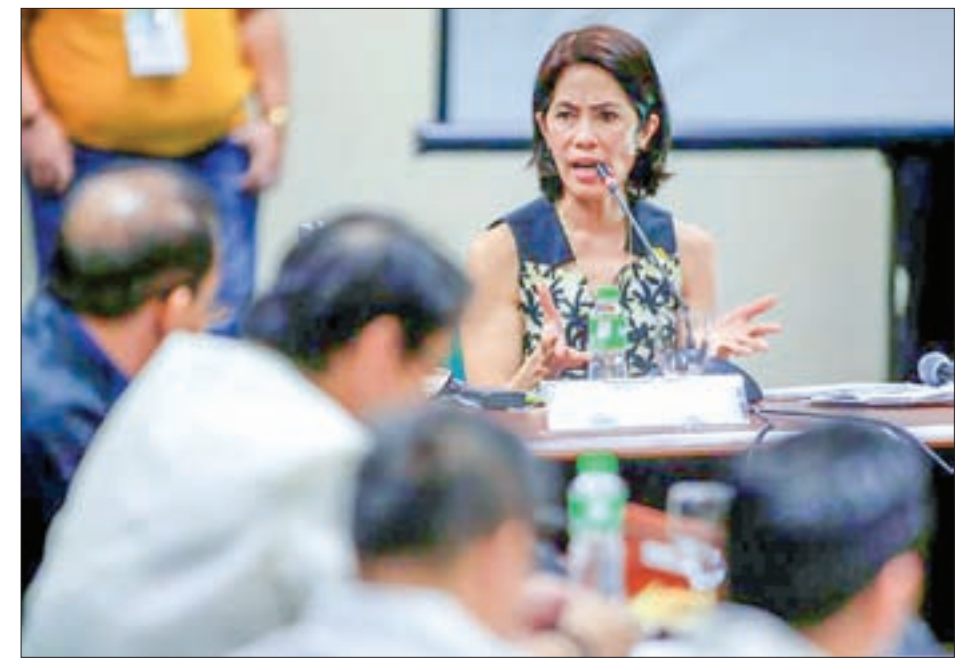
Philippines' Environment and Natural Resources (DENR) Secretary Regina Lopez gestures as she faces a panel of Commission on Appointment during a hearing at the Senate headquarters in Pasay city, metro Manila, Philippines, on 9 March 2017.

In the Philippines, confirmation hearings can take place long after ministers start work. On Wednesday, the Commission on Appointments unanimously decided not to approve Perfecto Yasay as foreign minister, the first member of Duterte's cabinet to be rejected by the panel. The congressional panel is hearing from those opposed to Lopez's confirmation and can defer a vote to a later date. Congress will go on recess from 18 March, but Lopez is due to leave the country on Friday. Sessions will not resume until May.