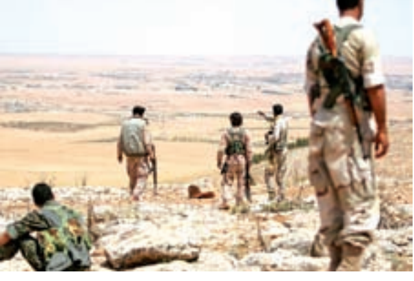
Fighters of the Manbij military council, take an overwatch position in the southern rural area of Manbij, in Aleppo Governorate, Syria, on 1 June 2016.

The Russian-backed Syrian army has made a rapid advance against Islamic State to the south of the city, while the Turkish military and Syrian rebel groups it backs have been fighting Manbij-based militia to the west of the city. Manbij was captured from Islamic State last year by an alliance of US-backed militias includ-