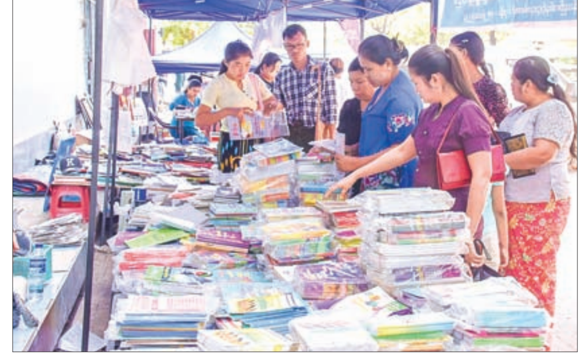
Book enthusiasts visits the week-end book stalls on the platforms of Anawrahta Road.

PPD of the Ministry of Information has arranged to speed up its activities further.