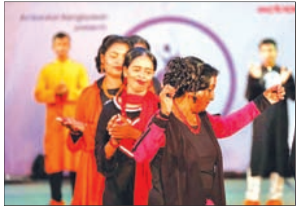
Acid attack survivors walk on the ramp as they participate in a fashion show titled "Beauty Redefined" organized by ActionAid Bangladesh in Dhaka, Bangladesh, on 7 March 2017.

DHAKA — Bangladesh hosted a fashion show with a difference to mark International Women's Day, featuring 15 confident catwalk models fighting to overcome the trauma of acid attacks.