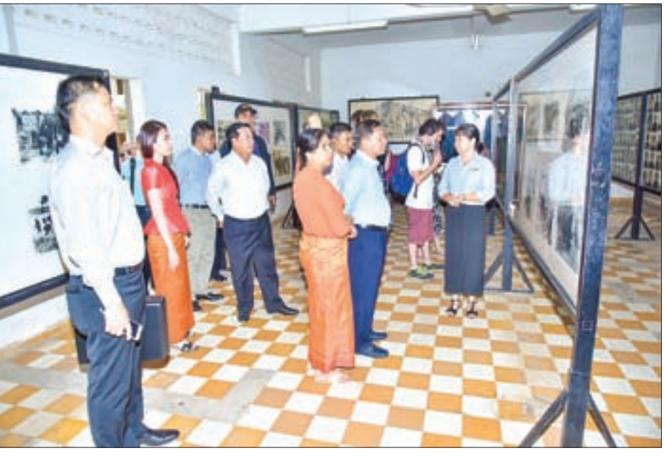
Senior General Min Aung Hlaing and wife visit Tuol Sleng Genocide museum.

Earlier yesterday, the Senior General and delegation visited Peace Palace and the Tuol Sleng Genocide museum. The delegation then visited the Myanmar military (Army, Navy, Air) attaché's office and met the Myanmar ambassador and wife, and family members of the embassy.