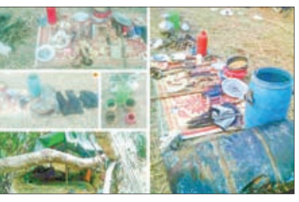
Evidences are found from the three huts where a group of men from the neighbouring country was staying.

Border guard police also inspected the huts and seized some evidence. The police investigation is ongoing.—Myanmar News Agency