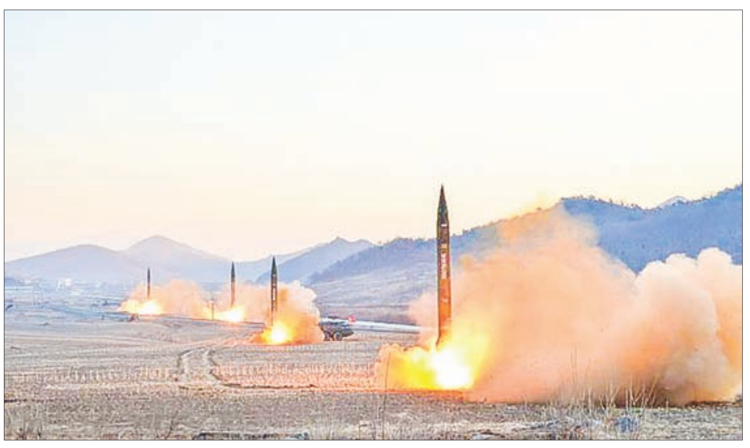
North Korean leader Kim Jong Un supervised a ballistic rocket launching drill of Hwasong artillery units of the Strategic Force of the KPA on the Spot in this undated photo released by North Korea's Korean Central News Agency (KCNA) in Pyongyang, on 7 March 2017.

Chinese Foreign Minister Wang Yi said on Wednesday that the tests by the North and the joint drills across the border in South Korea were causing tension to increase like two "ac-