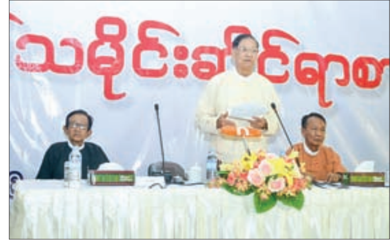
Writers take part in the paper reading session on history.