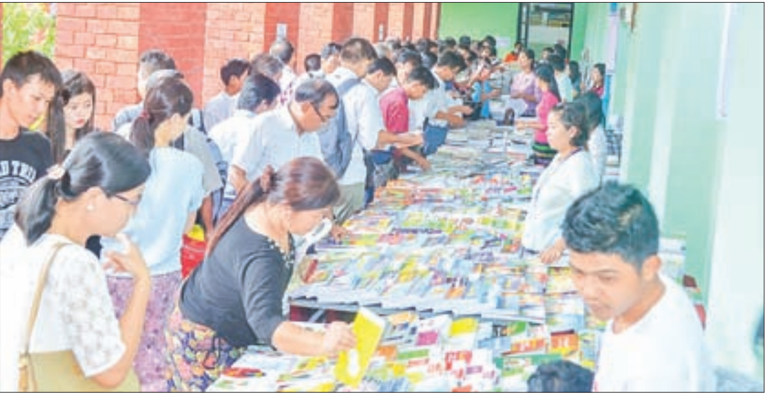
Bookstalls are crowded with book enthusiasts on Theinbyu Street.

Collection of the 18 papers read by writers, questions raised by the audience and answers replied by the paper-writers were compiled into books for publication. The first volume contains 485 pages and the second 515 pages.