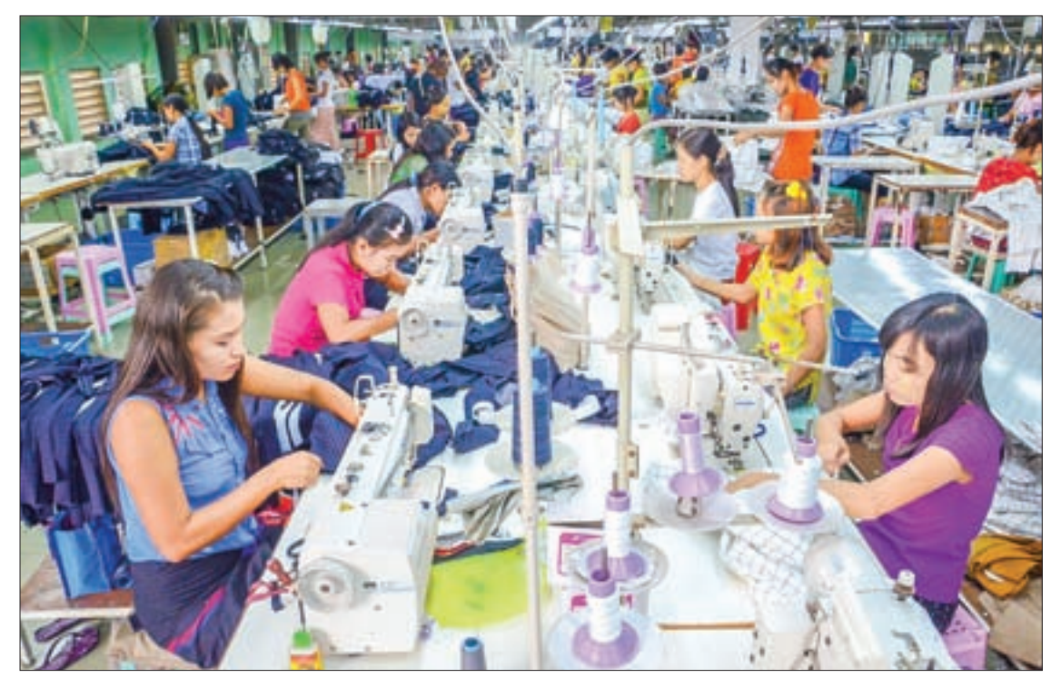
Employees work on a production line at a garment factory in Hlinethaya, Yangon.