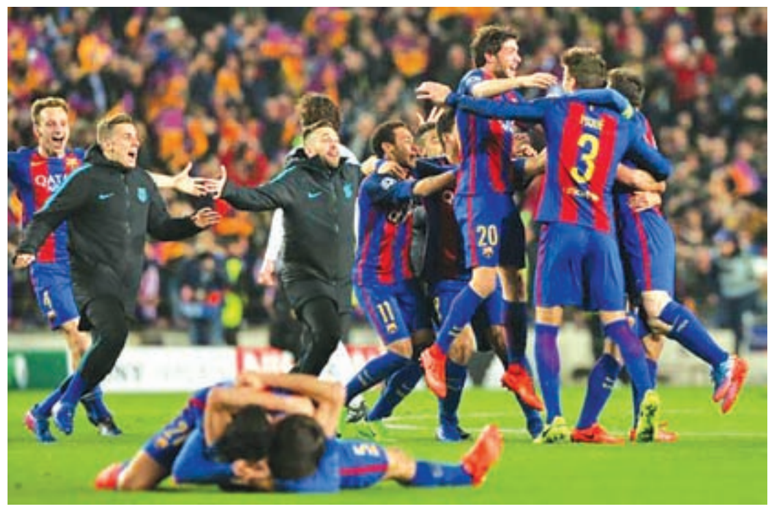
Barcelona players celebrate after the game, UEFA Champions League Round of 16 Second Leg at The Nou Camp, Barcelona, Spain, on 8 March 2017.

the attacking. The Catalans owed their second to another piece of slack defending, however, as Iniesta nudged his way past Marquinhos in the area to knock the ball back into the danger zone and it bounced off the swinging leg of Kurzawa and into the far corner.— Reuters