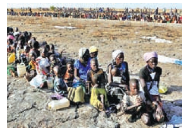
Women and children wait to be registered prior to a food distribution carried out by the United Nations World Food Programme (WFP) in Thonyor, Leer state, South Sudan, on 26 February 2017.

Last month, the United Nations declared that parts of the country are experiencing famine, the first time the world has faced such a ca-