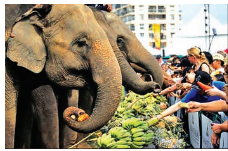
People feed elephants before a match at the annual King's Cup Elephant Polo Tournament at a riverside resort in Bangkok, Thailand, on 9 March 2017.