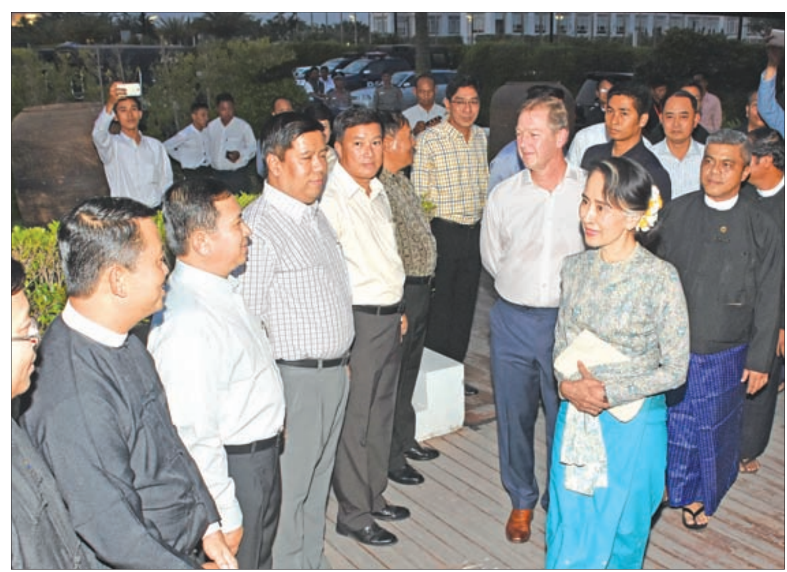
Daw Aung San Suu Kyi greets attendees of a course on defence and security at Kempinski Hotel in Nay Pyi Taw yesterday evening.