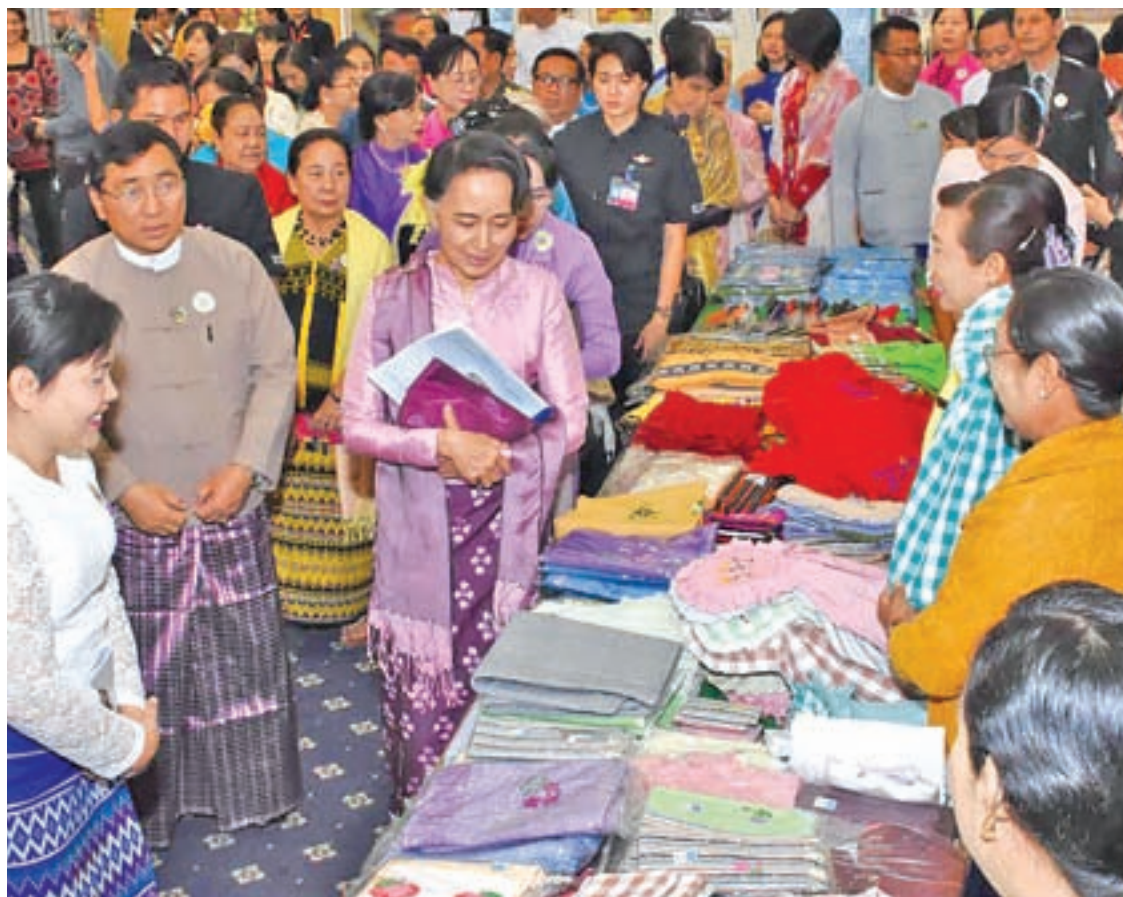
State Counsellor Daw Aung San Suu Kyi visits booth showcasing women's handiwork at International Women's Day Ceremony for 2017 in Nay Pyi Taw.

She further stated that all citizens should prioritize success for businesses and show how to use it to help others. It is important to design a business model so as to bring a balance between charity work and self-interest, because only in harmony can they be a truly powerful force. It is not