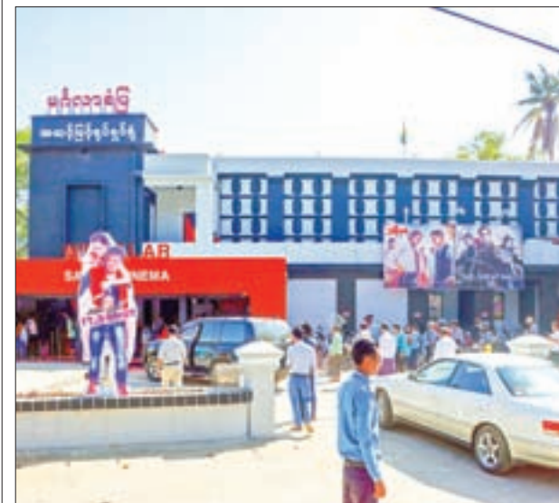
Photo shows the cinema fixed digital system.

IPRD is driving force to change remaining movie-houses into digital system cinemas. This year, 29 cinemas were changed into digital system movie-houses, reaching 67 altogether across the nation.