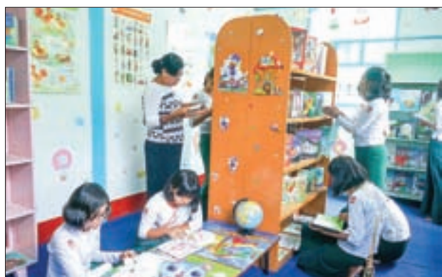
Teacher and students read in the reading room for children.

Being the department of public service formed to fulfill the needs and interests of the people, IPRD managed to perform the tasks of changing libraries in Regions and States into Community Centers by linking with Daw Khin Kyi Foundation. It opened socially based community center in the Insein District Office on 20 August 2016, in Myaungmya district office on 15 December 2016 and in Magwe district, Natmauk township office on 15 January 2016.