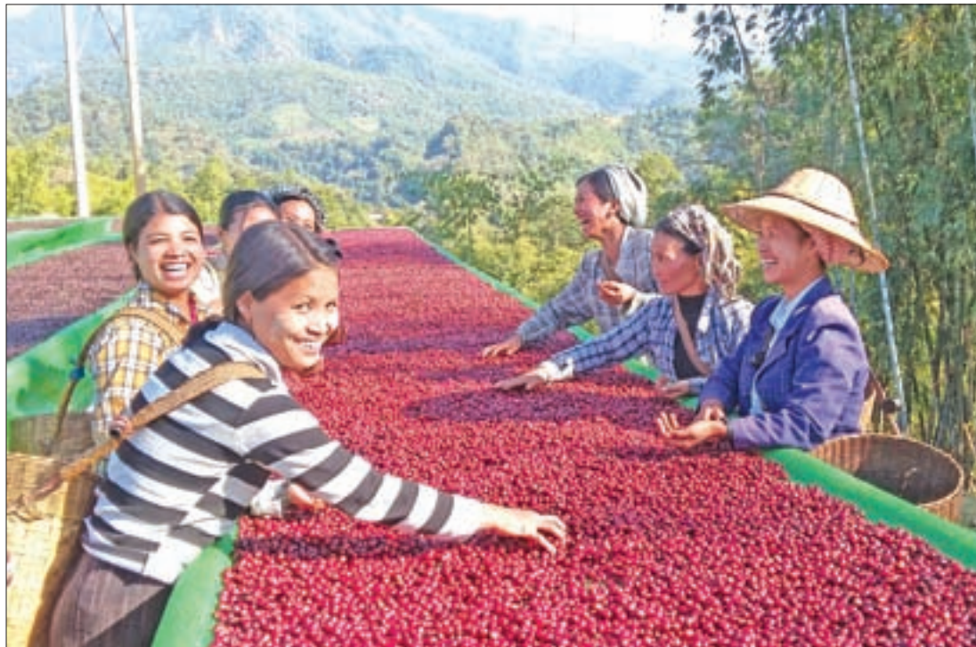
Workers dry coffee beans under the sun in Ywangan.

COFFEE origin tours have begun in Ywangan, a popular coffee-production village in Taunggyi District, southern Shan State, by Genius coffee with the aim of promoting the country's tourism sector and creating more job opportunities for residents.