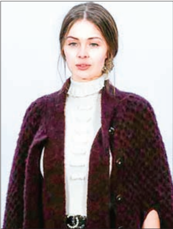
Actress and model Marie-Ange Casta.