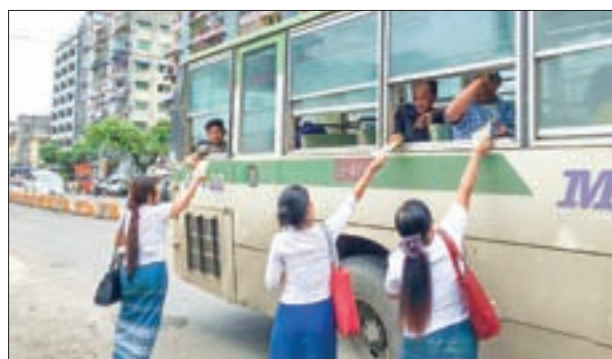
Staffs of the IPRD deliver leaflets to the commuters.

Children are human resources for the future, so all the governments across the world are supporting in every way for the development of children's lives. For the all-round development, acquisition of literary knowledge, improvement of intellects and capacity building of children in Myanmar, children literature festival was held at the Myanmar International Convention Centre 2 of Nay Pyi Taw on 5 th November 2016, whereas children literature festival in Mandalay was held from 27 th January 2017 to 29 th January 2017, together with merry-makings and entertainment programmes, contests, book exhibition, book fair and workshops on the development of children literature. Similarly, such festivals are being held in other towns with greater momentum.