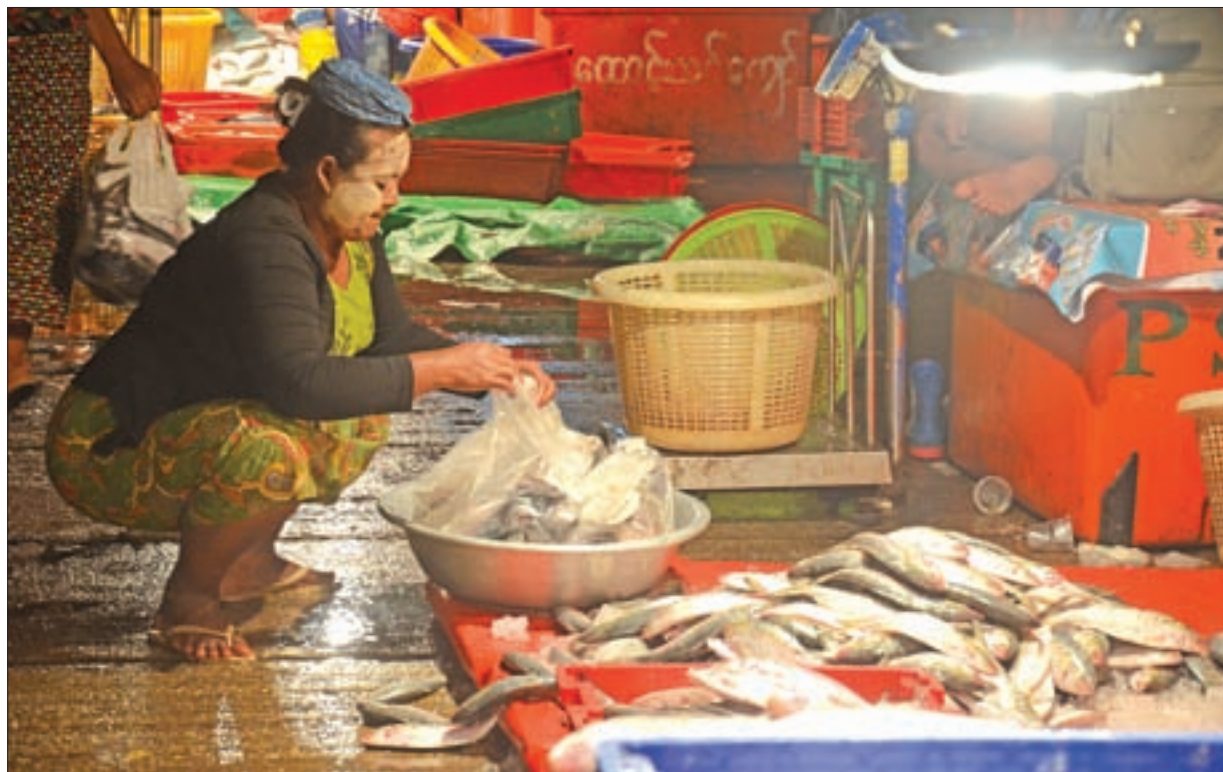
A woman prepares fish at San Pya Fish Wholesale Market in Yangon, on 7 January 2017.

"We are faced with many difficulties in developing fisheries enterprises, and the hatcheries are also required. We will exert concerted efforts to boost