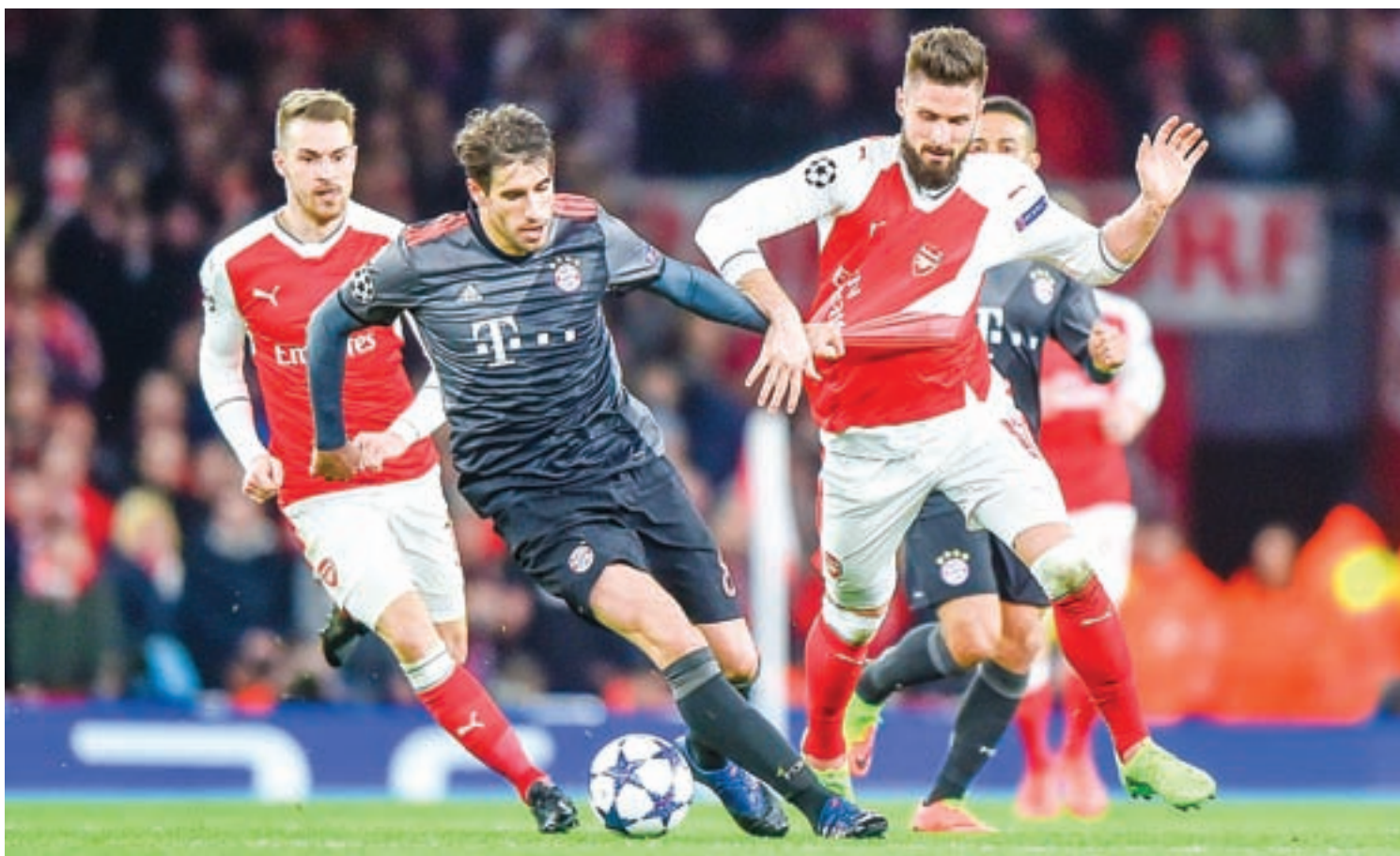
Arsenal's Olivier Giroud in action with Bayern Munich's Javi Martinez during the UEFA Champions League Round of 16 Second Leg between Arsenal and Bayern Munich at Emirates Stadium in London, England on 7 March 2017.

Bayern were not finished though and Arturo Vidal struck twice as Arsenal slumped to a seventh successive elimination at the last-16 stage in humiliating fashion.— Reuters