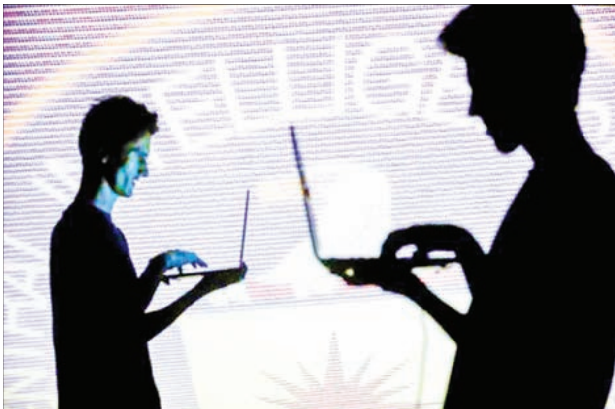
People are silhouetted as they pose with laptops in front of a screen projected with binary code and a Central Intelligence Agency (CIA) emblem, in this picture illustration taken in Zenica, Bosnia and Herzegovina, on 29 October, 2014.

WikiLeaks, led by Julian Assange, said its publication of the documents on the hacking tools was the first in a series of releases drawing from a data set that includes several hundred million lines of code and