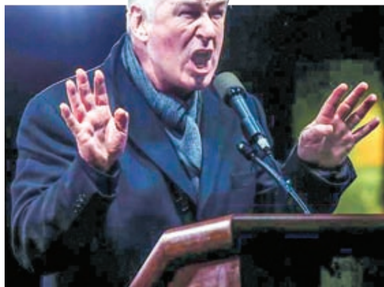
FILE PHOTO; Actor Alec Baldwin speaks at a protest against US President-elect Donald Trump outside the Trump International Hotel in New York City, US, on 19 January, 2017.