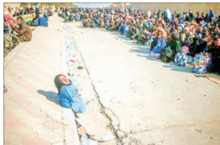
A displaced Iraqi woman reacts as she waits in a street for a truck to carry her to a safe place, as Iraqi forces battle with Islamic State militants, in western Mosul, Iraq on 8 March, 2017.

Lami said most of the fighters that had fought around the governorate building were local but there