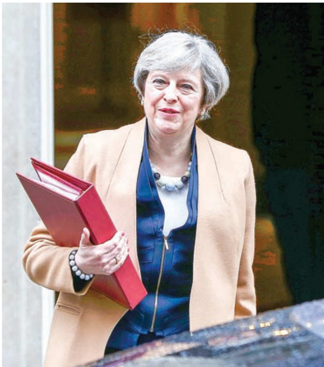
Britain's Prime Minister Theresa May leaves 10 Downing Street before Chancellor of the Exchequer Philip Hammond delivers his budget to the House of Commons in London, Britain on 8 March, 2017.

LONDON — Britain's upper house of parliament voted on Tuesday to give lawmakers more power to reject the final terms of the country's exit from the European Union, ignoring pleas from Prime Minister Theresa May's government not to hamstring their negotiations.