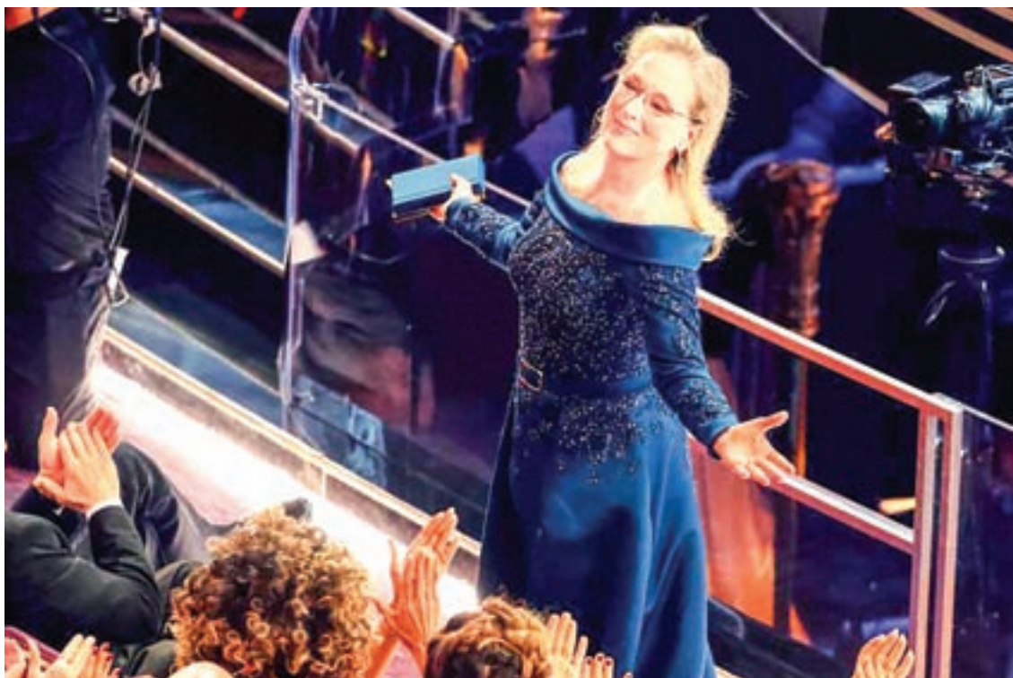
Actress Meryl Streep reacts at the 89 th Academy Awards — Oscars Awards Show at Hollywood in California, US, on 26 March 2017.

Viewer ratings have soared for “Saturday Night Live” since Baldwin started portraying Trump in a series of skits mocking the billionaire reality TV star-turned-politician as a dim-witted commander-in-chief with a short attention span, an oversized-ego and a Twitter addiction. Trump criticized the NBC show in December, calling it “totally unwatchable” and a “hit-job.” Asked whether he felt playing the president took a toll on him, Baldwin said the challenge of the role was that it would “delight some people and offend other people.”—Reuters