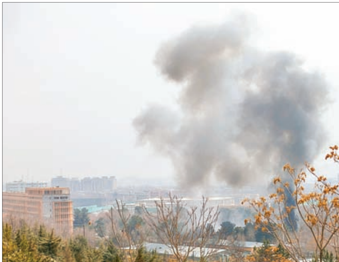
Smoke rises from a military hospital area at the site of blast and gunfire in Kabul, Afghanistan on 8 March, 2017.

“In all religions, a hospital is regarded as an immune site and attacking it is attacking the whole of Afghanistan,” he said in impromptu remarks during a speech for International Women’s Day in Kabul.