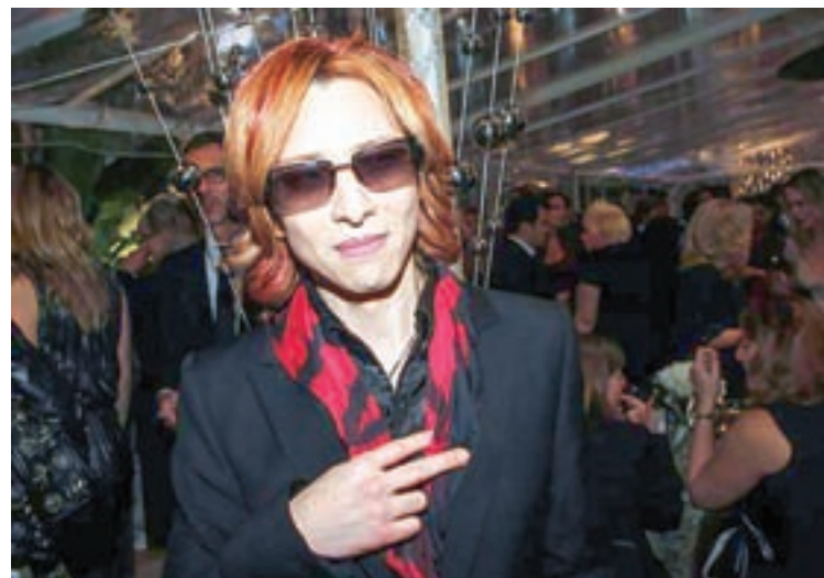
Japanese musician Yoshiki from rock band X Japan poses inside HBO after party following the 69 th annual Golden Globe Awards in Beverly Hills, California on 15 January 2012.