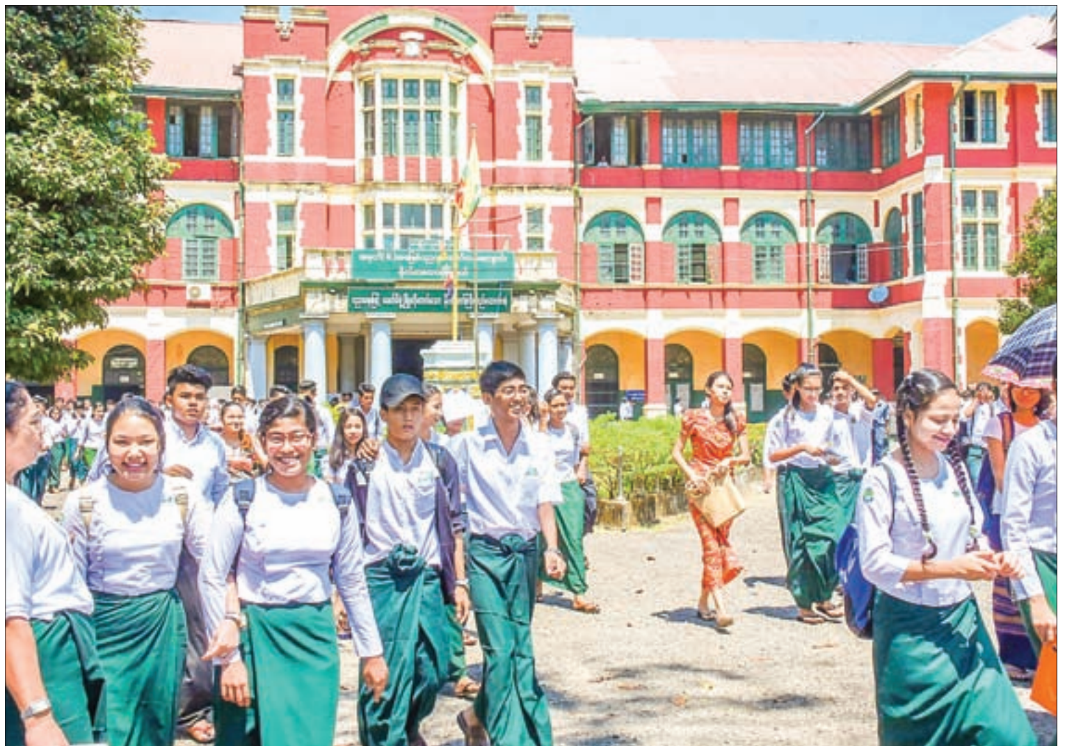
Students return home following the end of the first day of matriculation examinations at BEHS-6 in Botataung, Yangon.

Out of 114,237 students registered for the exams in Yangon Region, 104,256 students took the exam. Absent were 9,981 students. Six students took the exam at Yangon General Hospital, with no absentees.—GNLM