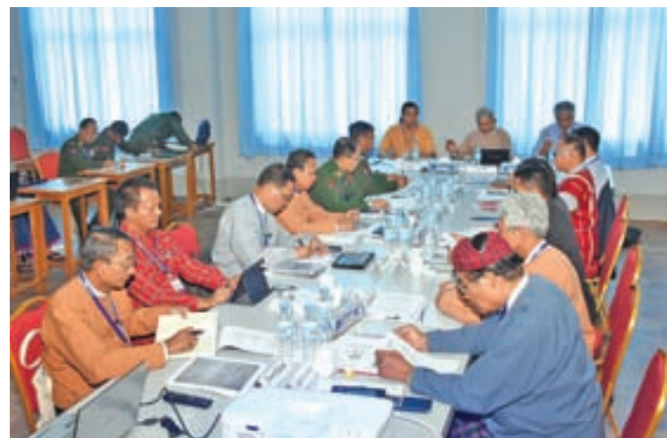
A working committee discussing the political sector.

The various working committee discussion meetings will be held from 8 to 10 March.