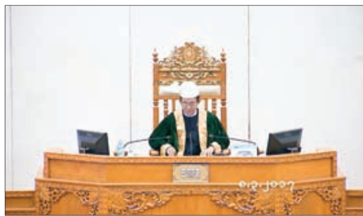
Speaker U Win Myint.

Ministries concerned should implement the use of pastureland as farming land. Only if the remaining pastureland can be divided among farmers without farming land, will it be helpful to reduce poverty and to develop rural areas. The motion of acqui-