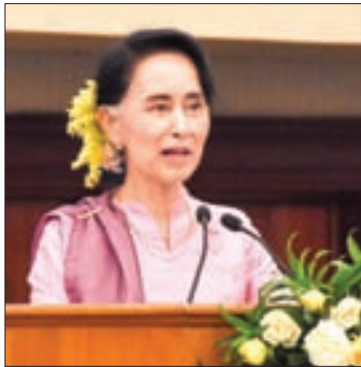
State Counsellor Daw Aung San Suu Kyi.

ON International Women's Day, State Counsellor Daw Aung San Suu Kyi highlighted the role of women in the peace-making process, urging women who are taking part in economic sectors to make the best use of their wealth and proficiency in business for the peace of the country.