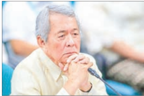
Philippine Foreign Secretary Perfecto Yasay gestures during a commission on Appointment hearing at the Senate headquarters in Pasay city, metro Manila, Philippines on 8 March, 2017.

MANILA — Philippine lawmakers dismissed a close ally of President Rodrigo Duterte as foreign minister on Wednesday, citing "compelling issues" about his qualifications and his failure to prove he was not a US citizen when he took the job. The Commission on Appointments unanimously decided not to approve Perfecto Yasay as minister, hours after a confirmation hearing in which he was grilled about his citizenship and inconsistent statements made during television in-