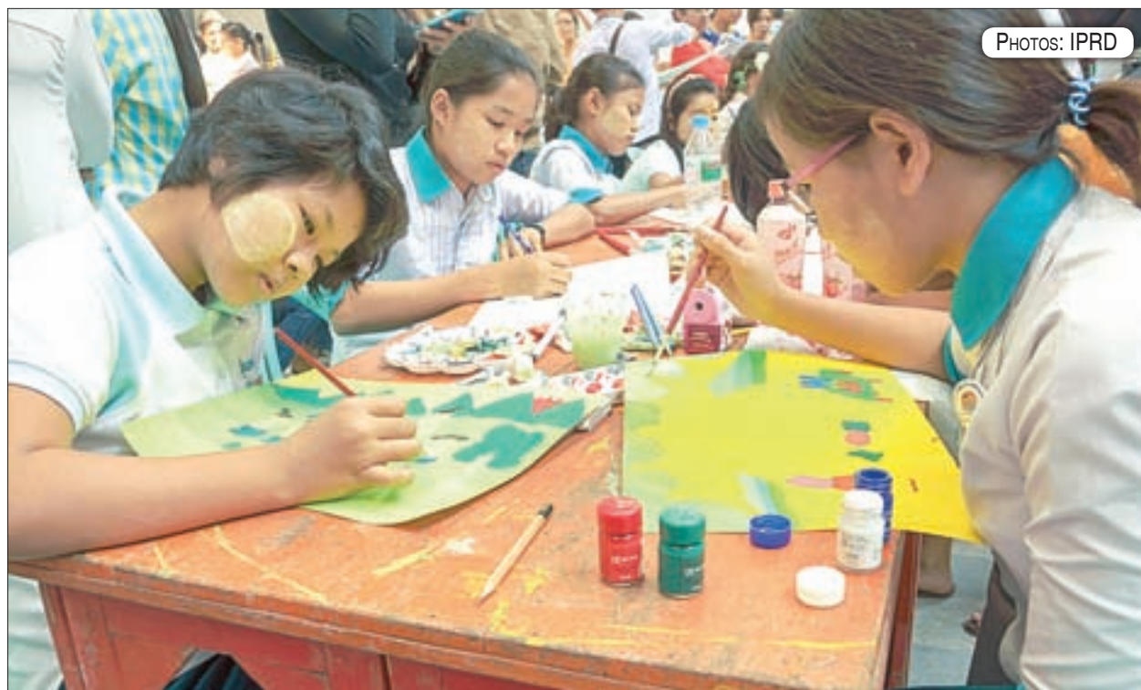
Children draw the pictures at the Children Literature Festival.