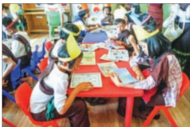
Students read books in the reading room for children.

For the development of reading rooms for children, upgrading of reading among children is being carried by supplying 133 District and Township Offices with necessary furniture used in children's reading rooms. And, story-telling contests, poem-recitation competition and essay writing contests are being held for children.