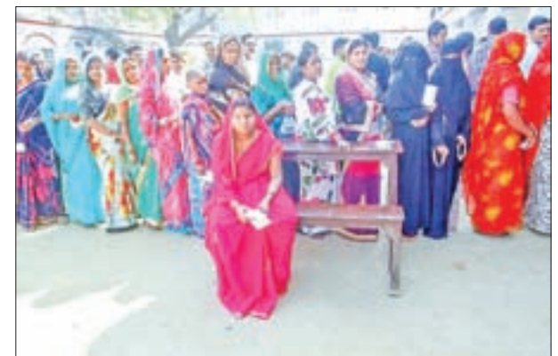
People queue up to vote at a polling booth during the last phase of Uttar Pradesh state assembly election, in Varanasi on 8 March, 2017.

A third party, popular among lower-caste Indians in a region where most people vote along social and religious lines, appears to be recovering some