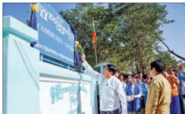
U Pe Myint, Union Minister for Information sprinkles scented-water on the board of Natmauk Community Center.