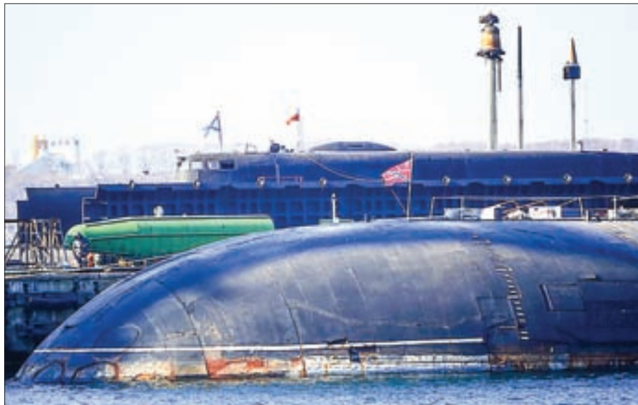
Project 949A Antey submarine. Project 949A Antey nuclear-powered submarines will be rearmed with Kalibr missile systems after a profound upgrade.

Overall, Russia has built 11 Project 949A Antey submarines. Eight of them have remained operational with the Russian Navy. Each submarine has a dis-