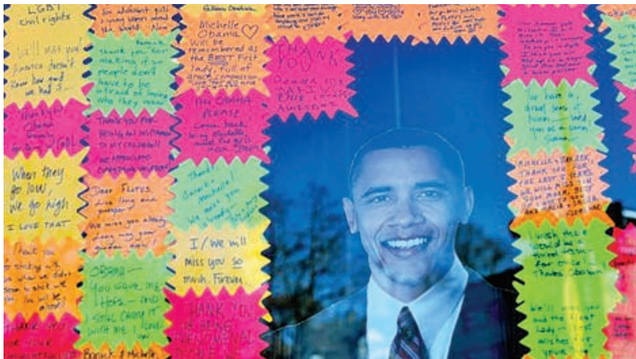
Messages are seen next to a cut-out of former US President Barack Obama at a local shop during President Day holiday in Washington US, on 20 February 2017.

NEW YORK — Former US President Barack Obama on Thursday was named this year's winner of the John F. Kennedy Presidential Library's "Profile in Courage" award, an annual honour for leaders who stand up to political opponents.