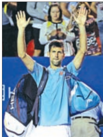
Serbia's Novak Djokovic waves after losing match against Australia's Nick Kyrgios in Acapulco, Mexico, on 2 March 2017.

Kyrgios needed only one for victory, taking the initiative with