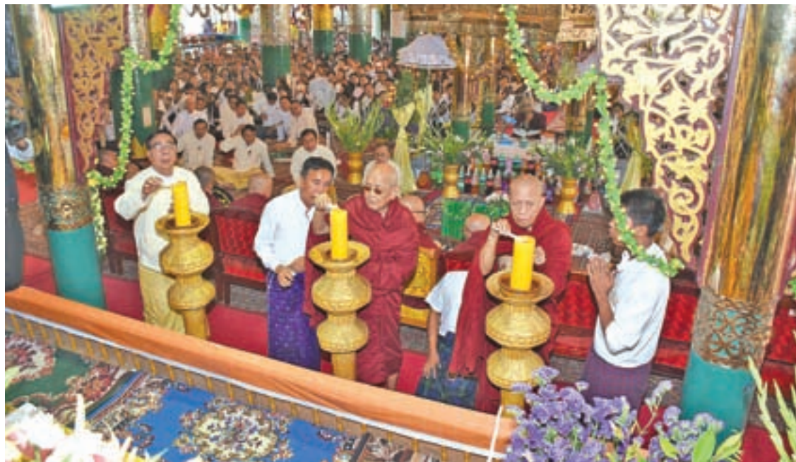
Venerable Sayadaws light candles to the Pagoda and open the Tabaung Festival.