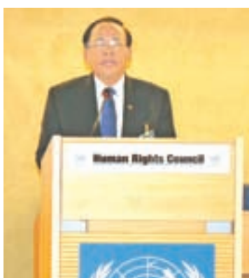
Minister of State for Foreign Affairs U Kyaw Tin.

tion of the issue of Rakhine State including establishment of domestic mechanisms. He also pointed out that at a time when the Government's such efforts were gaining momentum, the coordinated armed attacks against three police outpost took place in northern Rakhine State on 9 October 2016. He briefed the Council of such attacks, conduct of area clearance operation to arrest the perpetrators and to retreat arms and ammunition taken away by the armed attackers and ongoing investigation through a national investigation commission on allegations of human rights abuses. The Minister of State also stressed that any action by the HRC must be a cure and part of the solution, not part of the problem; the Council's focus must be on resolving, not inflaming, the very evident tensions in the Rakhine State and on helping us bring the communities together instead of