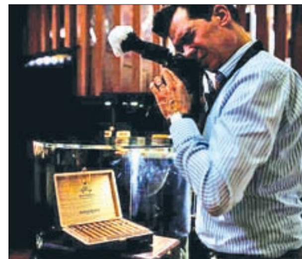
A photographer takes a photograph of cigars on display at the 19th Habanos Festival in Havana, Cuba, on 27 February 2017.

"People reckon they had better buy now because they don't know if it will be legal next year," he said. "You just don't know about tomorrow."—Reuters