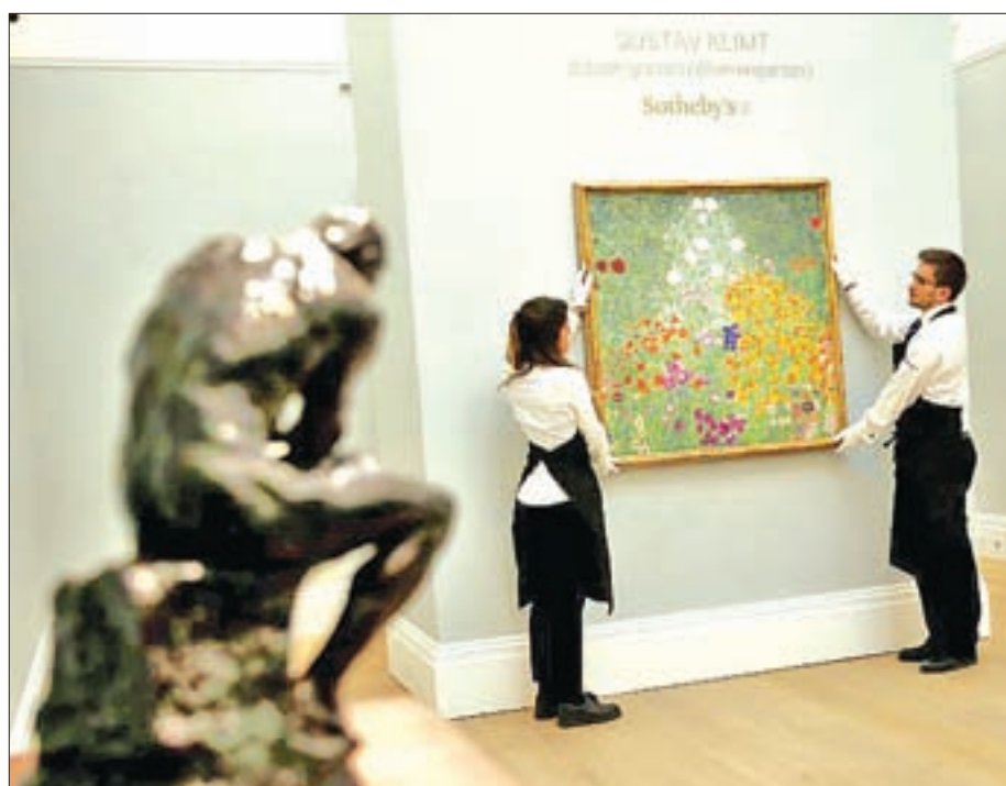
Workers pose with Gustav Klimt's "Bauerngarten (Blumengarten)" ahead of an upcoming sale at Sotheby's auction house, in London, Britain, on 22 February 2017. A painting of flowers by Gustav Klimt sold in London for 48 million pounds ($59 million), a record for a work by the Austrian artist and the third-highest price for any work sold at auction in Europe, Sotheby's said on 2 March 2017.

"Tonight's outstanding result is a new benchmark for London sales as much as it is a statement on the momentum of the global art market in 2017," said Helena Newman, chairman of Sotheby's Europe, in a statement.