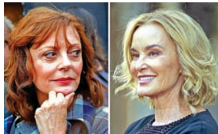
Actors Susan Sarandon (L) and Jessica Lange.

"I think the strength of women who had to survive this, through the knocks, through the aging process, having your face on a twenty-by-twenty foot screen and people critiquing you, that is the same as today," she said.—Reuters