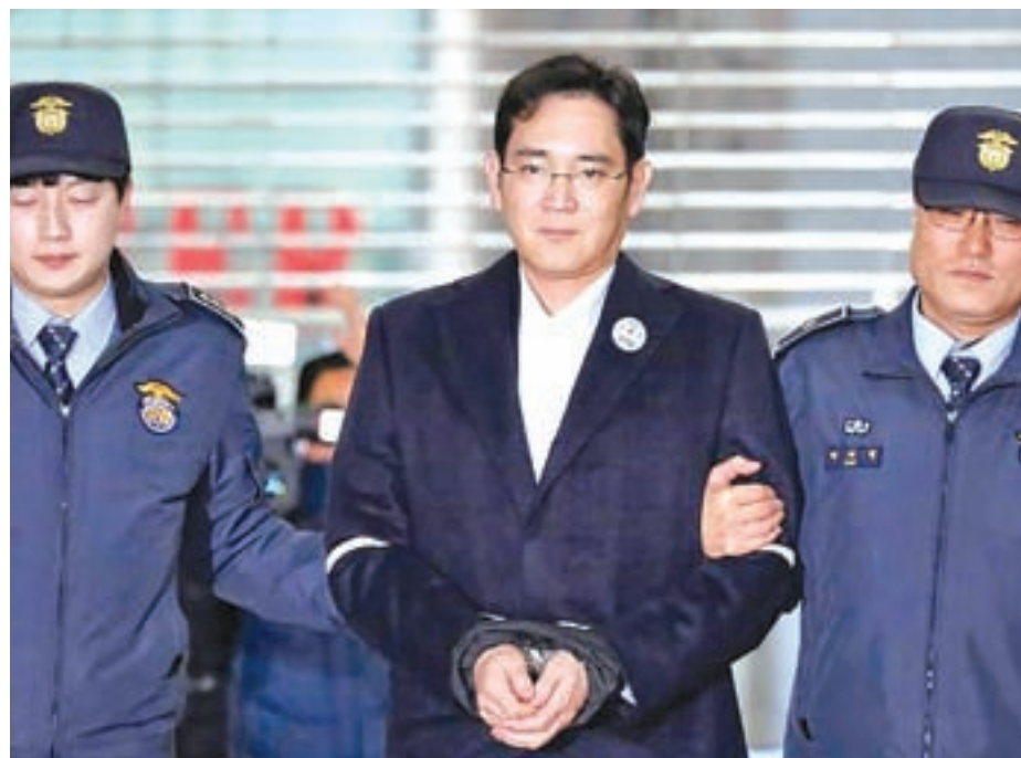
Samsung Group chief, Jay Y. Lee arrives at the office of the independent counsel team in Seoul, South Korea, on 19 February 2017.

BKL declined to make its attorneys available for comment, while the other three defence lawyers declined comment or were not immediately available.—Reuters