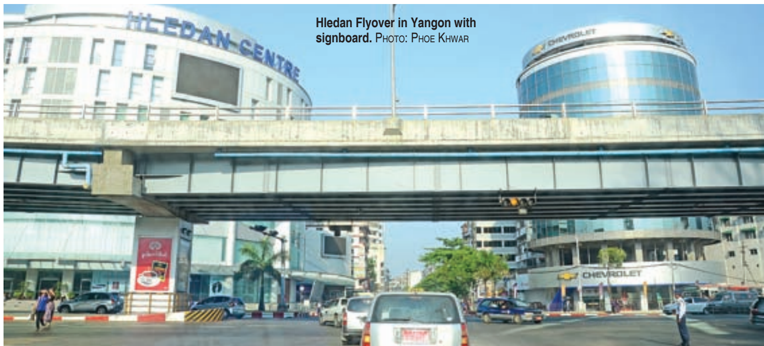
Hledan Flyover in Yangon with signboard.

The commercial advertisements on the signboards cost Ks25,000 for the Hledan flyover, Ks20,000 for the Bayintnaung flyover, Ks45,000 for the Shwegondine flyover and Ks40,000 for the Myaynigone flyover. The YCDC invited signboard tenders to advertise businesses for a period of one year. Currently, three advertisers who bought space on the three bridges have already submitted appeals to YCDC to grant extensions for their advertising purchases.—200