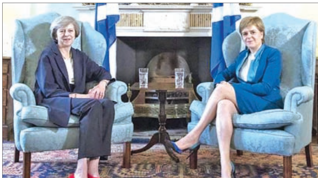
New British Prime Minister Theresa May meeting First Minister of Scotland, Nicola Sturgeon at Bute House in Edinburgh, Scotland, on 15 July 2016.

LONDON — The Scottish National Party is treating politics as a game and obsessing over independence rather than focusing on improving public services in Scotland, Prime Minister Theresa May will say on Friday.