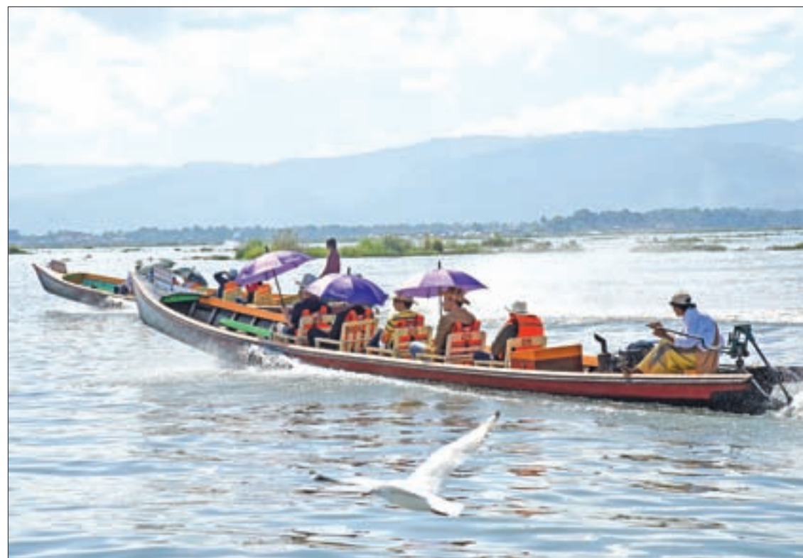
Visitors take a boat trip in Inle Lake, Nyaungshwe Township.

Construction of a new jetty could be built on the west bank of Inle Lake about three miles away from Nyaungshwe Township. After the jetty is completed, visitors' travelling would not only be more convenient, but export of agricultural goods from the lake such as tomatoes would also be easier.—200