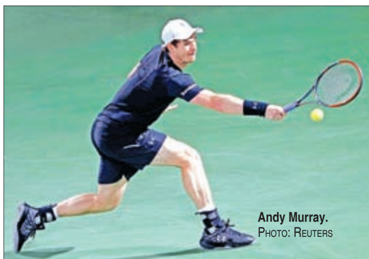
Andy Murray.

"I've never played a tiebreak like that ever, not in juniors, nothing has been close to that," Murray, who is contesting his first tournament since losing in the fourth round of the Australian Open in January, told reporters.