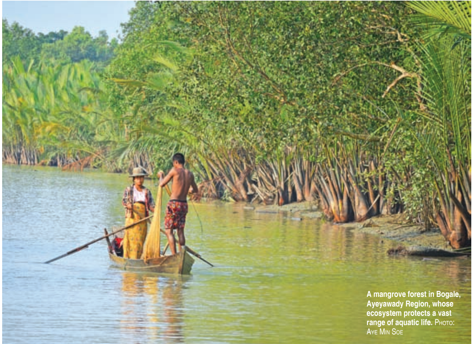
A mangrove forest in Bogale, Ayeyarwady Region, whose ecosystem protects a vast range of aquatic life.

Present at the meeting were U Ohn Win, Union Minister, Dr Le Le Maw, Chief Minister of Taninthayi Region Cabinet, U Win Thein, Chief Minister of Bago Region Cabinet, Ministers from Yangon Region, Mon State, Rakhine State and Ayeyarwady Region Cabinets, permanent secretaries who are central committee members, departmental heads, invited guests and responsible officials. SEE PAGE 2 >>