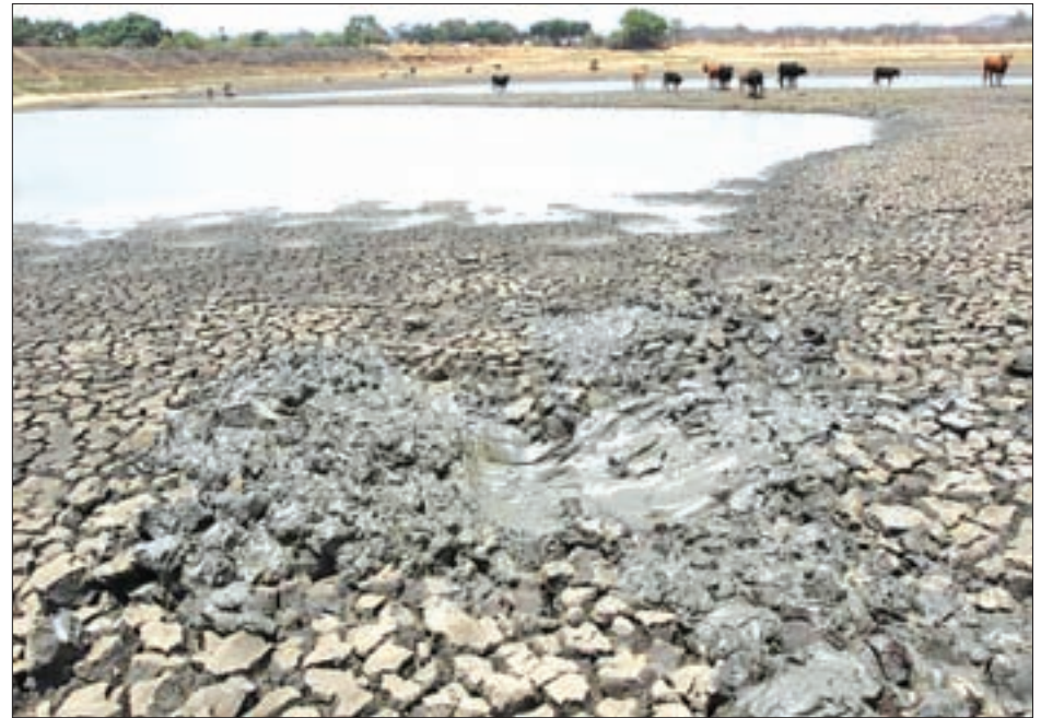
Cattle stand over cracked earth as water levels drop in a dam near Mount Darwin, Zimbabwe, on 26 October 2016.