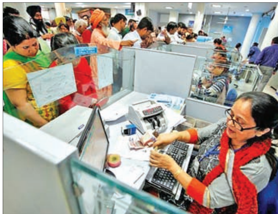
A cashier counts Indian banknotes as customers wait in queues inside a bank in Chandigarh, India, on 10 November 2016.

That has raised questions about the quality of government data, and prompted economists to