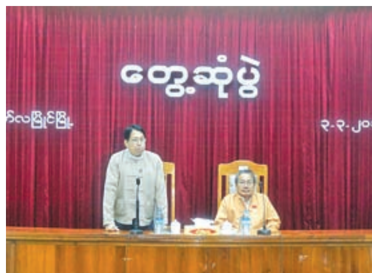
Union Minister Dr Pe Myint addresses coordination meeting on organizing Children's Literary Fair in Mawlamyine.