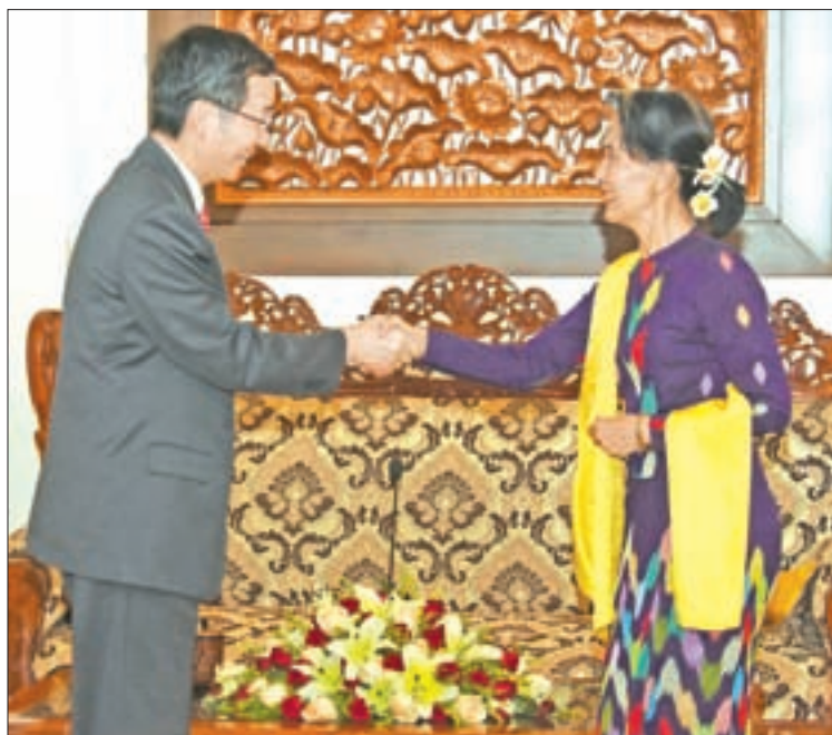
State Counsellor Daw Aung San Suu Kyi welcomes Mr. Sun Guoxiang, Special Envoy from China in Nay Pyi Taw.