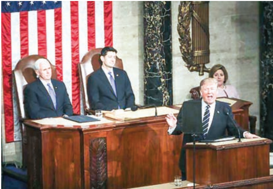
US President Donald Trump addresses Joint Session of Congress in Washington, US on 28 February, 2017.

WASHINGTON — President Donald Trump's pick to head the Interior Department is expected to be confirmed easily by the US Senate on Wednesday morning as the White House seeks to increase fossil fuel production from federal lands.