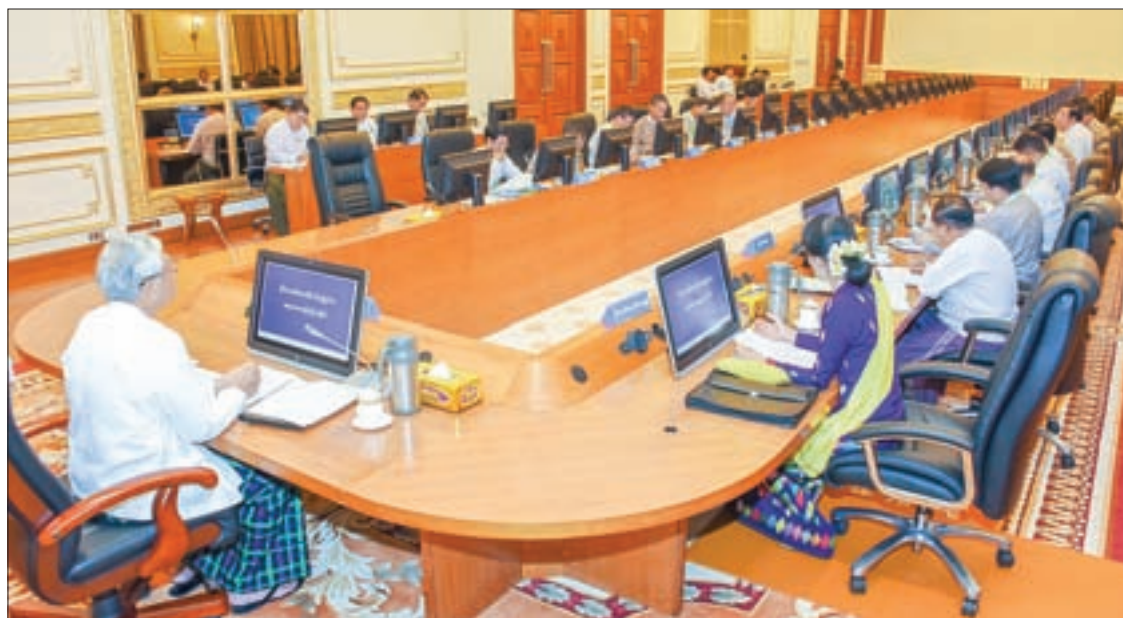
President U Htin Kyaw addresses the meeting of Central Committee for Development of Small and Medium Enterprises (1/2017) in Nay Pyi Taw.

"We can liken small and medium enterprises to a bridge linking local and foreign sectors.