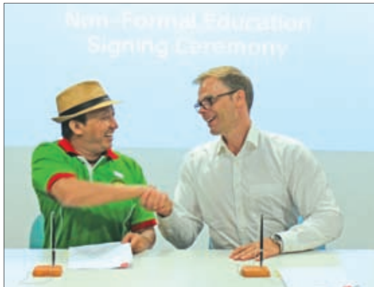
Officials from myME, Telenor shaking hands after signing agreement on 27 February.

"Providing functional literacy and vocational skills to out-of-school and working children is the most critical and practical contribution that anyone can make, especially during this his-