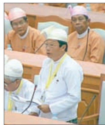
U Hla Kyaw, Deputy Minister for Agriculture, Livestock and Irrigation.

maintenance and propagation of the traditional cultures, customs and cultural heritages of national ethnics."