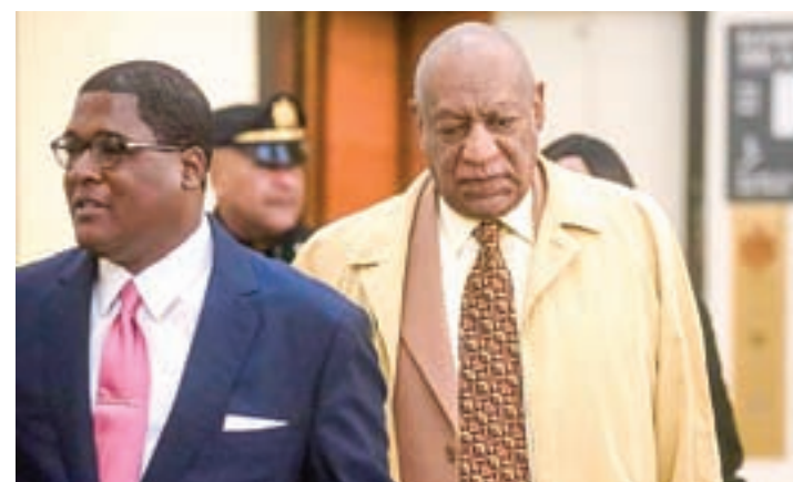
Comedian Bill Cosby arrives for a pre-trial hearing at the Montgomery County courthouse in Norristown, Pennsylvania, US, on 27 February, 2017.