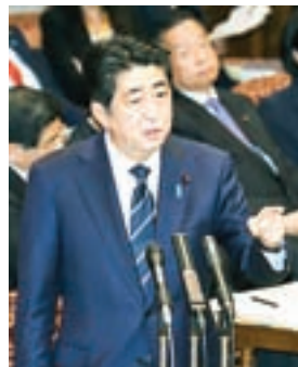
Japanese Prime Minister Shinzo Abe speaks during a session of the House of Councillors budget committee in Tokyo on 1 March, 2017. Japan remains committed to exploring the feasibility of a Trans-Pacific Partnership free trade pact without the United States, Abe said.

TOKYO — Japan remains committed to exploring the feasibility of a Trans-Pacific Partnership free trade pact without the United States, Prime Minister Shinzo Abe said on Wednesday. “I will discuss with (TPP) countries other than the United States the possibilities we can see in the future,” Abe told a parliamentary session ahead of a ministerial meeting on the initiative in Chile on 15 March.