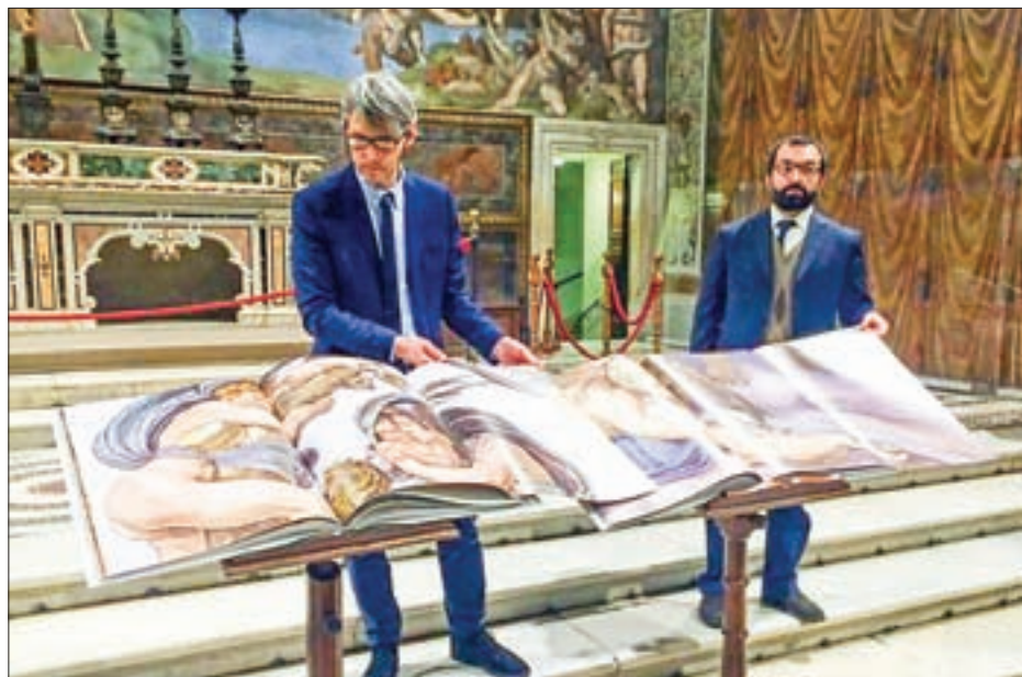
Two 1:1 scale photographic books depicting Sistine Chapel are seen during a news conference in the Sistine Chapel, the Vatican on 24 February 2017.

Post production computer techniques included "stitching" of frames that