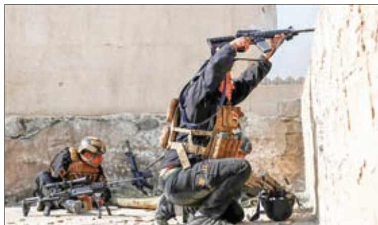
An Iraqi special forces soldier fires his rifle at Islamic State fighters' positions during a battle in Mosul, Iraq, on 28 February 2017.

Mosul to Tal Afar, another Islamic State stronghold 60 km (40 miles) to the west, and then to the Syrian border. Iraqi forces captured the eastern side of Mosul in January after 100 days of fighting and launched their attack on the districts that lie west of the Tigris river on 19 February. If they defeat Islamic State in Mosul, that would crush the Iraq wing of the caliphate declared by the group's leader Abu Bakr al-Baghdadi in 2014. The US commander in Iraq has said he believes US-backed forces will recapture both Mosul and Raqqa, Islamic State's Syria stronghold in neighbouring Syria, within six months.—Reuters