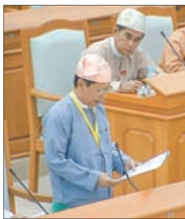
Thura U Aung Ko, Union Minister for Religious Affairs and Culture.

The Union Minister added, "Original statement submitted by the Ministry of Religious Affairs and Culture says that traditional cultures and customs of national ethnics are to be surveyed and recorded collectively. Over the discussion made by Hluttaw representative, I hereby want to say that it has been described in the revised statement as "to record survey works, for traditional cultures and customs of national ethnics not to be extinct and to develop simultaneously." The objective of the Ministry of Religious Affairs and Culture is exploration,