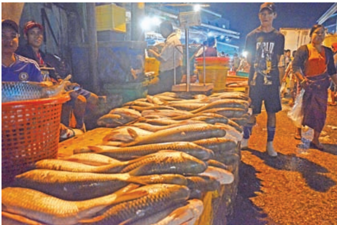
Fish are seen at Sanpya Fish Market, Yangon, on 7 January 2017.

The merchants from Minbu, Salin and Magwe come to Pwintbyu to buy them. Jackfruit trees are perennial and so they are planted in the compounds. They start to yield only after six or ten years of cultivation depending on the soil.— Thura Tun (Pwintbyu)