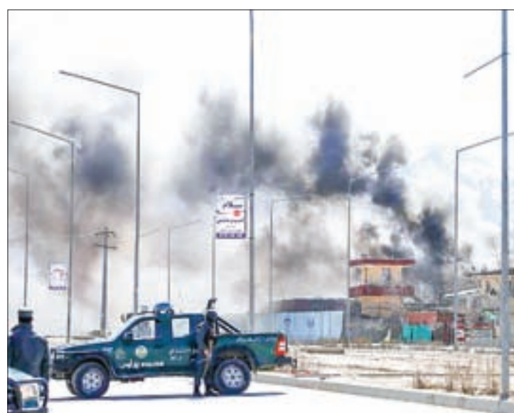
Smoke rises from the site of a blast and gunfire between Taliban and Afghan forces in PD 6 in Kabul, Afghanistan, on 1 March 2017.