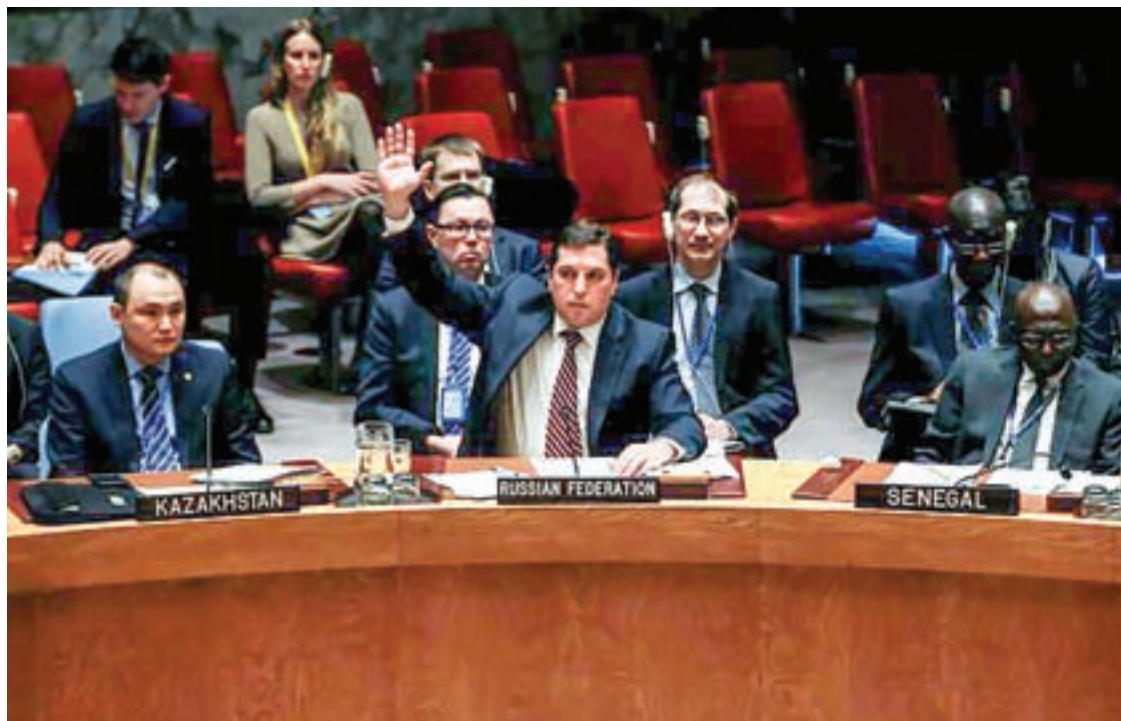
Russian Deputy Ambassador to the United Nations Vladimir Safronkov raises his arm to vote against a United Nations Security Council resolution to ban the supply of helicopters to the Syrian government and to blacklist Syrian military commanders over accusations of toxic gas attacks at UN headquarters in New York City, US, on 28 February 2017.

confrontations at the United Nations between Russia and the United States since US President Donald Trump took office in January, pledging to build closer ties with Moscow.