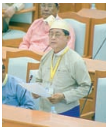
U Maung Maung Win, Deputy Minister for Planning and Finance.