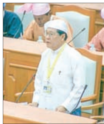
U Thein Swe, Union Minister for Labor, Immigration and Population.