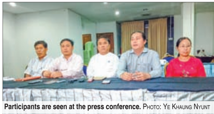
Participants are seen at the press conference.