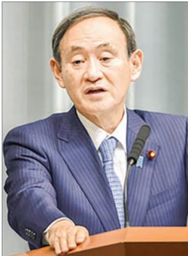
Japanese Chief Cabinet Secretary Yoshihide Suga gives a press briefing in Tokyo on 1 March, 2017.

TOKYO — Japan will coordinate closely with the United States to build a robust bilateral alliance, the top government spokesman said on Wednesday, after US President Donald Trump renewed his vow to “make America great again” in his first address to Congress.