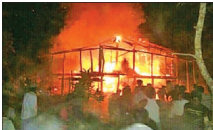
Local residents try to prevent further spreading of fire.