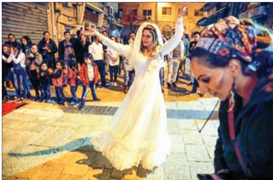
A woman dances as Arab and Jewish players compete in a backgammon championship organised by Double Yerushalmi, a group trying to build closer ties between Arabs and Jews through cultural activities, in Jerusalem, on 27 February, 2017.

To the strains of Arabic Dabke music — not usually heard in the western, mainly Jewish side of Jerusalem —