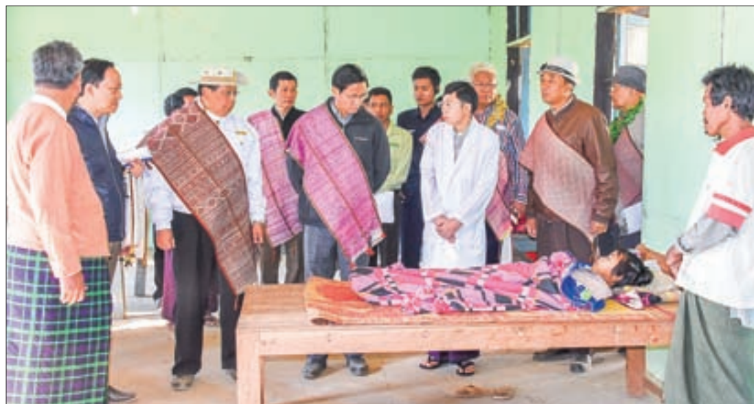
Vice President U Henry Van Thio comforts a patient receiving medical treatment at People's Hospital in Paletwa.