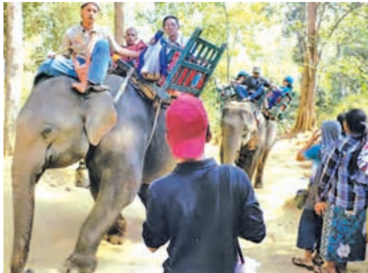
Pilgrims take elephant ride to Alaungdaw Kathapa Pagoda.

"Then, the trustee will build the building on the land. We also