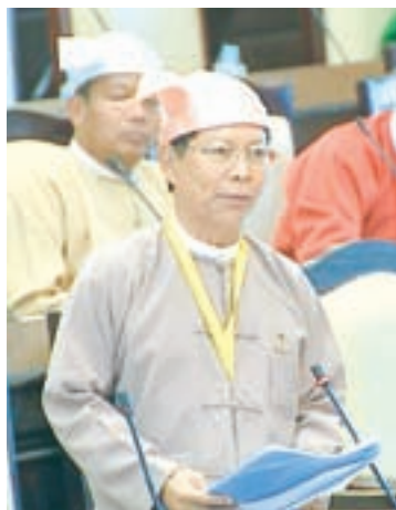
Thura U Aung Ko, Union Minister for Religious Affairs and Culture.

"The Holy Black-Robed Buddha Image was aged to be 100 years or more, so it can be designated to be an antique. According to the law of protecting and conserving antiques, the Ministry is liable to keep the antique as an item of cultural heritage if the antique is considered to be easily harmed or decayed or damaged. Yet, the above-said Buddha Image is being used as an antique