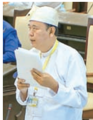
U Win Maw Tun, Deputy Minister for Education.

the Deputy Minister for Education, replied to questions raised by U Han Win Thein of Taninthayi Region constituency 4, U Kyaw Ni Naing of Shan State constituency 11, U Zonhlehtan of Chin State constituency 4 and U Soe Thiha (a) Maung Tu of Mon State constituency 10.