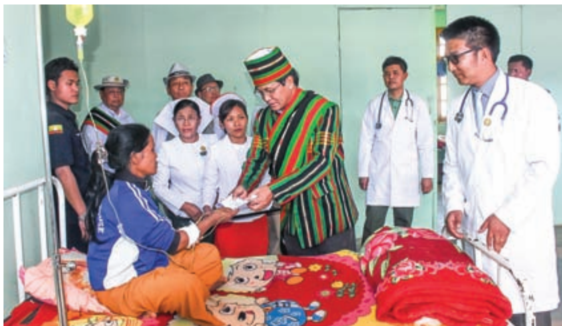
Vice President U Henry Van Thio presents cash assistance to a patient receiving treatment at Matupi Hospital.

He also explained how they are working on safeguarding the people from calamities and preventive measures to avoid similar events that had occurred. He also explained how in developing preventive measures from natural disasters like landslides consideration is put into supplying the region with adequate electricity and drinking water. In this endeavor, he suggested that a joint committee should be formed as soon as possible, comprising experts on geology, geography and irrigation and led by the Chief Minister of Chin State.— Myanmar News Agency