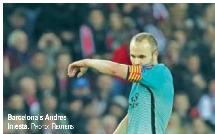
Barcelona's Andres Iniesta.

"There are no doubts regarding our commitment to him," Iniesta said. "I hope he has the desire to continue in this team in order to continue to win titles."— Reuters