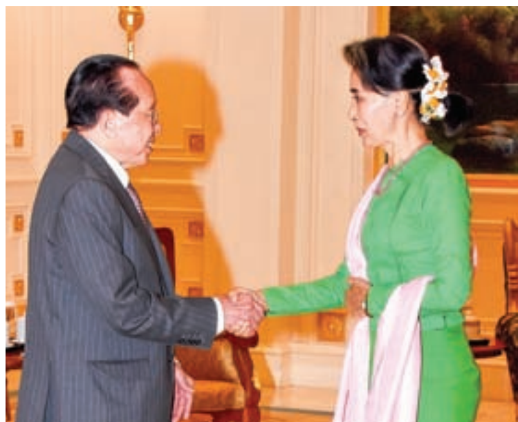
State Counsellor Daw Aung San Suu Kyi welcomes Cambodian Deputy Prime Minister Mr. Hor Namhong.