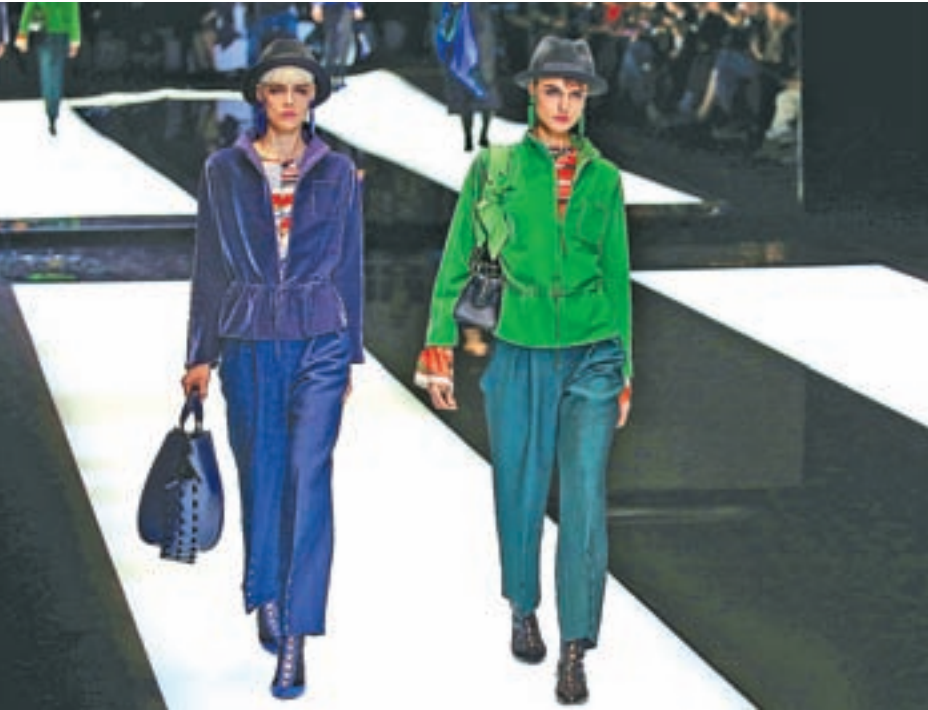
Models present creations from the Giorgio Armani Autumn/Winter 2017 women collection during Milan Fashion Week, in Milan, Italy on 27 February, 2017.

MILAN — Once again Italian designer Giorgio Armani stunned with bright and eloquent colours in his autumn and winter collection, wrapping up six days of catwalk shows at Milan’s Fashion week. As with his Emporio line, shown on Friday, the designer brought to life his