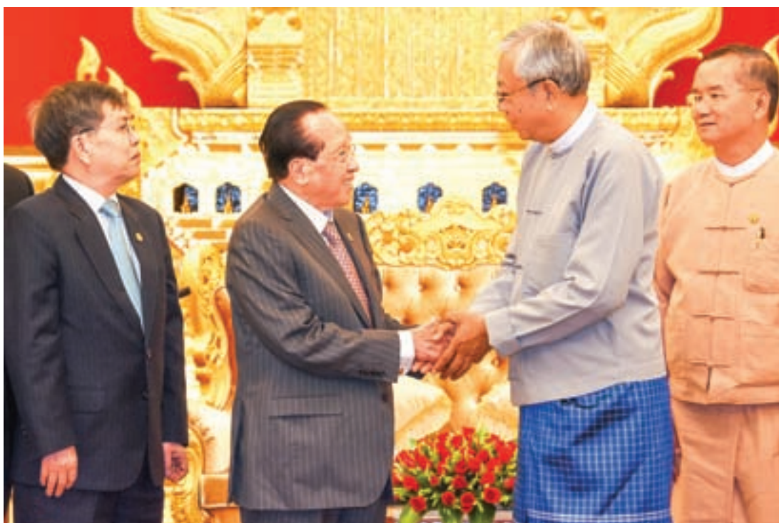
President U Htin Kyaw shakes hands with Cambodian Deputy Prime Minister Mr. Hor Namhong.

THE president of the Republic of the Union of Myanmar U Htin Kyaw received Cambodian Deputy Prime Minister Mr. Hor Namhong and delegation at the Credentials Hall of the Presidential Palace yesterday morning in