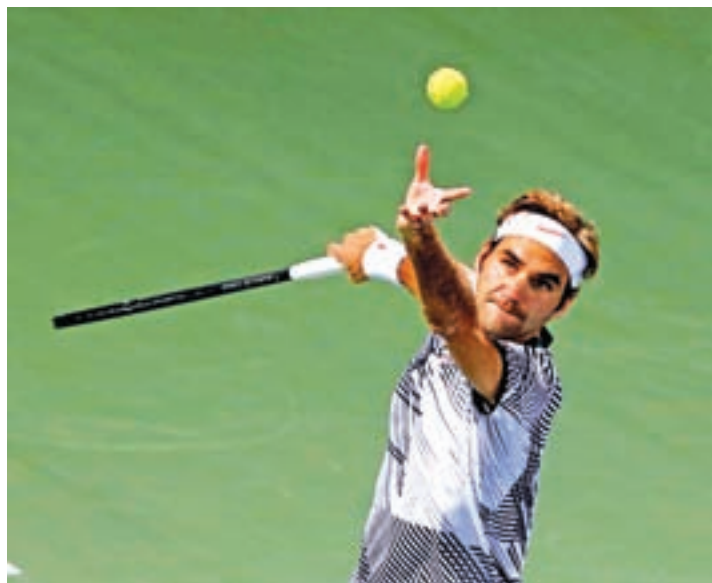
Roger Federer.

Ranieri's former assistant, 53-year-old Craig Shakespeare, was in charge on Monday and is among the candidates to replace Ranieri on a full-time basis.— Reuters