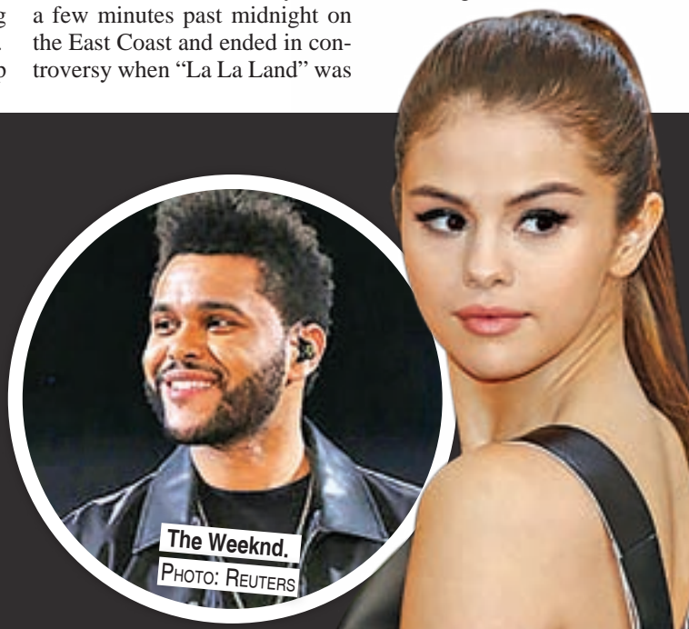
The Weeknd.

The pair, who have been spotted on several dates here and Italy over the last two months, touched down in the famously romantic city just ahead of the start of Paris Fashion Week, which kicks off today.—PTI