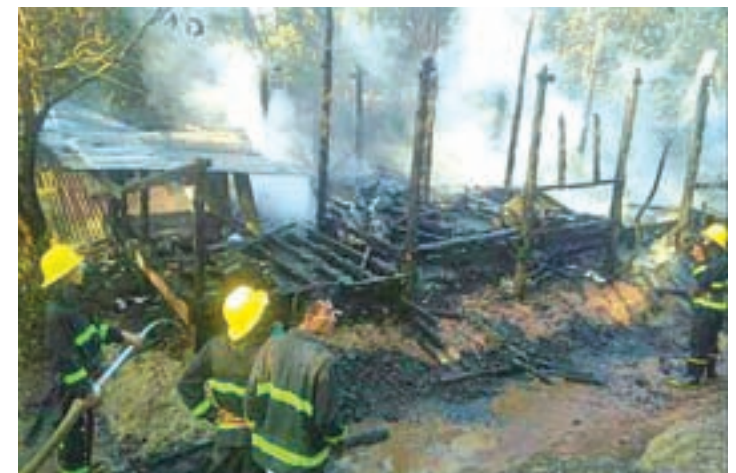
Fire fighters pull out the fire at monastery in Maungtaw.

The fire started from a candle on the shelf of a Buddha image and destroyed a zinc-roofed building.— Myanmar News Agency