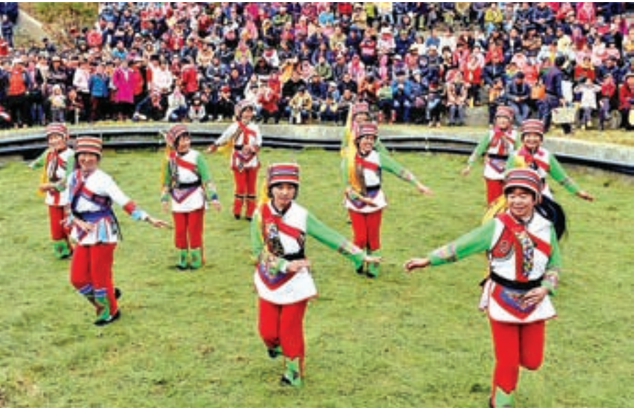
People of Yi ethnic group perform to celebrate Er Yue Er, or the second day of the second month on the Chinese Lunar calendar in Zika Village of Malong County, southwest China's Yunnan Province, on 27 February, 2017. Er Yue Er fell on 27 February this year. Chinese people call it the day when the "dragon raises its head", which means the spring awakens after winter hibernation.