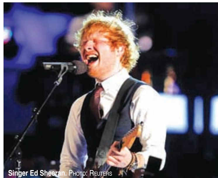
Singer Ed Sheeran.

Earlier, "Tonight Show" Music Room also saw ultimate a capella collaboration for many recording artists including Adele, Mariah Carey, Idina Menzel, One Direction, Metallica and Sesame Street.—PTI