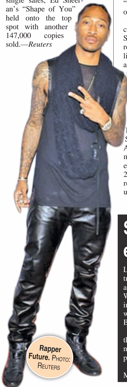
Rapper Future.

On the Digital Songs chart, which measures online single sales, Ed Sheeran's "Shape of You" held onto the top spot with another 147,000 copies sold.—Reuters