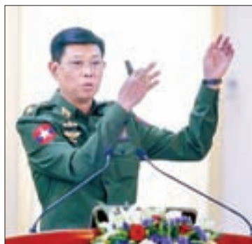
General Mya Tun Oo.

CLASHES between armed ethnic groups and the Tatmadaw in November in north-eastern Shan State effectively halted border trade with China, causing losses of US$90.5 million in just five days, a military leader said yesterday.