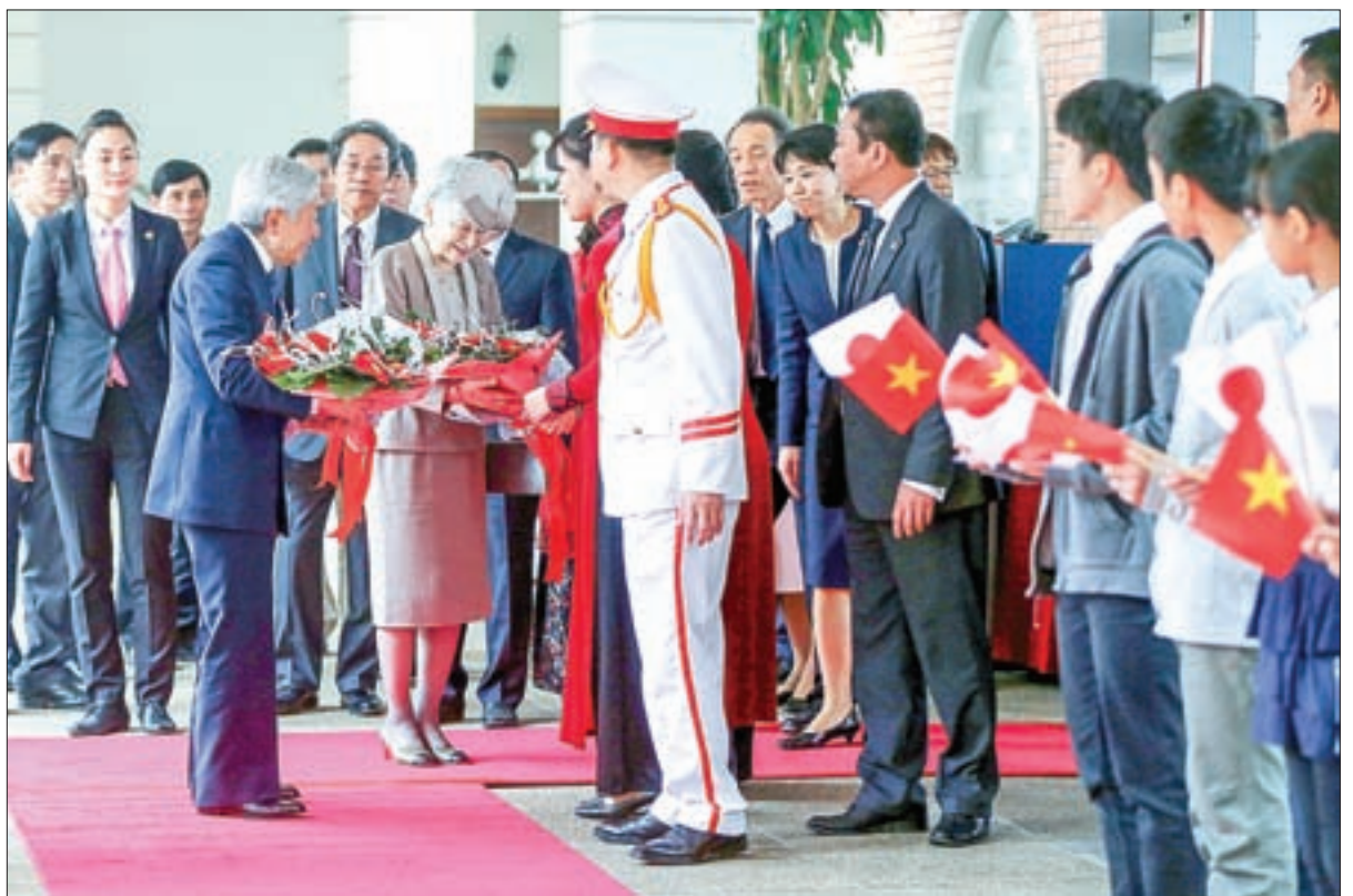
Japanese Emperor Akihito (L) and Empress Michiko (C) receive bouquets as arrive at the hotel in Hanoi, Vietnam on 28 February 2017. Emperor Akihito and Empress Michiko during their six-day visit, are expected to meet with surviving widows and families members of Japanese WWII war veterans.

Hun Sen has warned that an opposition election win could lead to the return of civil war. He has long dismissed Western concerns about human rights, democracy and corruption. Last week, the US embassy said it was deeply concerned about legislation introduced by Hun Sen's ruling party to make it easier for the government to dissolve political parties, saying it restricted freedom of expression and legitimate political activity.— Reuters