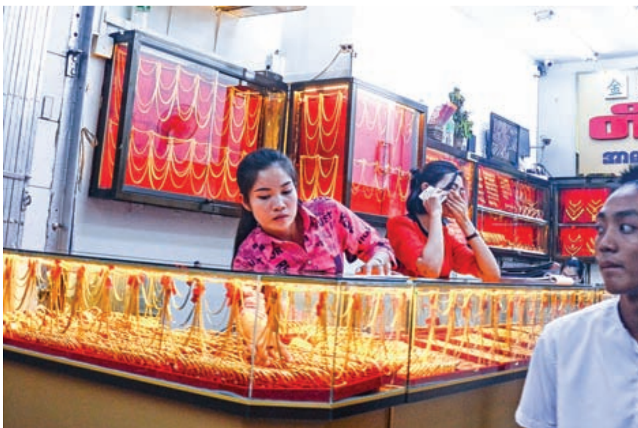
An employee prepares gold jewellery in the counter at a shop in Yangon on 15 February 2017.

The global gold price rose against the decline in the US dollar index on 24th February, with a price of US$1,257 per ounce at closing time on 24th February. The gold price on 20th February was US$1,235 per ounce in the global market, whereas it jumped to US$1,258 on 27th February, it is learnt.— Ko Htet