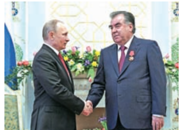
Russia's President Vladimir Putin shakes hands with his Tajik counterpart Emomali Rakhmon during their meeting in Dushanbe, Tajikistan on 27 February, 2017.