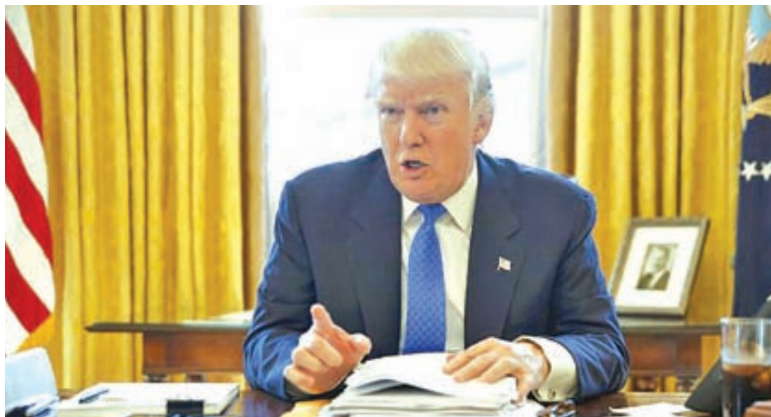
US President Donald Trump.

WASHINGTON — President Donald Trump is seeking what he called a “historic” increase in defence spending, but ran into immediate opposition from Republicans in Congress who must approve his plan and said it was not enough to meet the military’s needs.