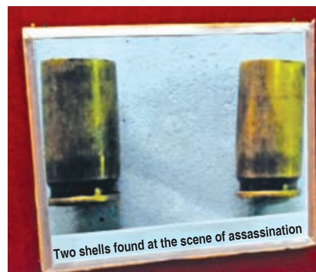
Two shells found at the scene of assassination