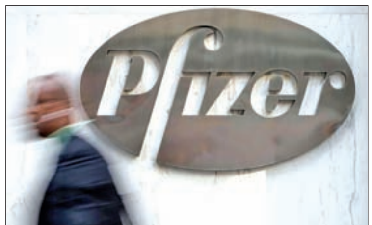
A man walks past Pfizer's world headquarters in New York on 28 April 2014.

Pfizer said it has been providing information to the government in response to the subpoenas.—Reuters