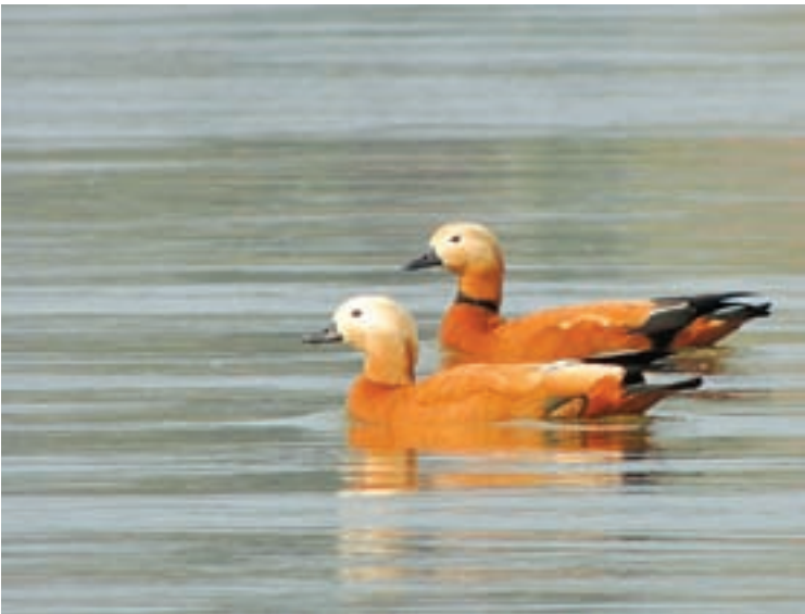
Ruddy Shelduck (male and female).