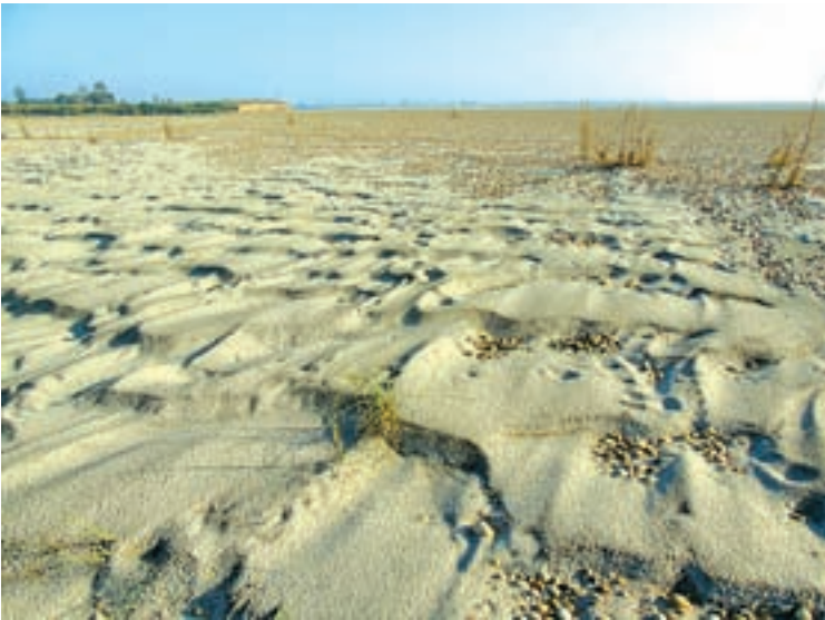
The dynamic river creates wild places and habitat for wildlife.