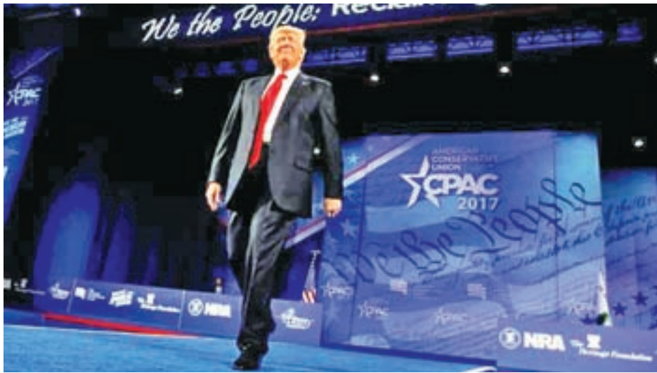
US President Donald Trump takes the stage to address the Conservative Political Action Conference (CPAC) in Oxon Hill, Maryland, US on 24 February, 2017.