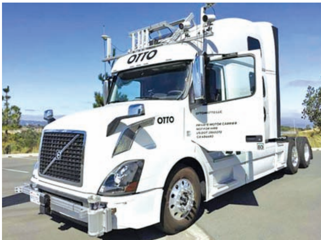
An Autonomous trucking start-up Otto vehicle is shown during an announcing event in Concord, California, US on 4 August, 2016.

Otto launched with much fanfare in May, due in part to the high profile of one of its co-founders,