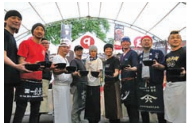
Representatives of 10 of Japan’s well-know ramen noodle restaurants pose for the media at the first Nippon Ramen Festival in Taipei on 14 February, 2017.

Different regions, from the colder Hokkaido to the