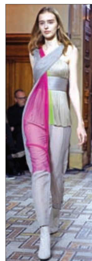
A model presents a creation from the Vionnet Autumn/Winter 2017 women collection during Milan's Fashion Week, in Milan, Italy, on 24 February 2017.

Models walked in a succession of frescoed and wooden beamed rooms of the 15 th century Milan palazzo Casa degli Atelliani, as