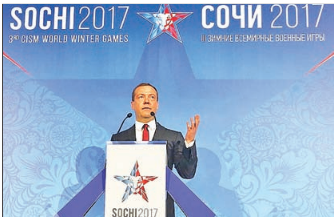
Dmitry Medvedev.

In February and March of 2014 the Black Sea resort city of Sochi hosted Winter Olympic and Paralympic Games, which, according to international sports officials, athletes and visitors, were organized at the highest level possible and provided up-to-date infrastructure at all levels as well as security for all participants in the event.—TASS