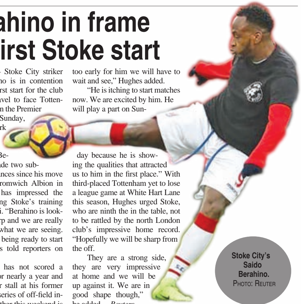
Stoke City's Saido Berahino.

They are a strong side, they are very impressive at home and we will be up against it. We are in good shape though,” he added.—Reuters