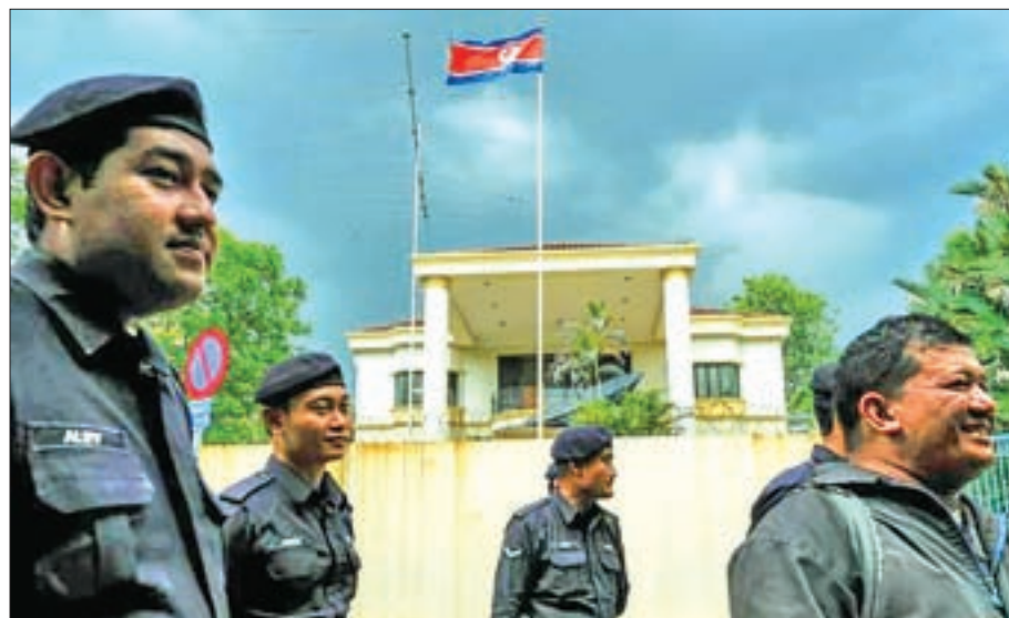
Malaysian Police officers gather before a protest organized by Members of the youth wing of the National Front, Malaysia's ruling coalition, in front of the North Korea embassy, following the murder of Kim Jong Nam, in Kuala Lumpur, Malaysia on 23 February, 2017.

They are seen grabbing at his face and then quickly walking away in different directions. Later clips show the victim asking airport officials for medical help. —Reuters