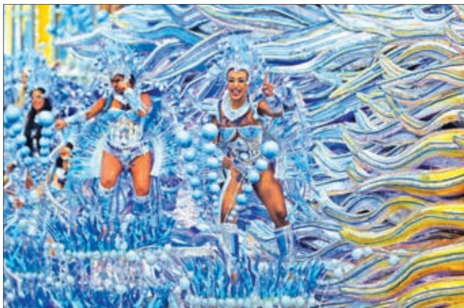
A reveller parades for the Aguia de Ouro samba school during the carnival in Sao Paulo, Brazil, on 25 February 2017.

Major carnival parades and other festivities will also take place in other cities, including São Paulo, Brazil's biggest metropolis, and Salvador, a city in the northeast where processions of giant floats serve as stages for pop stars and other performers— Reuters