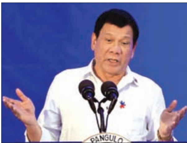
Philippine President Rodrigo Duterte. PHOTO: REUTERS

Rights groups and a US senator criticised Duterte for the arrest of