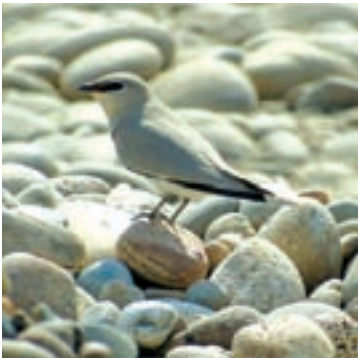
Small pratincole, a characteristic bird of from the the Ayeyawady River.

“Despite the decline, this is still a globally-important site for waterbirds. Therefore we believe it is now critical to secure the designation of this river section as a globally important wetland under the international protection of the