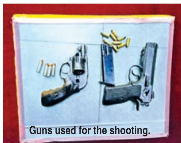
Guns used for the shooting.