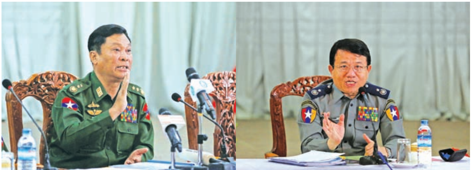
Union Minister for Home Affairs Lt-Gen Kyaw Swe (Left) and Myanmar's Police Chief Police Maj-Gen Zaw Win (Right) speak to the media during a news conference regarding the killing of U Ko Ni, in Yangon, Myanmar, on 25 February 2017.

PERSONAL antagonism and extreme nationalism was behind the assassination of legal adviser to the ruling National League for Democracy (NLD) U Ko Ni, said Union Minister for Home Affairs Lt-Gen Kyaw Swe yesterday.