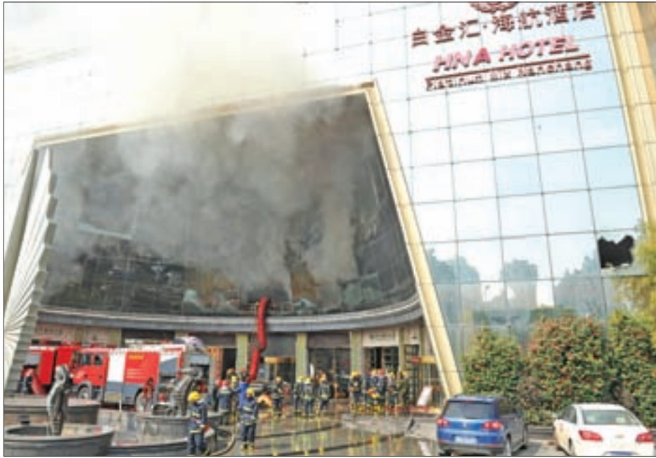
Firefighters are seen at the site after a fire broke out at HNA Hotel in Nanchang, Jiangxi province on 25 February, 2017.