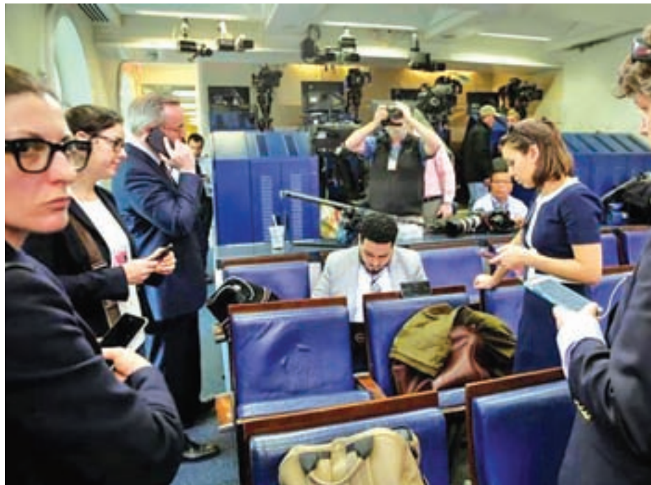
Journalists work in the briefing room at the White House in Washington, US on 24 February, 2017.

"Nothing like this has ever happened at the White House in our long history of covering multiple ad-