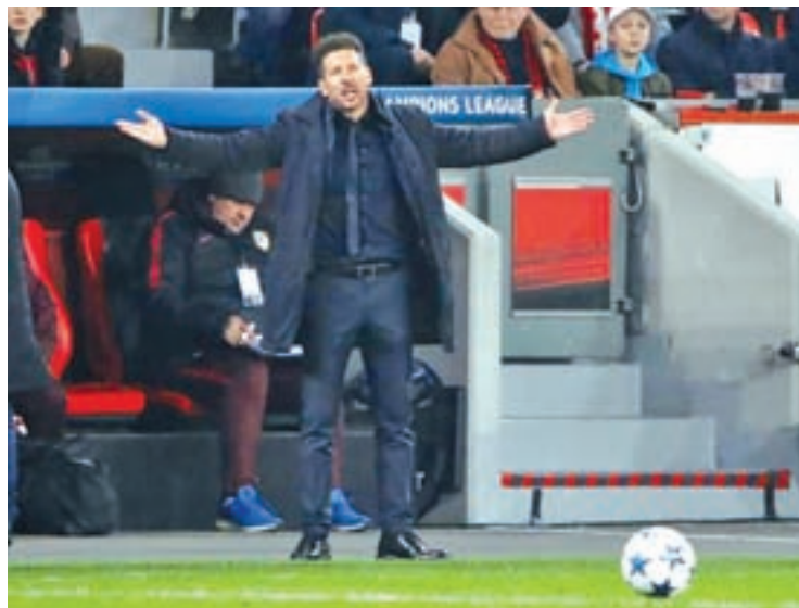
Atletico Madrid coach Diego Simeone.

MADRID — The toughness and guile that made Diego Simeone a great player has been there for all to see in his time as manager of Atletico Madrid, and the Argentinian marks his 300 th game at the club with a major challenge on Sunday against Barcelona.