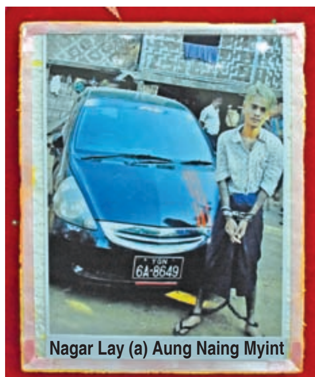
Nagar Lay (a) Aung Naing Myint