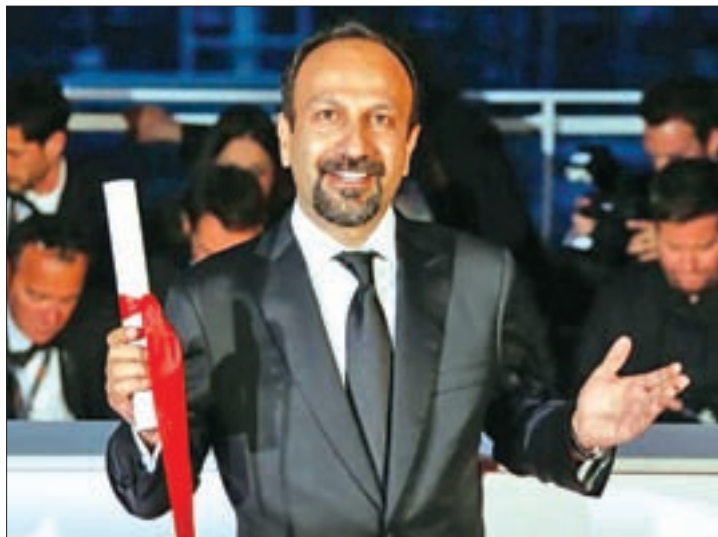
Director Asghar Farhadi, Best screenplay award winner for the film ‘Forushande’ (The Salesman), poses during a photocall after the closing ceremony of the 69th Cannes Film Festival in Cannes, France, on 22 May 2016.

Speaking to the rally in a video from Tehran, Farhadi denounced politicians whom he