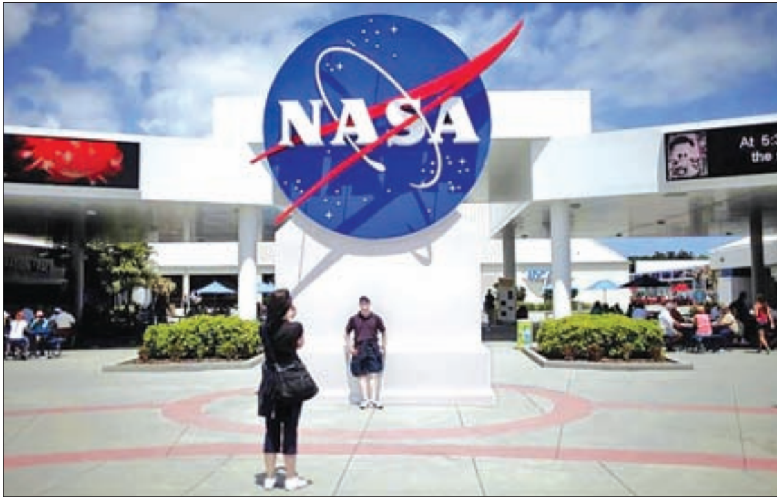
Tourists take pictures of a NASA sign at the Kennedy Space Center visitors complex in Cape Canaveral, Florida on 14 April, 2010.

NASA officials said they do not feel compelled to fly the test mission with crew aboard, Bill