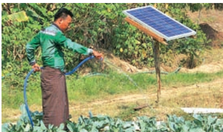
A farmer in Myanmar waters his crop with the help of a solar-powered irrigation pump.

The pump's solar panel directly converts solar energy into electrical power, which is transferred to a simple motor that rotates a fly-wheel, whose turning moves a pis-