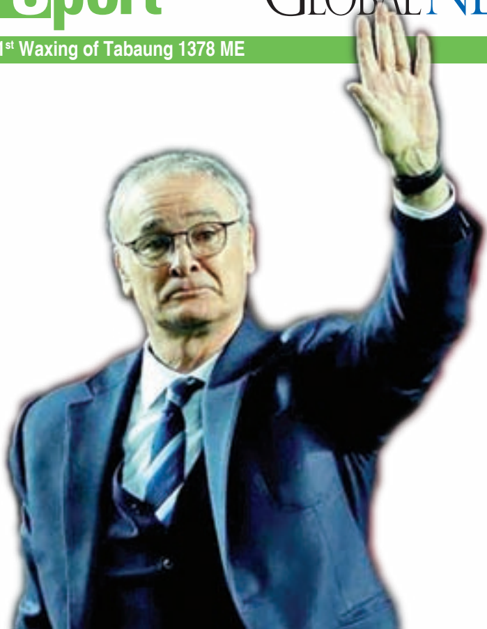
Leicester City manager Claudio Ranieri.