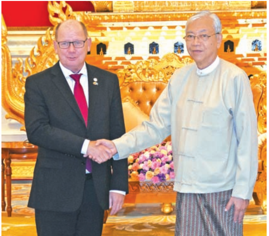
President U Htin Kyaw welcomes Sweden's Parliament Speaker Mr. Urban Ahlin.

PRESIDENT U Htin Kyaw received Speaker of the Swedish Parliament H.E. Mr. Urban Ahlin and his delegation at 4 pm yesterday at the Credentials Hall in Nay Pyi Taw.