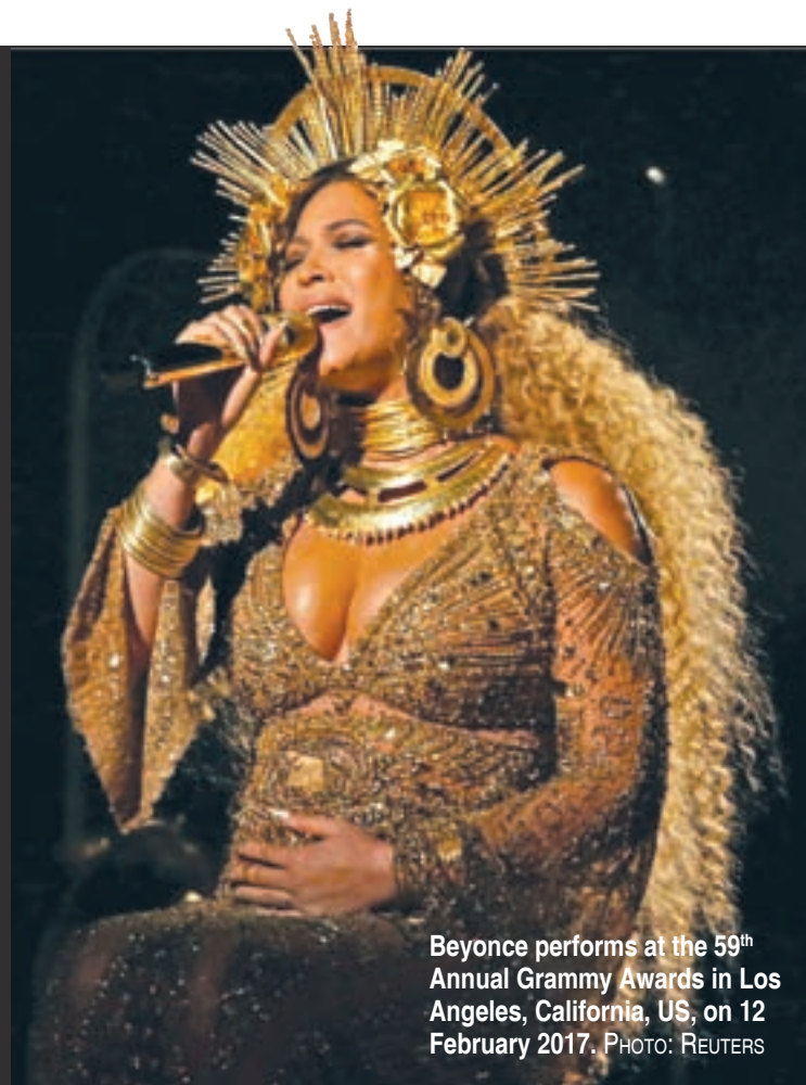
Beyonce performs at the 59 th Annual Grammy Awards in Los Angeles, California, US, on 12 February 2017.

Beyonce and her rapper husband Jay Z, who have a five year-old daughter Blue Ivy, have not said when the twins are due.—Reuters