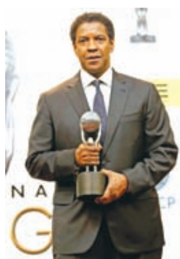
Denzel Washington poses with the award for Outstanding Actor in a Motion Picture for his role in “Fences” backstage at the 48 th NAACP Image Awards in Pasadena, California, US, on 11 February 2017.