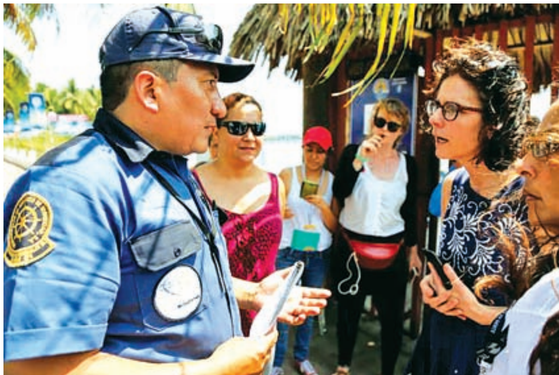
A guard faces members of Women on Waves, a Dutch non-profit that provides abortion services beyond the territorial waters of countries where abortion is illegal, in Puerto de San Jose, Guatemala on 23 February 2017.

PORT OF SAN JOSE, (Guatemala) — Guatemala's army detained a boat carrying a supply of abortion pills on Thursday and prevented it from picking up women seeking to end their pregnancies, saying the move was prohibited by the country's constitution.