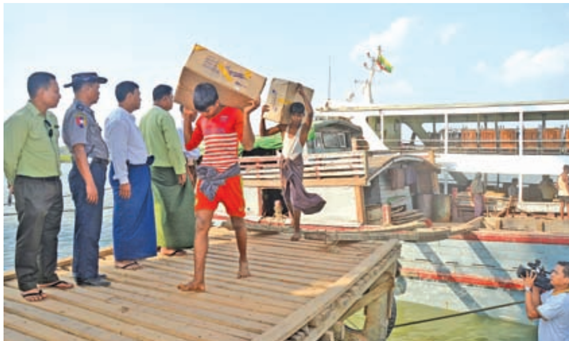
Officials on deck as aid from Malaysia are unloaded from the Aung Kyaw Moe (1).