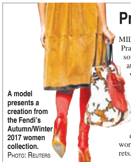
A model presents a creation from the Fendi’s Autumn/Winter 2017 women collection.

The Academy Awards ceremony, hosted by comedian Jimmy Kimmel, takes place in Hollywood and will be shown live on ABC television starting at 5 pm EST/8 pm PST (2200 GMT).—Reuters