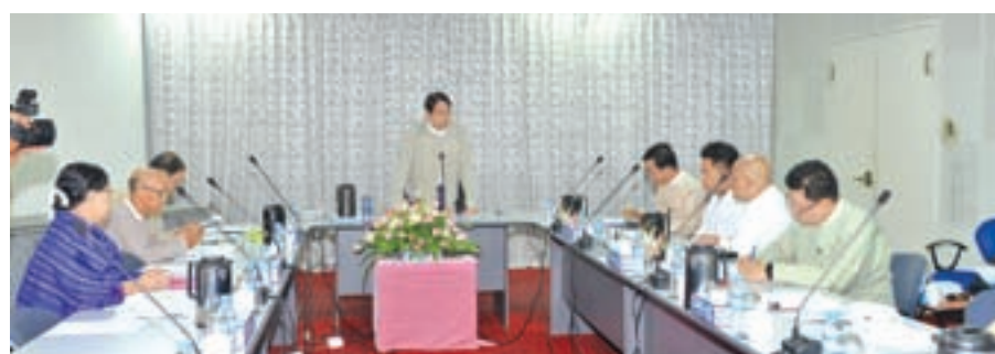
Union Minister for Information Dr. Pe Myint addresses the meeting for the weeklong Myanmar Democracy Film Festival yesterday in Yangon.

cials from the Ministry of Information and the Myanmar Motion Picture Organisation who were in attendance discussed choosing the plots, narratives, director, actors and actresses