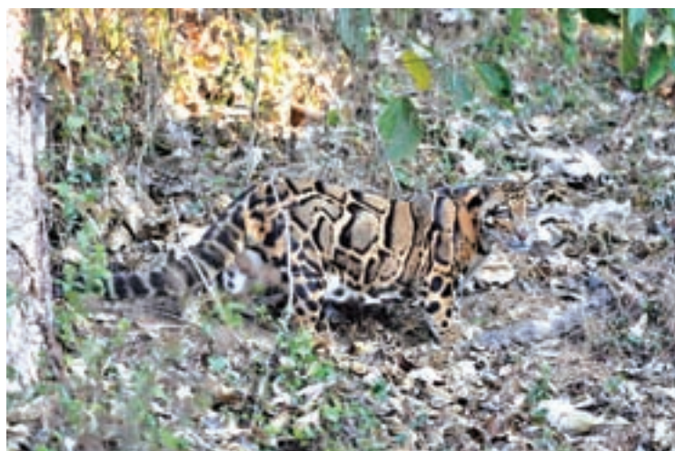
Clouded Leopard ( Neofelis nebulosa macrosceloides ). PHOTO TAKEN AT ZOO IN AIZAWL, MIZORAM, INDIA.

Small cats and other herbivore species are the part of trophic niche