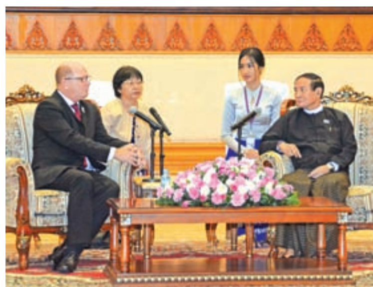
Pyithu Hluttaw Speaker holds talks with Swedish Parliament Speaker.

Pyithu Hluttaw Speaker U Win Myint spoke words of greeting and Speaker of Swedish Parliament gave words of thanks.