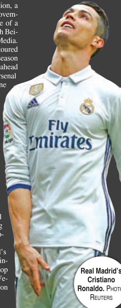
Real Madrid's Cristiano Ronaldo.

China has the world's largest population of internet users, with its top social messaging app WeChat boasting 800 million users.—Reuters