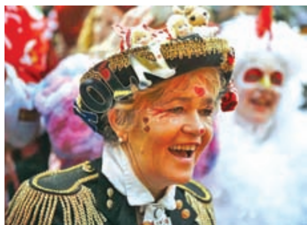
Carnival revellers celebrate during 'Weiberfastnacht' (Women's Carnival) in Cologne, Germany, on 23 February 2017, marking the start of a week of street festivals with the highlight 'Rosenmontag', Rose Monday processions.

COLOGNE (Germany) — Revelers in clown costumes and wigs kicked off six days of merriment on Thursday with Weiberfastnacht or "women's carnival", traditionally the day when women take over town halls and symbolically "castrate" men by cutting off their ties.