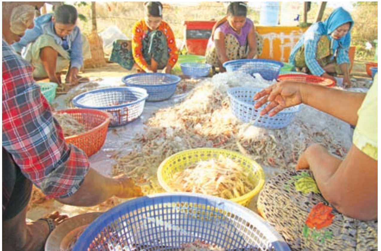
A file photo shows workers select shrimps in Kyauktan, outside Yangon.

If the project meets with success, local breed-