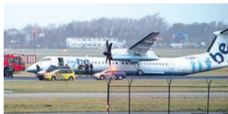
A plane of FlyBe airlines is seen of the runway of Schiphol airport after landing gear broke in high winds, in Amsterdam, Netherlands, on 23 February 2017.

"We are working with the operator (FlyBe) to understand what happened," Tucker said. "Our engineering teams are ready to assist."—Reuters