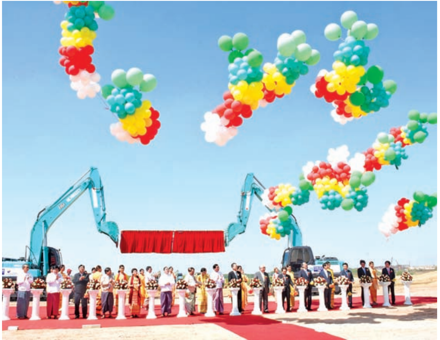
Vice President U Henry Van Thio and dignitaries cut a ceremonial ribbon to launch the expansion project of the Thilawa SEZ.