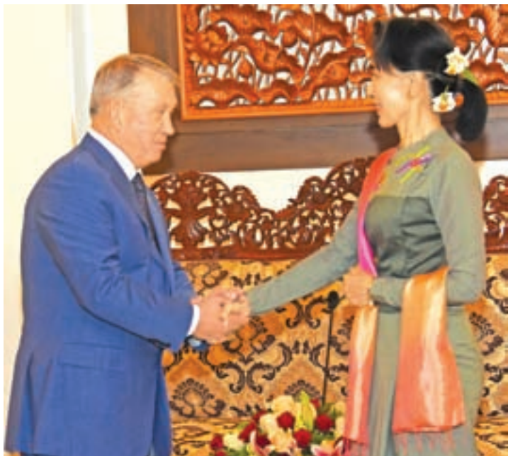
State Counsellor Daw Aung San Suu Kyi welcomes Mr. Mikhail A. Dmitriev at the Ministry of Foreign Affairs in Nay Pyi Taw.

Union Minister for Foreign Affairs of the Republic of the Union of Myanmar Daw Aung San Suu Kyi also received H.E. Mr. Urban Ahlin, Speaker of the Swedish Parliament (the Riksdag) at the Ministry of Foreign Affairs in Nay Pyi Taw yesterday and exchanged views on the peace process, the transition process in Myanmar and the promotion of bilateral relations and cooperation between Myanmar and Sweden.— Myanmar News Agency