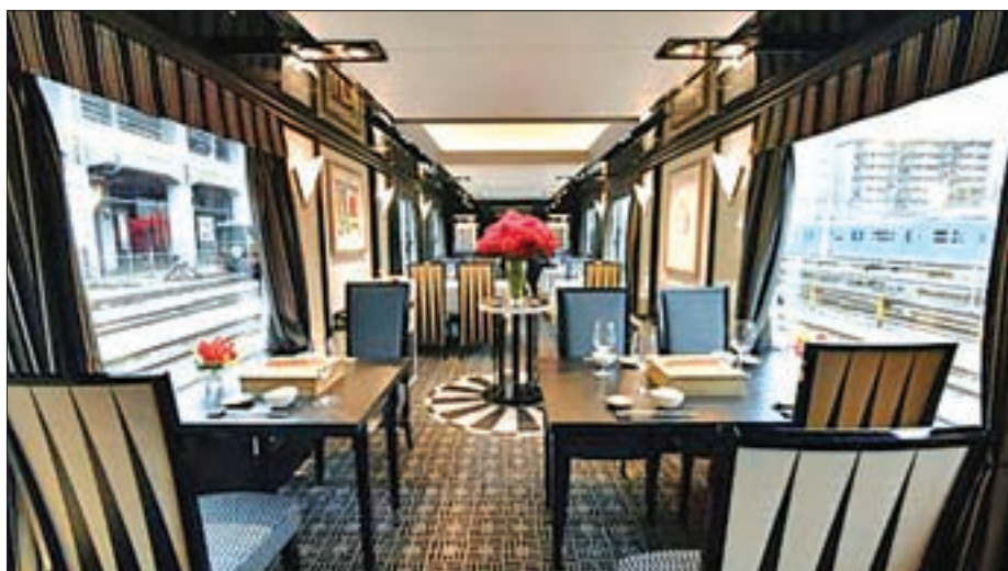
Photo shows the inside of "Twilight Express Mizukaze," a 10-coach luxury express train of West Japan Railway Co., when it is unveiled to the media in Osaka on 23 February 2017.

room for two people will be 270,000 yen ($2,400). The price for a suite starts from 750,000 yen.