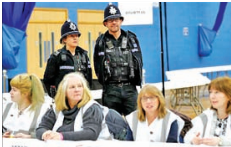
Police officers patrol during the Stoke Central by-election count in Stoke on Trent, on 23 February 2017.