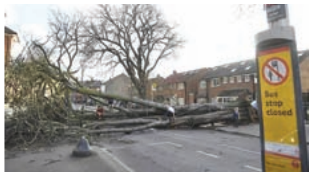
A fallen tree brought down by high winds from Storm Doris lies across a main road in Isleworth in London, Britain, on 23 February 2017.

LONDON — A woman was killed by flying debris on Thursday as storm Doris battered Britain and Ireland, disrupting travel and leaving thousands without power as it swept in from the Atlantic.