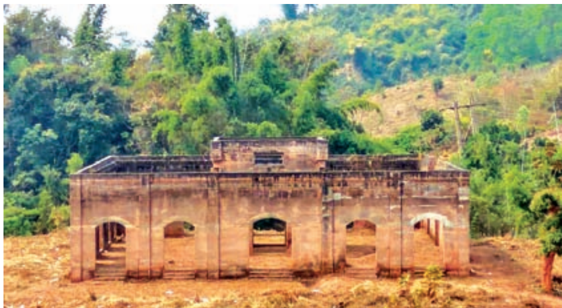
The palace of Hsenwi Sawbwa seen at Hsenwi town, northern Shan State.

Responsible officials from the Department of Health Human Resources and other medicine-related universities gave talks at the workshop.