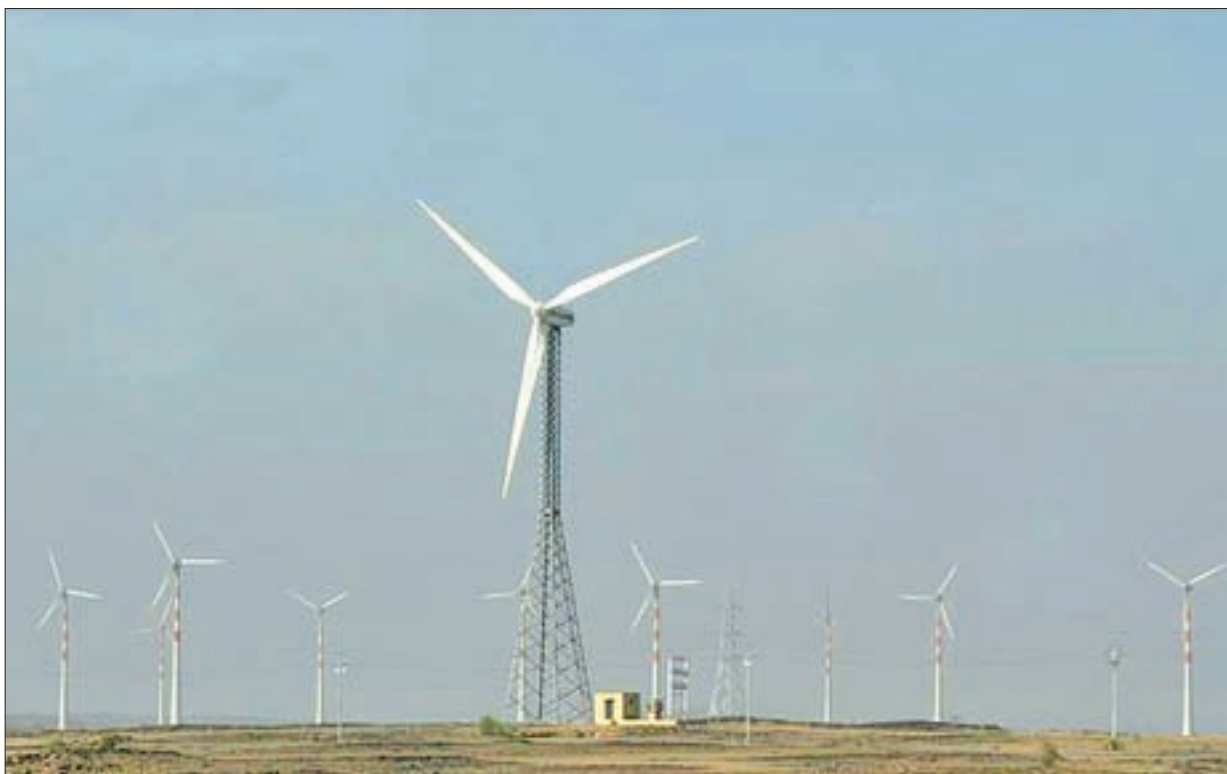
Wind turbines turn in the breeze in the outskirts of Jaisalmer in the Indian desert state of Rajasthan, on 30 November 2009.

In an auction conducted by state-controlled Solar Energy Corporation of India (SECI) for various wind projects totalling 1 gigawatt, five companies separately quoted a tariff of 3.46 rupees ($0.0519)