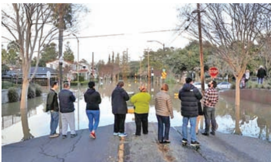
People stand by a flooded street near William Street Park after heavy rains overflowed nearby Coyote Creek in San Jose, California, US, on 21 February 2017.

More than 1,000 properties, home to 3,800 people, were still under evacuation orders on Thursday, Vossbrink said. It was unclear when they would be allowed home. City inspectors would need to assess for