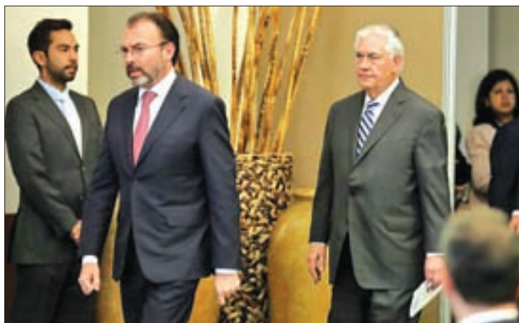
US Secretary of State Rex Tillerson (R) and Mexico's Foreign Secretary Luis Videgaray arrive to deliver a statement at the Ministry of Foreign Affairs in Mexico City, Mexico, on 23 February 2017.

Tillerson and Kelly emphasized traditionally strong