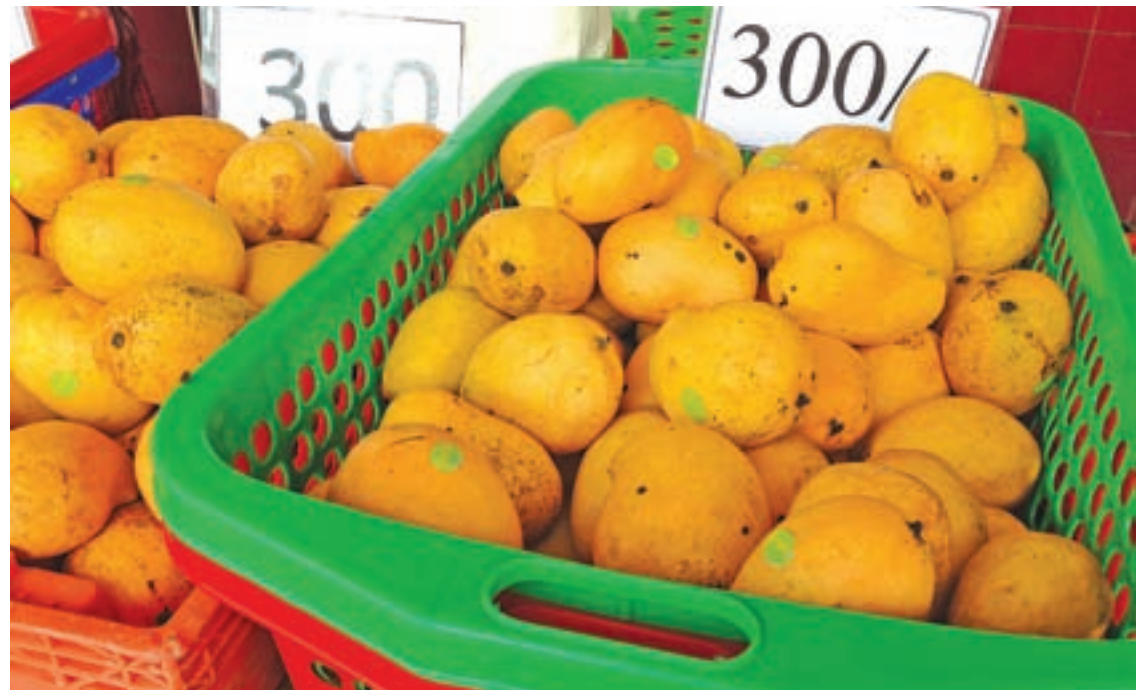
A file photo of Sein Ta Lone mangos.

MYANMAR's mango is being planned to penetrate the Russian market, said a local association for technology and market promotion of Myanmar's mango.