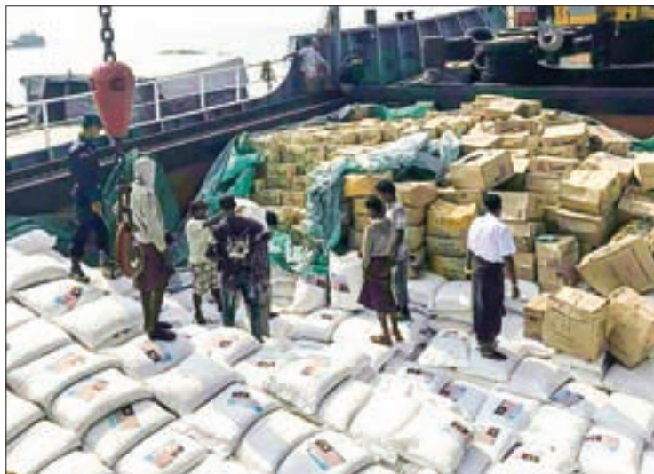
Workers unloading aids from Malaysia from a ship in Sittway.

ment, officials from the Ministry of Border Affairs and district management committee and representatives from International Organizations in Maungtaw will provide humanitarian aid to 190 villages by 25 February. Rakhine State Social Affairs Minister and responsible officials will also provide aid to Internally Displaced Persons (IDP) camps in Sittway. — Myanmar News Agency