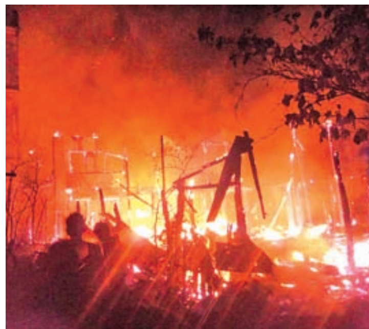
Two houses destroyed by fire in Kyaukpyu Township.

Action has been taken against the owner of the house, according to the Penal Code.