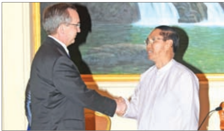
Vice President U Myint Swe welcomes Ambassador of the United States to Myanmar Mr. Scot Marciel.

CHAIRMAN of the investigation commission on Maungtau, Rakhine State Vice President U Myint Swe, received Ambassador of the United States to Myanmar Mr. Scot Marciel at 10 am yesterday at the Credential Hall in Nay Pyi Taw.