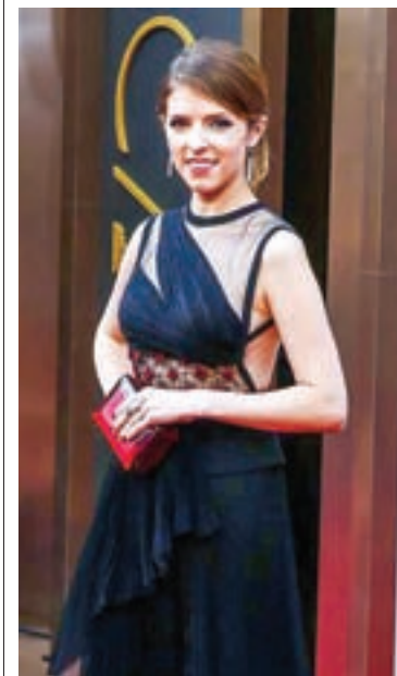
Anna Kendrick.

Kendrick is currently filming the third installment of the musical.