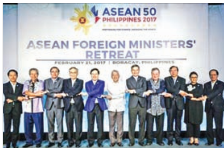
ASEAN Foreign Ministers pose for photo in ASEAN way before the ASEAN Foreign Ministers' Retreat in Boracay.

The attendees were briefed on the six thematic priorities of her Chairmanship of ASEAN in 2017, namely: a people-oriented and people-centred ASEAN; peace and stability in the region; maritime security and cooperation; inclusive