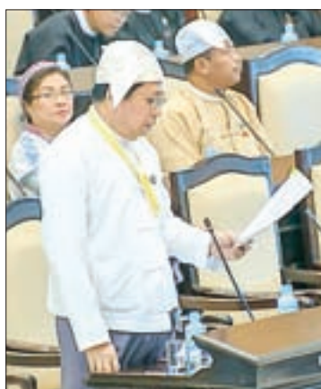
Union Minister for Information Dr Pe Myint.

U Win Maung of Magway constituency (6) asked: "Is there consideration for approving the appointment of a fire services department and fire engines in Faunglim Village in Salin Township, Magway?" to which Deputy Minister for Home Affairs Major-General Aung Soe replied of the 69 fire services department bases in the Magway Region, fire services department buildings have been constructed in 18 bases with 51 bases left for construction, and fire en-