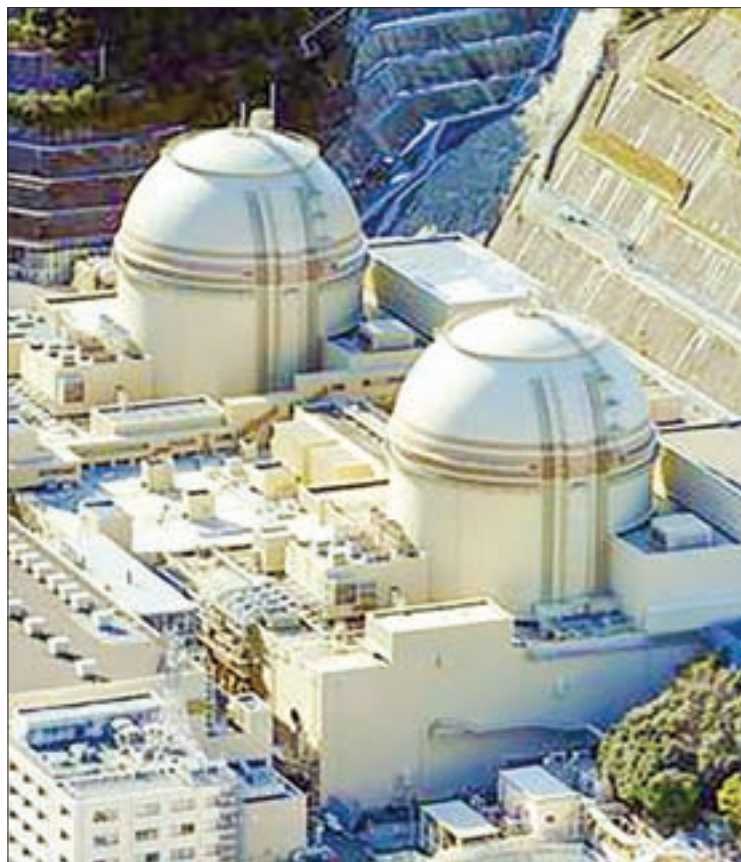
File photo taken in January 2017 shows the No 3 (front) and 4 reactors of Kansai Electric Power Co's Oi nuclear plant on the Sea of Japan coast.

In Fukui, two reactors at Kansai Electric's Takahama plant were brought back online last year after clearing the safety requirements, but faced a court injunction in connection with safety issues and there are no clear prospects for their restart.— Kyodo News