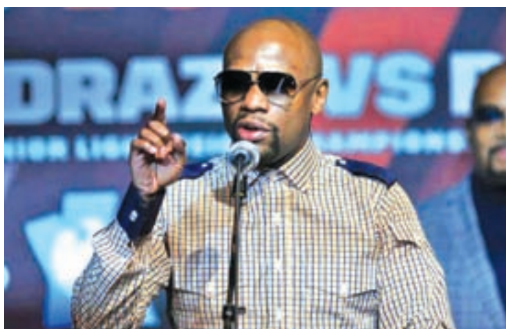
Floyd Mayweather.

"According to Mayweather, yes. He told me he would fight him. Everything is pointing in that direction right now," said Roach, who added that he would consider training McGregor if asked. "I think Mayweather is the favorite, yes, but I wouldn't count anyone out. Because (McGregor) throws, he throws hard and he's not afraid to throw." —Reuters