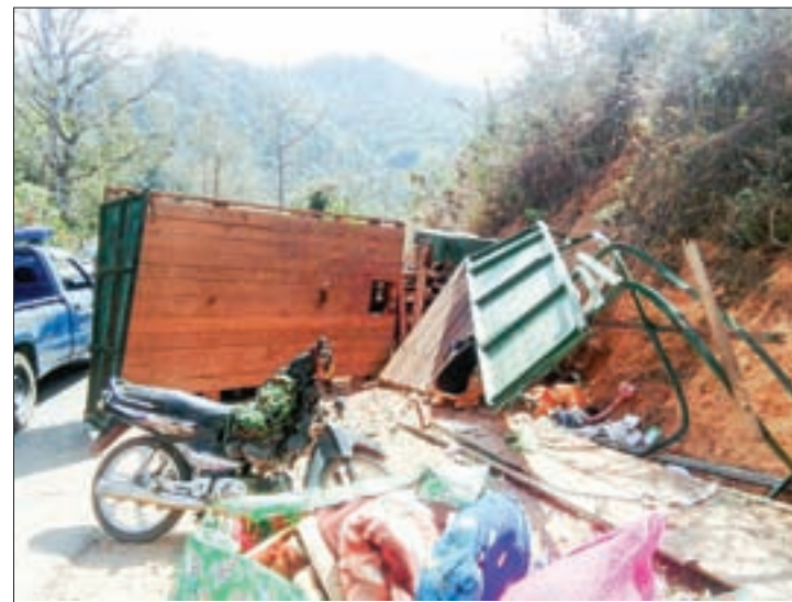
The vehicle overturns due to brake failure in Mongkai Township.

Police filed charges against U Sai Thein under section 304 (A)/338/337/279 of the Penal Code.