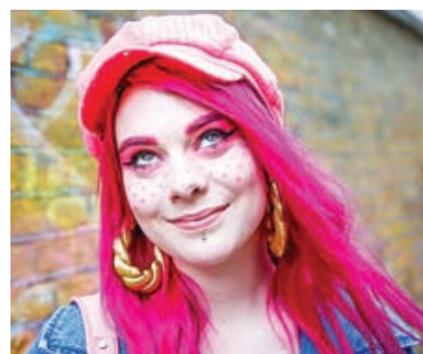
Musician 'Girli' poses for a portrait during London Fashion Week in London, Britain, on 21 February 2017.

"London has an amazing sense of ideas and freshness," British accessories designer Anya Hindmarch said. "People are prepared to be different but also you