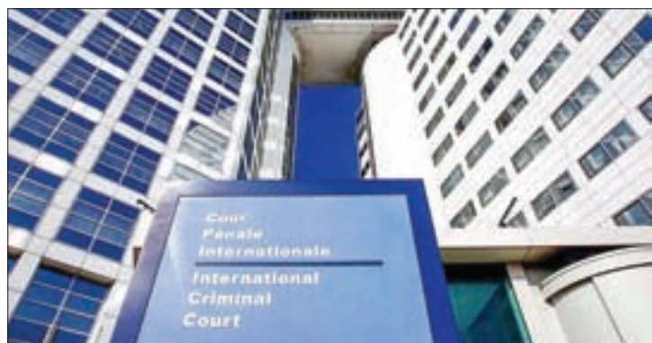
The entrance of the International Criminal Court (ICC) is seen in The Hague, Netherlands, on 3 March, 2011.

South Africa said it was quitting the ICC because membership conflicted with diplomatic immunity laws.—Reuters