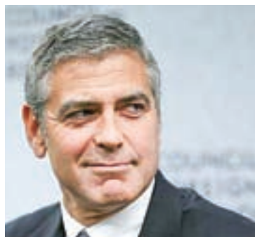
Hollywood star George Clooney.