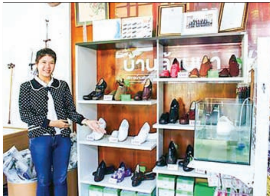
Photo taken on 20 October, 2016, in Chiang Mai, Thailand, shows a health-care goods shop run by Friend Co, a Japanese firm operating group homes for the elderly, to cater to elderly people from Japan spending their post-retirement life in the Thai city.

Friend is now making preparations to open a welfare facility for Japanese retirees in Chiang Mai in 2017. The home is intended to serve the needs of Japanese with dementia and those who cannot return