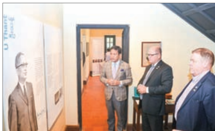
Dr Thant Myint U explains U Thant's biographies displayed to the Speaker of the Parliament and delegation from Sweden.

The delegation was welcomed at Yangon International Airport by Yangon Region Hluttaw Deputy Speaker U Lin Naing Myint, Region Hluttaw repre-