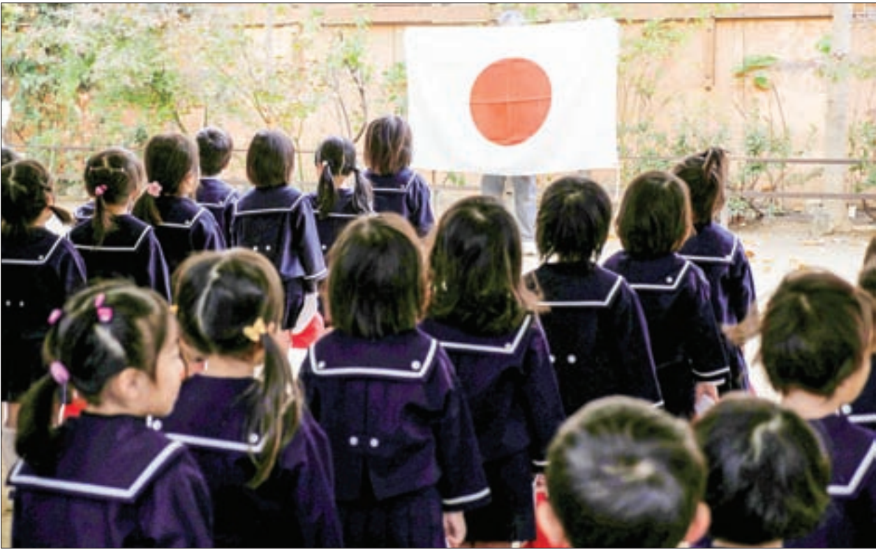
Students line up in front of Japan's national flag at the morning assembly at Tsukamoto kindergarten in Osaka, Japan on 30 November, 2016.

TOKYO — Japan's largest opposition Democratic Party has demanded that the head of a school operator with ties to Prime Minister Shinzo Abe's wife, Akie, appear before parliament to explain its purchase of government-owned land, it said on Wednesday. The operator, Moritomo Gakuen, last year bought an 8,770-square-metre plot of government-owned land for 134 million yen ($1.2 million), or 14 per cent of its appraisal price, to build a new elementary school, Kyodo news agency has reported. Akie Abe is set to be honorary principal of the new school in Japan's western region of Toyonaka, Moritomo Gakuen says on its website. Prime Minister Abe told parliament on Friday neither he nor his wife had been involved in the transaction. Although the appraisal price of the land was 956 million yen, an estimated