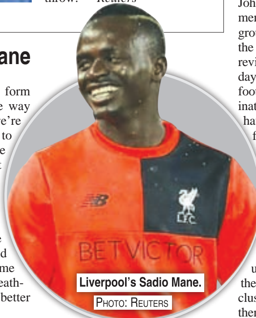
Liverpool's Sadio Mane.

"We had a good time (in Spain) but we also worked very hard, we trained together well and we also had a friendly game amongst ourselves. The weather wasn't brilliant but a bit better than here." —Reuters