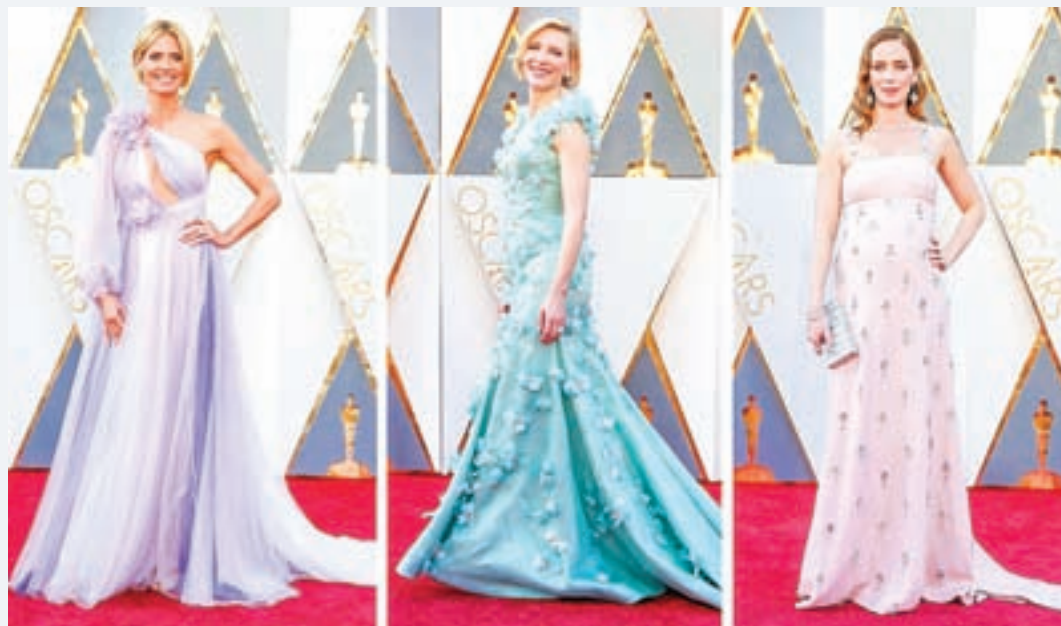
Heidi Klum, Cate Blanchett and Emily Blunt pose on the red carpet before the 2016 Academy Awards.

LOS ANGELES — It's not just women who are getting ready for the Oscars' red carpet on Sunday.