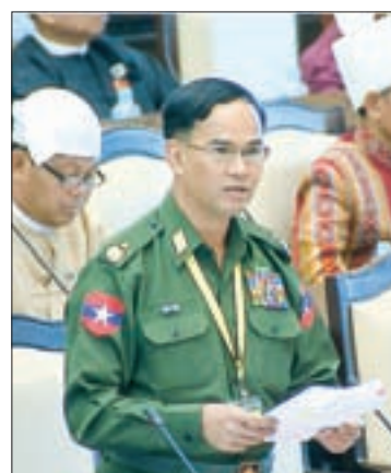
Deputy Minister for Home Affairs Major-General Aung Soe.

The Magway Fire Services Department is working in line with the allotted national budget to build residential buildings for staffs and appoint vehicles and machineries in areas approved by the constitution. The Faunglim village, Sa-