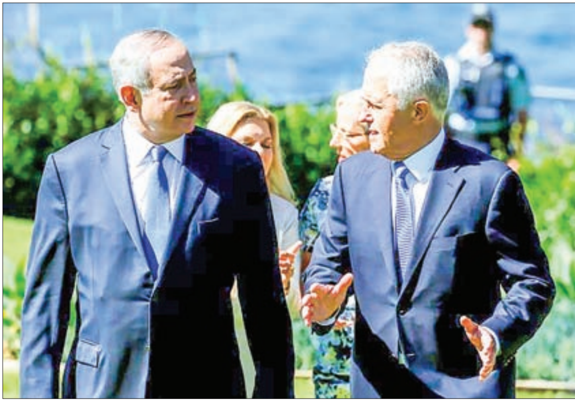
Israeli Prime Minister Benjamin Netanyahu (L) walks with Australian Prime Minister Malcolm Turnbull upon their arrival at Admiralty House in Sydney, Australia, on 22 February, 2017.

The UN resolution was approved in the final weeks of Barack Obama’s administration, which broke with a long tradition of shielding Israel diplomatically