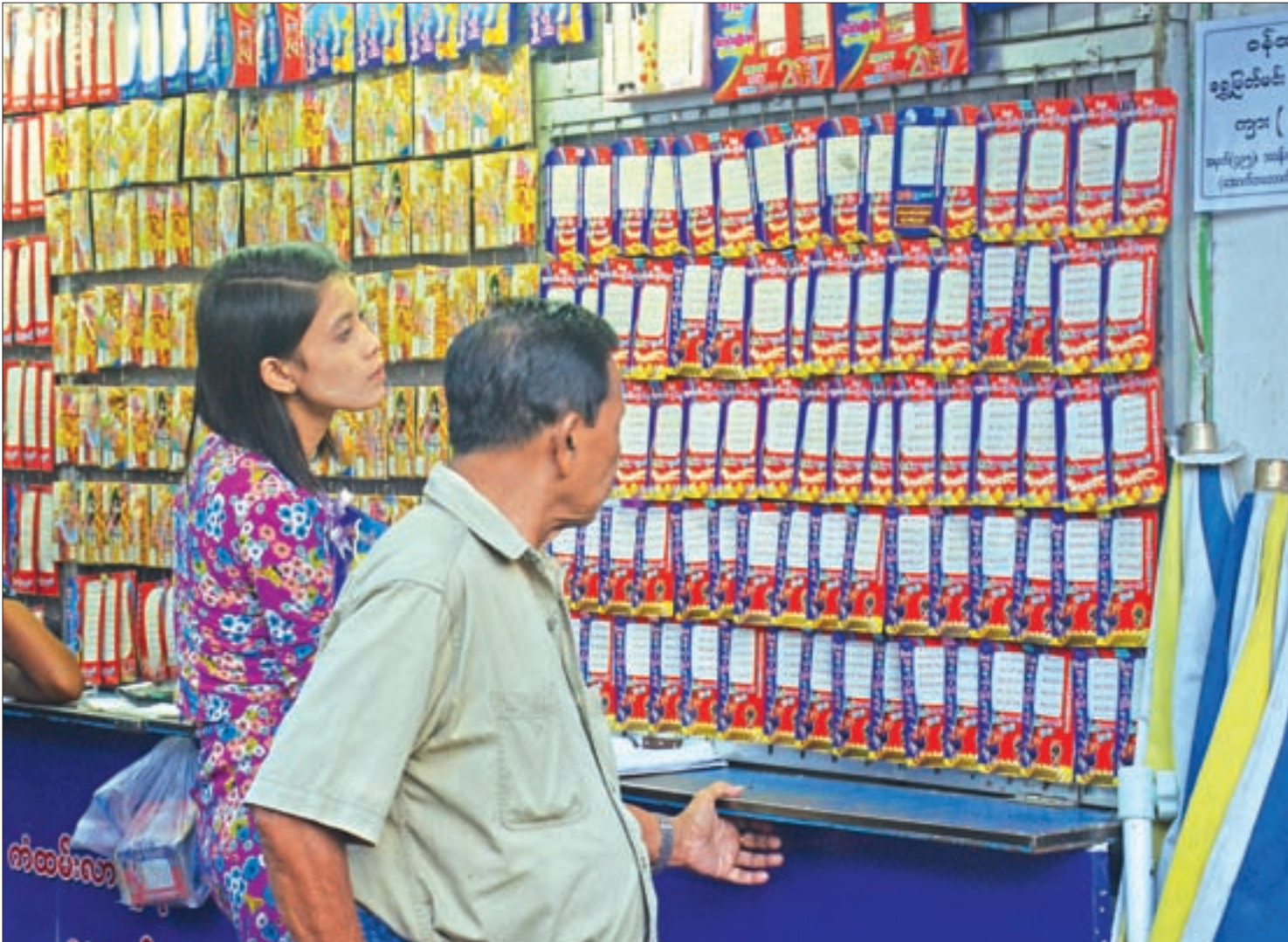
A potential buyer peruses numbers at a sidewalk stand in Yangon selling tickets for the state lottery yesterday.