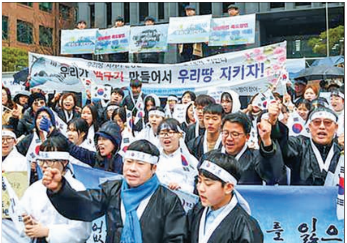
Members of South Korean civic groups stage a rally in front of the Japanese Embassy in Seoul on 22 February, 2017, protesting against Japan's designation of the day to promote its territorial claim to Dokdo, South Korean-controlled islets in the Sea of Japan that are known as Takeshima in Japan.