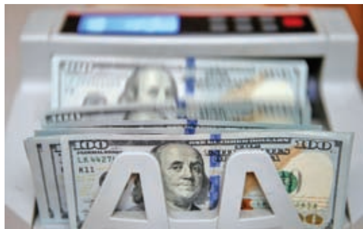
US dollar.

The US dollar exchange rate in the domestic market hit a recorded high of Ks1,438 on 16th Dec 2016, whereas the rate plunged to its lowest level of Ks1,346 on 16th Jan, it is learnt.— Ko Htet