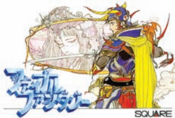
Supplied photo shows the package design of the first title under the “Final Fantasy” video game series launched in 1987. Square Enix Co. said 20 February, 2017, the series has been recognized by Guinness World Records as the role-playing game series with the largest number of titles, totaling 87 as of 15 February.

TOKYO — Square Enix Co said Monday its video game series “Final Fantasy” has been recognized by Guinness World Records as being the role-playing game series with the largest number of titles. It won the title of “most prolific role-playing series” for having 87 titles in total as of last Wednesday, including works that were derived from the series and smart-phone games. “Final Fantasy” was launched in 1987 with its first game sold to be played on Nintendo Co’s consoles for home use that were branded famicom in Japan. Since then, the main characters in the series have grown up, undergoing various experiences such as battling enemies, and the series’ storylines and songs have become popular worldwide. Up to now, 15 “Final Fantasy” compilations have been released. The series’ 14th compilation has also been recognized by Guinness World Records for “most original pieces of music in a video game (including expansions).” The certificates were awarded at a promotional event in Frankfurt, Germany, over the past weekend.—Kyodo News