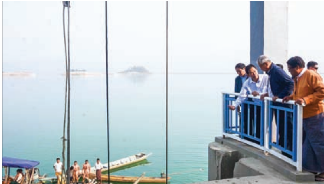
President U Htin Kyaw (second from right) inspects Razagyo dam in Sagaing Region.

At midday they visited the general hospital in Tantalán and consoled the patients and gave