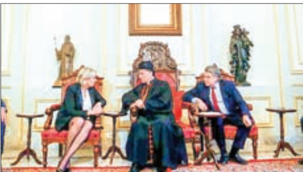
Marine Le Pen, French National Front (FN) political party leader and candidate for the French 2017 presidential elections, meets with Cardinal Bechara Boutros Rai of Lebanon, the Maronite Patriarch of Antioch and the Whole Levant, as French deputy Gilbert Collard listens, in Bkerke, north of Beirut, Lebanon on 21 February, 2017.

with a head of state — and Sunni Prime Minister Saad al-Hariri on Monday, she had been scheduled to meet the Grand Mufti Sheikh Abdul Latif Derian. He heads the Dar al-Fatwa, the top religious authority for Sunni Muslims in the multireligious country. “I met the grand mufti of Al-Azhar,” she told reporters, referring to a visit in 2015 to Cairo’s 1,000-year-old centre of Islamic learning. “The highest Sunni authority didn’t have this requirement, but it doesn’t matter. “You can pass on my respects to the grand mufti, but I will not cover myself up,” she said. The cleric’s press office said Le Pen’s aides had been informed beforehand that a headscarf was required for the meeting and had been “surprised by her refusal”. But it was no surprise in the French political context. French law bans headscarves in the public service and for high school pupils,