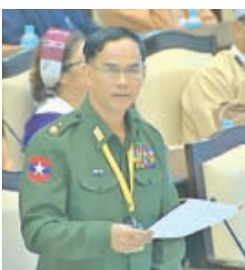
Deputy Minister Major-General Aung Soe.

Deputy Minister Major-General Aung Soe said the purpose of introducing criminal act 144 was due to requirements in the administration department in the seven areas of oil refineries starting in 1977. Even after the legislation of the criminal act, thefts have occurred on the oil pipe lines incurring losses in the national budget and livelihoods of the citizens, therefore until an alternative law is legislated criminal act 144 will continue to be in effect in Minbu District, Minbu township Mann Oil refinery and oil refineries from Taukshar-