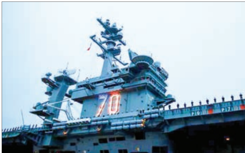
Sailors man the rails as the USS Carl Vinson aircraft carrier departs on deployment from Naval Station North Island in Coronado, California, US on 5 January, 2017.

BEIJING—China said on Tuesday it opposed action by other countries under the pretext of freedom of navigation that undermined its sovereignty, after a US aircraft carrier strike group began patrols in the contested South China Sea.