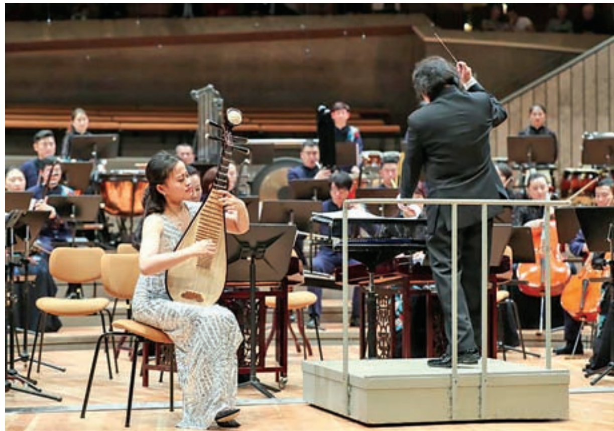
Photo taken on 20 February, 2017 shows the Chinese New Year Concert 2017 at Berlin Philharmonie in Berlin, capital of Germany. The Chinese New Year Concert 2017 performed by Guangdong National Orchestra of China kicked off on Monday. A series of cultural activities will be held to commemorate the 45th anniversary of the establishment of the Chinese-German diplomatic relations.