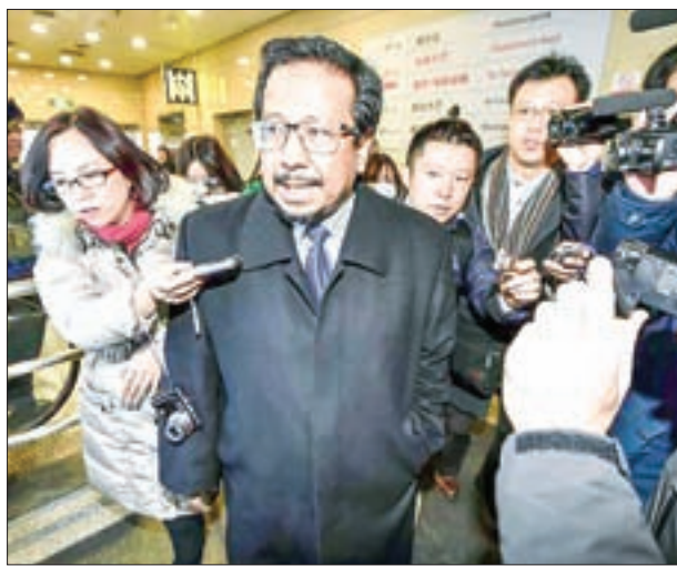
Malaysia's ambassador to North Korea Mohamad Nizan Mohamad (C) is surrounded by media upon his arrival from Pyongyang, after being recalled by Malaysian government, at Beijing airport in Beijing, China, in this photo taken by Kyodo on 21 February, 2017.

day, Malaysian Prime Minister Najib Razak denounced the ambassador's comments and reiterated that the investigation would be fair.