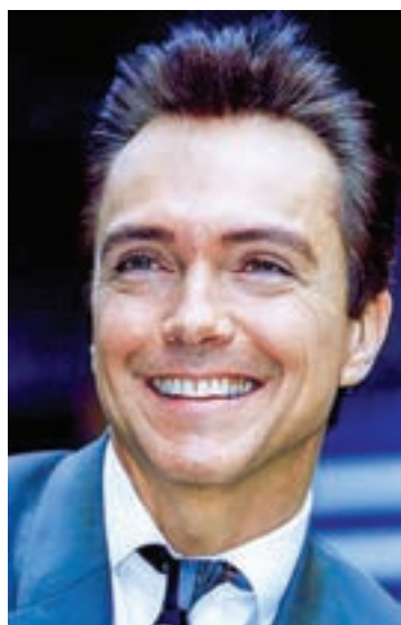
David Cassidy smiles for photographers outside the Phoenix theatre in London, Britain, October 23, 1995.

His comments followed videos taken by fans of the singer struggling to remember words to some of his old hits at small venue concerts in southern California on Saturday and Sunday. At one point, he appeared to fall off the side of a small stage before climbing back up. Cassidy, whose hits "Cherish" and "I Think I Love You" had teenage girls swooning in the 1970s, has struggled with drinking and financial troubles in