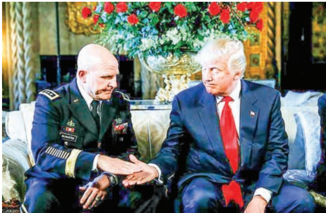
US President Donald Trump shakes hands with his new National Security Adviser Army Lt Gen HR McMaster after making the announcement at his Mar-a-Lago estate in Palm Beach, Florida US on 20 February, 2017.

WEST PALM BEACH, Fla./WASHINGTON — US President Donald Trump on Monday named Lieutenant General Herbert Raymond McMaster as his new national security adviser, choosing a military officer known for speaking his mind and challenging his superiors.