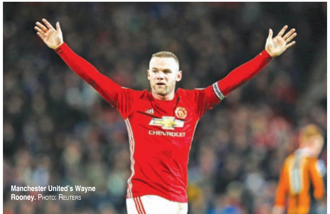
Manchester United’s Wayne Rooney.

Arsenal have been drawn against non-league Lincoln City in the quarter-finals, a team that became the first minor league side to reach the FA Cup quarter-finals in 103 years when they beat the Premier League’s Burnley in the last round.—Reuters