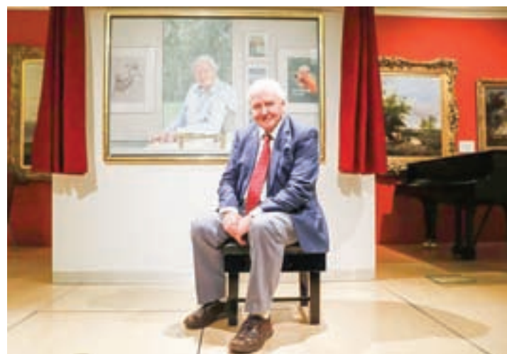
David Attenborough poses next to a portrait of himself by Bryan Organ to mark his 90th birthday at New Walk Museum and Art Gallery in Leicester, Britain, on 22 September, 2016.

The BBC said the new series will feature phenomena such as methane volcanoes in the Gulf of Mexico and the Pacific Ocean's so-called 'boiling sea', as well as footage from 1,000 metres under the Antarctic Ocean.