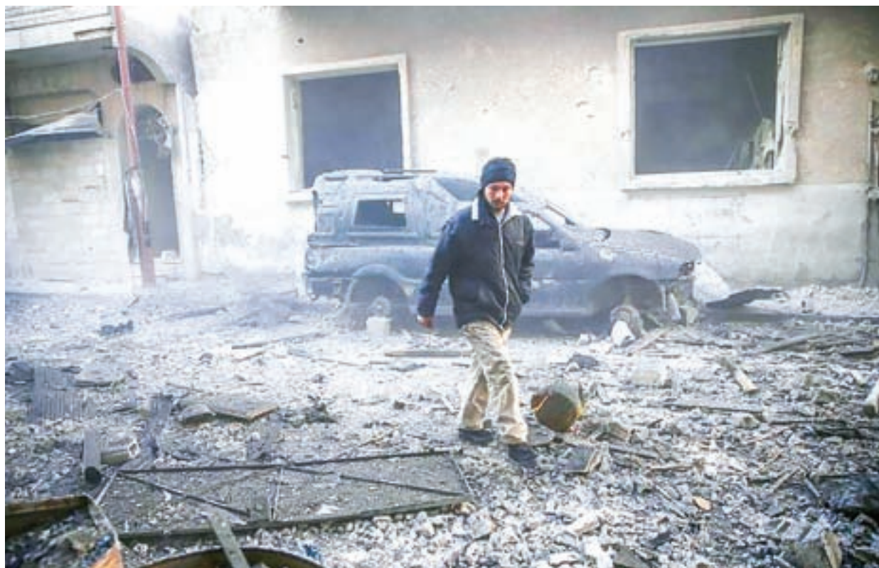
A man inspects the damage at a site hit by airstrikes in the rebel held besieged Douma neighbourhood of Damascus, Syria on 19 February, 2017.