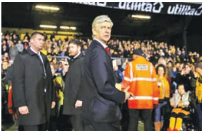
Arsenal manager Arsene Wenger.

LONDON — Arsenal manager Arsene Wenger left Sutton United with a deeper respect for non-league football after watching his Premier League charges being pushed hard by their far less illustrious opponents in the FA Cup fifth round.