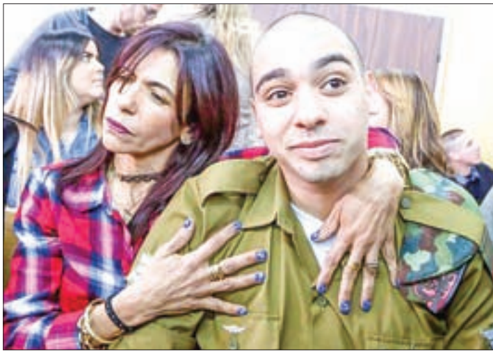
Israeli soldier Elor Azaria is embraced by his mother at the start of his sentencing hearing at a military court in Tel Aviv, Israel on 21 February, 2017.

Passing an 18-month sentence that Israeli media commentators described as lenient, the court said that Azaria had not ex-