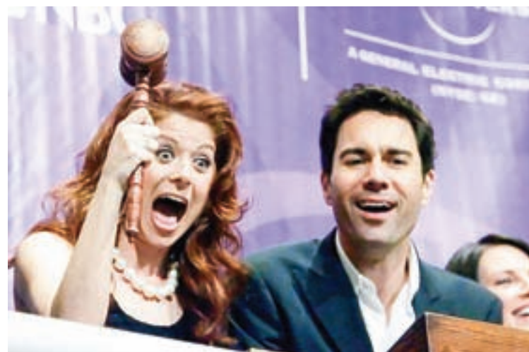
Members of the cast of the NBC television series "Will and Grace" Debra Messing (L) Eric McCormack (C) and Megan Mullally (R) clown around on the bell balcony overlooking the main trading floor of the New York Stock Exchange shortly before ringing the closing bell for the session in New York, on 18 May, 2006.

Cassidy appeared in several stage shows after his career as a solo singer declined. He played an aging former teen heartthrob in the short-lived 2009 TV comedy "Ruby & the Rockits" and was a member of the "Celebrity Apprentice" reality TV show in 2011.—Reuters