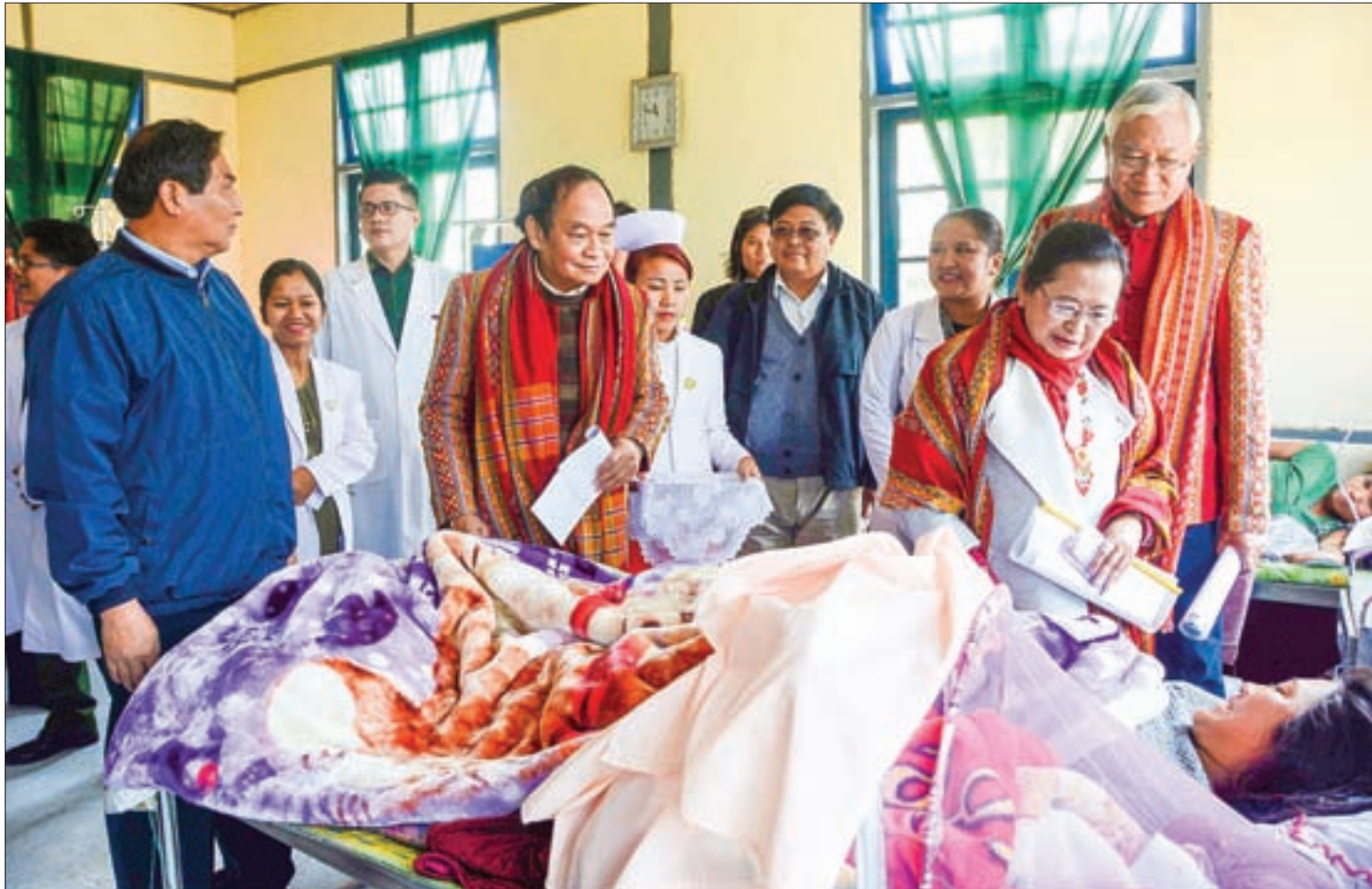
President U Htin Kyaw, right, and First Lady Daw Su Su Lwin comfort a patient receiving treatment at Htantalan Hospital.