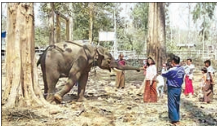
A man takes photo of a young elephant and women.

The Phoe Kyar elephant camp is 173 miles from the Yan-