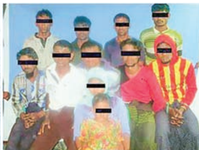
Left: The arrested motorboat. Right: The 11 people suspected of illegally crossing countries.

TATMADAW (Navy) seized an illegal motor-boat in the Naf River as it was heading to Bangladesh Monday evening.