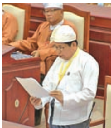
Dr Pe Myint, Union Minister for Information.

Similarly, U Win Maw Tun replied to the questions of U Saw Tun of Mudon constituency and U Htay Min Thein of Gyobingauk constituency. Following that, five Hluttaw representatives discussed the motion urging the Union Government to systematically make educative programmes with separate budgets targeted, raised by Daw Yin Min Hlaing of Gangaw constituency. Concerning the motion, U Sai Oo Kham of Theinni constituency discussed the