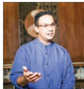
Former education minister and Jakarta governor candidate Anies Baswedan speaks during an interview at his home in Jakarta, Indonesia on 21 February, 2017.

“I think there’s a framing that is not fair here,”