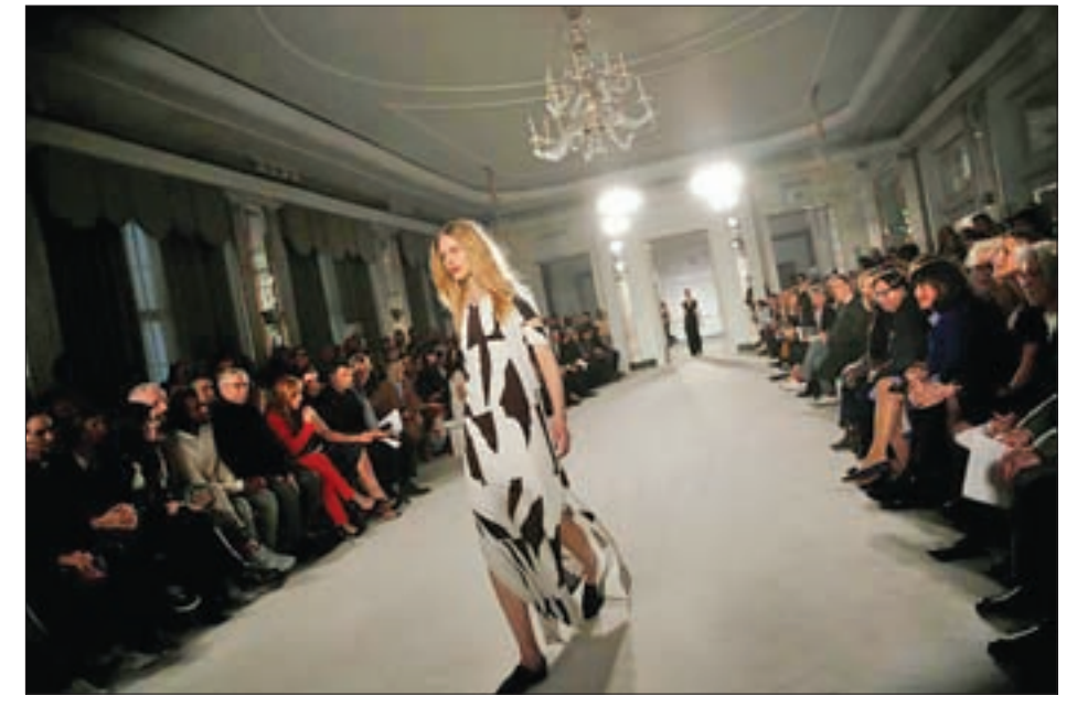
A model presents a creation at the Jasper Conran catwalk show during London Fashion Week in London, Britain, on 18 February 2017. PHOTO: REUTERS

London Fashion Week, during which designers are showcasing their autumn/ winter 2017 womenswear creations,runsuntilTuesday. -Reuters