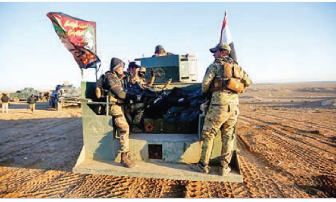
Iraqi security forces advance towards the western side of Mosul, Iraq on 19 February, 2017.

fight for any army in the world," the commander of the US-led coalitions forces, Lt Gen Stephen Townsend, said in a statement.