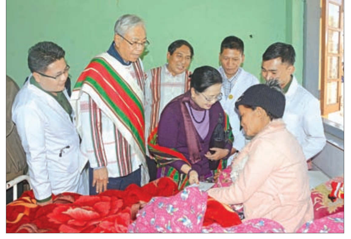
President U Htin Kyaw and wife Daw Su Su Lwin present cash assitance to a patient and comfort her during their visit to a hospital in Chin State yesterday.

naturally formed heart shape and is located near the Indo-Burma border. Ri Lake has clear water almost all year round, except in December when the water is sometimes known to turn red. The lake is about 2.5 miles in circumference and has a depth of