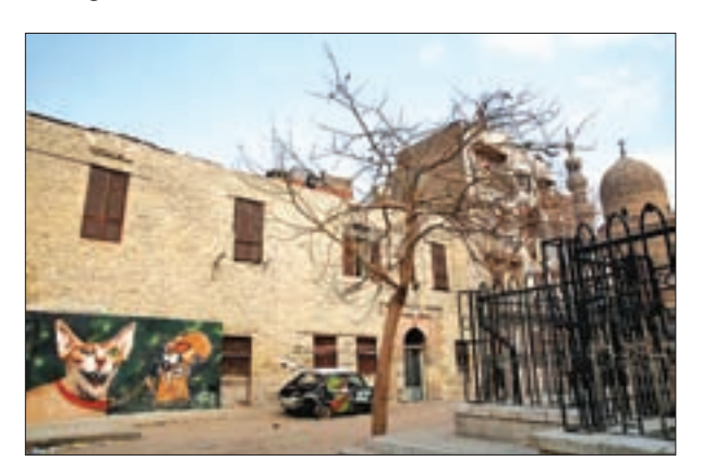
A graffiti, painted on the wall of a house located inside the 15th-century complex built by Mameluk Sultan al-Ashraf Qaitbey, is photographed, in Cairo's City of the Dead, Egypt, on 13 February 2017.

Artists have so far come up with murals, mosaics, sculptures, graffiti and even live performances. Frankie the mouse is the work of a Polish graffiti artist who uses the pseudonym Franek Mysza. -Reuters