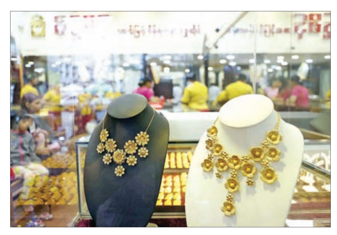
Gold jewellery are on display at a shop in Yangon.