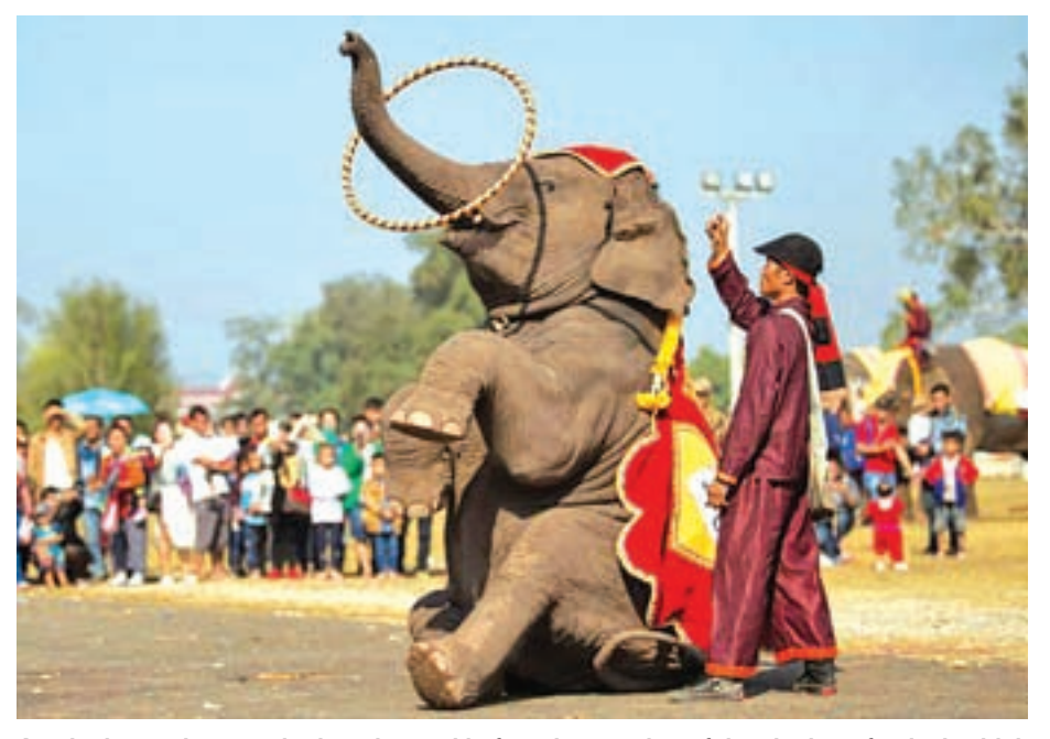
An elephant takes part in the rehearsal before the opening of the elephant festival, which organizers say aims to raise awareness about elephants, in Sayaboury province, Laos, on 17 February 2017.

"The festival is organized to draw the public's attention to the condition of the endangered elephant as well as promoting traditional culture and livelihoods,"