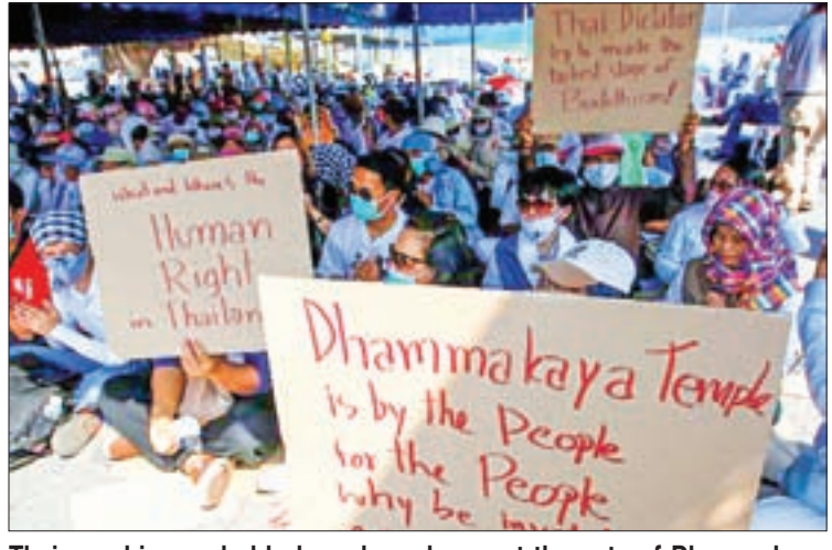
Thai worshippers hold placards and pray at the gate of Dhammakaya temple, after police ordered thousands of worshippers to leave the temple so it can search for its former abbot, in Pathum Thani province, Thailand on 19 February, 2017.

South Korean and US officials have said Kim Jong Nam was assassinated by North Korean agents.—Reuters