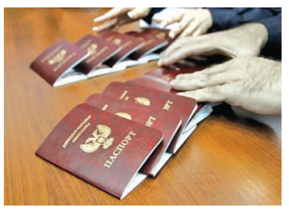
Local police officers arrange passports during a ceremony to issue the first passports of the self-proclaimed Donetsk People's Republic to residents in Donetsk, Ukraine, on 16 March, 2016.

Fighting has recently escalated in the conflict between the Ukrain-