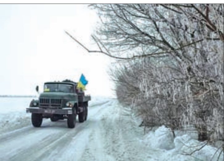
A military vehicle travels near the government-held industrial town of Avdiyivka, Ukraine, on 6 February 2017.

"The meeting showed that Russians and Ukrainians had no other option, but to respect Minsk. They have no alternatives. We agree to meet quickly, perhaps in three weeks, to see if we can advance on the ceasefire, withdrawal of heavy weapons and exchange of prisoners. We need a lot of patience, because we can see a lack of will on either side." — Reuters