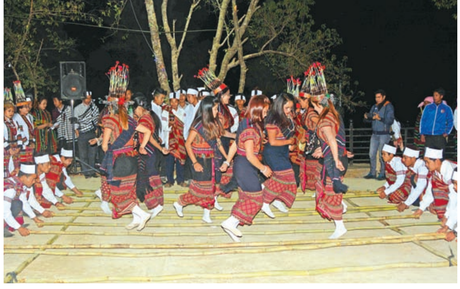
Chin ethnic people dance around a bonfire in Falam yesterday as they welcomed President U Htin Kyaw and First Lady Daw Su Su Lwin one day ahead of Chin National Day.

The President further stated that, to ensure smooth development in underdeveloped areas, the government is considering