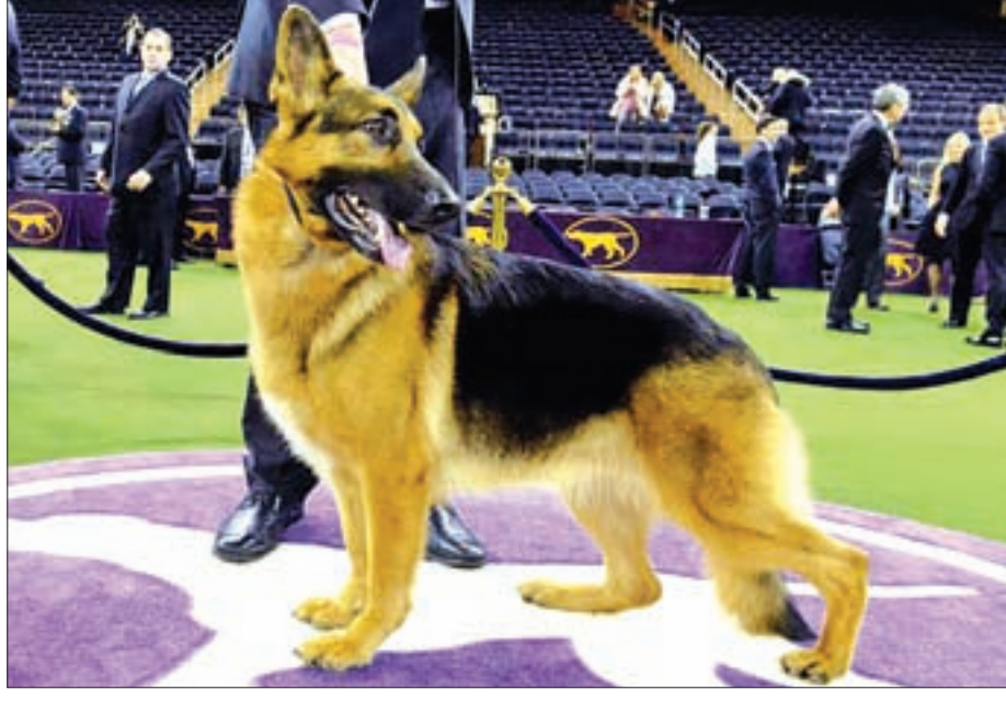
Rumor, a German shepherd and winner of Best In Show at the 141st Westminster Kennel Club Dog Show, poses for photographers at Madison Square Garden in New York City, US, on 14 February, 2017.