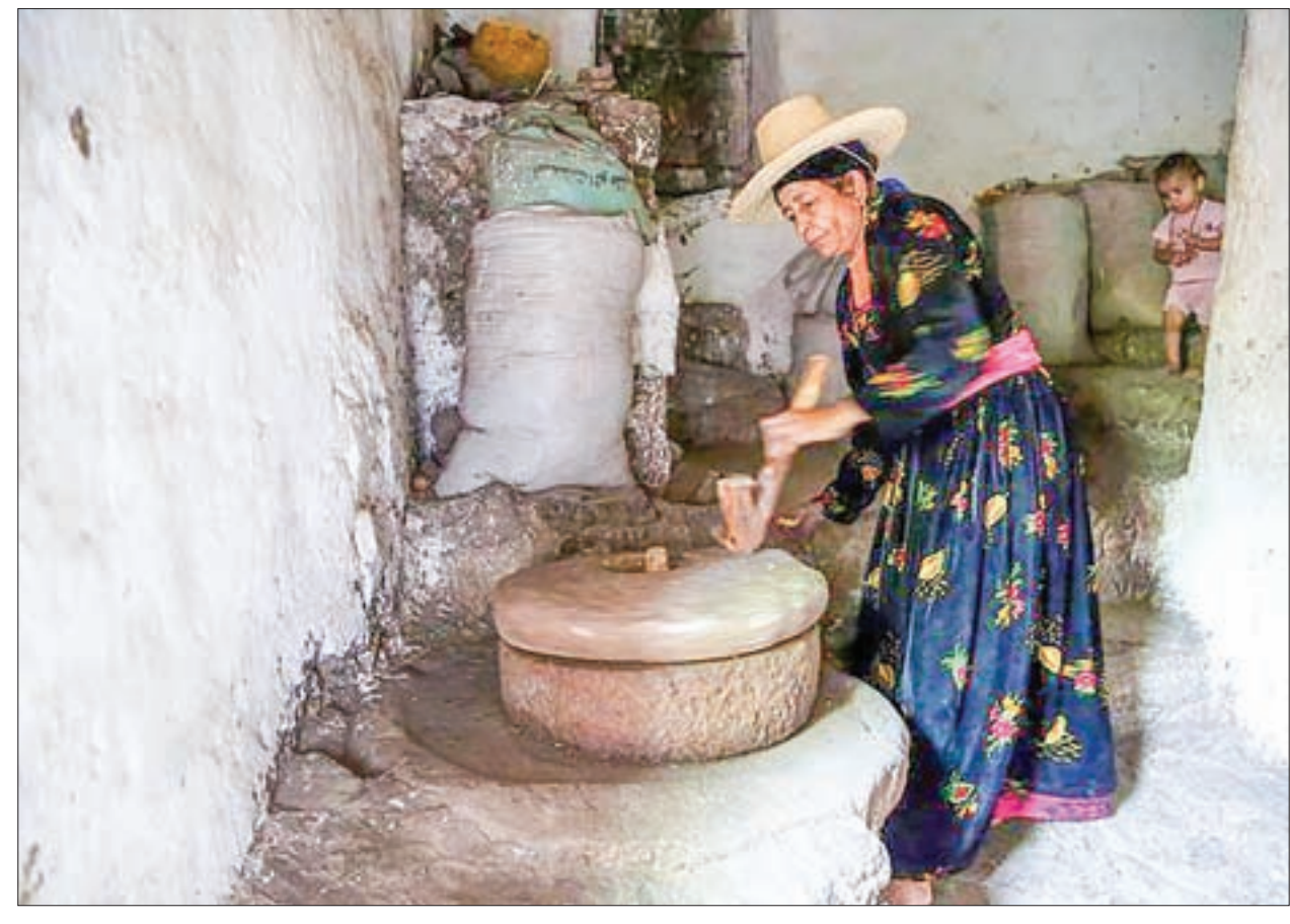
A woman uses a stone grinder to make flour in her house in the mountains, in the Jafariya district of the western province of Raymah, Yemen, on 21 May 2016.

"Then you have places like DRC (Democratic Republic of Congo), CAR (Central African Republic), Burundi, Mali, Niger,