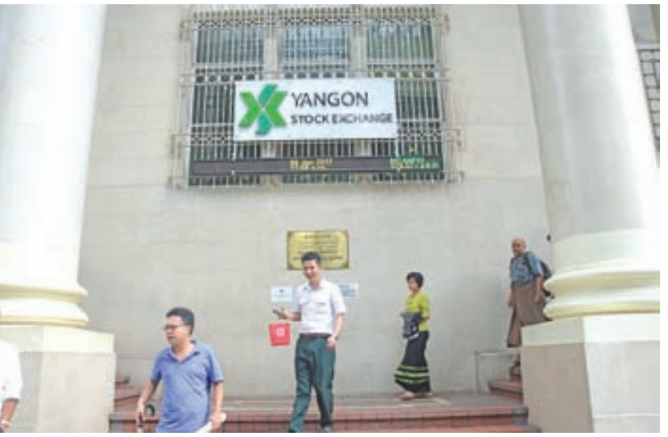
People seen outside the Yangon Stock Exchange on 6 January 2017.

There are four companies trading shares on YSX; FMI, Myanmar Thilawa SEZ Holdings (MTSH), Myanmar Citizens Bank