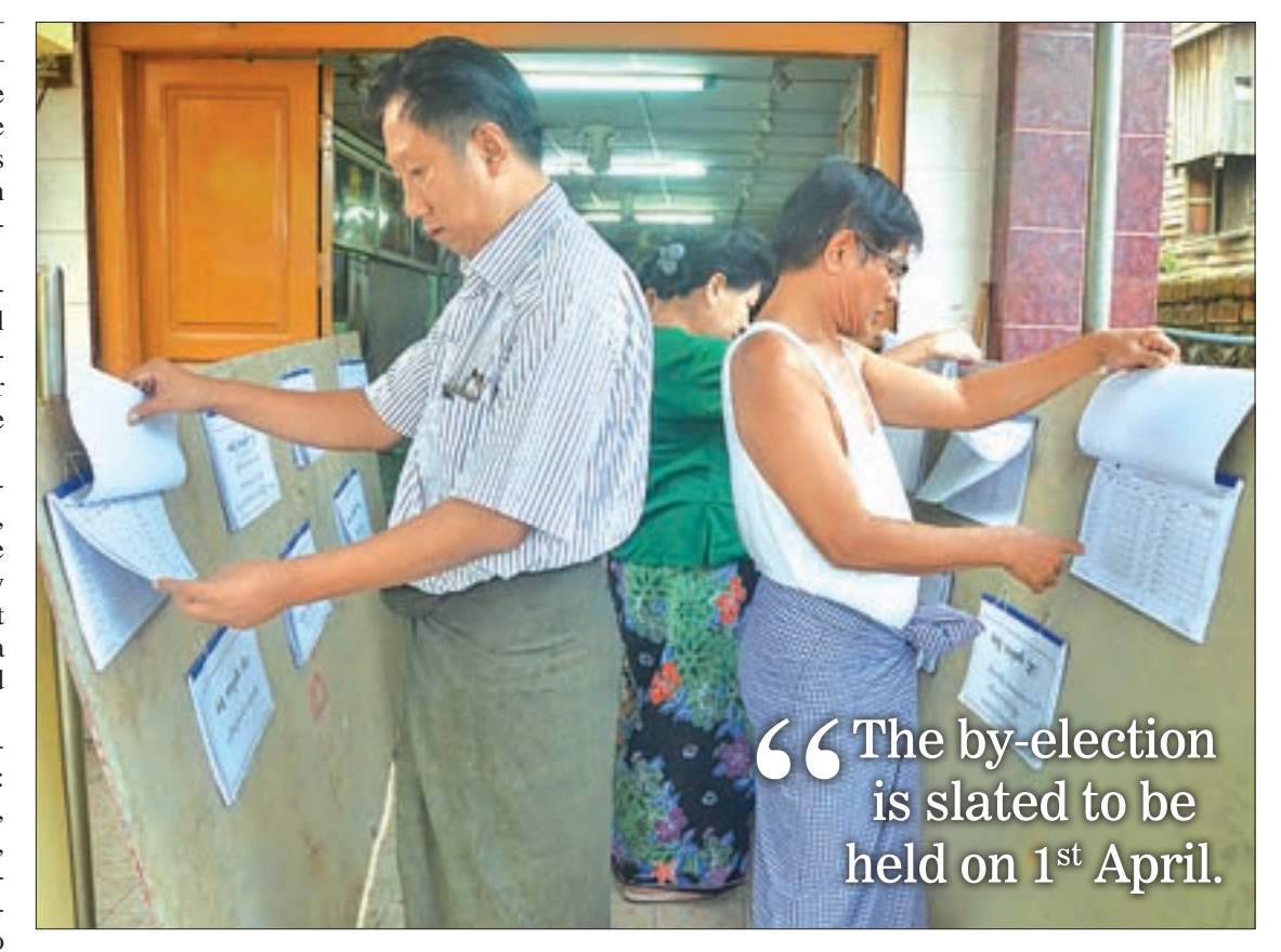
Voters check their names on the electoral roll in their district for this year's by-elections on 1 April.

In Yangon Region, the candidates will contest in 11 townships: Kamayut, Kyimyindine, Seikan, Latha, Hlaing, Lanmadaw, Ahlon, Hlinethaya, Dagon Myothit Seikkan, Dagon Myothit (East) and Kawhmu. The by-election is slated to be held on 1st April.