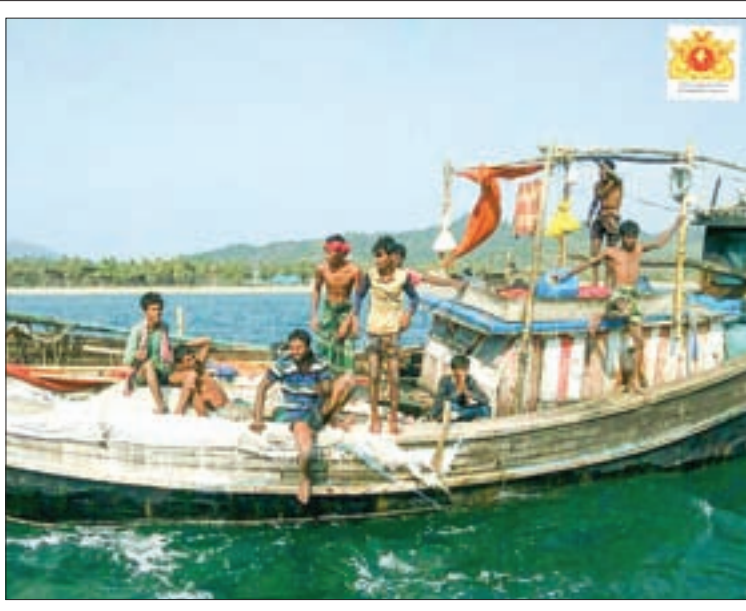
Illegal fishermen are seen after they are detained by security forces.

When interrogated, the nine suspects admitted that they are Bangladeshis and that they left Bangladeshis were detained at the News Agency