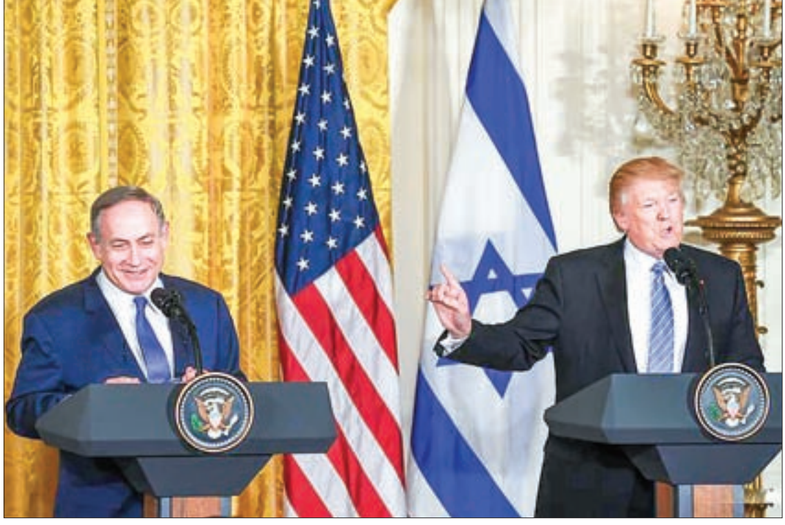
US President Donald Trump (R) gestures at a joint press conference with visiting Israeli Prime Minister Benjamin Netanyahu at the White House in Washington DC, the United States, on 15 February, 2017.

both parties like. ... I can live with either one," Trump said.