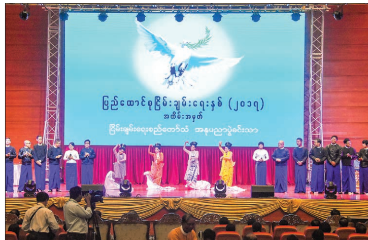
Traditional dancers perform together with comedians at the performance held in conjunction with fund raising for peace process.

A PERFORMANCE and fund raising for peace process was held at Myanmar International Convention Center -2 in Nay Pyi Taw yesterday, with an opening speech by Chairman of the Union Peace Commission Dr Tin Myo Win.