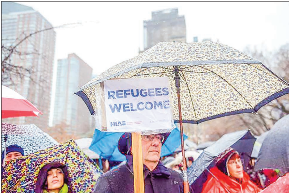
People participate in a protest against US President Donald Trump’s immigration policy at the Jewish Rally for Refugees in New York City, US on 12 February, 2017.