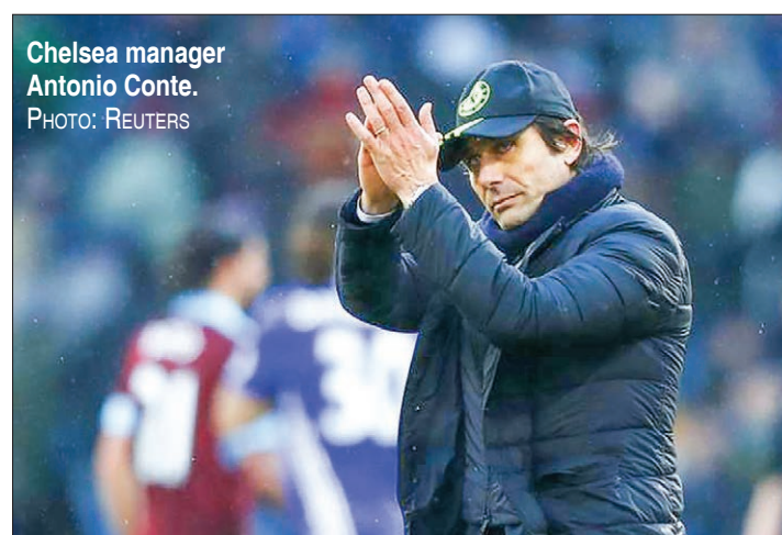
Chelsea manager Antonio Conte.

"We started well and kept the situation under control. We could have killed the game but it didn't