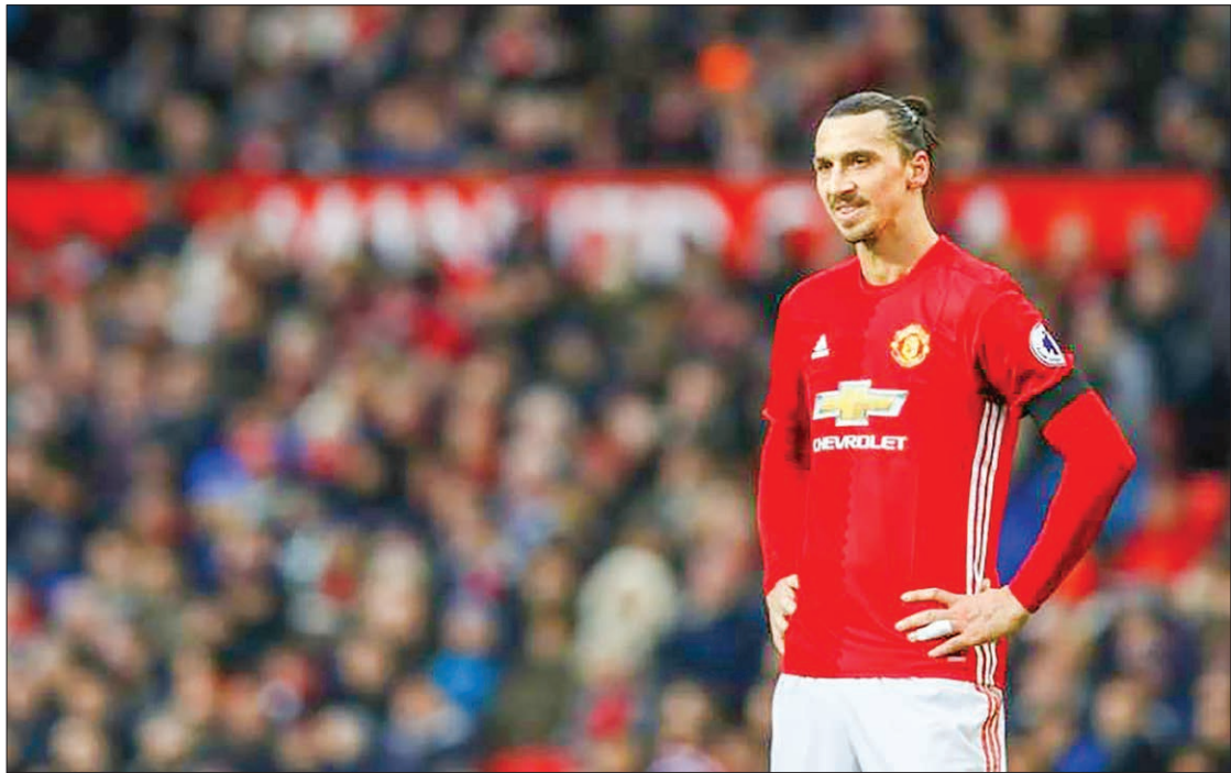
Manchester United's Zlatan Ibrahimovic.