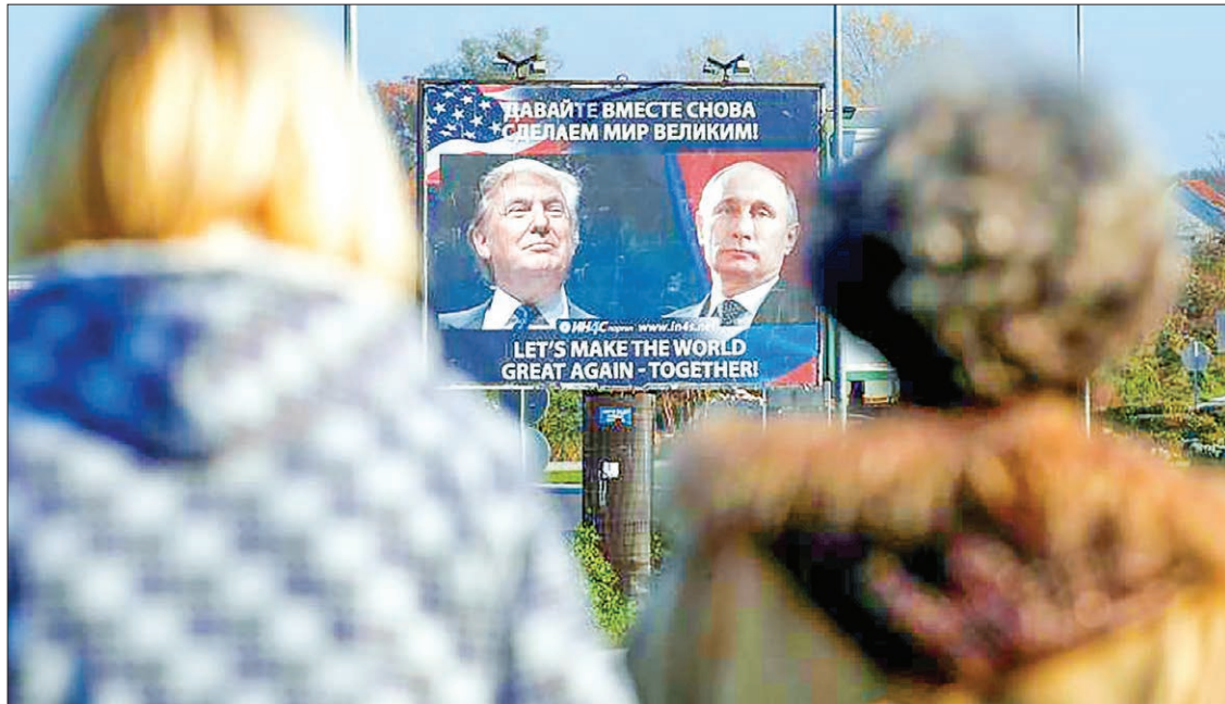
A billboard showing a pictures of US president-elect Donald Trump and Russian President Vladimir Putin is seen through pedestrians in Danilovgrad, Montenegro, on 16 November, 2016.

MOSCOW — The Kremlin said on Monday there was talk of a possible meeting between President Vladimir Putin and US President Donald Trump taking place before a G20 summit in July, but there was nothing specific to report so far.