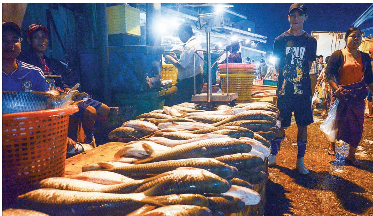
Rohu fish are seen at the Kyimyindine Sanpya Fish Market in Yangon on 7 January 2017. The livestock and fisheries sector hit over US$96.6 million during the first 10 months of this fiscal year.