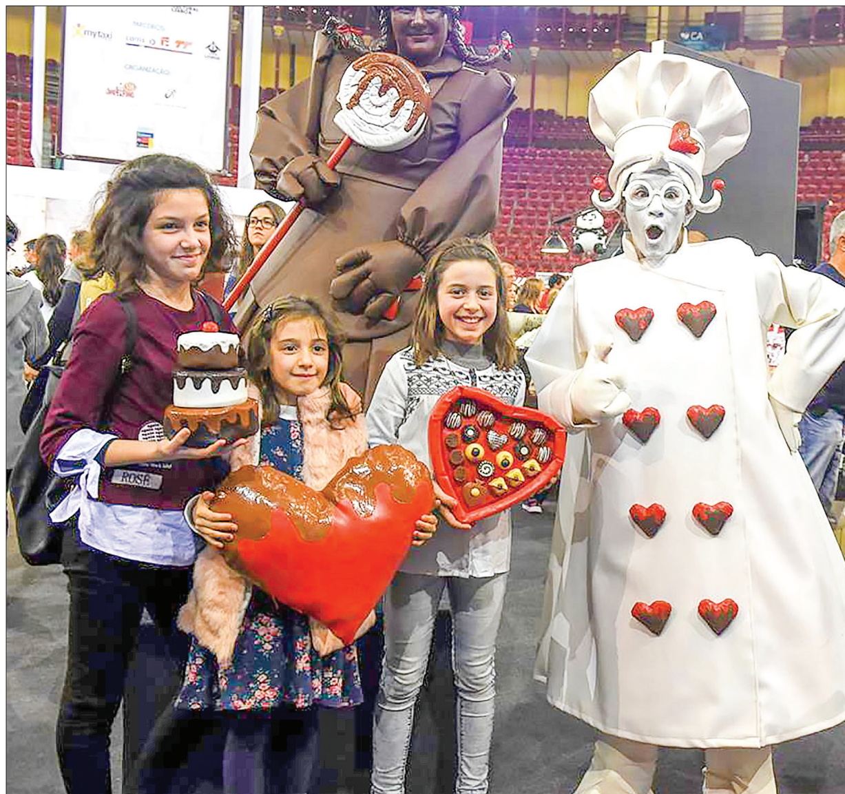
People visit the chocolate fair at Campo Pequeno Square in Lisbon, capital of Portugal, on 12 February, 2017. Lisbon's chocolate fair ended Sunday at Campo Pequeno Square in Portuguese capital Lisbon, with dozens of local and international brands displaying tasty and unique cocoa products.