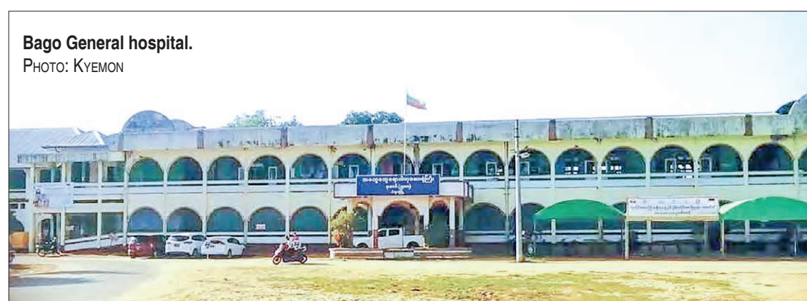
Bago General hospital.

THE LOCAL government will develop a new 500-bed hospital in Bago Region using a Ks2.4 million budget on the project.