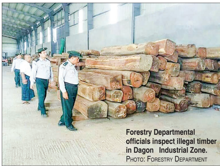
Forestry Department officials inspect illegal timber in Dagon Industrial Zone.

Also found yesterday were eight empty cargo containers, bringing the total of confiscated containers to 37, and six ten-wheeled container trucks. The value of all illegal timber and related confiscations in the last 16 days is estimated to be over Ks30,000 lakhs, according to the Forestry Department.— Taryar