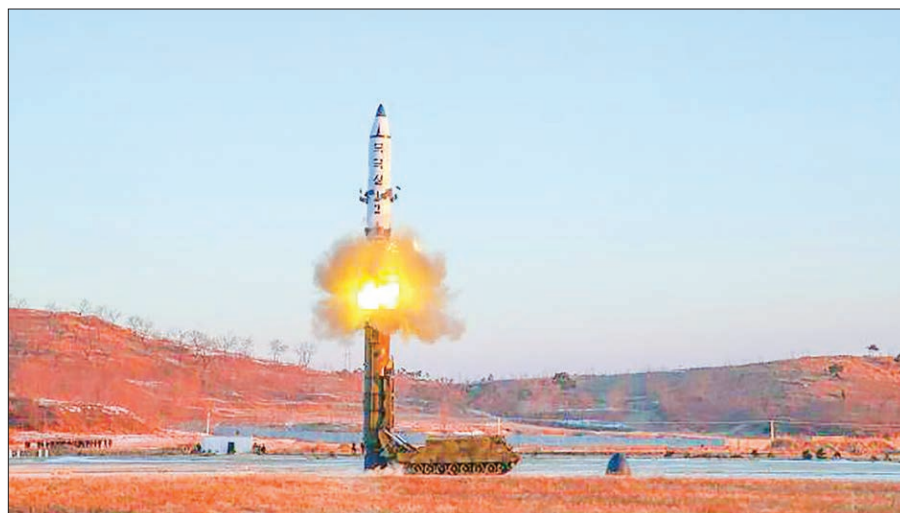
A view of the test-fire of Pukguksong-2 guided by North Korean leader Kim Jong Un on the spot, in this undated photo released by North Korea's Korean Central News Agency (KCNA) in Pyongyang on 13 February, 2017.

China is North Korea's main ally and trading partner but is irritated by its re-