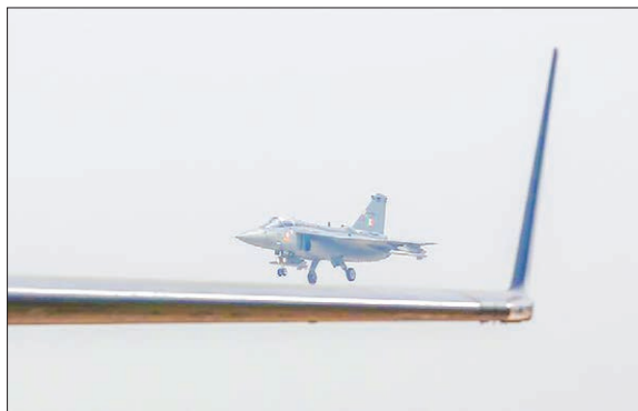
An Indian Air Force (IAF) light combat aircraft 'Tejas' performs during the Indian Air Force Day celebrations at the Hindon Air Force Station on the outskirts of New Delhi, India, on 8 October, 2016.

ing done because of techno-nationalism. They are done because these countries perceive of themselves as rising powers."