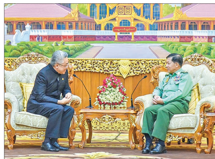
Senior General Min Aung Hlaing holds talks with Thai Ambassador at Bayinnaung guest house in Nay Pyi Taw yesterday.