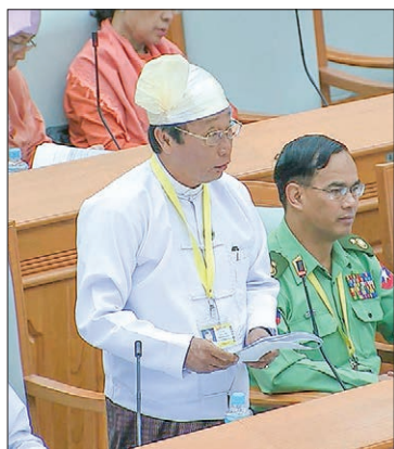
Deputy Minister for Agriculture, Livestock and Irrigation U Hla Kyaw.