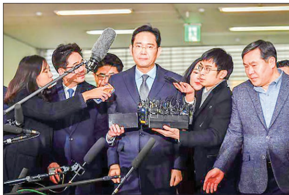
Lee Jae-yong (C), vice chairman of Samsung Electronics, arrives to be questioned as a suspect in a corruption scandal that led to the impeachment of President Park Geun-Hye, at the office of the independent counsel in Seoul on 13 February, 2017.

Park was impeached by parliament in December and South Korea's Constitutional Court will decide whether to uphold that decision. She has been