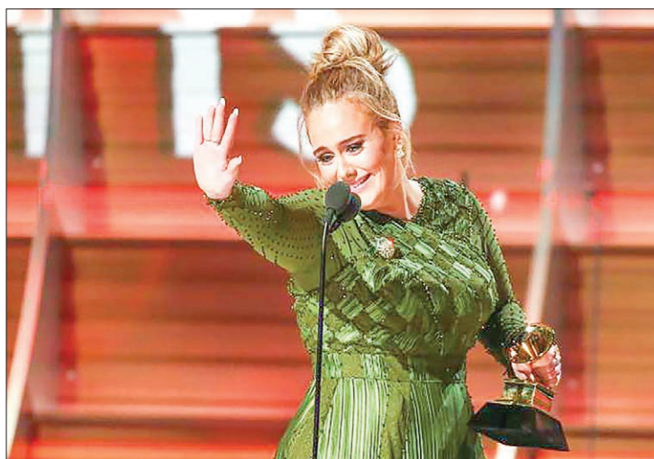
Adele waves to singer Beyonce who is in the audience as she and co-song writer Greg Kurstin (not pictured) accept the Grammy for Song of the Year for ‘Hello’ at the 59th Annual Grammy Awards in Los Angeles, California, US, on 12 February, 2017.

“My queen and my idol is Queen B I adore you,” the British