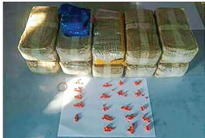
Seized stimulant tablets.

Police handed over the boat and stimulant tablets to the relevant authorities.—Myanmar News Agency