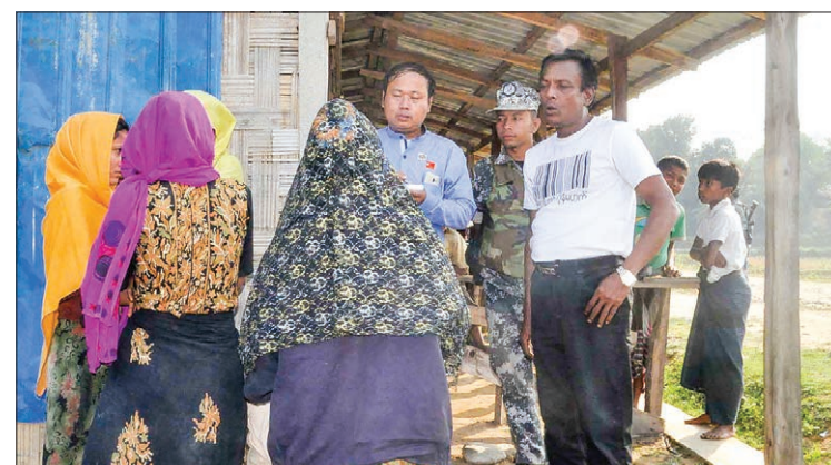
A member of Investigation Commission on Maungtau inquires women in Pwintphyuchaung Village.

In the afternoon the commission members divided into two groups and visited Pwintphyuchaung, Dargyisar and Myawtaung to interview local residents individually in an open and transparent manner on matters related to the Office of the High Commissioner on Human Rights (OHCHR) report on human rights violations, as well as challenges faced by the residents concerning their economic and financial situation, the youth's education, and religious matters.