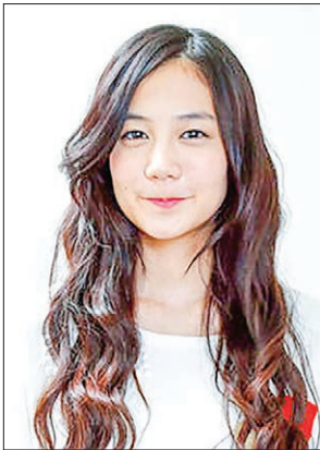
Japanese actress Fumika Shimizu, shown in this undated photo, said on 12 February, 2017, she is retiring from show business to devote herself to spreading the teachings of a religious group she follows, Happy Science.