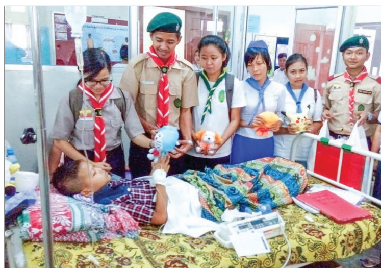
Scouts comfort a patient at the Yankin Children Hospital.

In addition, University Scouts made sanitation work in the hospital compound together with hospital staff, talking about Bogyoke Aung San, singing scout songs and demonstrating with games.