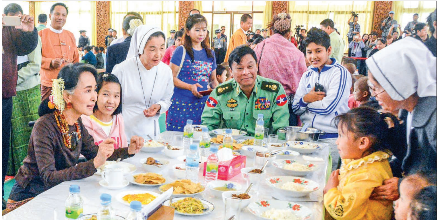
Above, Daw Aung San Suu Kyi, left, speaks with children and staff members in Taunggyi yesterday. Below, with a statue of General Aung San in the background, the State Counsellor gives a gift to a child from a philanthropic group in Taunggyi, Shan State.

While at the Cula Mani Pagoda, she signed the guest book and greeted fellow pilgrims. During the greetings, a first-year university student majoring in Myanmar language and literature asked the State Counsellor whether she had a right to take part in the Peace Process. The State Counsellor replied that anyone has access to participate in the Peace Process, as does an unhealthy but strong-minded traveller in the journey of life. The State Counsellor gave words