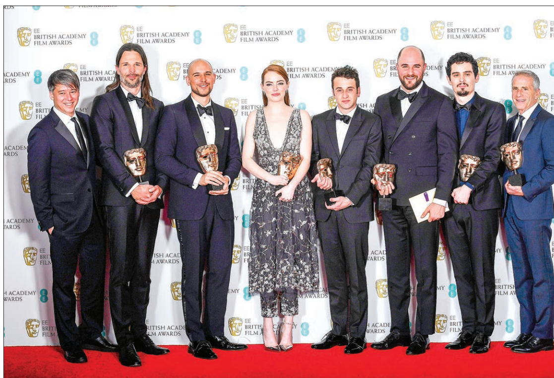
The team behind ‘La La Land’ hold their awards for Best Film at the British Academy of Film and Television Awards (BAFTA) at the Royal Albert Hall in London, Britain, on 12 February, 2017.

It has a joint-record 14 nominations for the Academy