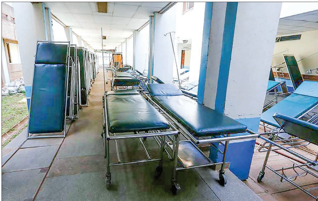
Medical stretchers are seen abandoned along the corridors at the emergency section of the Kenyatta National Hospital during a doctors' strike to demand fulfilment of a 2013 agreement between doctors' union and the government that would raise the medical practitioners pay and improve working conditions in Nairobi, Kenya, on 19 January, 2017.

This month, in a rare move, the Syrian government and rebel groups swapped dozens of women prisoners and hostages, some of them with their children, in Hama province in northwestern Syria.— Reuters