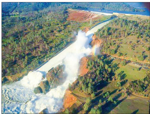
A damaged spillway with eroded hillside is seen in an aerial photo taken over the Oroville Dam in Oroville, California, US on 11 February, 2017.

The California Department of Water Resources said on Twitter at about 4:30 pm PST (0030 GMT Monday) that the spillway next to the dam was "predicted to fail within the next hour."