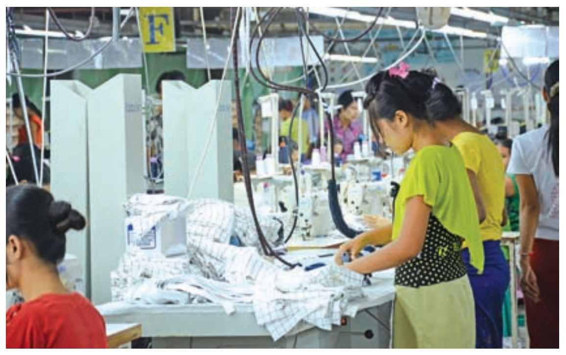
A file photo shows workers seen on a production line at a garment factory in Hlaingthaya.

domestic market. The greenback exchange rate hit a high of between Ks1,354 to Ks1,362 from 20 January to 7 February. The exchange rate climbed up to Ks1,369 on 8 February with the rise in global currency market, it is learnt from local currency exchange market. The Central Bank of Myanmar (CBM) set the exchange rate at Ks1,350 from 31 January to 6 February. The rate on 7 February was at Ks1,355 until CBM increased the rate to Ks1,360 on 8 and 9 January.—Ko Khant