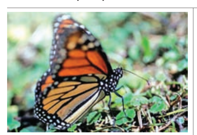
A monarch butterfly rests on the ground at the Sierra Chincua butterfly sanctuary on a mountain in Angangeo, Michoacan on 24 November 2016.

Sri Lanka became a place of attraction particularly after the civil war ended in May 2009.