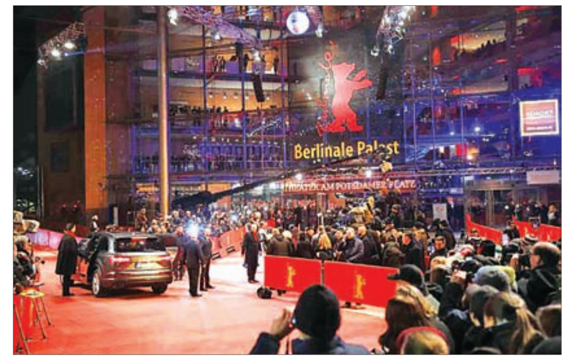
General view of the red carpet arrivals for the screening of the movie 'Django', during the opening gala of the 67th Berlinale International Film Festival in Berlin, Germany, on 9 February 2017.

"Political commitment is not a straightforward question - should you play or not play to a certain audience when you don't approve of their ideas, for example?" Co-