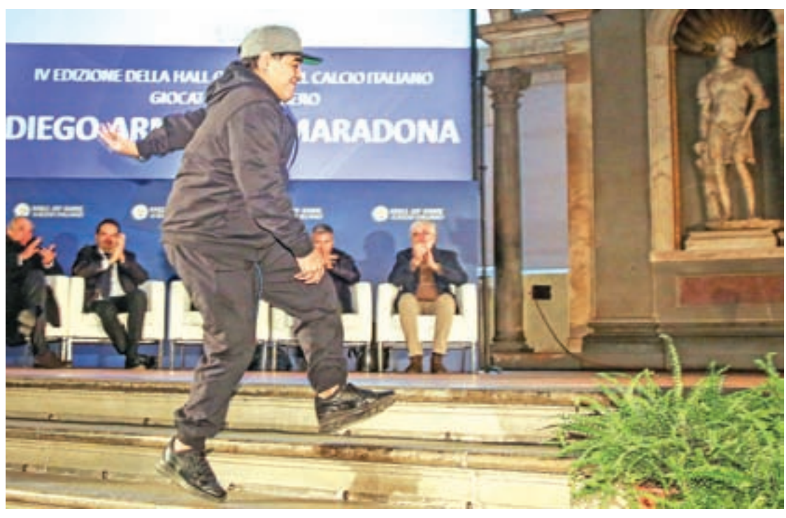
Argentinian soccer legend Diego Armando Maradona attends the Italian soccer Hall of Fame 2017 event in Florence, Italy, on 17 January 2017.

France are likely to choose clay for the tie. -Reuters