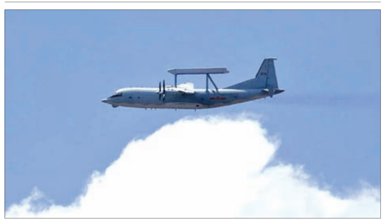
A KJ-200 surveillance aircraft of the Chinese Air Force flies during a training session for the upcoming parade marking the 70th anniversary of the end of World War II, on the outskirts of Beijing, in 2015.

Abe is scheduled to return to Japan on Monday evening.—Kyodo News