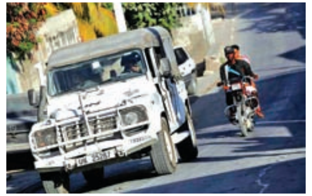
A United Nations (UN) car drives along a street of Port-au-Prince, Haiti, on 9 February 2017.

"The security situation throughout the country cannot be compared with that of