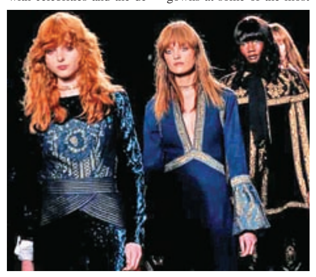
Models present creations from the Tadashi Shoji Autumn/ Winter 2017 collection during New York Fashion Week in the Manhattan borough of New York, US, on 9 February 2017.

NEW YORK — New York sign world's elite braving a massive storm to watch models strut street-wear and gowns at some of the most