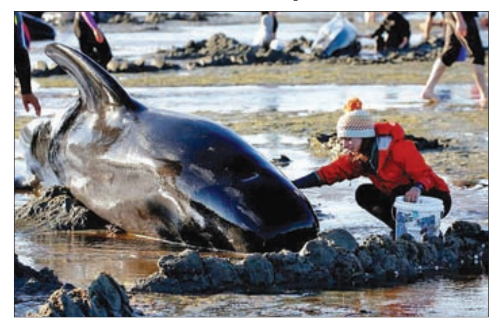
Volunteers attend to some of the hundreds of stranded pilot whales still alive after one of the country's largest recorded mass whale strandings, in Golden Bay, at the top of New Zealand's South Island, on 10 February 2017.

Pilot whales are not listed as endangered, but little is known about their population in New Zealand waters.—Reuters