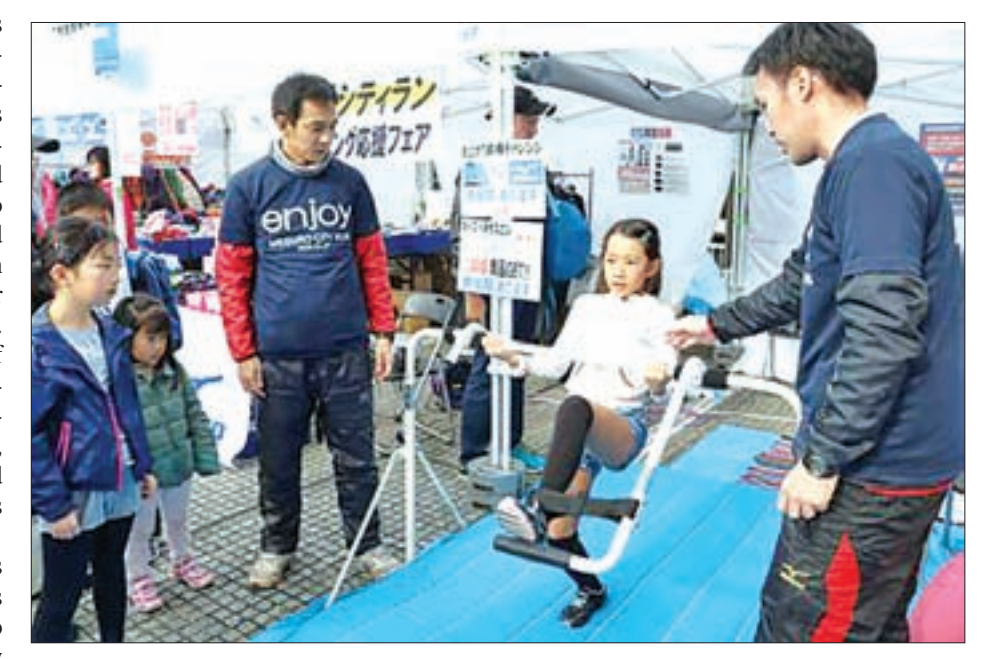
Photo taken on 27 November, 2016 shows an elementary school girl practicing a back-hip circle on a horizontal bar with the help of a device developed by a Mizuno Corp. group company.

The event is held at kindergartens and commer-