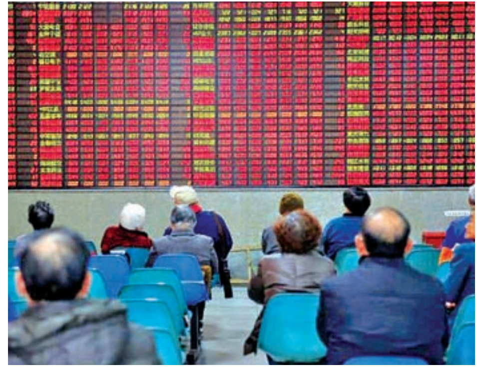
Investors look at an electronic board showing stock information on the first trading day after the New Year holiday at a brokerage house in Shanghai, China, on 3 January 2017.

On the political front, Trump seemed to change tack and said he would honor the longstanding "one China" policy during a phone call with China's leader, a major diplomatic boost for Beijing which brooks no criticism of its claim to neighbouring Tai-