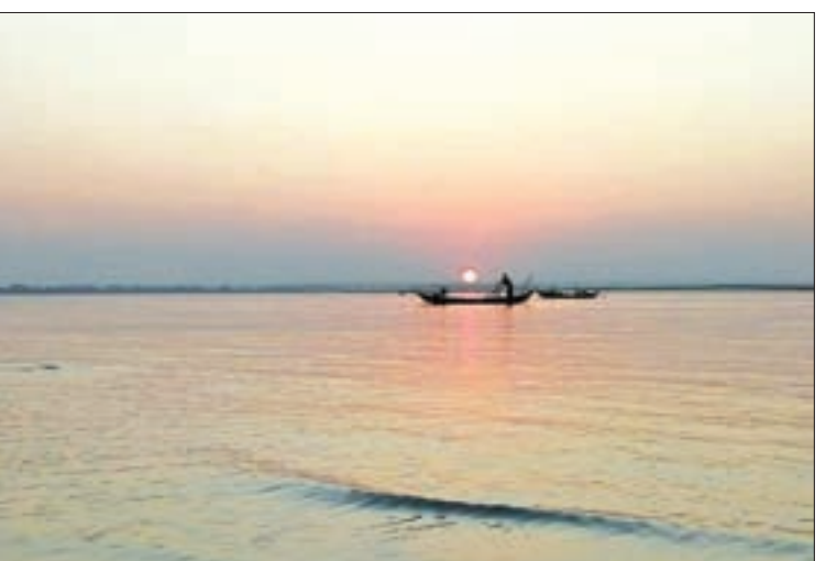
File photo shows the sunset over the Ayeyawady river.

"Nyaung Chuang Thar Beach, which was opened in 2012, was moved to a place near Bo Myat Tun and Ayeyawady (Nyaungdon) bridges because there was a high risk of death