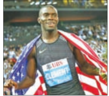
Kerron Clement of USA.

"Today was fun. I love my team, we finished last but it's just great to be here," Clement