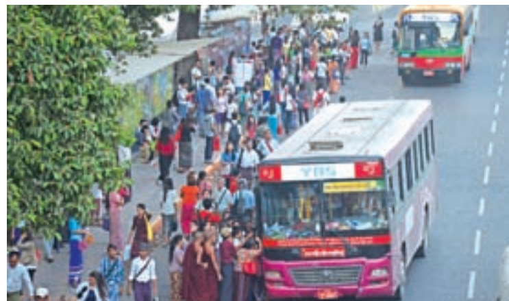
Commuters waiting to board YBS No.12 at a bus stop on 6 February.

To reduce traffic jams in Yangon Region and for the bus lines to become disciplined, Yangon Region's Cabinet changed to