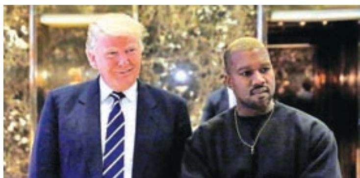
US President-elect Donald Trump and musician Kanye West pose for media at Trump Tower in Manhattan, New York City, US, on 13 December, 2016.

NEW YORK — Kanye West, one of Donald Trump's biggest celebrity supporters, appeared to have deleted his tweets about his meeting last year with the then US president-elect in which the two discussed multi-cultural issues.