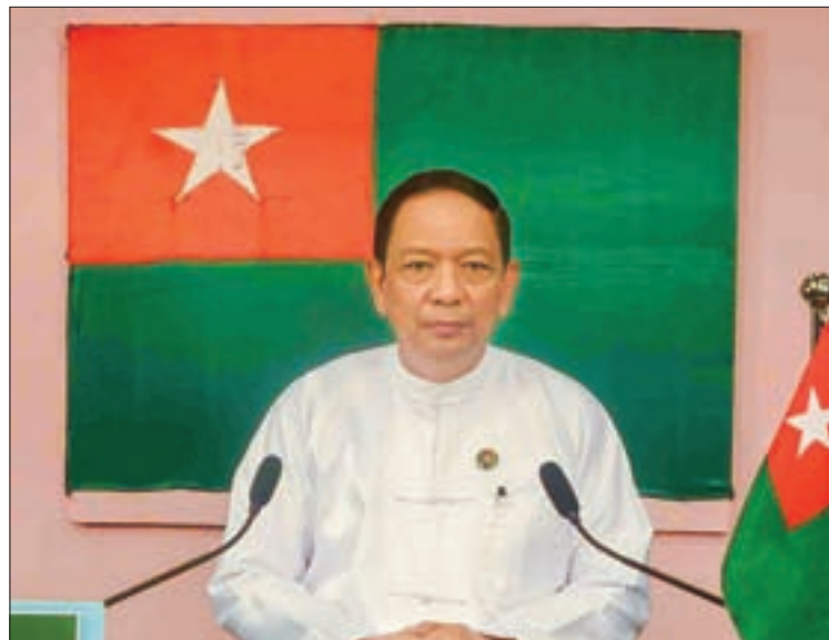
U Thet Naing Win, General secretary of the Union Solidarity and Development Party.

General secretary of the Union Solidarity and Development Party U Thet Naing Win presented the policies, attitudes and programmes of his party on 7 February 2017, on Radio and TV programmes.