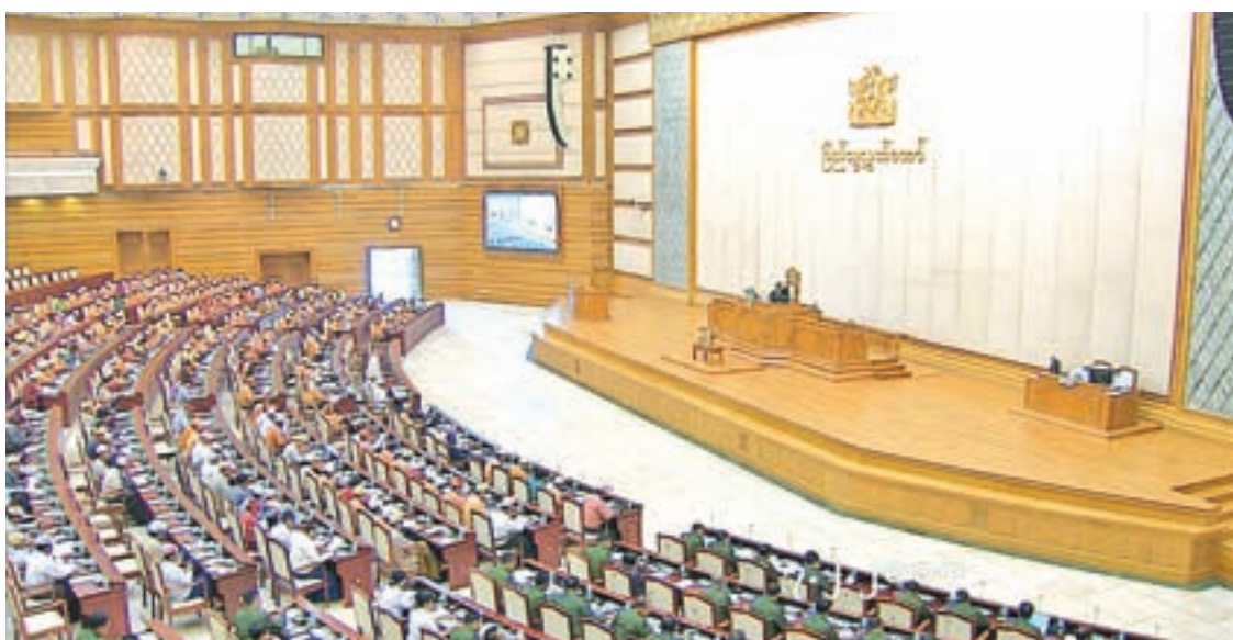
Pyithu Hluttaw being convened in Nay Pyi Taw.

The deputy minister made clarifications on the issue of direct flights from Nay Pyi Taw to Kengtung once a week by U Steven, MP for Kengtung constituency that there is one state-owned airline and nine private airlines in Myanmar and that state-owned Myanmar National Airline has commercially run as an international airline without asking for budget assistance from the government since 2013-2014, when