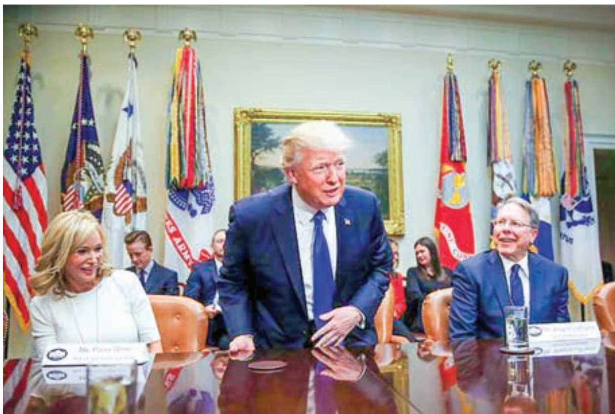
US President Donald Trump attends a meeting in Washington US, on 1 February, 2017.

For further information , please call or email the following contacts. Applicants should send a cover letter and CV to No.150 Nga Htat Gyi Pagoda Road, Bahan Township, Yangon, or email: gnlmdaily@gmail.com , dce@globalnewlightofmyanmar.com or call (01) 8604529.