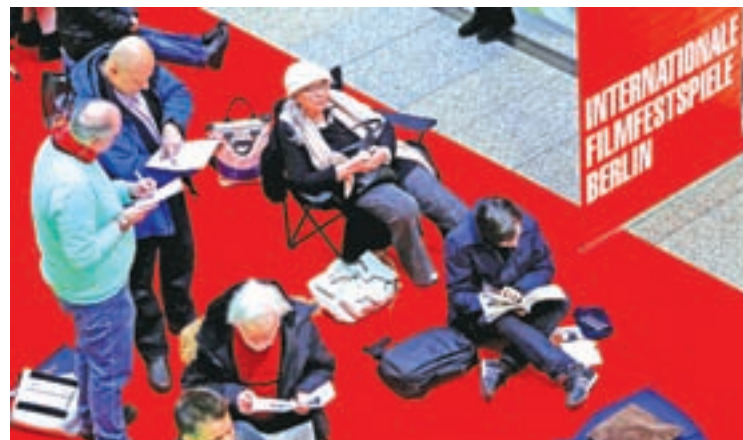
People queue to buy tickets for the upcoming 67th Berlin International Film Festival Berlinale in Berlin, Germany, on 6 February, 2017.