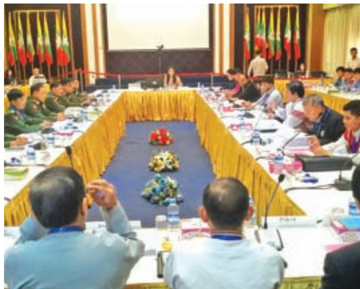
The meeting of Union Joint Ceasefire Monitoring Committee in progress at the National Reconciliation and Peace Centre in Yangon.

During the three-day meeting, the members of the JMC-U will also discuss matters on arrangements for a visit to the Philippines, conducting mine clearance trainings and demarcation for the troops.— Ye Khaung Nyunt