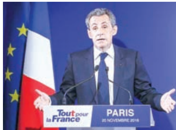
Nicolas Sarkozy, former French president and candidate for the French conservative presidential primary, reacts after partial results in the first round of the French center-right presidential primary election at his campaign headquarters in Paris, France, on 20 November, 2016.

The source, who was speaking on condition of anonymity as is often the case in France when initial