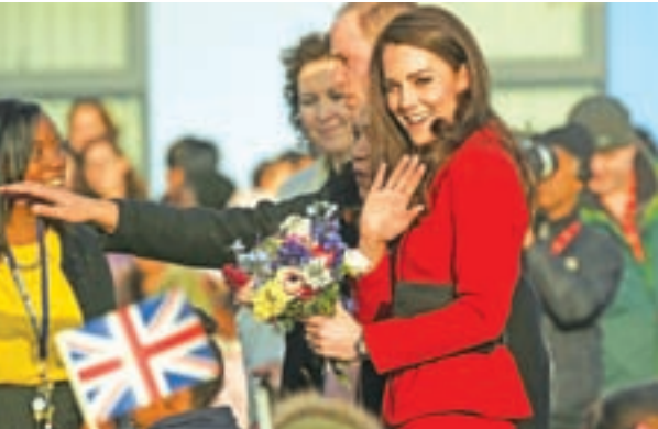
Britain's Catherine the Duchess of Cambridge speaks with school pupils as she arrives with Prince William at an event organised by charity Place2Be during Children's Mental Health Week at Mitchell Brook Primary School in north London, Britain, on 6 February, 2017.

erine told the assembly. “I know it is hard if you are feeling down yourself. But helping someone out will also make you feel so much better too.” Catherine, who is patron of the children's mental health charity Place2Be, and William watched pupils perform role plays about kindness. They also presented Place2Be's first “Kindness Cup” to a young girl. The charity wants to inspire kindness among adults and children during Children's Mental Health Week 2017, which began on Monday. On Sunday, William and Catherine took to the track for a short race with Harry as they joined a training day for runners competing for Heads Together in April's London Marathon.—Reuters