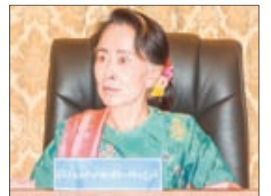
State Counsellor Daw Aung San Suu Kyi.

Present at the meeting were Nay Pyi Taw Council members, and Ministers for Planning and Finance from the Cabinets of Kachin State, Kayin State, Chin State, Mon State, Shan State, Yangon Region, Mandalay Region, Ayeyawady Region, Sagaing Region, Magwe Region, Bago Region and Tanintharyi Region.— Myanmar News Agency