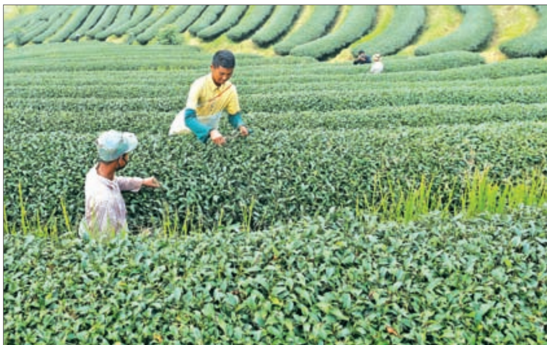
Workers work in tea leaf field in Mong Mao on 1 October, 2016.

THE Myanmar Tea Group plans to send local tea growers to Japan to study tea cultivation techniques in the world's top tea-producing country as part of its project to boost high-quality tea products in Myanmar.