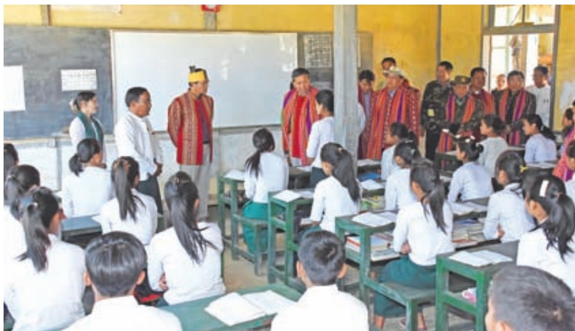
Vice President U Henry Van Thio meeting with school children studying at a school in Htantalan.