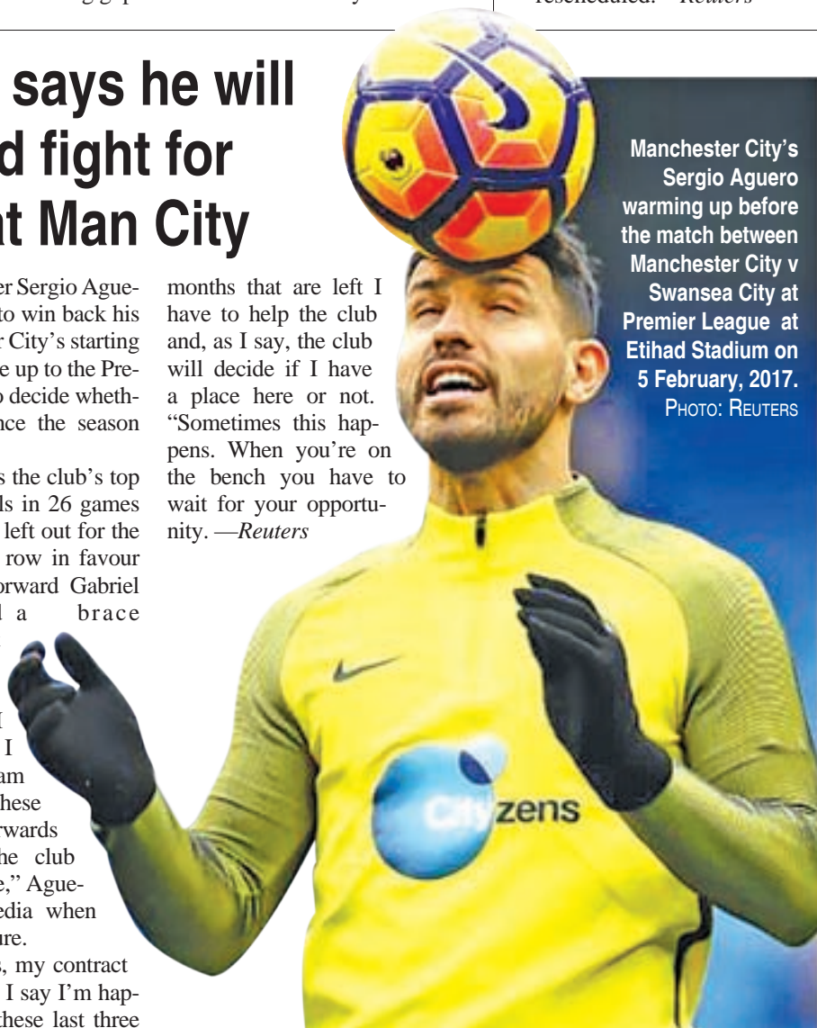
Manchester City's Sergio Aguero warming up before the match between Manchester City v Swansea City at Premier League at Etihad Stadium on 5 February, 2017.

months that are left I have to help the club and, as I say, the club will decide if I have a place here or not. "Sometimes this happens. When you're on the bench you have to wait for your opportunity. —Reuters