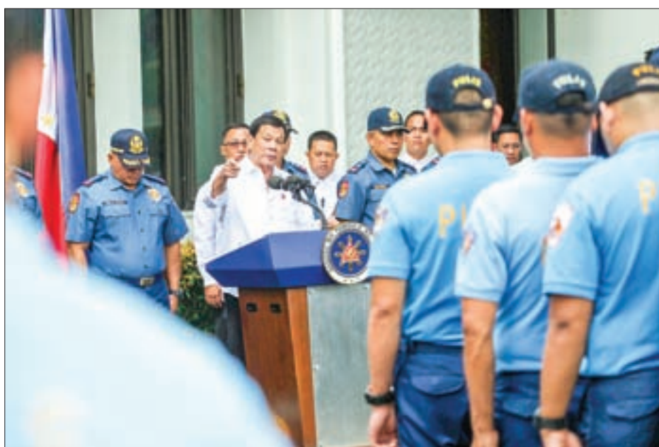
Philippine President Rodrigo Duterte speaks while talking to police officers who are under investigation for various infractions during a meeting at the Malacanang presidential palace in metro Manila, Philippines on 7 February, 2017.

“I will send you to Basilan, live there for 2 years. If you get out alive,