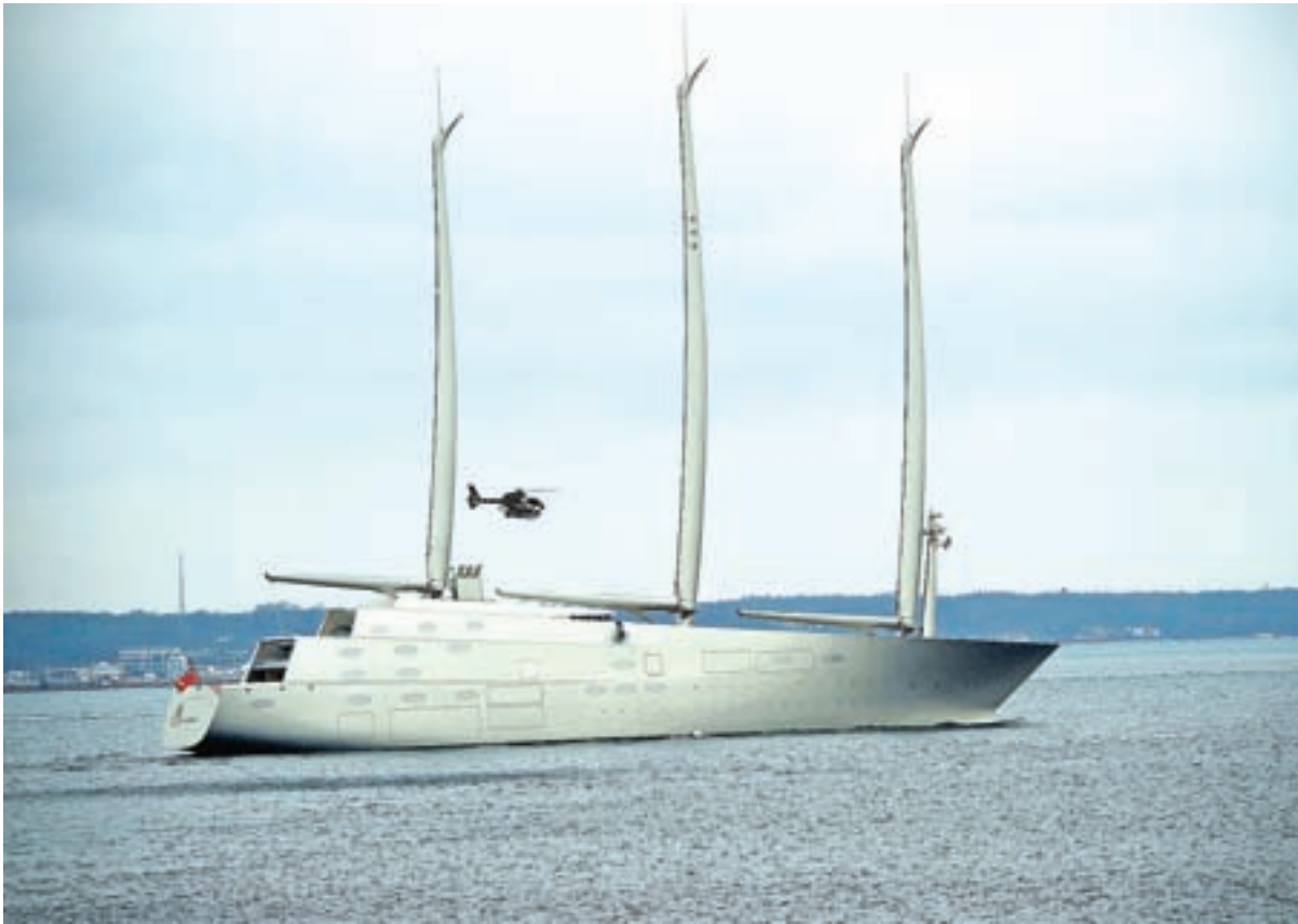
The 142.81 metre sail-assisted motor yacht 'Sailing Yacht A' passes Elsinore, North Sealand, Denmark on 6 February, 2017. With masts of 90 meters, a huge swimming pool and eight storeys 'Sailing Yacht A' is the world's largest sailing ship. The yacht, owned by Russian tycoon Andrey Melnichenko, was build in Kiel, Germany and is now passing through Denmark on its way to Kristiansand in Norway.

CHICAGO — The long-est-living fish in a zoo-logical setting, a lung-fish known as Granddad acquired by the Shedd Aquarium in Chicago in 1933, has been euthanized after suffering failing health well in his mid-90s, aquarium officials said on Monday. Granddad, who came to Shedd from Australia in anticipation of the 1933-34 Chicago World's Fair,