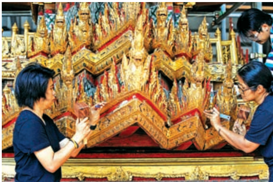
Thai officials from the Conservation Science Division of the Fine Arts Department of the National Museum of Thailand repairs the Minor Chariot, which will be used during the late King Bhumibol Adulyadej's funeral later this year, Thailand, on 6 February, 2017.