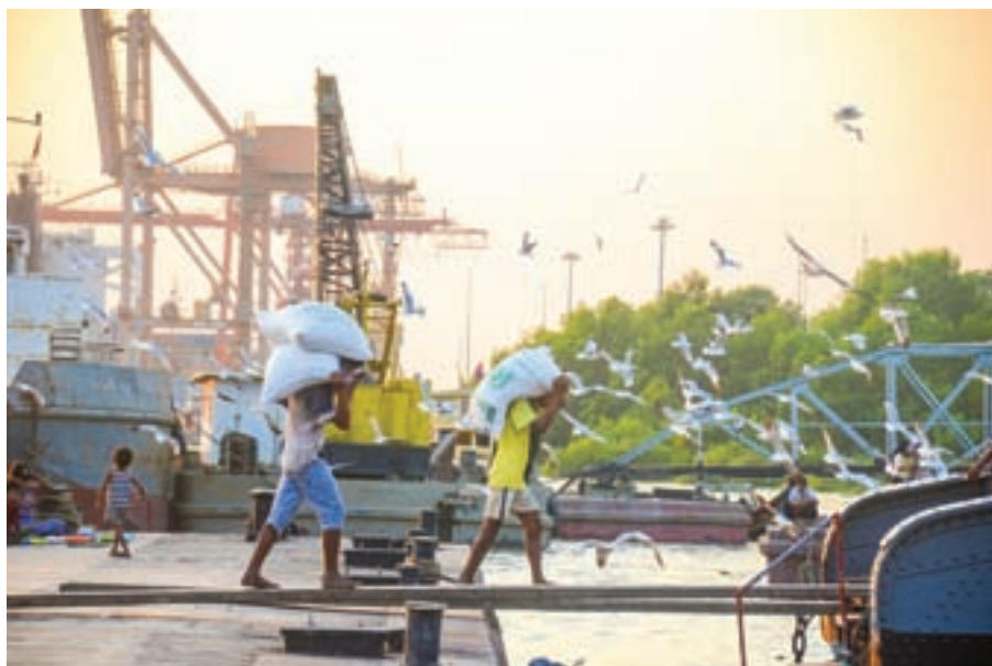
Workers loading rice bags onto a ship at a Botahtaung jetty in Yangon.

Agricultural products are in second place in the export sector, accounting for 24 per cent of export