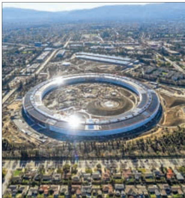
The Apple Campus 2 is seen under construction in Cupertino, California on 13 January, 2017.

Since Apple unveiled its plans in 2011, the move-in date has slowly receded: Jobs' initial projection was 2015, but this spring now