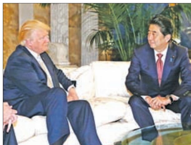
Photo shows Japanese Prime Minister Shinzo Abe (R) and Donald Trump holding talks at Trump Tower in New York, just over a week after Trump’s US presidential election victory. Abe will visit the United States from 9 February, 2017, to hold a summit with the new president, the Japanese government said.

TOKYO —Japanese Prime Minister Shinzo Abe will visit the United States from Thursday to hold a summit with President Donald Trump, the Japanese government said on Tuesday.