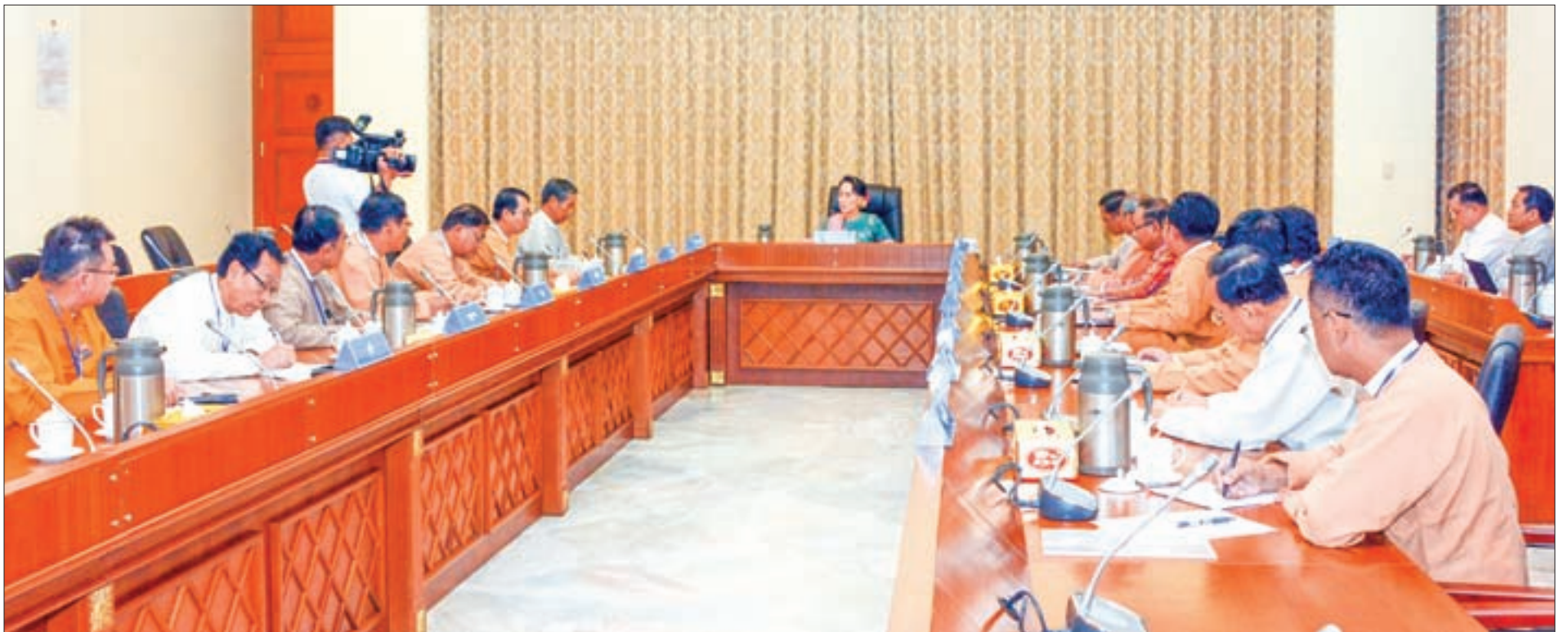
State Counsellor Daw Aung San Suu Kyi addresses the meeting for planning and finance from Cabinets of Regions and States in Nay Pyi Taw.