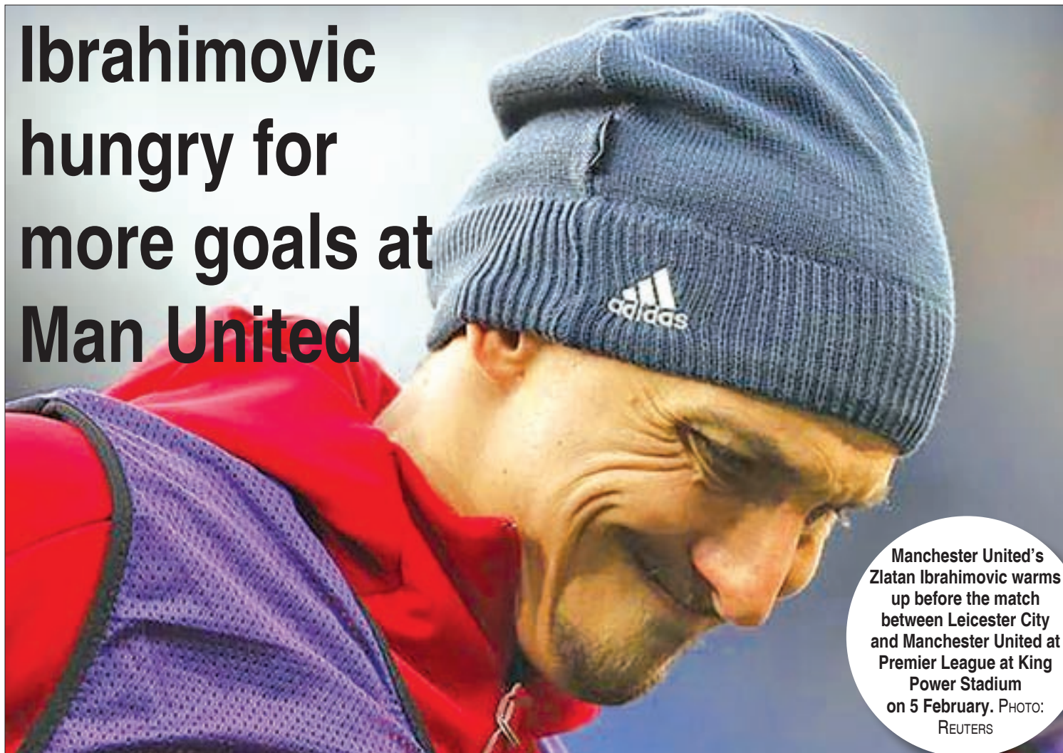
Manchester United's Zlatan Ibrahimovic warms up before the match between Leicester City and Manchester United at Premier League at King Power Stadium on 5 February.

LONDON — Manchester United striker Zlatan Ibrahimovic is refusing to rest on his laurels after becoming the oldest player to net 15 goals in a Premier League season when he scored in Sunday's 3-0 win at Leicester City.