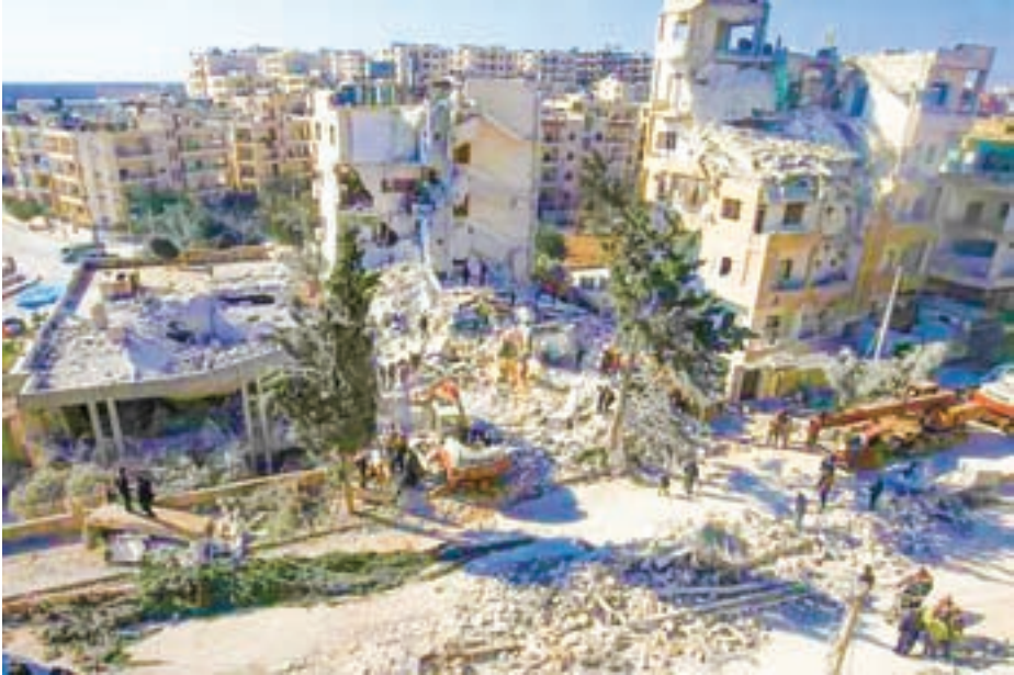
People inspect the damage at a site hit by airstrikes in the rebel-held city of Idlib, Syria on 7 February, 2017.

ALEPPO — At least 15 people died in air strikes on the rebel-held Syrian city of Idlib on Tuesday, in some of the heaviest raids there in months, residents and a rescue worker said. Around eight attacks by what were believed to be Russian jets wounded scores of people and leveled several multi-storey buildings in residential areas of the northwestern city, they added. “We are still pulling bodies from the rubble,” Issam al Idlibi, a volunteer civil defence worker, said. Most of the casualties were civilians and the death toll would probably rise, he added.