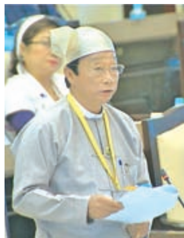
Deputy Minister for Agriculture, Livestock and Irrigation U Hla Kyaw.