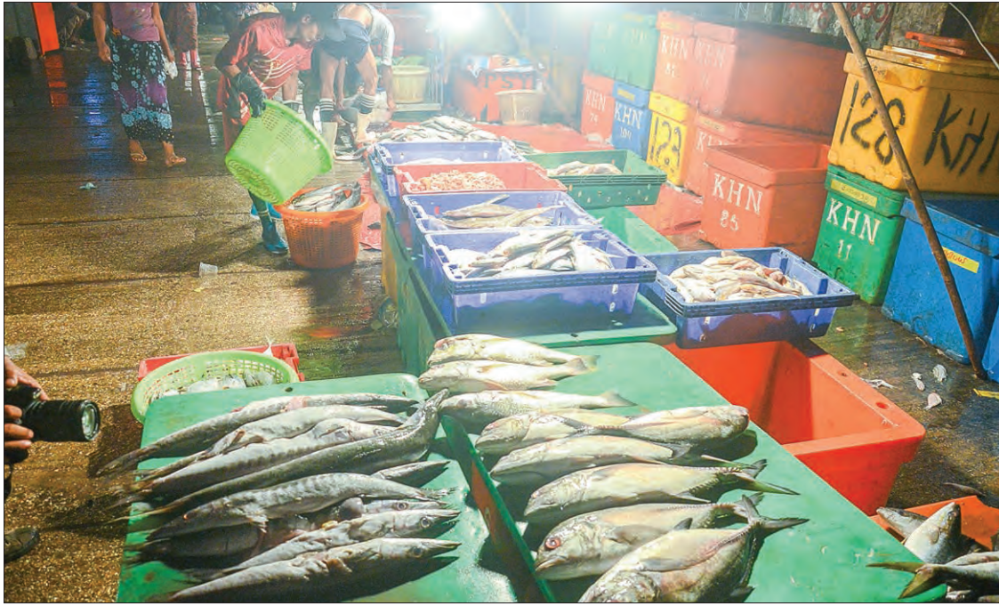
Workers prepare for putting fish from farms in cold-storage boxes of the Sanpya Fish Market in Yangon.