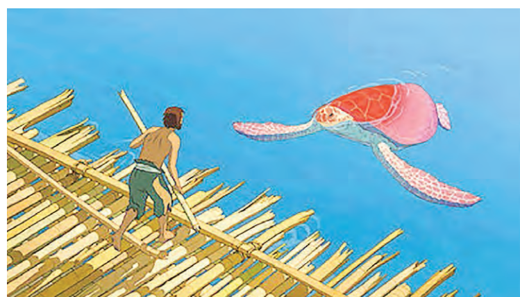
“The Red Turtle,” produced by Japan’s Studio Ghibli and directed by Dutch-British animator Michael Dudok de Wit, takes the Best Animated Feature - Independent award at the annual Annie Awards ceremony in Los Angeles on 4 February, 2017.