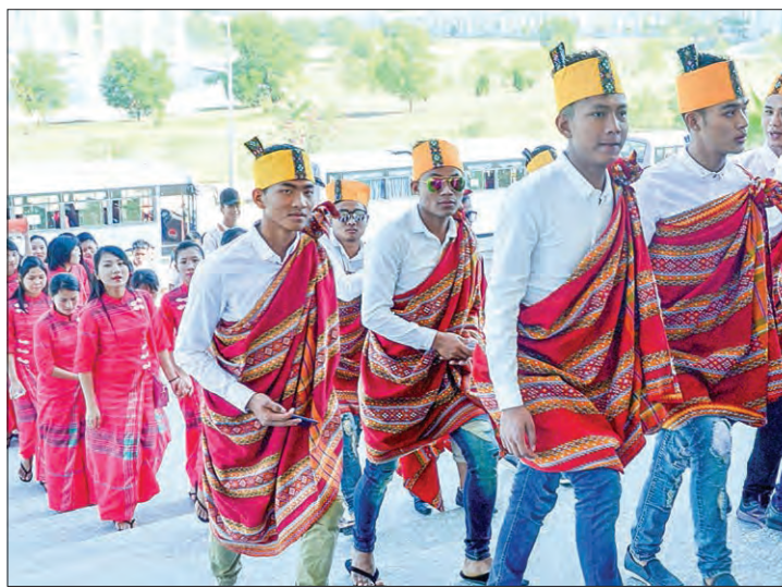
A group of cultural troupes from regions and states visits Nay Pyi Taw.

A GROUP consisting of people from a wide range of regions, states, cultures and ethnicities will observe the development of Nay Pyi Taw starting today.