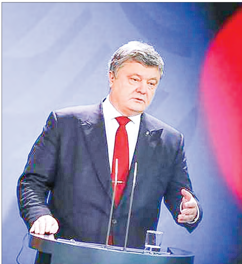
Ukraine's President Petro Poroshenko.

Trump's open admiration for Russian President Vladimir Putin and campaign pledge to mend ties with Moscow have raised questions over his administration's commitment to maintaining sanctions