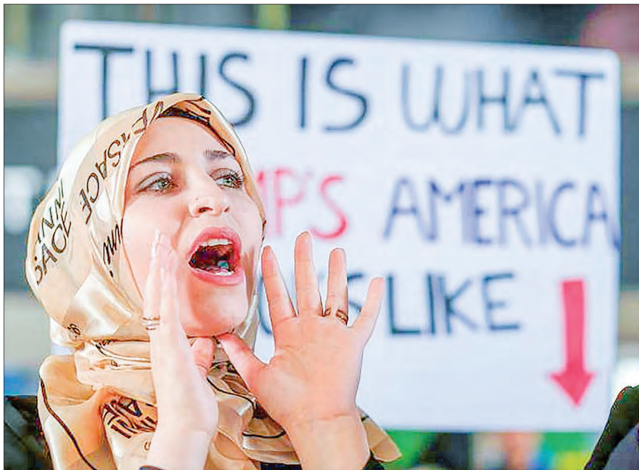
A demonstrator against the immigration rules implemented by US President Donald Trump's administration, protests at Los Angeles international airport in Los Angeles, California, US, on 4 February, 2017.

WASHINGTON — A US appeal court late on Saturday denied a request from the US Department of Justice to immediately restore a immigration order from President Donald Trump barring citizens from seven mainly Muslim countries and temporarily banning refugees.