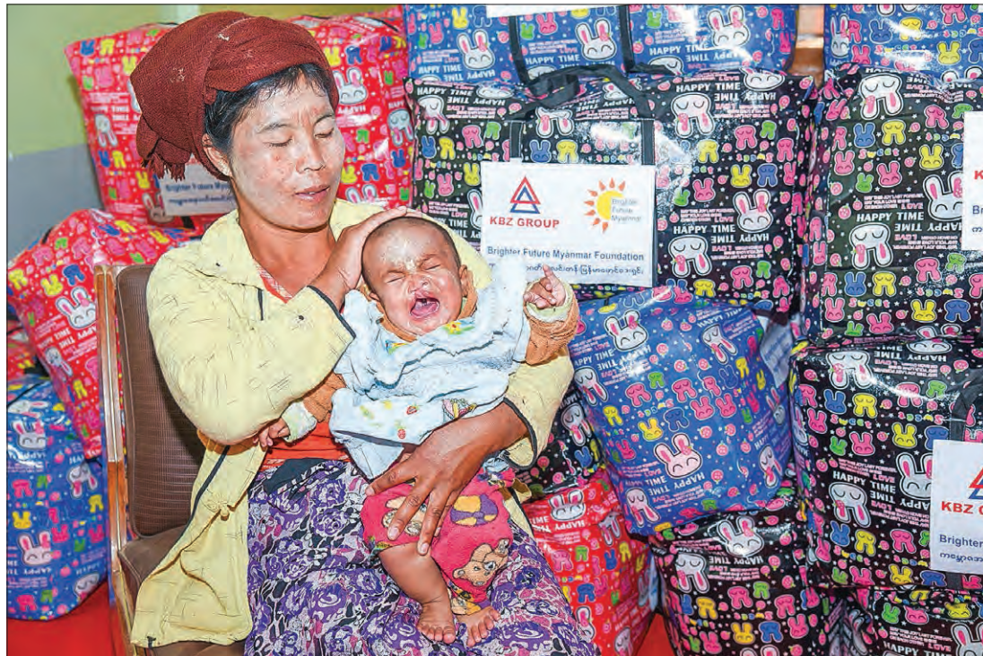
A child with cleft lips and palates is ready to receive medical check-up before undergoing surgery.

More than 170 children received medical check-ups, and of them more than 110 received surgery in the second mission last year at Yangon General Hospital in Yangon. Since its establishment in 2008, when Cyclone Nargis ravaged Myanmar, BFM has carried out social welfare activities nationwide, adopting five tasks for corporate social responsibility and spending more than Ks170 billion nationwide.