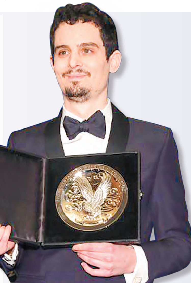
Feature Film Award nominee, Damien Chazelle, poses for photographers at the 69th annual DGA Awards in Beverly Hills, California, US on 4 February, 2017.

The Oscars will be handed out in Hollywood on 26 February to producers, directors, actors and actresses in a star-studded television show viewed around the world and among the most-watched TV programmes in the United States.—Reuters