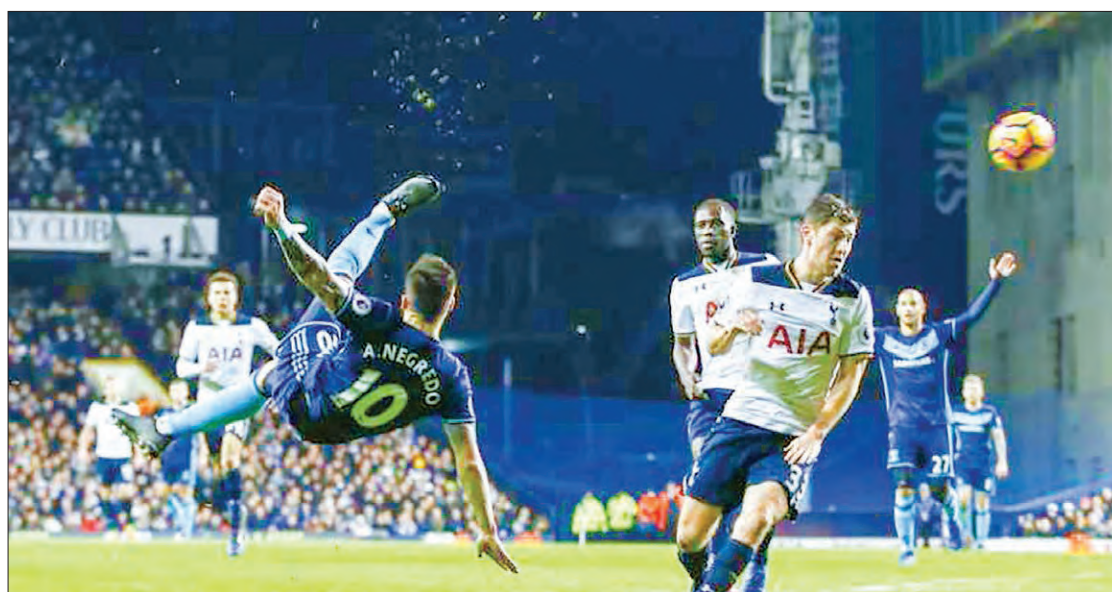
Middlesbrough's Alvaro Negredo shoots at goal during the match of Premier League between Tottenham Hotspur and Middlesbrough at White Hart Lane on 4 February, 2017.

we can compete against every single team, and once again the players have been amazing," he told reporters, adding that Boro