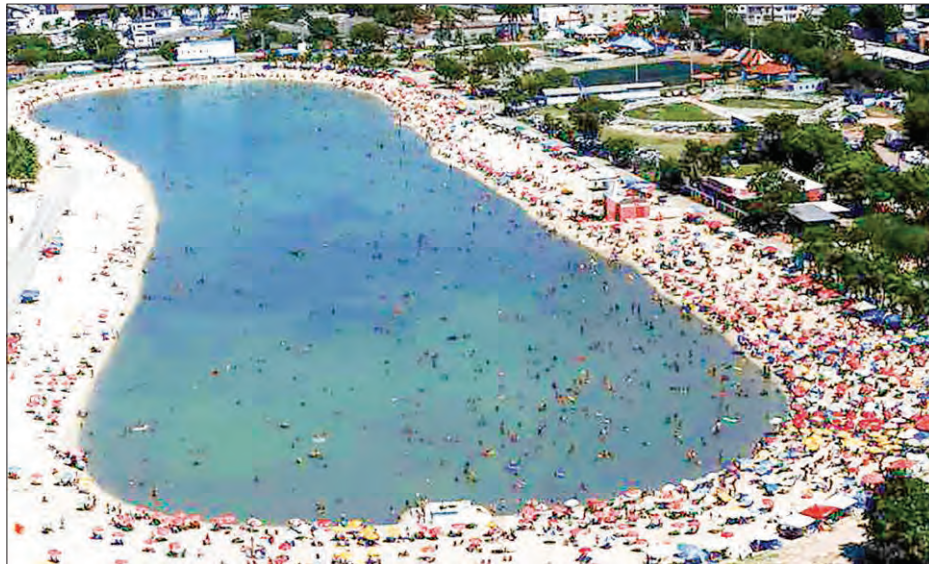
An artificial pond known as piscinão, or big pool, is seen next to the Mare slums complex, in the northern suburbs of Rio de Janeiro, Brazil, on 15 January 2017.

gathered one recent Sunday were many parents of young children who said the calm waters, despite abundant litter floating in some corners