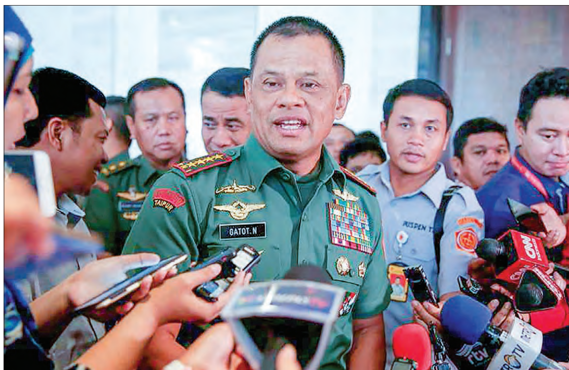
Indonesian military Chief Gatot Nurmantyo talks to reporters in Jakarta, Indonesia, on 5 January 2017.

Both governments moved quickly to try to cool tensions and Indonesia’s chief securi-