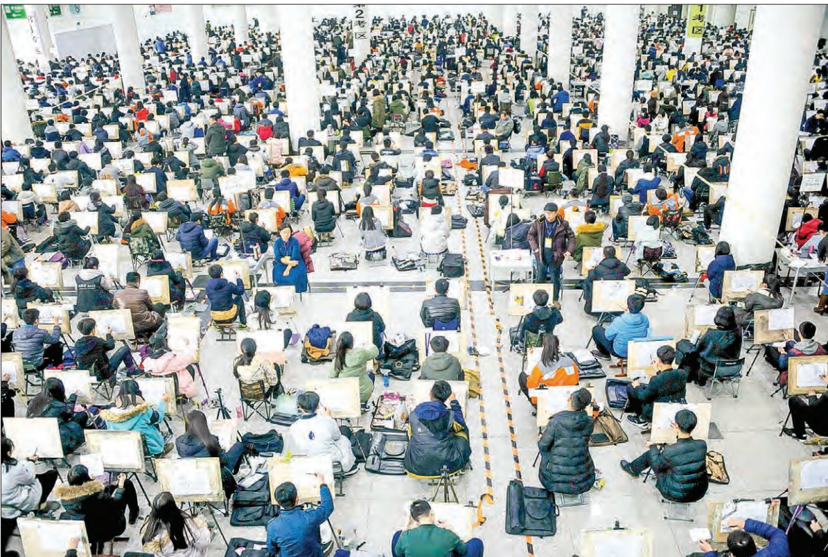
Candidates take the 2017 college entrance exam for art majors of Shandong University of Art and Design in Jinan, capital of east China’s Shandong Province, on 5 February 2017.