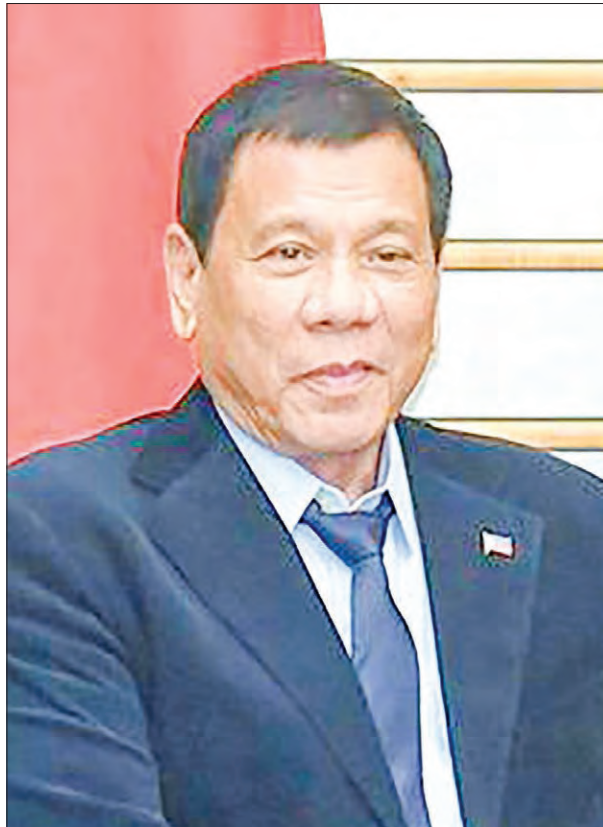
Philippine President Rodrigo Duterte.

MANILA — Philippine President Rodrigo Duterte said on Saturday evening his government is pulling out of peace talks with the country's communist movement, a day after he lifted the government's unilateral cease-fire with the insurgents.