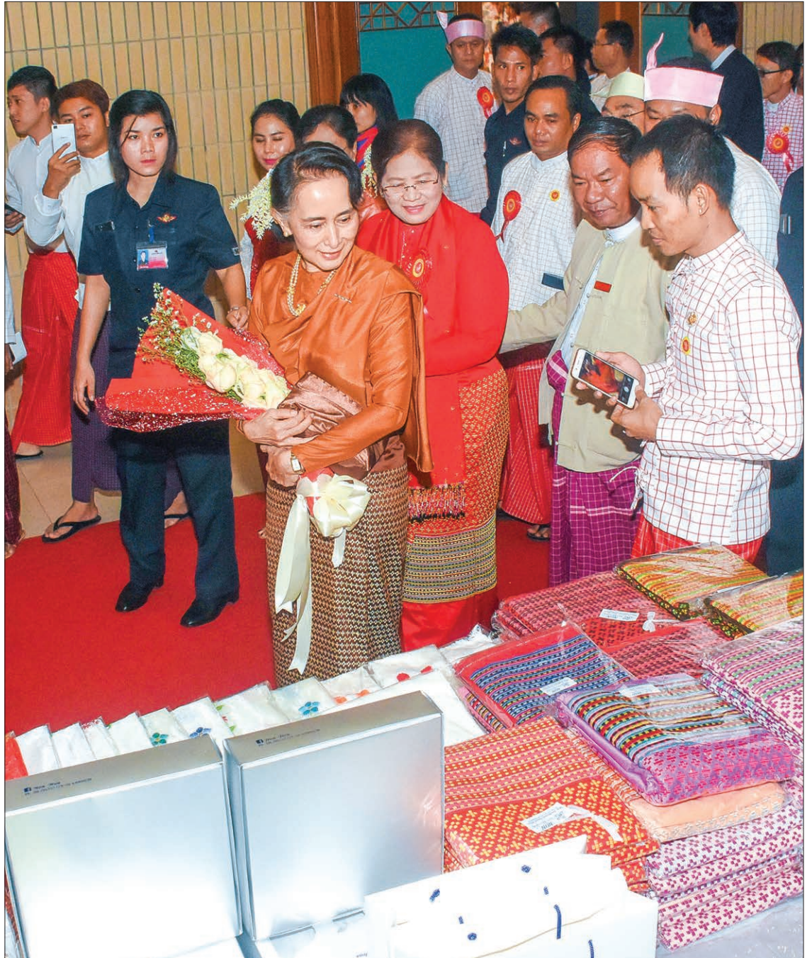
State Counsellor Daw Aung San Suu Kyi sees Mon traditional dresses displayed at the dinner to welcome the 70th Mon National Day.