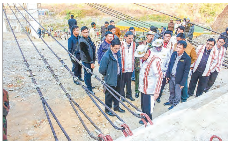
Vice President U Henry Van Thio inspects construction of the suspension bridge in Manipura.