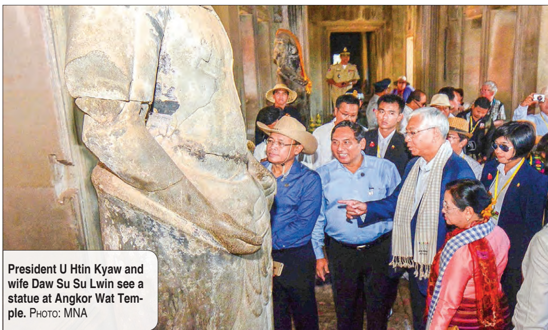
President U Htin Kyaw and wife Daw Su Su Lwin see a statue at Angkor Wat Temple.

The Artisans Angkor vocational training school, with the vision of poverty reduction, job opportunities, income generation and the preservation of Khmer tradition, was opened in 1992 for people between the ages of 18