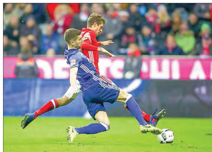
Thomas Muller of Bayern Munich in action with Matija Nastasic of Schalke during the match of German Bundesliga between Bayern Munich and FC Schalke 04 at Allianz-Arena, Munich, Germany on 4 February, 2017.

Dortmund's match with Leipzig was a stop-start affair until Dembele collected the ball near the halfway line, turned and beat Marvin Compner, then flicked the ball past Willi Orban before delivering a pinpoint pass which Aubameyang headed in for his 17th Bundesliga goal of the season. Aubameyang and Marco Reus both squandered further chances in the second half and Dortmund almost paid dearly when Palacios broke clear to fire past Roman Buerki in stoppage time only to have his celebrations cut short by the linesman's flag. —Reuters