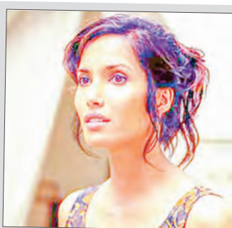
Padma Lakshmi . PHOTO: PTI

Lakshmi says it is quite a task to deal with photographers on a daily basis as they try and click pictures of not only her but also the model’s family including her six-year-old daughter, Krishna.