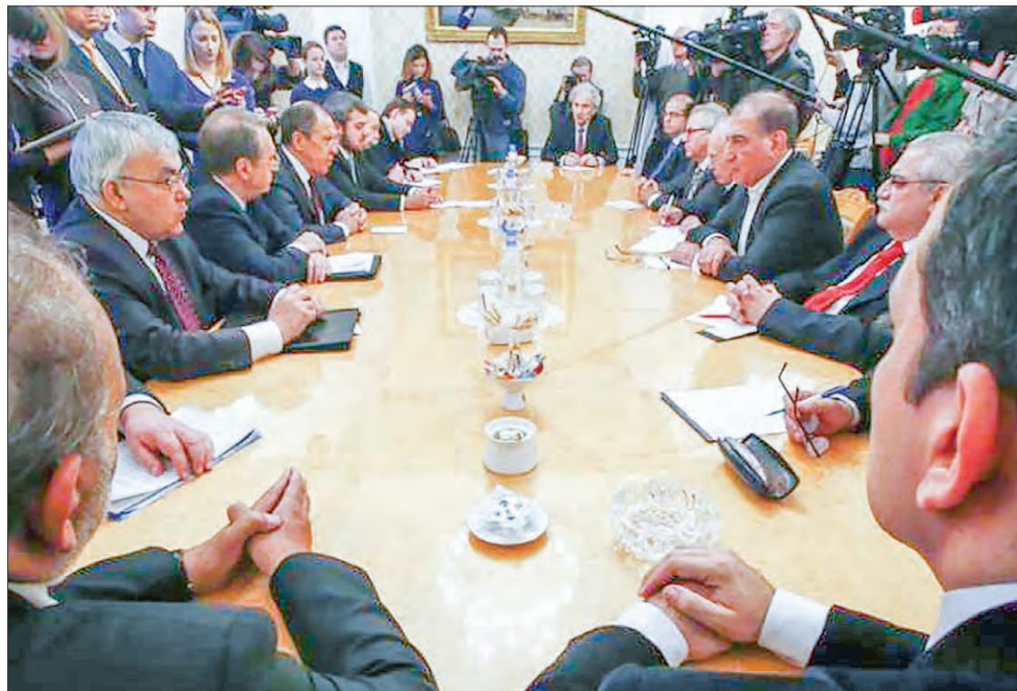
Russian Foreign Minister Sergei Lavrov meets with Syrian opposition representatives in Moscow, Russia on 27 January, 2017.

MOSCOW — Russia supports the continuation of talks on the Syrian crisis under United Nations auspices, Foreign Minister Sergei Lavrov said.