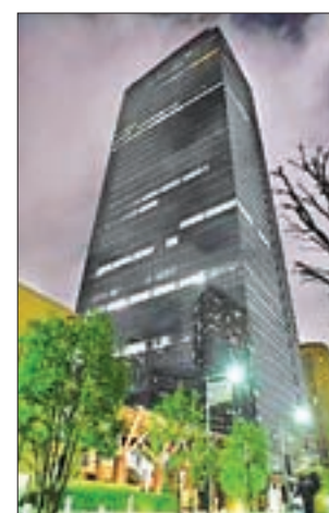
The building housing the Tokyo headquarters of H I S Co is pictured on the evening of 31 January, 2017. It was reported on 1 February that Japan's labour authorities plan to refer the major travel agency and those responsible for working hours to prosecutors on suspicion of requiring employees to do illegal overtime.