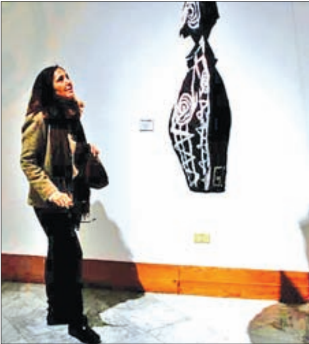
Mariela Castro, sexologist, National Assembly member and daughter of Cuba’s President Raul Castro looks at a painting on a dress by Cuban artist Jorge Perugorria during the ‘Fashion Art Havana’ exhibition in Havana, Cuba, on 31 January, 2017.

(For Detailed Schedule – www.myanmaritv.com/schedule)