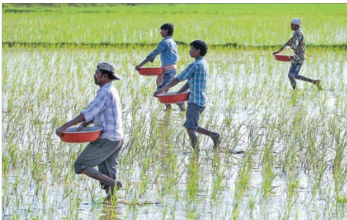
Farmers sprinkle fertilizers on a paddy field on the outskirts of Ahmedabad, India, on 1 February, 2017.

“The move should encourage more people to pay tax. The present burden of taxation is mainly on taxpayer and the salaried employees who are showing their income correctly. We also