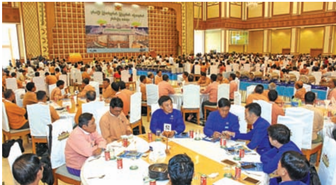
The ceremony of 1 st anniversary of the 2nd Pyidaungsu Hluttaw, Pyithu Hluttaw and Amyotha Hluttaw held in Nay Pyi Taw yesterday.

In the ceremony, Mahn Win Khaing Than, Speaker of Pyidaungsu Hluttaw and Speaker of Amyotha Hluttaw said: "The tenure of the 2nd Pyidaungsu Hluttaw, Pyithu Hluttaw and Amyotha Hluttaw that reflect the democratic appearance and essence of the Republic of the Union of Myanmar has reached one year. With effect from the very advent of the tenure