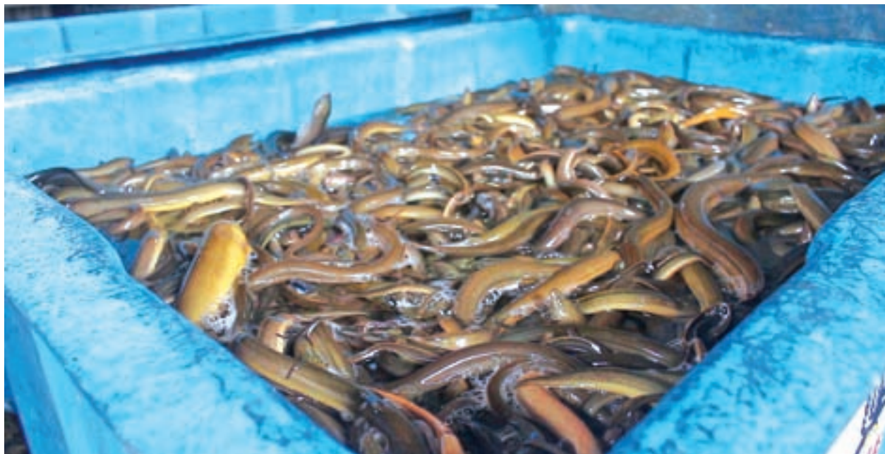
Experimental cultivation of eels conducted in the past but failed due to the high rate of eel death.

Baby eels are banned from being caught or sold in order to prevent further