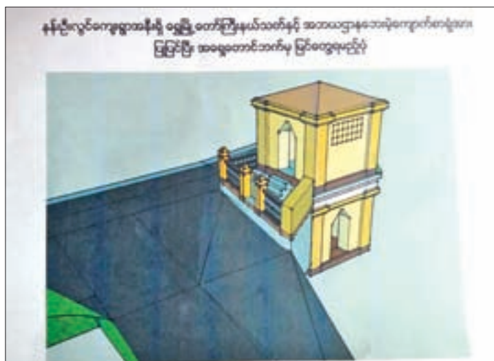
Photo shows building of Abaya Htana Bay Mae stone inscription near Nan Oo Lwin village.

The renovation was started on 25 January with the cleaning of