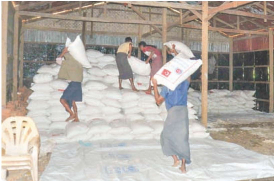
Bags of rice from Turkey are delivered to villages yesterday in Maungtaw, Rakhine State.