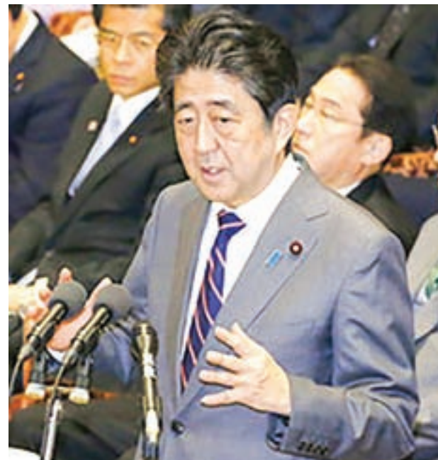
Prime Minister Shinzo Abe attends the lower house budget committee in Tokyo on 1 February, 2017. Abe said he will explain at his upcoming meeting with US President Donald Trump on 10 February how Japanese companies have contributed to overall US industry.

During his election campaign, Trump suggested Japan and other US allies need to contribute more toward the costs of stationing the US military in their countries if they want to retain the protection of the alliance. —Kyodo News