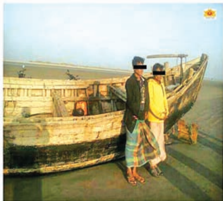
Two suspects and seized motor boat are seen in Maungtaw.

ONE 18 HP motor boat of 30 ft in length and 10 ft in width, with two men onboard, floating in the Thabyetaw Chaungwa in Maungtaw township was seized at about 6:15 pm on Tuesday night, by the combined force of government troops and police forces.