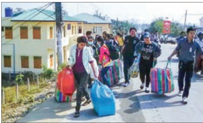
Forty-four Myanmar national sold into forced labour in Thailand have returned home.

Present at the hand-over ceremony were officials from the Ministry of Labour, Immigration and Population, the Task Force against Trafficking in Persons (Myawady), the Maternal and Child Welfare Association and the Women's Affairs Organisation.