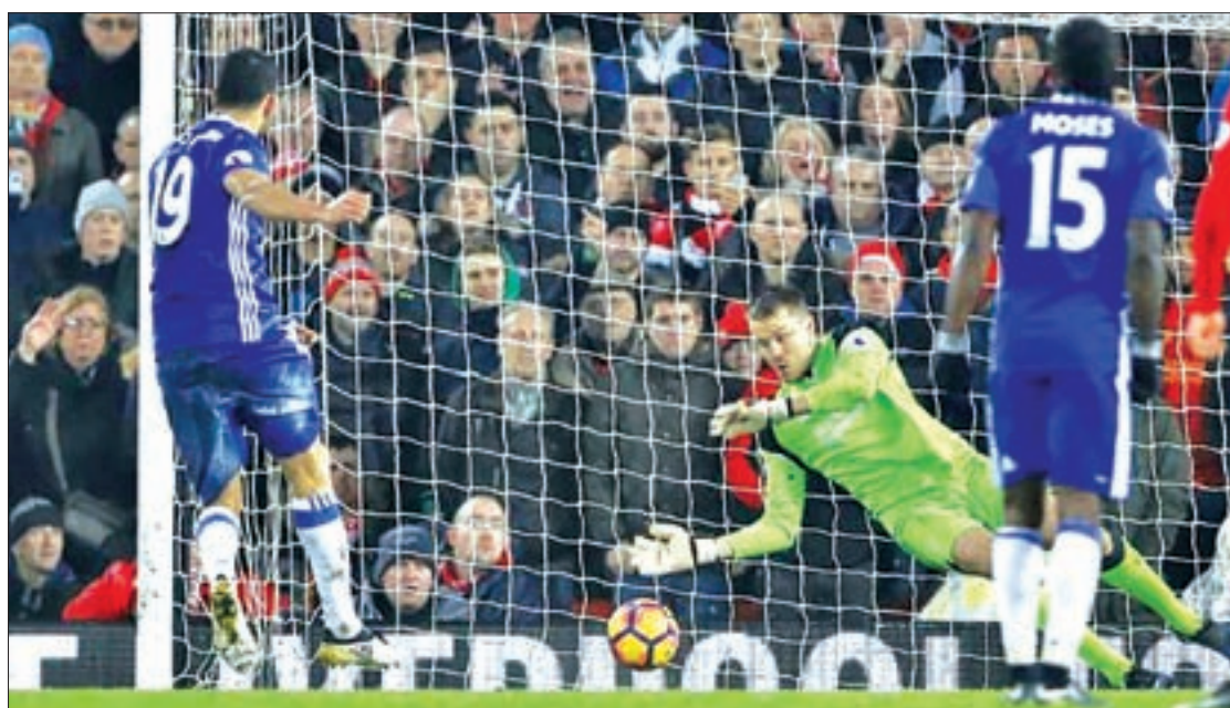
Chelsea's Diego Costa has his penalty saved by Liverpool's Simon Mignolet at Anfield on 31 January, 2017.

ing acute after Claudio Ranieri's side went down 1-0 at Burnley for whom Sam Vokes grabbed a late winner. Leicester's third consecutive league defeat left them two points off the relegation zone in 16 th place with the battle for survival hotting up after wins for Swansea City and Crystal Palace and Sunderland's battling point at home to Spurs.—Reuters