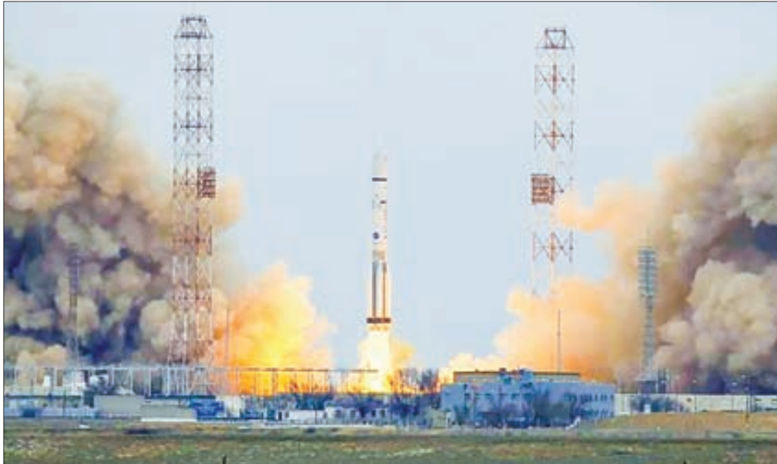
The Proton-M rocket, carrying the ExoMars 2016 spacecraft to Mars, blasts off from the launchpad at the Baikonur cosmodrome, Kazakhstan, on 14 March 2016.

MOSCOW — Russia's space agency said on Wednesday it had ordered extra checks to be made on its Proton-M rockets, meaning it might be forced to delay some satellite launches this year.