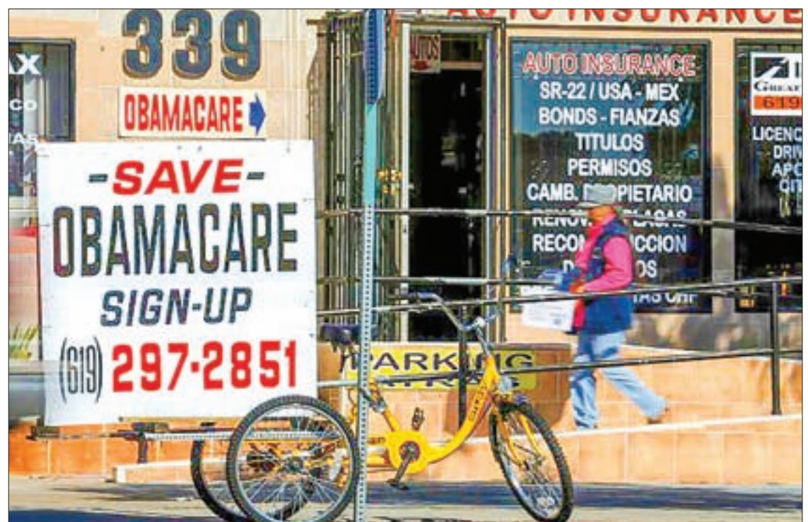
An insurance store advertises Obamacare in San Ysidro, California, US, on 25 January 2017.