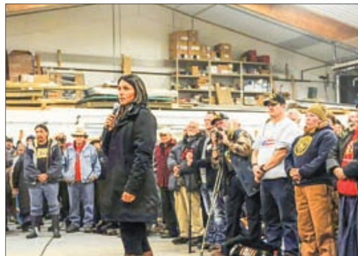
Tulsi Gabbard, Democratic Representative from Hawaii.

WASHINGTON — Democratic US Representative Tulsi Gabbard said on Wednesday she met with Syrian President Bashar al-Assad in Syria and discussed the possibility of achieving peace.