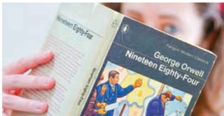
Laura Wood of Skoob Books poses for a photograph with a copy of George Orwell’s ‘1984’ in central London in 2013.