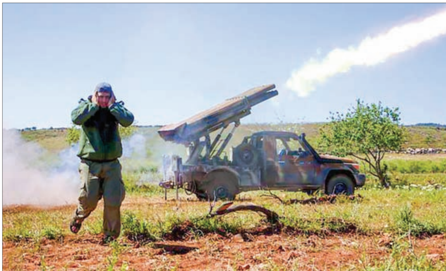
A rebel fighter from the Ahrar al-Sham Islamic Movement reacts as they fire grad rockets from Idlib countryside, towards forces loyal to Syria's President Bashar al-Assad stationed at Jureen town in al-Ghab plain in the Hama countryside, in 2015.

Ahrar al-Sham is considered a terrorist group by Moscow and did not attend the Russian-backed Astana peace talks. But it said it would support FSA factions that took part if they secured a favourable outcome for the opposition.