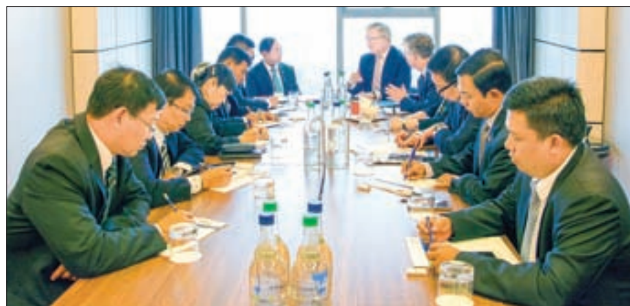
Pyithu Hluttaw speaker U Win Myint with Sir Edward Garnier are discussing legal affairs in London.

SPEAKER of Pyithu Hluttaw U Win Myint, who is currently visiting the UK, met with Sir Edward Garnier, QC Barrister, MP, at the Park Plaza Westminster Bridge Hotel in London Wednesday morning to discuss legal affairs.