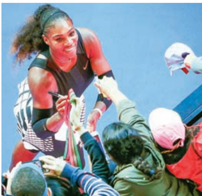
Serena Williams of the US signs autographs after winning her Women's singles semi-final match at Melbourne Park, Melbourne, Australia on 26 January 2017.

Although Serena has returned from four months out with a shoul-