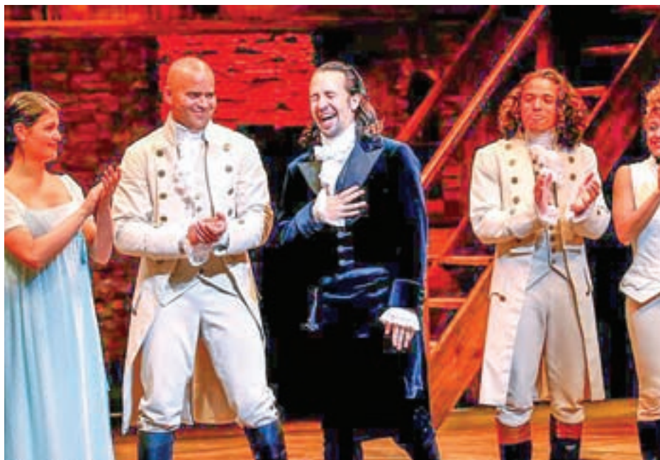
Actor Lin-Manuel Miranda (C) laughs next to cast members while greeting spectators after taking part in his last performance with Hamilton in New York in 2016.

He said this violates the Americans with Disabilities Act, which prohibits discrimination on the basis of disability in places of public accommodation, and "will continue to deter blind and visually impaired people from attending musicals." The proposed class-action lawsuit was filed in Manhattan federal court.