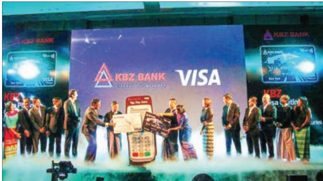
With introduction of the new Visa credit cards by KBZ Bank and Visa, customers will be able to use the card at more than 40 million outlets that accept Visa worldwide.

Customers will be able to use the card to make purchases online or around the world at more than