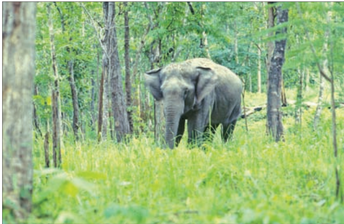
Better hope for the future of this juvenile elephant in the wild.

"Elephant conservation started with Myanmar's kings," said His Excellency U Ohn Win, Union Minister for MONREC. "The urgency now for elephant