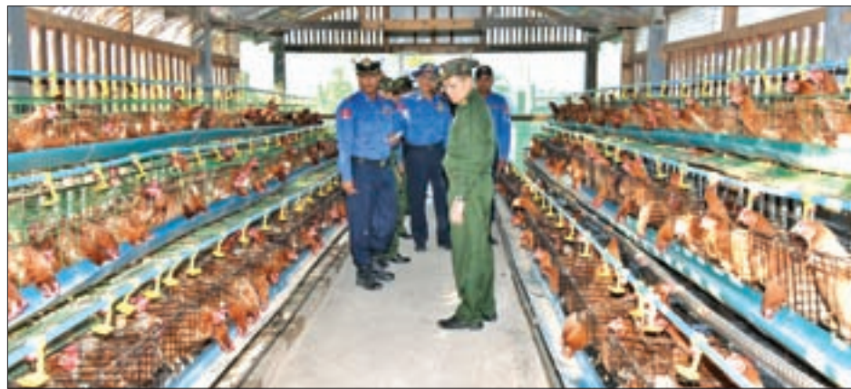
Vice-Senior General Soe Win with officers inspect poultry on Coco Island.

In the evening Vice-Senior General Soe Win met with officers, rank-and-file soldiers and families. — Myanmar News Agency