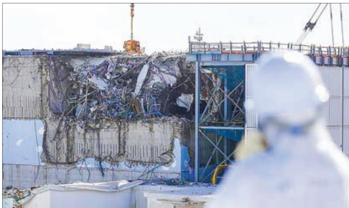
A member of the media, wearing a protective suit and a mask, looks at the No. 3 reactor building at Tokyo Electric Power Co's (TEPCO) tsunami-crippled Fukushima Daiichi nuclear power plant in Okuma town, Fukushima prefecture, Japan in 2016.

The report comes a few months after the Japanese government said in October the cost of cleaning up the Fukushima plant may rise to several billion dollars a year, adding that it would look into a possible separation of the nuclear business from the utility.— Reuters