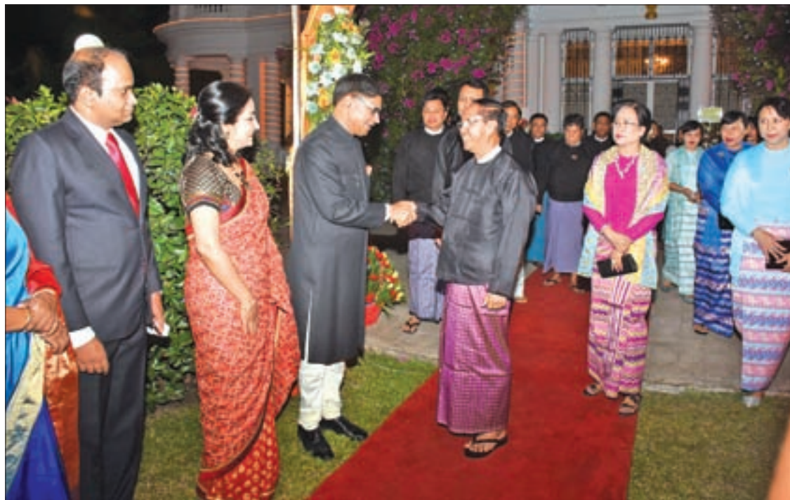
Vice President U Myint Swe is welcomed by Indian Ambassador Mr Mr Vikram Misri.

Then, the Vice President and the Indian ambassador to Myanmar posed for a documentary photo, together with those present at the ceremony. Afterwards, the Indian Ambassador and wife hosted a dinner for the Vice President and wife and invited guests.— Myanmar News Agency