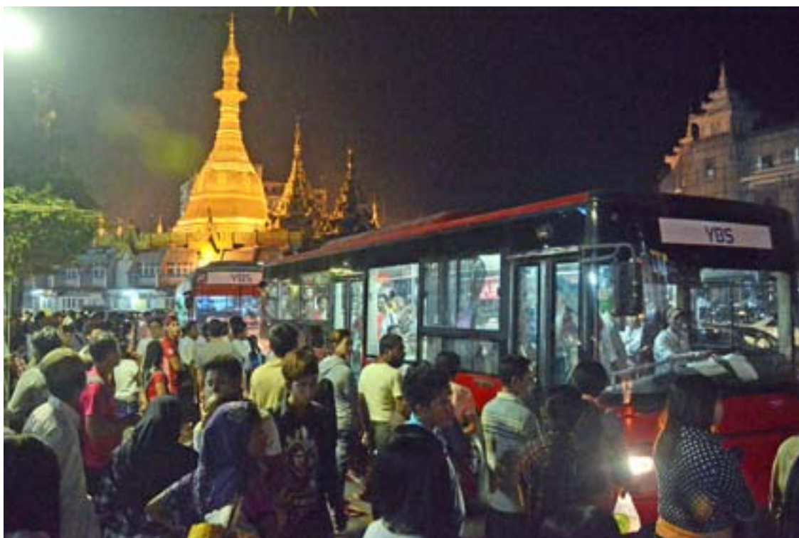
Commuters are waiting to take a bus at Sule bus-stop in downtown Yangon.

The Yangon Region Transport Authority announced its