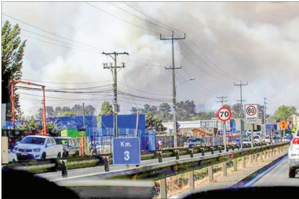
Smoke from the forest fire is seen from the town of Penco in the Concepcion region, south of Chile, on 25 January 2017.

International help from France, the United States, Peru and Mexico has been pouring into Chile as the fires swept through forested hills and into neighboring towns, scorching homes, industry and the region's world-renowned