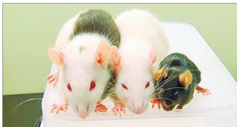
Undated supplied photo shows (from L to R) a rat with mouse stem cells, an ordinary rat and an ordinary mouse.