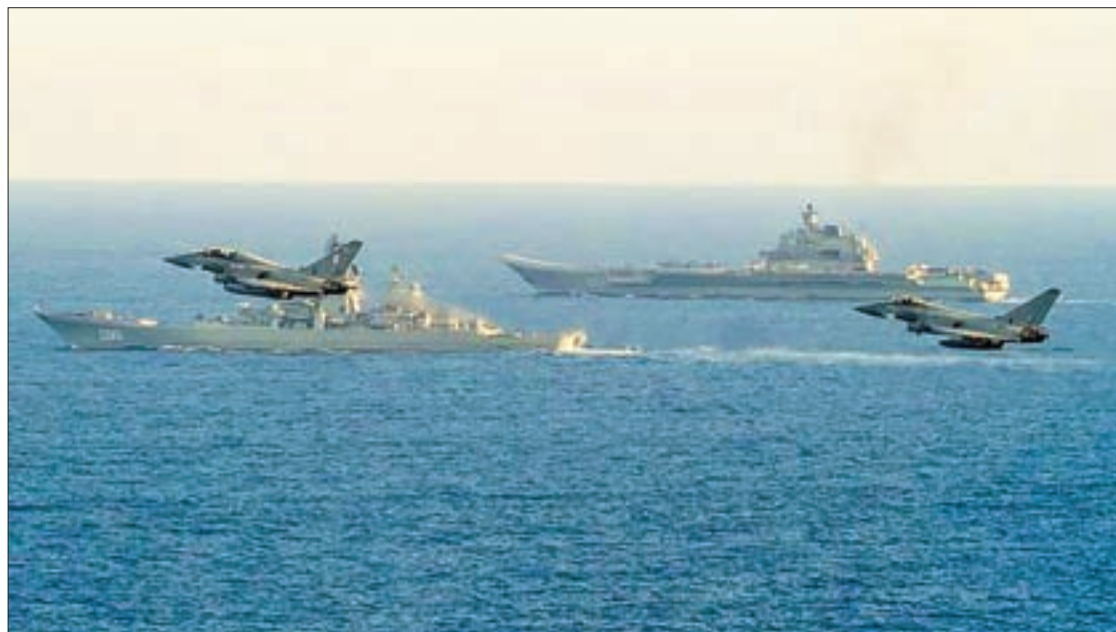
RAF Typhoons monitor Russian warships Pyotr Velikiy and the Admiral Kuznetsov (rear) as they pass close to UK territorial waters, in this photograph released in London, on 25 January 2017.