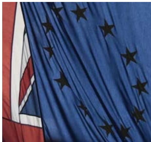
A Union flag flies next to the flag of the European Union in London, Britain, on 24 January 2017.

BRUSSELS — Since Prime Minister Theresa May set out her Brexit goals last week, interest in Britain has focused on the future trade deals she may one day strike with the United States and other powers, as well as with the European Union.