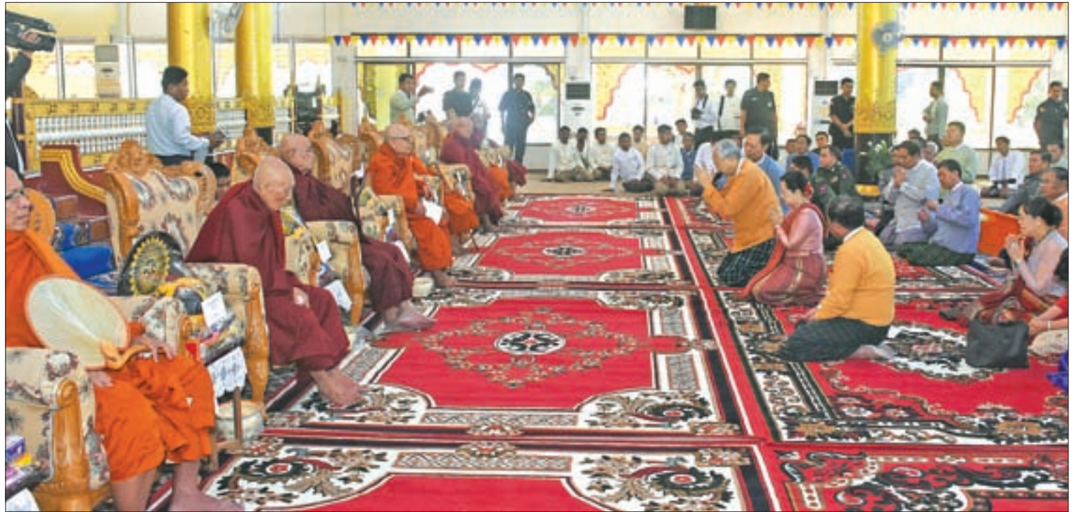
President U Htin Kyaw and wife, pay respect to the Sayadaws in Mandalay.

Then, the President, his wife and party donated offertories to the Sayadaws.— Myanmar News Agency