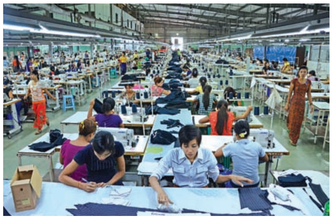
A file photo shows workers seen on a production line at a garment factory in Hlinethaya.

Formed in 2015 with 21 original shareholders, MAEX has a capitalisation of Ks15. 72billion. The company, which is engaged mainly in construction, is developing the fruits, vegetables and flowers wholesale market and also preparing for opening of cold storage warehouses. -Myitmakha News Agency