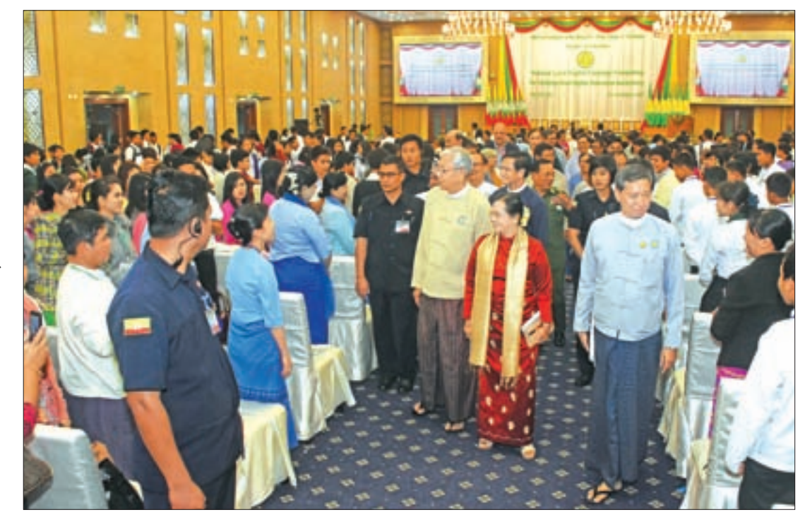
President U Htin Kyaw and first lady Daw Su Su Lwin attend prize presentation ceremony for English Language Proficiency at MICC-II in Nay Pyi Taw.

In addition, the union minister pointed out that it is impossible for anyone to be competent in all disciplines, as the speed of the progress of knowledge is very fast, but some people expect that graduate people are knowledgeable in their chosen area of