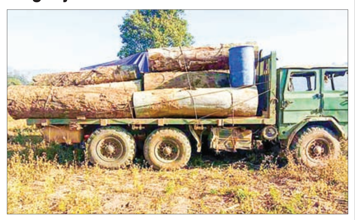
Photo shows confiscated illegally-cut timbers and truck.

UPON learning that illegally-cut timbers were being smuggled out along the "Shweli" riverine route, Tatmadaw troops and Myanmar Police made an area clearance operation, seizing 359 tonnes of various timber and 70 trucks, according to a news release from the Office of the Commander-in-Chief of the Defence Service.