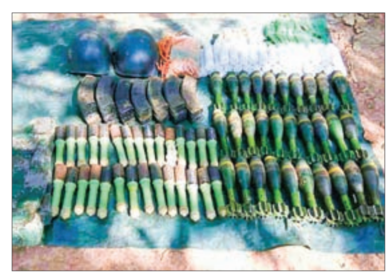
Ammunition seized in Shan state.

TATMADAW columns seized ammunition on Sunday morning near Kyugok (Panghsai) town, east northern Shan State