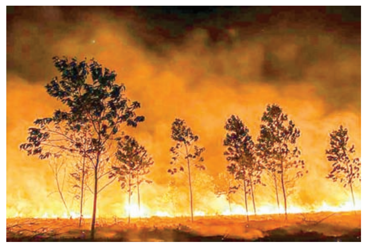
Trees burn during a fire in Pekanbaru, Indonesia Riau province, Indonesia, on 18 January, 2017.

"We hope that at the beginning of this year there is planning and quick action (so) we can prevent forest and land fires in 2017," Widodo said.