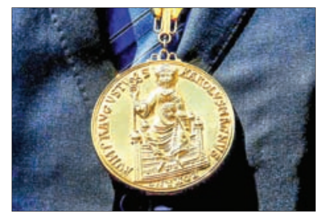
European Parliament President Martin Schultz wears the Charlemagne Prize medal during a news conference in Rome, Italy, on 6 May, 2016.

The price is named for Charlemagne, the eighth to ninth century Frankish ruler who carved out a European empire. —Reuters