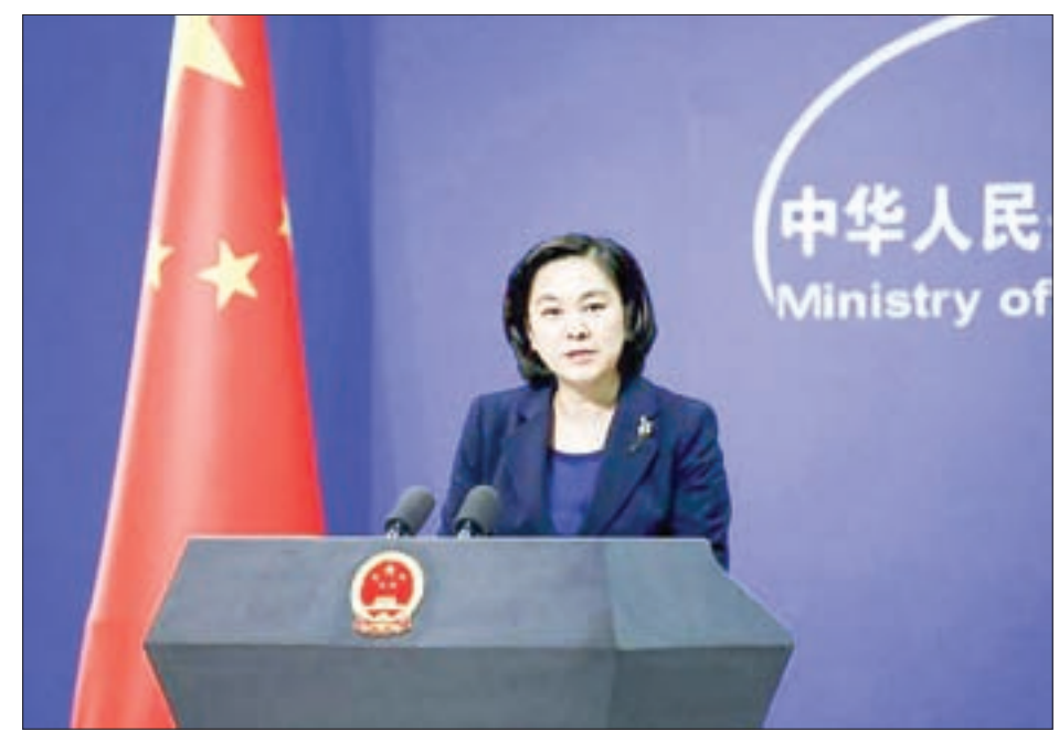
Hua Chunying, spokeswoman of China's Foreign Ministry, speaks at a regular news conference in Beijing, China, on 6 January, 2016.

Tillerson's remarks at his Senate confirmation hearing prompted Chinese state media to say at the time that the United States would need to "wage war" to bar China's access to the islands, where it has built military-length air strips and installed weapons sys-