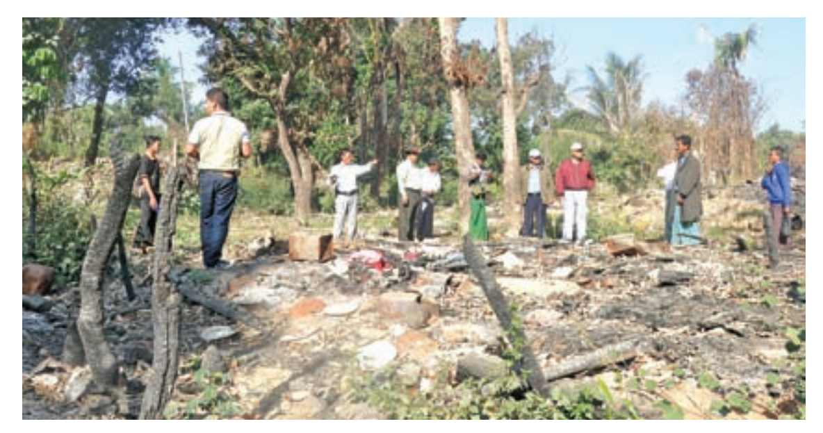
Authorities and locals check sites of homes which were burnt down during recent violent attacks by armed attackers.

PLANS are underway to make Warpeik, which was burnt down during recent violent attacks, into a model village.