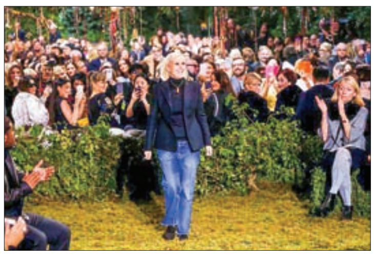
Italian designer Maria Grazia Chiuri appears at the end of her Haute Couture Spring/Summer 2017 fashion show for Dior in Paris, France, on 23 January, 2017.

At her debut ready-to-wear line for Dior in September, Chiuri showcased an eclectic collection, mixing "sport couture", street style and fairytales, for the brand looking to appeal to young fashionistas.—Reuters