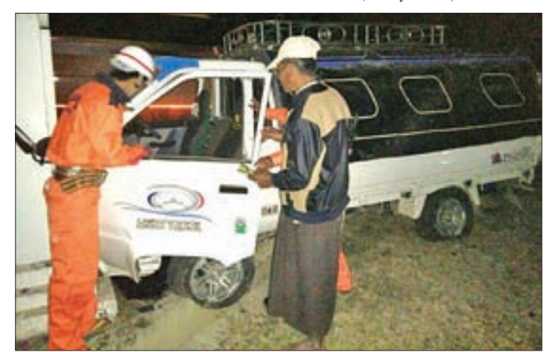
Highway police inspect the light truck on Ygn-Mdy Highway.

Police have taken action against the driver under section 337/338 of the Penal Code.— Than Oo (Lemyethna)