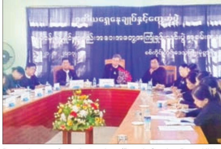
Deputy Attorney-General meets law officers in Sagaing.

Besides, he also urged the officers to carry out the tasks dutifully in the upcoming by-election.— GNLM