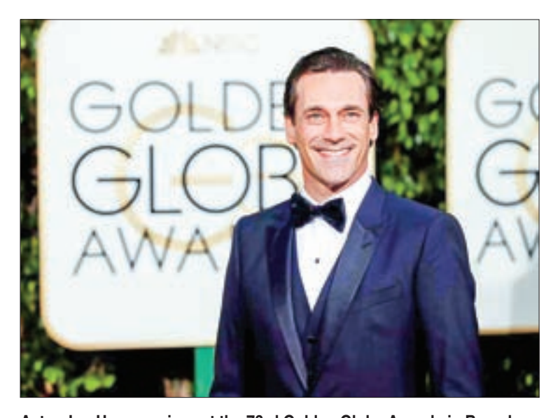
Actor Jon Hamm arrives at the 73rd Golden Globe Awards in Beverly Hills, California January 10, 2016.

at the Sundance Film Festival can use augmented reality (AR) to hang out with "Mad Men" star Jon Hamm or assemble a human brain, as makers of the new immersive technology seek to engage independent filmmakers.