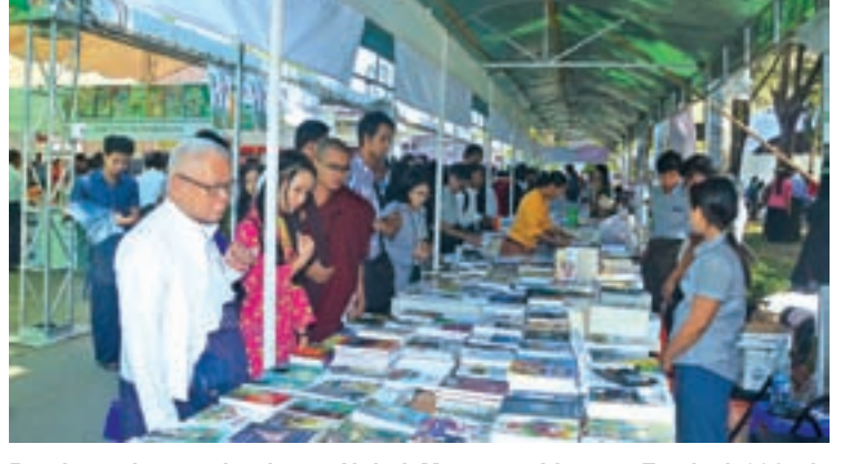
Readers observe books at Nobel Myanmar Literary Festival 2017 in Yangon.

The festival came to an end in the evening successfully.—Yee Yee Myint & Ohnmar Thant