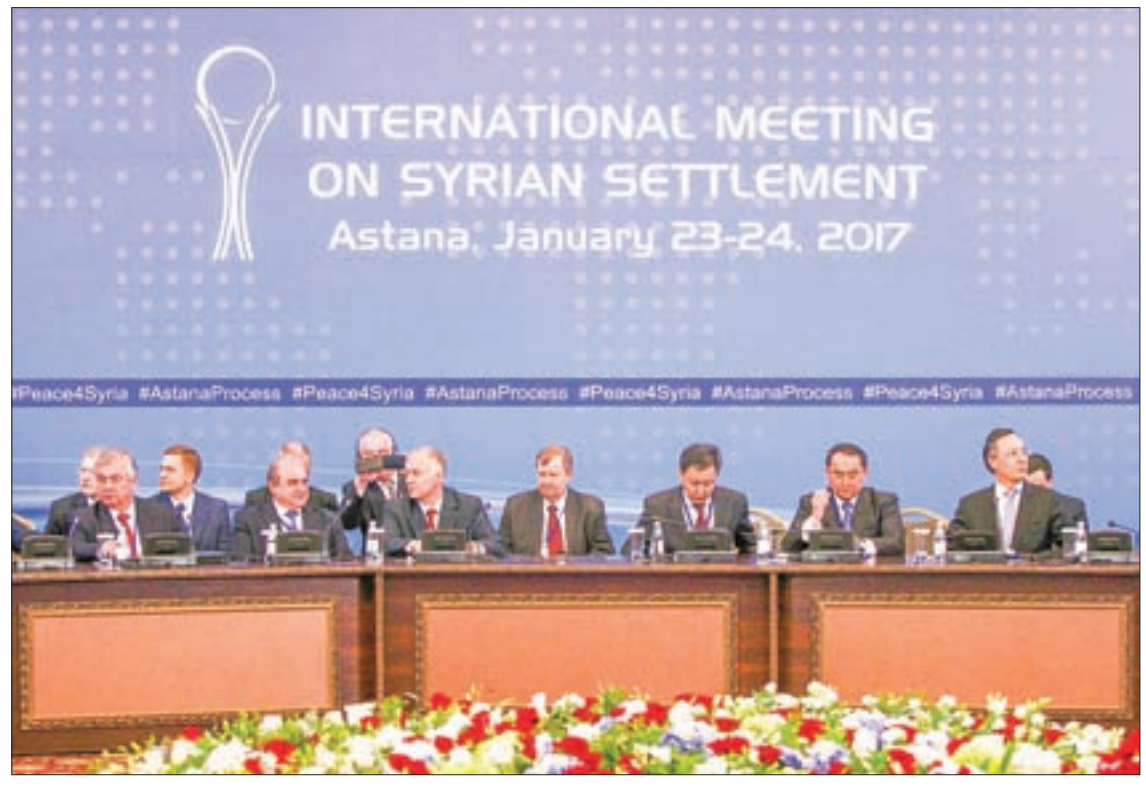
Participants of Syria peace talks attend a meeting in Astana, Kazakhstan on 23 January, 2017.

UN Special Envoy for Syria Staffan de Mistura, attending the Astana talks, said the three powers were closing in on a final statement that would reaffirm and