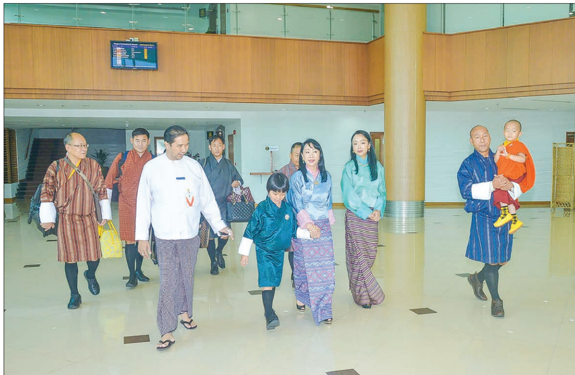
Royal delegation from Bhutan led by Royal Queen Mother Ashi Dorji Wangmo Wangchuck is welcomed by officials at the Yangon International Airport.