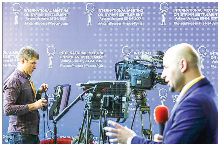
Reporters work in the media center set for Syria peace talks, in Astana, Kazakhstan, on 23 January, 2017.