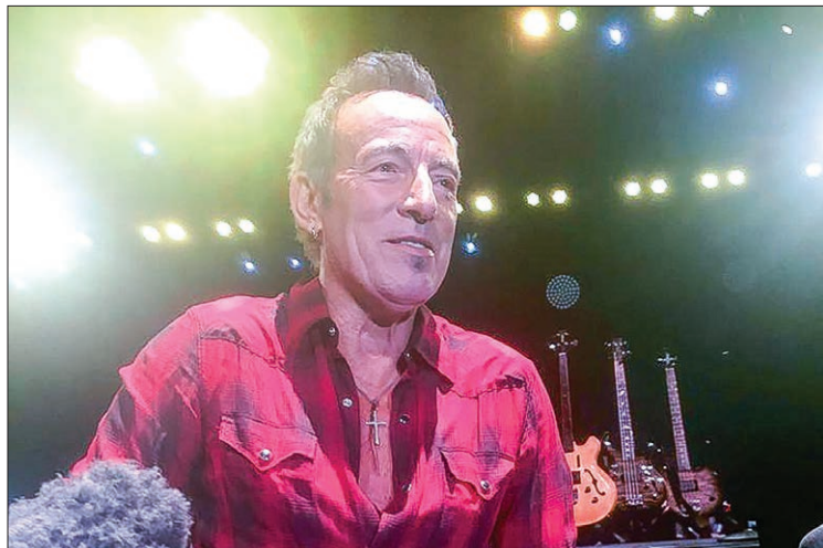
US entertainer Bruce Springsteen speaks during a media conference ahead of his first Australian show in Perth, Australia, on 22 January, 2017.