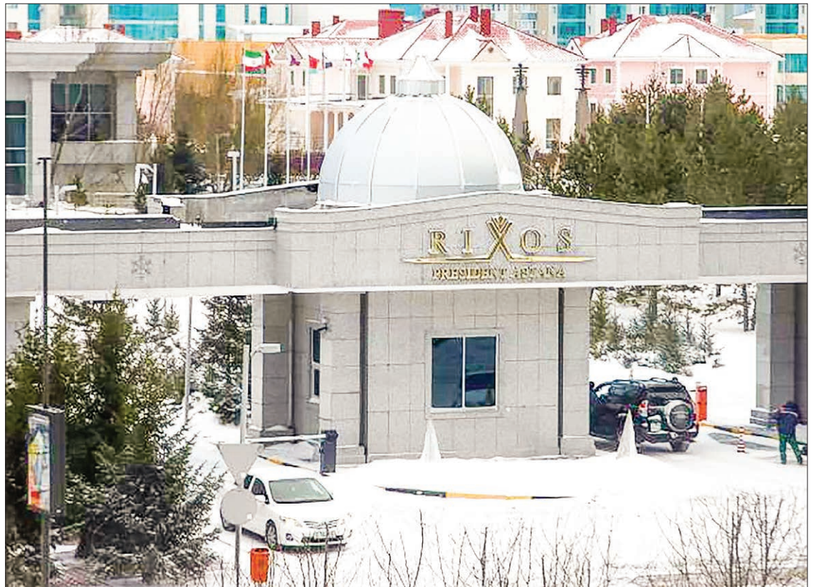
A car is parked in front of Rixos President Hotel, the venue that hosts Syria peace talks, in Astana, Kazakhstan, on 23 January, 2017.