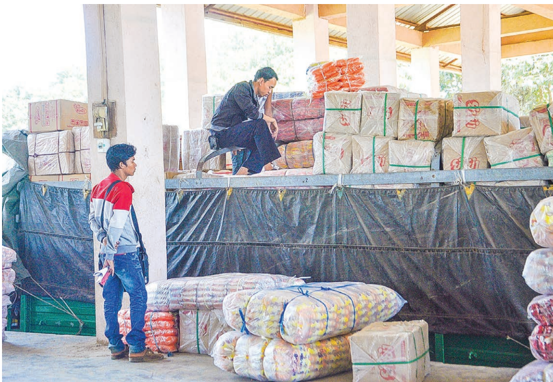
A file photo shows merchants check the goods at 105-mile Muse Trade Zone, northern Shan State.