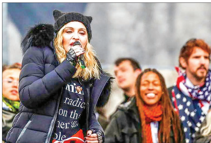
Madonna performs at the Women’s March in Washington US, on 21 January, 2017. PHOTO: REUTERS

Turnout for Saturday’s march was unprecedented, as organizers took credit for mobilizing 5 million marchers worldwide.— Reuters