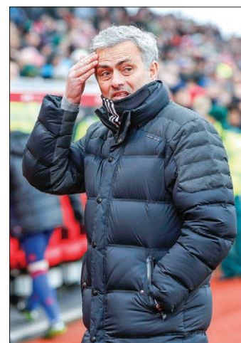
Manchester United manager Jose Mourinho.

"No, and I think with Wayne it's the same... It's him, his family and his decision. But, of course, I see him with an important contribution for us.