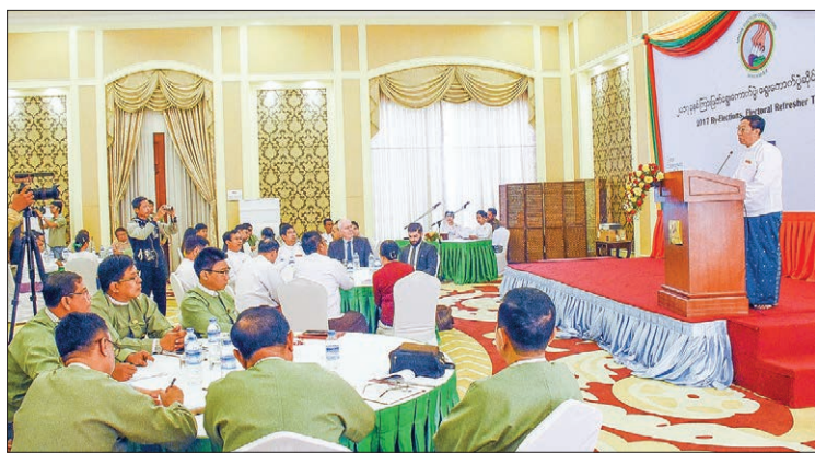
Union Election Commission Chairman U Hla Thein addresses the refresher course for election sub-commission.

The trainees will conduct on to wards and village-tracts' sub-commissions, in-charges and members of the voting booths, according to the UEC.— Myanmar News Agency