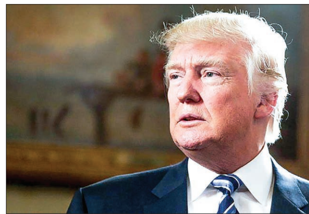
US President Donald Trump speaks during the Inaugural Law Enforcement Officers and First Responders Reception in the Blue Room of the White House in Washington, US, on 22 January, 2017.

democratic Taiwan shows not interest in being ruled by Beijing.