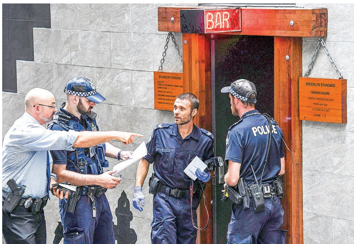
Australian police talk outside a bar as they investigate whether live firearms were used in the filming of a music video during which an actor was fatally wounded in the chest in Brisbane, Australia, on 23 January, 2017.

No further details were immediately available. Long-running Australian band Bliss n Eso have had several local hits, including their latest single, “Dopamine”. Their sixth album is due out later this year. —Reuters