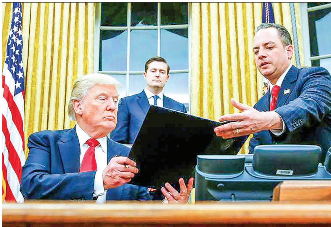
US President Donald Trump hands Chief of Staff Reince Priebus (R) an executive order that directs agencies to ease the burden of Obamacare, after signing it in the Oval Office in Washington, US on 20 January, 2017.

WASHINGTON — The White House vowed on Sunday to fight the news media “tooth and nail” over what it sees as unfair attacks, with a top adviser saying the Trump administration had presented “alternative facts” to counter low inauguration crowd estimates.