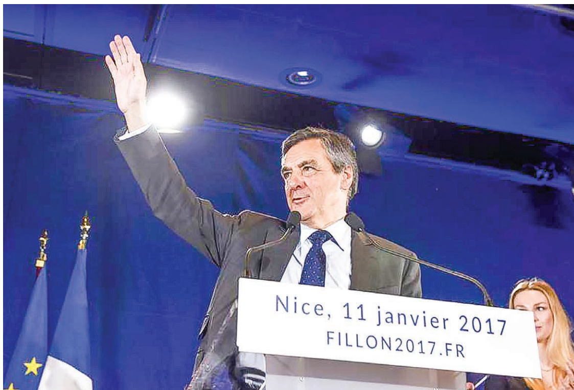
Francois Fillon, member of Les Republicains political party and 2017 presidential candidate of the French centre-right, attends a political rally in Nice, France, on 11 January, 2017.