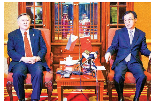
Philippine Finance Secretary Carlos Dominguez and China's Commerce Minister Gao Hucheng address reporters after their meeting in Beijing, China, on 23 January, 2017.

Asked whether US President Donald Trump's economic policies would affect commercial ties between China and the Philippines, Dominguez said: "It's better to be with good friends."—Reuters