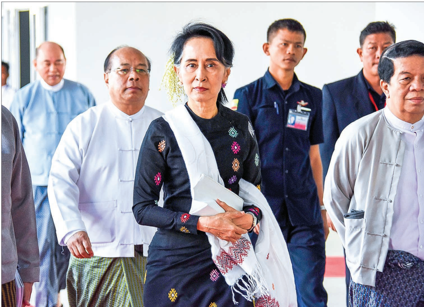
Daw Aung San Suu Kyi, centre, in Nay Pyi Taw yesterday prior to her meetings with representatives of armed groups.

STATE Counsellor Daw Aung San Suu Kyi held talks with the Peace Process Steering Team (PPST) of armed groups in Nay Pyi Taw yesterday over several issues related to the peace process.