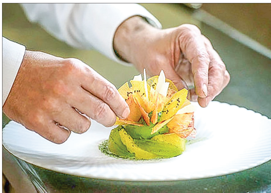
Supplied photo shows a French dish infused with luxury Uji green tea.

According to the Japanese Association of Tea Production, green tea consumption in Japan fell to about 78,000 tons in 2015 from around 116,000 tons in 2004 as coffee's popularity