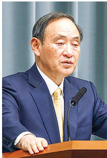
Japanese Chief Cabinet Secretary Yoshihide Suga attends a press conference in Tokyo on 23 January, 2017.

TOKYO — Japan will “take every opportunity” to appeal to US President Donald Trump about the merits of remaining a party to the Trans-Pacific Partnership trade deal he has promised to dump, the government’s top spokesman said on Monday.