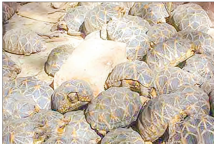
Myanmar star tortoises, a critically endangered species, are found mostly in arid climates. PHOTO: TAINAMAN

Forest fires, the destruction of their habitats and illegal commercial trading are the main reason star tortoises have been brought close to extinction. There are three protected areas for the rare and beautiful star tortoises in the country: Lawkananda Wildlife Sanctuary in Bagan; Shwesettaw Wildlife Sanctuary in Minbu Township and Minsontaung Wildlife Sanctuary in Natogyi Township. The Myanmar star tortoises are characterised by the highly distinctive star or radiating patterns on their upper shell. Males are distinguished from the females by a much thicker and longer tail.— Taintaman