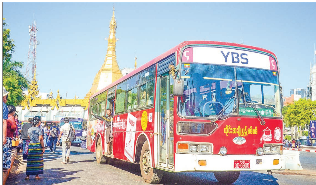
YBS bus runs near Sule Pagoda in Yangon.