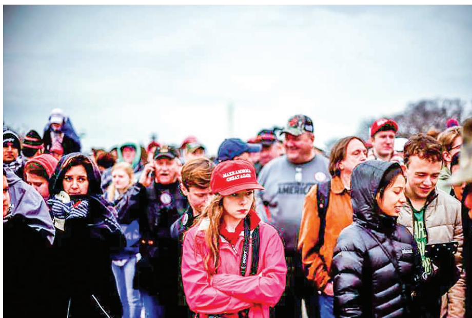
The crowd on the National Mall reacts during the inauguration of US President Donald Trump in Washington, US, on 20 January, 2017.

But they are also more expensive than the $20 versions sold by street vendors