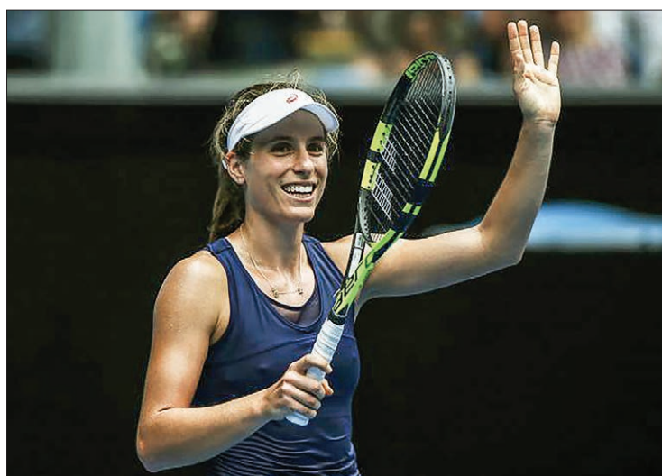
Britain's Johanna Konta celebrates winning her Women's singles fourth round match against Russia's Ekaterina Makarova at Melbourne Park in Melbourne, Australia on 23 January, 2017.

"It's an incredible honour and I will cherish every moment out there."