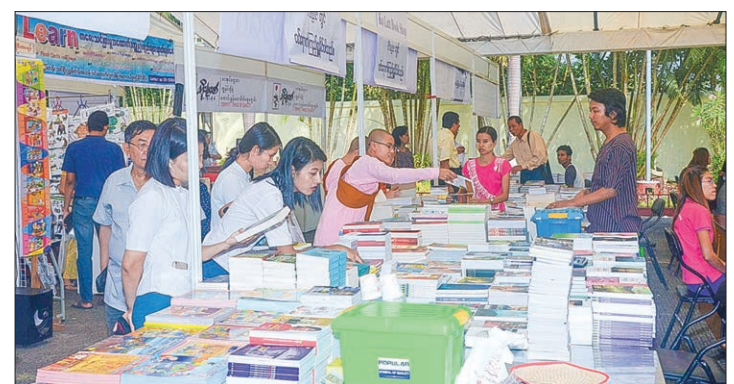
Bookshops are crowded with visitors on the second day of the Nobel-Myanmar Literary Festival in Yangon.

It is learnt that those present at the festival are being entertained with foodstuff and coffee and monhinkha.