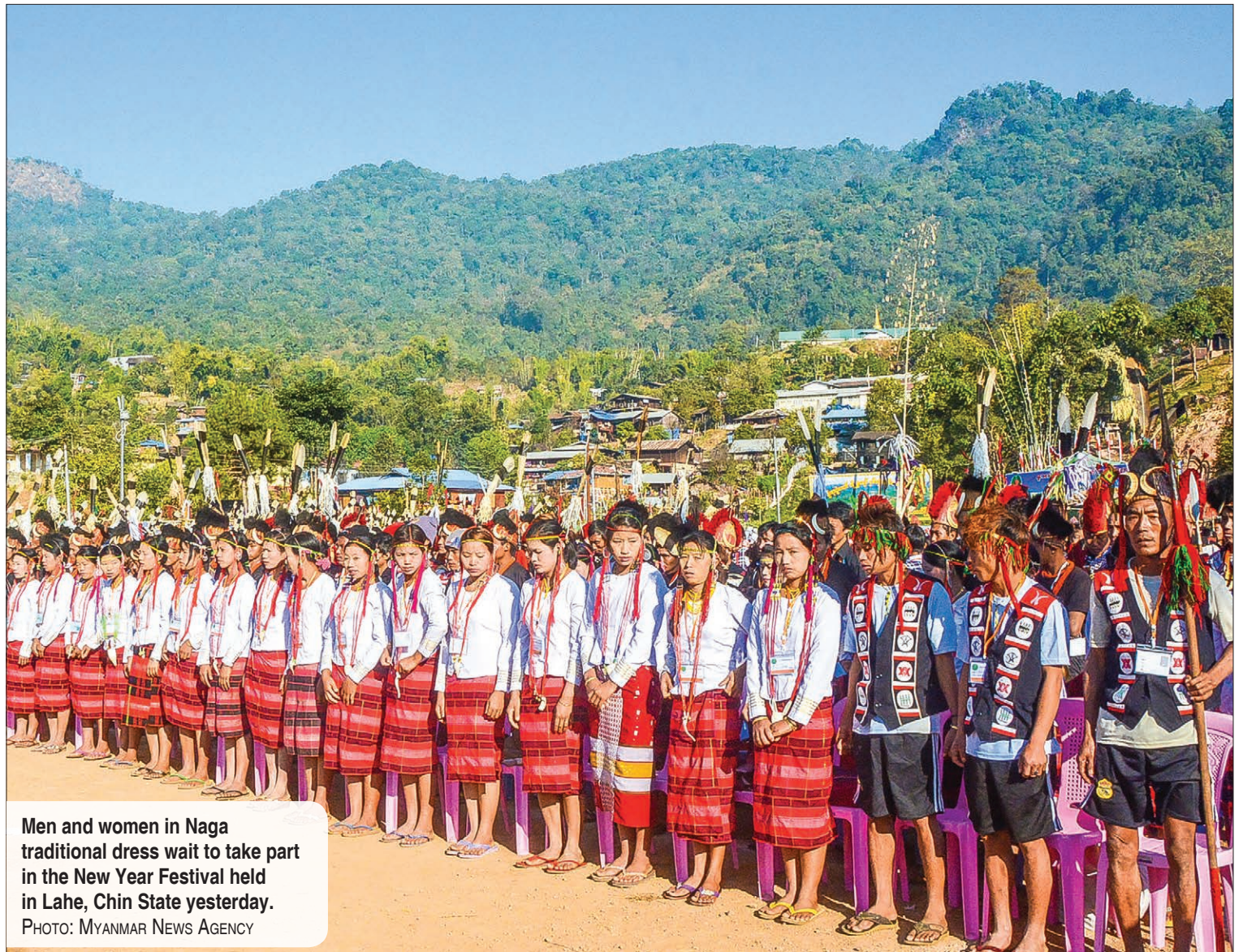
Men and women in Naga traditional dress wait to take part in the New Year Festival held in Lahe, Chin State yesterday.