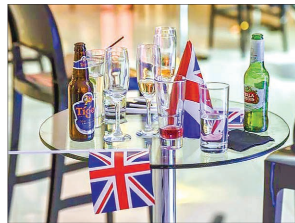
Union flags and a paper hat lie on a table with empty glasses at a Leave.eu party, as votes are counted for the EU referendum, in London, Britain on 24 June, 2016.