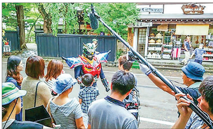
The Thai TV series Miraigar T1 is shot in Kakunodate, Akita Prefecture, on 6 September, 2016.

AKITA — A Japanese hero character created in the aftermath of the 2011 Great East Japan Earthquake and tsunami is growing in popularity in Thailand through a television program broadcast in the Southeast Asian nation.