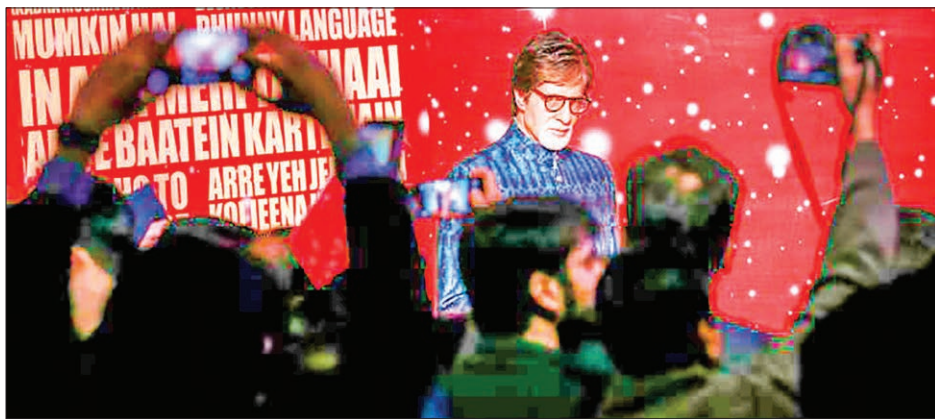
People take pictures of a waxwork of Bollywood actor Amitabh Bachchan at a photocall for the new Madame Tussaud's waxwork museum in New Delhi, India on 12 January, 2017.