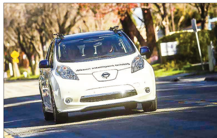
An autonomous drive Nissan Leaf drives during a media preview of autonomous Renault-Nissan Alliance vehicles in Sunnyvale, California on 7 January 2016.

In October the firm, which builds around a third of Britain's total car output, said it would expand production at its plant in northeast England with what a source described as a government promise of extra support to counter any loss of competitiveness caused by Britain's EU exit. —Reuters