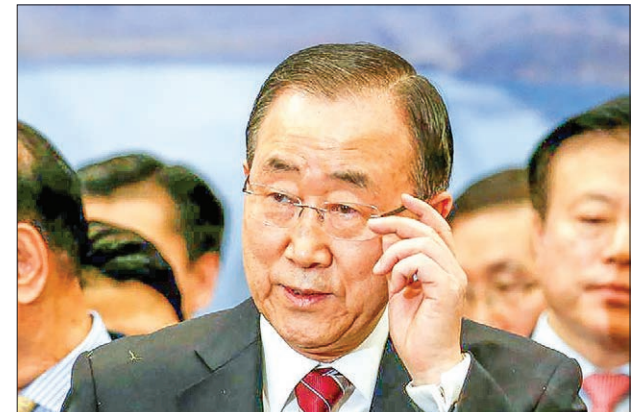
Former UN chief Ban Ki-moon speaks during a news conference upon his arrival at the Incheon International Airport in Incheon, South Korea, on 12 January, 2017.

"There is the issue of relations with neighbouring countries. This problem can be solved diplomatically," Ban said, according to Yonhap. Ban returned to South Korea on Thursday after his decade at the helm of the global body ended in December. He has yet to say whether or not he will run for president.—Reuters