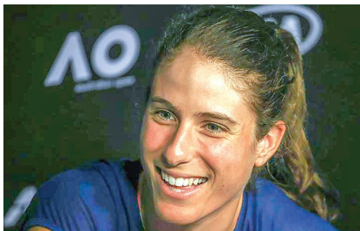
Britain's Johanna Konta reacts during a news conference ahead of the Australian Open tennis tournament in Melbourne, Australia, on 15 January, 2017.

The chatter reached fever pitch last Friday, however, when Konta simply demolished world number three Agnieszka Rad-