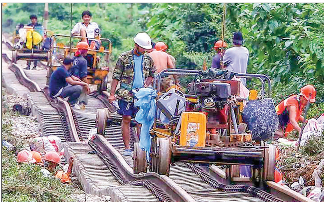
Workers stand by a flood-damaged train line in Bang Saphan Workers stand by a flood-damaged train line in Bang Saphan district in Prachuap Khiri province, Thailand on 11 January, 2017.

The rainy season in Thailand normally takes place from June to November. The floods, which began on January 1, have followed