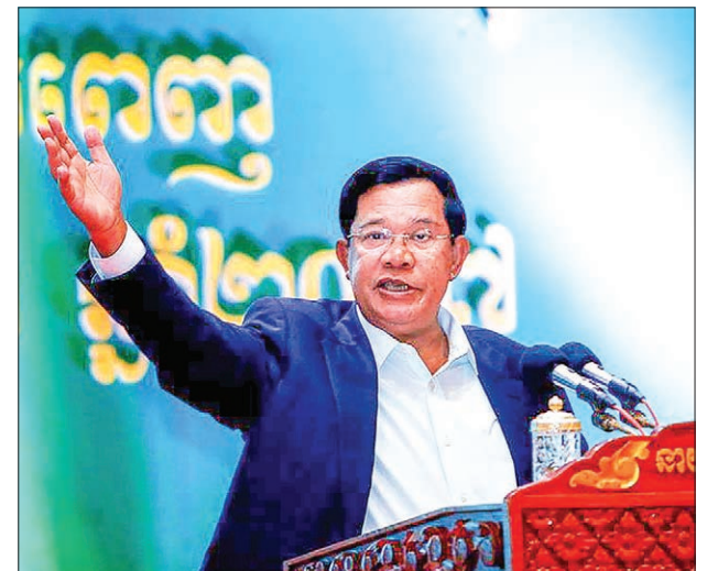
Cambodian Prime Minister Samdech Techo Hun Sen addresses to local journalists in Phnom Penh, Cambodia, on 14 January, 2017.

He added that journalists must dare to make corrections if they had re-