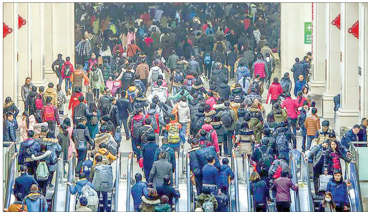
Passengers access to Hankou Railway Station in Wuhan, capital of central China's Hubei Province, on 13 January 2017.

Obesity and heavy drinking are major causes of heart disease, diabetes and other chronic health problems affecting millions of people worldwide. Public Health England said last month that eight out of 10 middle-aged adults in Britain either weigh too much, drink too much or exercise too little. —Reuters