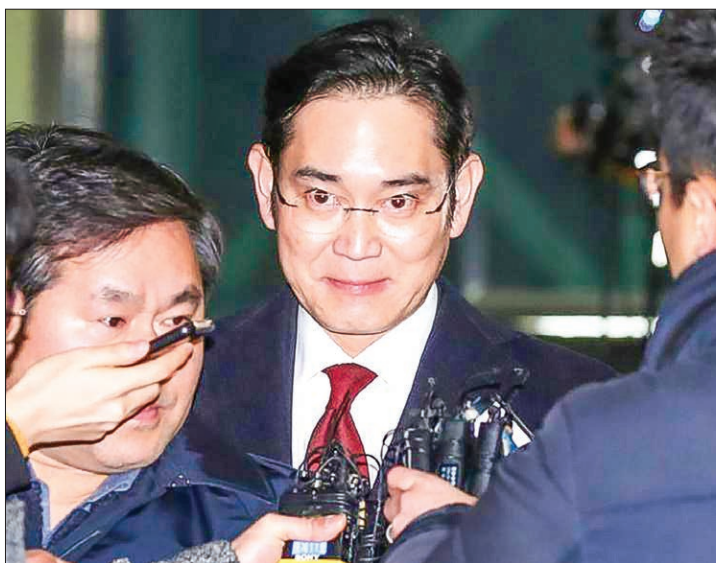
Samsung Electronics vice chairman Jay Y Lee is surrounded by media as he leaves the office of the independent counsel in Seoul, South Korea, on 13 January, 2017.

Prosecutors have been investigating whether Samsung provided 30 billion won ($25.46 million) to a business and foundations backed by President Park Ge-