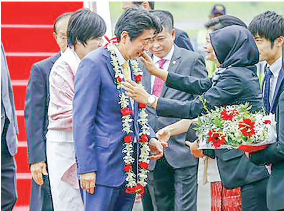
Japanese Prime Minister Shinzo Abe (C) is welcomed at Indonesia’s international airport in Jakarta on 15 January, 2017. Abe met with President Joko “Jokowi” Widodo later that day.

Japan views Indonesia, with the world’s fourth-largest population and high economic potential, as a major power in the 10-member Association of