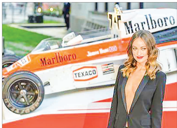
Actress Olivia Wilde.