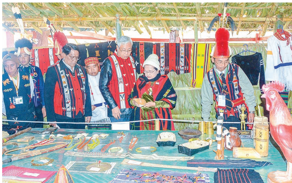
President U Htin Kyaw and wife, centre, visit a booth in Lahe displaying traditional ornaments and utensils of the Naga people.