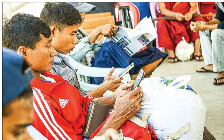
Passengers use mobile phones as they take a ferry in the Yangon River.

The telecoms sector is projected to support 5 per cent of Myanmar's GDP in five years, with increasing FDI entering, according to the existing three operators