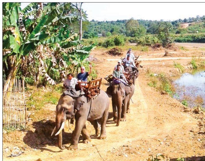
Tourists ride elephants at Thitgatoeeing Elephant Camp. (News on page ).