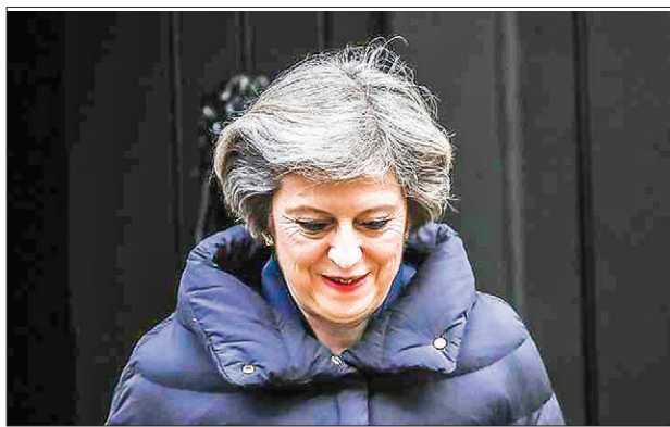
Britain's Prime Minister Theresa May leaves Downing Street in London, Britain on 11 January, 2017.

the need for Britons, who voted for Brexit by 52 to 48 percent in last June's referendum after a deeply divisive campaign, to unite around common goals such as protecting and enhancing workers' rights.