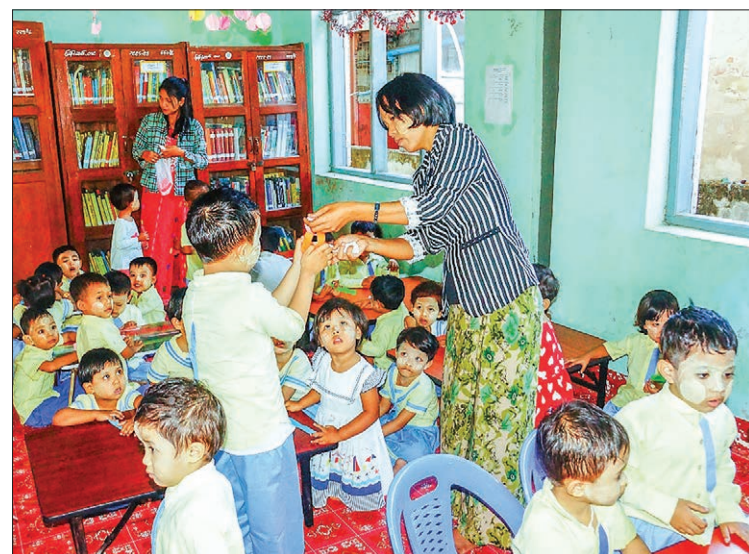
Children being seen at the Taungoo District Public Library of IPRD. PHOTO: SHWE WIN (PYAY)

The Taungoo District IPRD has arranged a reading room in the library with the aim of developing the intellectual curiosity of children, supporting their creativity, expanding their knowledge and providing relaxation. — Shwe Win (Pyay)