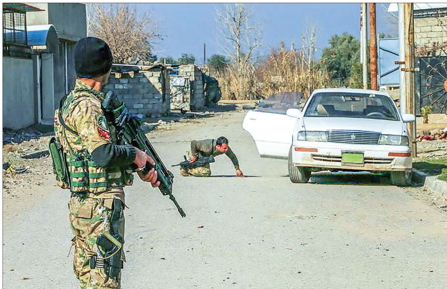
Iraqi rapid response forces inspect a car during a battle with Islamic State militants in the district of Yarimja in southern Mosul, Iraq, on 14 January, 2017.