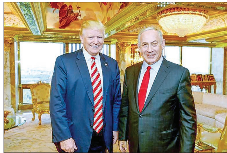
Israeli Prime Minister Benjamin Netanyahu (R) stands next to Republican US presidential candidate Donald Trump during their meeting in New York, on 25 September, 2016.

Reuters reaffirms existing international resolutions, urges both sides to restate their commitment to the two-state solution and disavow officials who reject it, and asks the protagonists to “refrain from unilateral steps that prejudice the outcome of final status negotiations”.