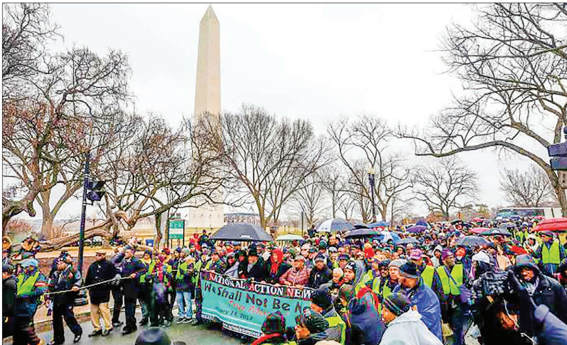
Activists march during the National Action Network's 'We Shall Not Be Moved' march in Washington, DC, US, on 14 January, 2017.

WASHINGTON — US civil rights activists vowed on Saturday to defend hard-fought gains in voting rights and criminal justice during the presidency of Donald Trump, kicking off a week of protests ahead of the Republican's inauguration.