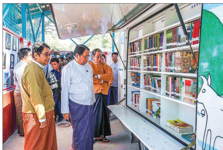
Union Minister Dr Pe Myint, centre, visits a mobile library.

that the Ministry of Information is an entity that would cooperate with any organisation anywhere in the world that has shared values, wishes and interests. But the