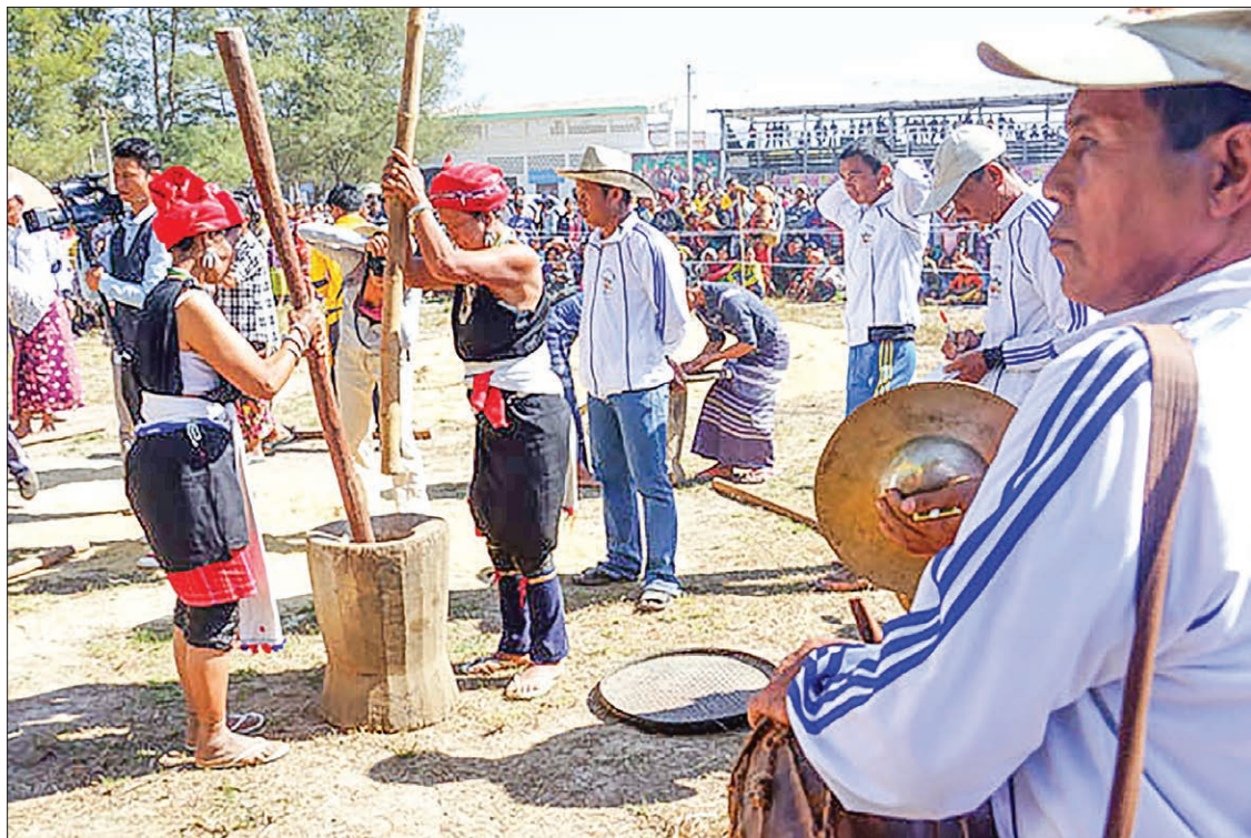
Kayah ethnic people traditional 65 th Anniversary of Kayah State Day.

THE 65 th Anniversary of Kayah State Day, 2017, was held at Granite Square in Kandahaywun Park in Loikaw yesterday, with the presence of Amyotha Hluttaw Speaker U Man Win Khaing Than, Union Minister for Ethnic Affairs U Naing Thet Lwin, Chief Minister of Kayah State U L Phaung Sho, Speaker of the State Hluttaw U Hla Htwe, the deputy speaker of the State Hluttaw, state-level of-