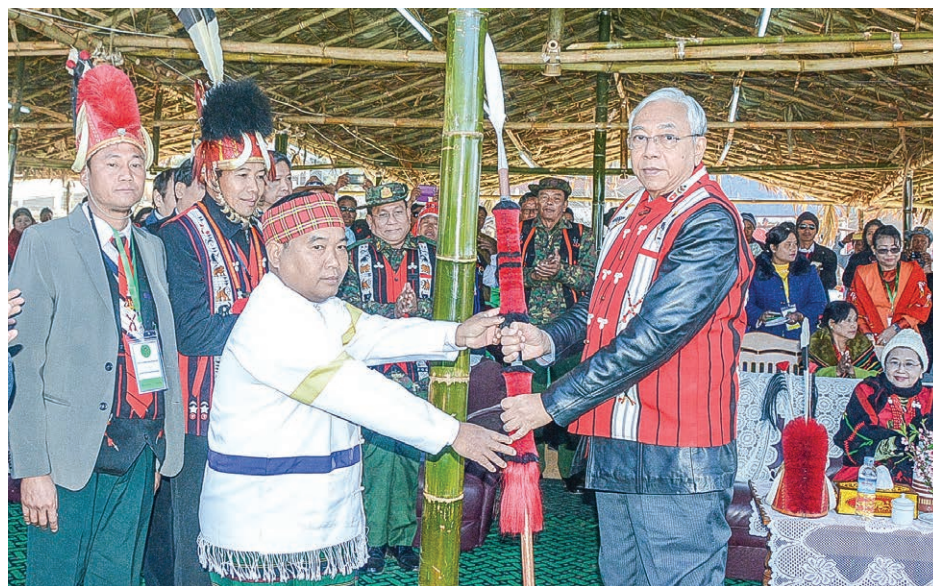
President U Htin Kyaw, right, accepts a spear from a leader of the Naga Self-Administered Zone at the Naga Traditional New Year Festival.