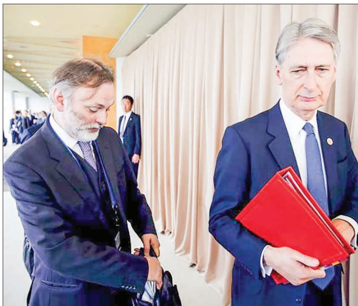
Britain's Foreign Minister Philip Hammond (R) and Foreign Ministry Political Director Tim Barrow arrive with fellow G7 foreign ministers for a working session, the fourth session of the their meetings in Hiroshima, Japan, on 11 April 2016.

"If we have no access to the European market, if we are closed off, if Britain were to leave the European Union with-