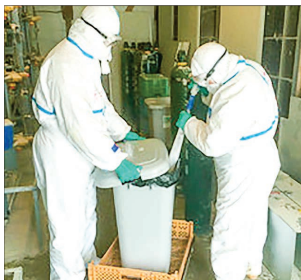
Supplied photo taken on 15 January, 2017, shows local officials culling chickens at a poultry farm in Yamagata in Gifu Prefecture, central Japan, after a highly virulent strain of bird flu was detected a day earlier.

The prefectural government has restricted the movement of poultry and eggs within a radius of 10 kilometers from the farm in question. The farm notified the prefectural government of a suspected bird flu case Saturday morning as it found more than 100 of its chickens had died. Of seven chickens examined by the local government, six tested positive in a preliminary exam. Further tests showed the presence of the H5 virus.—Kyodo News