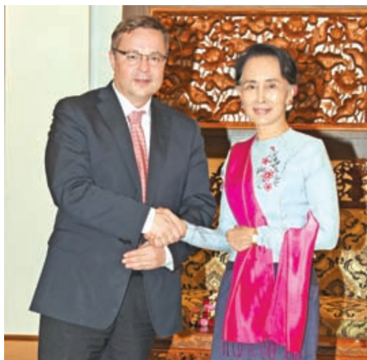
State Counsellor Daw Aung San Suu Kyi welcomes Deputy Minister of the Czech Republic Mr. Martin Tlapa.

At the meeting, they exchanged views on the promotion of bilateral relations and cooperation between Myanmar and the Czech Republic.— Myanmar News Agency