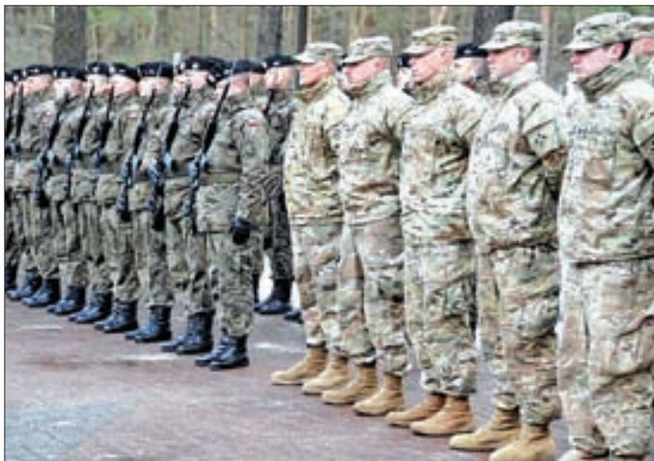
US soldiers arrive to Zagan as part of NATO deployment, Zagan, Poland, on 12 January 2017.

"We consider this a threat to us," Dmitry Peskov, Kremlin's spokesman, told journalists on a conference call. "We are talking here about a third