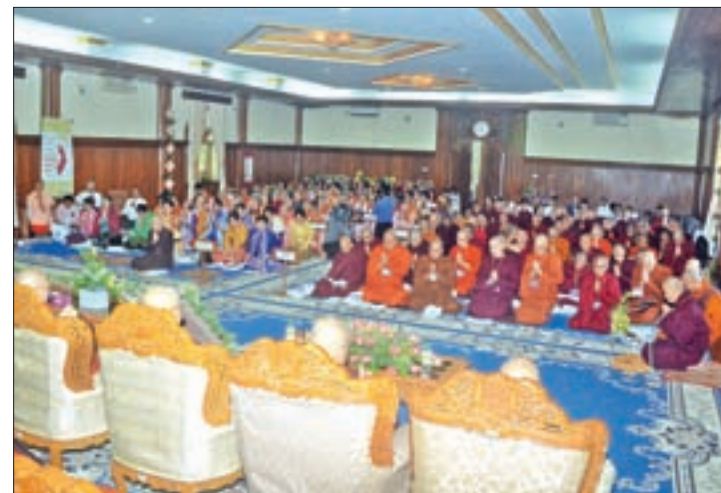
Students of the International Theravada Buddhist Missionary University pay respects to Sayadaws.

THE 18 th anniversary of ceremony for paying homage to teachers in International Theravada Buddhist Missionary University was held at the university premises in Mayangone township, Yangon, yesterday morning.