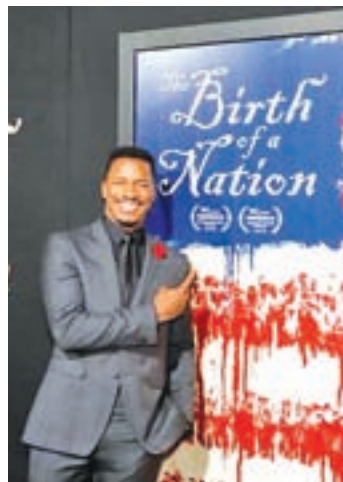
Actor Nate Parker attends the premiere of "The Birth of a Nation" in Hollywood, California, on 21 September 2016.

"Birth of a Nation," the Fox Searchlight film about a 19th century slave rebellion, is writ-