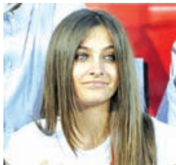
Michael Jackson's daughter Paris Jackson.

The story about Jackson casts Fiennes in a re-imagined tale of a road trip across the United States that the "Thriller" singer is said to have taken in 2001 with movie stars Elizabeth Taylor and Marlon Brando.