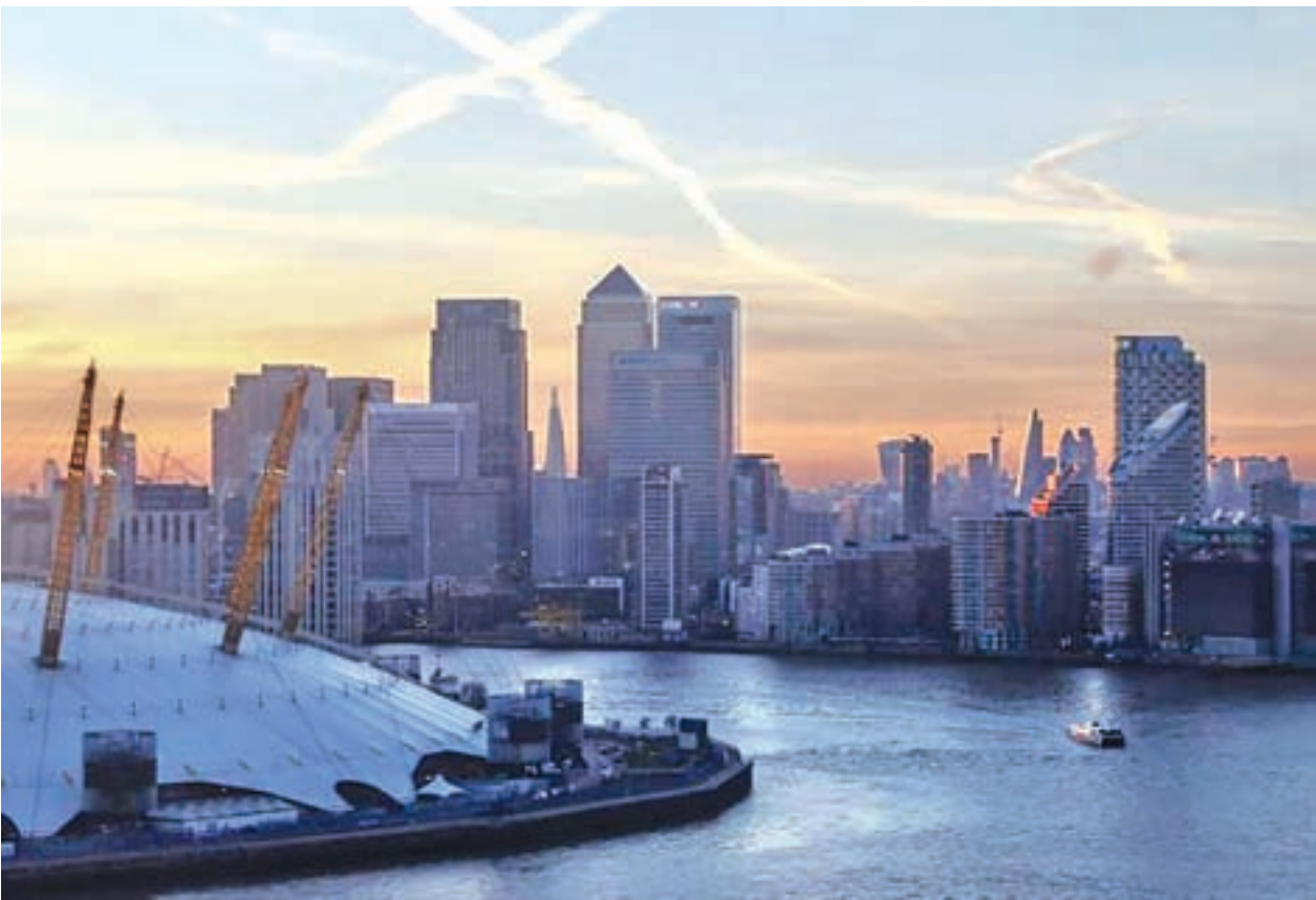
Canary Wharf and the city are seen at sunset in London, on 14 December 2016.

The “call for evidence” seeking views on whether further reform is needed to combat corporate criminality, after banks and other institutions have paid billions of pounds in fines for fraud