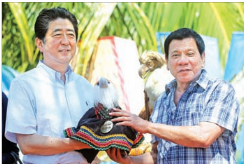
Philippine President Rodrigo Duterte (R) hands over a Philippine Eagle stuffed toy named Sakura to Japan's Prime Minister Shinzo Abe during the ceremonial eagle naming at the garden area of Waterfront Insular Hotel in Davao City, southern Philippines, on 13 January 2017.

Duterte told Abe he is ready to have direct talks with China concerning the South China Sea, according to the ministry. Duterte has previously suggested