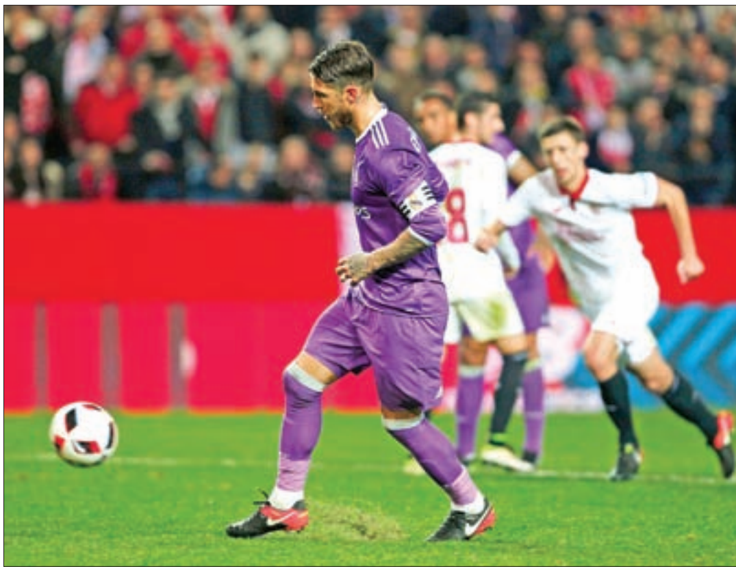
Real Madrid's Sergio Ramos scores his first goal from penalty spot during Spanish King's Cup at Ramon Sanchez Pizjuan stadium in Seville, Spain, on 12 January 2016.

Sevilla took the lead when Danilo headed a cross from Pablo Sarabia into his own net in the 10 th minute, but Marco Asensio equalised with a low near-post shot following a terrific run from midfield three minutes after the re-start. Stevan Jovetic, who joined Sevilla on loan from Inter Milan this week, volleyed home right-footed eight minutes after coming on to put the hosts in front in the 54 th minute before Vicente