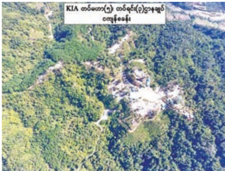
KIA battalion headquarters.

COLUMNS of Tatmadaw troops occupied three KIA strongholds including the headquarters of Battalion (3) of Brigade (5) yesterday morning. After taking over Gidon post, 768 Laiphong camp and outposts nearby of the KIA during December 2016 and January 2017, Tatmadaw troops launched operations on three KIA posts including Ngakyan Camp, the headquarters of Battalion 3 of the KIA from 10 to 12 January before occupying them. Tatmadaw troops seized some bodies, four assorted weapons, 1500 rounds of ammunition, 600 catridges and 50 shells while some members of security forces sacrificed their lives for the country. —Myanmar News Agency