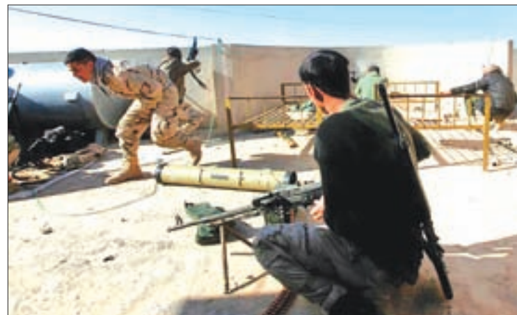
Iraqi army members clash with Islamic State militants from the roof of a building, eastern Mosul, Iraq, on 12 January 2017.

Last month, Moscow and Ankara agreed to back a ceasefire between the Syrian government and rebel groups, with the truce largely holding in vast areas of the country, though clashes have continued to occur near Damascus. —Xinhua