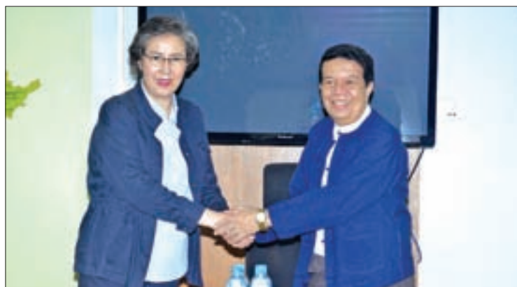
Chairman of Myanmar Peace Commission Dr Tin Myo Win welcomes Ms Yanghee Lee, Special Rapporteur, in Yangon.