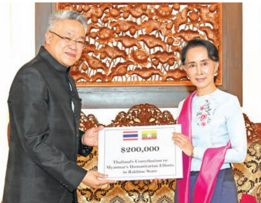
State Counsellor Daw Aung San Suu Kyi accepts USD 200,000 of cash assistance from Mr. Pisanu Suwanajata, Ambassador of Thailand at the Ministry of Foreign Affairs.