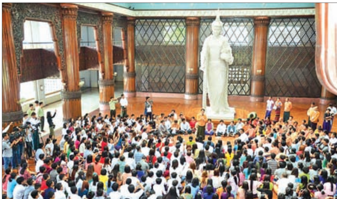
Yangon Region Chief Minister meeting with volunteers for new public transportation system at the Yangon Region Government office in Yangon.

Yangon based companies will also contribute to the launching of the new bus system by changing office hours while some companies offered to transport to travellers in difficulty.—001