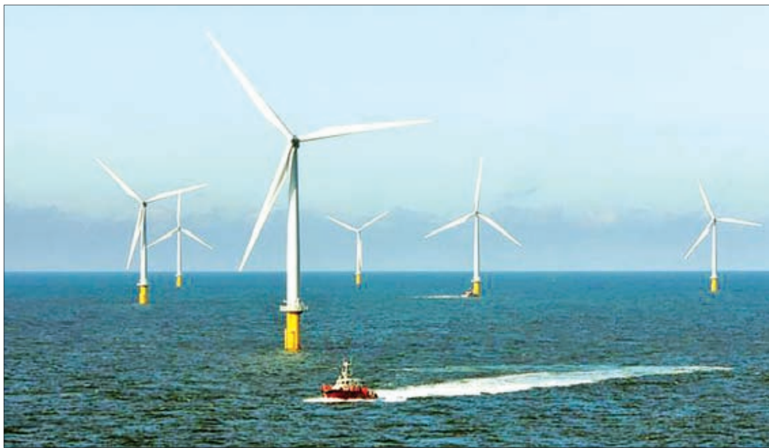
A crew boat passes through Horns Rev 2, the world's largest wind farm, 30 km (19 miles) off the west coast of Denmark near Esbjerg in 2009.

Cuomo, seen as a potential 2020 presidential candidate, is pursuing wind power after President-elect Donald Trump on the campaign trail dismissed solar and wind energy as too expensive