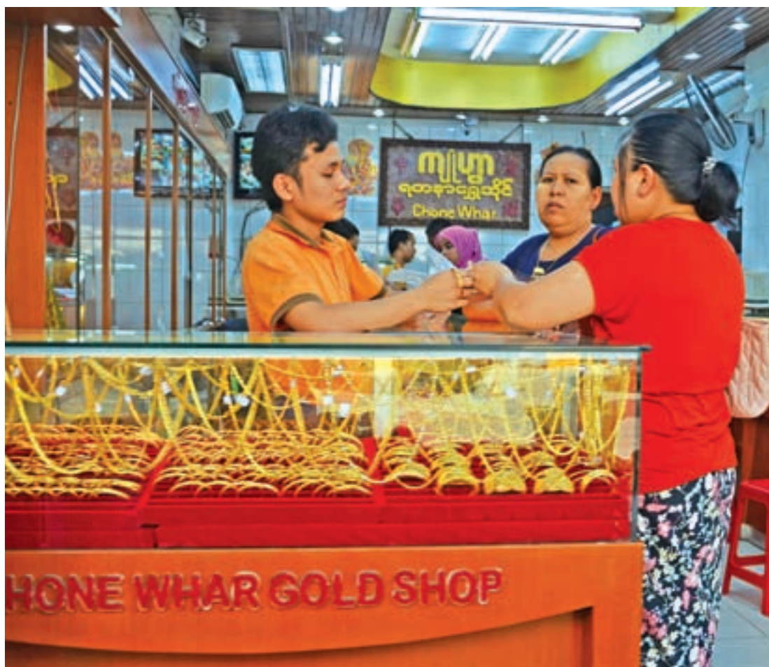
The file photo shows sale staff shows gold bracelets to customers at gold shop.

According to current prices on the morning of 13 January, Myanmar gold price fetched Ks 867,000 while 15 carat Myanmar gold was priced at Ks 808,000. The price of gold on the global market was valued at US$ 1203 per ounce. The foreign exchange rate of Myanmar kyat was around Ks 1360 per dollar.— Myitmakha News Agency