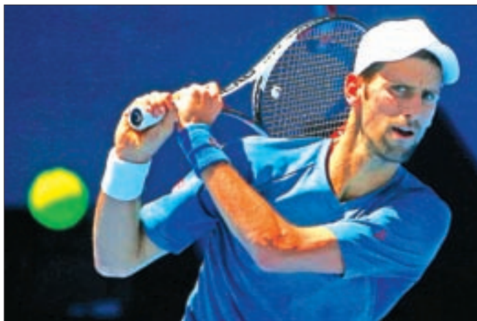
Serbia's Novak Djokovic hits a shot during a training session ahead of the Australian Open tennis tournament in Melbourne, Australia, on 12 January 2017.

Federer, seeded 17 th after the longest injury lay-off of his near-20 year career, eases back in to grand slam action against a qualifier.