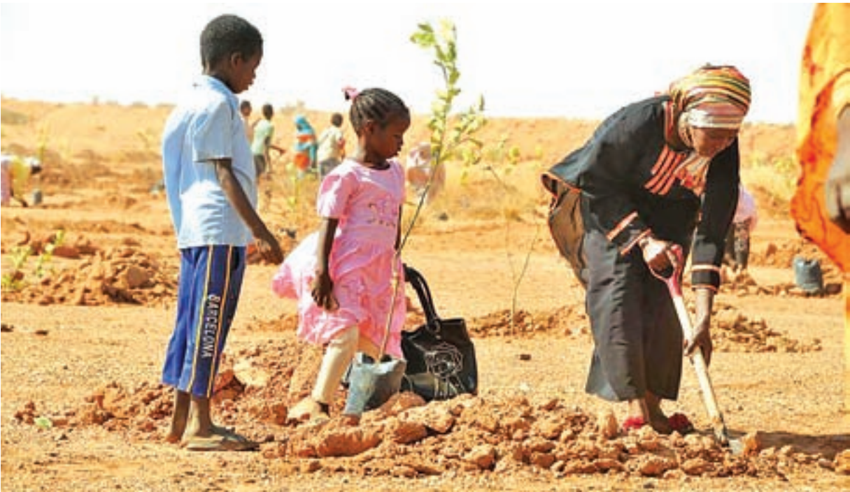
People plant trees on the outskirts of Khartoum, Sudan, on January 2017. Sudan’s Khartoum State authorities on Thursday started planting around 1,000 trees as part of the state’s greenbelt project, which is part of the African Great Green Wall. The African Great Green Wall project was endorsed by the community of Sahel-Saharan states (CEN-SAD) in 2005 and then it was approved by the African Union in 2007 as a strategic African project to help the African countries curb up the risk of desert creeping which threatens the CEN-SAD countries.

TOKYO — Japan’s health minister on Friday expressed eagerness to pursue the eradication of passive smoking ahead of the 2020 Tokyo Olympics and Paralympics, saying it is the government’s “mission” to alleviate the effects of secondhand cigarette smoke. Emphasizing that Olympic host countries in recent years have implemented regulations and penalties to curb smoking, Health, Labour and Welfare Minister Yasuhisa Shiozaki said at a press conference the move away from allowing smoking in public areas is “a big trend across the world.” The health ministry is aiming to submit a bill revising the Health Promotion Law, possibly including a complete ban on smoking in indoor public spaces, to the ordinary parliamentary session scheduled to be convened next Friday. In a report called the “Tobacco White Paper,” released last year, the ministry warned that secondhand smoke definitely raises the risk of lung cancer. The report said setting up sealed smoking rooms does not prevent the cigarette smoke from leaking and even causes passive smoking effects among staff tasked with cleaning the areas. On Thursday, Japanese restaurant industry groups voiced opposition to a total ban on smoking in restaurants. Shiozaki, however, shrugged it off, saying it is important to make efforts to protect people from secondhand smoke with an eye on increasing the number of foreign visitors to Japan.—Kyodo News