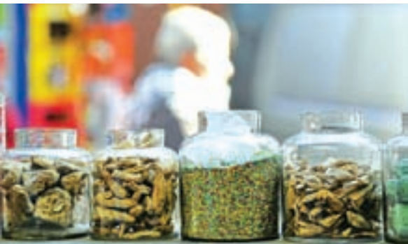
Herbs for sale are pictured at a herbal store in Cairo, Egypt, on 10 January 2017.