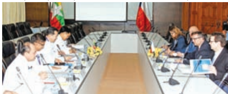
The meeting of Myanmar-Czech Foreign office consultations in progress.

At the meeting, matters on promotion of bilateral relations and cooperation on economy, investment, education, and cultural sectors were cordially discussed. —Myanmar News Agency