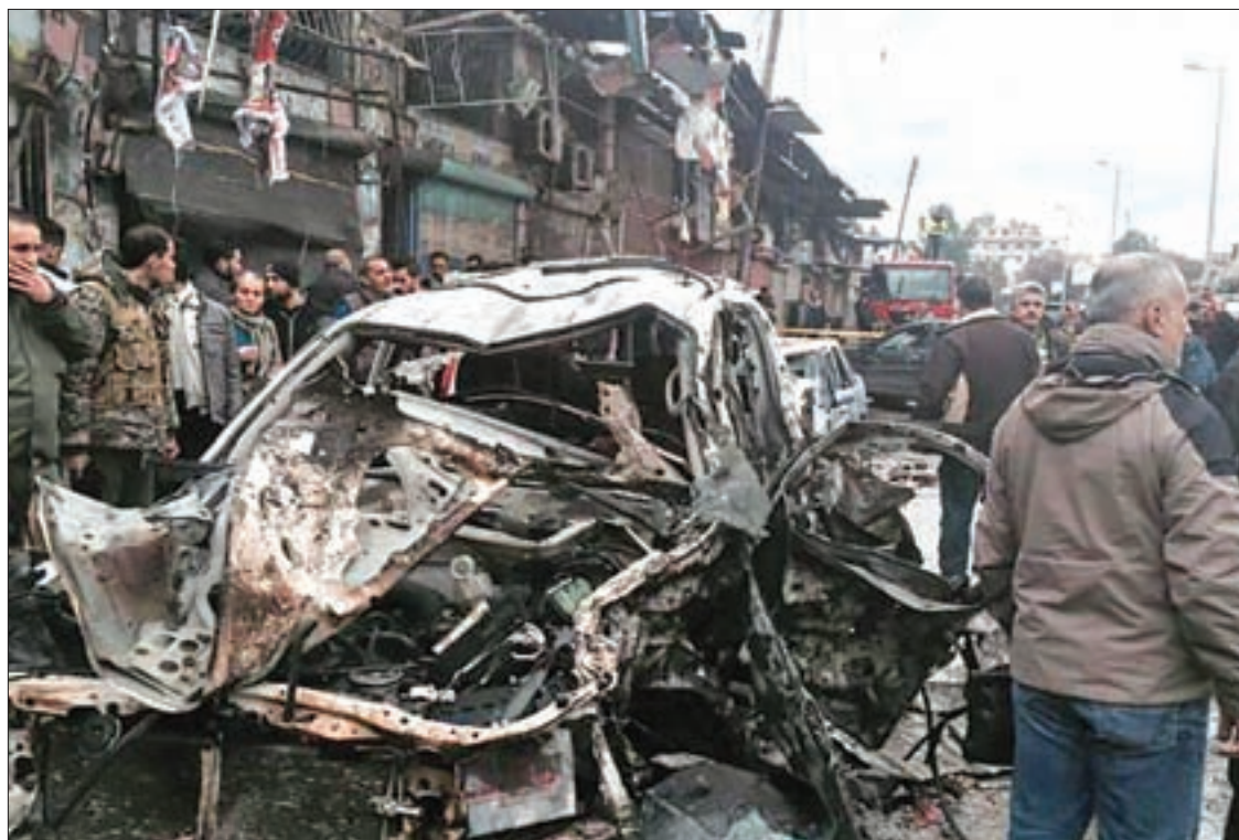
People inspect the damage at the site of a car bomb explosion, in the centre of the Syrian town of Jableh in the coastal Mediterranean province of Latakia, Syria, in this handout picture provided by SANA on 5 January 2017.