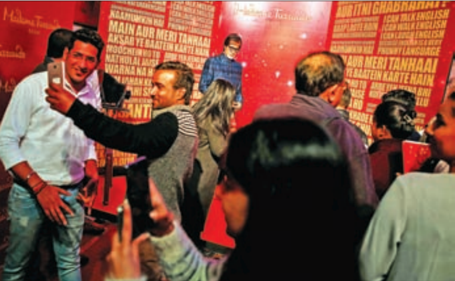
People take pictures of a waxwork of Bollywood actor Amitabh Bachchan at a photocall for the new Madam Tussaud’s waxwork museum in New Delhi, India, on 12 January 2017.

NEW DELHI — Madame Tussauds unveiled a waxwork of Bollywood superstar Amitabh Bachchan on Thursday ahead of the museum’s opening later this year in the Indian capital of New Delhi. Bachchan, 74, is one of Indian cinema’s most revered and influential actors and has been a mainstay on screens for five decades.