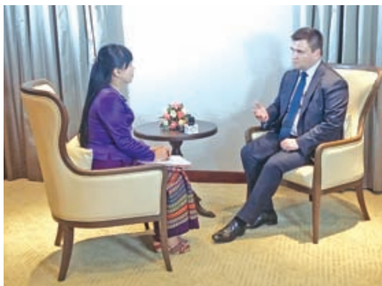
Ukrainian Foreign Minister talking with reporter from the Myanmar Radio and Television.

Q: Your honorary consulate was opened in Yangon very recently and it is a good start for