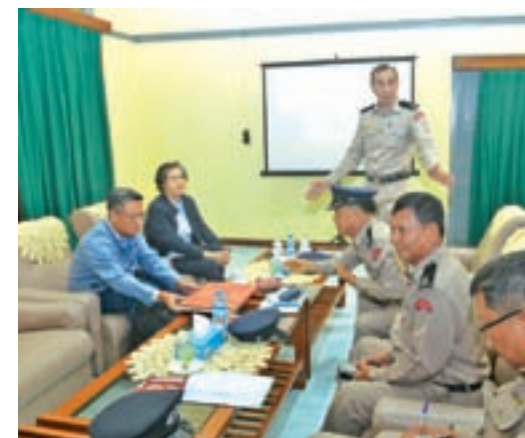
Ms Yanghee Lee holds talks with officers from the Insein Correctional Department.