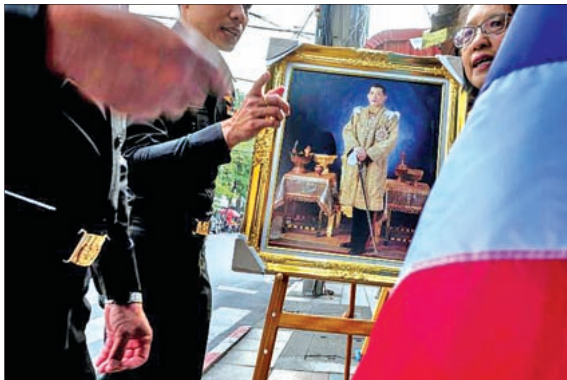
People look at a portrait of Thailand's King Maha Vajiralongkorn Bodindradebayavarangkun at a royal memorabilia shop in Bangkok, Thailand, on 13 January 2017.

Meanwhile, support rate for the Minjoo Party was 41 per cent. It surpassed the ruling Saenuri Party's 12 per cent, the People's Party's 10 per cent and the Righteous Party's 7 per cent.—Xinhua