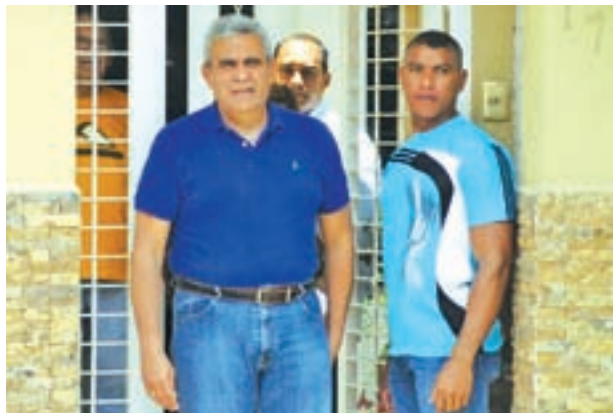
Former general Raul Baduel (C) walks out from his house in Maracay, Venezuela in 2015.