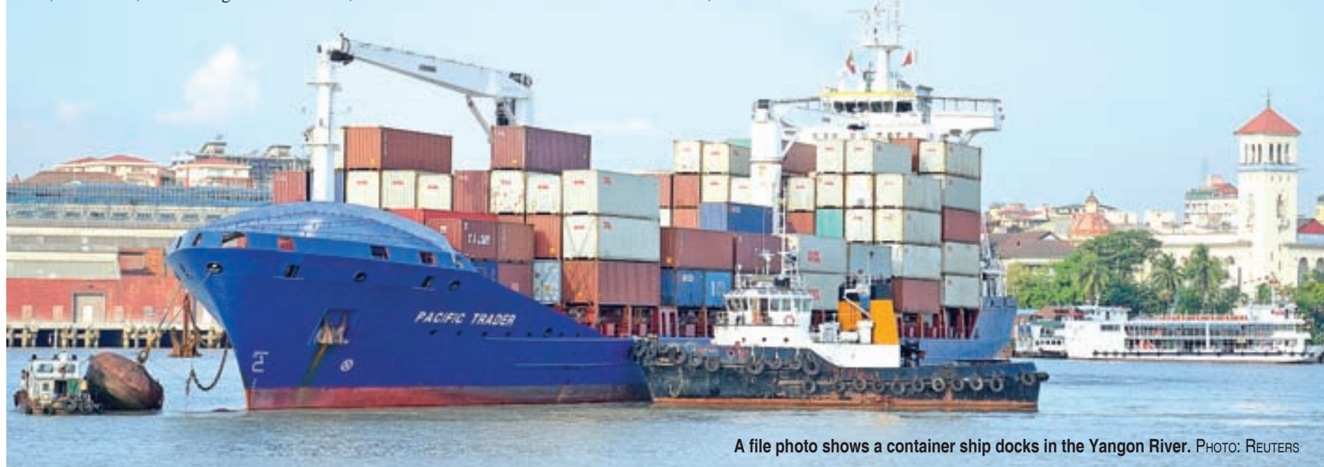
A file photo shows a container ship docks in the Yangon River.

A businessman can trade Ks3million a day with an ITC, and the trade department granted trade up to Ks15million, which amounted to a five-day-trade-value.— Ko Khant