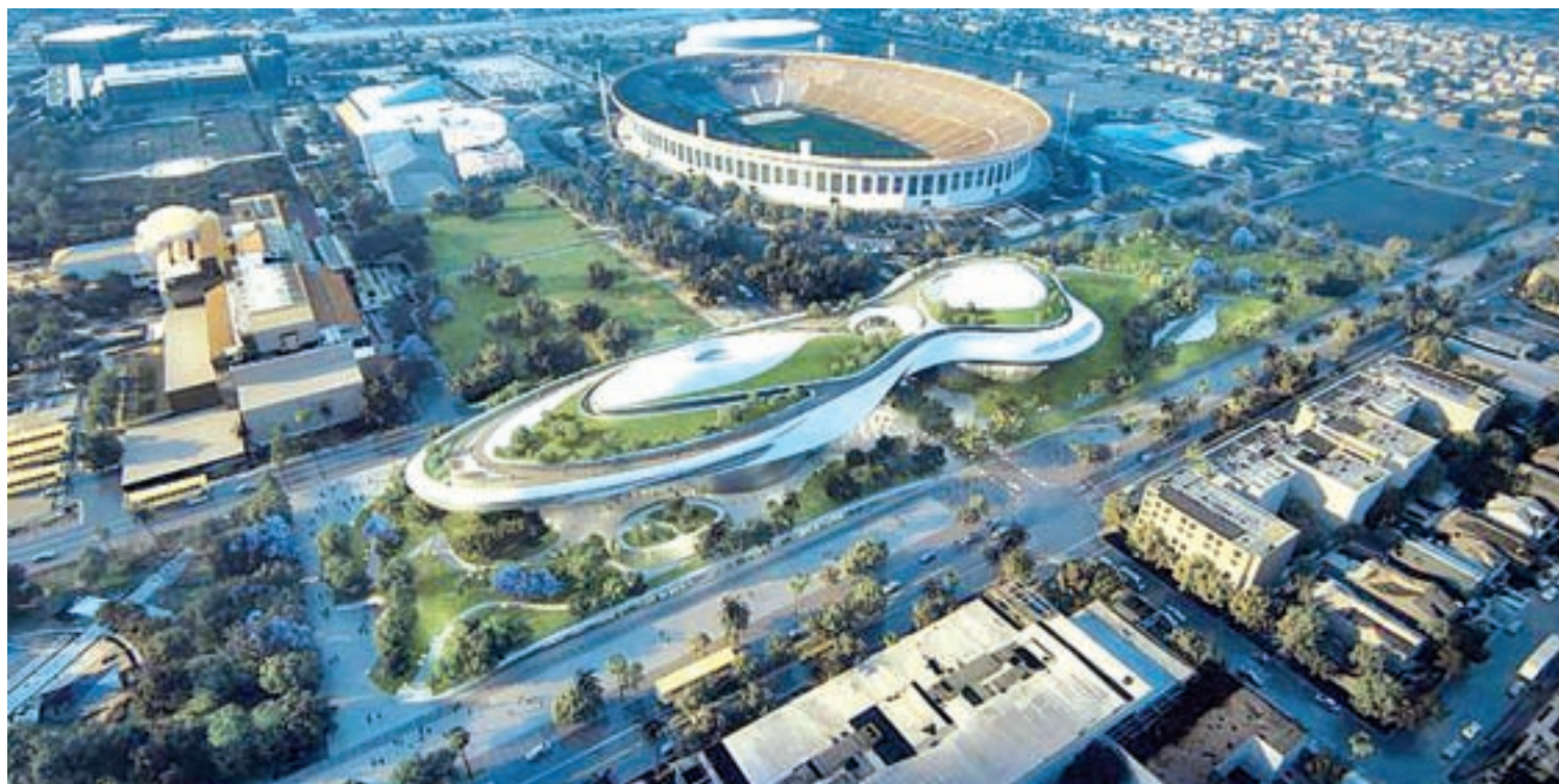
An artist rendering shows Lucas Museum of Narrative Art to be built in Exposition Park in downtown Los Angeles in this image released in California, US, on 10 January 2017.