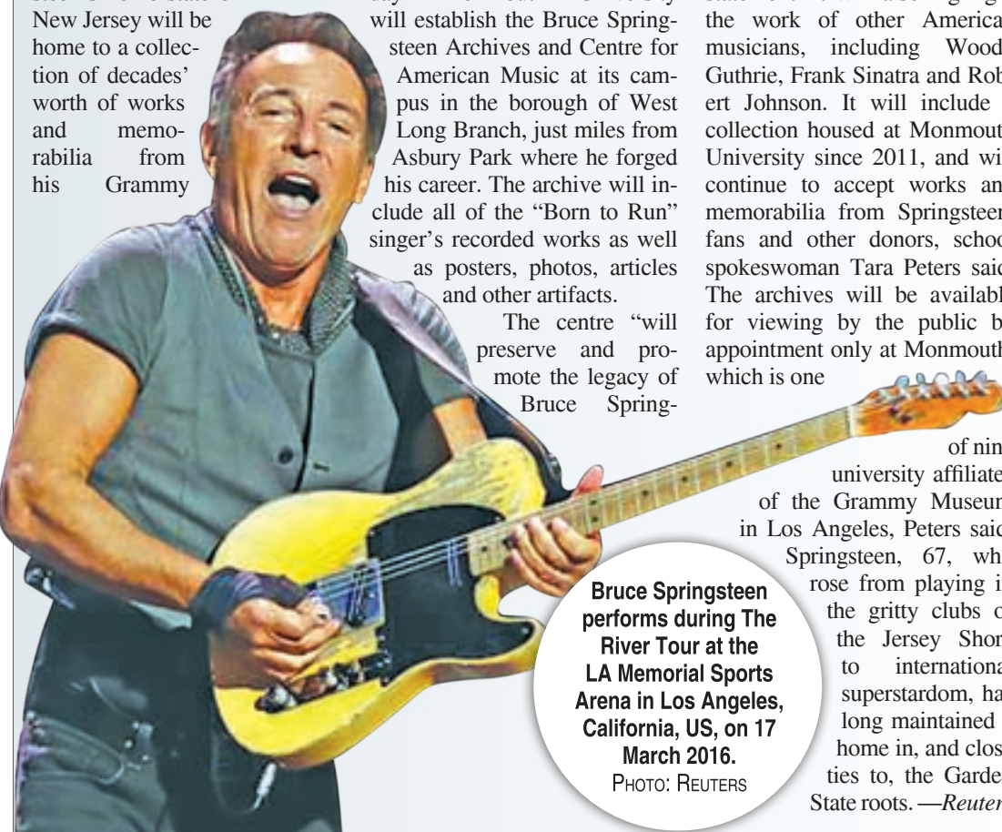
Bruce Springsteen performs during The River Tour at the LA Memorial Sports Arena in Los Angeles, California, US, on 17 March 2016.