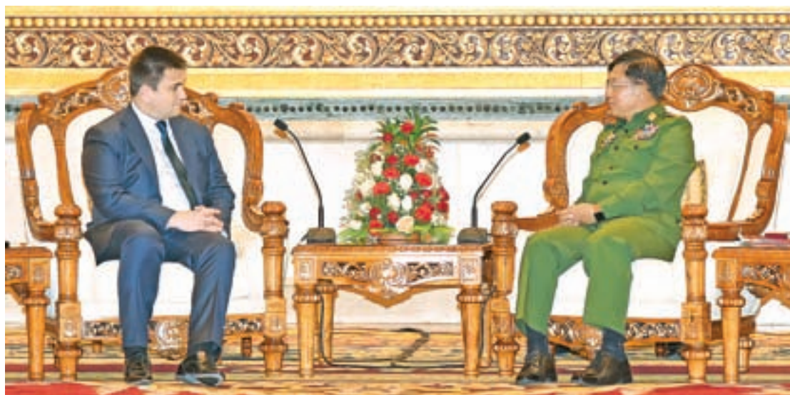
Senior General Min Aung Hlaing holds talk with Ukraine Foreign Affairs Minister in Nay Pyi Taw.

COMMANDER-IN-CHIEF of Defence Services Senior General Min Aung Hlaing received Mr Pavlo Klimkin, Foreign Affairs Minister of Ukraine,