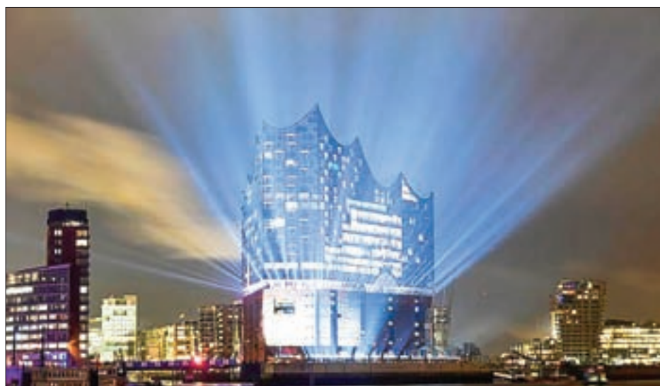
The 'Elbphilharmonie' (Philharmonic Hall), which will open its doors to public on 11 January 2017, is illuminated during a light test in downtown Hamburg, Germany, on 9 January 2017.

port of Hamburg, now a media hub with chic shopping arcades as well as its red light district around the Reeperbahn, hopes the hall will help draw tourists to Germany's second-biggest city.