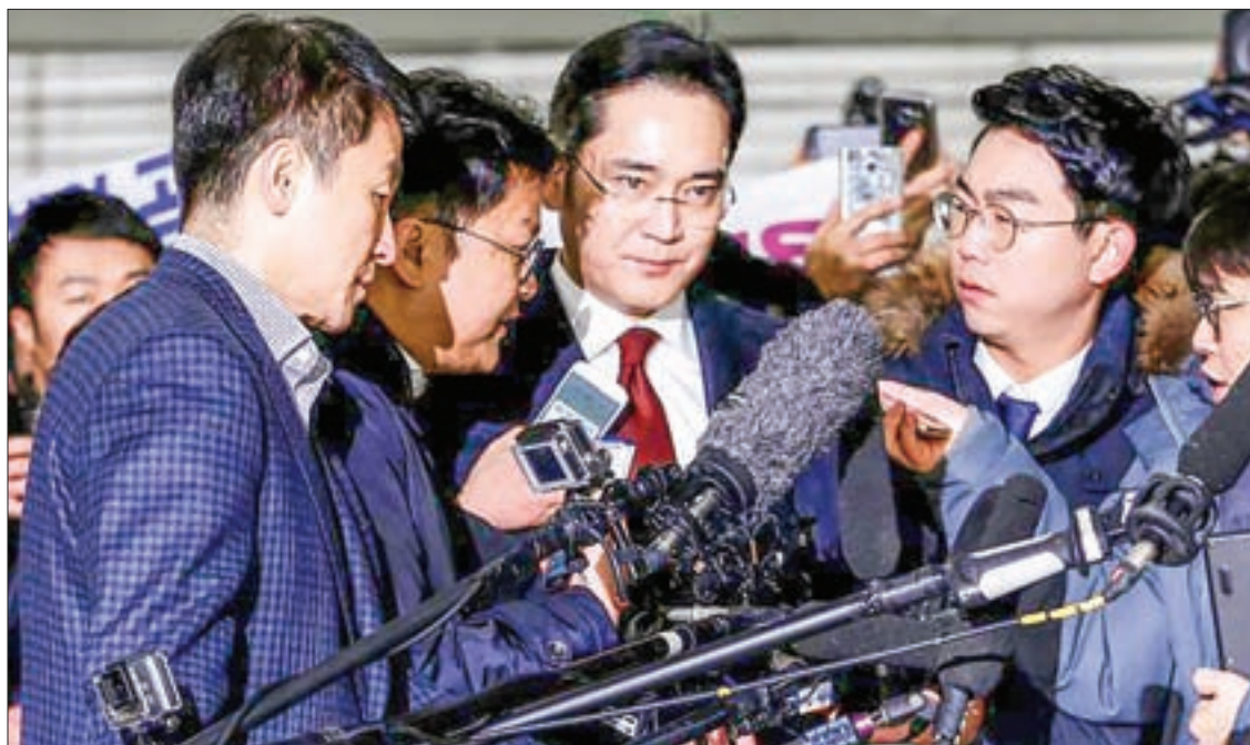
Jay Y. Lee, centre, vice chairman of Samsung Electronics, arrives to be questioned as a suspect in bribery case in the influence-peddling scandal that led to the president's impeachment at the office of the independent counsel in Seoul, South Korea, Thursday, on 12 January 2017.