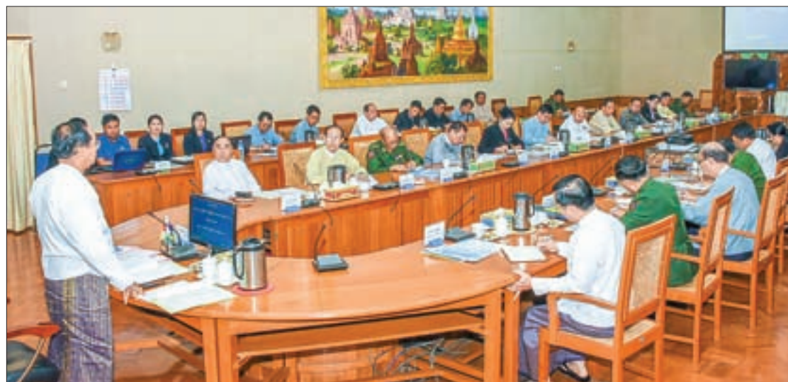
Vice President U Myint Swe addresses the 2 nd coordination meeting of the central committee for convening the 70 th anniversary Union Day 2017 celebration in Nay Pyi Taw.

At the meeting, participants discussed promotion of energy sufficiency among member countries, programmes to bridge the gap between energy need and generation in the member countries, energy planning for sustainable development including the use of renewable energy and connecting the national grids in member countries, and the MoUs on establishment of the BIMSTEC Grid and the Energy Centre. —Myanmar News Agency