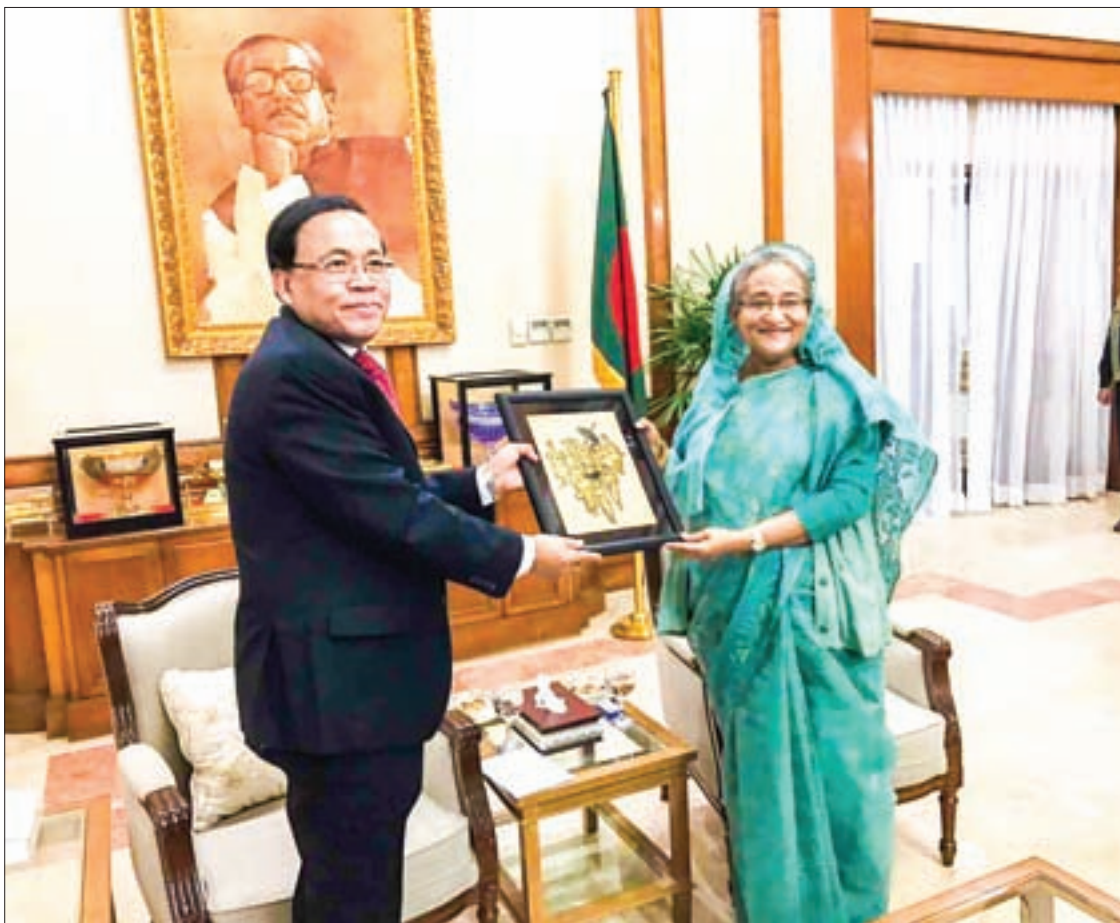
Minister of State for Foreign Affairs U Kyaw Tin, Special Envoy of the State Counsellor, presents a gift to Bangladeshi Prime Minister Sheikh Hasina in Dhaka, Bangladesh yesterday.

“The State Counsellor expresses her confidence that Myanmar and Bangladesh would be able to address the issues of mutual concern in a spirit of good neighbourliness.