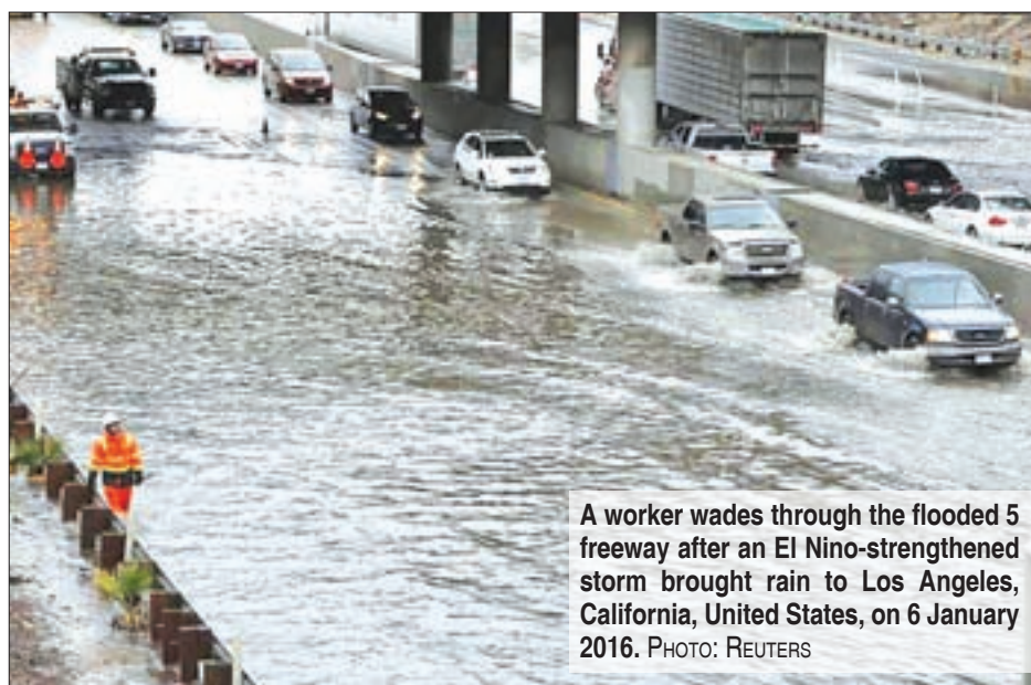
A worker wades through the flooded 5 freeway after an El Nino-strengthened storm brought rain to Los Angeles, California, United States, on 6 January 2016.

The last weeks of 2016 were particularly wet for California, which has struggled through years of drought, and the rainfall has