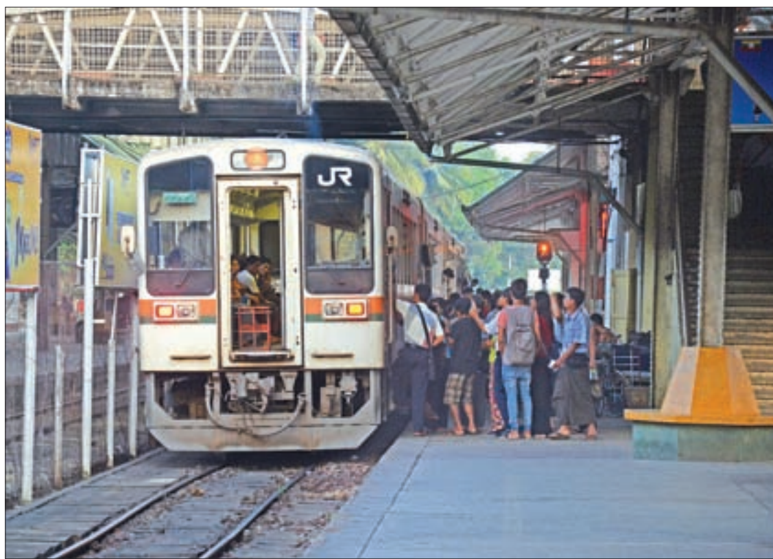
Commuters getting onto a circular train at Yangon Central Railway Station on 19 Nov 2016.

Myanma Railways operates its transport service business daily with 38 high-speed trains, 56 postal trains, 58 cargo trains, 215 Yangon circulator trains and 20 more trains which run only short trips around the country.—200