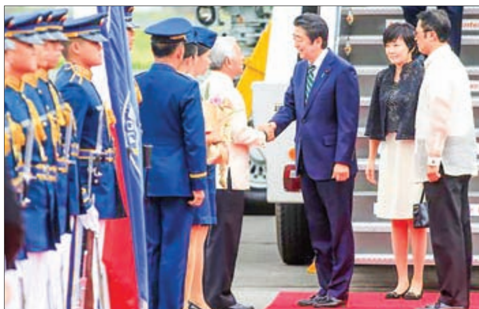
Japanese Prime Minister Shinzo Abe is greeted by Philippine Foreign Secretary Perfecto Yasay upon arrival for a state visit in metro Manila, Philippines, on 12 January 2017. Pictured second right is Prime Minister Shinzo Abe's wife Akie Abe.

"I chose the Philippines as my first destination this