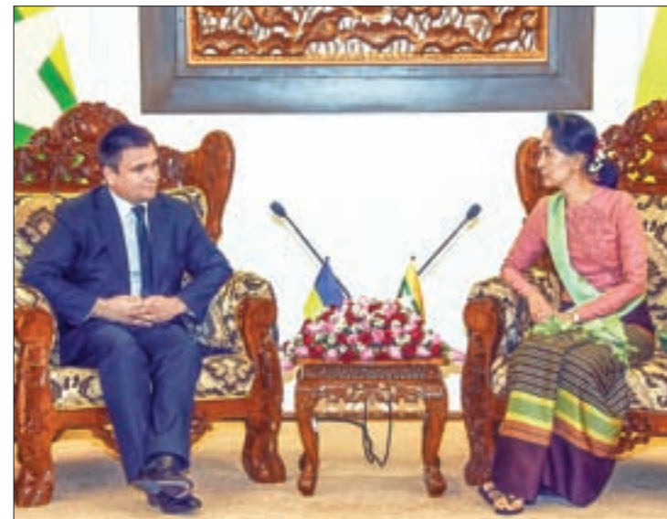
State Counsellor Daw Aung San Suu Kyi holds talks with Mr Pavlo Klimkin, Foreign Affairs Minister of Ukraine.

During the meeting, they discussed matters related to bilateral relations and boosting the cooperation between the two countries.—Myanmar News Agency