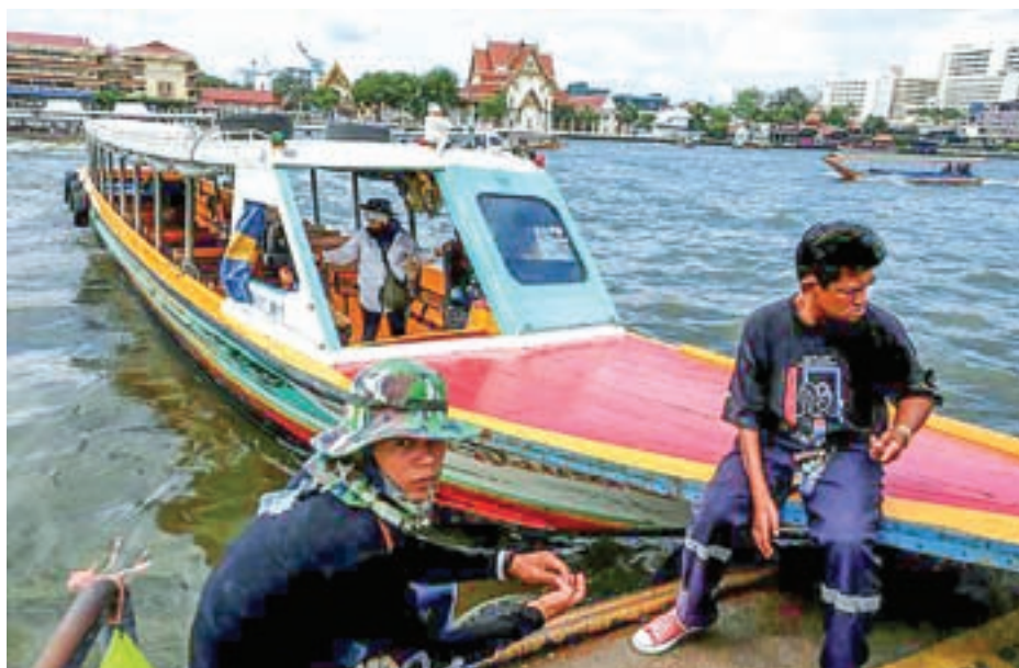
Boat drivers wait for tourists at a pier at Chao Phraya River in Bangkok, Thailand, on 11 January 2017.

But the government's insistence on a minimum 1,000 baht (23 pounds) per night charge for package tourists had made Thailand