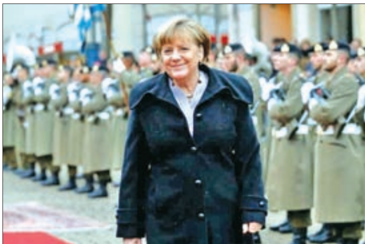
Germany's Chancellor Angela Merkel reviews an honour guard during an official visit to Luxembourg, on 12 January 2017.

"It makes me optimistic that a lot of countries have sadly had the experience that terrorism is a big challenge for all of us and only cross border cooperation in the (passport free) Schengen area will help us," she said.—Reuters