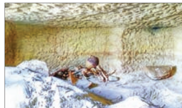
Skeletal and animal remains are seen at one of 12 newly discovered ancient Egyptian cemeteries dating back to the New Kingdom era at Gabal al-Silsila or Chain of Mountains area in Upper Egypt, north of Aswan, on 11 January 2017, in this handout picture courtesy of the Ministry of Antiquities. PHOTO: REUTERS

Initial examinations revealed several complete bodies as well as evidence of malnutrition and broken bones that were the result of heavy labour, the ministry quoted expedition head Maria Nilsson as saying.—Reuters