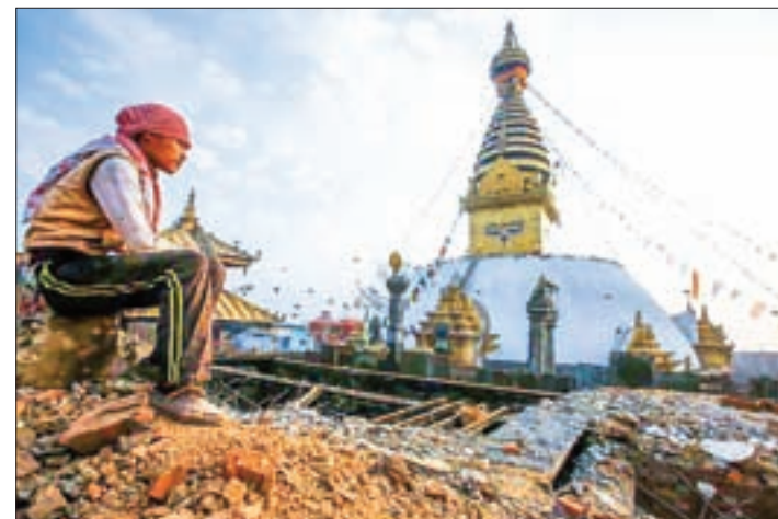
A labourer sits on top of the debris of a monastery damaged during the 2015 earthquake, in Swayambhunath Stupa, a UNESCO world heritage site in Kathmandu, Nepal, on 11 January 2017.