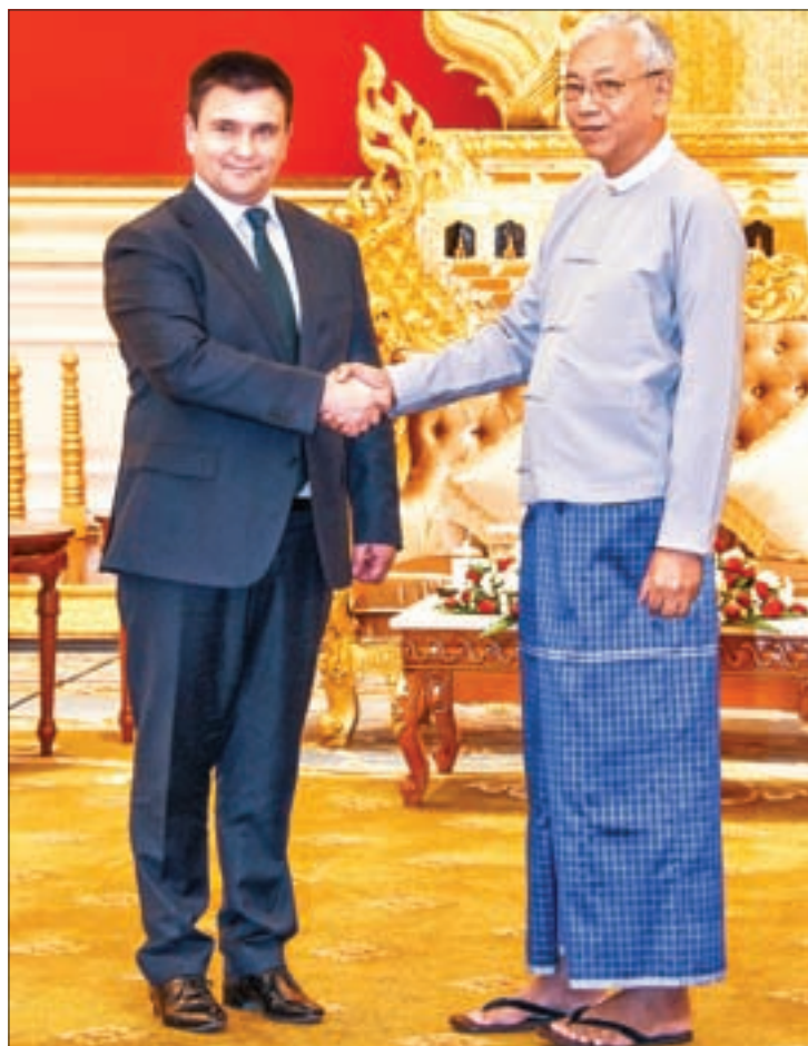
President U Htin Kyaw welcomes Mr Pavlo Klimkin, Foreign Affairs Minister of Ukraine, in Nay Pyi Taw.

Also present at the call were Union Minister Dr Than Myint, Deputy Minister U Khin Maung Tin, Ambassador of Ukraine to Thailand Mr Andrii Beshta and officials. —Myanmar News Agency