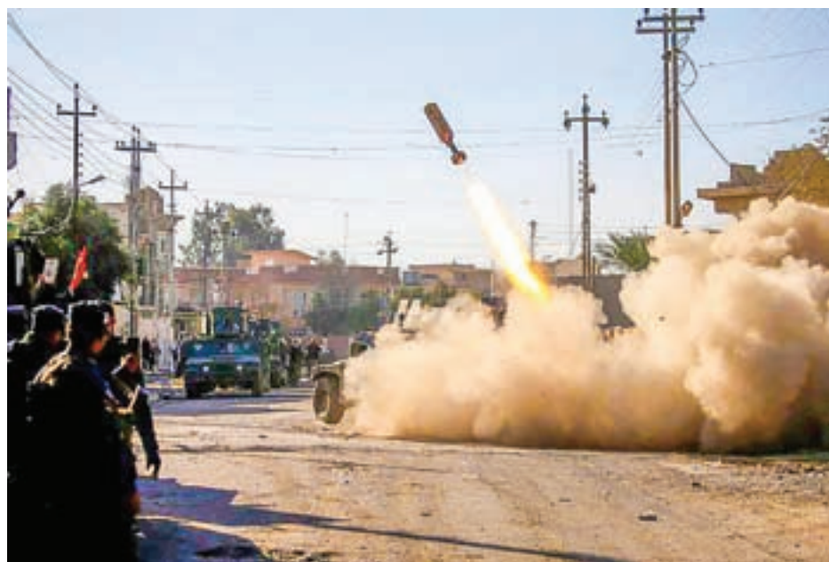
Members of the Iraqi rapid response forces fire missile toward Islamic State militants during a battle between Iraqi forces and Islamic State militants in Sumer district of eastern Mosul, Iraq, on 11 January 2017.

The US-backed campaign to recapture Mosul, Islamic State's last major stronghold in Iraq,