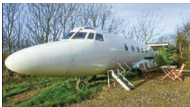
The luxury Jetstar private jet, built in the seventies and retaining most of the original features which is now being used as a holiday let is seen in Redberth, Pembrokeshire, Wales on 11 January 2017. PHOTO: REUTERS

original features, the plane, which would have carried maximum nine passengers, comes with a bar area, an Xbox with flight games in the cockpit, a toilet and a cold water basin. "It ticks quite a few different people's boxes," said Apple Camping owner Toby Rhys-Davies, who bought the jet from a salvage yard. "I've had all sorts of people staying from plane enthusiasts to people who are scared of flying and then just couples."—Reuters