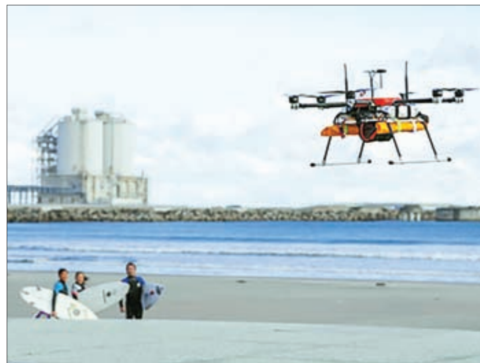
A drone delivers a bottle of hot soup to surfers on the beach of Minamisoma in the north-eastern Japan prefecture of Fukushima on 12 January 2017, during a test of an unmanned flying vehicle traveling a preset route of more than 10 kilometres.

Other contributors to the test included the Autonomous Control System Laboratory headed by Kenzo Nonami, a leading drone system developer in Japan.—Kyodo News