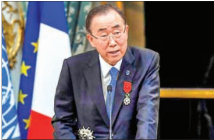
UN Secretary General Ban Ki-moon delivers a speech after being awarded with the Legion of Honour (Legion d'Honneur) by the French president at the Elysee Palace in Paris, France, on 17 November 2016.

A former foreign minister, Ban has not declared his intention