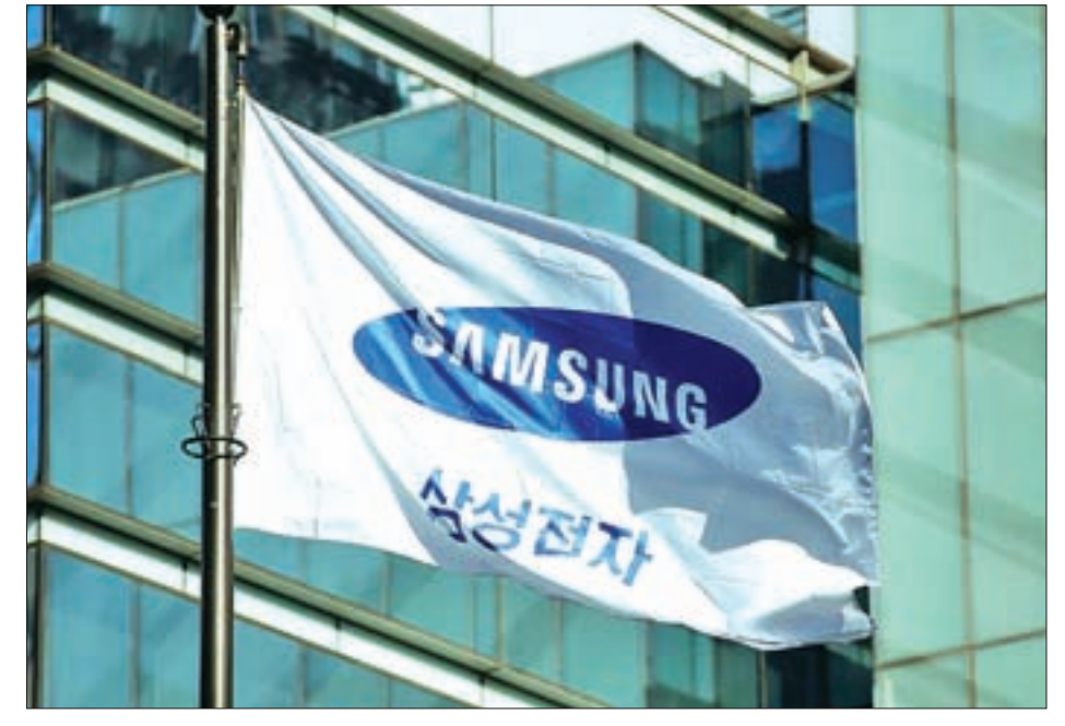
A flag bearing the logo of Samsung Electronics is pictured at its headquarters in Seoul, South Korea, on 29 November, 2016.

leader to leave office early after parliament voted to impeach her in December over the corruption scandal, a decision that must be approved or overturned by the Constitutional Court.—Reuters