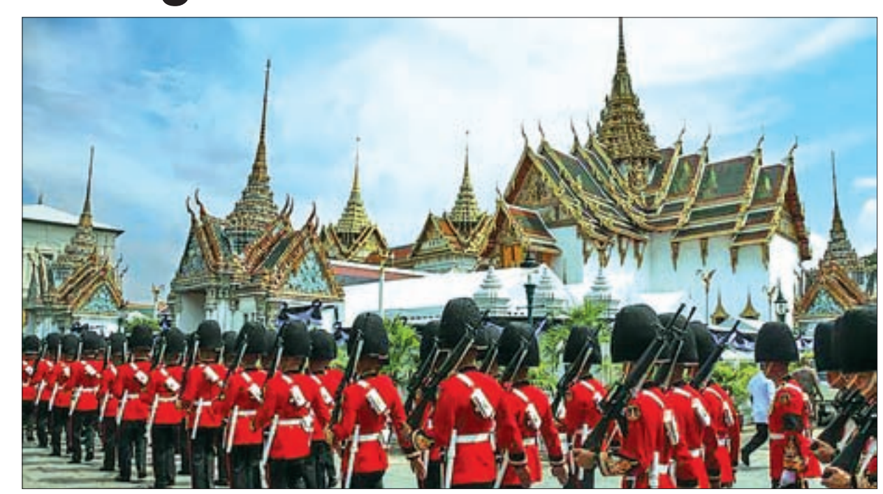
Thai Royal guards march as mourners line up to enter the Grand Palace to pay respect to Thailand's late King Bhumibol Adulyadej in Bangkok, Thailand, on 14 October, 2016.

King Maha Vajiralongkorn's office has requested changes to a draft constipowers, the prime minister said on Tuesday.