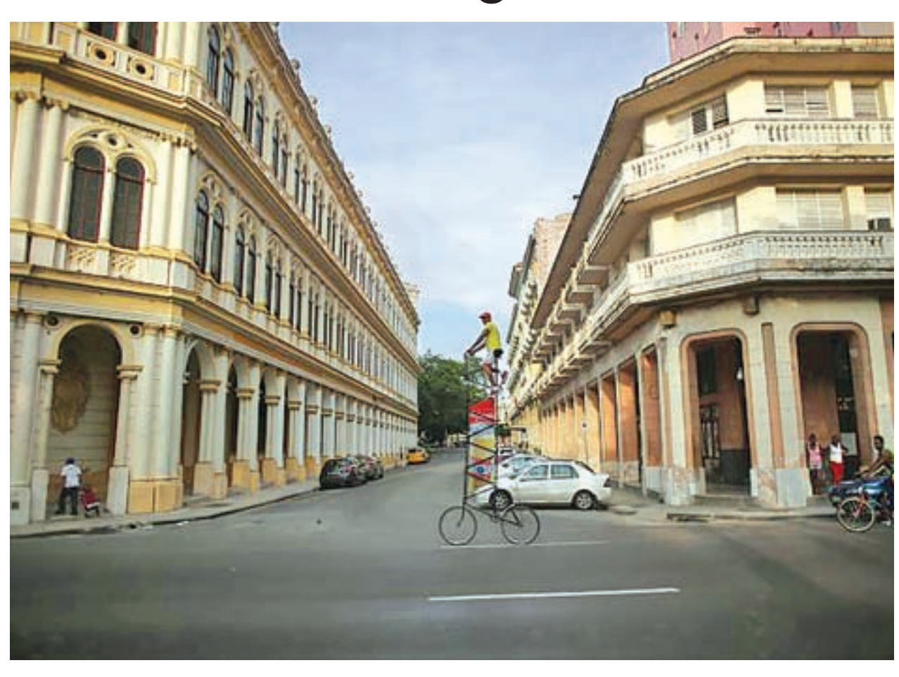
Felix Guirola, 52, rides a homemade bike with an advertising banner in Havana, Cuba, on 20 July, 2016.

HAVANA — Cubans are earn cash but Felix Guirola stands - or rather, cycles head and shoulders above them.