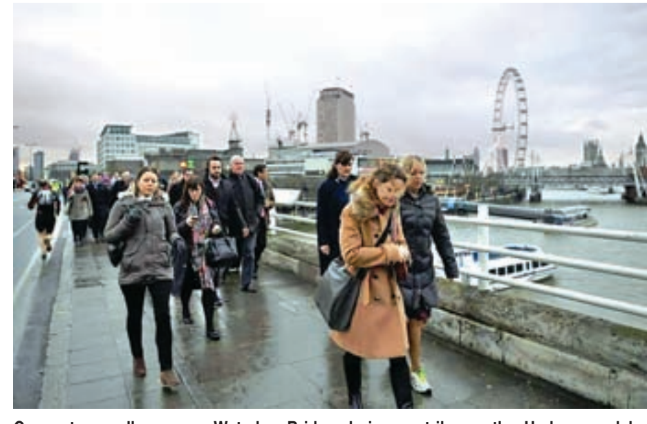
Commuters walk accross Waterloo Bridge during a strike on the Underground by members of two unions in protest at ticket office closures and reduced staffing levels, in London, Britain on 9 January, 2017.

Monday's walkout on the Tube, which carries up to 4.8 million passengers a day, begins a week of industrial action which will hit rail and air passengers, and there are warnings the problems could