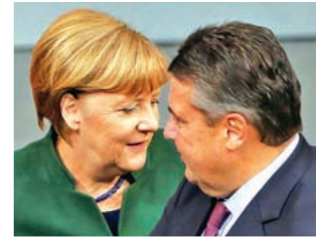
German Chancellor Angela Merkel and Economy Minister Sigmar Gabriel attend a meeting at the lower house of parliament Bundestag on 2017 budget in Berlin, Germany, on 23 November, 2016.

A spokesman for Gabriel said the party was sticking to its planned timetable. "The SPD will decide on its candidate for chancellor on 29 January," he said. Senior party members are holding a closed-door meeting to discuss election strategy on Tuesday, but the question of who will be the party's top candidate will not be discussed officially,