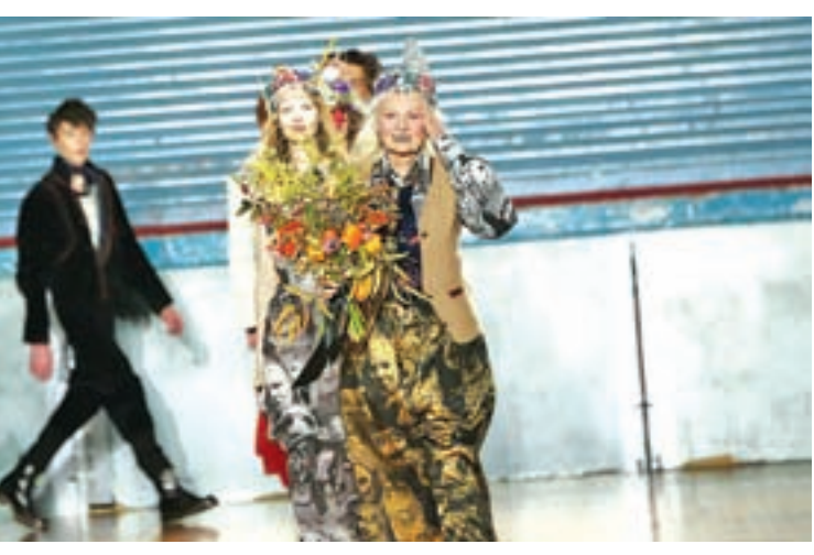
Designer Vivienne Westwood (C) walks the runway after her catwalk show during London Fashion Week Men's 2017 in London, Britain on 9

"She and he are having fun with unisex and swapping clothes," shownotes for the collection read. "Buy less, choose