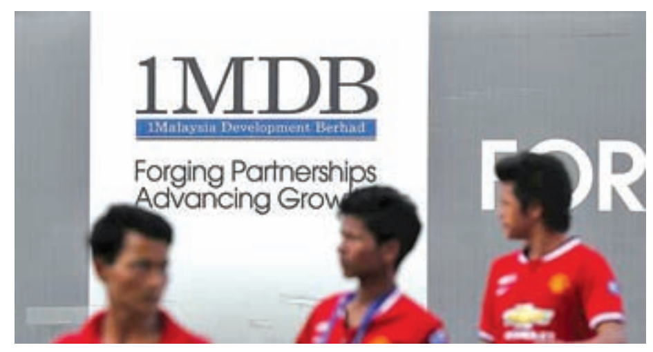
Men walk past a 1Malaysia Development Berhad (1MDB) billboard at the fund's flagship Tun Razak Exchange development in Kuala Lumpur on 1 March, 2015.

companies associated with 1MDB and have assisted our foreign law enforcement partners with their investigations in relation to a number of these matters," the AFP said in an emailed statement.—Reuters