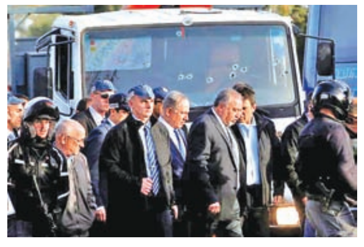
Israeli Prime Minister Benjamin Netanyahu (C) and Defence Minister Avigdor Lieberman visit the scene in Jerusalem.

JERUSALEM—Israel's government has been quick to suggest a Palestinian who rammed a truck into a group of Israeli soldiers at the weekend was inspired by Islamic State, raising questions over how it came to that conclu-