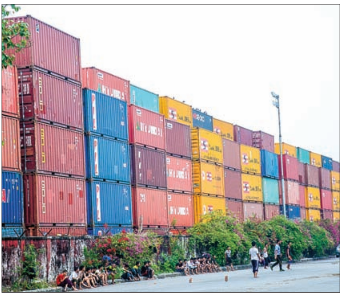
Containers seen at the container yard in Yangon on 8 December 2016.

The MIC permitted investment proposals only after scrutiny of environmental and social impact assessments and sector-specific developments, in keeping with the existing laws. — Mon Mon