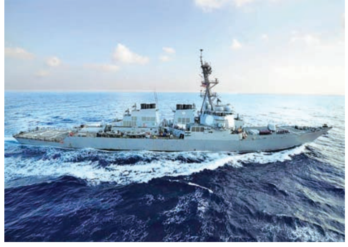
The guided-missile destroyer USS Mahan (DDG 72) transits the Mediterranean Sea in this on 31 August, 2012.

tion team were not immediately available for comment.