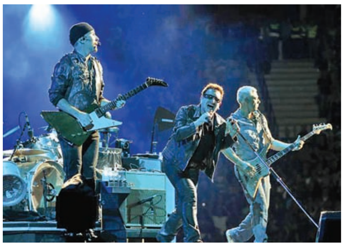
Lead singer Bono (C) of Irish rock band U2 performs with Edge (L) and Adam Clayton (R) during their 360 Degree Tour at King Baudouin Stadium in Brussels on 22 September, 2010.