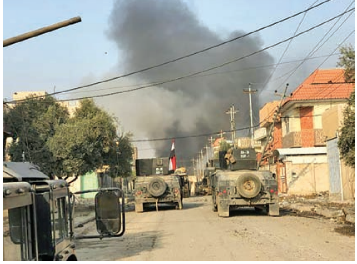
Smoke rises from clashes in Baladiyat district, east of Mosul during a fight with Islamic State, Iraq, on 9 January, 2017.

He said rapid response units and Iraqi army units had fought