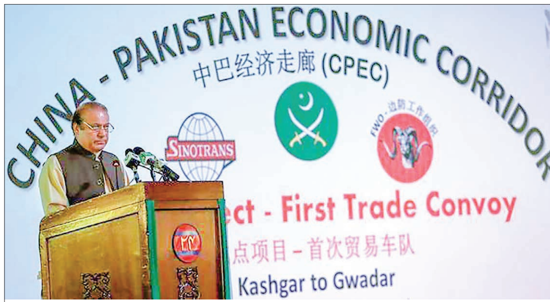
Pakistan’s Prime Minister Nawaz Sharif speaks at the inauguration of the China Pakistan Economic Corridor port in Gwadar, Pakistan, on 13 November 2016.

Students in the audience were sceptical about whether CPEC would benefit the province.