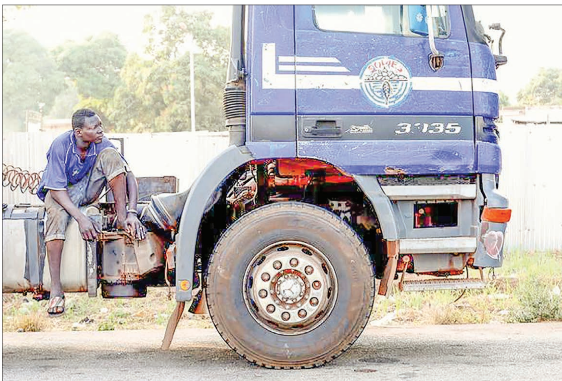
A man sits on a truck in Djebonoua, outside Bouake, as disgruntled soldiers demanding salary increases seized the city of Bouake, Ivory Coast, on 6 January, 2017.

He said the soldiers expect to be paid on Monday.