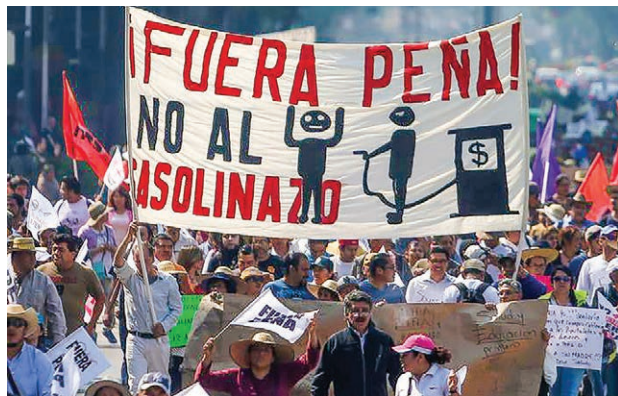
Protesters march during a demonstration against the rising prices of gasoline enforced by the Mexican government at downtown in Mexico City, Mexico, on 7 January, 2017.

Local media reported marches on Saturday in the Mexican states of Sonora, Chiapas, Guerrero, Jalisco, Tabasco and Puebla as well.—Reuters