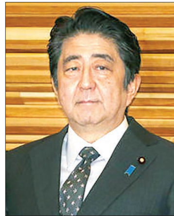
Japanese Prime Minister Shinzo Abe, shown in this undated photo, urged South Korea to remove a new statue dedicated to women forced to work in Japan’s wartime brothels on a TV programme broadcasted on 8 January 2017.

Sources familiar with bilateral relations have said Abe and Trump are arranging a meeting in the United States in late January, shortly after Trump’s inauguration. In November, Abe was the first world leader to meet face-to-face with Trump following his victory over Hillary Clinton.