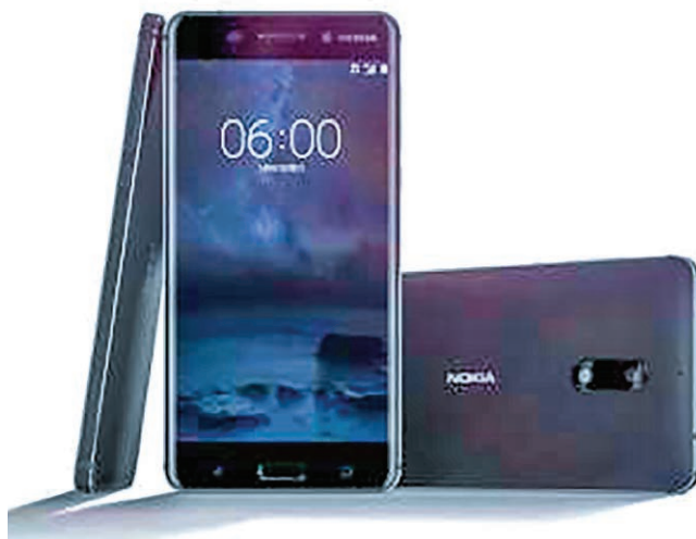
A new Nokia 6 smartphone is seen in this handout image released by HMD to Reuters on 7 January, 2017.

After the 2014 deal, Microsoft continued selling cheaper basic