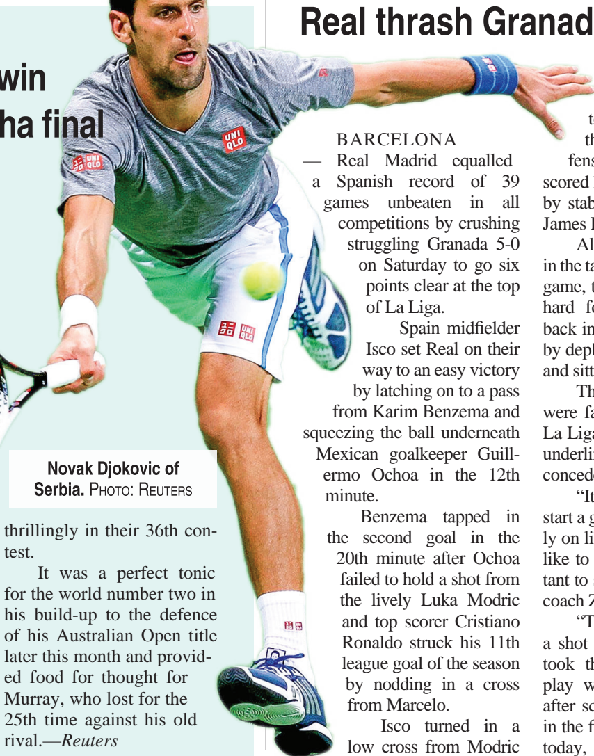
Novak Djokovic of Serbia.

In their first meeting since Murray won their season-ending climax at the ATP World Tour finals, the Briton ran into a rejuvenated Djokovic who, despite having problems with his racket hand and receiving two warnings for his behaviour, prevailed