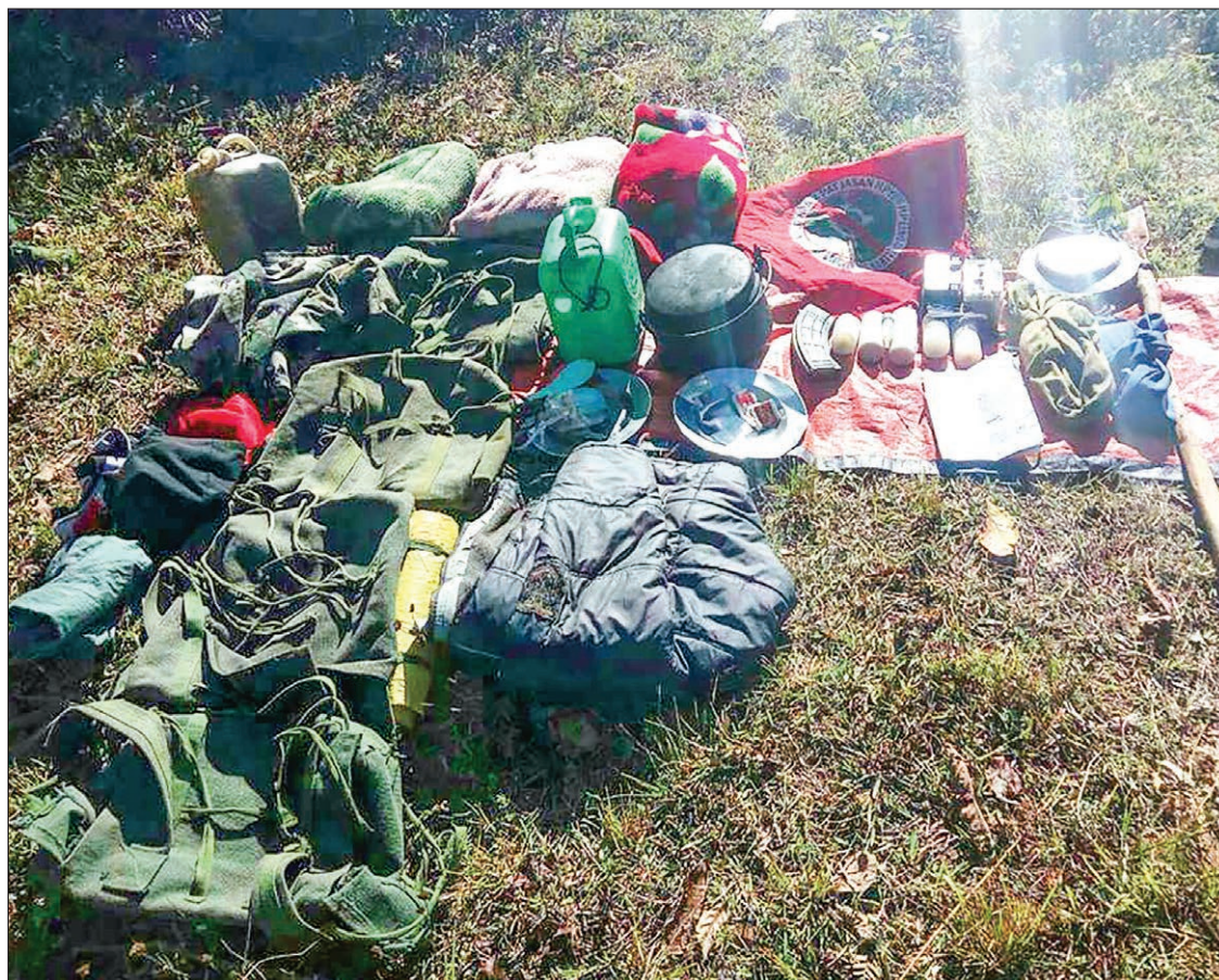
Weapons and ammunitions seized from TNLM group are seen.

WHILE conducting security operations in Kutkai, northern Shan State, columns of government troops came under heavy weapons fire from about 30 members of the Ta'ang National Liberation Army (TNLA) about one mile from Honaung