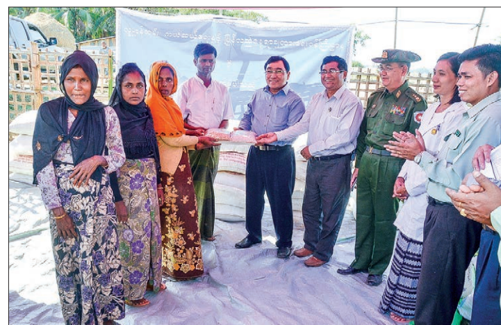
Union Minister Dr Win Myat Aye, fifth from left) delivers aid to villagers on his visit to the villagers in northern Rakhine.

sioner for Refugees, Médecins Sans Frontières (MSF), International Committee of the Red Cross (ICRC), the Japanese aid group BAI, Action Contre la Faim (ACF), Care, the World Food Programme (WFP), Malteser and Community and Family Services International (CFSI). The government mission led by Union Minister Dr Win Myat Aye delivered aid to 25 villagers in northern Rakhine during two days of their trip. — Zin Oo