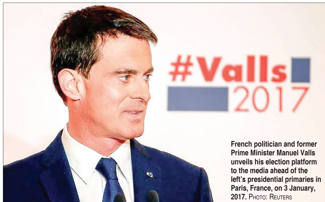
French politician and former Prime Minister Manuel Valls unveils his election platform to the media ahead of the left’s presidential primaries in Paris, France, on 3 January, 2017.

PARIS — Former French prime minister Manuel Valls’ lead over his opponents in upcoming Socialist primaries has narrowed, an Ifop poll published by the weekly Journal du Dimanche showed on Sunday.