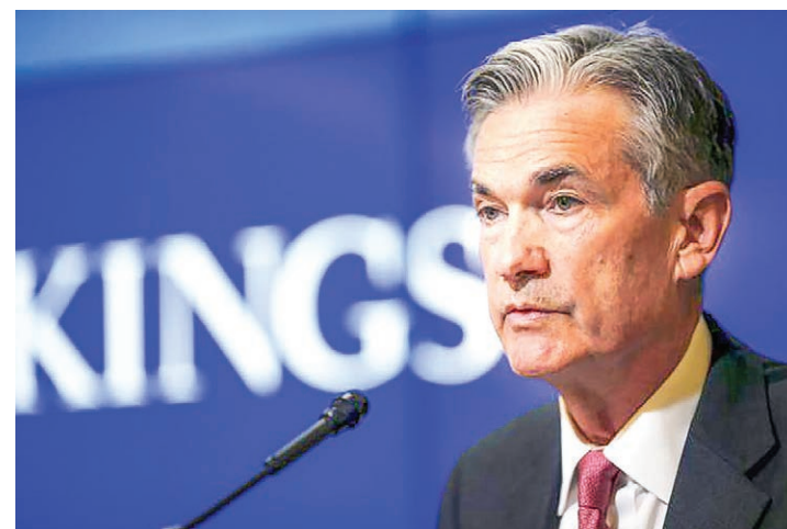
Federal Reserve Governor Jerome Powell delivers remarks during a conference at the Brookings Institution in Washington on 3 August, 2015.