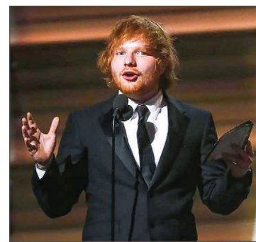
Ed Sheeran accepts the award for Song of the Year for “Thinking Out Loud” at the 58th Grammy Awards in Los Angeles, California, US, on 15 February 2016.

The case is Copeland et al v Bieber et al, US District Court, Eastern District of Virginia, No. 13-00246.—Reuters