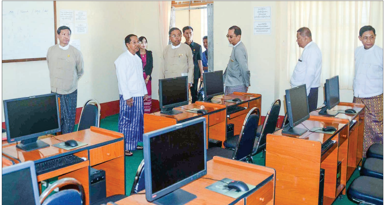
Vice President U Myint Swe (second from left), inspects a lecture room at Taungup Degree College in Rakhine State.

To ease the difficulties, Taungup College was opened in 2012 thanks to the efforts of residents in Tuangup, said the Vice President before adding that it is necessary to improve education