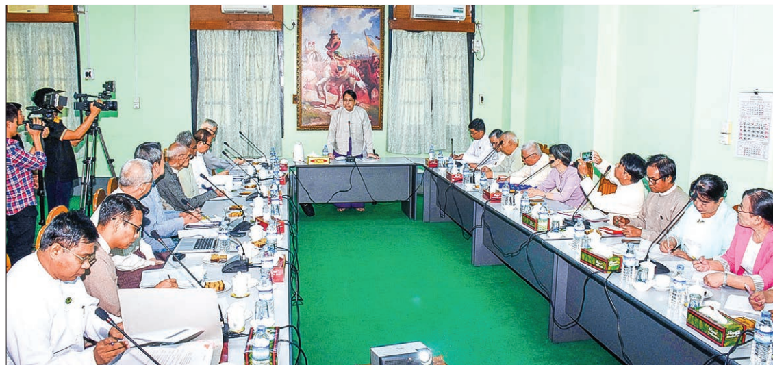
Union Minister Dr Pe Myint addresses at a coordination meeting on the republishing of Myanmar Encyclopedias by the Ministry of Information and the Tun Foundation.

A coordination meeting on the joint republishing of Myanmar Encyclopedias by the Ministry of Information and the Tun Foundation was held at the Printing and Publishing Department in Yangon yesterday, with an address by Union Minister for Information Dr Pe