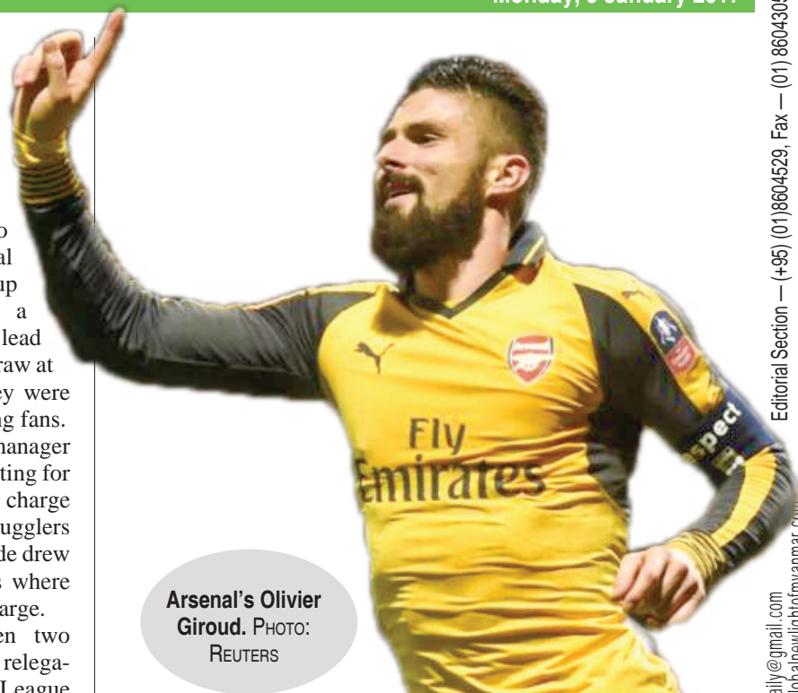
Arsenal's Olivier Giroud.

Arsenal play at Preston North End later and Premier League leaders Chelsea will hope to bounce back from their midweek defeat by Tottenham Hotspur when they host third-tier Peterborough on Sunday. —Reuters