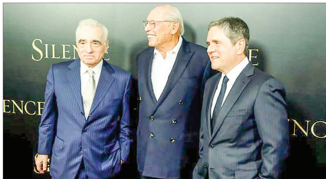
A combination photo shows recording artist Usher in Paris, France on 4 October, 2016, and Justin Bieber performing in Los Angeles, California, US, on 2 December, 2016.

based on the acclaimed 1966 novel of the same name by late Japanese writer Shusaku Endo and was shot in Taiwan.