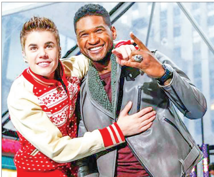
Singers Justin Bieber and Usher (R) pose together after performing on NBC’s ‘Today’ show in New York, US, on 23 November 2011.