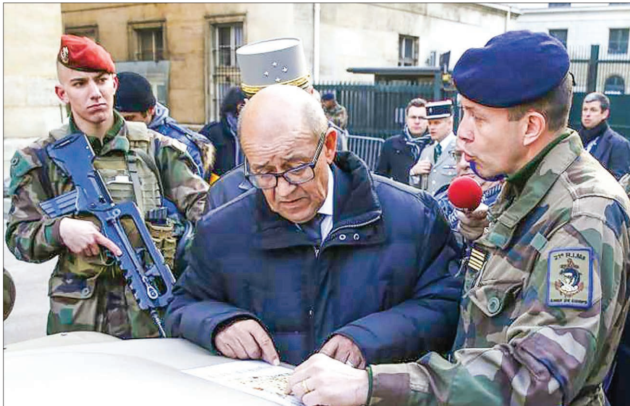
French Defence Minister Jean-Yves Le Drian (C) listens to a soldier who explains a security mission the day before New Year's eve celebrations in Paris, France, on 30 December, 2016.

France will hold presidential elections in April-May and leading conserv-