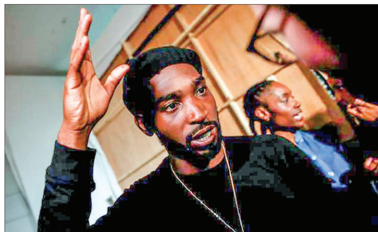
Designer and musician Tinie Tempah speaks during an interview backstage of his What We Wear catwalk show during London Fashion Week Men’s 2017 in London, Britain on 7 January, 2017.

LONDON — British rapper Tinie Tempah made his catwalk debut at London Fashion Week Men’s on Saturday with a minimalistic, casualwear collection inspired by architecture and “the everyday man”.