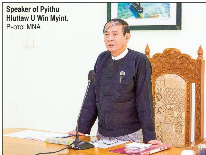
Speaker of Pyithu Hluttaw U Win Myint.