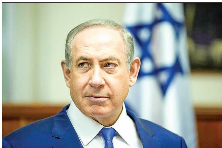
Israeli Prime Minister Benjamin Netanyahu attends the weekly cabinet meeting at his office in Jerusalem on 8 January, 2017.

The Wadi Barada media office denied the Nusra fighters were present in the valley.—Reuters