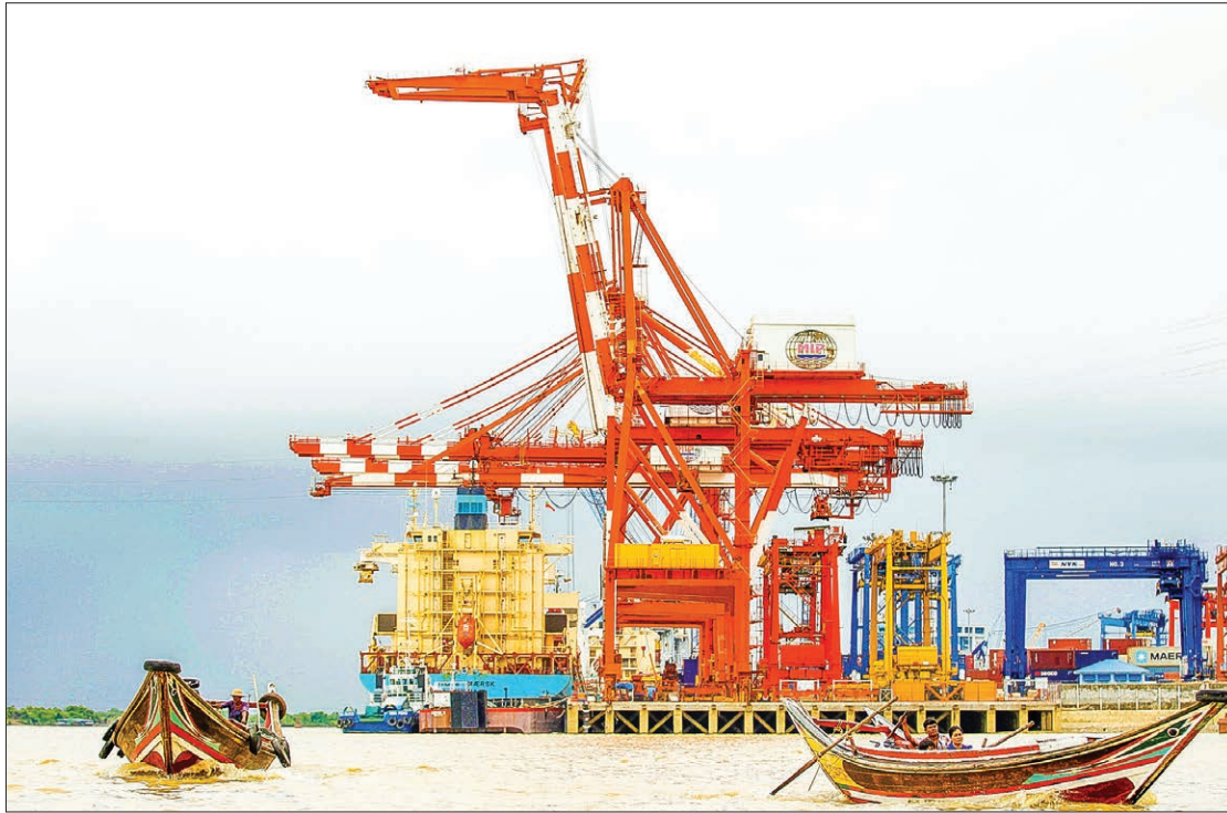
A view shows the Myanmar industrial port terminal at the banks of the Hlaing river in Yangon, on 9 June, 2016.