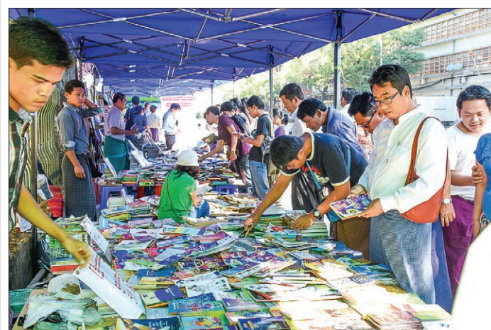
Book shops at the Saturday-Sunday Yangon Books Stree are crowded with visitors on Sunday.