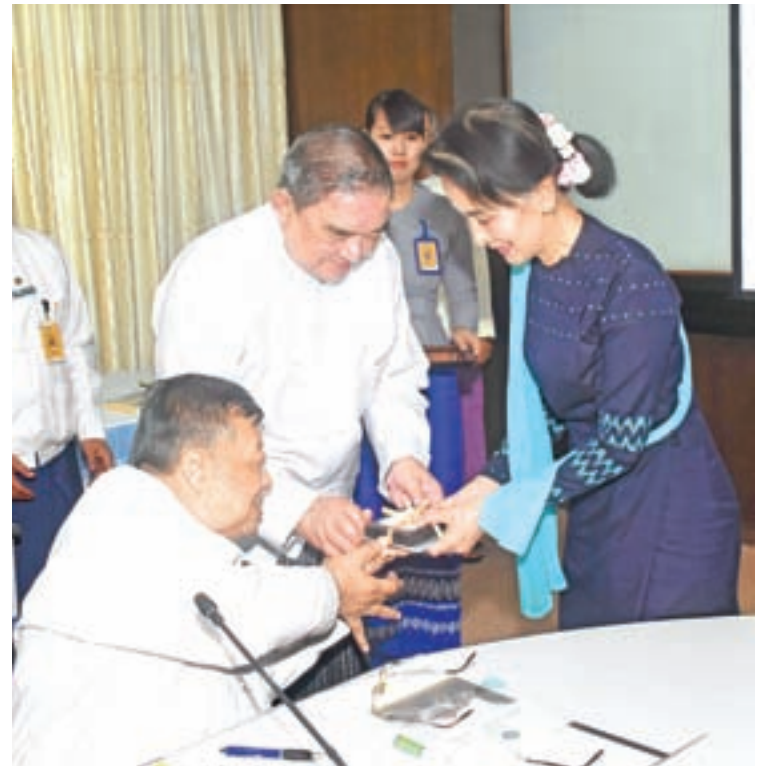
State Counsellor Daw Aung San Suu Kyi meeting with members of Myanmar Institute of Strategic and International Studies (MISIS).