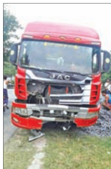
An oil browser vehicle crashed into the motorbike on Yangon-Mawlamyine road, Mon State.

"The motorbike got hooked with the car. Pyayt Son was pronounced dead at the scene while two others were taken to hospital for treatment. The driver of browser fled the scene. The police are still investigating the case," said an official from Yin Nyein police station.