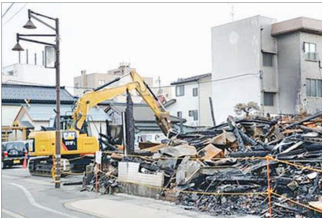
Removal of debris starts on 6 January, 2017, in the Sea of Japan coastal city of Itoigawa, following a 22 December fire which burned down more than 140 buildings.

The next day, Toshihiro Nikai, secretary general of ruling Liberal Democratic Party, told Niigata Gov. Ryuichi Yoneyama