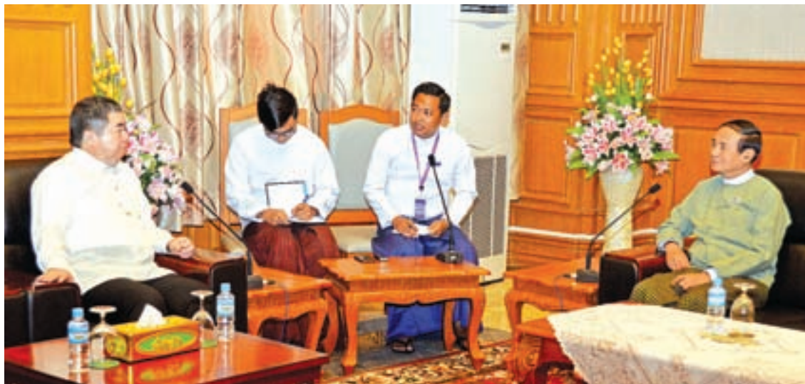
Speaker U Win Myint holds talks with Philippine Ambassador in Nay Pyi Taw.