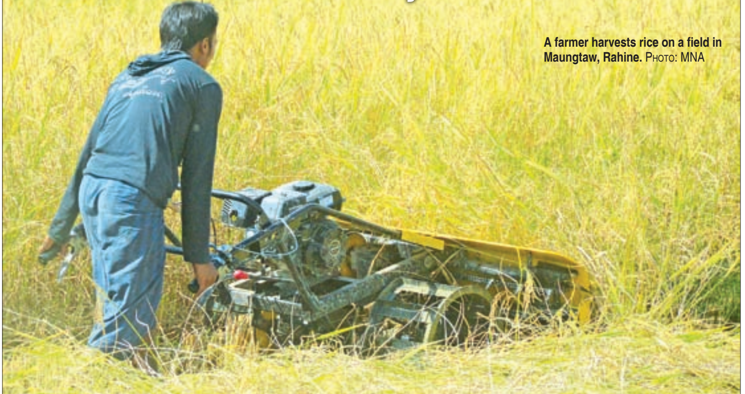
A farmer harvests rice on a field in Maungtaw, Rahine.

ABOUT 180,000 tonnes of Myanmar’s rice will be sold to foreign buyers through normal trade within the first three months of this year, according to the Ministry of Commerce.