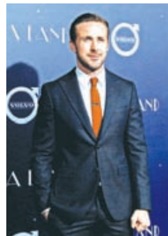
Cast member Ryan Gosling poses at the premiere of 'La La Land' in Los Angeles, California US, on 6 December 2016.