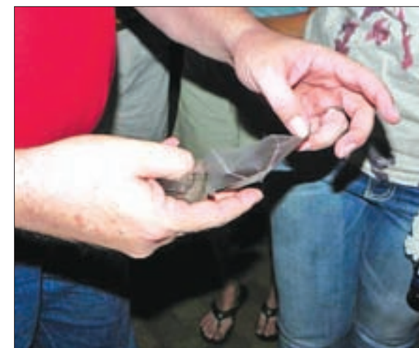
Lesser long-nosed bat captured during a citizen science research project is pictured in southern Arizona in this undated handout photo obtained by Reuters on 5 January 2017. PHOTO: REUTERS

It was declared recovered by Mexico in 2015 and removed from that country's endangered species list. —Reuters