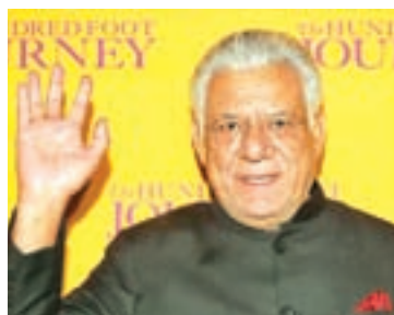
Actor Om Puri arrives for the British gala screening of 'The Hundred-Foot Journey' at the Curzon Mayfair in London, on 3 September 2014.

#RIPomPuri ....cinema has truly lost a brilliant artist," Johar tweeted.