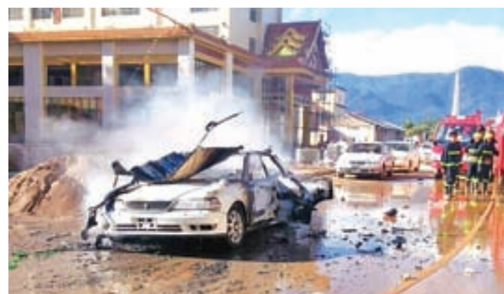
Firefighters put out the fire of Mark II in Laukkai.

The vehicle and its driver, who left the vehicle and took a taxi, were seen on CCTV camera nearby and the authorities are taking measure to arrest the suspect.— Myanmar News Agency