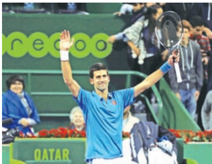
Djokovic celebrates after winning Qatar Open, Men's Singles in Doha, Qatar, on 5 January 2017.

the oldest top-20 player since Ken Rosewall in 1978, lost 6-2, 7-5 to Spain's Fernando Verdasco.