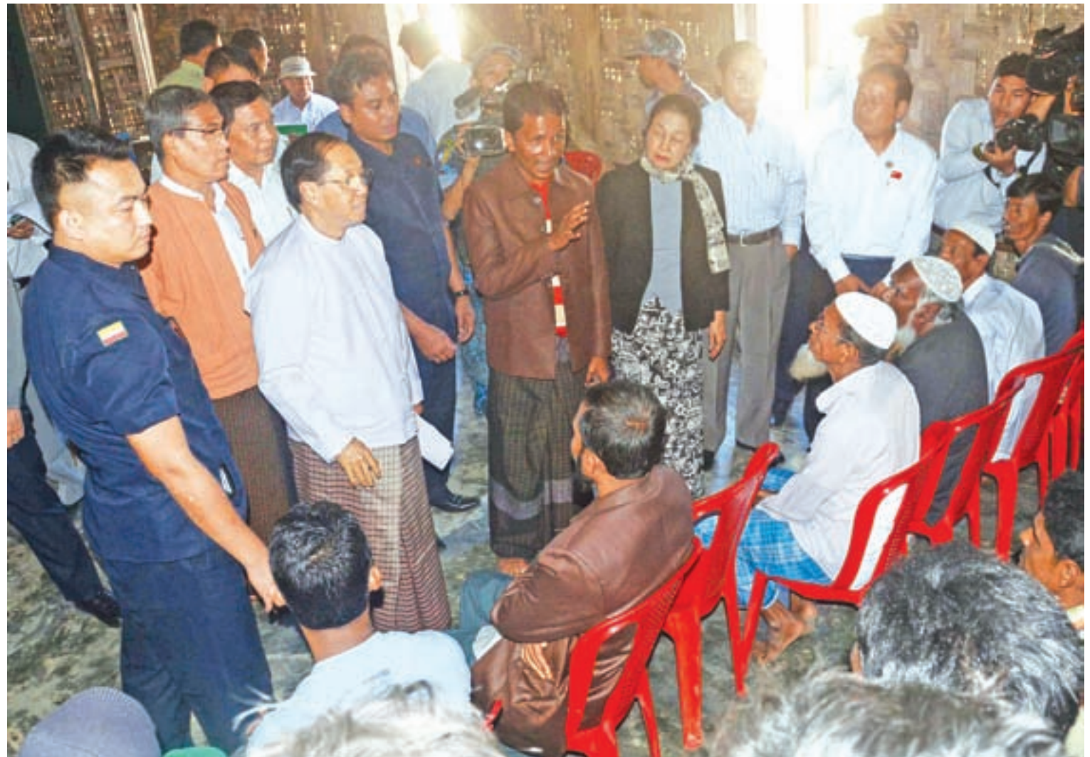
Chairman of Investigation Commission on Rakhine State talks to local people in Zinpaingnyar Village in Maungtau Township.

and the commission met with locals of Myothugyi Village at the post-primary school and talked about security, the socio-economic situation, trade and transportation difficulties and organizing religious events in freedom, before attending to their needs.