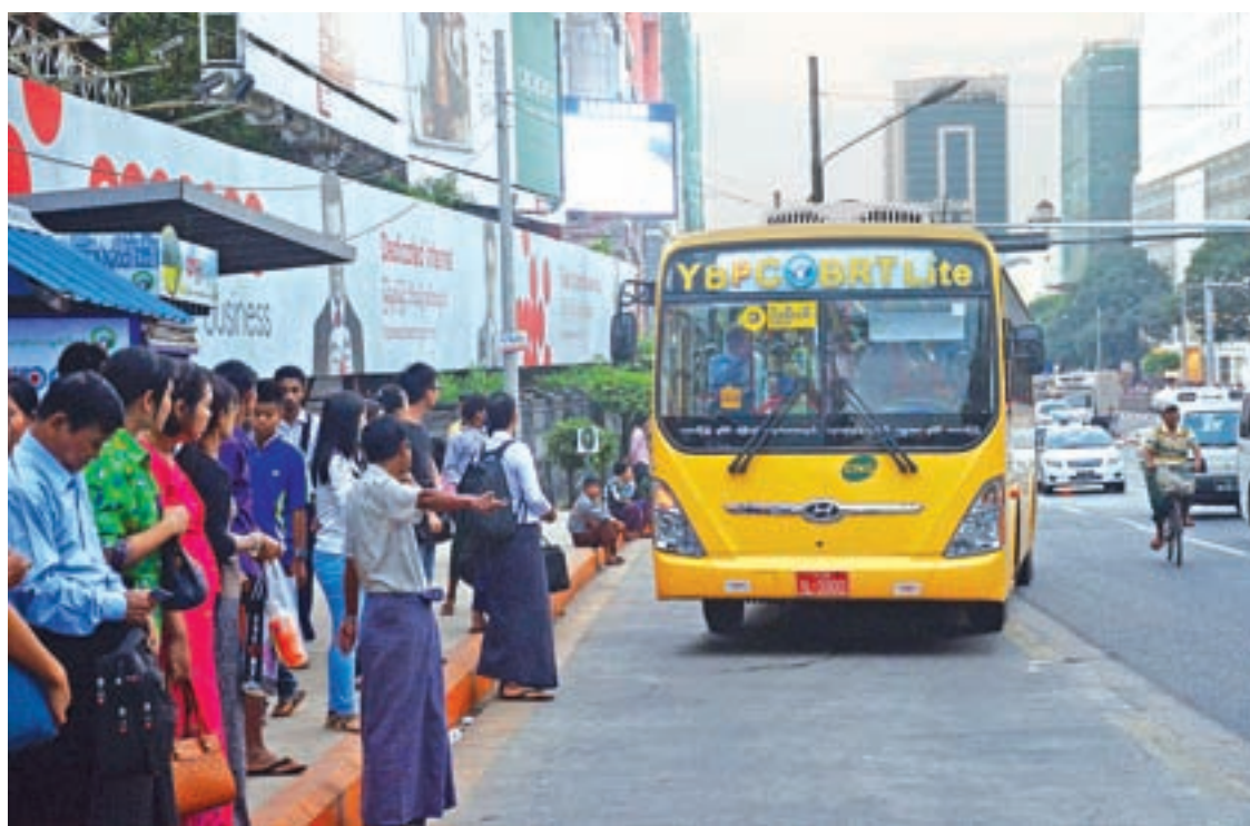
Passengers gather at a bus stop to take BRT bus in downtown Yangon.

There are 20 companies in all, which applied to the Yangon Region Transport Supervision Board to allow them to run in Yangon. It is learnt that by the end of 2017, public-owned bus lines that the Yangon Region government itself will invest their