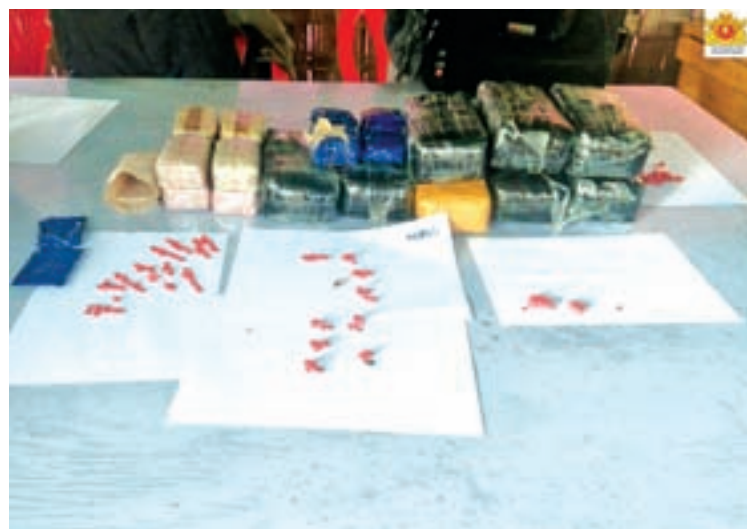
Seized package wrapped with black-color polyethylene bags.

DURING the patrol in the river Naf in Maungtaw Township, security forces found a suspected boat rowing into the border area of the neighboring countries at about 4:30 am yesterday and chased it. Due to the pursuit of the suspected boat, those on board escaped, leaving the boat at the bank. The security forces searched it, finding a package wrapped with black-color polyethylene bags.