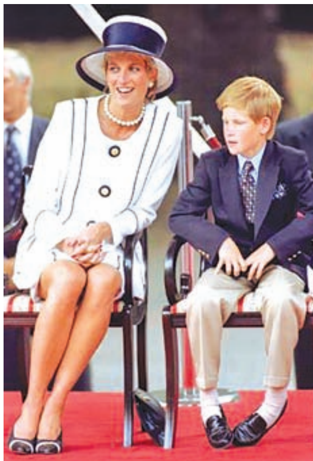
Britain's Diana, the Princess of Wales and Prince Harry attend VJ (Victory over Japan) Day ceremonies in the Mall, in London, on 19 August 1995.