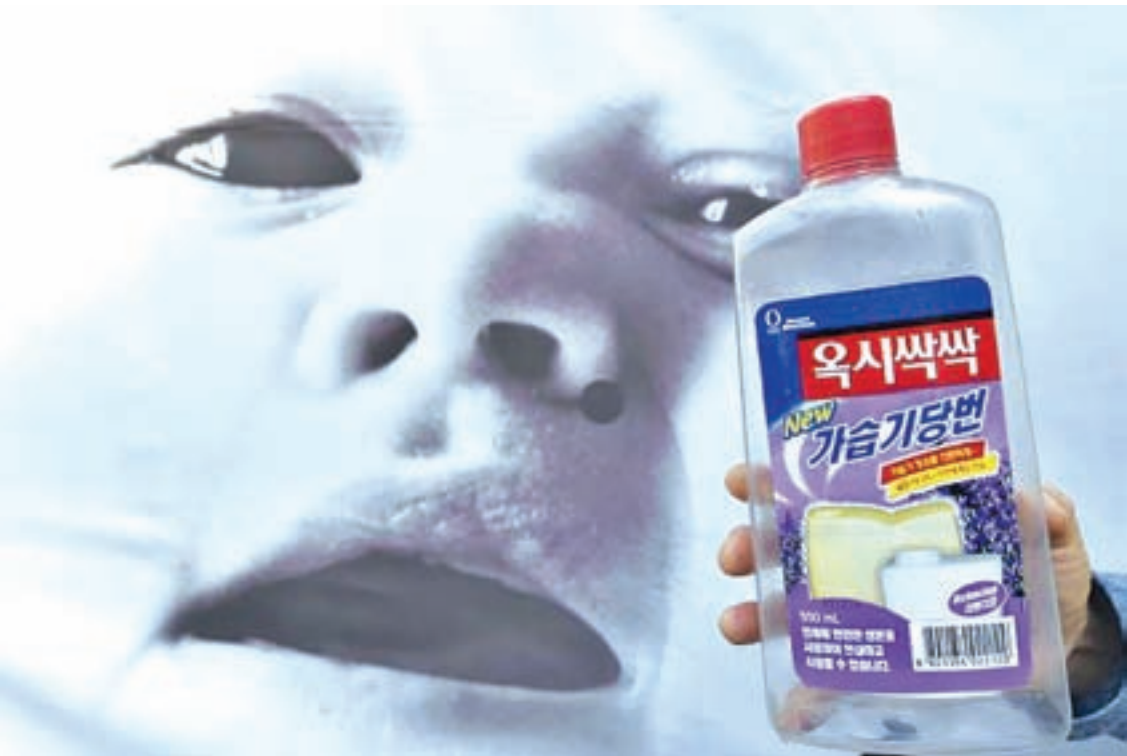
A protestor poses with a sample bottle during a demonstration ahead of Reckitt Benckiser's annual general meeting, over claims that a sterilising hygiene product made by the company has led to deaths in South Korea, in London, Britain on 5 May 2016.