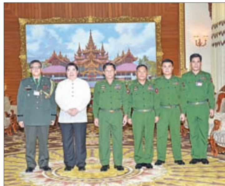
Senior General Min Aung Hlaing poses for a documentary photo with Philippine ambassador at Byintnaung guest house.

The AA has also been involved in violence attacks in northeastern Shan State together with the KIA and has now resorted to violence acts in Rakhine State with the aim of undermining the stability in Rakhine State.— Myanmar News Agency