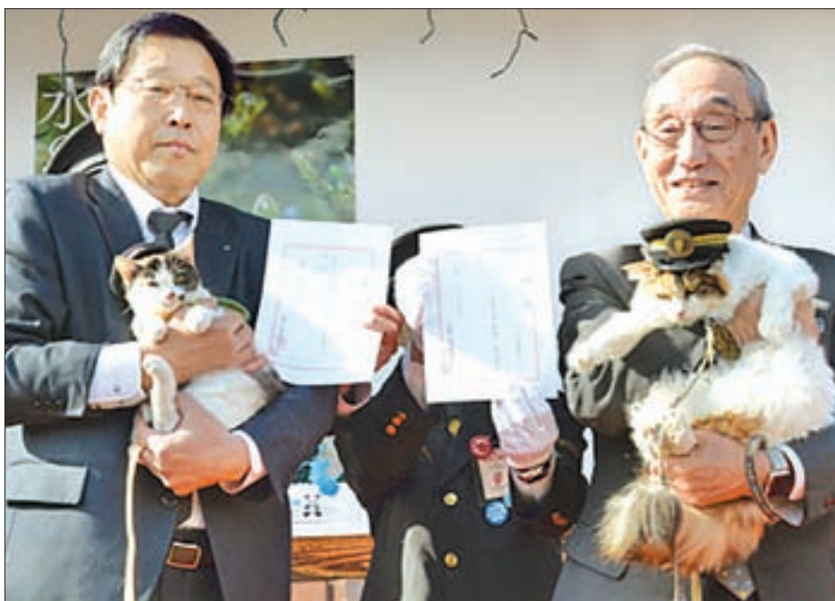
Yontama (L), an 8-month-old calico cat, receives a letter of appointment from Wakayama Electric Railway Co. on 5 January 2017.

Tama became the master of Kishi Station on 5 January, 2007. Until its death in June 2015, the stationmaster cap-wearing Tama entered