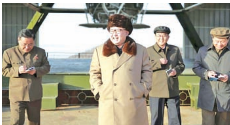
North Korea leader Kim Jong Un smiles as he visits Sohae Space Centre in Cholsan County, North Pyongan province for the testing of a new engine for an intercontinental ballistic missile (ICBM) in this undated photo released by North Korea’s Korean Central News Agency (KCNA) on 9 April 2016.

“With every passing day the threat does get more acute,” Blinken said, and referred to comments by North Korea’s leader, Kim Jong Un, on Sunday that his country was close to test-launch-