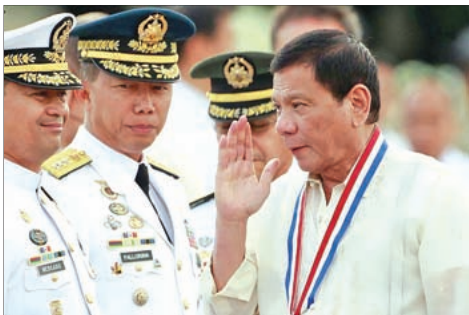
President Rodrigo Duterte returns the salute of a military officer (not pictured) as he leads the death anniversary celebration of Filipino national hero Dr Jose Rizal in Manila, Philippines, on 30 December 2016.

Duterte has thrown the future of Philippine-US relations into question with angry outbursts against the United States, a former