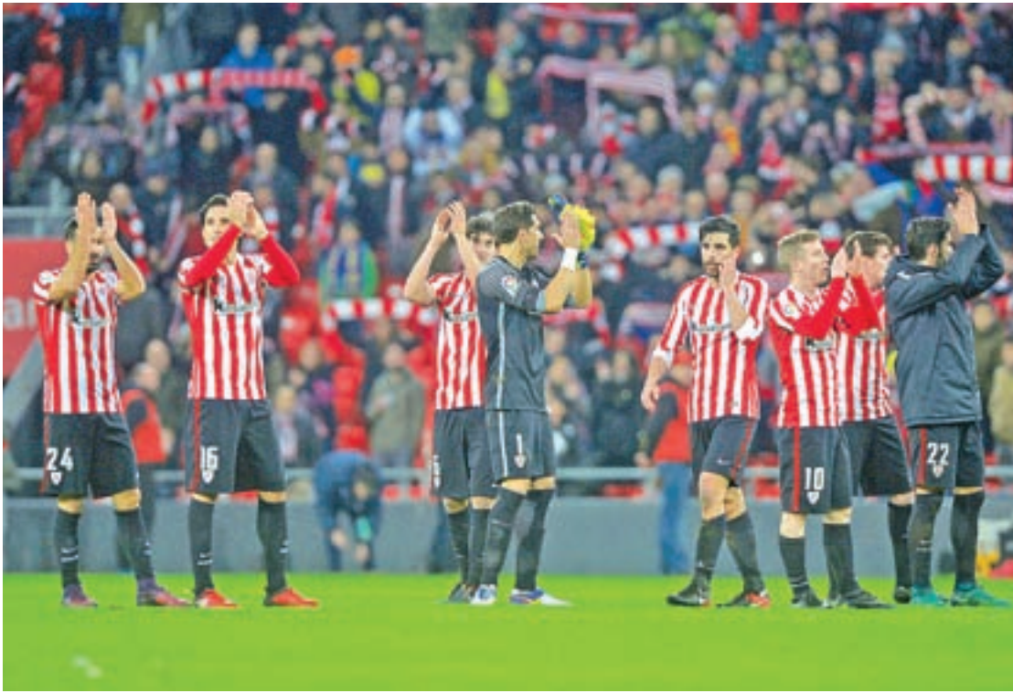
Athletic Bilbao players celebrate victory in King's Cup soccer match at San Mames stadium, Bilbao, Spain on 5 January 2017.