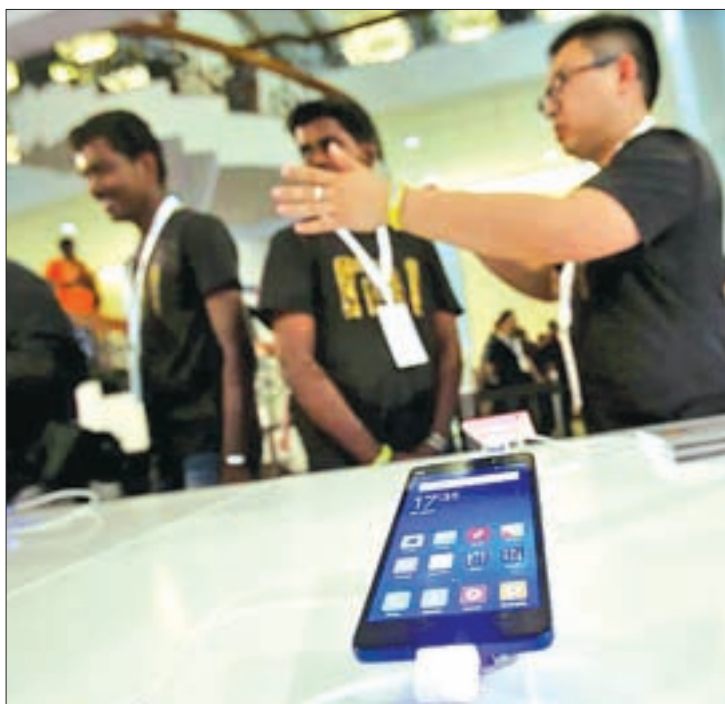
A Xiaomi's Mi 4i phone is kept on display at the venue during its launch in New Delhi, in 2015.

Celebrity endorsements from Bollywood actors like Hrithik Roshan and Ranveer Singh, along with huge sponsorship campaigns by brands such as Oppo and Gionee of the