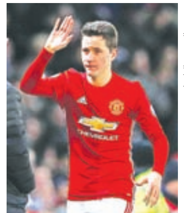
Manchester United's Ander Herrera.

"But, we are United, we have to fight for every trophy and at home against Reading we have the obligation to try to win, to score goals and to get to the next round," he added.—Reuters