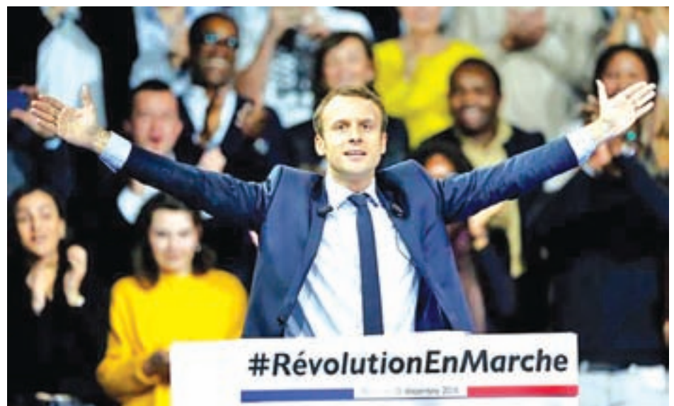
Emmanuel Macron, head of the political movement En Marche!, or Forward!, and candidate for the 2017 French presidential election, attends a political rally in Paris, France, on 10 December 2016.

Macron polled at between 16 per cent and 24