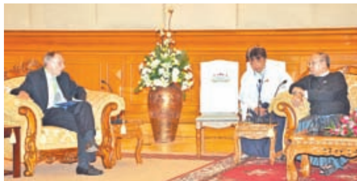
Speaker Mahn Win Khaing Than holds talks with National Democratic Institute (NDI) Director in Nay Pyi Taw.