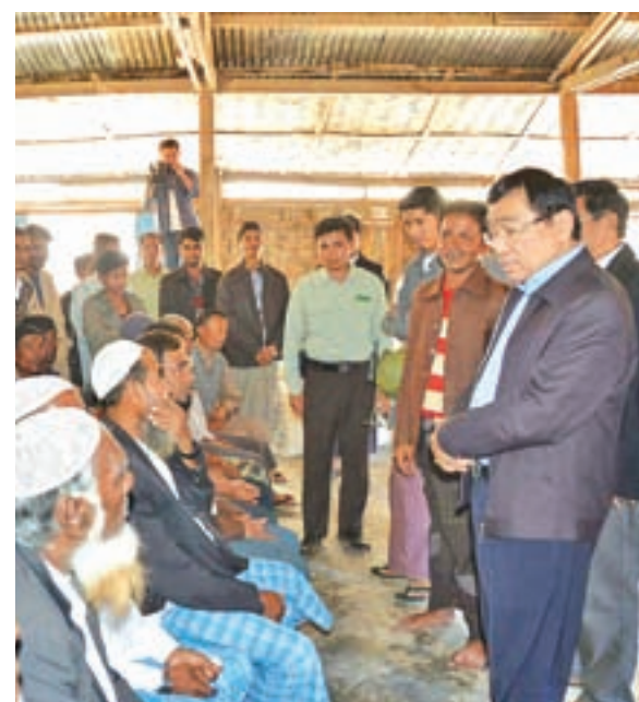
Union Minister Dr Win Myat Aye meeting with local people at a village in Maungtaw Township.

The team led by Union Minister for Social Welfare, Relief and Resettlement Dr Win Myat Aye delivered 320 bags of rice and 639 viss of peas to the villagers in villages in Zinpaingnya Village-tract, Hlaphokaung Village, Kyaukpyinseik Village, ThuOoLar Village, Thaye-toak Village and Darkyis-