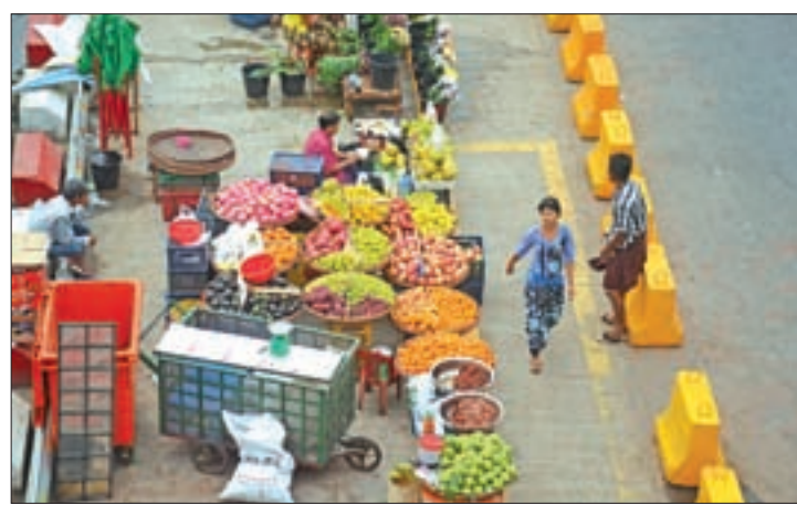
Vendors are seen at Strand Road in downtown Yangon on 8 December 2016.

The new night market will have approximately 130 stalls.