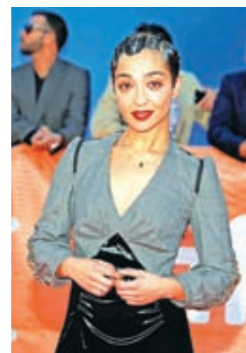
Ruth Negga arrives on the red carpet for the film 'Loving' during the 41st Toronto International Film Festival (TIFF), in Toronto, Canada, on 11 September 2016.

Past winners, who are voted for by the public, include "Star Wars: The Force Awakens" actor John Boyega and Oscar nominee Tom Hardy. BAFTA will announce the full list of nominees for this year's film awards, which will be held on 12 February, next week.—Reuters