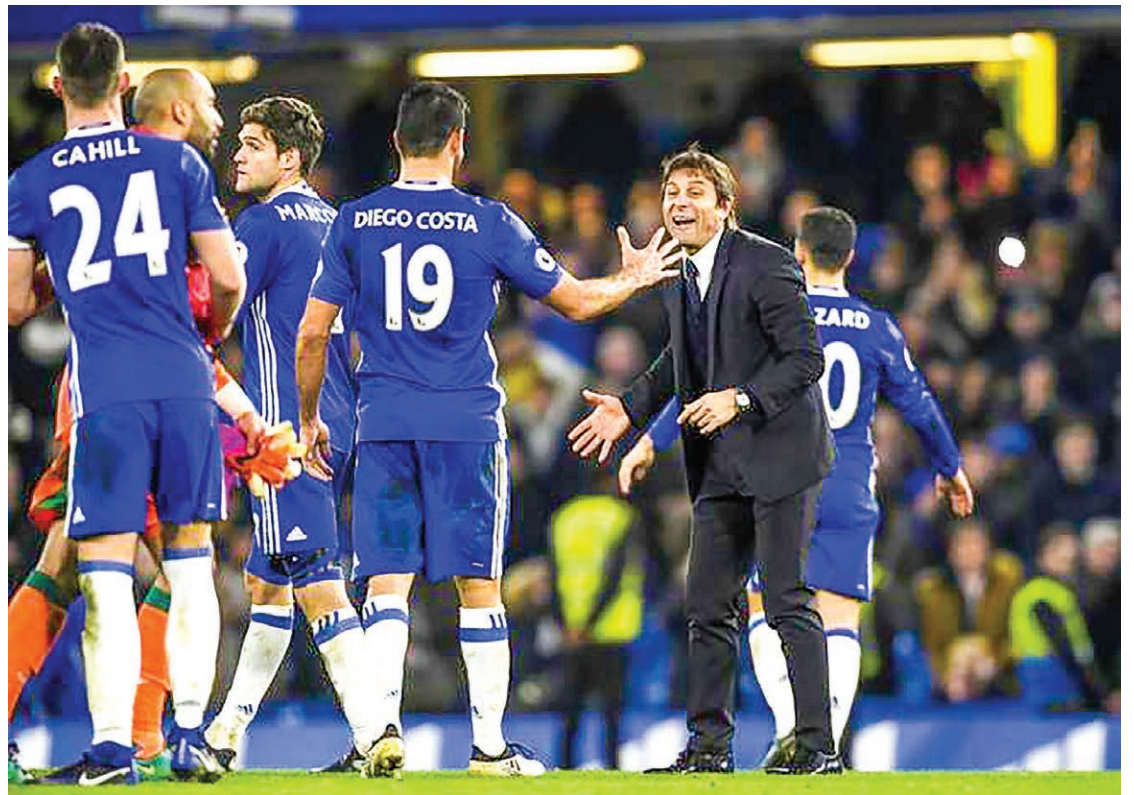
Chelsea's Diego Costa and Chelsea manager Antonio Conte celebrate after the win at Stamford Bridge Chelsea v Stoke City - Premier League - 31/12/16 after the game Liverpool

LONDON — Chelsea were given a stiff examination by Stoke City at Stamford Bridge on Saturday before extending their lead at the top of the Premier League to nine points ahead of the late game between Liverpool and Manchester City.