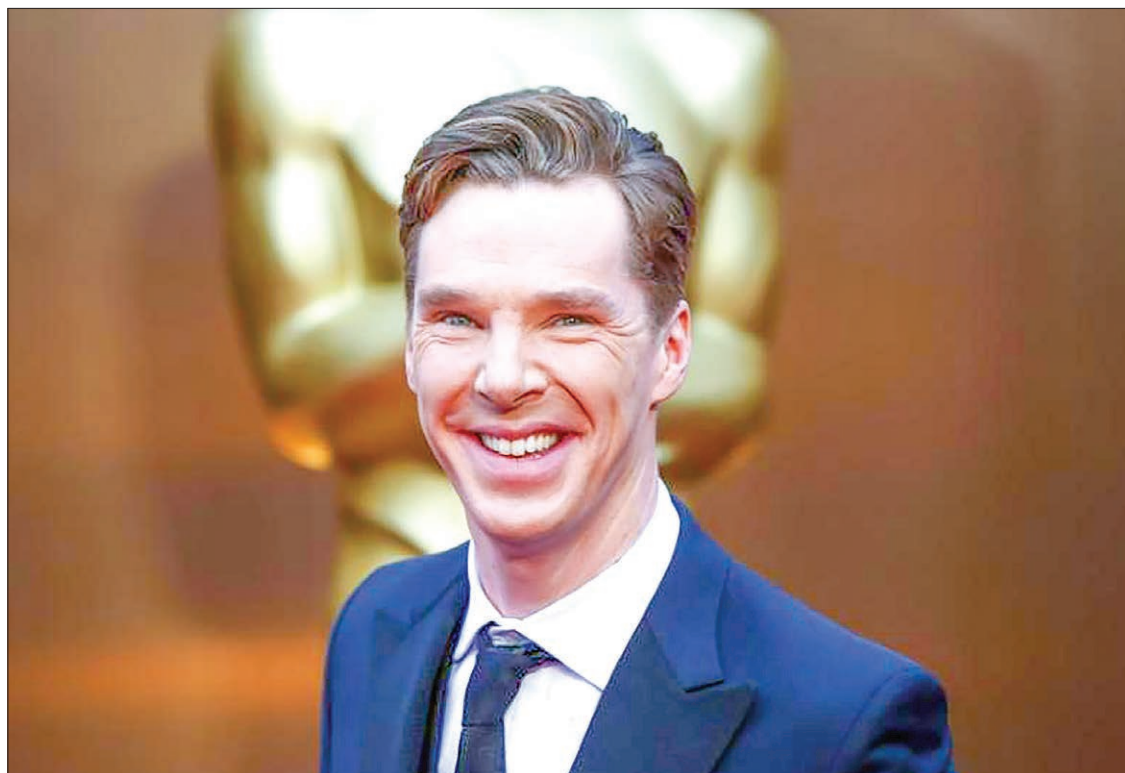
Actor Benedict Cumberbatch arrives at the 86th Academy Awards in Hollywood, California on 2 March, 2014.

The show, in which Cumberbatch plays Holmes as a haughty, socially inept detective to Martin Freeman's calm, practical Dr John Watson, is the most popular TV drama in Britain, according to ratings data, and has been sold to 180 other countries.