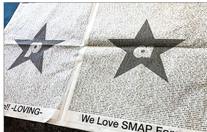
Photo shows part of an eight-page ad placed by thousands of fans of SMAP, one of Japan's most popular and longest-lived pop groups, in the morning edition of major Japanese daily the Asahi Shimbun on 30 December, 2016, a day before SMAP's breakup.

SMAP defied stereotypes of Japanese male idol groups known for separating after a short time, and remained popular for three decades at home and abroad, especially in Asia.—Kyodo News