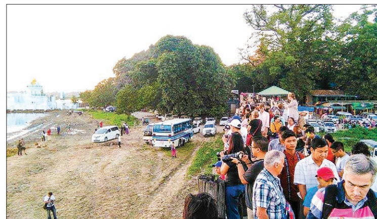
U Bein Bridge, a crossing that spans Taungthaman Lake near Amarapura. The 1.2-kilometre (0.75 m) bridge was built around 1850 and is believed to be the oldest and longest teakwood bridge in the world. It is used as an important passageway for the local people and has also become a tourist attraction.

Holding the International Tourism Expo, Myanmar 2017 will make the Myanmar travel and tourism industry develop and increase the country's foreign exchange earnings from tourism. Also, travel-related business sectors will develop and it will provide assistance to develop the tourism areas. — Soe Win (MLA)