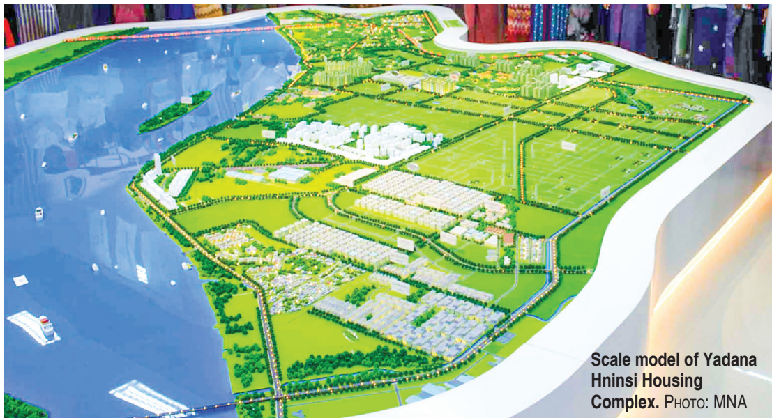
Scale model of Yadana Hninsi Housing Complex.