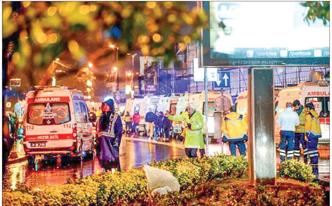
Ambulances line up on a road leading to a nightclub where a gun attack took place during a New Year party in Istanbul, Turkey, on 1 January, 2017.

Turkey is part of the US-led coalition against Islamic State and launched an incursion into Syria in August to drive the radical Sunni militants from its borders. It also helped broker a fragile ceasefire in Syria with Russia.