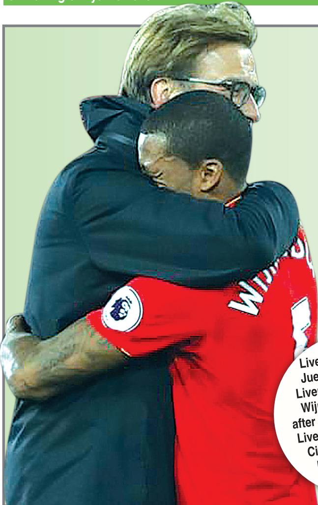
Liverpool manager Jurgen Klopp and Liverpool's Georginio Wijnaldum celebrate after the match between Liverpool v Manchester City at Anfield on 31 December, 2016.