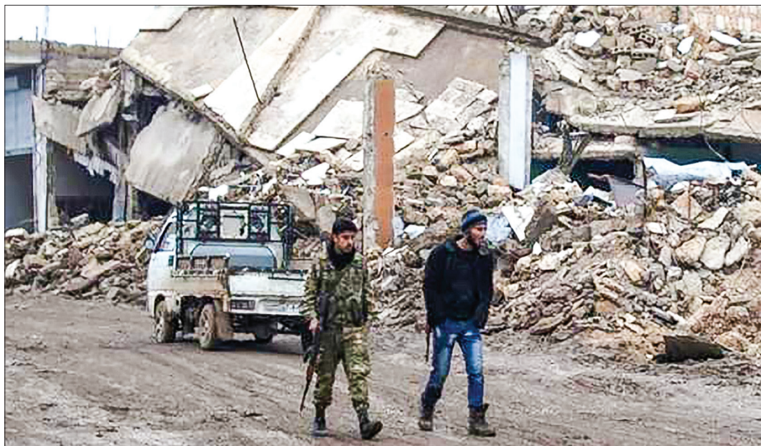
Rebel fighters walk near damaged buildings in al-Rai town, northern Aleppo countryside, Syria, on 30 December, 2016.

The Syrian Observatory for Human Rights monitoring group confirmed that there had been fighting in the area, source of most of the capital's water, and said there had also been government shelling in the southern provinces of Quneitra and Deraa. —Reuters