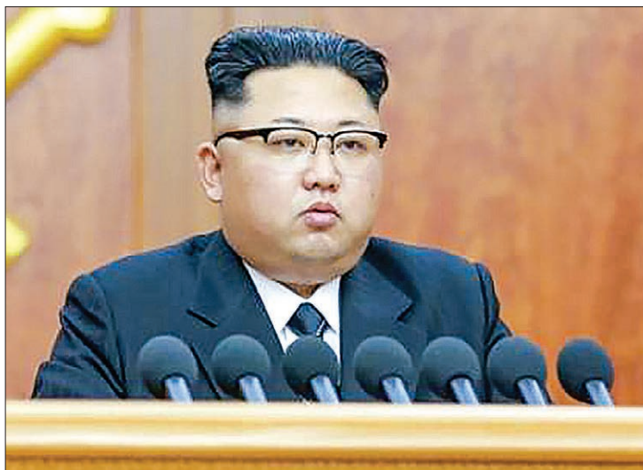
North Korean leader Kim Jong Un gives a New Year address for 2017 in this undated picture provided by KCNA in Pyongyang on 1 January 2017.

struggled to reliably deploy its intermediate-range Musudan ballistic missile, succeeding just once in eight attempted launches last year.