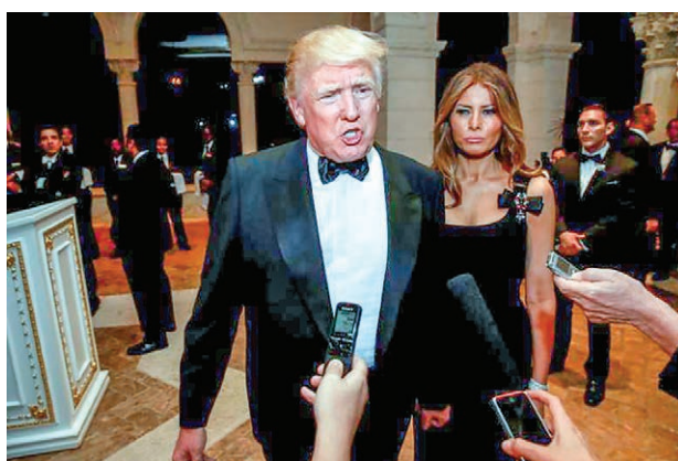
US President-elect Donald Trump.

Talk of a stop-over in the United States by the Tai-