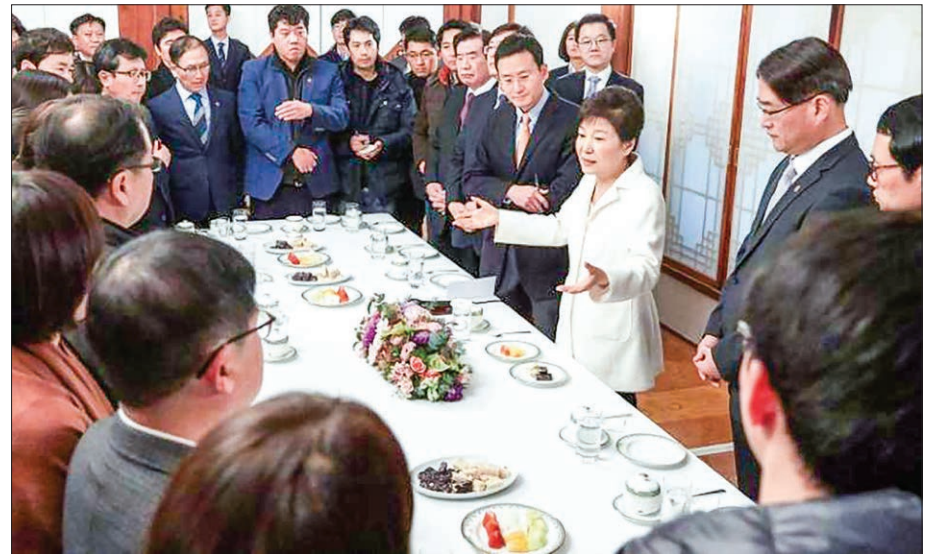
South Korean President Park Geun-hye speaks during a meeting with reporters at the Presidential Blue House in Seoul, South Korea, in this handout picture provided by the Presidential Blue House and released by Yonhap on January 1, 2017.

Park was quoted on Sunday as saying that the decision by the country's national pension fund to back a merger between