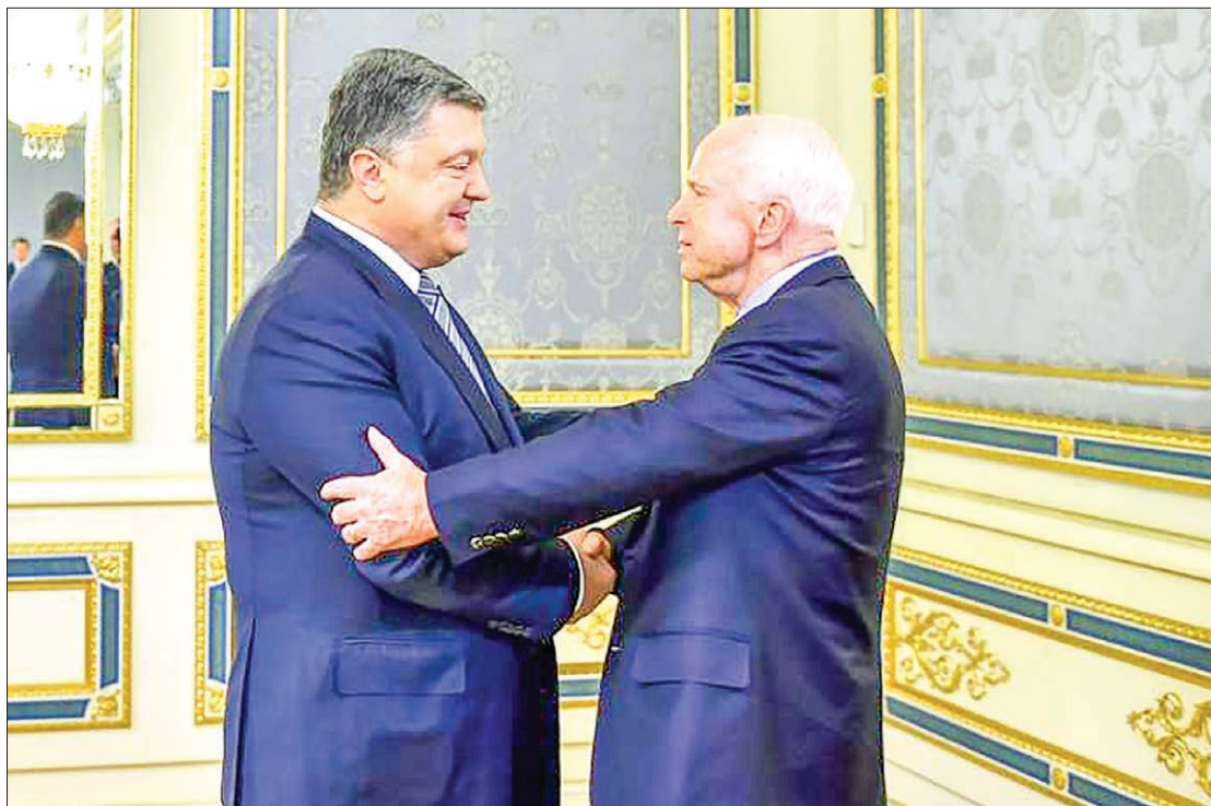
Ukrainian President Petro Poroshenko (L) greets US Senator John McCain during a meeting in Kiev, Ukraine, on 30 December, 2016.

"Talking of isolation for a project that, on the contrary, takes part in the flow of history, after Brexit and Donald Trump's election ... is a clear misunderstanding of the world's evolution and peoples' deep aspirations," Le Pen said. —Reuters