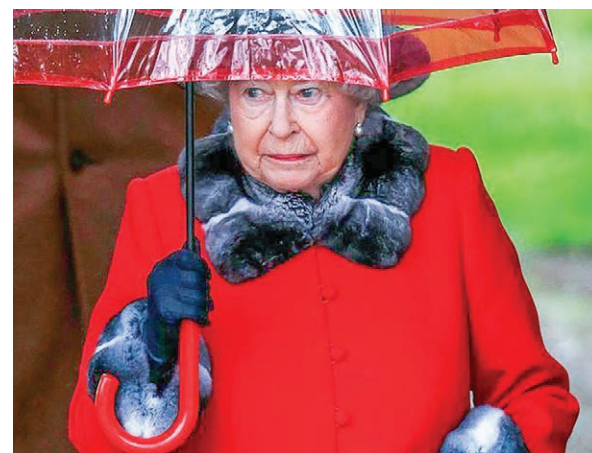
Britain's Queen Elizabeth.