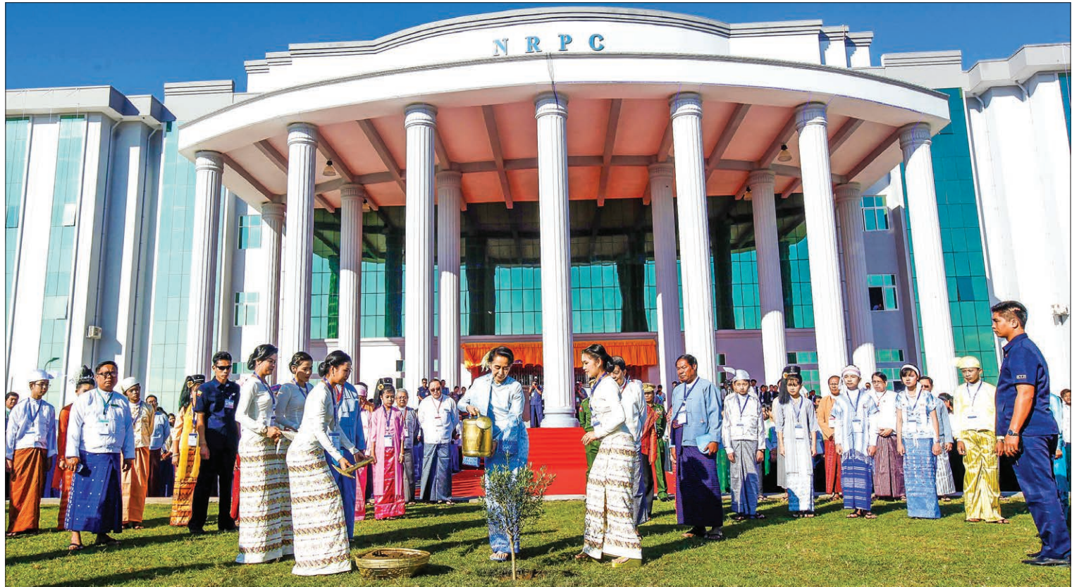
State Counsellor Daw Aung San Suu Kyi plants an olive tree in front of the National Reconciliation and Peace Centre in Nay Pyi Taw.

Daw Aung San Suu Kyi stressed the need to have honest