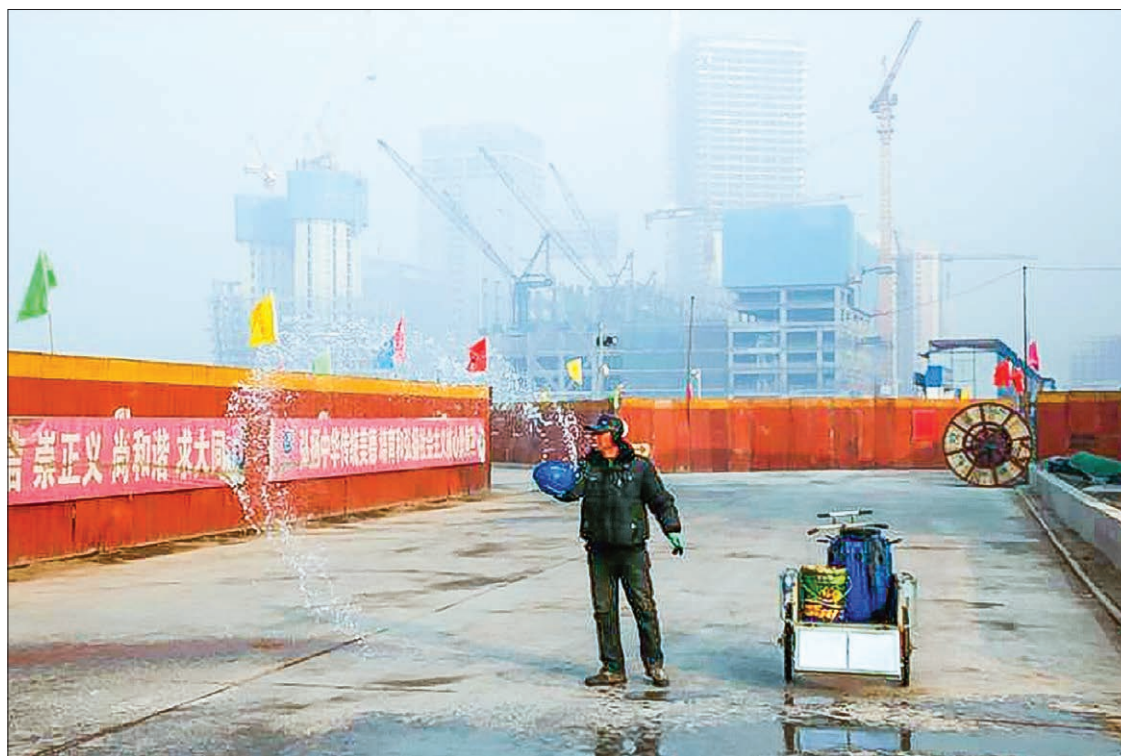
A worker sprinkles water onto a road at a construction site in Beijing, China, on 31 December, 2016.

But the government is cracking down on speculative property buying, and signals from policymakers that more will be done to contain asset bubbles and rising debt — even at the expense of slower growth — means extra stimulus measures could be limited.