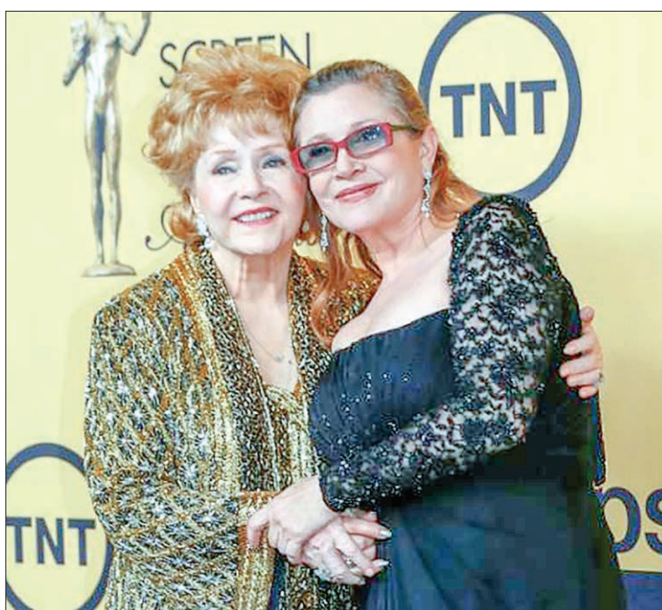
Actress Debbie Reynolds poses with her daughter actress Carrie Fisher.

er, best known as Princess Leia in the "Star Wars" films, died a day earlier on Tuesday, four days after suffering a heart attack on a flight from England, where she had been shooting the third season of a British television comedy. She was 60.