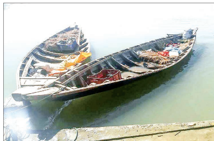
Two boats used by 25 villagers in an attempt to travel to Bangladesh.

The detainees will be handed over to the Maungtaw Myoma Police Station for further investigation.—Myanmar News Agency