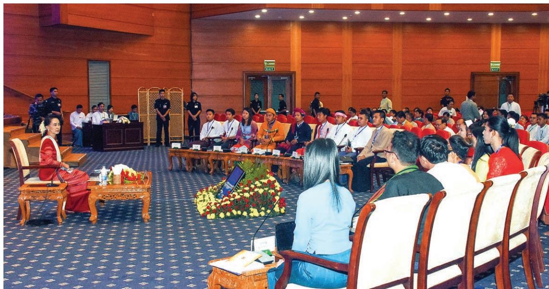
State Counsellor Daw Aung San Suu Kyi talks to youths at the Peace Talk in Nay Pyi Taw.

"There are priorities which we have unveiled since the government was formed by the National League for Democ-