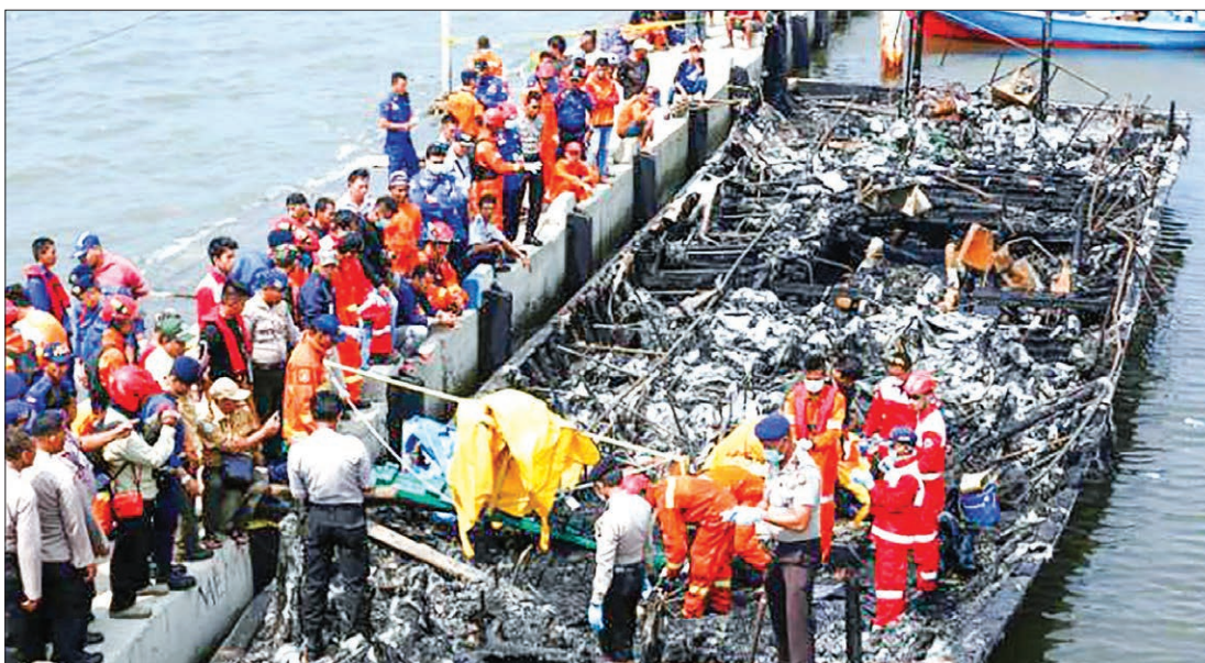
Police and rescue workers search a boat for victims at Muara Angke port in Jakarta, Indonesia on 1 January, 2017.

Sea accidents are frequent in Indonesia, a sprawling archipelago, with vessels often overloaded and having too few life jackets on board.—Reuters