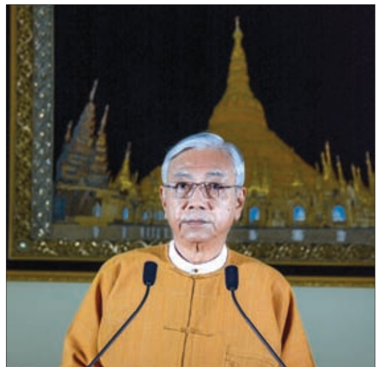
President U Htin Kyaw.

“An obvious example was the signing of the Panglong Pact in 1947. The Panglong Pact was a symbol of the unity of all indigenous races, and attainment of Myanmar independence could be attributed to this unity”.