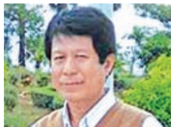
U Myo Kyaw, Member of the Central Executive Committee, Rakhine National Party.

IN the time of the new government that we believe in, I'd like to urge the people to cooperate with the government in the new year for achieving peace, democracy and federal affairs. Only then will the wishes of the people be fulfilled. I wish all the people of the country physical and mental well-being.