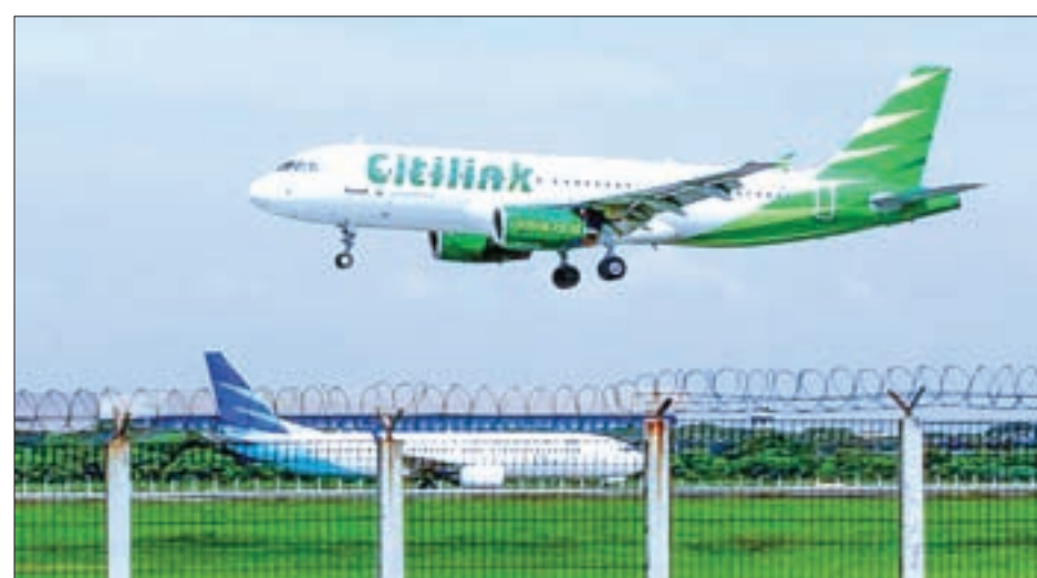
A Citilink Airbus A320 approaches for a landing at Soekarno-Hatta International Airport in Jakarta, in 2013.

The transportation ministry had sent a warning letter to Citilink and called for