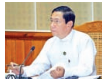
U Than Htay, Chairman of the Union Solidarity and Development Party.

The first day of the New Year 2017 is an auspicious day. We are determined to join hands with the people with our willingness to help people, our intellectual strength and unity based on our nature to serve people wherever we are. It is necessary to work in the interests of the people practically. I wish all people in Myanmar liberty, justice and socio-economic development in the New Year.