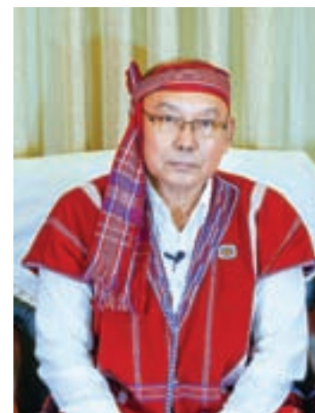
Mahn Win Khaing Than, Speaker of Amyotha Hluttaw.

I wish all of you—Myanmar citizens, a peaceful and prosperous life, as of 2017.