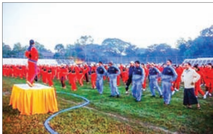
Participants gathering to start the mass walking activity.

At the end of the event, the District Sport and Physical Education Department arranged the lucky draw programme for participants.— Shwe Win (Pyay)