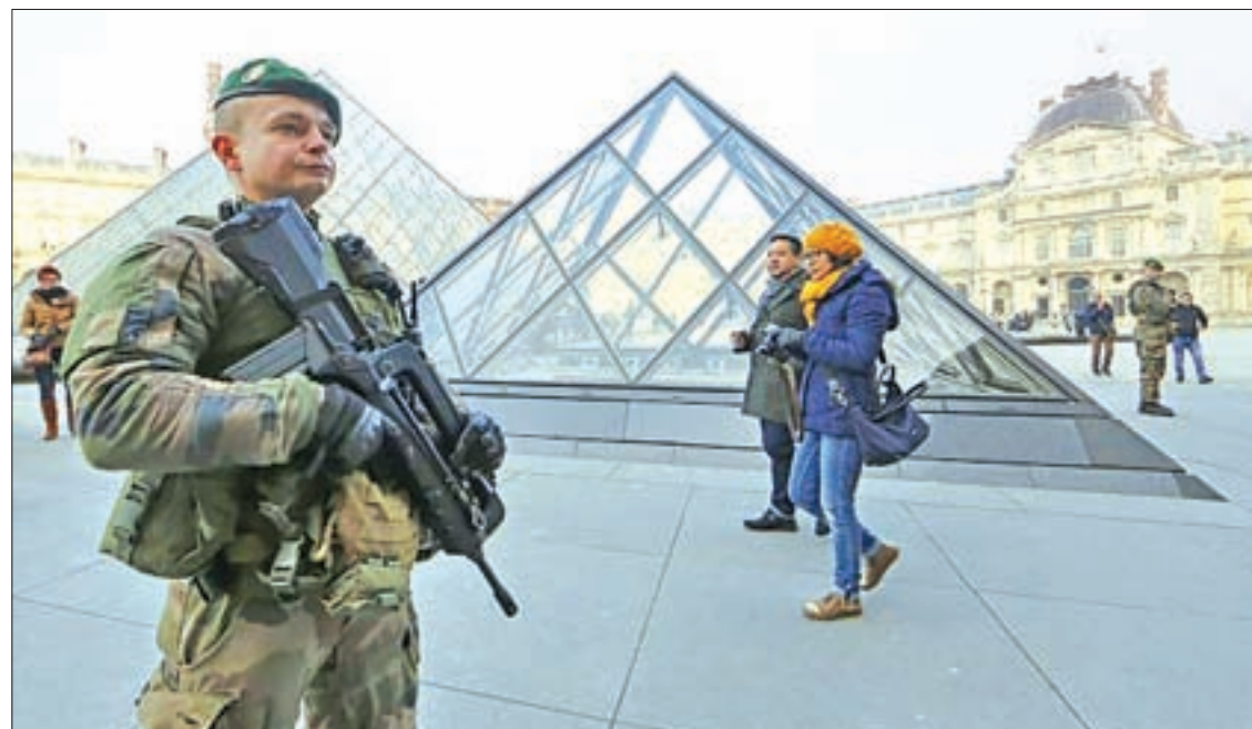
Armed French soldiers patrol at the Louvre Museum as emergency security measures continue ahead of New Year’s eve celebrations in and around the French capital, in Paris, France, On 30 December 2016.

In Brussels, where Islamist suicide bombers killed 16 people and injured more than 150 in March, the mayor was reviewing whether to cancel New Year fireworks, but decided this week that they would go ahead.—Reuters