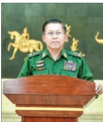
Senior General Min Aung Hlaing.

cordance with its duty to protect the sovereignty of the State and the lives and property of the people and to prevent the detrimental