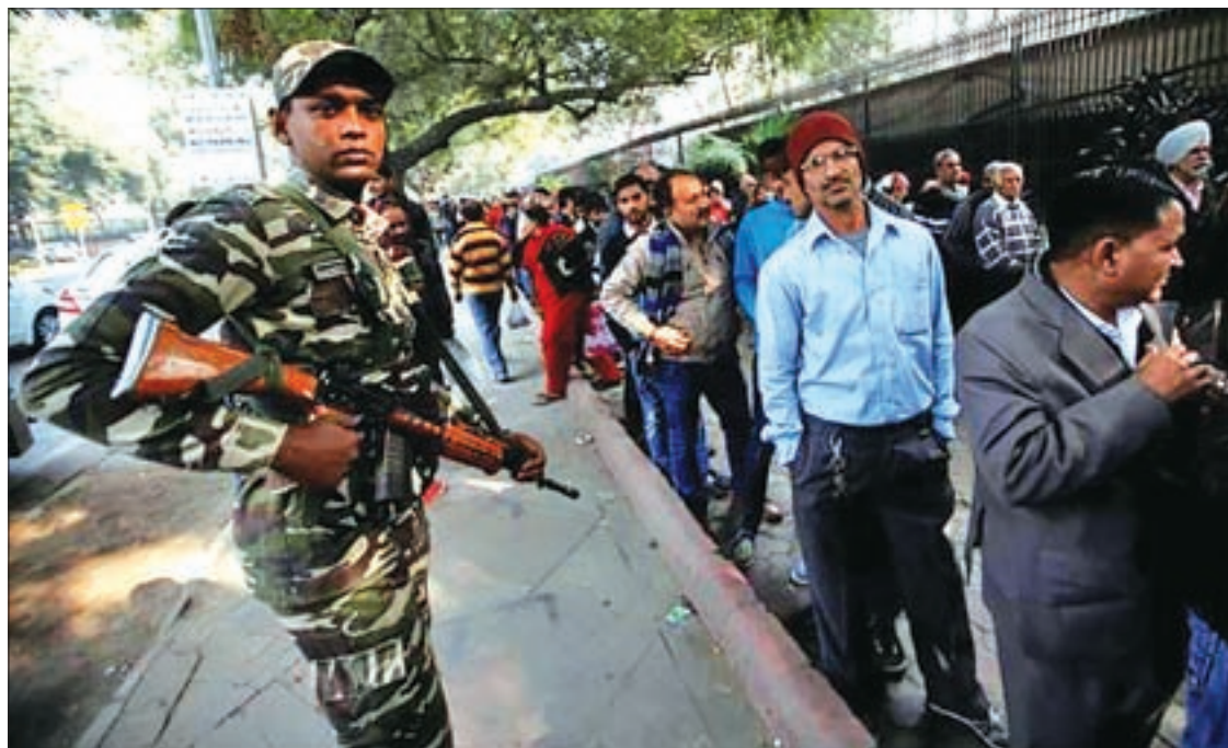
People queue outside the Reserve Bank of India (RBI) to exchange their old high denomination bank notes as a security personnel stands guard, in New Delhi, India, on 30 December 2016.

“Altogether, the whole exercise has been a case of total mismanagement, administrative collapse and widespread corruption,” Chidambaram added, accusing the government of taking the decision in haste.—Reuters