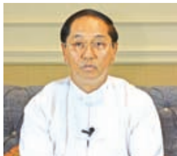
Vice President U Myint Swe.

I EXTEND my sincere good wishes to all national brethren living in the Republic of the Union of Myanmar for their good health and happiness in 2017.