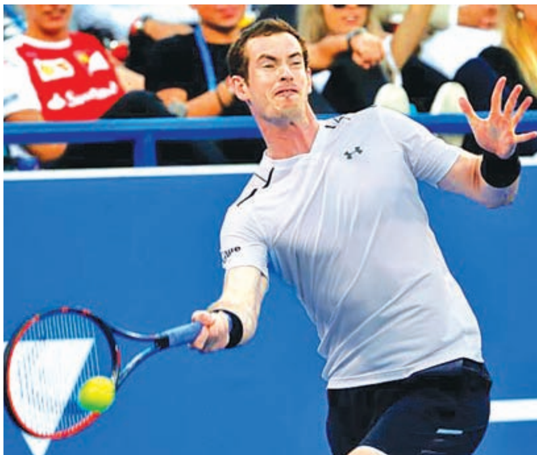
Britain's Andy Murray returns the ball against David Goffin of Belgium, in Abu Dhabi, UAE, on 30 December 2016.