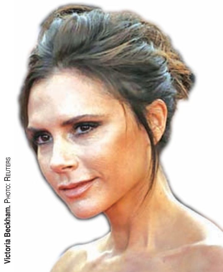
Victoria Beckham.

David Adjaye received a knight bachelor award. His most recent project was the Smithsonian National Museum of African American History and Culture in Washington D.C. while Turner