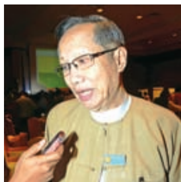
U Han Shwe, Vice Chairman of the National Unity Party.

I WOULD like to wish the Myanmar people peace through negotiations, national reconciliation and security of public life. Furthermore, I wish all the rule of law and peace. In 2016, national races and the lower strata of people encountered difficulties due to low incomes and high commodities prices. We wish that foreign investment, international cooperation and efforts of our country will be able to overcome the crises and adopt fundamental economic development.