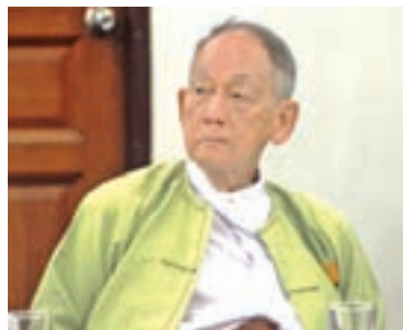
U Thu Wai, Democratic Party (Myanmar).

EVERYTHING is in order as the incumbent government is in power for about a year. The union government will be able to realise democracy and federalism successfully in the New Year. I wish all people of Myanmar higher economic and social standards.