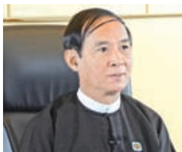
U Win Myint, Speaker of Pyithu Hluttaw.

On this auspicious occasion of the 2017 New Year Day, I send my greetings to all our respected and beloved ethnic nationalities and citizens, and wish them all good health and happiness.