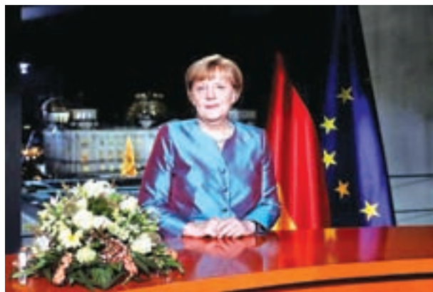
German Chancellor Angela Merkel.