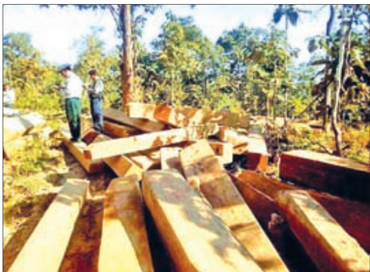
Authorities are inspecting illegal timber.

The seized 18 tonnes of timber are teak, Inngyin, Htauk Kyant and Thin Wun. Those timber will be managed according to the forestry law. The illegal timber was mostly seized in Pauk township. There are illegal timber weighing nearly 70 tonnes seized within one week of December. — Myitmakha News Agency