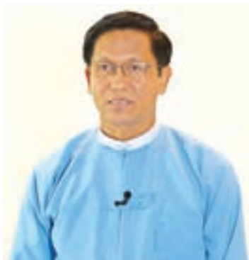
Vice President U Henry Van Thio.

I wish all the people in the country physical and mental well-being, and I hope the New Year will bring development to the Republic of the Union of Myanmar.