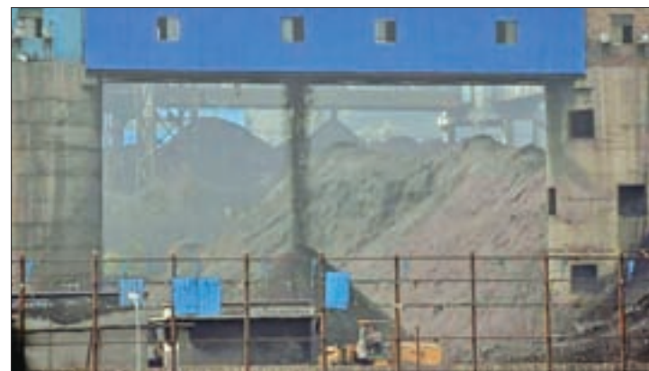
A worker operates a vehicle at a coal mine on the outskirts of Xiaoyi, China’s Shanxi Province, on 3 August 2016.

By the end of 2017 all coal-fired plants of 300,000 KW and above will be upgraded to produce fewer emissions, Xinhua said. But under its five-year plan for the coal sector, the state planner said it was targeting national coal output of 3.9 billion tonnes in 2020, up from 3.75 billion tonnes in 2015, even as it attempts to tackle pollution.—Reuters