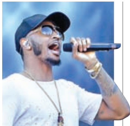
R&amp;B singer Trey Songz.