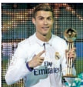
Cristiano Ronaldo celebrates with the Golden Ball trophy.