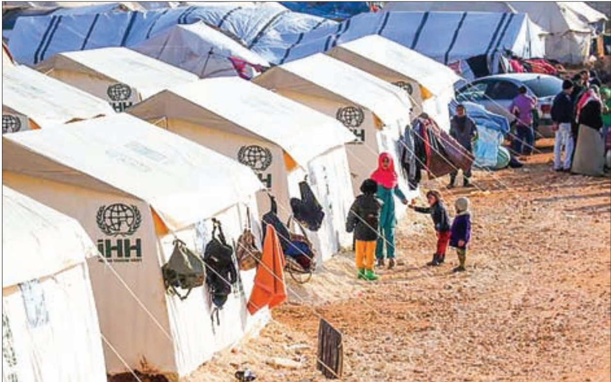
Evacuees from a rebel-held area of Aleppo, stand near their tents in al-Kamouneh camp, Idlib province, Syria, on 29 December 2016.

BEIRUT — A nationwide ceasefire in Syria, brokered by Russia and Turkey which back opposing sides in the conflict, appeared to hold early on Friday after a shaky start during the night in the latest attempt to end nearly six years of bloodshed. Russian President Vladimir Putin, a key ally of Syrian President Bashar al-Assad, announced the ceasefire on Thursday after forging the agreement with Turkey, a longtime backer of the opposition. Monitors and a rebel official reported clashes almost immediately after the truce took force at midnight (2200 GMT Thursday) between insurgents and government forces along the provincial boundary between Idlib and Hama, and isolated incidents of gunfire further south. Hours later calm prevailed in areas included in the deal, they said. Russian Foreign Minister Sergei Lavrov said the United States could join the peace process once President-elect Donald Trump takes office on 20 January. He also wanted Egypt to join, together with Saudi Arabia, Qatar, Iraq, Jordan and the United Nations. A number of rebel groups have signed the agreement, Russia's Defence Ministry said. Several rebel officials acknowledged the deal, and a spokesman for the Free Syrian Army (FSA), a loose alliance of insurgent groups, said it would abide by the truce. One FSA commander was optimistic about the truce deal, the third serious attempt at a nationwide