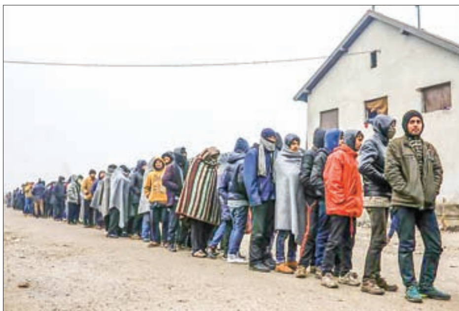
Migrants stand in line to receive free food outside a derelict customs warehouse in Belgrade, Serbia, on 22 December 2016.

About half of those are children, and every 10 th child is classified as unac-