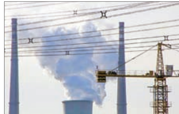
A coal fired power plant is pictured near a construction site in Beijing, China, on 9 December 2016.