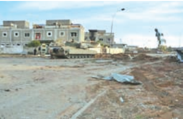
A tank is seen during battle with Islamic State militants in Mosul, Iraq, on 29 December 2016.

NEAR MOSUL, (Iraq) — Iraqi forces faced car bombs and fierce resistance from Islamic State militants in southern Mosul on Friday, the second day of a renewed push to take back the city after fighting stalled for several weeks.