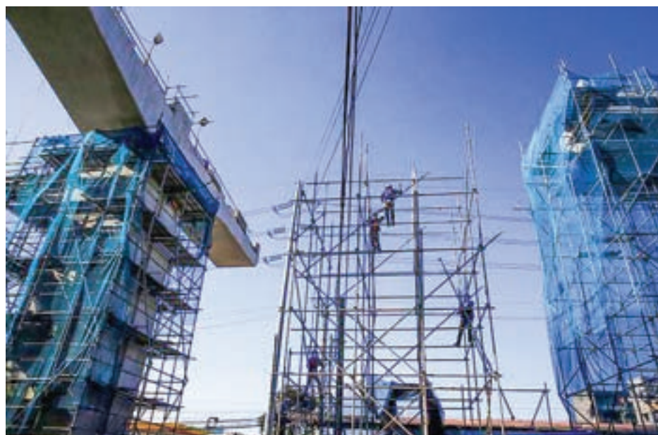
Workers work on steel frames as the construction of a skyway pushes through at a major thoroughfare in metro Manila, Philippines on 23 December 2016.

Secretary Ernesto Pernia sees the president only twice monthly and rarely hears feedback. He said Duterte was focused almost entirely on crime and drugs.