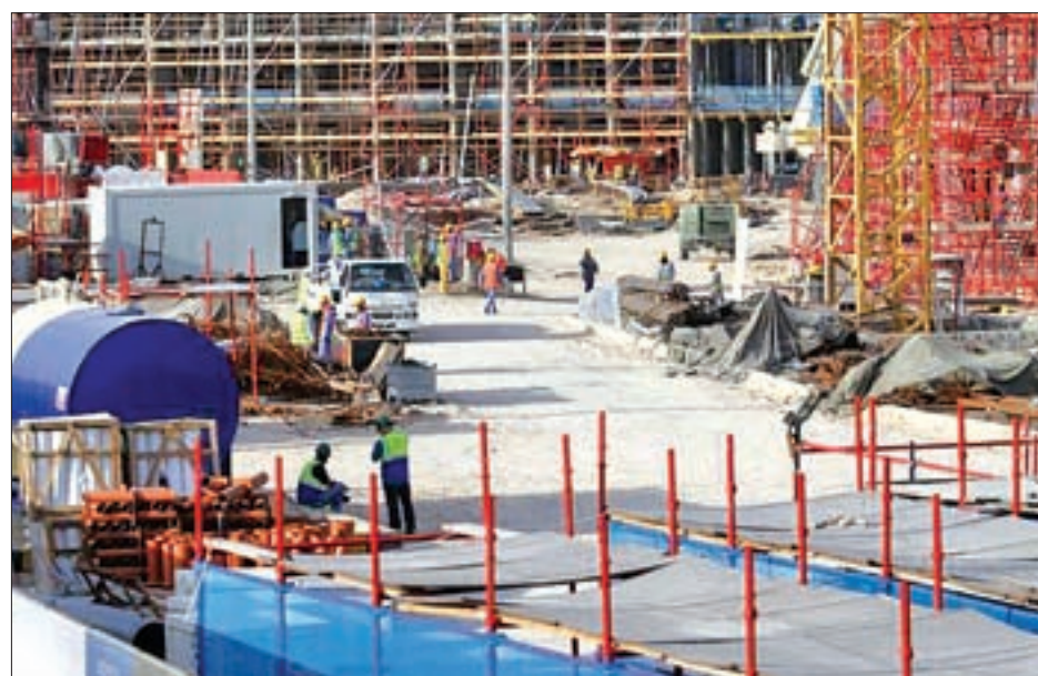
Migrant labourers work at a construction site at the Aspire Zone in Doha, Qatar, on 26 March 2016.

have used body-based cooling technology including "ice hats" to im-