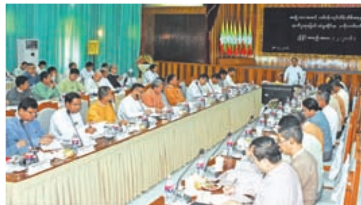
Vice President U Myint Swe addresses the meeting of Central Committee for National Level Environmental Conservation and Climate Change in Nay Pyi Taw.

Industrialization should not leave environmental conservation behind and every member of Myanmar society should bear in mind that environmental impacts of industrialization should be kept at the minimum, the Vice President added.