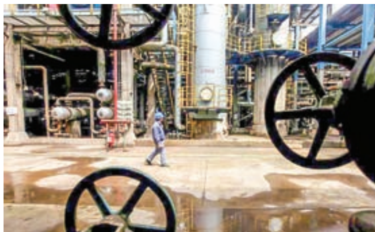
A worker walks past oil pipes at a refinery in Wuhan, Hubei Province in 2012.

However, gold's outlook for 2017 is bearish as the outlook for a rising US dollar and higher interest rates, combined with strong equity markets, will dampen demand for non-interest-paying bullion.—Reuters