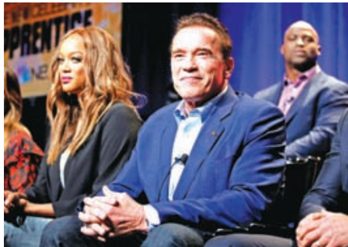
Host Arnold Schwarzenegger and Tyra Banks participate in a panel for ‘The New Celebrity Apprentice’ in Universal City, California, on 9 December, 2016.

“You’re terminated? Hasta la vista baby? Consider this a divorce? There’s many, many lines we can grab. That’s the great thing when you have had a long movie career,” he said.—Reuters