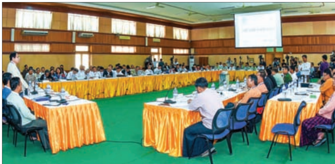
Union Minister Dr Pe Myint addresses the workshop of four estates.

One of the 16 agreements is that regional and state parliaments will issue one-year accreditation cards to the parliamentary reporters. Such kinds of workshops are expected to be held in regions and states. The workshop came to an end with concluding remarks by Union Minister Dr Pe Myint.— Myanmar News Agency