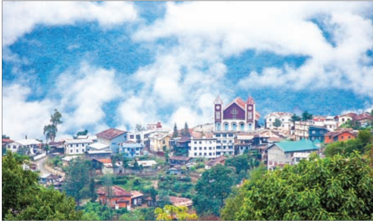
A file photo shows an aerial view of Tiddim City, Chin State.

Apart from Khaingkan, the government will provide land plot for hotel projects, which will be implemented with the investment of local entrepreneurs within three months starting from the time they received green