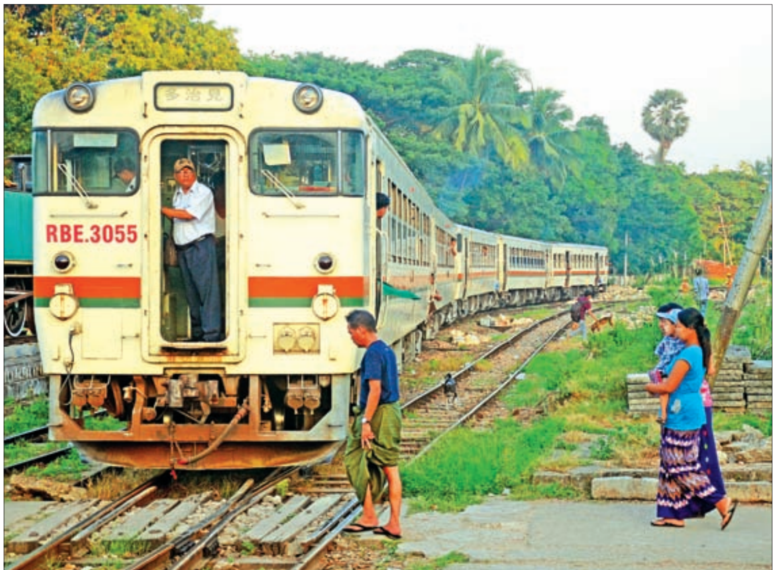
SEE PAGE 9 >> People cross the railway near Yangon Central Railway Station in Yangon on 19 November, 2016.

Speaking to Kyodo News at Yangon Central, American tourist Cari said she had opted to ride the train to relax and make the best of a rainy day.