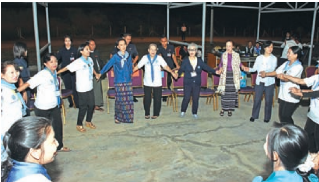
Daw Aung San Suu Kyi participates in the campfire party with the chief girl guides and officials of Osaka Girl Guides.

Also present at the call were Minister of State for Foreign Affairs U Kyaw Tin and officials concerned.— Myanmar News Agency