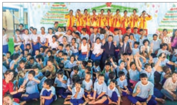
Korean diplomats and the embassy staff pose for photo together with children at School for Disabled Children” in Mayangone.