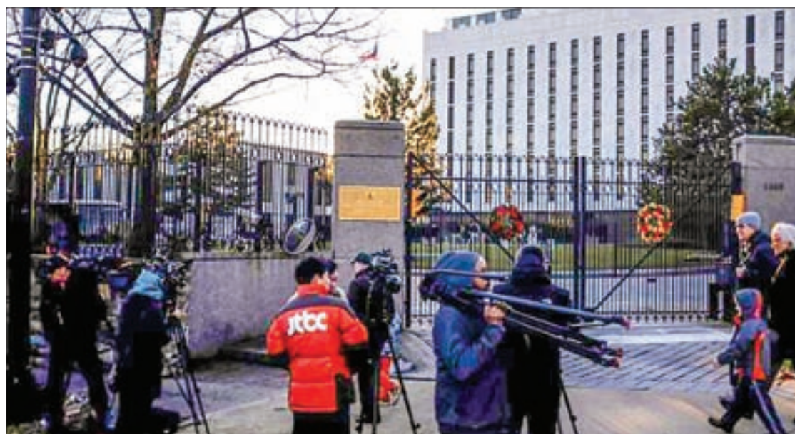
Television crews assemble outside the Russian embassy on Wisconsin Avenue in Washington, US, on 29 December 2016.

HONOLULU/WASHINGTON — President Barack Obama on Thursday ordered the expulsion of 35 Russian suspected spies and imposed sanctions on two Russian intelligence agencies over their involvement in hacking US political groups in the 2016 presidential election.