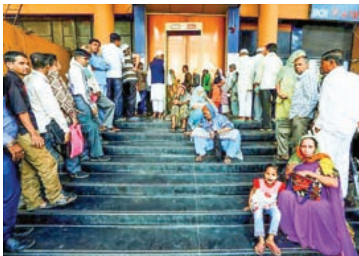
People wait for a bank to open to withdraw and deposit their money, after the scrapping of high denomination 500 and 1,000 Indian rupees currency notes, in Ahmedabad, India, on 5 December 2016.

In an interview to India Today magazine, Modi on Thurs-