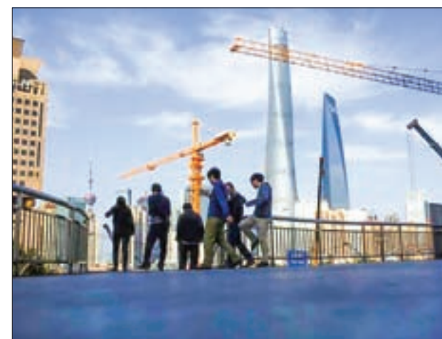
People walk on a bridge near the financial district of Pudong in Shanghai, in 2014.

Any further opening up to foreign firms should