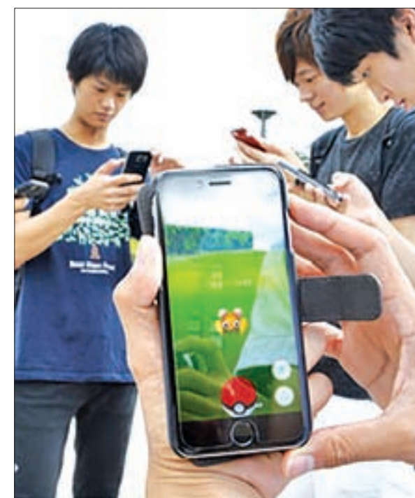
Young people play the "Pokemon Go" smartphone game in Nagoya in this file photo taken on 22 July 2016.