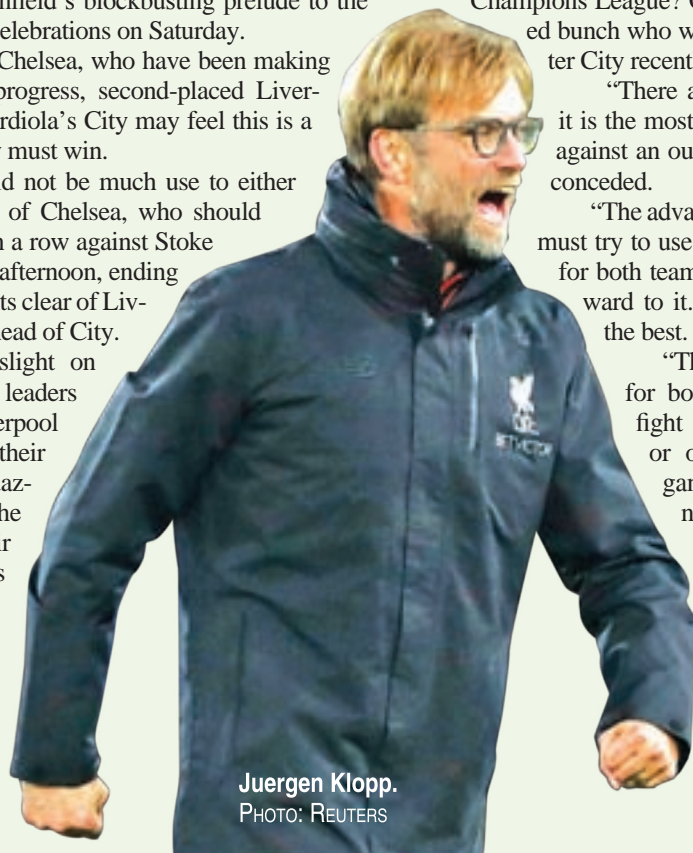
Juergen Klopp.