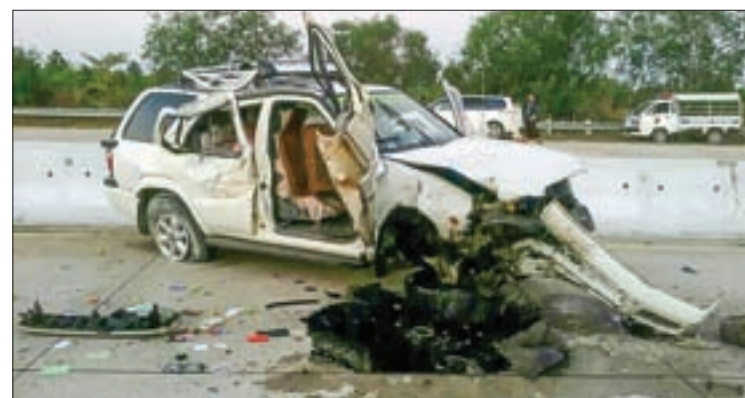
Overturned AD van seen on Ygn-Mdy express way.

Likewise, a light truck driven by Min Aung collided with the back of a Toyota Van driven by Jay Nyi Nyi when the light truck driver lost control because of high speed en route from Nay Pyi Taw to Yangon between mile-