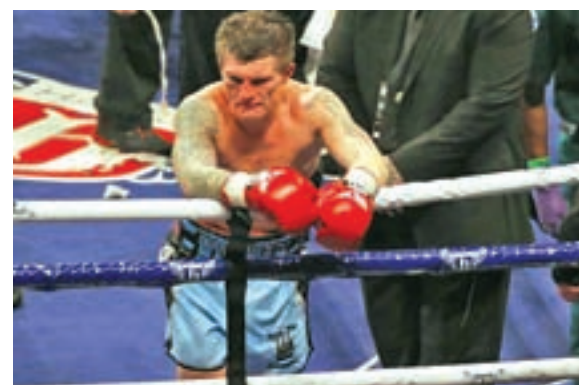
Britain's Ricky Hatton reacts after losing to Ukraine's Vyacheslav Senchenko in their boxing match at the Manchester Arena in Manchester, northern England, on 24 November 2012.

"I tried to kill myself several times," the 38-year-old told BBC radio. "I used to go to the pub, come back,