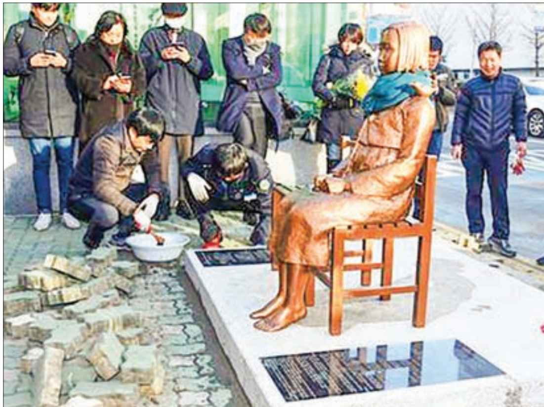
Members of a civic group install a statue symbolizing women forced into wartime Japanese military brothels in front of the Japanese Consulate in the southern South Korean port city of Busan, on 30 December 2016.

According to a live video streamed by the civic group, the 1-ton statue of a young girl was earlier Friday carried by forklift to the front of the consulate, with members of the group chanting “Victory to the people!” It plans hold an unveiling ceremony on Saturday. On Wednesday, the civic group tried to erect the statue on the sidewalk in front of the consulate, but police and officials confiscated it for obstructing a road.