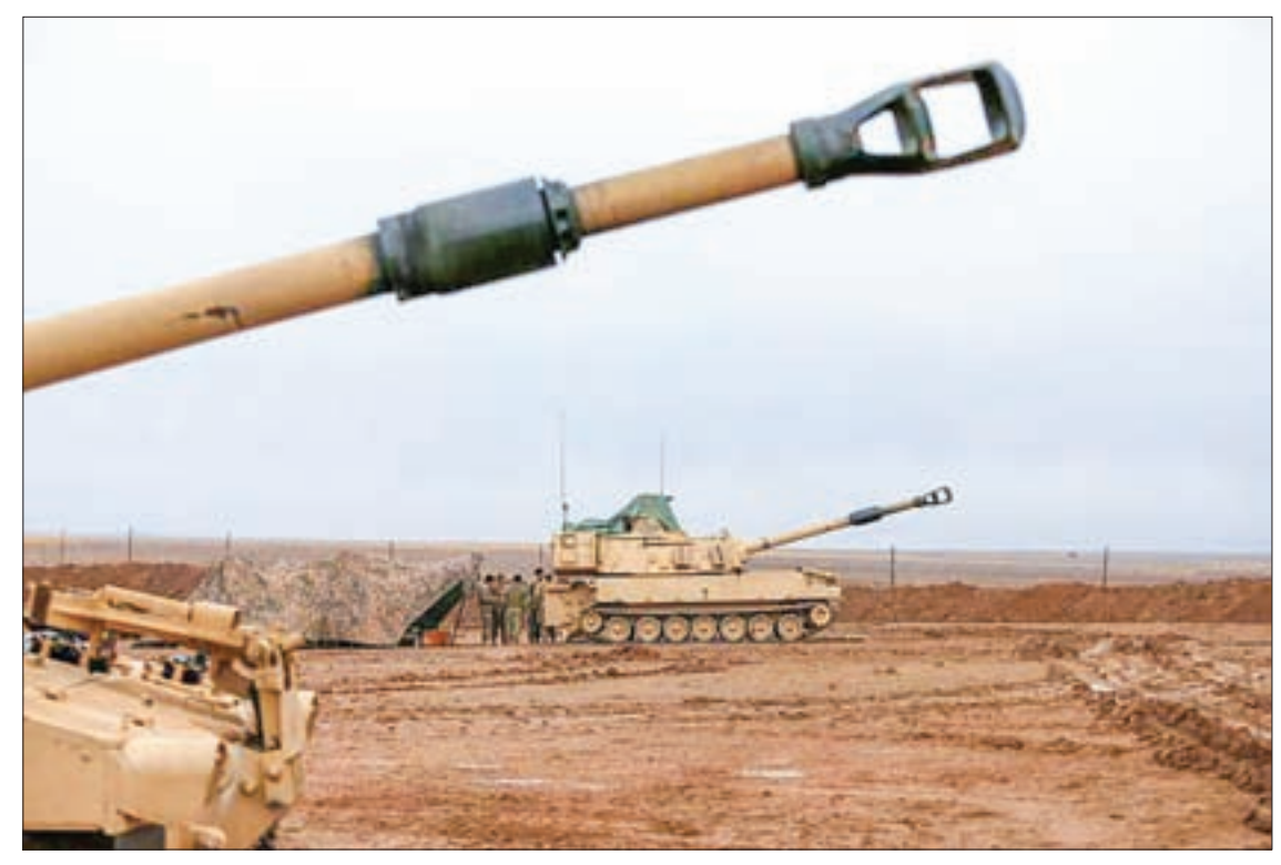
US soldiers stand near military vehicles at an army base in Karamless town, east of Mosul, Iraq, on 25 December 2016.

"So right now, positioning forces and positioning men and equipment into the interior of east