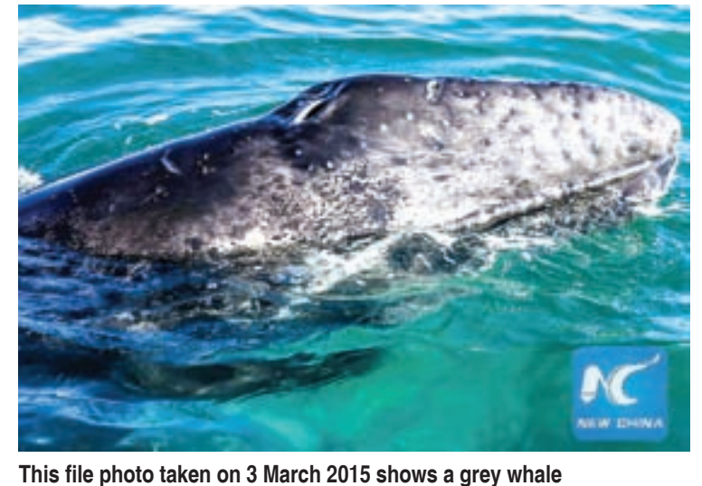
(Eschrichtius robustus) emerging from the waters of the Ojo de Liebre Lagoon, Baja California Sur State, Mexico.

The tag, according to the researchers, expands by several