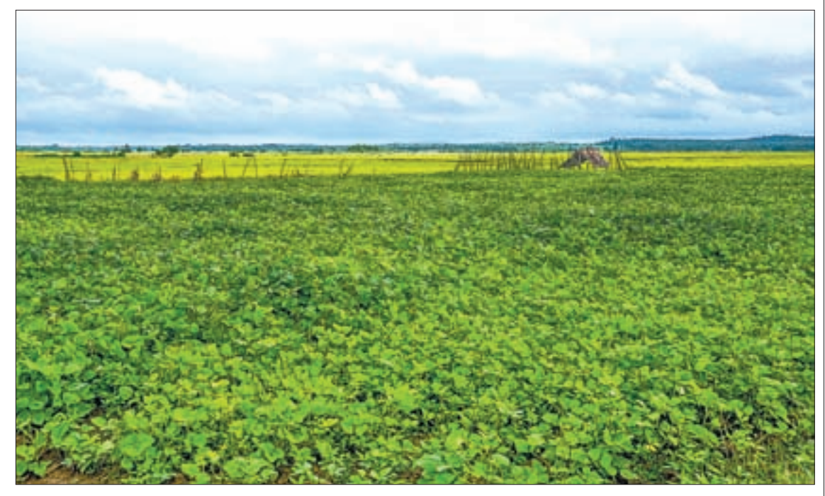
A pea farm seen in Pyay Township, Bago Region.

fisheries products worth $365m, minerals worth over $680m, forest products worth $166m, industrial goods worth $3.409b and other commodities worth $1.199b to foreign countries. Meanwhile, capital goods worth $4.345b, raw materials worth $4.012b and personal goods worth $2.634b were imported into Myanmar.—Ko Htet