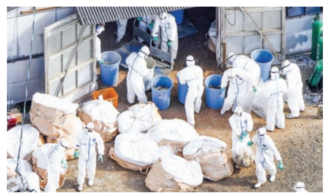
Work begins at a poultry farm in Kawaminami, Miyazaki Prefecture, southwestern Japan to bury chickens culled after a highly virulent strain of bird flu was detected on 20 December 2016.

The contagious H5N8 strain has been found in more than 500 wild birds in Germany in recent weeks. Outbreaks on farms have been rare after the government introduced tough sanitary rules to prevent infection by wild birds, including orders to keep poultry indoors in high-risk regions.