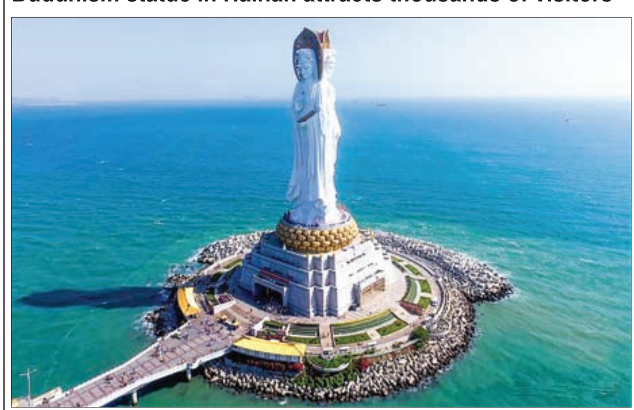
Aerial photo taken on 25 December 2016 shows the 108-metre-tall Buddhism statue of Avalokitesvara Bodhisattva, or Guanyin, at Nanshan resort in Sanya, south China's Hainan Province. About 15,000 tourists visited the statue everyday since 1 December.