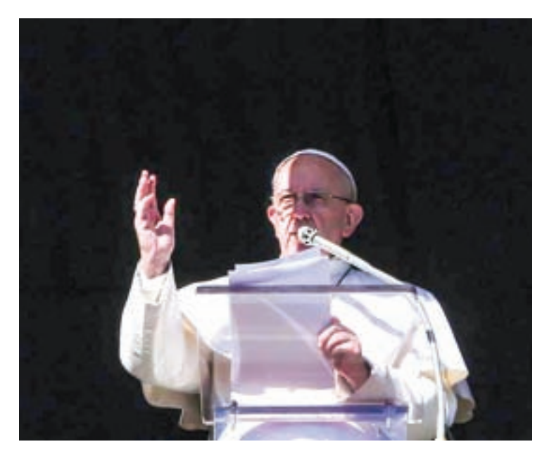
Pope Francis blesses during his Angelus prayer in Saint Peter's square at the Vatican, on 26 December 2016.

Christians in northern regions of Iraq held by Islamic bombed, have called the fact State were given an ultimatum: that Christians of all denomi-