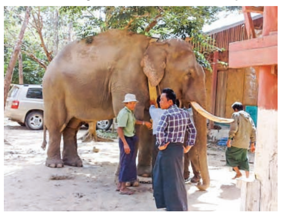
An elephant with radio collar.

RADIO collars were fitted on five elephants in the second week of December to explore the habitat of wild elephants at Myainghaywun elephant camp, Taikkyi Township, Yangon Region, said a responsible person from the World Wildlife Fund (WWF).