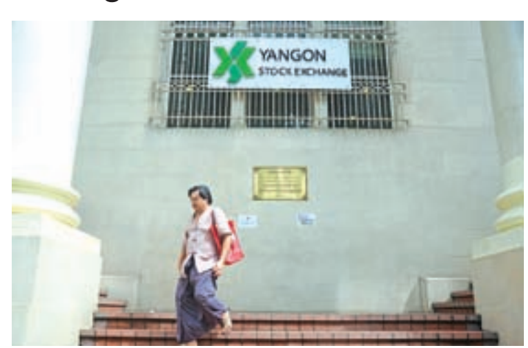
A visitor seen outside Yangon Stock Exchange in Yangon on 11 November, 2016.

YSX is barely over a year old and a publicity campaign will be required to make the public aware of the benefits of stock trading, an official said.—Mon