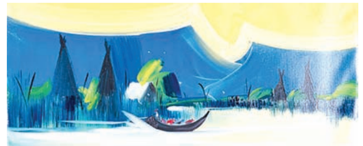
One of the works of artist Nyein Chan Su to be displayed at Yangon Gallery today and tomorrow.

ARTWORK by Nyein Chan Su, one of prominent contemporary artists in the country, will be showcased at his solo event to be held in Yangon this month.