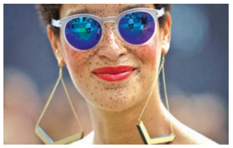
Woman wears sunglasses to protect from the sun.