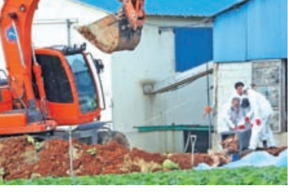
South Korean health officials bury chickens at a poultry farm where the highly pathogenic H5N6 bird flu virus broke out in Haenam, South Korea, on 17 November.

Having previously stood guard at facilities affected by the outbreak, Korea's military will now actively help destroy birds and disinfect farms to accelerate the cull, the ministry said. Culls announced previously took two to three days to complete because of a lack of manpow-