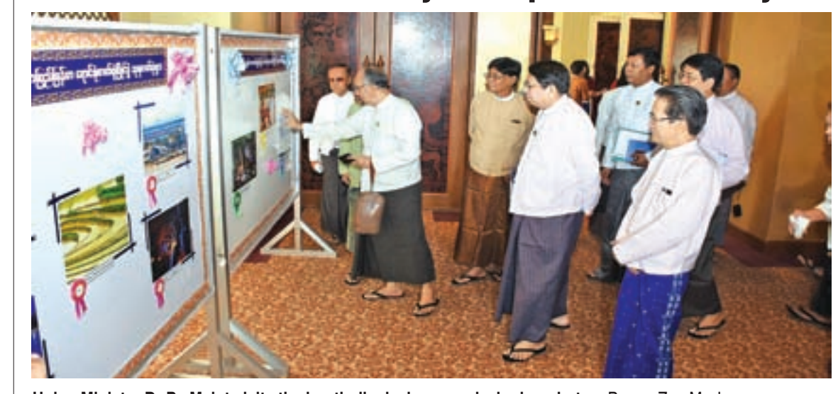
Union Minister Dr Pe Myint visits the booth displaying award-winning photos.

Dr Pe Myint, Union Minister for Information, took part in the ceremony for awarding of prizes in the colour photo contest in commemoration of the 69th anniversary Independence Day under the sponsorship of the information and public relations department of the Ministry of Information held at the Sule Shangri La Hotel in Yangon yesterday morning.