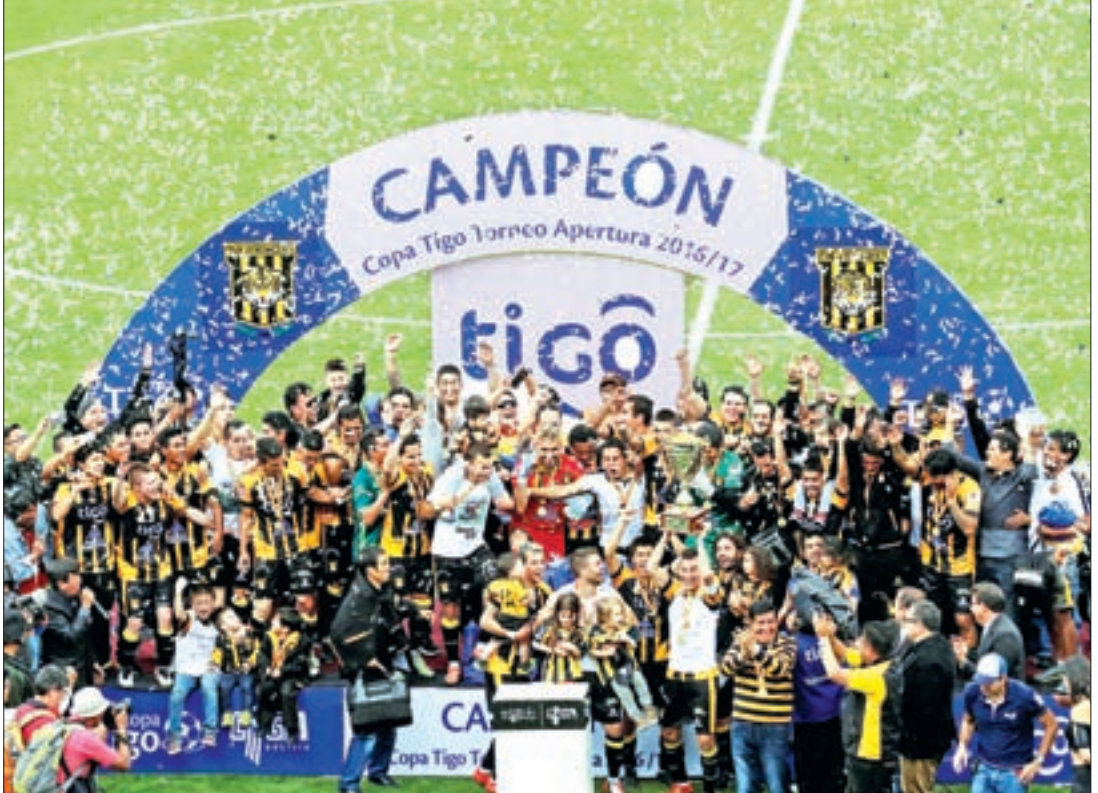
Players of The Strongest celebrate after winning the Bolivian League during the "Clasico" against Bolivar at Hernando Siles stadium, La Paz, Bolivia on 24 December 2016.