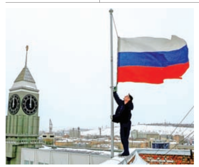
A worker lowers the Russian national flag to half-mast on a roof of the city administration building, as the country observes a day of mourning for victims of the Tu-154 plane which crashed into the Black Sea on its way to Syria on Sunday, in Krasnoyarsk, Russia, on 26 December 2016.

At the weekly cabinet meeting on Sunday, Netanyahu described a telephone conversation with US Secretary of State John Kerry on Thursday, when Israel and President-elect Donald Trump successfully pressed Egypt to drop the anti-settlement resolution it had put forward.—Reuters