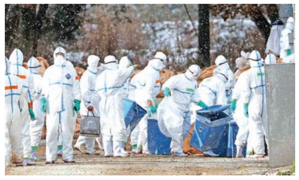
Workers wearing protective suits cull ducks after some tested positive for H5 bird flu at a poultry farm in Aomori, northern Japan, on 29 November 2016.

The Shanghai patient was a H7N9 is a bird flu strain first 45-year-old man who had trave-