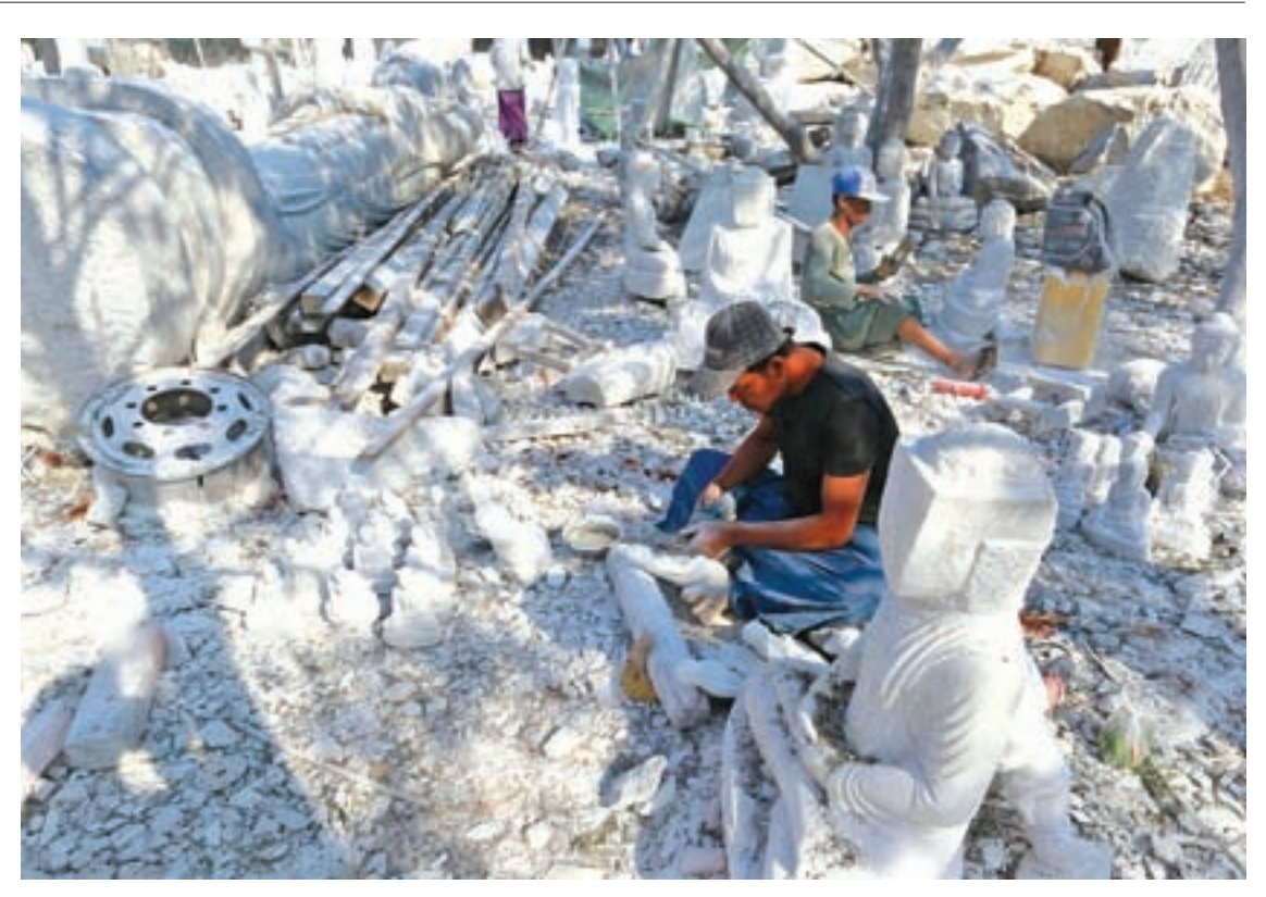
A man sculpts marble stones as he sits amid half-made Buddha sculptures at Zagyin (Marble) village in the Madaya township, Mandalay, on 26 February 2014.

There are around 10 businessmen in the village engaged in the sculpture business on a commercial scale, while others are sculpting on a manageable scale. Villagers who were financially doing well shifted to other businesses, resulting in a scarcity of labourers. With the shortage of raw materials and labourers, it has become difficult to meet the demand.—Mon Mon