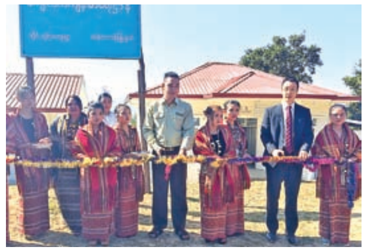
Rural health centre in Chin State formally being opened.

The Government of Japan has assisted 802 various grassroots projects in Myanmar under the GGP scheme since 1993: the number consisting of 391 education projects, 198 healthcare projects, 138 public welfare and environment projects, 42 infrastructure projects and 35 other projects. It is anticipated that these assistances will further strengthen the existing friendly relations between Japan and Myanmar.—GNLM