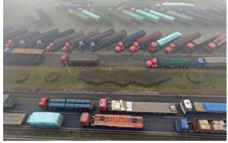
Trucks are seen stranded near a highway during a polluted day in Shijiazhuang, Hebei province, China on 20 December, 2016.

Experts say enforcement is lax amid concern