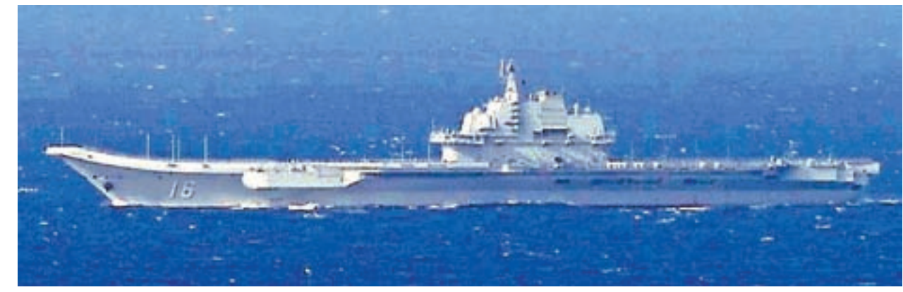
China's Kuznetsov-class aircraft carrier Liaoning sails the water in East China Sea, in this handout photo taken on 25 December by Japan Self-Defence Force and released by the Joint Staff Office of the Defence Ministry of Japan.

Taiwan's Defence Ministry said the carrier, accompanied by five vessels, passed southeast of the Pratas Islands, which are controlled by Taiwan, heading southwest.