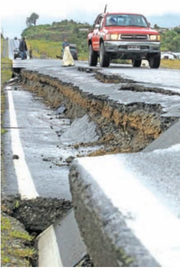
A damaged road is seen after a quake at Chadmo, on Chiloe island, southern Chile, on 25 December.

"It's great news that as of now, we don't have to