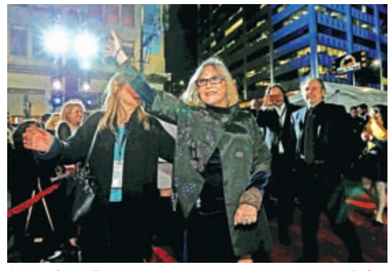
Actress Carrie Fisher waves as she arrives at the premiere of "Star Wars: The Force Awakens" in Hollywood, California on 14 December 2015.