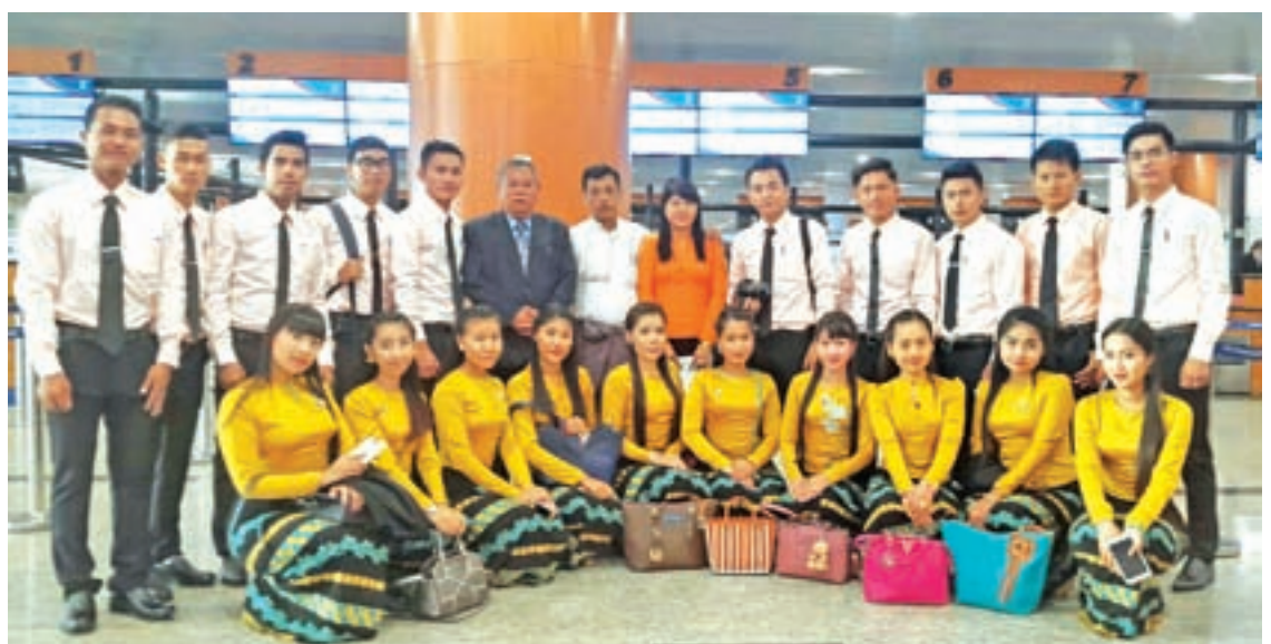
Myanmar Cultural delegation posing for a group photo before departure.

artists were accompanied by officials from the Ministry of Foreign Affairs and Department of Fine Arts of Religious Affairs and Culture. -Myanmar News Agency