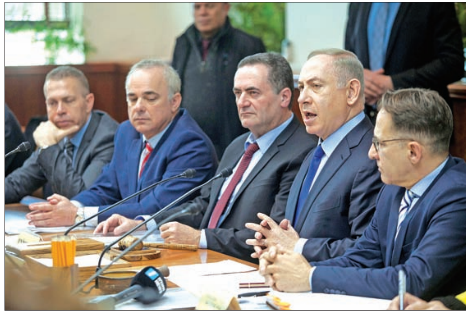
Israeli Prime Minister Benjamin Netanyahu (2nd R) attends the weekly cabinet meeting at his Jerusalem office on 25 December 2016.

So far, no one has claimed responsibility for the attack, but the Taliban militant group has launched similar attacks in the past.—Xinhua