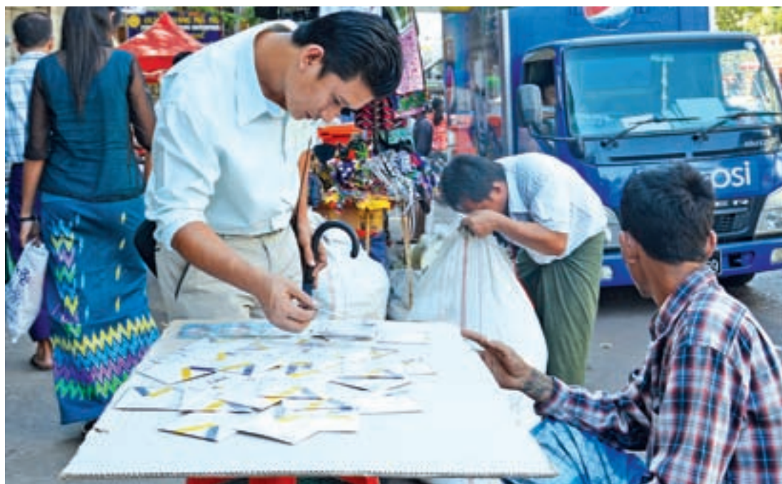
A man checks SIM cards of MPT at a vendor in Yangon. File photo taken on 4 Dec, 2014.

percentage of investments flowing into the country are 47.07 per cent in the telecoms sector, 25.5 per cent in the industrial sector, 17.5 per cent in the power sector, 3.03 per cent in real