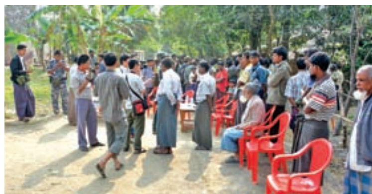
Independent journalists meeting with muslim community in Pyaungpaik Village in Maungdaw Township. PHOTO: MNA

Reporters also visited the Basic Education High School in Kyeinchaung and the Ngakhuya Police Station and interviewed subjects about the 9 October attack and the subsequent fires that occurred.— MNA