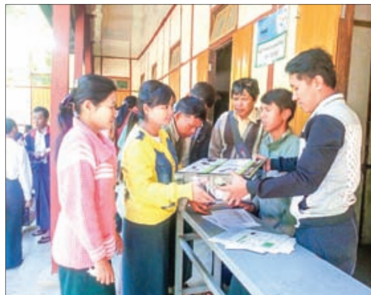
Solar lighting system being distributed to representative from government schools.

and students at the Donation Ceremony to renewable energy and to practice their skills and knowledge for sustainable development. They will be supported by tools and trainings for their classrooms by UNESCO, the Ministry of Education, and Panasonic in their effort to “provide a better life and better world for people everywhere”.— GNLM