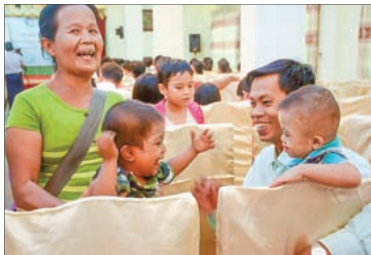
A care centre.

A SPECIAL care centre for children with disabilities is planned to launch in Mawlamyine, the capital town of Mon State, at the beginning of next year, according to the Myanmar Autism Association.