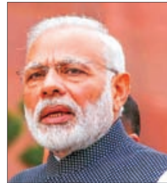
India’s Prime Minister Narendra Modi speaks to the media inside the parliament premises on the first day of the winter session in New Delhi, India, on 16 November 2016.

His announcement enjoyed popular support at first, with many people prepared to endure hardship as long as others are forced to give up their ill-gotten