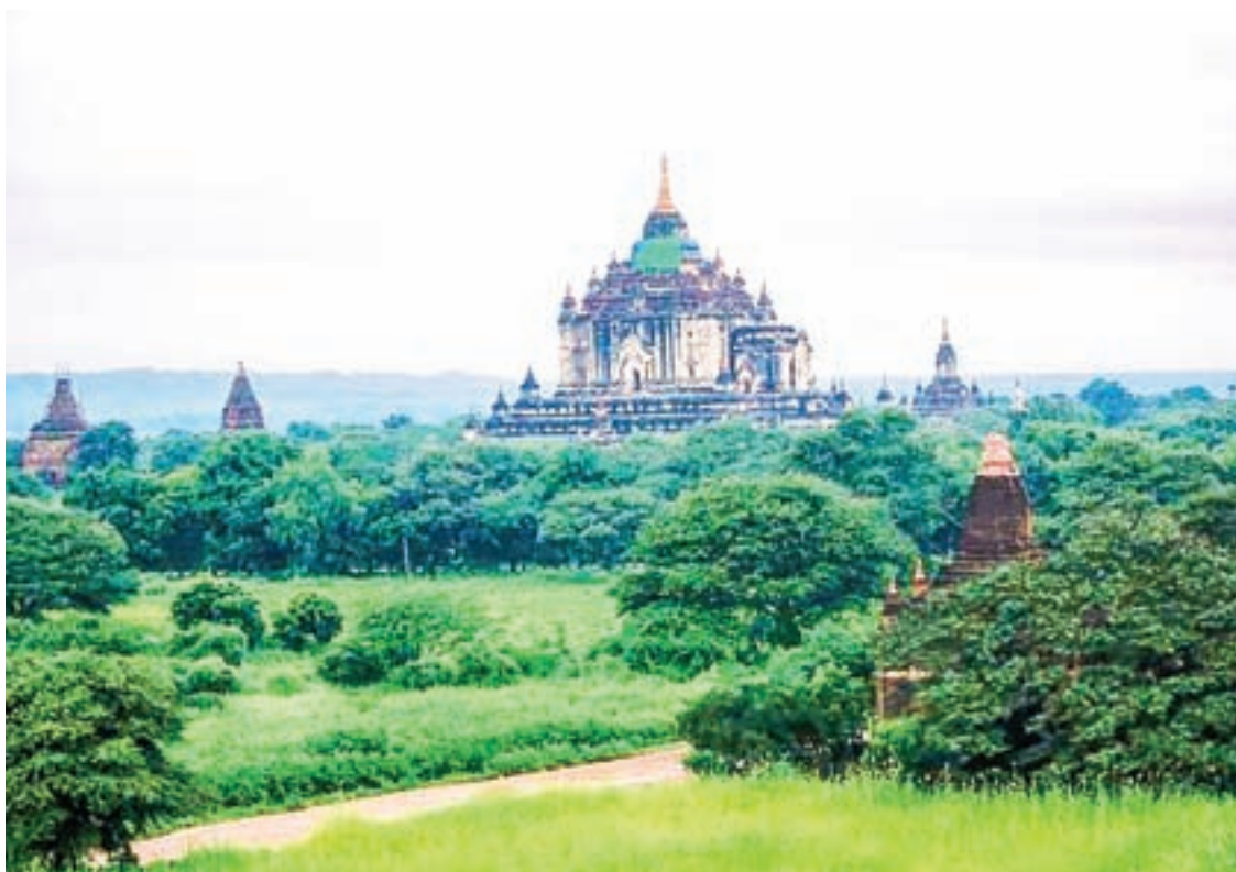
A temple in Bagan, one of the most famous tourist attractions in Myanmar. PHOTO: MYITMAKHA NEWS AGENCY

Over 500 types of precious ancient objects from inside the temples have been kept at Bagan's Archaeological Museum, said NyaungU District General Administrator U Soe Tint. — Myitmakha News Agency