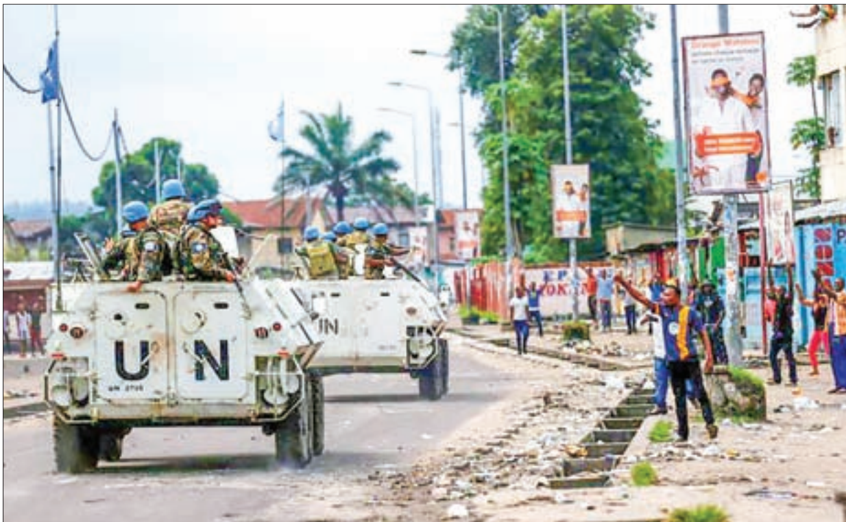
Peacekeepers serving in the United Nations Organisation Stabilisation Mission in the Democratic Republic of the Congo (MONUSCO) patrol in their armoured personnel carrier during demonstrations against Congolese President Joseph Kabila in the streets of the Democratic Republic of Congo's capital Kinshasa, on 20 December 2016.