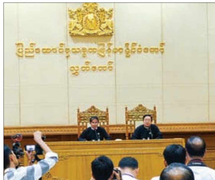
Pyithu Hluttaw Speaker U Win Myint (Left) gives a press conference at the parliament.

PYITHU HLUTTAW Speaker U Win Myint received editors and reporters from newspapers and journals, journalists from local news agencies and local-based International news agencies at 11:15 am in the Zabuthiri Building of the Hluttaw in Nay Pyi Taw on 21 December.