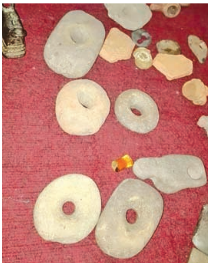
Stone Age objects found in ancient site in Ingapu.

Moreover, ancient symbols, including round shapes, and footprints of animals were found on the wall of Taungnyo Mountain, residents said.