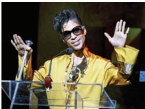
Musician Prince gestures on stage during the Apollo Theatre's 75th anniversary gala in New York, US on 8 June 2009. Prince has died at the age of 57, according to news reports.

"That generation was tested in a way that subsequent generations have not