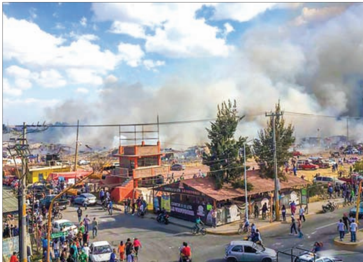
Photo taken by a mobile device on 20 December, 2016 shows the site of a blast at the San Pablito fireworks market in Tultepec, Mexico.

"Everything was destroyed, it was very ugly and many bodies were thrown all over the place, including a lot of children. It's the worst thing I've ever seen in my life," said 24-year-old housewife An-