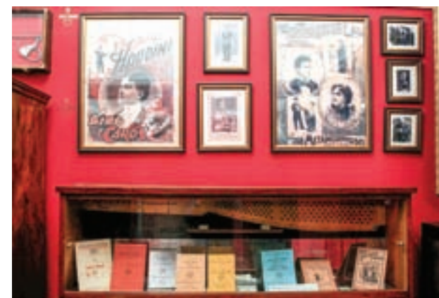
Posters are seen in the 'House of Houdini' museum in Budapest, Hungary, on 19 December 2016.

He left with his family for the United States in 1878 and became an American citizen. When he became a magician, Houdini started to call himself Harry Houdini after the French magician Jean Eugene Robert-Houdin.