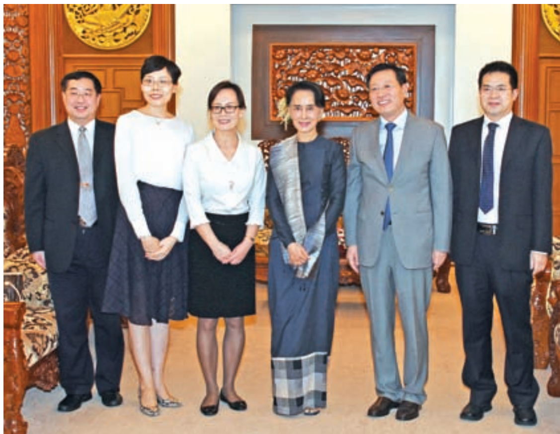
State Counsellor Daw Aung San Suu Kyi poses for a group photo together with H.E. Mr. Hong Liang, Ambassador of the People's Republic of China to Myanmar in Nay Pyi Taw.