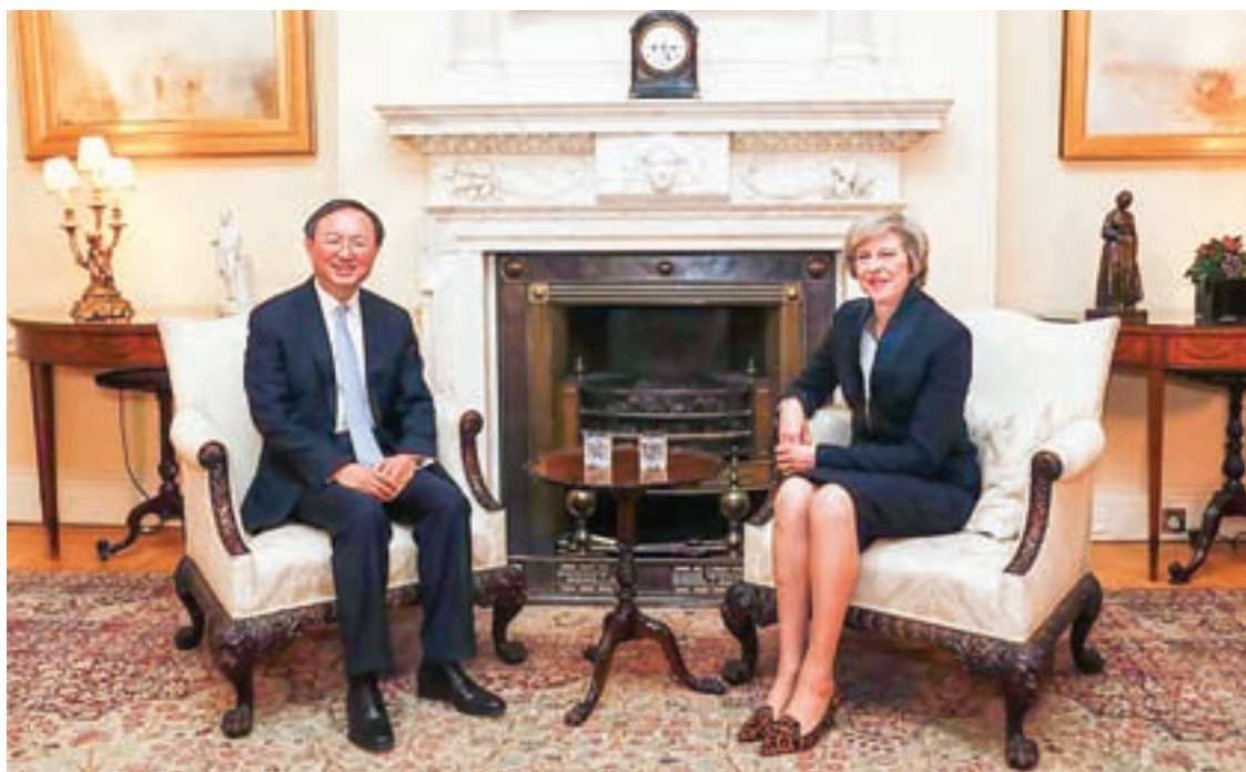
British Prime Minister Theresa May (R) meets with visiting Chinese State Councilor Yang Jiechi in London, Britain, on 20 December 2016.

The senior Chinese official also called on the two sides to strengthen their communication and coordination to solve major international and regional issues, jointly push forward the open, inclusive economic globalization and combat the