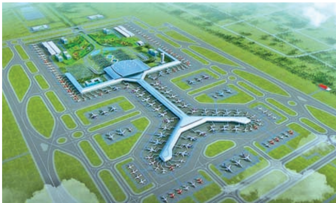
An artist's impression of Hanthawaddy International Airport.

The Vice President stressed the need for respective ministries and regional and state cabinets to take part in the discussions about situations on an official develop-