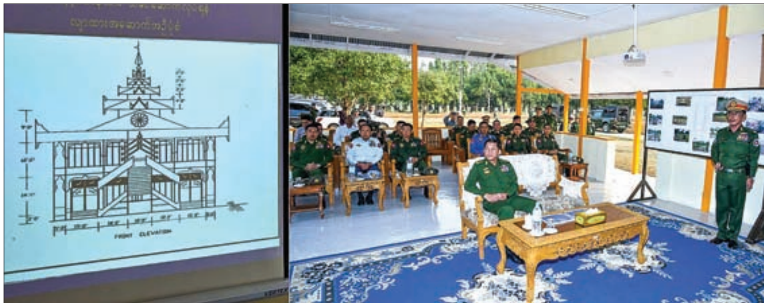
Senior General Min Aung Hlaing inspects Sasana Beikman construction.

Defence Services Commander-in-Chief Senior General Min Aung Hlaing visited the pagoda, and during his visit he gave instructions to those officials concerned to construct the beikman systematically and in accordance with the target of the project, to use good quality construction materials so that the building can endure the natural disasters and to ensure sufficient water supply and electric power supply as well as systematic sanitation.— Myanmar News Agency