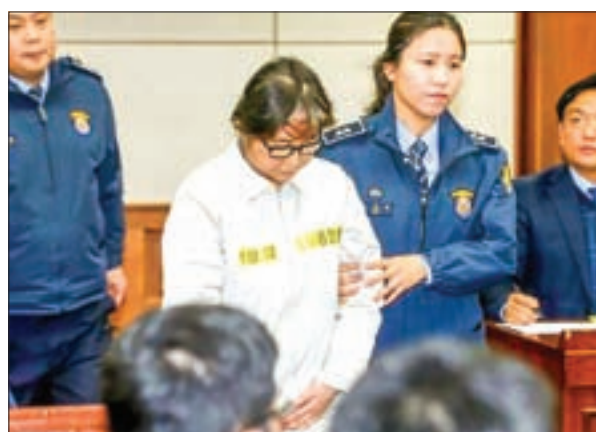
Choi Soon-sil, a long-time friend of South Korean President Park Geun-hye who is at the center of the South Korean political scandal involving Park, arrives for her first court hearing in Seoul, South Korea, on 19 December 2016.

A court issued an arrest warrant on Wednesday for Chung Yoo-ra, the 20-year-old daughter of Choi Soon-sil, Park's long-time friend