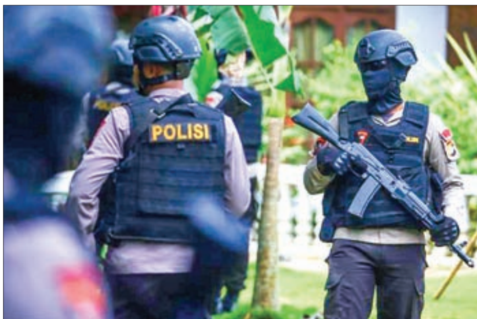
Indonesian police officers stand outside a home following a gunfight in which three suspected militants were killed in South Tangerang, Banten province near Jakarta, Indonesia on 21 December 2016.

After Wednesday's raid, police said the suspects, who authorities believe are supporters of