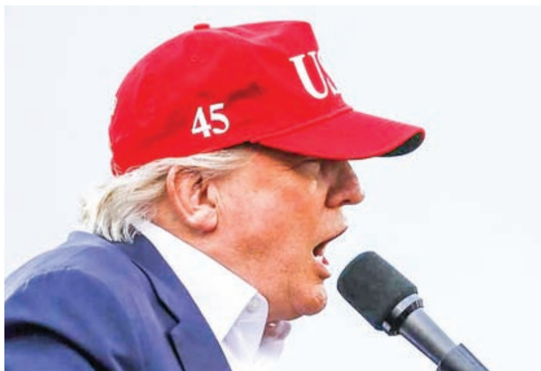
President-elect Donald Trump speaks during a USA Thank You Tour event in Mobile, Alabama.

Trump has used Twitter regularly as his megaphone on everything from personal beefs to US policy on China. Trump's individual targets have ranged from Fox News anchor Megyn Kelly, whose questions during a presidential debate angered Trump, to the leader of an Indiana steelworkers union who disputed the number of jobs saved by a Trump deal in that state. —Reuters