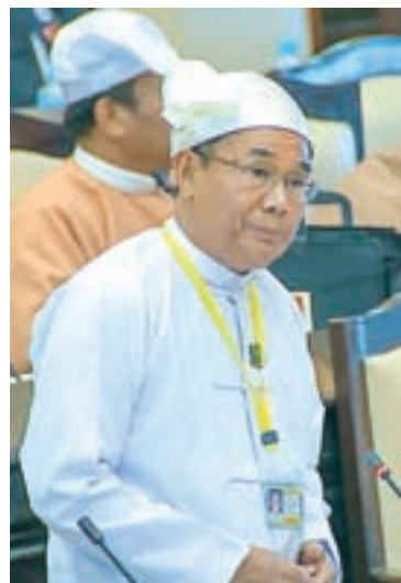
Union Minister for Natural Resources and Environmental Conservation U Ohn Win.

THE third regular session of the second Amyotha Hluttaw concluded yesterday following discussions on compensation for seized land, implementation of the report of the Investigation Commission of the Letpadaung Copper Mine Project and the crocodile threat in Ayeyawady.