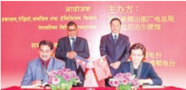
Liu Qibao (2nd R), the visiting member of the Political Bureau of the Communist Party of China (CPC) Central Committee and head of the CPC Central Committee’s Publicity Department, and Nepalese Deputy Prime Minister Krishna Bahadur Mahara (2nd L) attend a signing ceremony in Kathmandu, Nepal, on 19 December 2016. Nepal and China on Monday signed various agreements in the areas of publication and television.