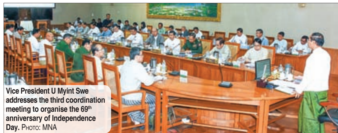
Vice President U Myint Swe addresses the third coordination meeting to organise the 69 th anniversary of Independence Day.

THE third coordination meeting organise the 69th anniversary Independence Day was held at the President's Office in Nay Pyi Taw yesterday afternoon.