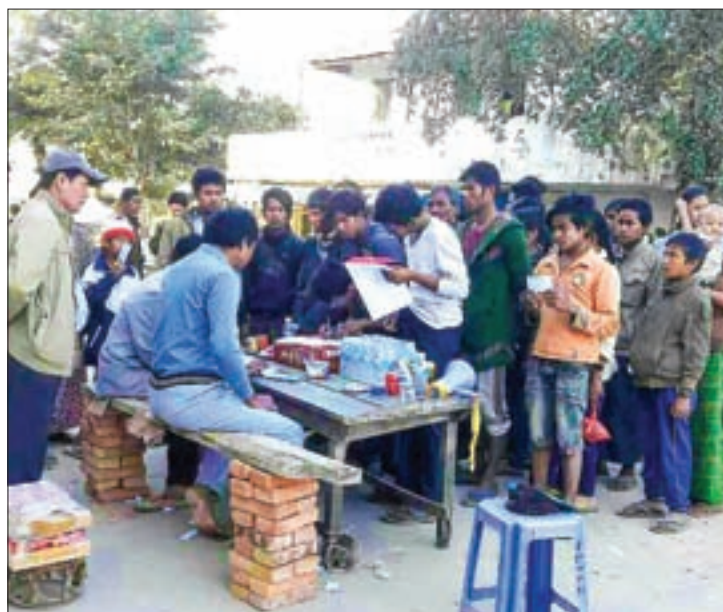
Internally displaced persons receive checks as they return to Mongko as the situation is returning to normalcy.

The displaced people began to re-enter Mongko starting on December 9 and were received by combined teams comprising Tatmadawmen, Myanmar Police Force, township administrative