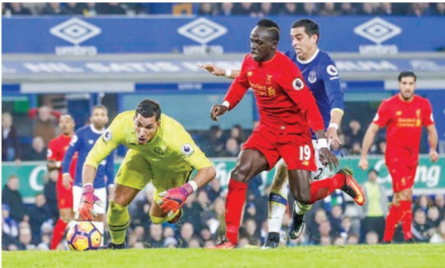
Liverpool's Sadio Mane in action with Everton's Joel Robles before scoring their first goal at Goodison Park on 19 December.

"He's a guy that can continue to have an influence on the golf course for players ... he can truly help get the numbers back up in golf."—Reuters