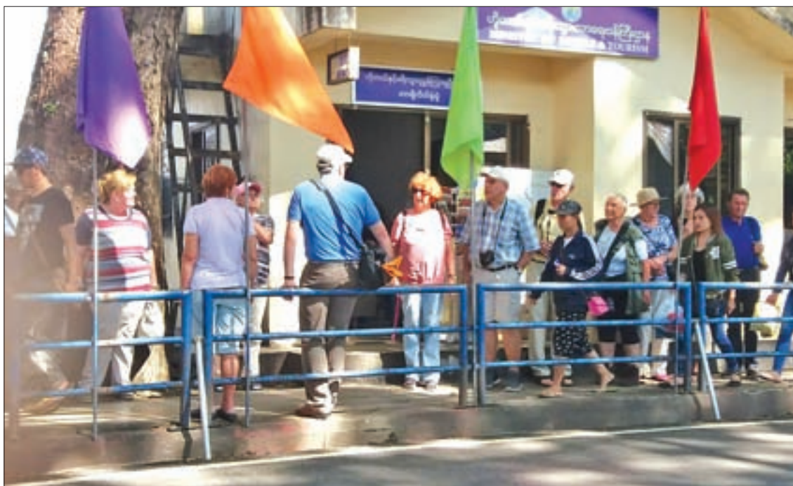
Tourists being seen at the Tachilek border entrance.

Foreign tourists also visited to see the views of Myanmar's natural landscape and to observe different traditional customs and lifestyles in various places and to observe ethnic minority communities and their cultures. On 12 December, under the arrangements of Marvellous Travels & Tours Co., Ltd, 43 Malaysian tourists entered Tachilek through Mae Sai of Thailand, and visited limited areas — Tachilek, Kengtung, Inle, Mandalay, Bagan, Nay Pyi Taw, Yangon, Mawlamyine and Myawady — in their own cars, and then returned to Thailand via the Myawady border entrance on 20 December. — Myanmar News Agency