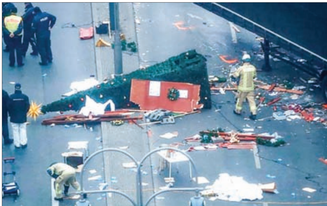
Rescue workers are seen at the scene where a truck ploughed through a crowd at a Christmas market on Breitscheidplatz square in Berlin, Germany, December 20, 2016.

BERLIN — Berlin police said on Tuesday that investigators assume the driver of a truck that plowed into a crowd at a Berlin Christmas market, killing 12 people and injuring 48 others, did so intentionally in a suspected terrorist attack.