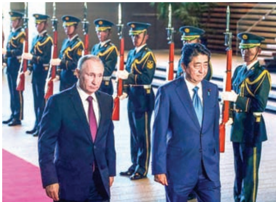
Russian President Vladimir Putin and Japanese Prime Minister Shinzo Abe review the guard of honour during a meeting in Tokyo, Japan, on 16 December 2016.

LDP Secretary General Toshihiro Nikai told reporters after that meeting that the party's lawmakers “won't be welcoming the new year with idleness.”— Kyodo News