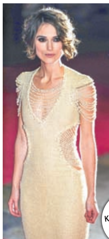
Actress Keira Knightley.