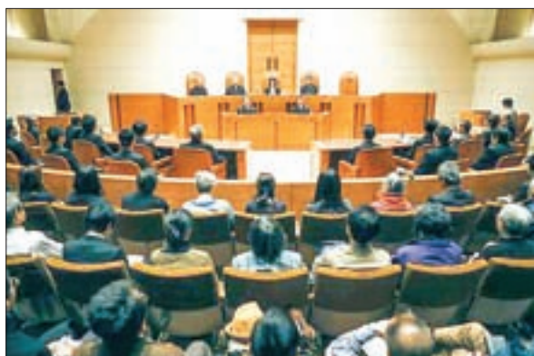
Judges of the Supreme Court's No. 2 Petty Bench sit in a courtroom in Tokyo, on 20 December 2016, before handing down a ruling on a dispute between the central government and Okinawa prefectural government over the relocation of a US Marine Corps air base within the southern island prefecture.

In the ruling handed down by the No. 2 Petty Bench of the Supreme Court, Presiding Justice Kaoru Onimaru said it was illegal for Onaga to revoke his predecessor's approval for landfill work required for the plan to move the Marine base from a crowded residential area in Ginowan to the less populated Henoko coastal area of Nago. The judgment was in