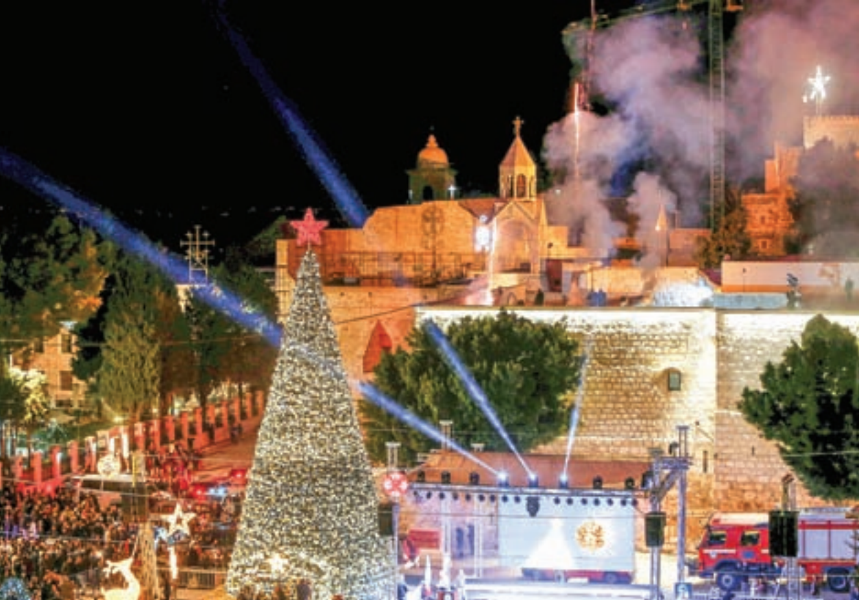
Fireworks explode during a Christmas tree lighting ceremony outside the Church of the Nativity in the West Bank town of Bethlehem on 3 December 2016.