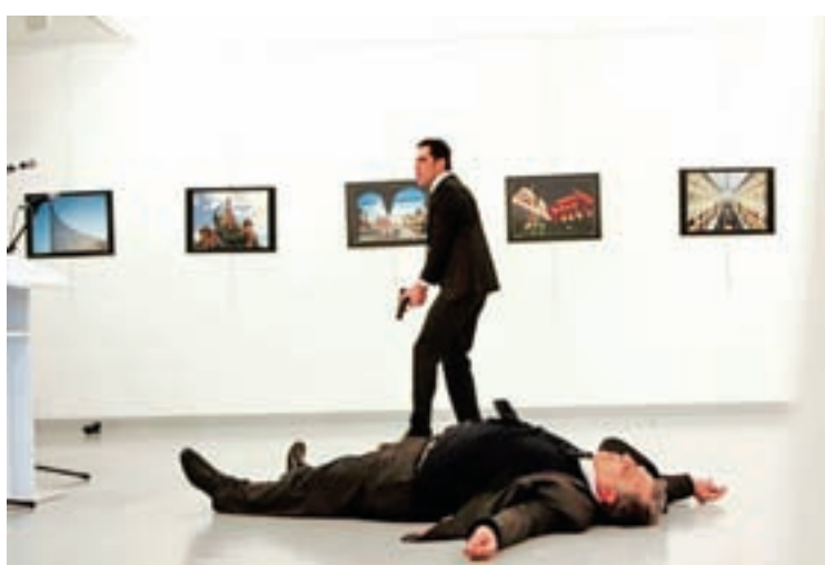
Russian Ambassador to Turkey Andrei Karlov lies on the ground after he was shot by unidentified man at an art gallery in Ankara, Turkey, on 19 December 2016.

Turkey identified the killer as 22-year-old Mevlut Mert Altintas, who had worked for the Ankara riot police for 2-1/2 years. Altintas, who also shouted slogans associated with Islamist militancy after shooting ambassador Andrey Karlov, was killed minutes later by members of Turkey's special forces. His