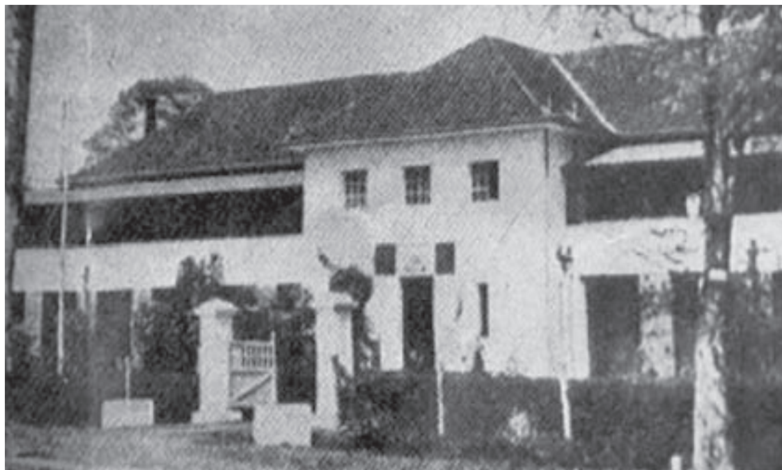
The union building seen in 1962 before being blown down.

The nation got pained in the heart. The empty plot where the students' union building once stood now stands a reminder of 'an insult by a few against a whole'. The negative impact on national politics of the bare plot has been shown in ages to be persistent, especially with regard to the relation between the Tatmadaw, the defense services, and students. And when we say students let us all be reminded of the whole population who support them.