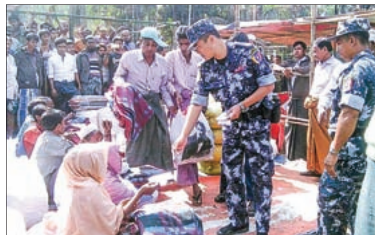
Officials and volunteers deliver aid to fire victims in Phonnyoleik Village.

The fire victims — 50 people from 8 households — were provided with food, clothing and other commodities worth Ks. 2,629,000 by police forces and well-wishers on December 17, it is learnt. — Myanmar News Agency