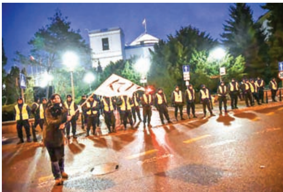
Policemen stand guard during the third day of a protest outside the Parliament building in Warsaw, Poland on 18 December 2016.

The protesters had earlier set up a few tents on the