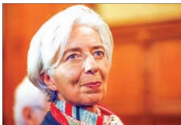
Managing Director of the International Monetary Fund (IMF) Christine Lagarde reacts before the start of her trial about a state payout in 2008 to a French businessman, at the courts in Paris, France, on 12 December 2016.

"I have been held negligent, but without penalty, without sanction, without registration of the decision," she said. "I am not satisfied with it, but