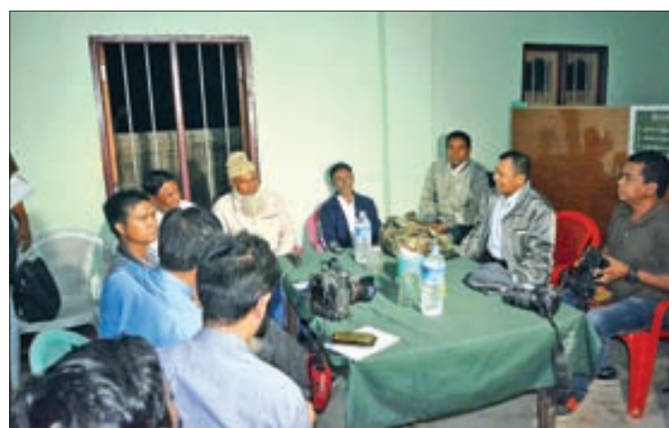
Journalists talk to leaders of Muslim community in Maungtaung.

ed to Maungtaung and met with townsmen and religious leaders of the Muslim community.