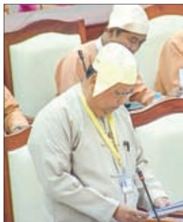
U Win Khaing, Union Minister for Construction.

U Win Khaing, Union Minister for Construction, made remarks to the Hluttaw in regard to a question raised by Dr Khin Maung Maung, constituency of Dagon Myothit (North), to wit: "U Wisara Road in Dagon Myothit (North) is a 1.1-mile long concrete road with 16 feet in width. It is learnt that it will take 40 tonnes of tar provided that a one-inch layer is surfaced further on the concrete road. It is true that in some parts of the concrete road, potholes were refilled with concrete, but 60 per cent of the