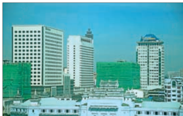
High rise buildings are seen in Yangon.