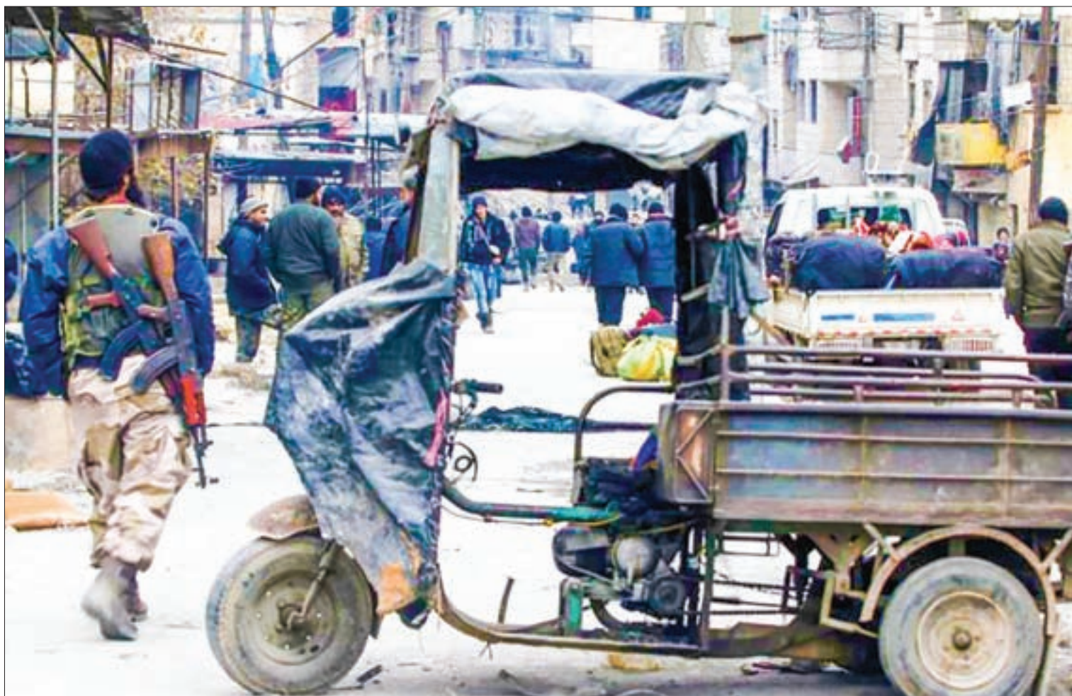
Rebel fighters and civilians walk in a rebel-held sector of eastern Aleppo, Syria on 18 December, 2016.

Civilians are also being evacuated from two mostly Shi'ite Muslim villages near Idlib that have been besieged by rebels