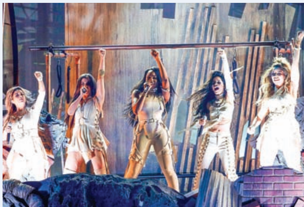
Fifth Harmony performs "That's My Girl" at the 2016 American Music Awards in Los Angeles, California, US, on 20 November 2016.

"As scary as it is to take the leap, I am excited and full of joy because I know that no matter what happens, I am following my heart."—Reuters