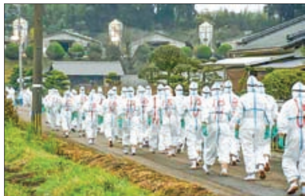
Officials of Miyazaki Prefecture in southwestern Japan head to a poultry farm in the town of Kawaminami on 20 December 2016 to cull about 122,000 chickens after a highly virulent strain of bird flu was detected.

Cases of the highly pathogenic H5 virus at poultry farms have been found in Niigata and Aomori prefectures as well as in Hokkaido since November. The Hokkaido government said on Tuesday that work to cull and bury all 280,000 chickens at a farm in the town of Shimizu has been completed after a virus outbreak was detected there.— Kyodo News