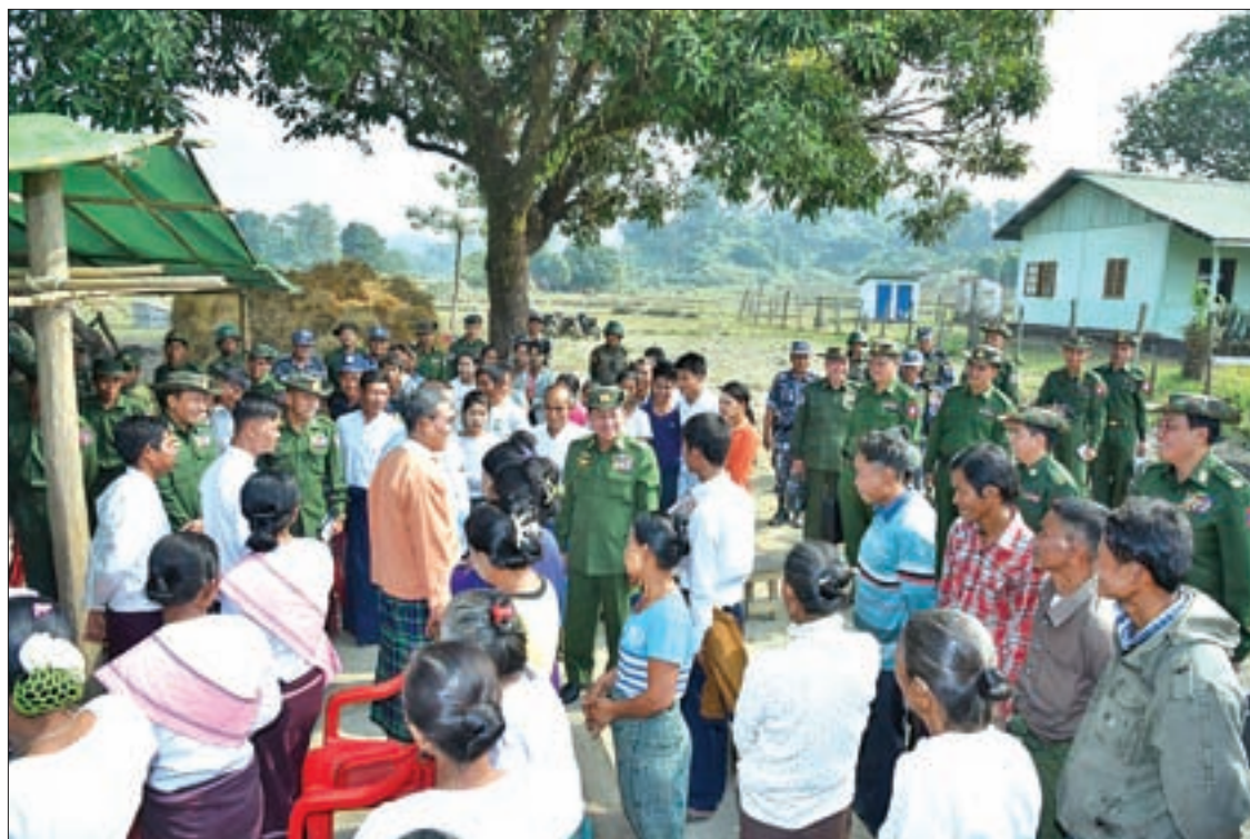
Senior General Min Aung Hlaing greeting.

THE Tatmadaw will always protect every inch of the territory of a sovereign country and urged national races to cooperate with the Tatmadaw, Senior General Min Aung Hlaing told residents and people's militia of Bandoola and neighbouring villages in Maung-taw yesterday.