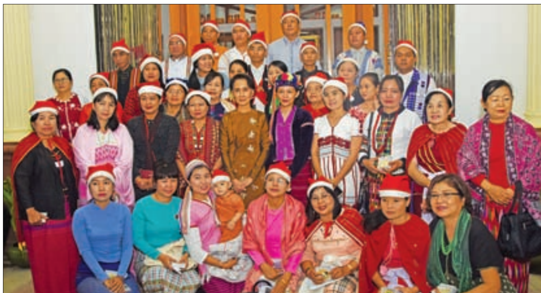
Families of multiethnic representatives of the Pyidaungsu Hluttaw pose for photo with State Counsellor Daw Aung San Suu Kyi after singing hymns for the State Counsellor at her residence.