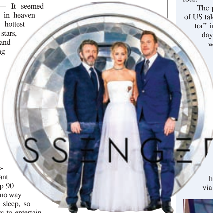
Cast members (L-R) Michael Sheen, Jennifer Lawrence and Chris Pratt pose at the premiere of "Passengers" in Los Angeles, California US, on 14 December 2016.

"Then when I got there I realized how un-sexual sex scenes are. You're sitting there with everyone that you work with and you're like 'OK, so I guess my leg will go there' so it was a lot of build-up for