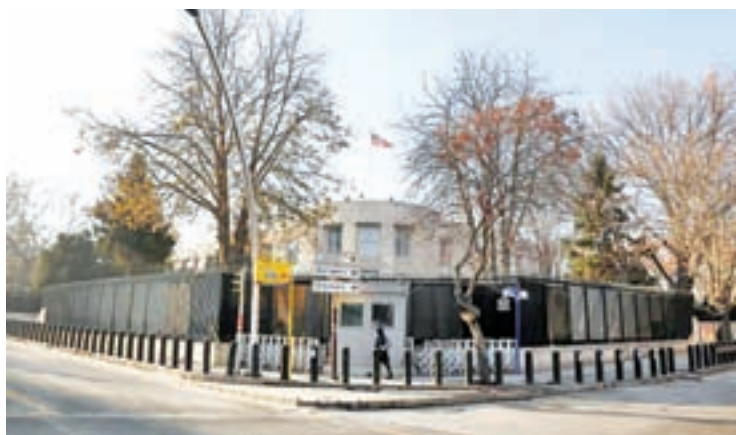
General view of the US Embassy in Ankara, Turkey, on 20 December 2016.

Russia and Iran are the main supporters of Syrian President Bashar al-Assad and the assailant who killed the Russian envoy shouted “Don’t forget Aleppo” when he shot him. Officials from the French and German embassies in Ankara told Reuters their operations were continuing normally for the time being.—Reuters