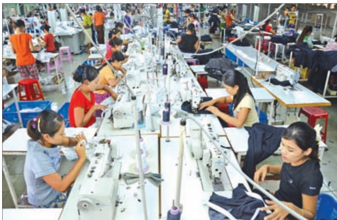
Workers seen on a production line at a garment factory in Hlinethaya.

Meanwhile, six local enterprises are permitted to invest US$61.971million in two industrial enterprises, one real estate development project, two hotels and tourism projects and one service