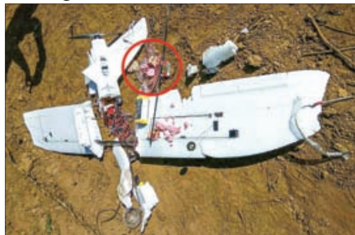
An unmanned aerial newnnaisance vehicle being seen damaged.