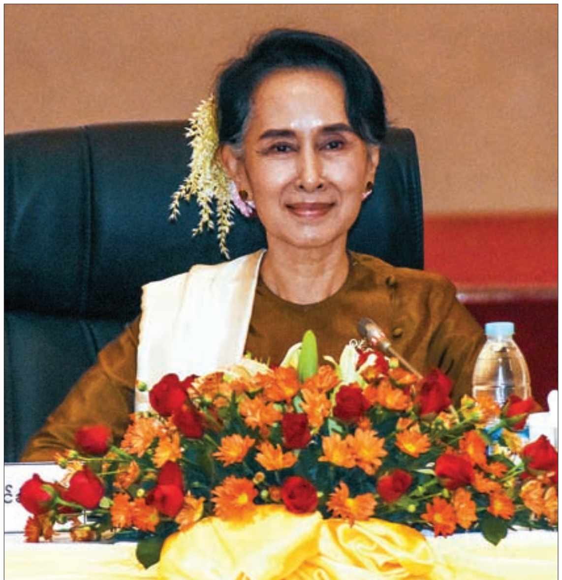
State Counsellor Daw Aung San Suu Kyi addresses the meeting of the Joint Coordinating Body for Peace Process Funding in Nay Pyi Taw to discuss the allocation of international funding.