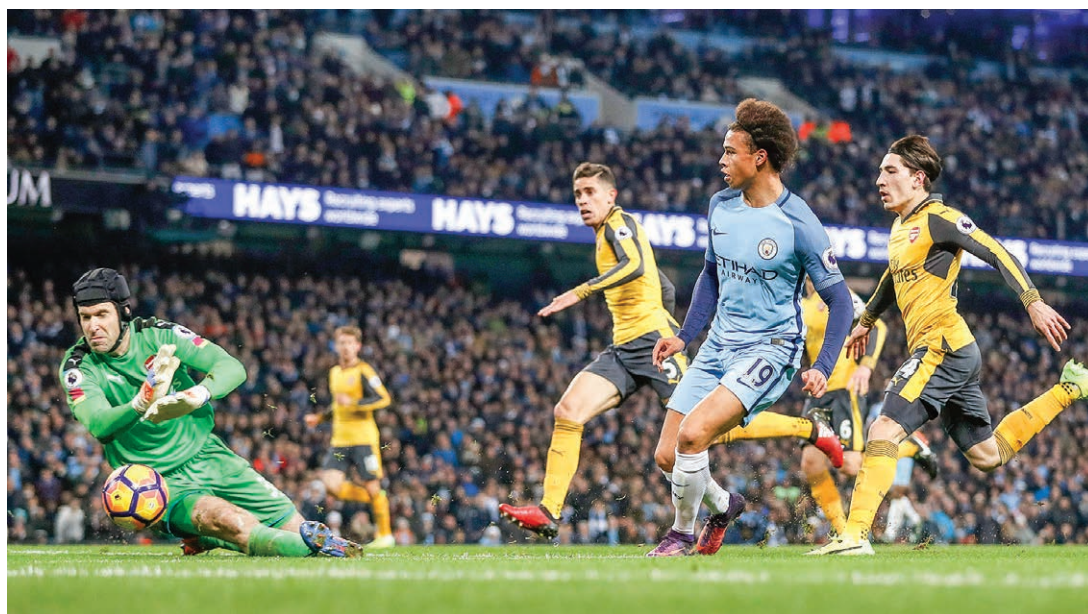
Manchester City's Leroy Sane has a shot saved by Arsenal's Petr Cech during Premier League at Etihad Stadium on 18 December 2016.