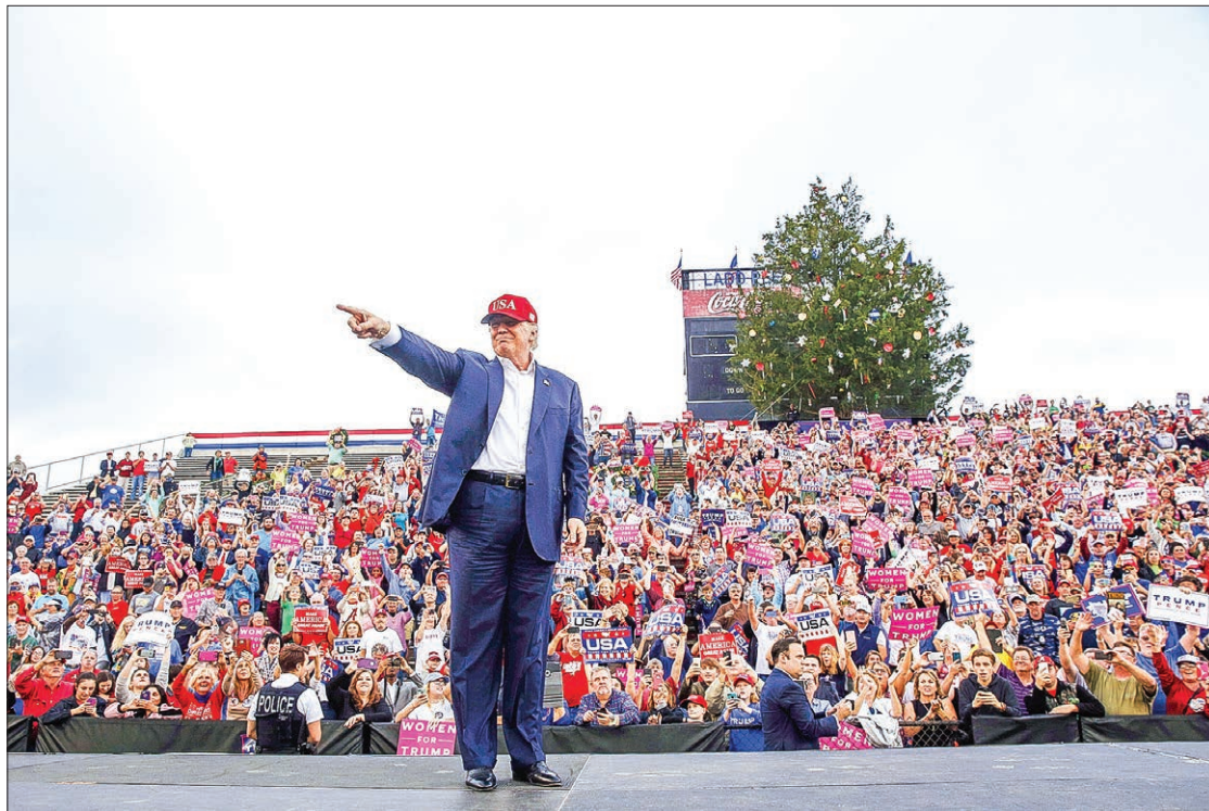
US President-elect Donald Trump arrives to speak during a USA Thank You Tour event in Mobile, Alabama, US, on 17 December 2016.

WASHINGTON — The US Electoral College is expected on Monday to officially select Republican Donald Trump as the next president in a vote that is usually routine but takes place this year amid allegations of Russian hacking to try to influence the election.