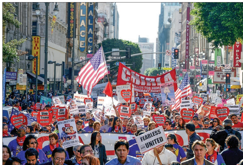
Protesters hold up signs during a march and rally against the United States President-elect Donald Trump in Los Angeles, California, US, on 18 December.

State TV showed a plane arriving on Sunday afternoon with a first batch of new currency notes. Central Bank Vice President Jose Khan said they were 13.5 million 500 bolivar bills. — Reuters