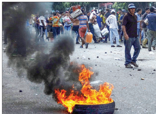
People carry goods taken from a food wholesaler after it was broken into, in La Fria, Venezuela on 17 December 2016.

Maduro, a 54-year-old former bus driver and foreign minister who replaced Hugo Chavez in 2013, has seen his popularity plunge during a