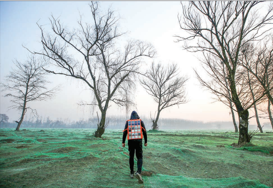
Artist Liu Bolin wearing a vest with 24 mobile phones walks in smog as he live broadcasts air pollution in the city on the fourth day after a red alert was issued for heavy air pollution in Beijing, China, on 19 December, 2016.

BEIJING — Chinese artist Liu Bolin, known as “the invisible man” for using painted-on camouflage to blend into the backdrops of his photographs, says his latest project aims to put the spotlight on China’s air pollution problem.