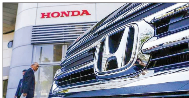
A Honda Motor Co's automobile displayed outside the company showroom in Tokyo.

The agreement was reached among three parties: Eastern Nova, Honda Motor Co., Ltd., and Asian Honda Motor Co., Ltd, Honda's regional headquarter for the Asia and Oceania Region, to materialize high quality after-sales service for the owners of Honda vehicles.