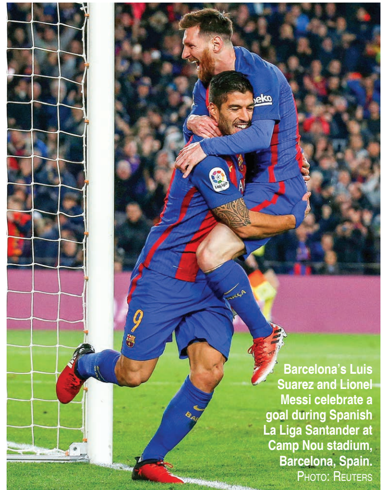
Barcelona's Luis Suarez and Lionel Messi celebrate a goal during Spanish La Liga Santander at Camp Nou stadium, Barcelona, Spain.

"I would have preferred for him to have completed his amazing move rather than me scoring it, it was like a PlayStation move," he said. "Messi is a unique player."—Reuters