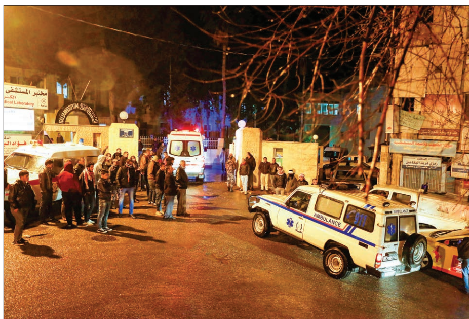
Ambulances are seen in front of the Italian hospital where some of the injured were evacuated to after an attack, in the city of Karak, Jordan, on 18 December, 2016.