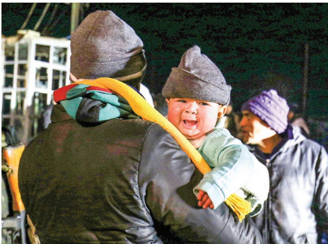
A child reacts as evacuees from rebel-held east Aleppo arrive at the town of al-Rashideen, which is held by insurgents, Syria on 19 December 2016.

Later on Monday, the Security Council will vote in New York on a resolution to allow UN staff to monitor the evacuations.