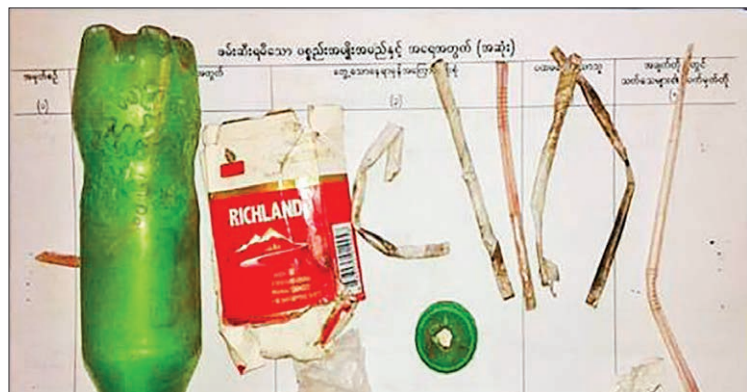
Items including the empty bottle, two pipes used for snorting drugs seized from the home of Hammad Tusaung, 50, in Ducheertan Village (West).

A suspected drug trafficker was killed yesterday as a security policeman defended himself against a knife attack in Maungtaw, northern Rakhine.