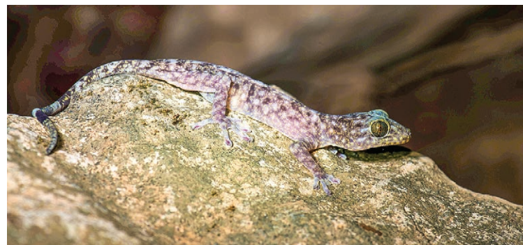
Gekko Bonkowski is pictured in this handout picture received by Reuters on 18 December 2016.

The Greater Mekong is a global hub for illegal wildlife