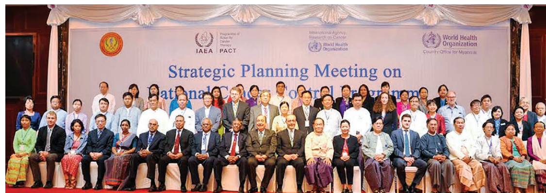
A group photo of attendees at the National Strategic Planning Workshop on Cancer Control held in Nay Pyi Taw from 12-14 December. The meeting concentrated on implementation of a National Cancer Control Plan.

Asia accounts for 60 per cent of the world population and half the global burden of cancer. The incidence of cancer cases is estimated to increase from 6.1 million in 2008 to 106 million in 2030. According to the International Agency for Research on Cancer (IARC), Myanmar faced an estimated 64,000 new cancer cases in 2012. Since that time, the figure has steadily increased. Cancer deaths are predicted to increase by