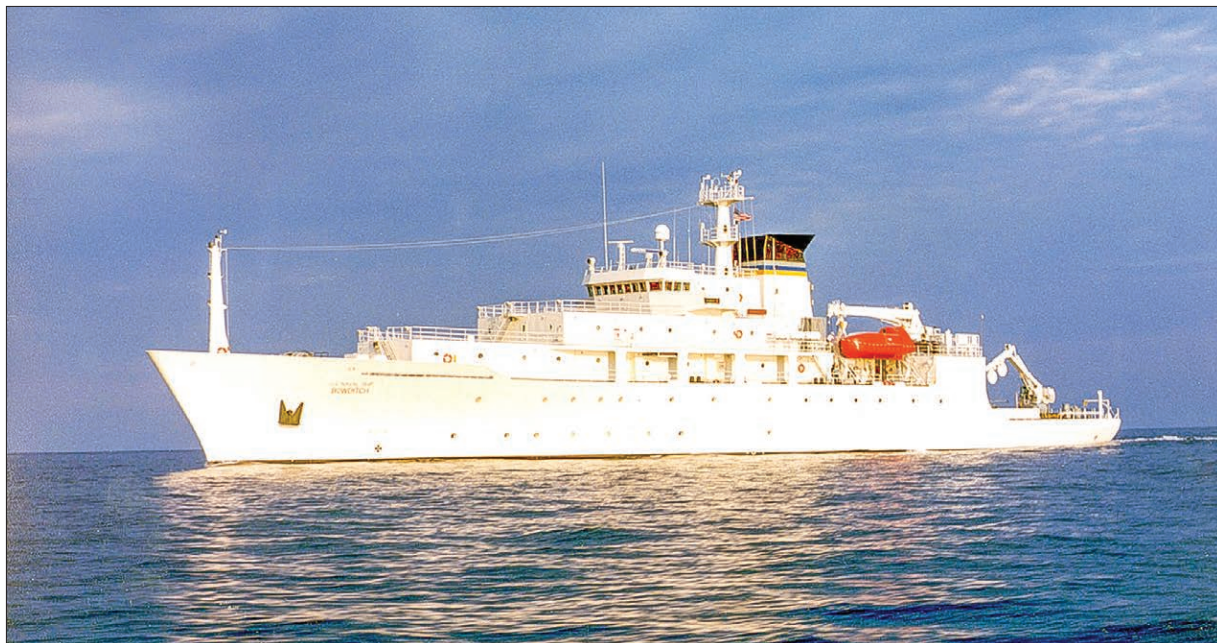
The oceanographic survey ship, USNS Bowditch, is shown on 20 September 2002, which deployed an underwater drone seized by a Chinese Navy warship in international waters in South China Sea, on 16 December 2016.

Printed and published at the Global New Light of Myanmar Printing Factory at No.150, Nga Htat Kyee Pagoda Road, Bahan Township, Yangon, by the Global New Light of Myanmar Daily under Printing Permit No. 00510 and Publishing Permit No. 00629.