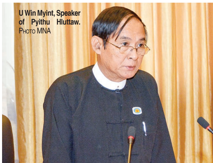
U Win Myint, Speaker of Pyithu Hluttaw.