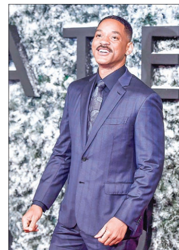
Will Smith arrives at the European Premiere of Collateral Beauty in London, Britain, on 15 December, 2016.

"I've spent every Christmas without a Christmas tree ... since some while, I'm like Charlie Brown's Christmas - the sad tree, the Grinch," he said.—Reuters