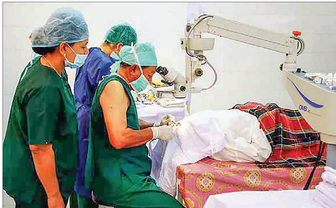
Photo: Eye surgical operation being performed by surgeons.