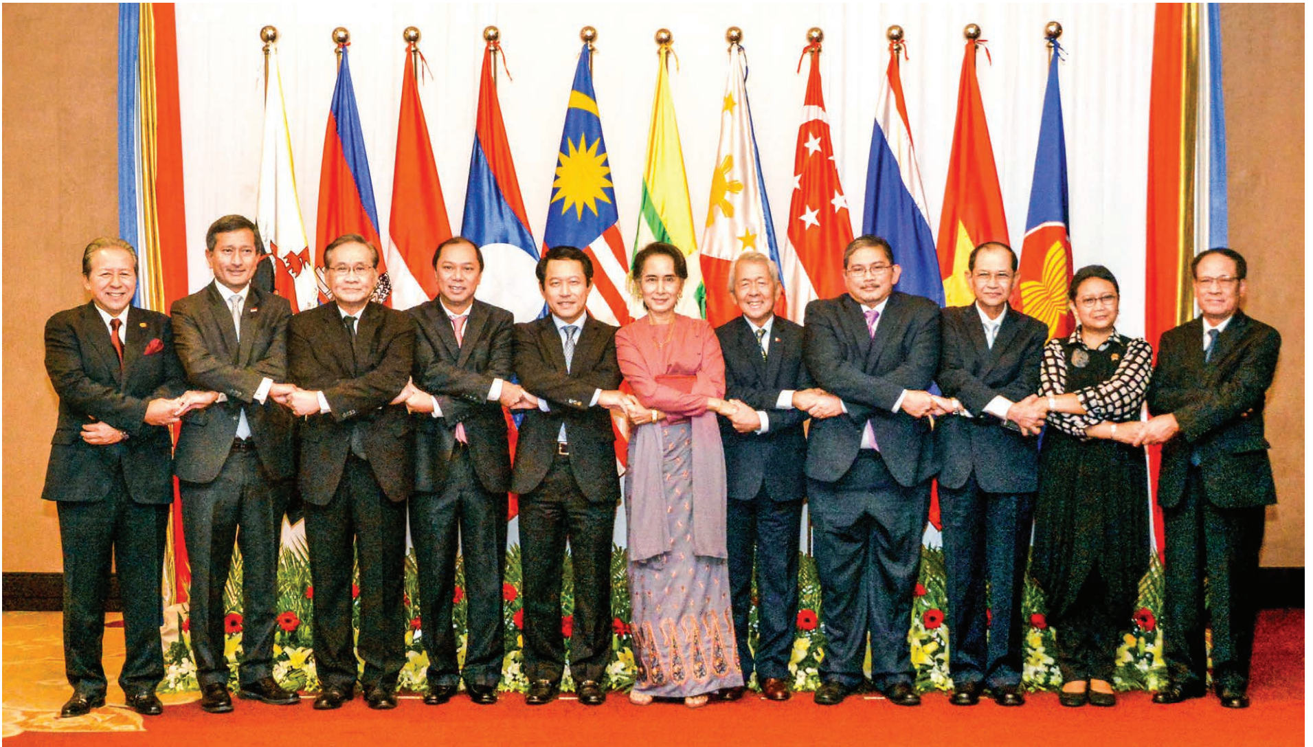
State Counsellor Daw Aung San Suu Kyi joins hands with ASEAN foreign ministers before the start of the retreat for ASEAN Foreign Ministers at the Sedona Hotel in Yangon.