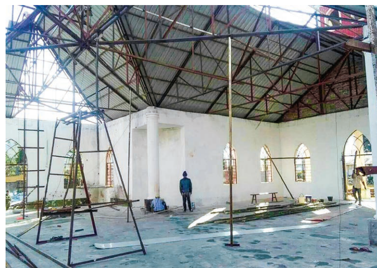
Government troops repair church damaged by explosions.

As stability has been restored in the area, government troops are also rebuilding other damaged buildings during the attacks and carrying out rehabilitation tasks in Mongko. — Myanmar News Agency