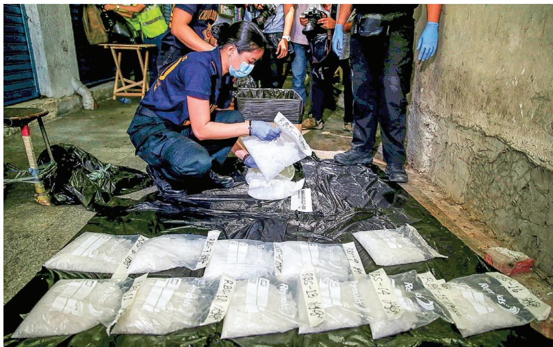
A police investigator makes an inventory of the Methamphetamine, locally known as Shabu, worth 120 million pesos ($2.41 million), that was confiscated during a drug-buy bust police operations in a mall at a Guadalupe city, metro Manila, Philippines on 21 November 2016.