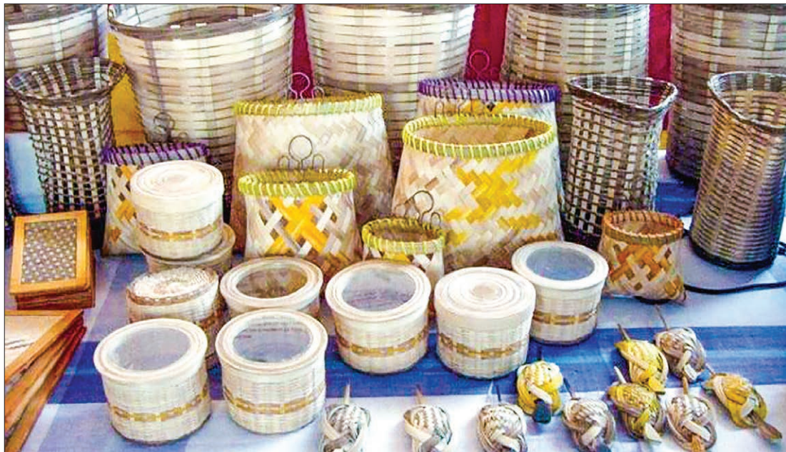
Bamboo products on display.

The exchange rate for one Chinese Yuan was at Ks193 and the rate rose a bit to Ks195 on 18th December, it is learnt.—Myitmakha News Agency