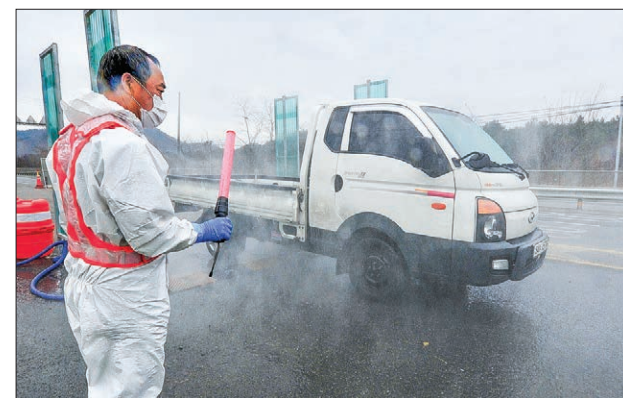
A South Korean health official disinfects a vehicle to prevent spread of bird flu in Pohang, South Korea, on 19 December 2016.