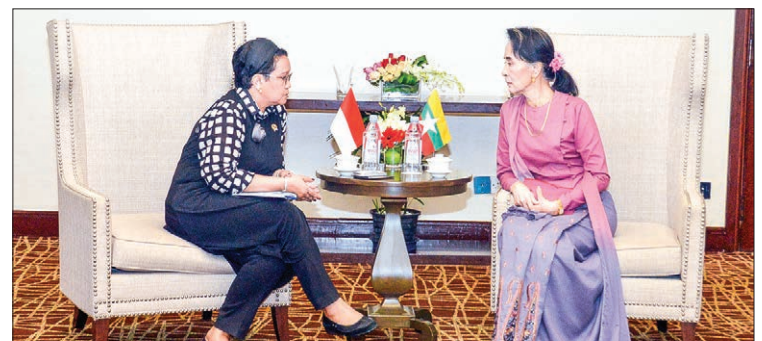
State Counsellor Daw Aung San Suu Kyi holds talks with Ms Retno Marsudi.

Daw Aung San Suu Kyi, State Counsellor and Union Minister for Foreign Affairs, held talks separately with Dato Erywan Pehin Yusof, Deputy Minister for Foreign Affairs and for Trade of Brunei Darussalam, and Ms Retno Marsudi, Minister of Foreign Affairs of Indonesia at the Sedona Hotel at 10.30 am and 1 pm respectively yesterday. — Myanmar News Agency