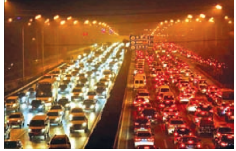
Vehicles drive along the 4th ring road among heavy smog in Beijing, China, on 16 December 2016.

With Christmas just a week away, others resorted to dark hu-