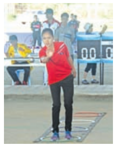
A contestant competes in 20th Asian Petanque Championship 2016.

A total of 129 athletes from host country Myanmar, Brunei, Cambodia, Singapore, Laos, Japan, Malaysia, China (Taipei) and Thailand participated in the events. —Myanmar News Agency