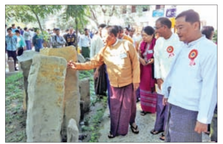
The Geo Stone Garden being observed by the dignitaries.

CEREMONY to open the Geo Stone Garden, which was built for the 63th anniversary of the foundation of the Geology Department at Mandalay University, was held on the grounds between the main building of Mandalay University and academic building and the Geology Department on Friday.