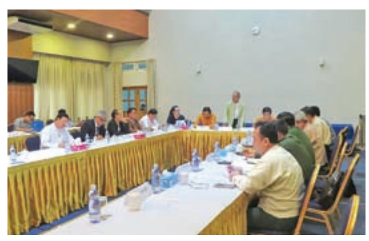
Representatives of the secretariat of the Union Peace Dialogue Joint Committee hold a meeting at NRPC in Yangon.

It is also learnt that national-level political dialogues for ethnics in Kayin State, national-level political dialogues for the Tanintharyi Region and national-level political dialogues for issues participated by civil society organizations will be held. The outcomes of the dialogues will be submitted to the Second Panglong Union Peace Conference in February in accordance with the Nationwide Ceasefire Agreement.—Myanmar News Agency