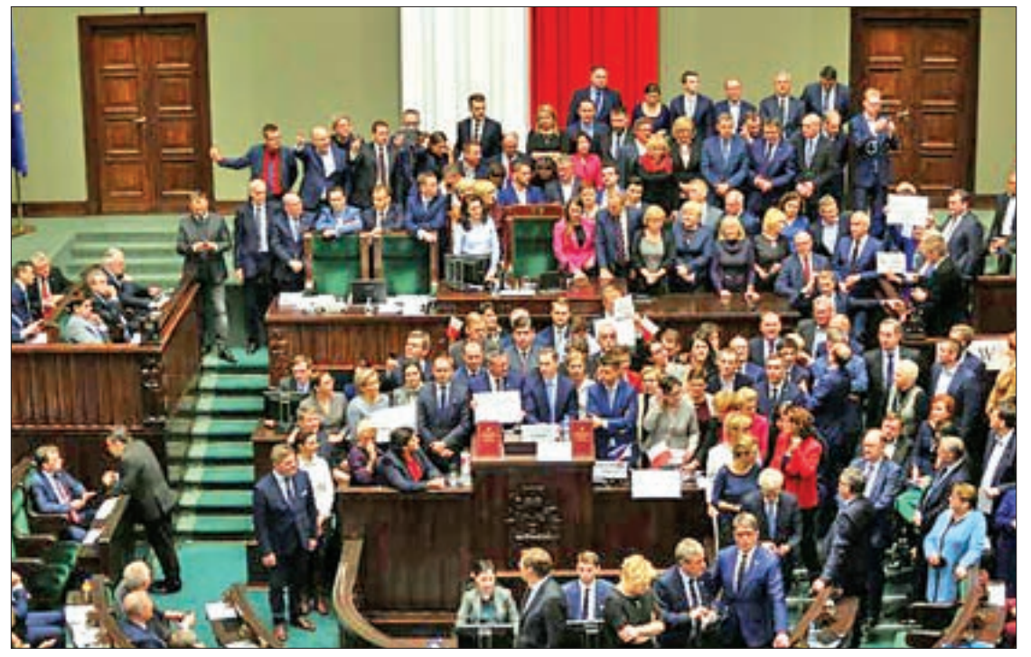
Polish opposition parliamentarians protest against the rules proposed by the head office of the Sejm, the lower house of parliament, that would ban all recording of parliamentary sessions except by five selected television stations and limits the number of journalists allowed in the building, in the Parliament in Warsaw, Poland, on 16 December 2016.