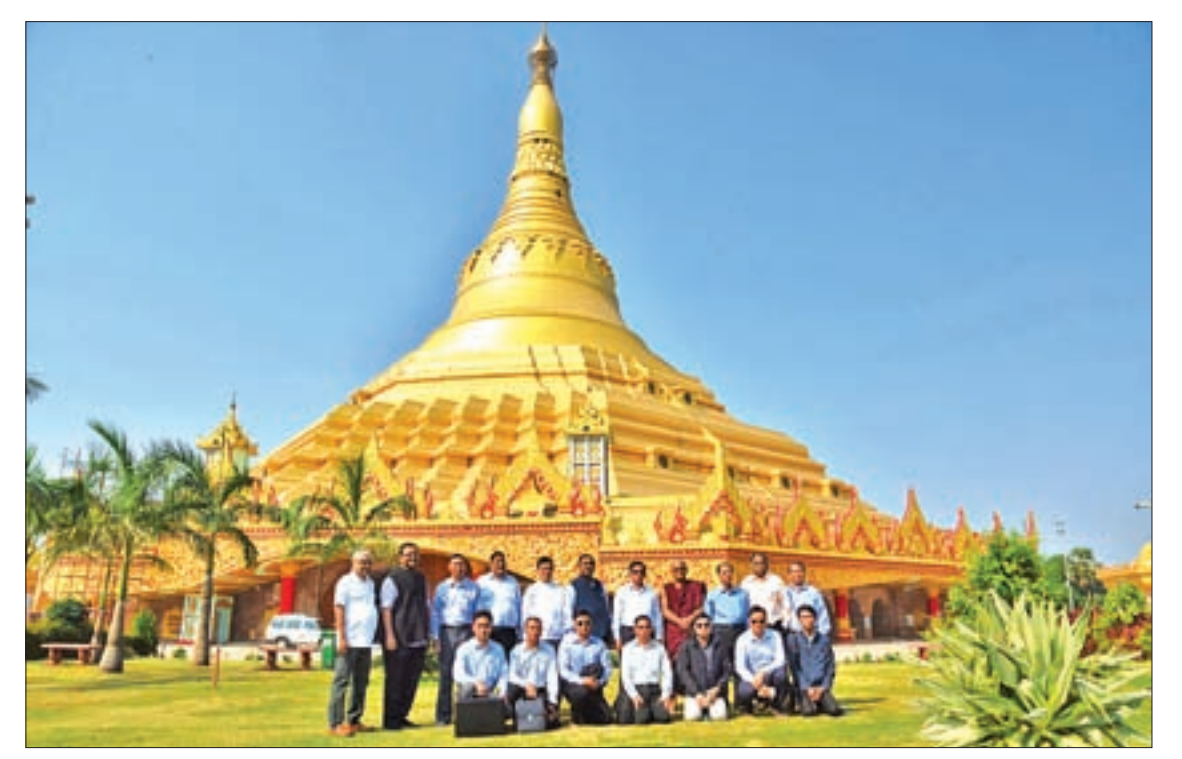
VP and Senior General posing for a group photo in front of the pagoda.

An investigation has been launched into the fire by security forces.— Myanmar News Agency