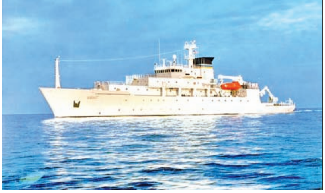
The USNS Bowditch, an oceanographic survey ship, is seen in this undated US Navy handout photo.

ministries have yet to comment publicly on the issue.