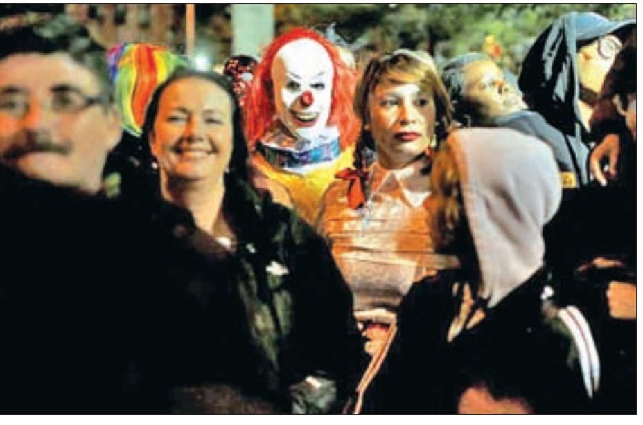
A person dressed in a clown costume stands amongst attendees during the Greenwich Village Halloween Parade in Manhattan, New York, US, on 31 October 2016.

In April, a California man was sentenced to 20 years in prison for setting one of the state's worst wildfires after filming himself surrounded by the flames.—Reuters