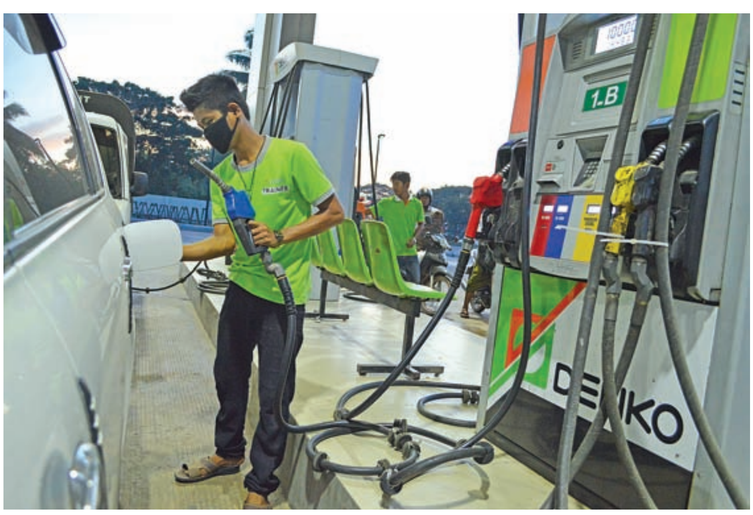
A Denko petrol filling station.

In a bid to reduce the inflation rate, the government is trying to lessen the trade deficit by scrutinising the luxury commodity and the import items, excluding essential items, according to the second five-year National Development Plan.-Mon Mon