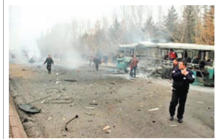
People react after a bus was hit by an explosion in Kayseri, Turkey, on 17 December 2016.

Turkey faces multiple security threats including spillover from the fight against Islamic State in northern Syria, where it is a member of a US-led coalition against the militant group. It also faces regular attacks from Kurdish militants, who have been waging a three-decade insurgency for autonomy in largely Kurdish southeast Turkey.-Reuters