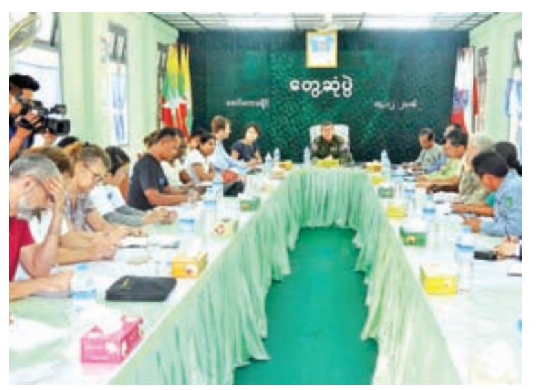
Authorities hold a meeting with UN/INGOs in Maungtaw

Police provide security to the entrance gate in Maungtaw.