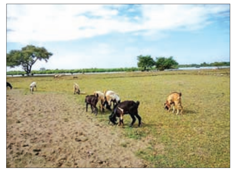
Goats seen feeding on the pasture.

they cannot adapt themselves to Rakhine weather yet. But, we're quite optimitistc. We also have a plan to extend the project," said a young man from Laung Chaung village.— Myitmakha News Agency