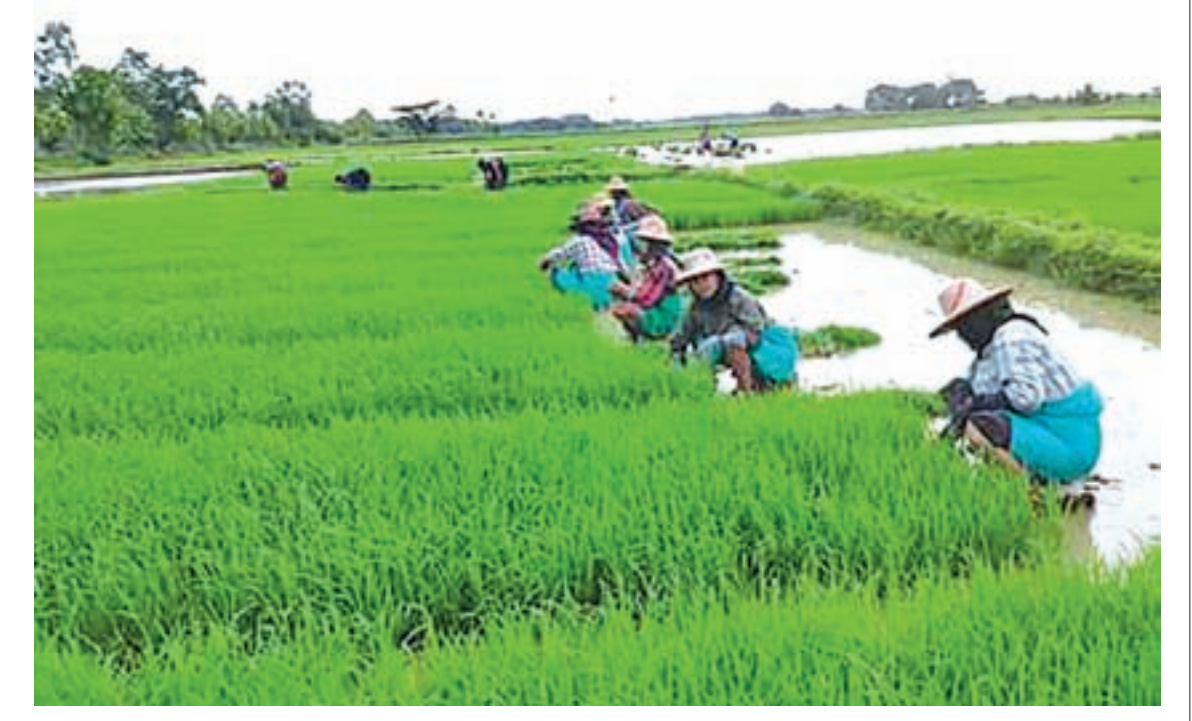
File photo shows farmers transplanting rice seedlings in Ayeyawady Delta. Photo: MYITMAKHA NEWS AGENCY

In 2016, Myanmar Agricultural Development Bank from Ayeyawady region lent over Ks390 billion to cultivate monsoon paddies on over 3.25 million acres of land. - Myitmakha