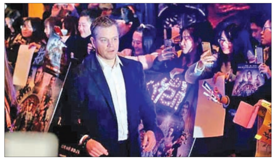
Actor Matt Damon attends a red carpet event promoting Chinese director Zhang Yimou's latest film 'Great Wall' in Beijing, China on 6 December 2016.

While a drop in China's ticket sales growth could muddy the outlook for foreign movies, Sanford Panitch, president of Sony Corp's Columbia Pictures, shrugged it off, saying: "We'll take this slowdown