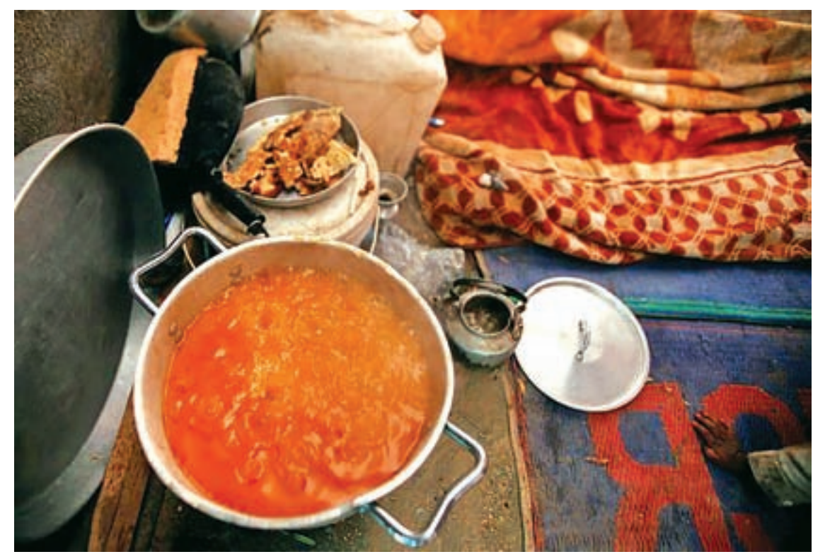
Food is cooked inside a tent at a camp for people displaced by the war near Sanaa, Yemen, on 27 September 2016.

year we will face significant problems," said McGoldrick, who described the economy as "shredded".