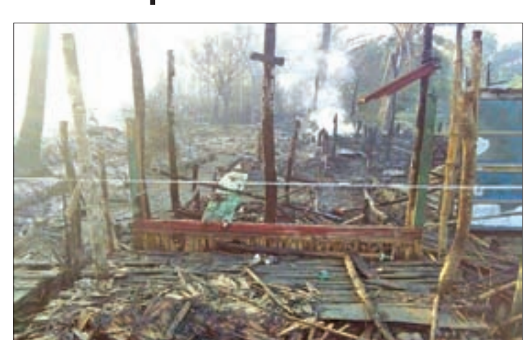
The fire caused by negligence destroys houses and kills two people in Buthitaung Township.

On Thursday morning, a fire broke out in the village of Phonnyoleik in Buthitaung township, Rakhine State, killing two people and destroying houses and shops. it is learnt. The fire started from the remnants left unattended and un-extinguished in the kitchen of Khobiarmat's house at about 2:30 am on December 15. The fire was brought under control and extinguished at about 3 am, killing 2 people and ruining 8 houses and 9 shops worth Ks 20 lakh. Phonnyoleik Police Station is taking action against Khobiarmat about the fire, it is learnt.— Myanmar News Agency