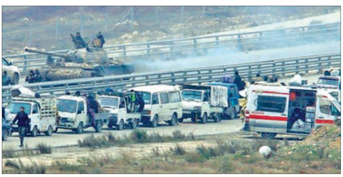
Forces loyal to Syria's President Bashar al-Assad sit on a tank as a convoy of buses and other vehicles bringing people out of eastern Aleppo turns back in the direction of the besieged rebel enclave, Syria, on 16 December 2016.

Rebels in eastern Aleppo went on high alert after pro-government forces prevented civilians from leaving and deployed heavy weaponry on the road out of the area. a Syrian rebel commander in the city said. A Syrian official source said the evacuation was halted because rebels had sought to take out people they had abducted with them, and they had also tried to take weapons hidden in bags. This was denied by Aleppo-based rebel groups. But a media outlet run by the pro-government Hezbollah group said protesters had blocked the road from the city, demanding that wounded people from the villages of Foua and Kefraya in nearby Idlib Province should also be evacuated.—Reuters