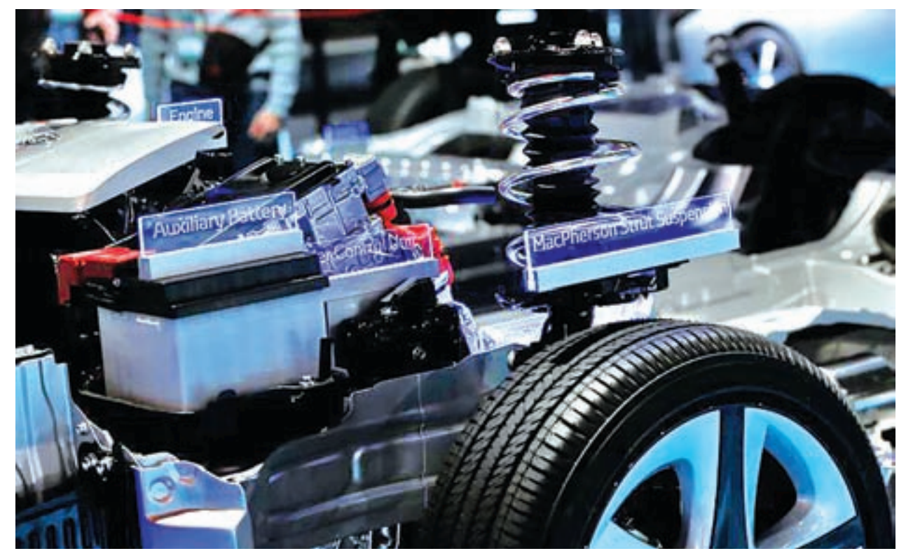
Cutaway view of a Toyota Prius Hybrid being displayed at the North American International Auto Show in Detroit, on 12 January 2016.

like glorified computers, automakers are standardising many mechanical parts and competing more on style and packaging - giving drivers a bigger range of features from automated parking to cockpit concierges.