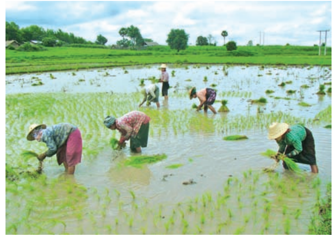
Woman transplanters are being seen on a paddy field.

Between April and November this year, rice and broken rice