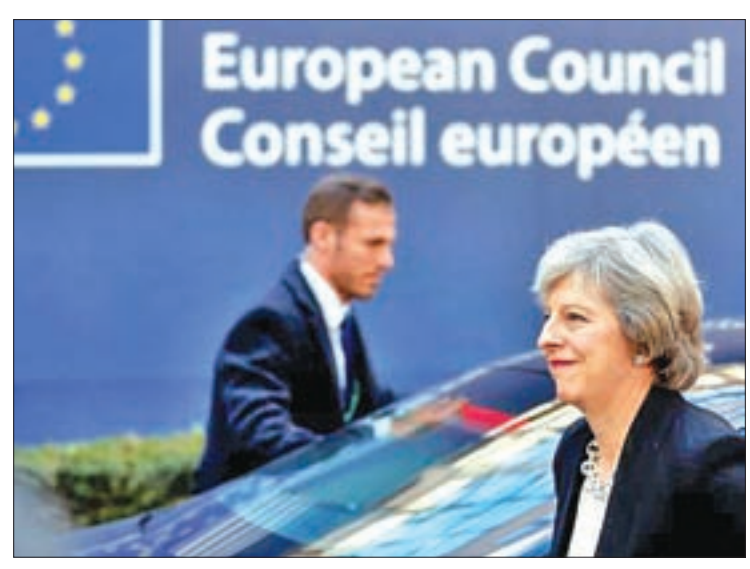
Britain's Prime Minister Theresa May arrives at a European Union leaders summit in Brussels, Belgium, on 15 December, 2016.

But "any agreement will have to be based on a balance of rights and obligations", they insisted, and reject British attempts to remain in the EU's single market if