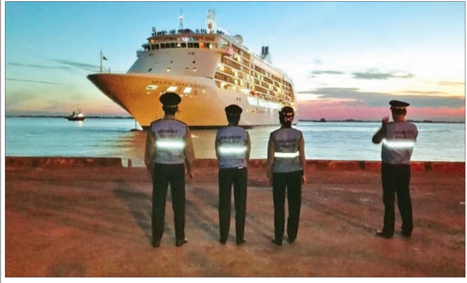
M.S Seven Seas Voyager carrying 654 tourists and 439 crews arrived the Myanmar Thilawa International Terminal on 16th December 2016. The tourists will visit Yangon, Bago, Bagan and Mandalay before they left the MITT on 18 December for Phuket Port in Thailand.