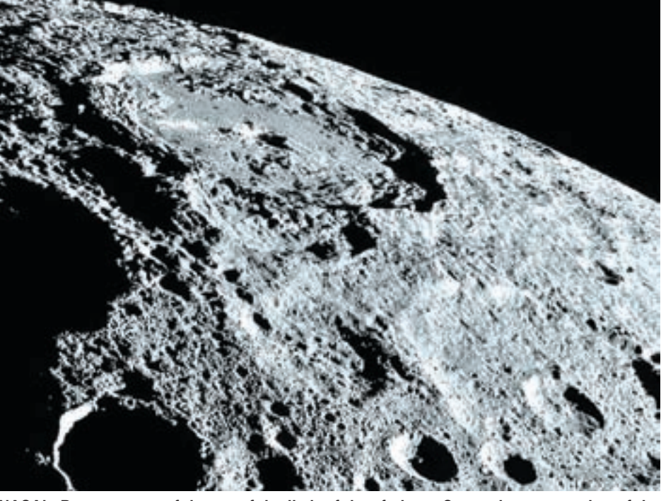
NASA's Dawn spacecraft image of the limb of dwarf planet Ceres shows a section of the northern hemisphere in this image on 17 October 2016.

The studies show that Ceres is about 10 per cent water, now frozen into ice, according to physicist Thomas Prettyman of the Planetary Science Institute in Tucson, Arizona, one of the researchers.