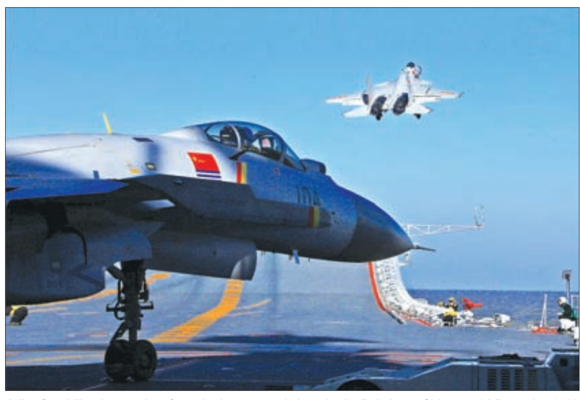
A live-fire drill using an aircraft carrier is seen carried out in the Bohai sea, China, on 14 December 2016.

er, firing missiles and destroying a target at sea.