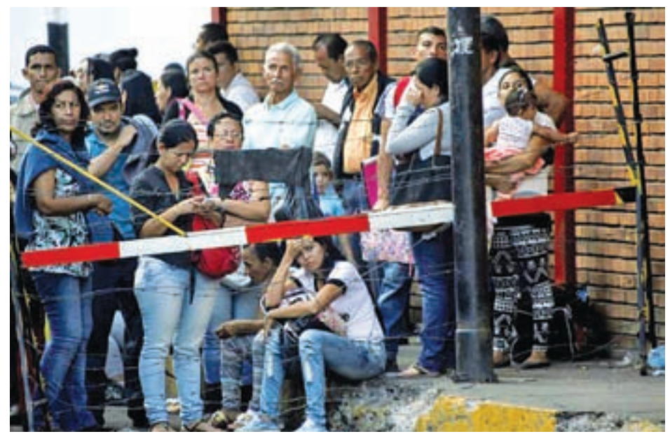
People wait next to fences to try to cross the Simon Bolivar international bridge into Colombia, in San Antonio del Tachira, Venezuela.

New bills were due to be phased into Venezuela's ailing economy on Thursday. But in a surreal twist, cash machines continued to give out 100-bolivar notes, frustrating Venezuelans who had scrambled to spend or deposit the bills — worth only 4 US cents on the black