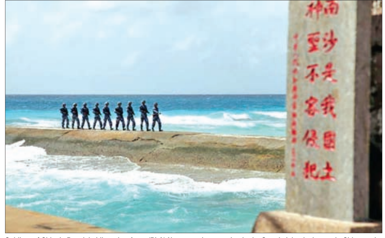
Soldiers of China's People's Liberation Army (PLA) Navy patrol near a sign in the Spratly Islands, known in China as the Nansha Islands, on 9 February 2016. The sign reads 'Nansha is our national land, sacred and inviolable.'

"Let them take whatever action is necessary in