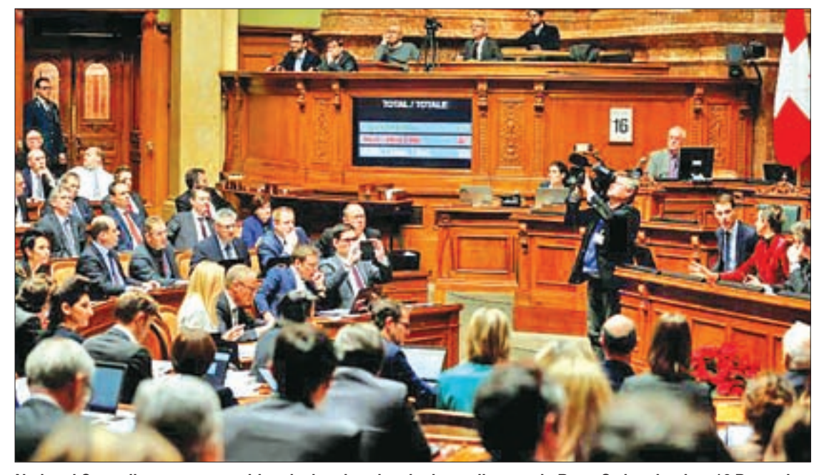
National Councilors vote on curbing the immigration, in the parliament, in Bern, Switzerland on 16 December 2016.

ZURICH — Switzerland approved a law on Friday aimed at curbing immigration by giving local people first crack at open jobs, skirting voters' demand for outright quotas that it feared could disrupt close ties with the in parliament, has accused other European Union.