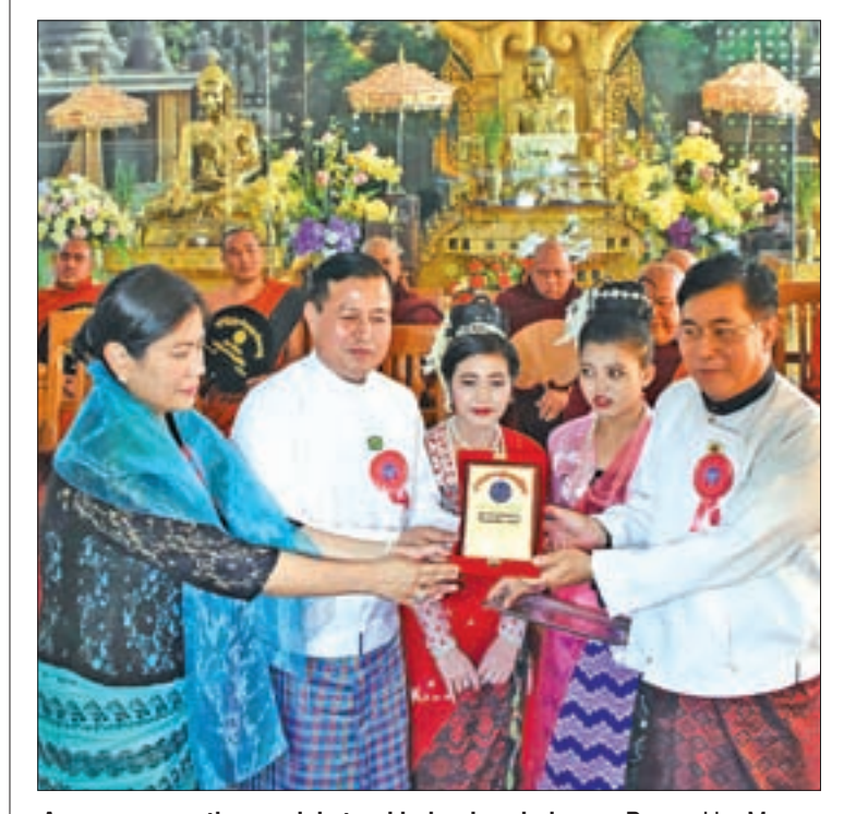
A commemorative medal stand being handed over.