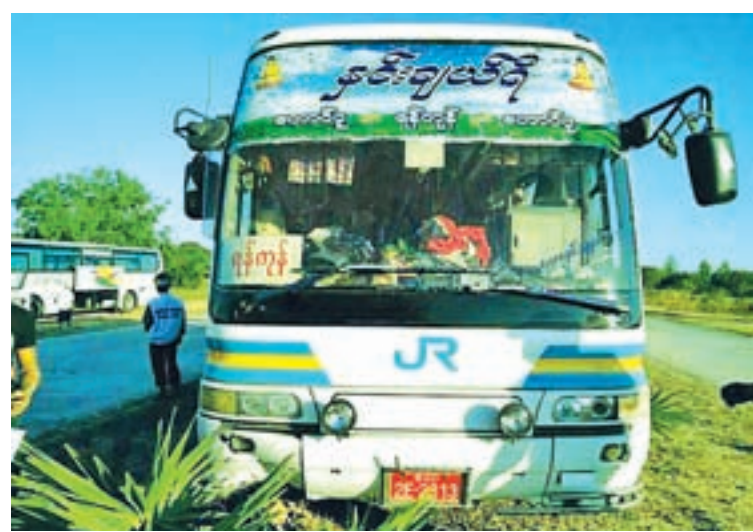
Hnin Cherry Express is being seen on the road-divider.

AN EXPRESS named Hnin Cherry driven by Than Tun Aung en route from Nay Pyi Taw to Yangon hit the road-divider between mile posts 130/2 and 130/3 on Yangon-Mandalay Highway at about 7am on 16 December 2016.