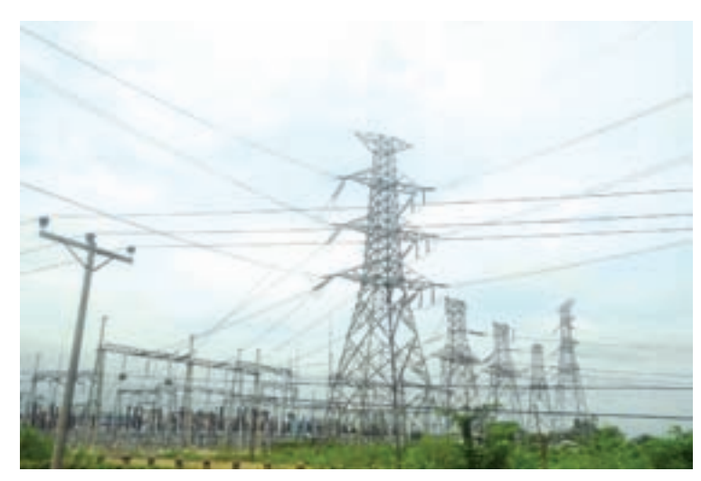
High-voltage power lines being seen.

Electricity supply corporation.—Myitmakha News Agency