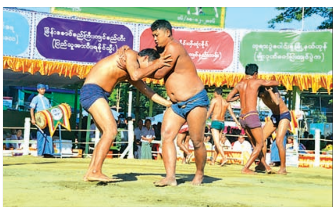
Kyin wrestling being seen in the arena.