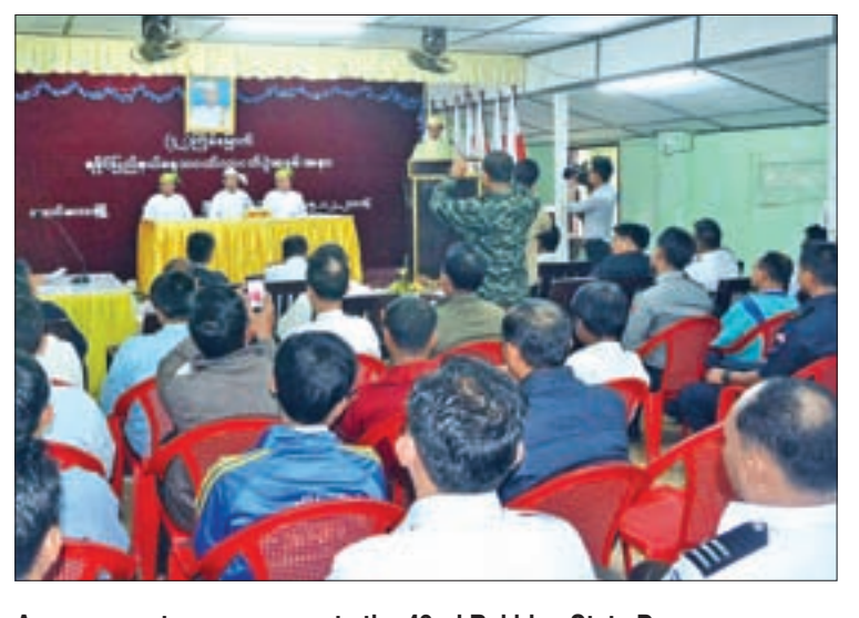
A ceremony to commemorate the 42nd Rakhine State Day at the Maungtaw Township General Administration Office.

memoration was held in the towns across the state.