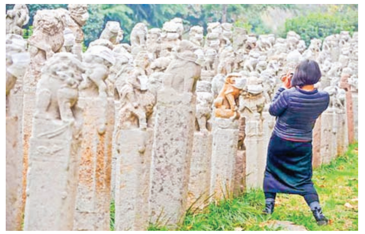
Stone pillars with masks placed on them by students of a university, as a pollution-themed art installation, are seen in the school campus in Xi'an, Shaanxi province, China, on 12 December 2016.