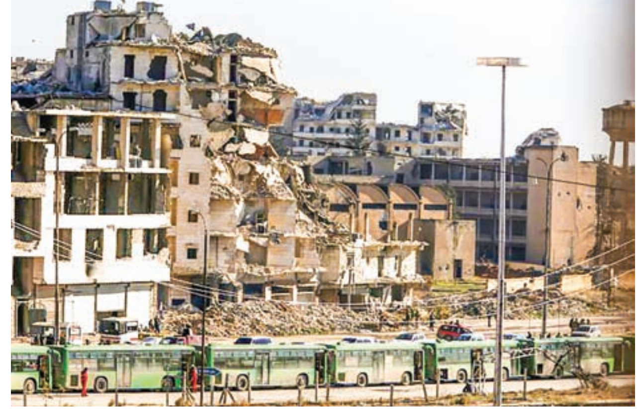
Buses are seen parked in Aleppo's government controlled area of Ramouseh, as they wait to evacuate civilians and rebels from eastern Aleppo, Syria on 15 December 2016.

An official with an Aleppo rebel group said the medical convoy had stopped before clearing the besieged eastern part of the city.