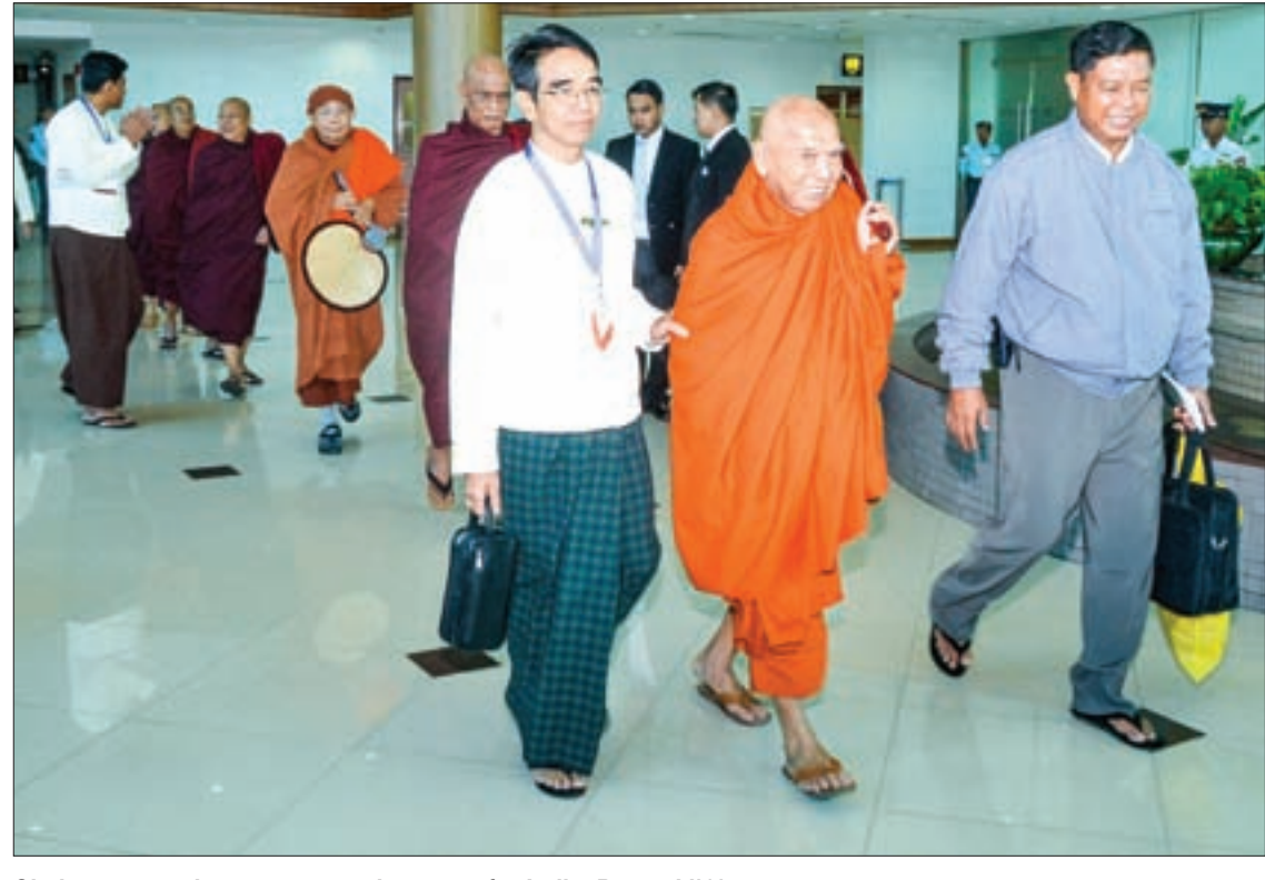
Chairman sayadaw seen upon departure for India.