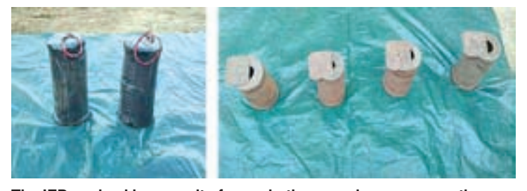
The IEDs seized by security forces in the area clearance operation.

Security forces also seized mines in bags along with automobile pistons used in making land mines while conducting area clearance operations in the hills near Mayintaung and Hmawtaung.—Myanmar News Agency