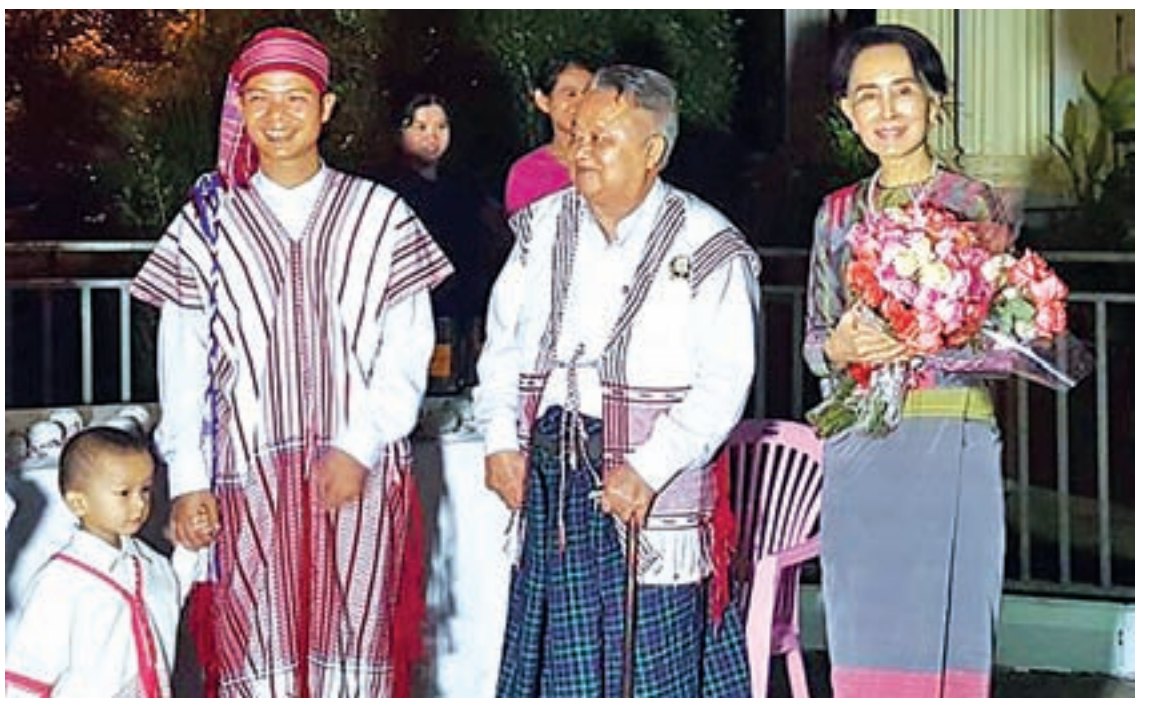
State Counsellor Daw Aung San Suu Kyi is seen at the event in which Kayin national parliamentarians sing psalms at her residence in Nay Pyi Taw in commemoration of the Kayin New Year.

The Kayin New Year Festival is to be celebrated in Nya Pyi Taw on 29 December as a holy traditional festival with pomp and circumstance that includes the traditional festival of eating the first crop of the year, exhibition of traditional commodities and traditional dance.—Myanmar News Agency