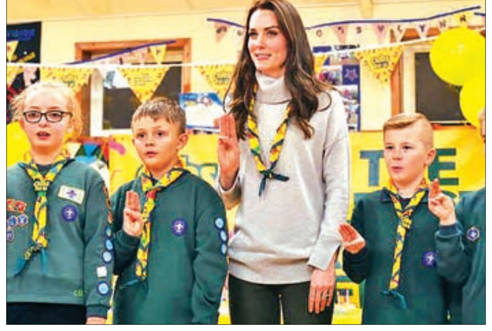
Britain's Catherine, Duchess of Cambridge (C), reads the Scouts promise during a Cub Scout Pack meeting with cubs from the Kings Lynn District, in Kings Lynn, Britain, on 14 December, 2016, during an event to celebrate 100 years of Cubs.

The event came ahead of Friday's official centenary of the Cub Scouts, an extracurricular organisation helping youth develop teamwork and leadership skills, which will be celebrated with a series of events held nationwide. -Reuters