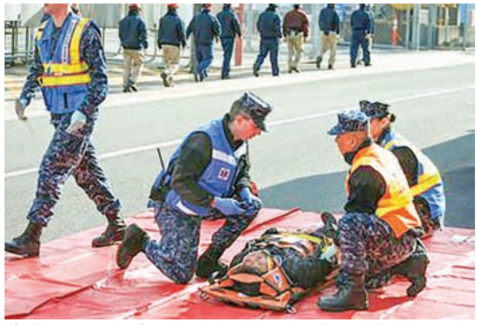
US military personnel perform triage during a joint nuclear disaster drill with Japan at the US Navy's Yokosuka base in Kanagawa Prefecture near Tokyo, on 15 December 2016. The drill was the 10th in a series that began in 2007.