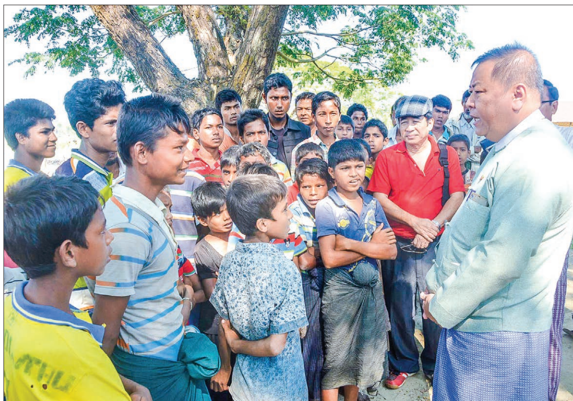
A member of the investigation commission meets with villagers during the visit to conflict areas in northern Rakhine.

The commission has been entrusted with the authority to investigate any persons needed, to get necessary particulars and to go to places as needed in the course of the investigation, it is described.