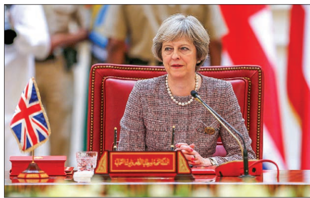
British Prime Minister Theresa May.

Banks and businesses have repeatedly argued the government should agree a transition period to avoid a damaging "cliff edge" or abrupt exit from the bloc before Britain has finalised its future trading