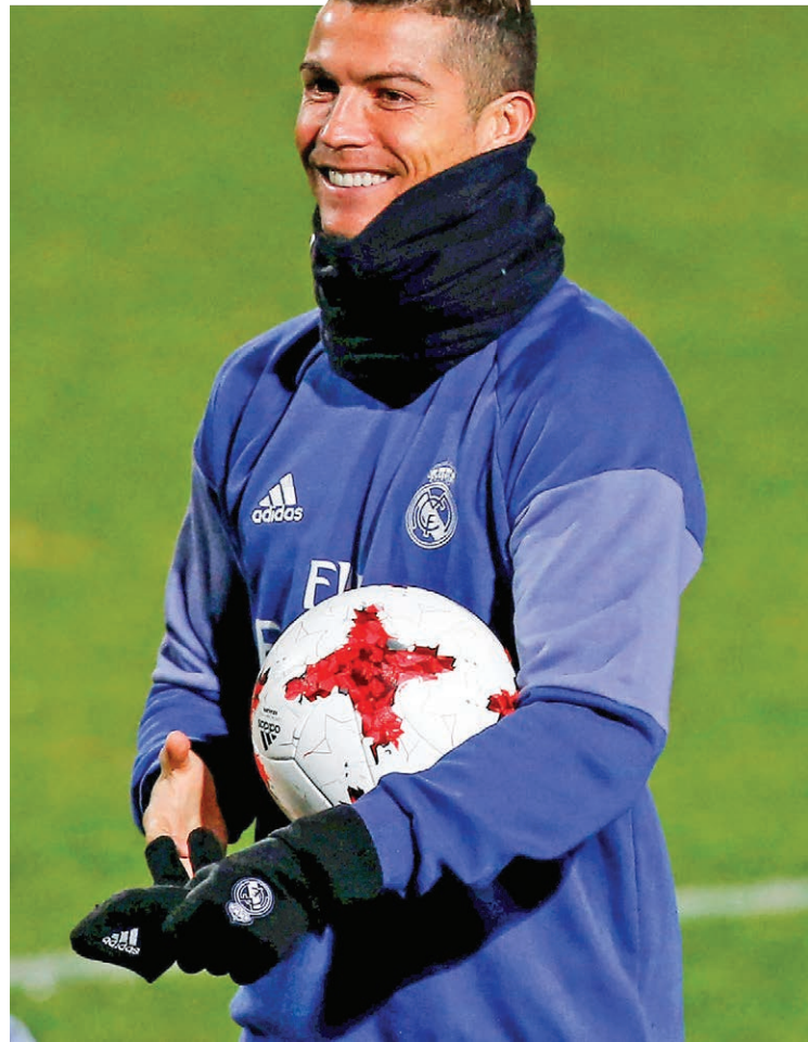
Real Madrid's Cristiano Ronaldo attends training ahead of FIFA Club World Cup Semi-Final match against Club America at Yokohama, Japan, on 13 December 2016.

It was, therefore, hard to see past 31-year-old Ronaldo for the winner of the Ballon d'Or, even if the trophy is designed to reward individual performance rather than team results.—Reuters