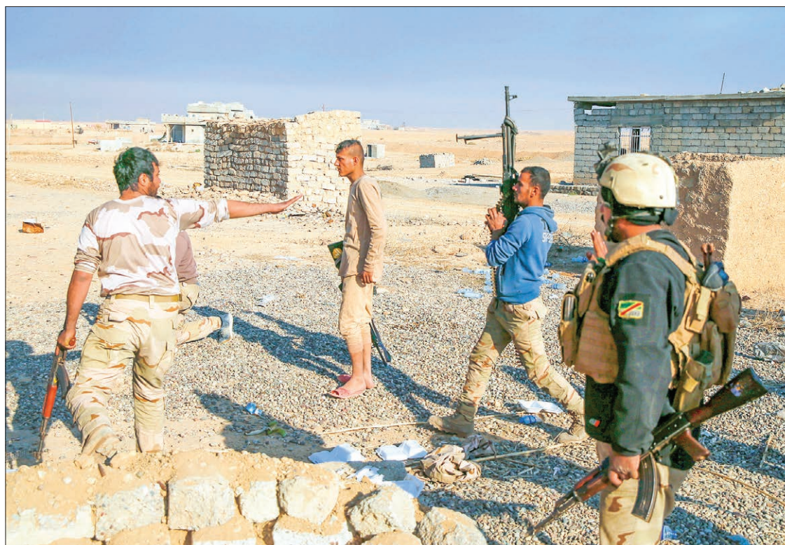
Members of the Iraqi Army take part during clashes with Islamic State militants at the south of Mosul, Iraq, on 12 December 2016.

"We are waiting for orders from the supreme commanders to start the offensive to defeat Daesh