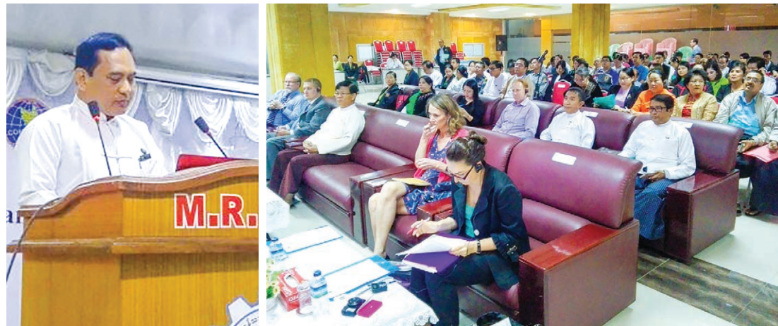
An explanatory session on GSP in progress.

JOINTLY organized by Trade Department under the Ministry of Commerce and the USAID-Funded Private Sector Development Activity, an explanation ceremony on the American Generalized System of Preferences (GSP) programmes for business entrepreneurs was held in the hall of Mandalay Region Chamber of Commerce and Industry (MRFCCI) in Mandalay on Monday.