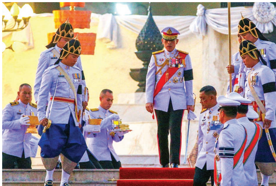
Thailand's new King Maha Vajiralongkorn Bodindradebayavarangkun leaves after paying his respects to a statue of King Rama VII on the occasion of Thai Constitution Day at the Parliament house in Bangkok, Thailand, on 10 December, 2016.

Prisoners jailed for insulting the monarchy and drug offences will be eligible, said Kobkiat Kasivivat, director general of the De-