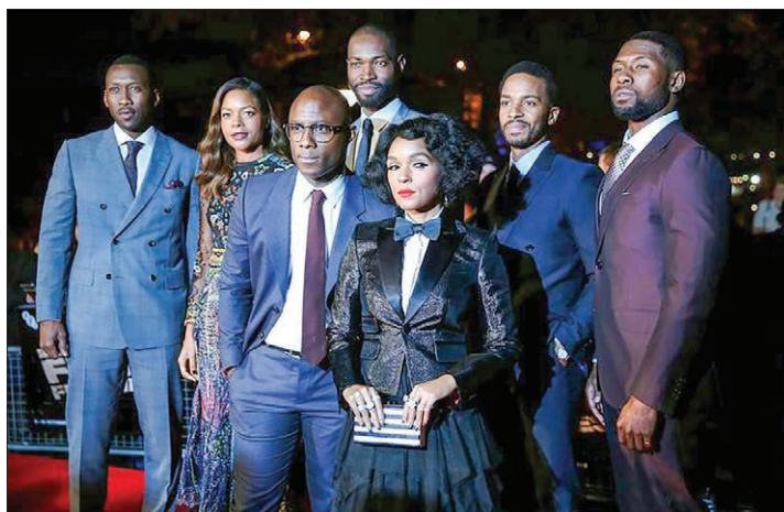
Cast members pose as they arrive for the gala screening of the film 'Moonlight', on the second night of the 60th British Film Institute (BFI) London Film Festival at Embankment Garden Cinema in London, Britain, on 6 October 2016.

"Moonlight" will face war drama "Hacksaw Ridge," Western