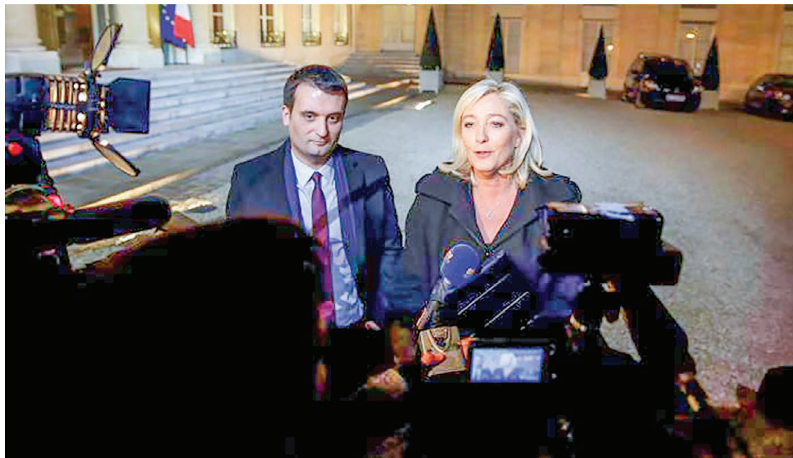
Marine Le Pen (R), France's far-right National Front political party leader and the party vice-president Florian Philippot speak to journalists at the Elysee Palace in Paris, France after a meeting with France's president, in this picture taken on 30 November 2012.

PARIS — France's far-right National Front leader Marine Le Pen, who wants to become president in next spring's elections, celebrated Britain's vote to leave the European Union.