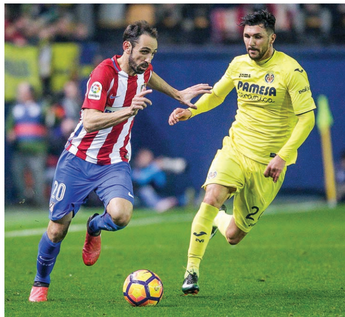
Atletico Madrid's Juanfran Torres (L) and Villarreal's Roberto Soriano in action at El Madrigal stadium, Villarreal, Spain, on 12 December 2016.

"We need to improve so we can get back towards the top of the table."—Reuters