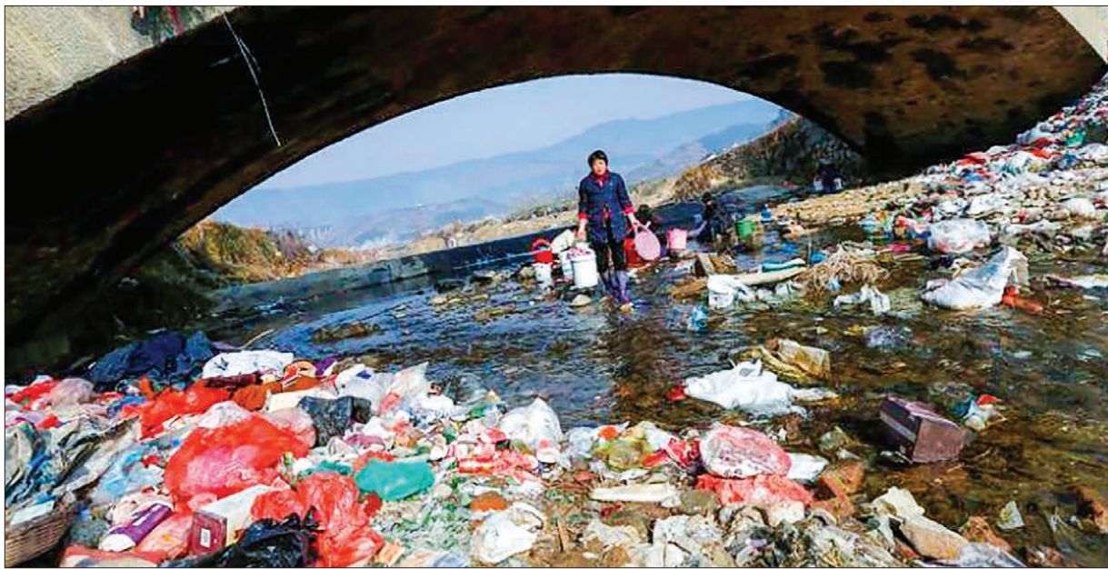
Villagers wash clothes in the garbage-filled Shenling River, in Yuexi county, Anhui Province, China, on 14 February 2015.

The UN Office for the Coordination of Humanitarian Affairs said in September that, according to figures based on government data, 133 people were killed in the floods and 395 were missing. — Reuters