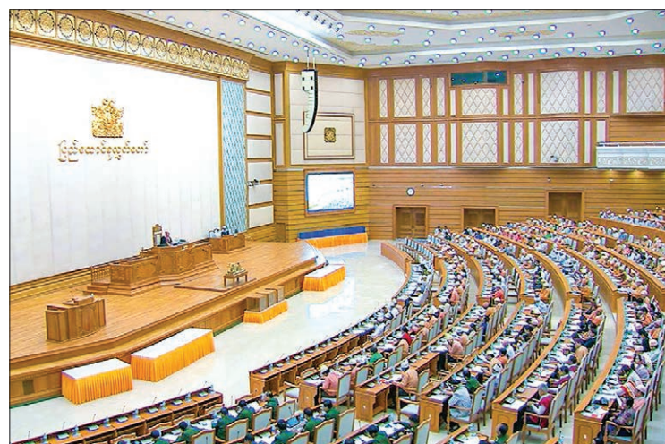
Pyidaungsu Hluttaw is convened in Nay Pyi Taw .

Other loans discussed at the session included 50 million euros from Poland for the Fire Brigade and US$56.8 million for agricultural development.— Myanmar News Agency