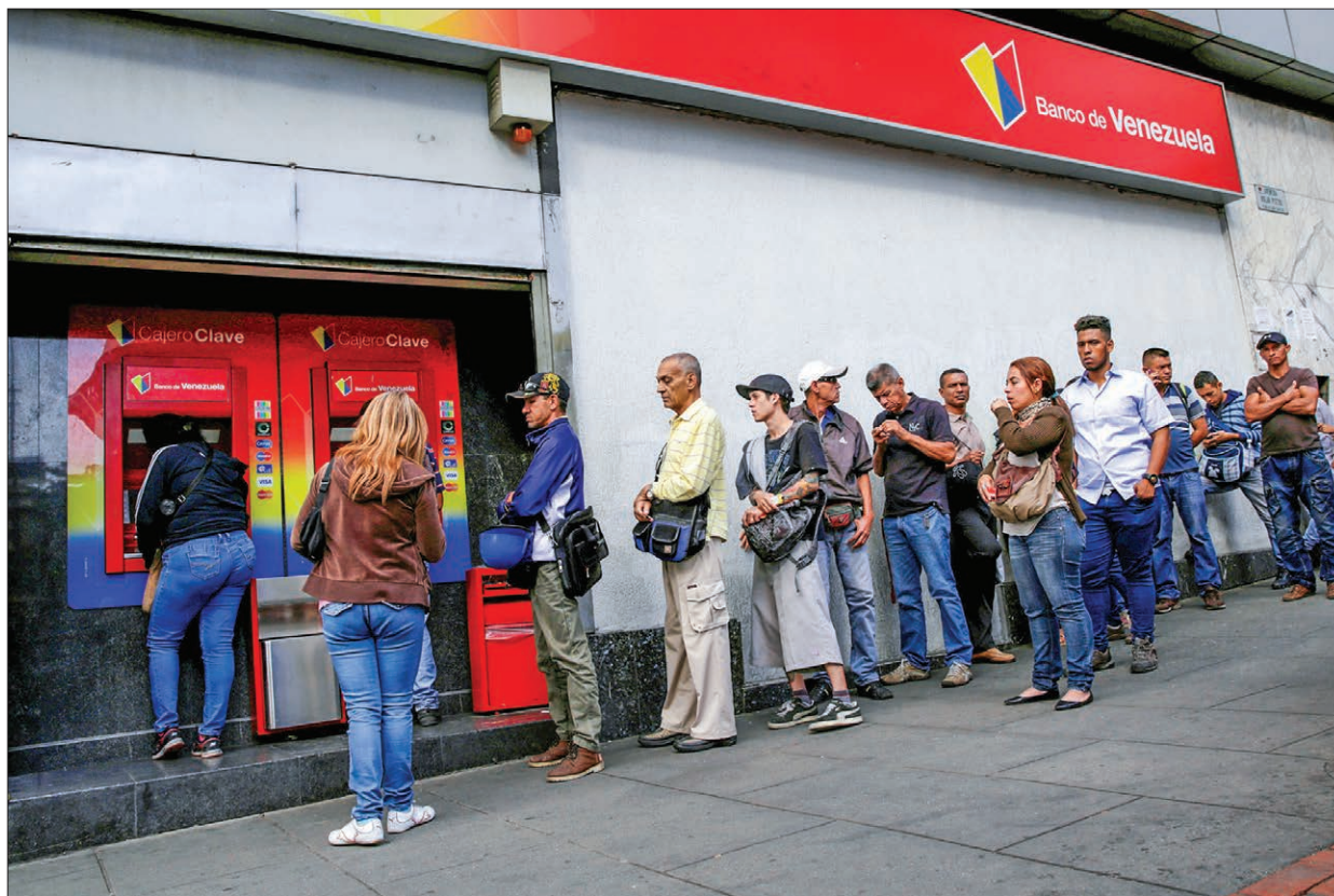
People line up to withdraw cash from an automated teller machine (ATM) outside a Banco de Venezuela branch in Caracas, Venezuela, on 12 December 2016.