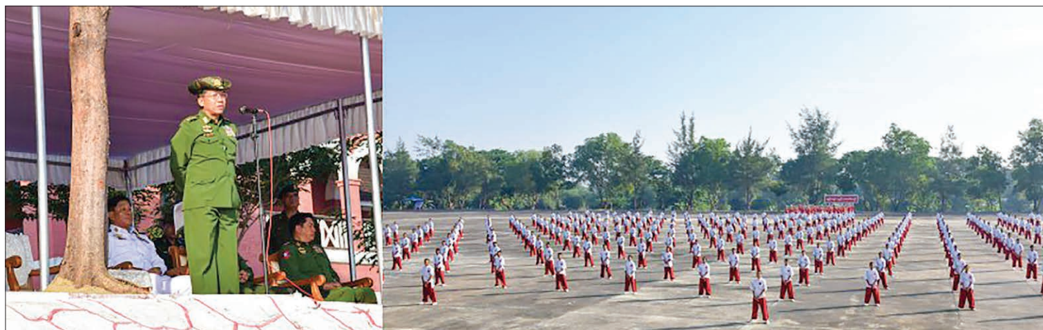
Senior General Min Aung Hlaing delivering a speech at the ceremony to demonstrate Myanmar Thaing Martial Arts.

The Senior General and party later visited the Military