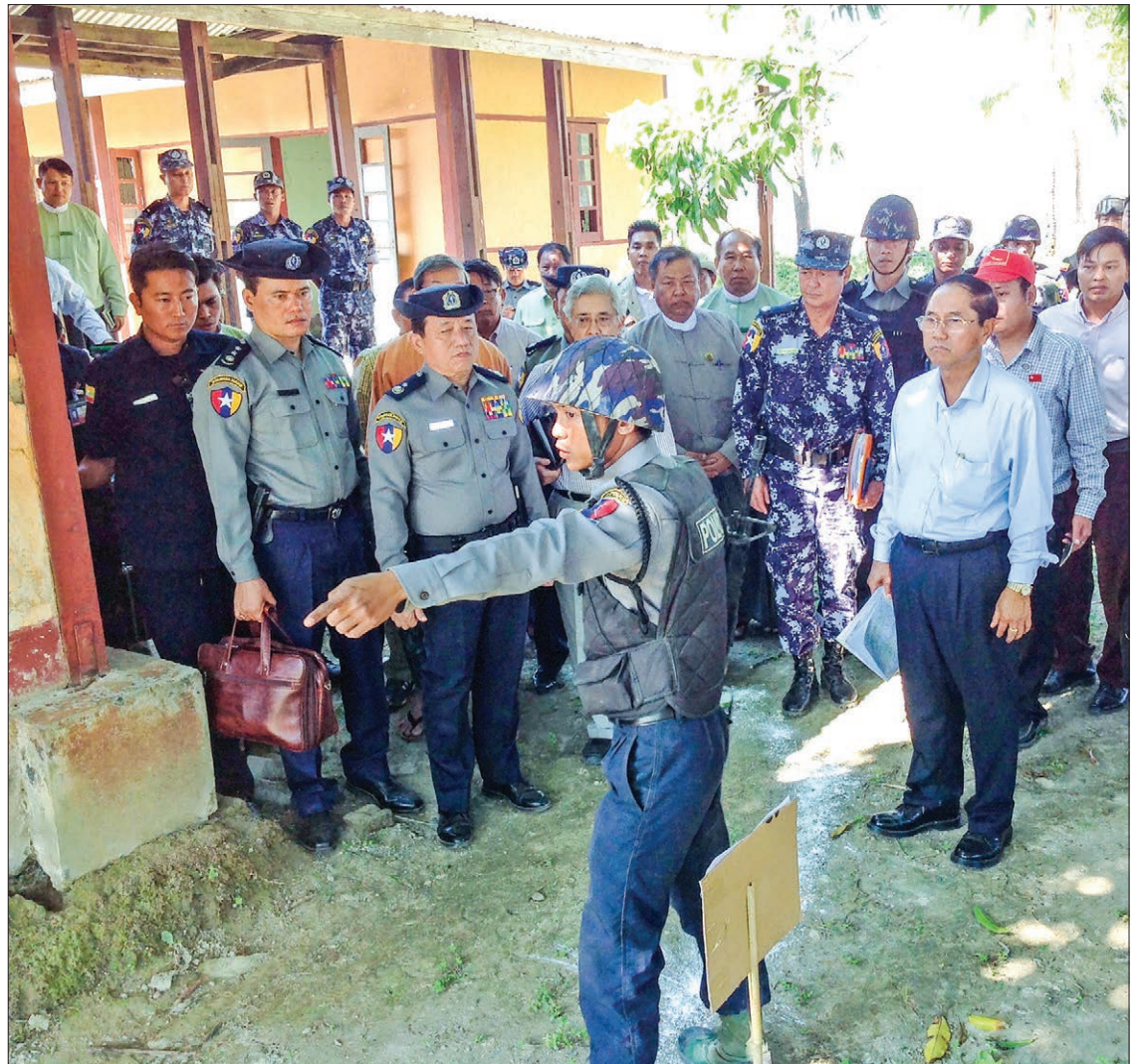
A police officer recounts the violent attack that happened at Koetankauk Outpost as the investigation commission led by its Chairman Vice President U Myint Swe inspects the outpost.

Afterward, the chairman and the commission left Sittway and arrived in Nay Pyi Taw in the evening.—Myanmar News Agency