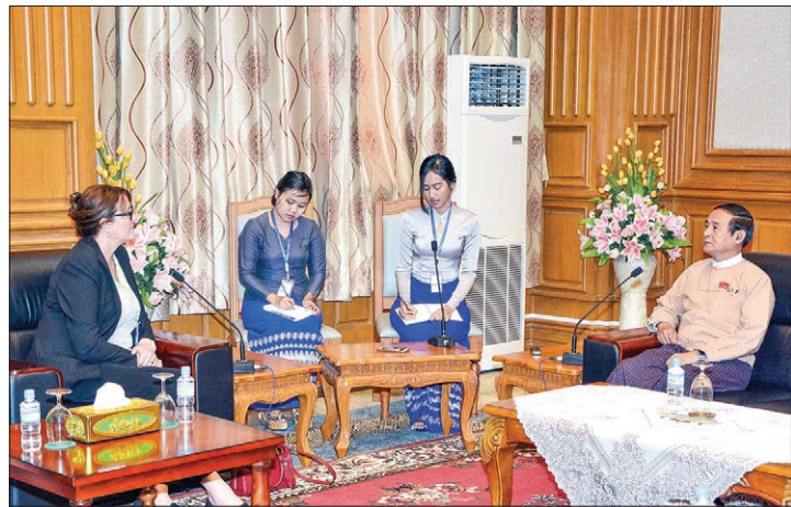
Speaker U Win Myint meets H.E. Ms. Karen MacArthur, the ambassador of Canada to Myanmar.

SPEAKER of the Pyithu Hluttaw U Win Myint received H.E. Ms. Karen MacArthur, the ambassador of Canada to Myanmar, at the Pyithu Hluttaw Hall in the Hluttaw Building in Nay Pyi Taw, at 2:00 pm, on 13 December 2016.