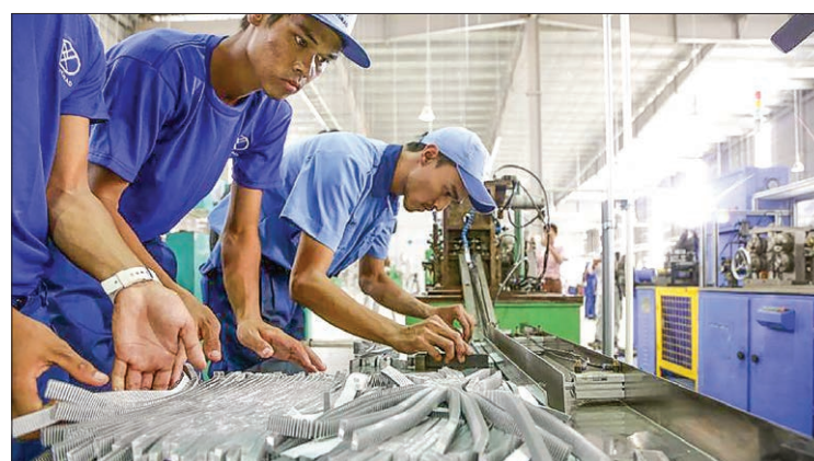
Factory workers work at the Thilawa Special Economic Zone outside Yangon, on 23 September 2015.

China is the main investor in Myanmar, followed by Singapore and Thailand. The manufacturing sector garners the largest investments. Additionally, heavy investments occur in the industrial businesses, transport and communications sectors.—Myitmakha News Agency