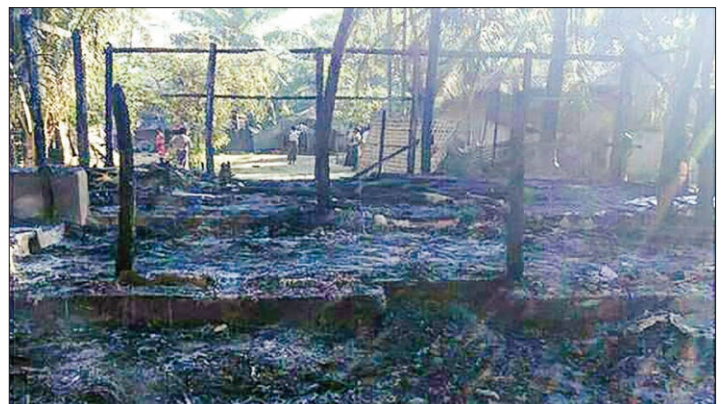
Two houses are totally destroyed by fire in Sabai Gone village in Maungtaw.

A fire broke out in Sabai Gone Village in Maungtaw Township on Monday night, destroying two homes.