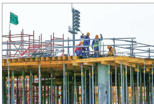
Migrant labourers work at a construction site at the Aspire Zone in Doha, Qatar, on 26 March 2016.

A statement from the Qatar government rejected the Amnesty report and said it was continuing to review and adapt its laws to "ensure our approach to reform is fit for purpose".