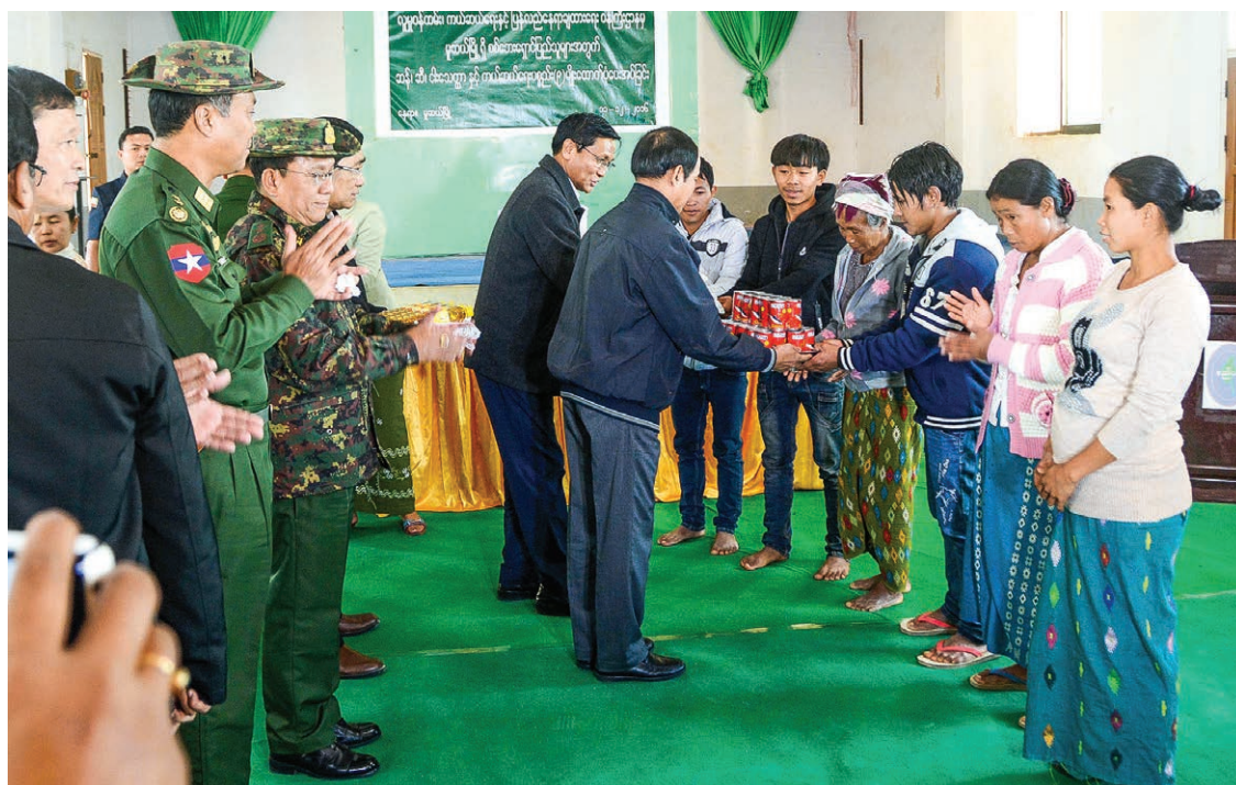
Vice President U Henry Van Thio and Speaker U Win Myint presents aid to IDPs in Muse.

He also said that the government is committed to ending the ethnic armed conflicts that have dragged on in the country for more than 60 years. The vice president pledged to solve the issue at the 21st Century Panglong