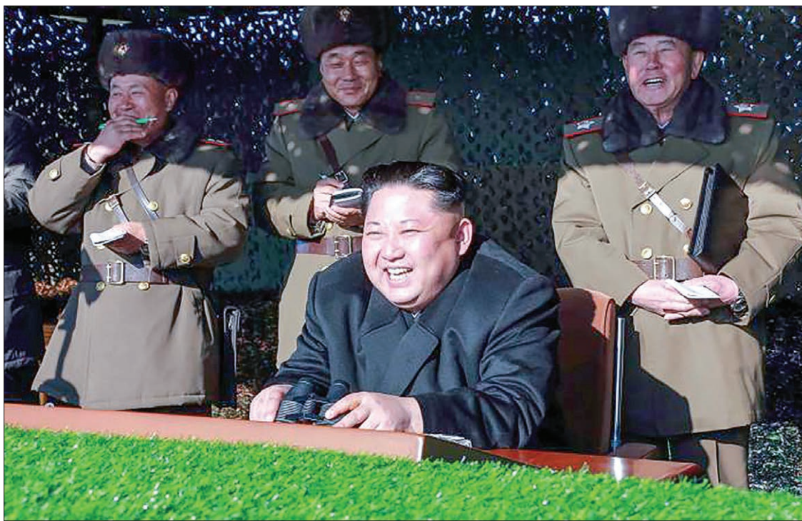
North Korean leader Kim Jong Un guides the combat drill of the service personnel of the special operation battalion of KPA Unit 525 in this undated photo released by North Korea's Korean Central News Agency (KCNA) in Pyongyang on 11 December, 2016.

The North's tests have brought tighter UN Security Council sanctions but no indication North Korea and its young leader Kim are willing to compromise on its nuclear and mis-