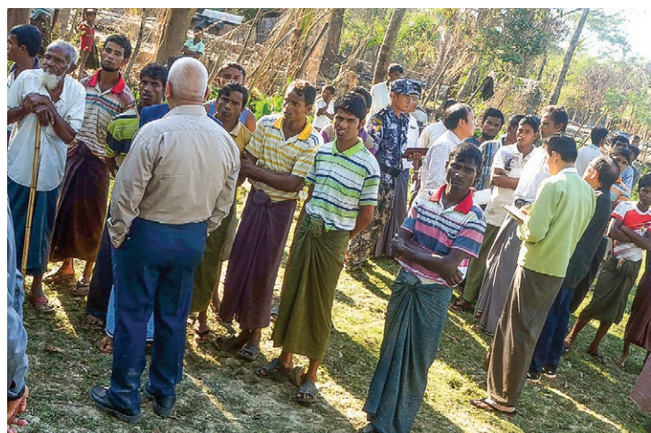
Investigation Commission on Rakhine State meeting with Muslims at Pyaug Paik Village in Maungtown Township.

The commission is a separate entity from the Rakhine State Advisory Commission, which is headed by former UN Secretary-General Kofi Annan.— Myanmar News Agency