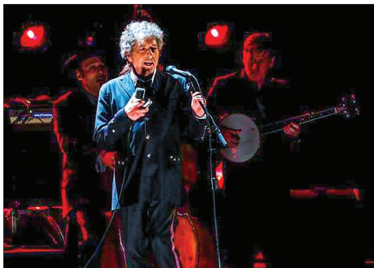
Singer Bob Dylan performs during a segment honoring Director Martin Scorsese, recipient of the Music+ Film Award, at the 17th Annual Critics' Choice Movie Awards in Los Angeles on 12 January, 2012.