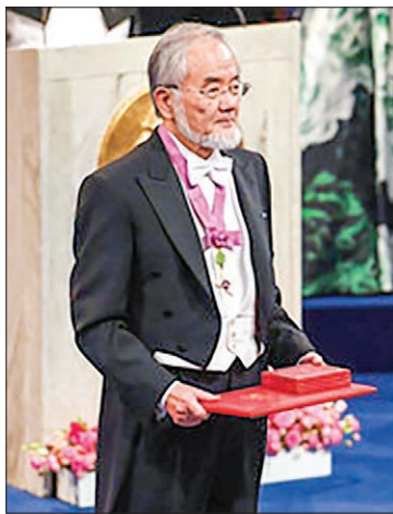
Japanese scientist Yoshinori Ohsumi receives the Nobel Prize in physiology or medicine for his research on cell recycling, at an award ceremony in Stockholm on 10 December, 2016.

Autophagy, Greek for "self-eating," has been known for over 50 years but its fundamen-