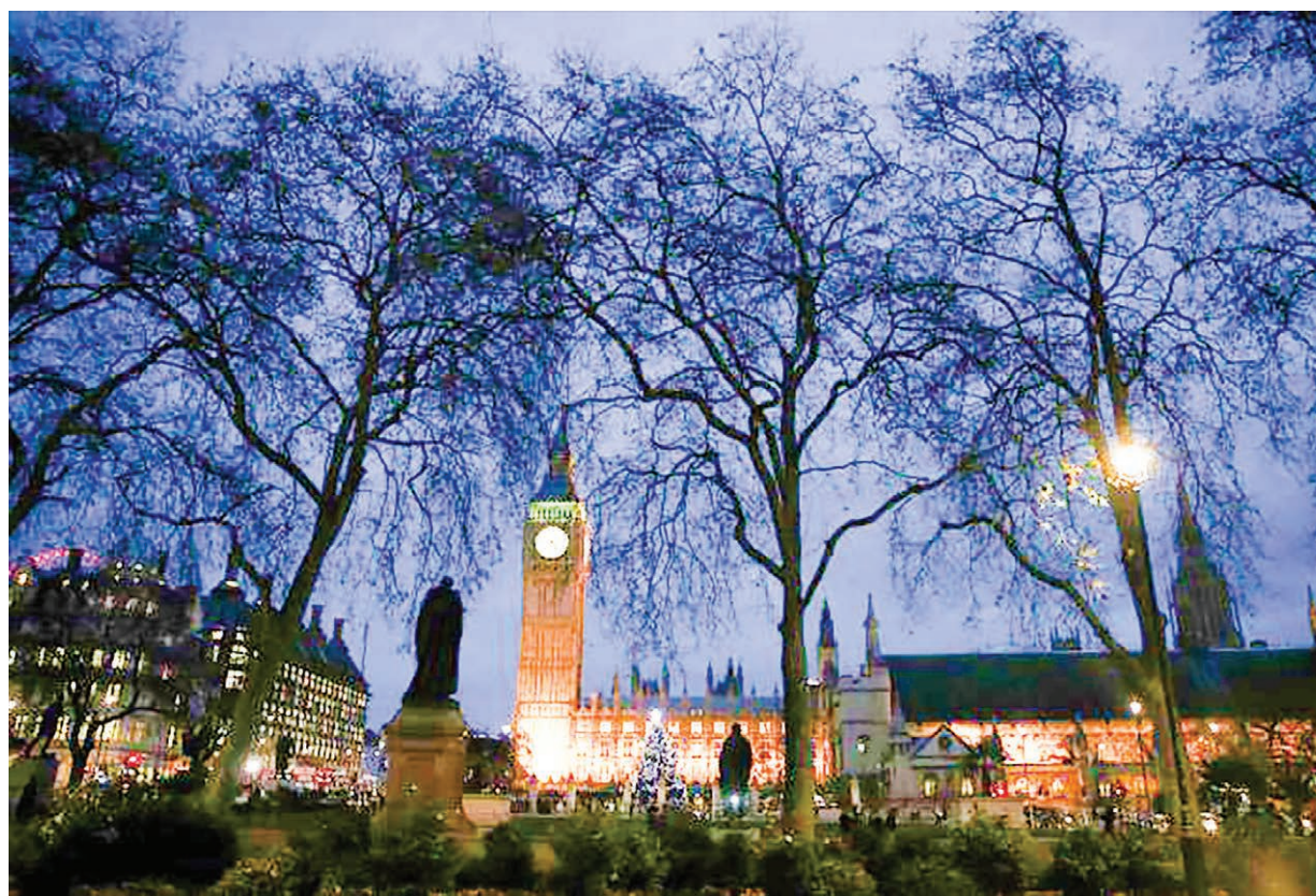
Dusk falls over Parliament Square outside the Supreme Court after the third day of the challenge against a court ruling that Theresa May's government requires parliamentary approval to start the process of leaving the European Union, in central London, Britain, on 7 December 2016.

However the High Court ruled last month that Article 50 cannot be triggered without parliament's