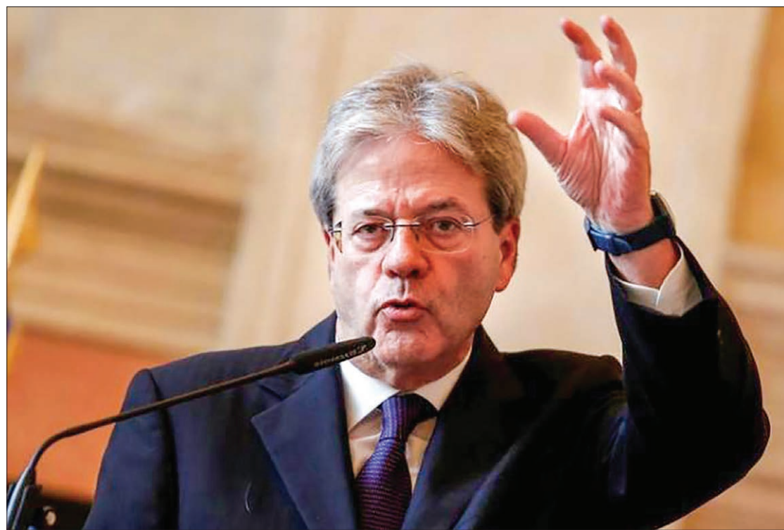
Italian Foreign Minister Paolo Gentiloni gestures as he talks during a joint press conference with Russian Foreign Minister Sergei Lavrov in Rome, Italy on 2 December 2016.

Also on Saturday, Republicans Mike Johnson, a state representative, and Clay Higgins prevailed in Congressional run-offs, replacing representatives who made unsuccessful bids for the Senate seat won by Kennedy. —Reuters