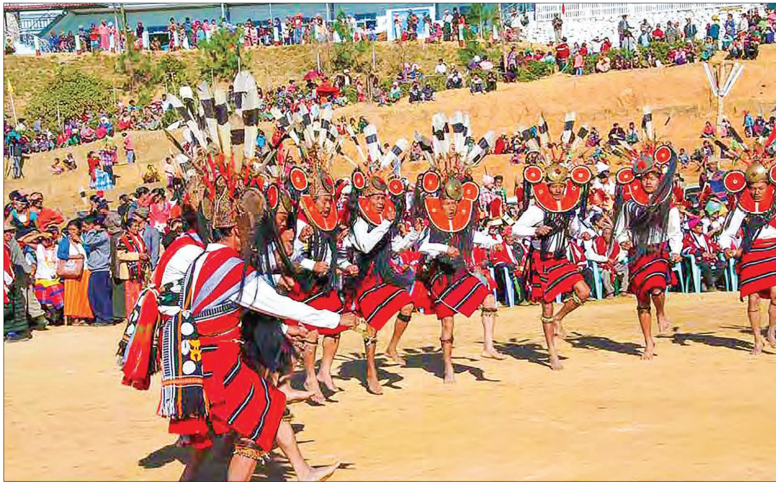
Naga people dancing at the traditional New Year festival held last year in Lahe.

The New Year Festival was held in Nanyun in 2014, Leishi in 2015 and Lahe in 2016.