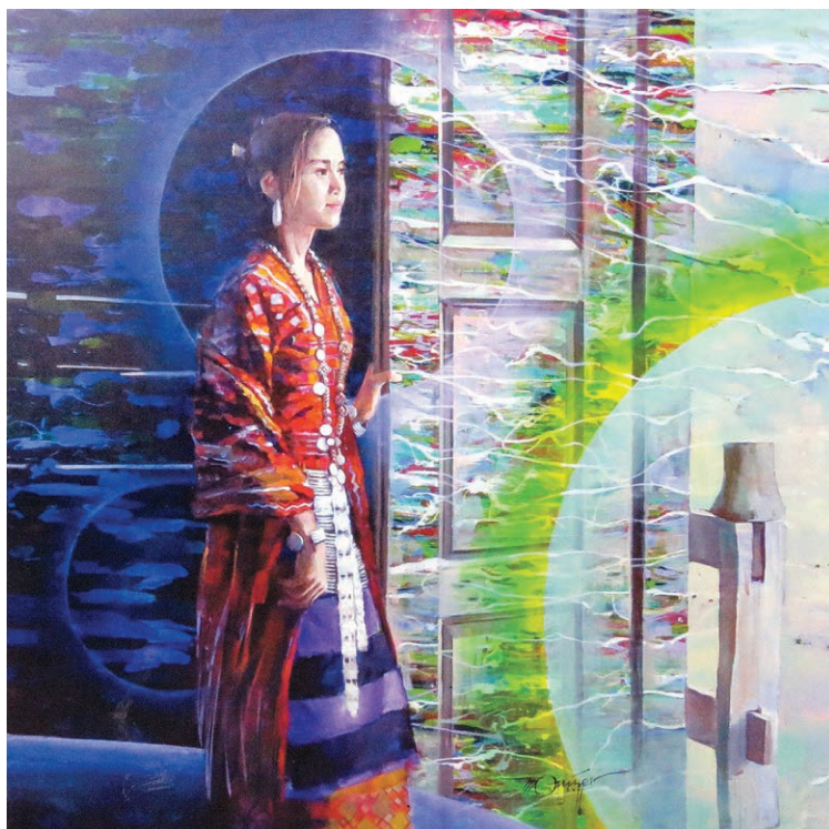
Chin Lady by Mon Thet.