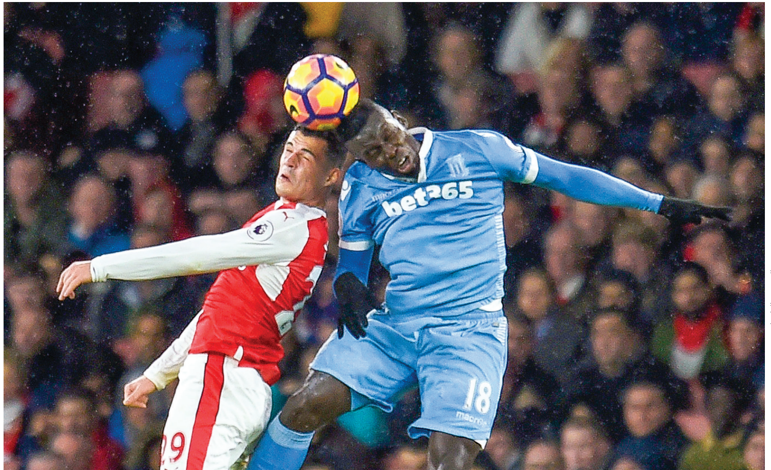
Arsenal's Granit Xhaka in action with Stoke City's Mame Biram Diouf during the match of the Premier League between Arsenal v Stoke City at the Emirates Stadium on 10 December, 2016.

"I am very pleased for Jamie. When he finished I said 'Oh, wel-