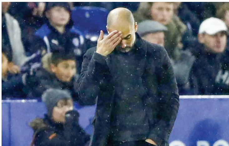
Manchester City manager Pep Guardiola looks dejected Action during the match between Leicester City and Manchester City at the King Power Stadium on 10 December, 2016.

He has always said he would not dilute the way he goes about playing in the Premier League but asked if he would compromise on his philosophy, he said: "I have to improve to solve that, yeah, that's true." There was also an intriguing exchange in light of City's fragility about his approach to on-field duels. "I'm not a coach for the tackles, so I don't train the tackles," he said.—Reuters