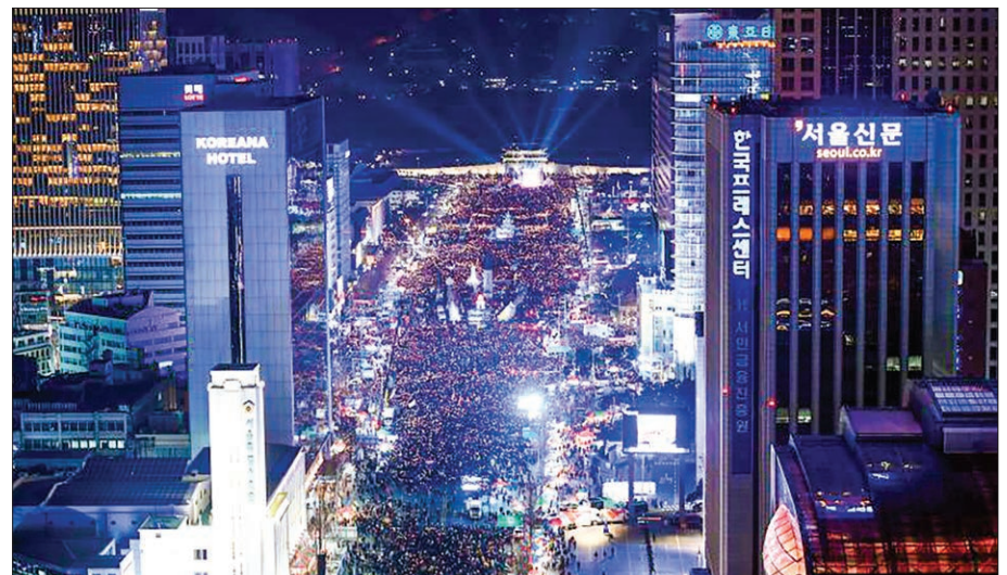
Protesters hold candles during a rally against South Korean President Park Geun-Hye in central Seoul, South Korea, on 10 December 2016.