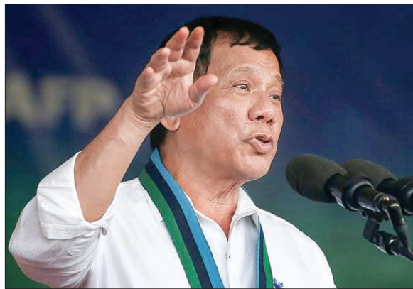
Philippine President Rodrigo Duterte speaks during the change of command for the new Armed Forces chief at a military camp in Quezon city, Metro Manila, on 7 December, 2016.

MANILA — Roman Catholic churches in Manila on Sunday read a prayer against Philippine President Rodrigo Duterte's plans to re-impose the death penalty on heinous crimes, including drug-related offences.