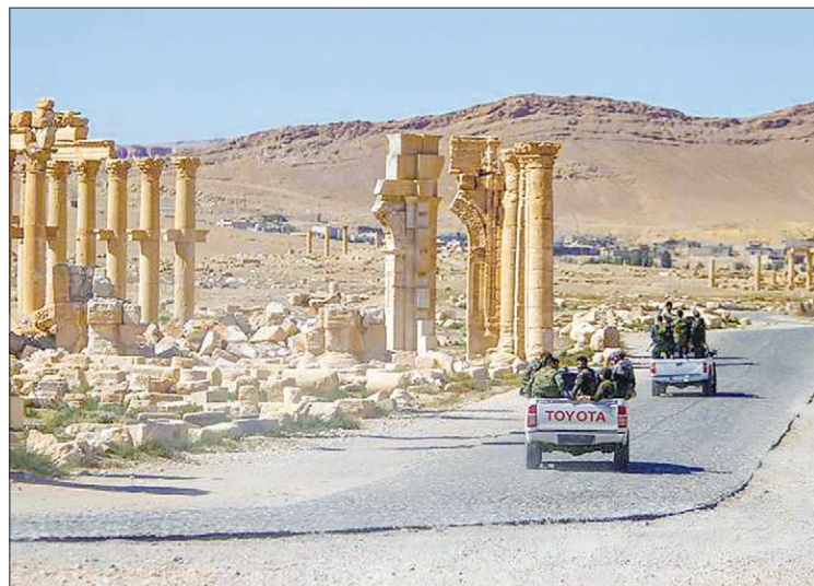
FILE PHOTO Syrian army soldiers drive past the Arch of Triumph in the historic city of Palmyra, in Homs Governorate, Syria in this 1 April 2016.

Turkey faces multiple security threats. In addition to the Kurdish insurgency, it is also battling Islamic State as a member of the US-led coalition against the Sunni hardline group. Less than a week ago, Islamic State urged its supporters to target Turkey's "security, military, economic and media establishment".—Reuters