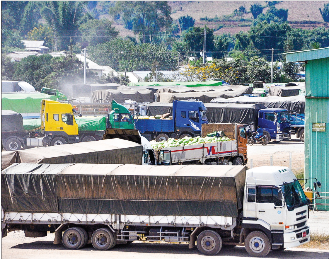
Fruit trading at Muse resumes on 11th December, with around 200 truck-loads of watermelon and 50 to 70 truckloads of muskmelons entering Muse.