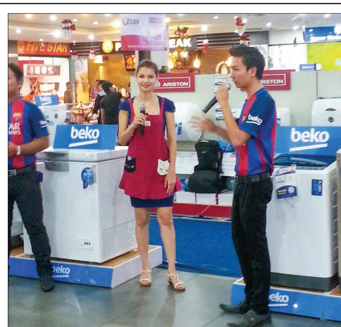
Thanda Hlaing, one of Myanmar famous models and public figures, introduces Europe's No. 1 home appliances of Beko and Ariston at the sale promotion at the Ocean Centre (Shwegongdine) on 11 December.

"For decades, Chinese movies have been very popular among Cambodian audience," he told the ceremony with about 500 spectators. "A large number of Chinese films have been screened at cinemas and television channels across Cambodia." —Xinhua