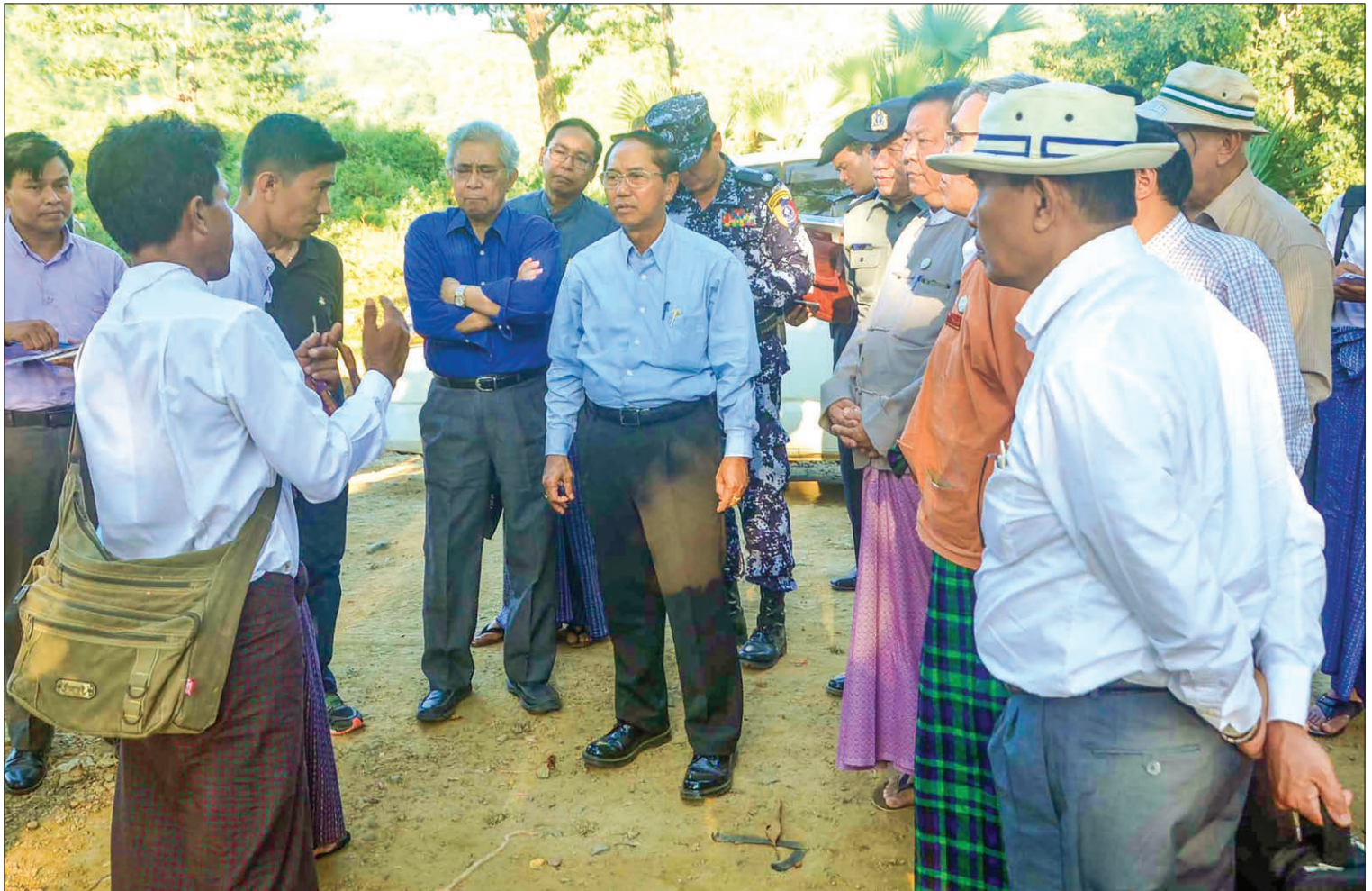
Vice President U Myint Swe, centre, Chairman of the Rakhine State Commission, and members of the commission interview eyewitnesses to the October attacks in Maungtaw as they visit Pyaungpyaik Village in Maungtaw Township.

The commission later visited Pwintphyuchaung Village, where the majority of residents are Muslim, and spoke with residents who described in detail the firing