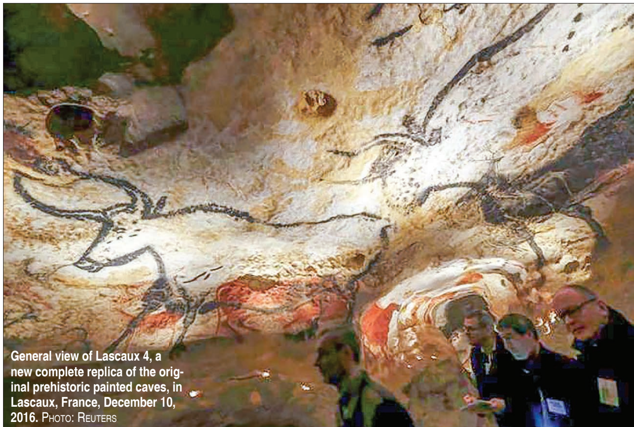
General view of Lascaux 4, a new complete replica of the original prehistoric painted caves, in Lascaux, France, December 10, 2016.

tant archeological finds of the 20th century. The caves were closed to the public in 1963 in order to preserve the paintings. There have been several earlier replicas built, but smaller and with less detail. The new replica, which cost 66 million euros ($70 million), is housed in a new building at the foot of the hill in the Dordogne region where the original paintings are. Authorities expect some 400,000 visitors per year. —Reuters