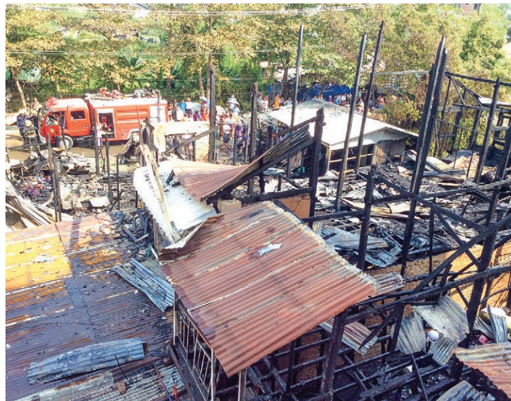
The houses destroyed by fire.

A fire broke out in South Okkalapa Township yesterday morning and burnt down five houses.