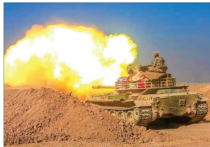
Members of the Iraqi Army fire towards Islamic State militant positions at the south of Mosul, Iraq on 10 December, 2016.

The Pentagon said Carter would meet Iraqi Prime Minister Haider al-Abadi, the president of the Kurdish region Massoud Barzani and the commander of the US-led coalition supporting