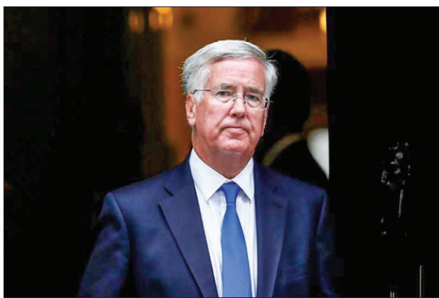
Britain's Secretary of State for Defence Michael Fallon leaves after attending a cabinet meeting at Number 10 Downing Street in London, Britain on 8 September, 2015.

LONDON — Britain's defence minister said on Sunday he was ready to work with his new US counterpart but that Western nations could not treat Russia as an equal partner as Moscow was a strategic competitor.