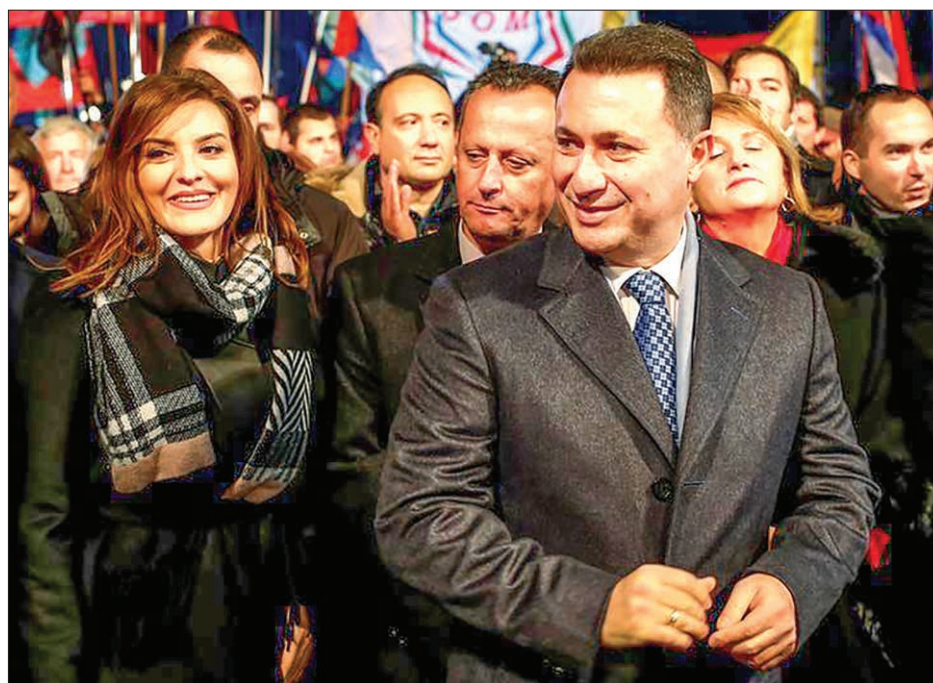
Leader of Macedonian ruling party VMRO-DPMNE and former Prime Minister Nikola Gruevski and his wife Borkica greet supporters during an election campaign rally in Ohrid, Macedonia, on 21 November, 2016.

The polls close at 1800 GMT. Preliminary results are expected after 2000 GMT, and a final result on Tuesday.—Reuters