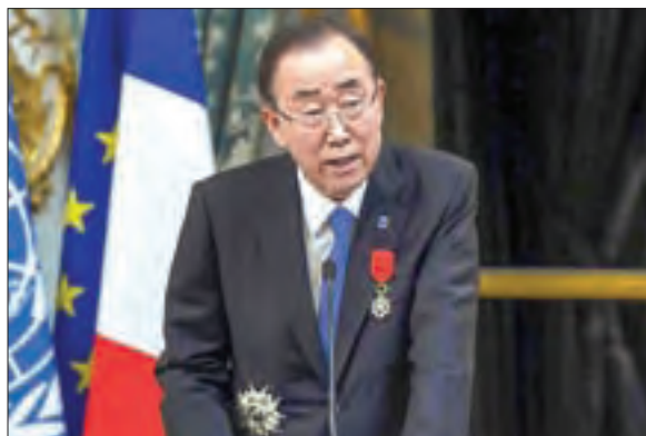
UN Secretary-General Ban Ki-moon delivers a speech after being awarded with the Legion of Honour (Legion d'Honneur) by the French president at the Elysee Palace in Paris, France, on 17 November 2016.

"It doesn't make any sense at all now for Secretary-General Ban Ki-moon to join the Saenuri Party. Unless he is stupid, he would never join Saenuri,