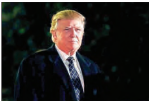
US President-elect Donald Trump looks towards the media as he arrives at a costume party at the home of hedge fund billionaire and campaign donor Robert Mercer in New York, US, on 3 December 2016.