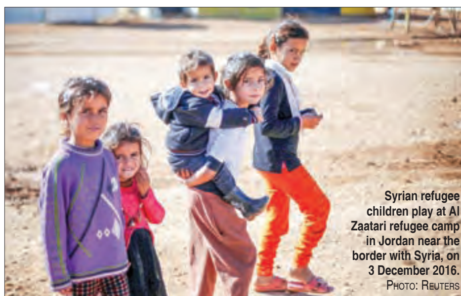
Syrian refugee children play at Al Zaatari refugee camp in Jordan near the border with Syria, on 3 December 2016.

"This is a reflection of a state of humanitarian need in the world not witnessed since the Second World War," he told a news conference, adding that 80 per cent of the needs stemmed from man-made conflicts, such as those in Syria, Iraq, Yemen, Nigeria and South Sudan. —Reuters