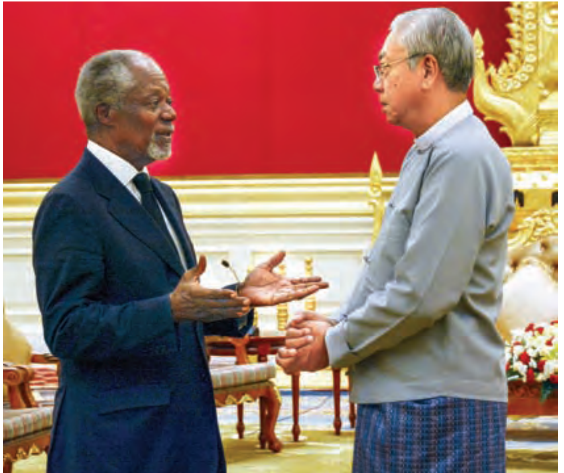
President U Htin Kyaw welcomes former UN Secretary-General Mr Kofi Annan, chairman of the Rakhine State Advisory Commission, at the Presidential Palace in Nay Pyi Taw yesterday.

Also present at the meeting were Union Minister for the Office of the State Counsellor, Minister of State for Foreign Affairs U Kyaw Tin and officials.—Myanmar News Agency