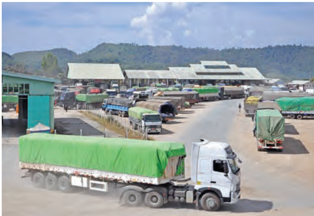
Trucks seen at 105-mile trade zone Muse, Northern Shan State.

The association aims to export high-value bamboo products to foreign countries manufacturing ready-to-install bamboo furniture. If year-old bamboo plants are systematically cut, there is not a risk of bamboo extinction, said U Kyaw Win.— Myitmakha News Agency