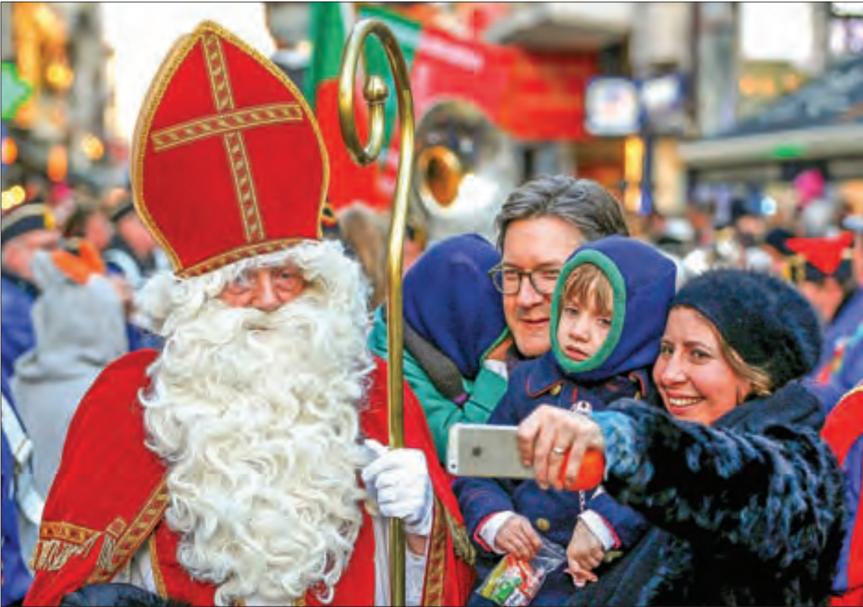
Saint Nicholas poses with a family during a traditional parade in central Brussels, Belgium on 3 December, 2016.

BRUSSELS — Children gathered with parents in Brussels’s medieval main square on Saturday to await the arrival of St. Nicholas, a pre-Christmas tradition in Belgium, the Netherlands and other parts of northern Europe held in honour of the legendary gift-giver. Every year in early December parades are held in towns across Belgium and the Netherlands, at which thousands of children cheer St. Nicholas, who sports a bushy white beard and carries a staff, as