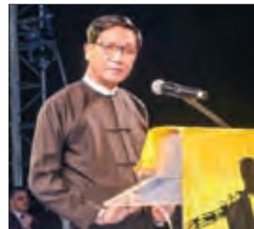
Vice President U Henry Van Thio.

"We want to thank all who helped to successfully observe the ceremony in every way. It is the Myanmar-based French Embassy that organised the 55th anniversary of the France-Myanmar