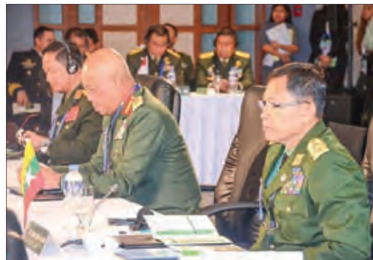
Vice Senior General Soe Win seen attending 17 th ASEAN Chiefs of Army Multilateral Meeting.

Vice Senior General Soe Win and his wife attended a dinner hosted by Commanding General of the Philippine Army Lt. Gen. Eduardo M. Ano and wife in the Luzon Hall of the Sofitel Hotel.— Myanmar News Agency