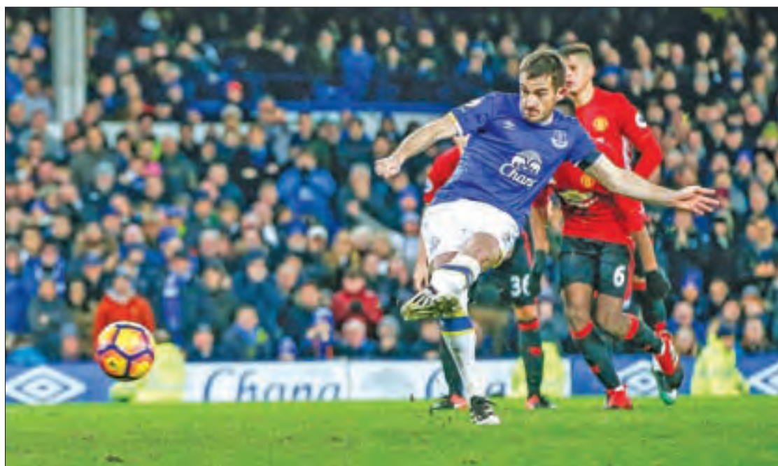
Everton's Leighton Baines scores their first goal from the penalty spot at Goodison Park on 4 December 2016.

Although Bournemouth had strong claims for a penalty turned down as Roberto Firmino challenged Nathan Ake, they did not threaten until the introduction of Scotland Under-21 international Ryan Fraser 10 minutes