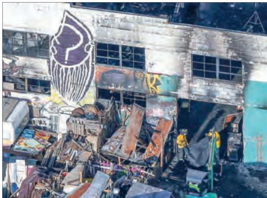
Firefighters work inside the burned warehouse following the fatal fire in the Fruitvale district of Oakland, California, US on 4 December 2016.

Mayor Libby Schaaf said the Alameda County District Attorney's Office activated its criminal investigation team at the fire scene. A representative of the prosecutor's office is monitoring the recovery process, she said, adding she was not authorised to say if a criminal probe was under way.