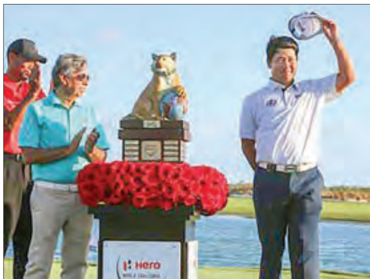
Hideki Matsuyama (R) of Japan acknowledges the spectators at Albany Golf Club in the Bahamas on 4 December, 2016, after winning the Hero World Challenge. Matsuyama, who finished with a total score of 18-under-par 270, won the tournament for the first time.

"I'm determined to win and am doing my very best, and that's maybe why the results are starting to show. My goal is to win the Masters, and I hope to win as many events as possible until then," Matsuyama said of the prestigious golf tournament held every spring.— Kyodo News