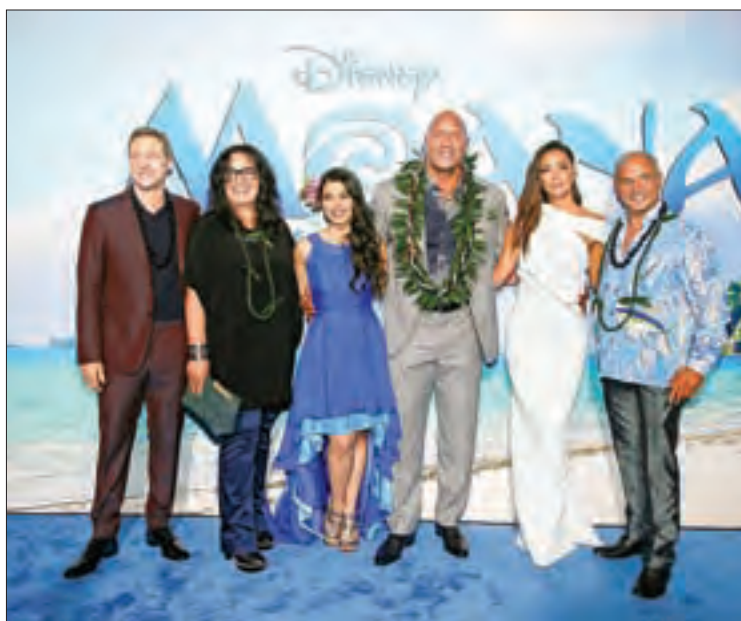
Alan Tudyk, Rachel House, Auli'i Cravalho, Dwayne Johnson, Nicole Scherzinger and Temuera Morrison.

"Incarnate" centres on a scientist (Aaron Eckhart) who enters the mind of an 11-year-old boy to rid him of an evil spirit. The horror film is the latest offering from BH Tilt, which is trying to contain distribution costs by orchestrating more targeted marketing campaigns for certain theatrical releases. "Incarnate" used digital advertising to try to better reach