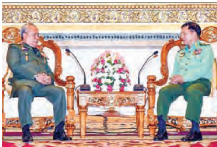
Senior General Min Aung Hlaing receiveing Chief of Malaysia Armed Forces.