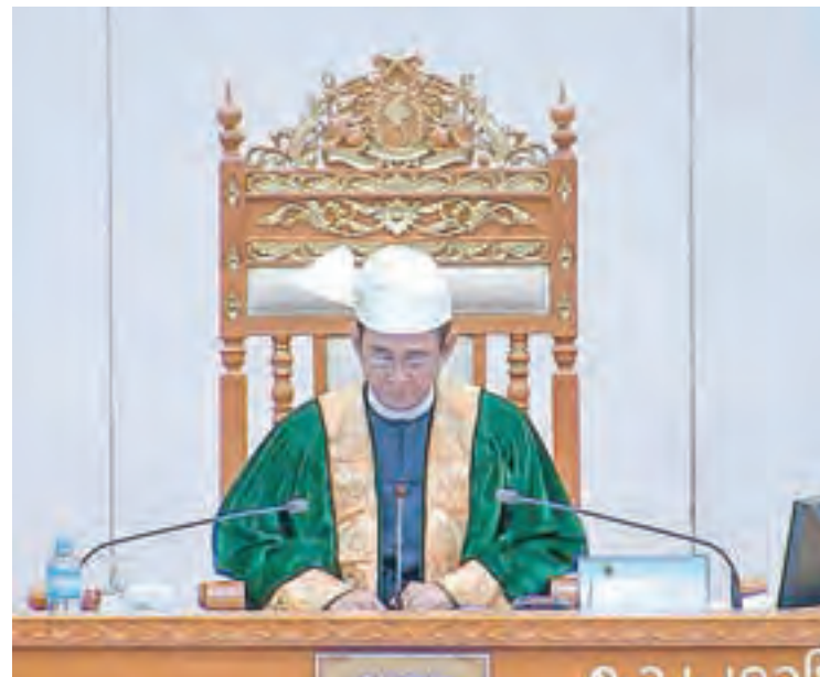
Speaker of Pyithu Hluttaw U Win Myint.

According to the clarification of the union minister at the parliamentary meeting yesterday, the Ministry of Sports and Health would seek budget allocations in the coming fiscal year for renovation of the Honan Station Hospital and construction of staff quarters for the staff of the station hospital in Maukme Township. — Myanmar News Agency