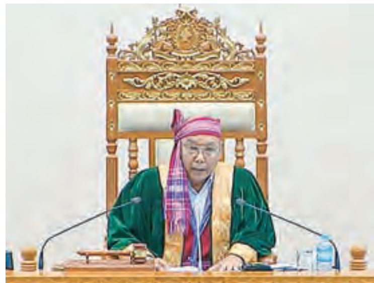
Speaker of Amyotha Hluttaw Mahn Win Khaing Than.

The deputy minister went on to say, "With a view to the emergence of qualified doctors who were actually interested in medicine and who could serve the duty in their respective regions, less than 3 per cent of the successful candidates from 6 self-administered zones — Naga, Danu, Paoh, Palaung, Kokant and Wa — were granted to the Institute of Medicine with their admission marks limited lower than the minimum admission marks in 2012-2013 academic year. Under that programme, from 2012 to 2015, 179