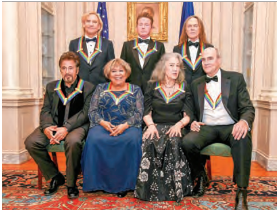
2016 Kennedy Centre Honorees pose for a group photo after a gala dinner at the US State Department, in Washington, US, on 3 December 2016. From L-R: (seated) actor Al Pacino, singer Mavis Staples, pianist Martha Argerich, singer-songwriter James Taylor; (standing) members of rock band Eagles, Joe Walsh, Don Henley and Timothy B. Schmit.

Still, the evening belonged to the honorees and the performers who feted them. Singers Darius Rucker, Sheryl Crow, and Garth Brooks sent up Taylor, who is known for hits such as "Sweet