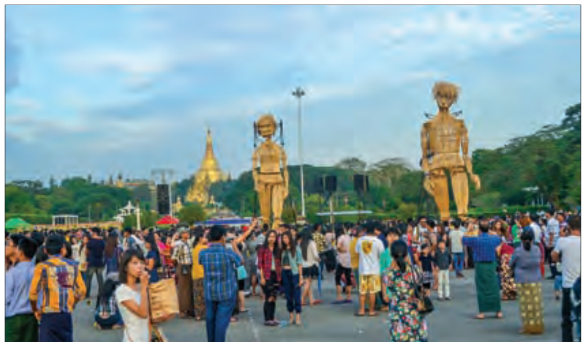
People visit the Mingalarbar Culture Festival in Yangon.

The ceremony came to a close after entertainment by vocalists from the two countries with musical accompaniment and fireworks.— Myanmar News Agency