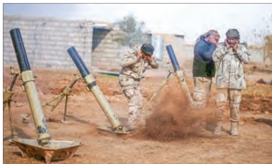
Iraqi soldiers fire mortar shells towards Islamic State positions, in Shayyallah al-Imam near Mosul, Iraq on 5 December 2016.

retreating in the face of a seven-week military assault on their Mosul stronghold have hit back in the past few days, exploiting cloudy skies which hampered US-led air support and highlighting the fragile army gains.