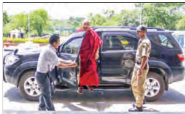
Karmapa Lama (C) alights from a car before his departure to Mumbai, at the airport on the outskirts of the northern Indian hilltown of Dharamsala in 2011.

BEIJING — China called on India on Monday not to do anything to complicate their border dispute after a senior exiled Tibetan religious