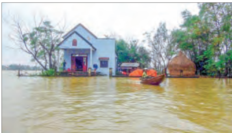
A man paddles a boat near a partially submerged house after a flood in Viet Nam's central Quang Nam Province, on 4 December 2016.

Printed and published at the Global New Light of Myanmar Printing Factory at No.150, Nga Htat Kyee Pagoda Road, Bahan Township, Yangon, by the Global New Light of Myanmar Daily under Printing Permit No. 00510 and Publishing Permit No. 00629.