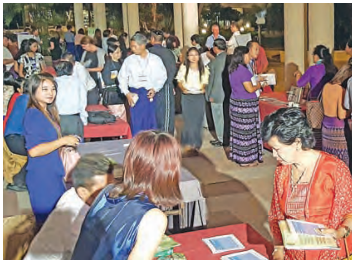
Product & Package Innovation Competition (PPIC) Awards 2016 in progress with visitors observing.