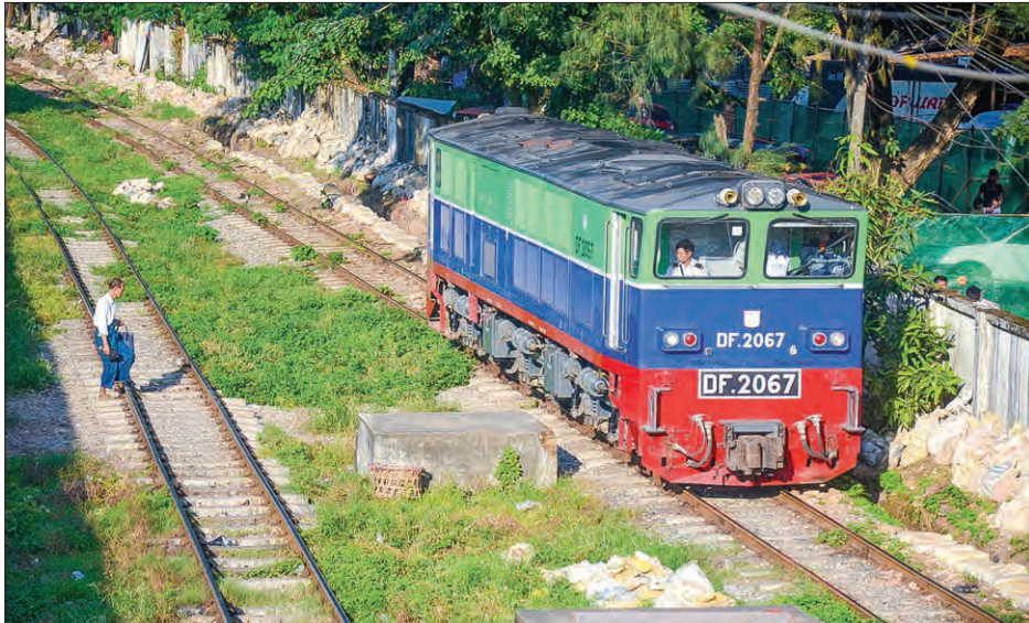
A locomotive running on a railway-track bieng seen.