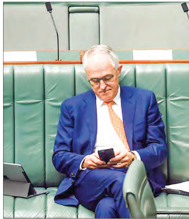
Australian Prime Minister Malcolm Turnbull uses his phone in the House of Representatives at Parliament House in Canberra, on 14 September 2016.

"It's a very good arrangement and we are confident that we'll continue