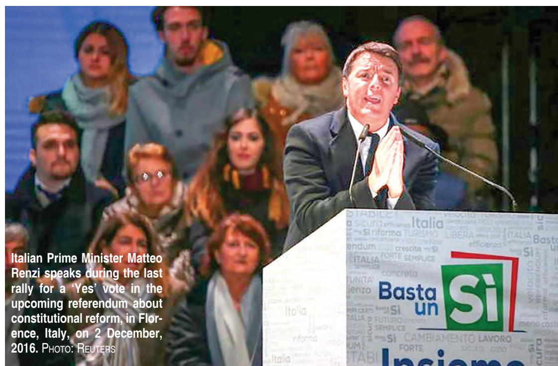
Italian Prime Minister Matteo Renzi speaks during the last rally for a 'Yes' vote in the upcoming referendum about constitutional reform, in Florence, Italy, on 2 December, 2016.

ROME — Italians started to vote on Sunday in a referendum on constitutional reform which will decide the political future of Prime Minister Matteo Renzi, who has promised to resign if he loses.