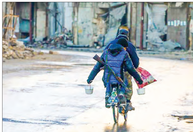
A rebel fighter carries food while riding a bicycle and carrying his weapon on his back in rebel-held besieged old Aleppo, Syria, on 2 December 2016.

In the landmark deal that Iran inked last year in Vienna with Russia, China, France, Germany, Britain, and the United States, it accepted long-term restrictions on its nuclear programme in return for an end to crippling banking and economic sanctions by the international community.—Kyodo News