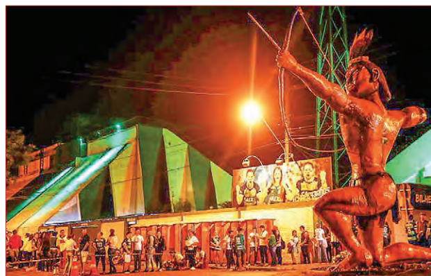
Fans of the Brazilian soccer team Chapecoense wait in front of the Arena Condá stadium to receive the bodies of the victims who died in the plane crash in Colombia, in Chapeco, Brazil, on 3 December 2016.

CHAPECO, (Brazil) — A downpour drenched thousands of mourners in this Brazilian city on Saturday as they grieved over 50 caskets flown overnight to the stadium of the local Chapecoense soccer team, which was all but wiped out in an air crash Monday in Colombia.