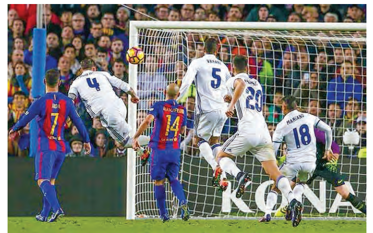
Real Madrid's Sergio Ramos scores a goal during the 'Clasico' at Nou Camp Stadium, Barcelona, on 3 December 2016.

Leganes, who are 15th, drew 0-0 with fifth-placed Villarreal in the day's other match. —Reuters