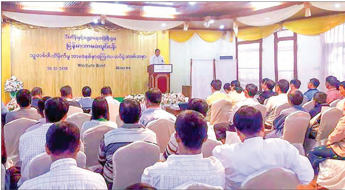
The third party insurance compensation presentation ceremony in progress.

As I mentioned above, it is just a few handful of RIT/YTU alumni that are enterprising enough to more than deserve the title of 'World Class Achievements'. Many more could be added. We and our country are proud of their achievements. They and many other alumni is the role model for our students of the Technological Educational Systems for this generation and for generations to come, we are proud and take ownership of them. The country and the Government should take ownership of our enterprising fellows. Keep up the good work fellows.