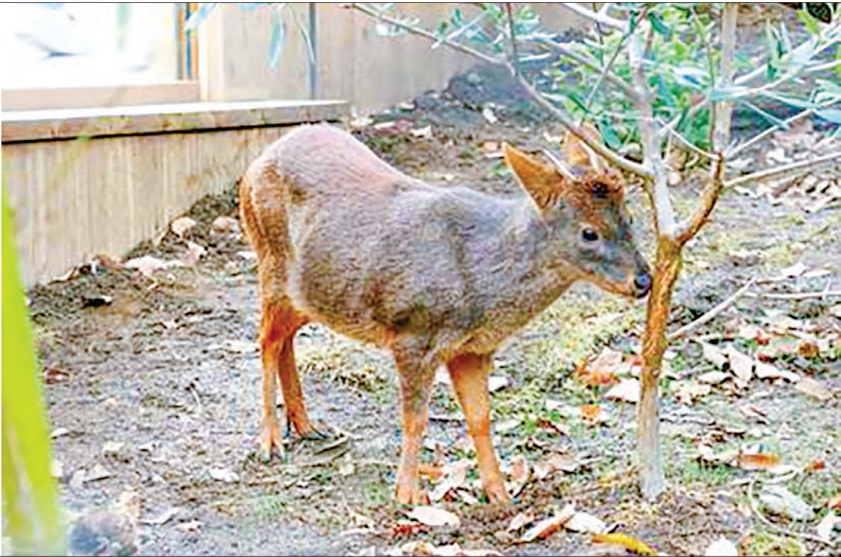
One of four pudus, the world’s smallest species of deer, is seen on display at Saitama Children’s Zoo near Tokyo, on 4 December 2016 in their first public appearance in the country.

SAITAMA (Japan) — Four pudus, the world’s smallest species of deer, were put on display Sunday in a zoo in Saitama Prefecture, near Tokyo, their first public appearance in the country. The pudu, native to southern Chile and parts of Argentina, is about 80 centimeters in length and weighs only 9 kilograms. Although the deer is listed as an endangered species, Saitama’s Children Zoo was given the pudus by Santiago Metropolitan Park in the Chilean capital after gaining permission to import them for the purpose of academic study, the Japanese zoo operator said. Two 2-year-old male pudus and two female pudus — a 2-year-old and 1-year-old — showed their faces among the bushes in a section of the zoo in Higashimatsuyama.—Kyodo News