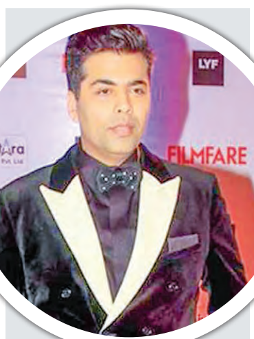
Karan Johar feels people from the movie industry are lost with the kind of expectations they carry.

says many industry people are just not equipped to carry a relationship.