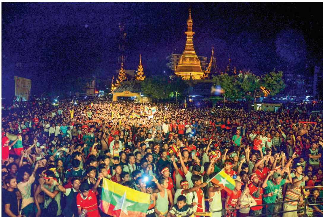
Supporters who gathered in downtown Yangon near the Sule Pagoda (in background) cheer for the Myanmar team as they faced Thailand in the Suzuki Cup semi-finals yesterday. The crowd gathered to watch the match at a giant screen set up in Mahabandoola Park. Thailand defeated Myanmar 2-0 in the match.