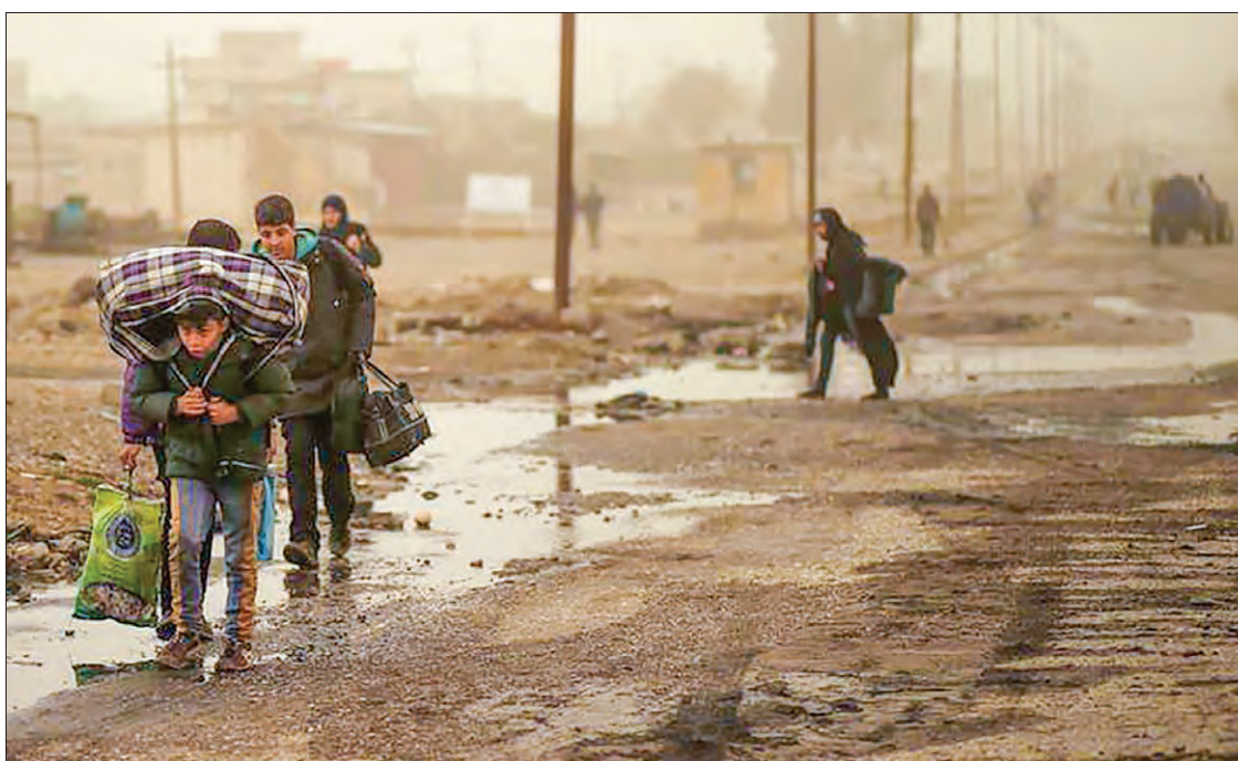
Iraqi people flee the Islamic State stronghold of Mosul in al-Samah neighbourhood, Iraq, on 2 December 2016.

"We've been living under a real state of siege for a week," said one resident of west Mosul, several miles (km) from the frontline neighbourhoods on the east bank of the Tigris river.