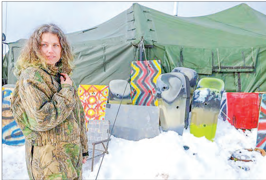
A veteran stands in front of homemade shields in Oceti Sakowin camp as “water protectors” continue to demonstrate against plans to pass the Dakota Access pipeline near the Standing Rock Indian Reservation, near Cannon Ball, North Dakota, US, on 3 December 2016.

Taylor Orpin, 23, quit her job to move to the camp last month. She spends her days collating donated coats by size and gender in a tent near the camp's main