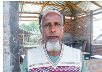
U Hasaung Amed.

“We assume that the commission's present visit will benefit peace and stability of the area. As regards Buthitaung's situation, the local populace did try for conflicts not to take place in the region in 2012 as well. Now we are taking great care for any problems not to break out in Buthitaung. For peace