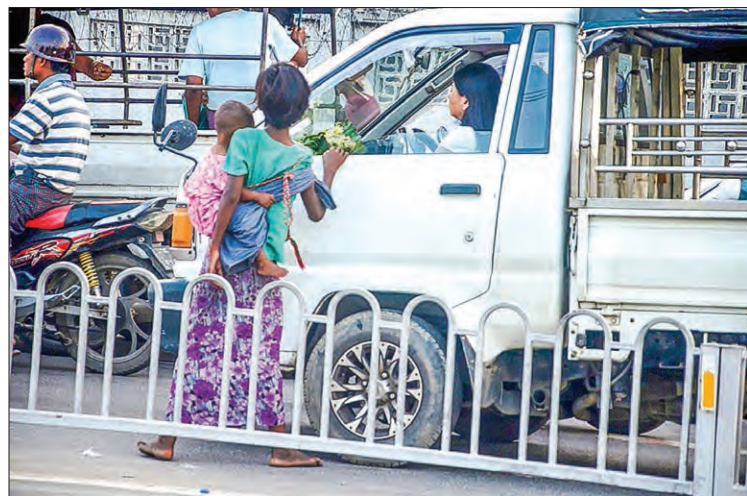
Such child beggars are rarely seen these days.

“NO CHILD BEGGARS have been seen on the streets of Mandalay since early November, as municipal police began arresting street beggars starting from October as part of an anti-child begging campaign,” said a member of the public.