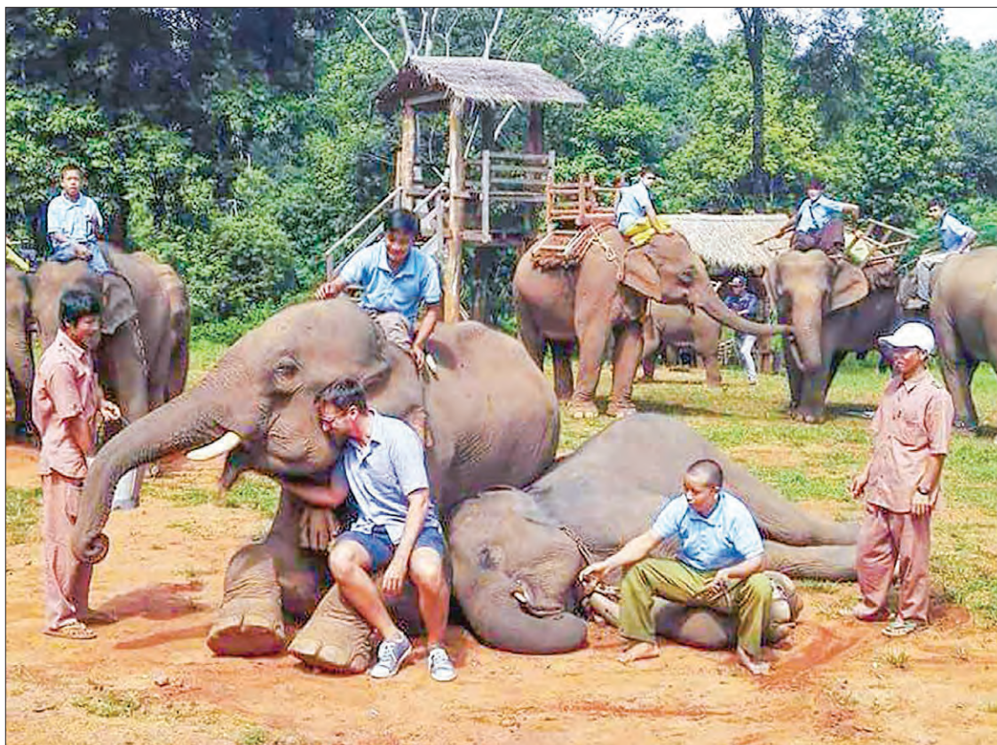
Natpauk Elephant Camp seen with visitors.

According to the Ministry of Hotels and Tourism, the country received over 4.6 million international visitors last fiscal year. This number was a 52 per cent increase when compared to 2014. The ministry estimates the number will increase to 5.5 million this fiscal year.—Aung Thant Khaing