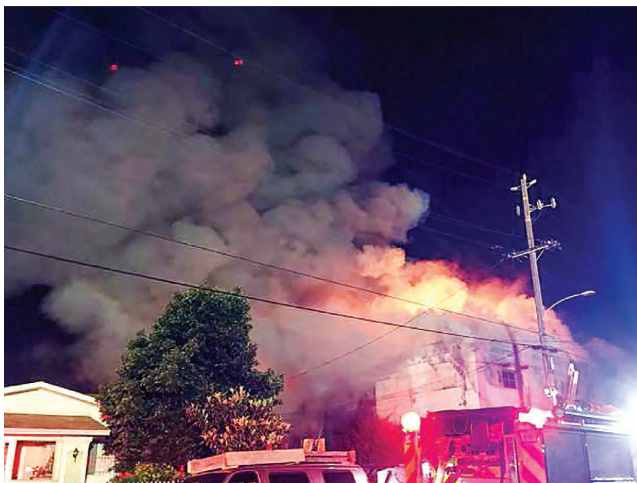
Flames rise from the top of a warehouse, which caught fire during a dance party in Oakland, California, US on 3 December 2016.

City Fire Chief Teresa Deloach Reed, said the blaze marked the worst sin-