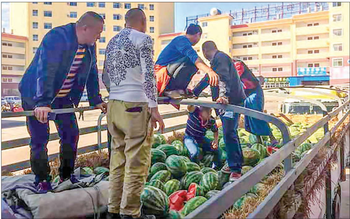
Watermelon to be exported to China.

Watermelon is a warm, long-season crop and is now grown commercially in wide parts of the country. The fruit mostly cultivated for its fresh juice and sweet flesh. Among others, melon produced from Mandalay mostly goes to export partners.—Myitmakha News Agency