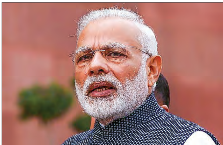
Prime Minister Narendra Modi speaks to the media inside the parliament premises on the first day of the winter session in New Delhi, India, on 16 November 2016.

Addressing his party's election campaign rally in the state of Uttar Pradesh, Modi said: "Please support me in curing the disease