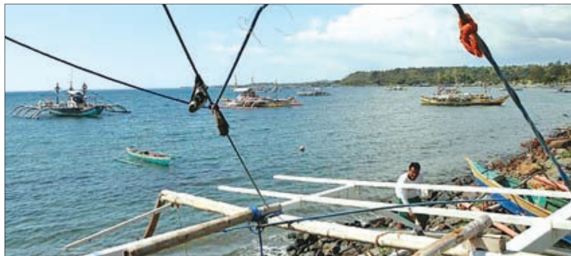
A fisherman repairs his boat overlooking fishing boats that fish in the disputed Scarborough Shoal in the South China Sea, at Masinloc, Zambales, in the Philippines on 22 April 2015.

The rescue illustrates the rapid changes in the relationship between the two countries under Philippine President Rodrigo Duterte, who in only a few months has sought to turn a historic foe into a friend. He visited Beijing in October and has met twice with Chinese leader Xi Jinping, to whom he has expressed admiration.— Reuters