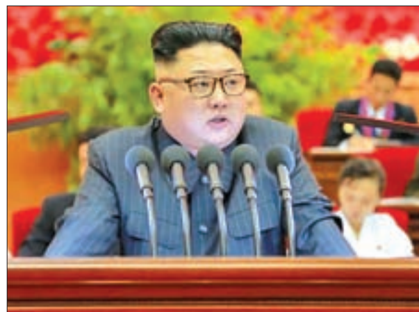
North Korean leader Kim Jong Un gives a speech at the 9th Congress of the Kim Il Sung Socialist Youth League in this undated photo released by North Korea's Korean Central News Agency (KCNA) in Pyongyang, on 29 August 2016.