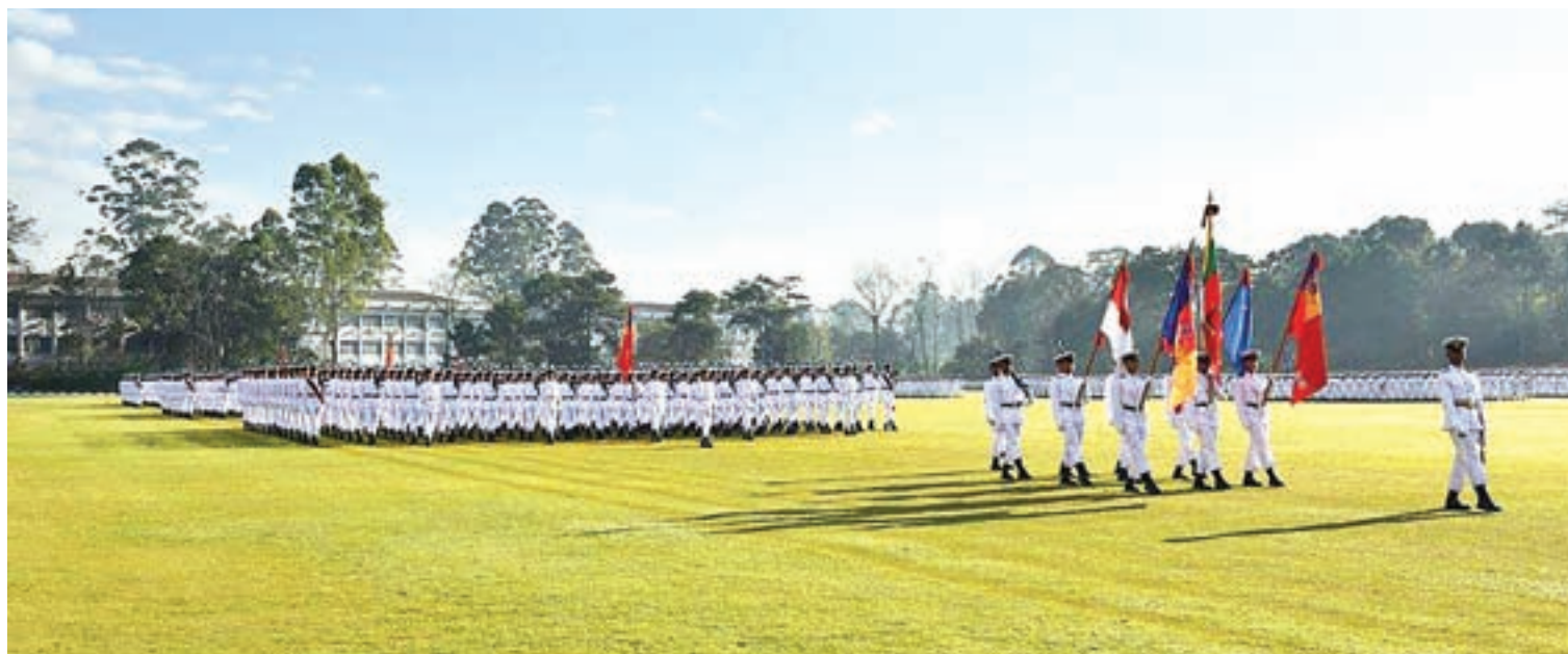
Senior General Min Aung Hlaing receives salute of graduating cadets at Defence Services Academy in PyinOoLwin.

SENIOR General Min Aung Hlaing, Commander-in-Chief of the Defense Services addressed the parade held in honour of the graduation ceremony of 58th Intake of Defense Service Academy held at the parade ground in Pyin Oo Lwin, at 7:30 am on December 2.