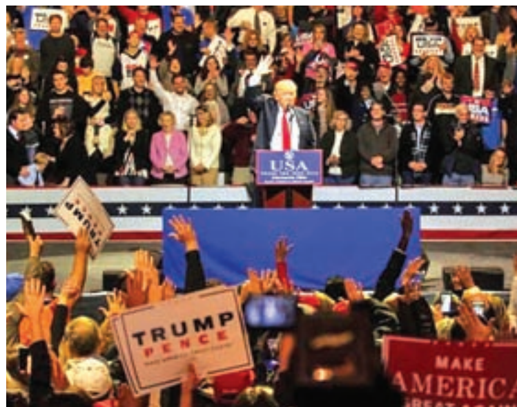
US President-elect Donald Trump speaks at a rally as part of their 'USA Thank You Tour 2016' in Cincinnati, Ohio, on 1 December 2016.

CINCINNATI — President-elect Donald Trump kicked off his post-election "thank you tour" on Thursday by railing against globalization, promising the return of manufacturing jobs to American workers, and vowing to shut US borders to some Middle East migrants.