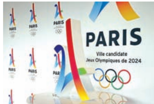
The logo of the Paris candidacy for the 2024 Olympic and Paralympic Games is pictured in Paris, France, on 17 February 2016.

The International Olympic Committee (IOC)