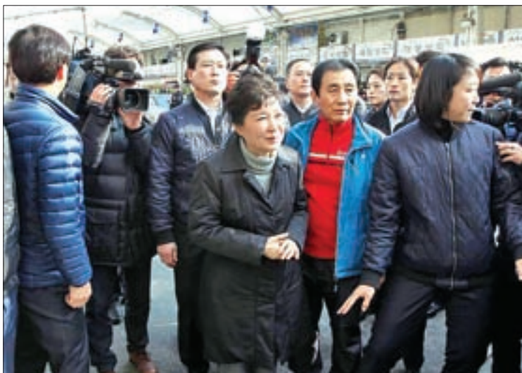
South Korean President Park Geun-hye visits the scene of a fire (not pictured) at a traditional market in Daegu, South Korea, on 1 December 2016.

The three opposition parties, with a combined 165 seats in the 300-member parliament, can bring the impeachment but will need some members from Park's Saenuri Party to bring the vote to the two-thirds majority required