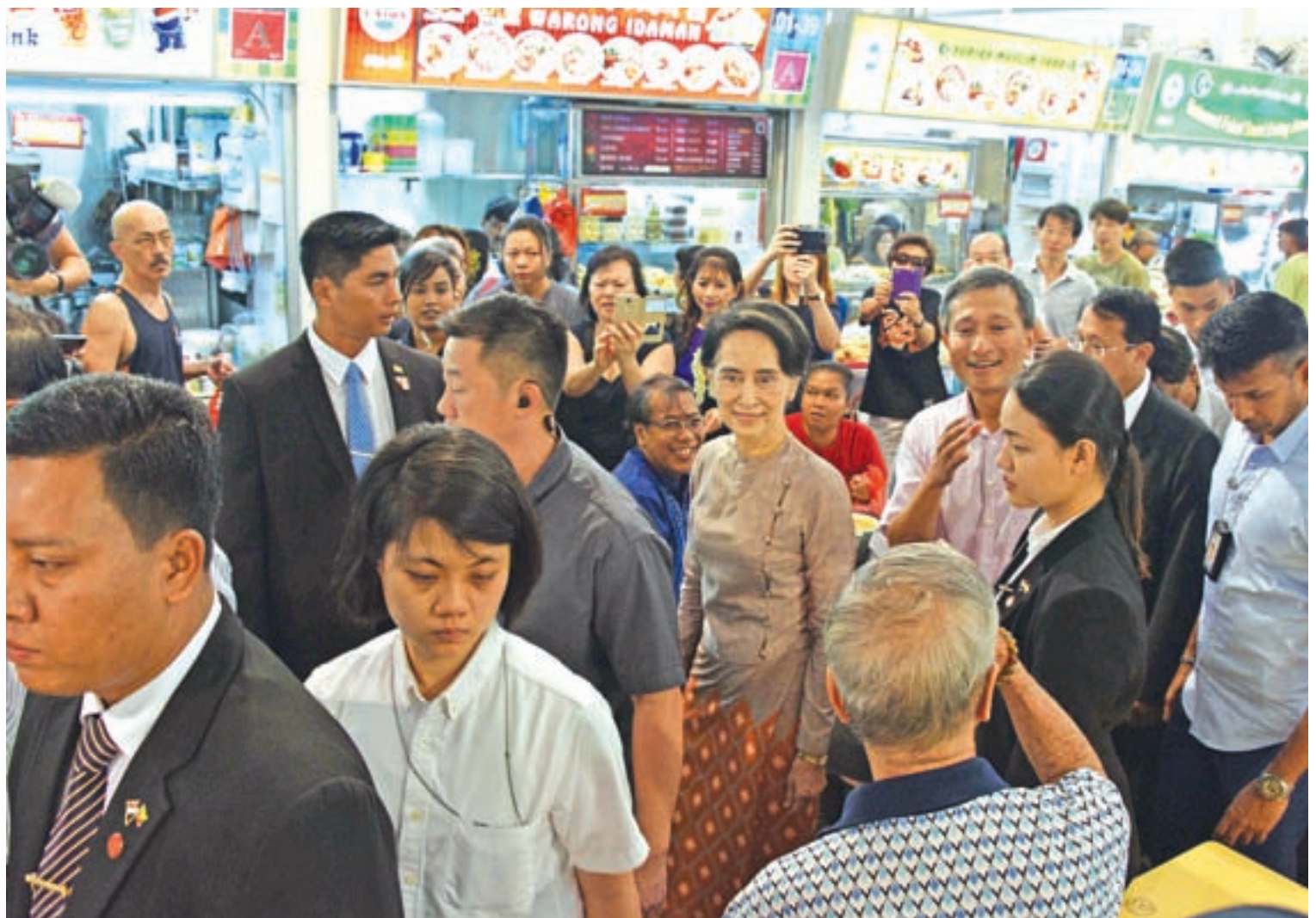
State Counsellor Daw Aung San Suu Kyi visiting Grim Moh Hawker Center & Market, Singapore.

Together with the State Counsellor, Union Minister Dr Than Myint, Minister of State for Foreign Affairs U Kyaw Tin and officials came back, it is reported.— Myanmar News Agency