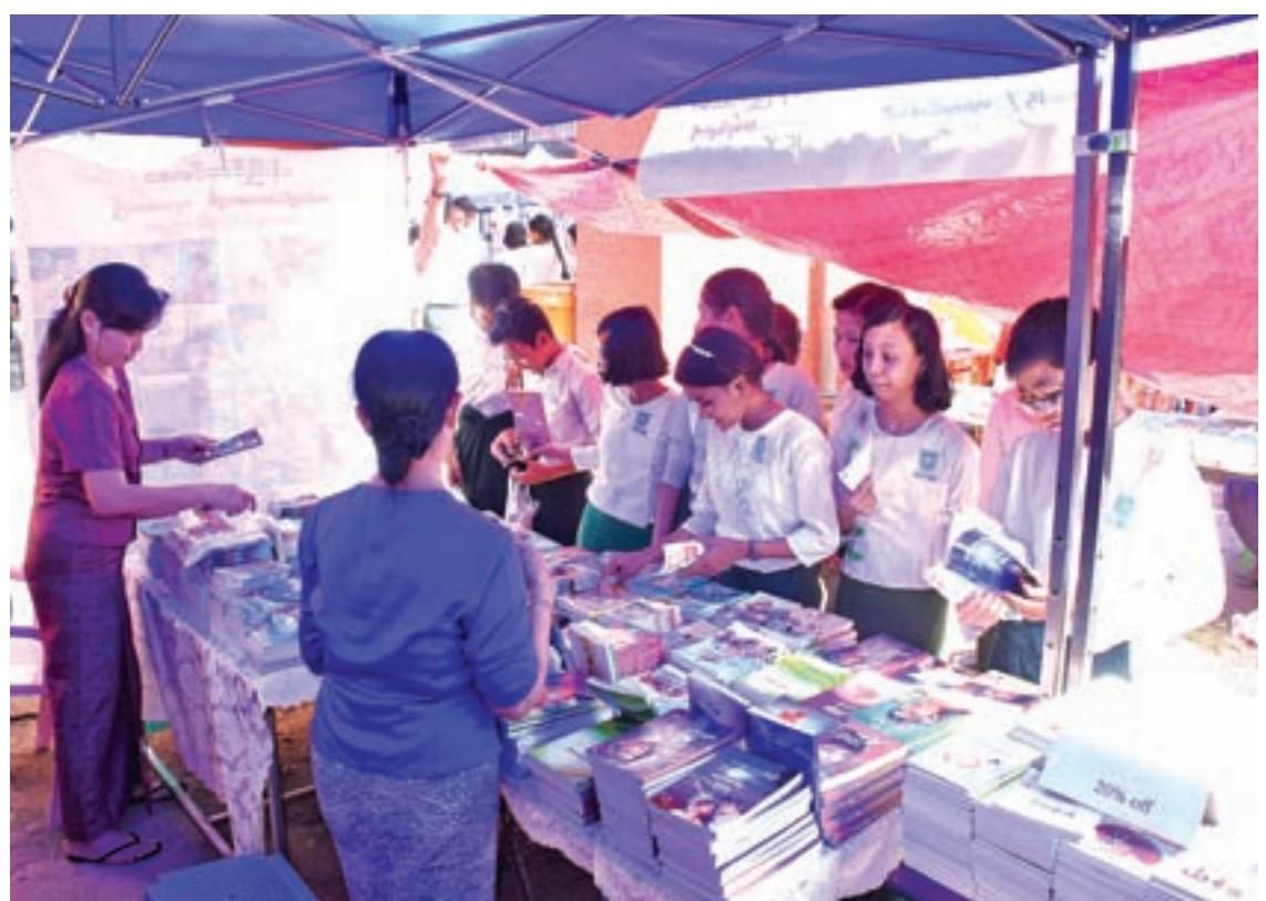
Students observing the books at a stall in the book fair.

Third-day paper reading ceremony will be held on December 3, it is learnt.— Yee Yee Myint, Ohnmar Thant