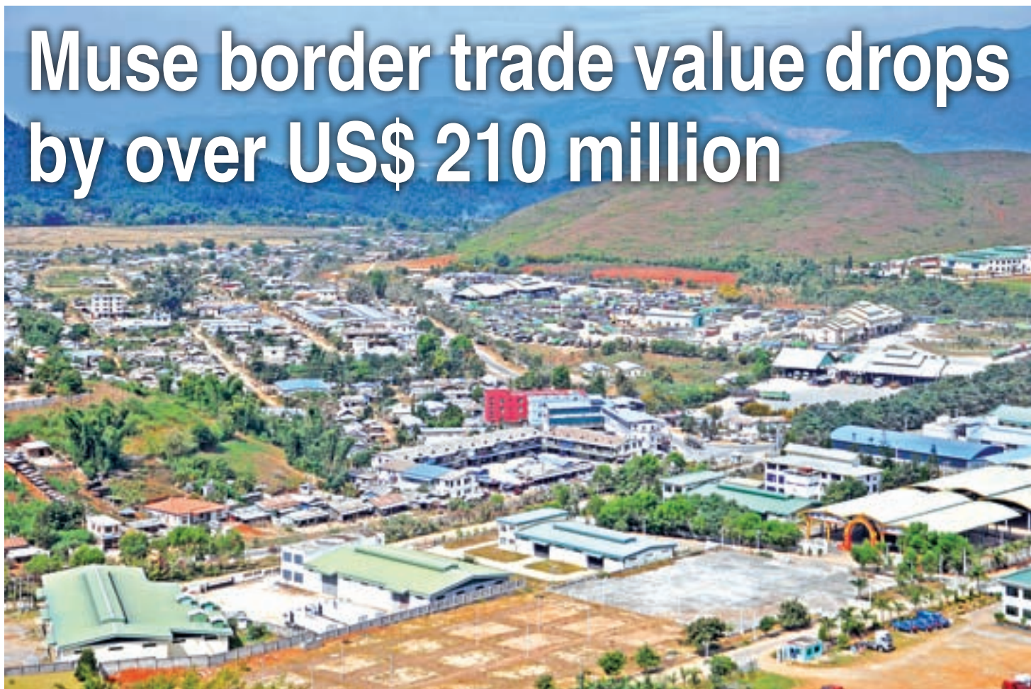
A panoramic view shows 105-mile Trade Zone, Muse, Northern Shan State.

THE TRADE value of Muse border trade camp over the past eight months declined to over US$3.2 billion from US$3.411 billion last year, a decrease of US$210 million, according to the official figures released by the Ministry of Commerce.