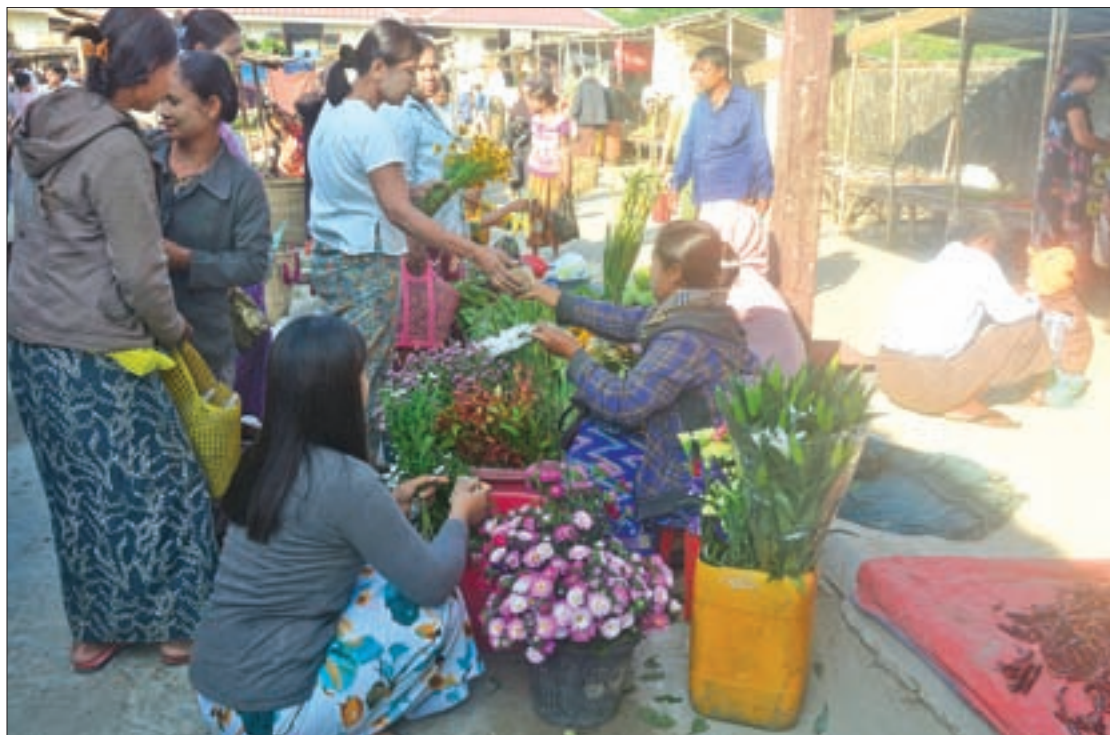
Woman sells the flowers to customers in Maungtaw district, Rakhine State.