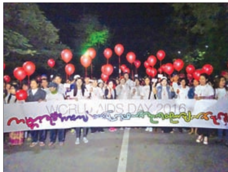
Participants are ready to walk to commemorate the World AIDS DAY 2016.

The activity was launched by Dr Soe Than, Minister of Agriculture, Livestock and Irrigation. The mass walk involves entertainments and distribution of educative pamphlets. — Thiha Ko Ko (Mandalay)