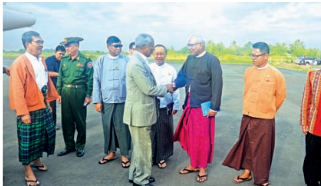
Kofi Annan and commission members being greeted upon arrival at Sittwe.

THE delegation led by Kofi Annan, chairman of the advisory commission on Rakhine State and former secretary-general of the United Nations, left Yangon by Myanmar National Airways, arriving at Sittwe at 8:25 am yesterday.