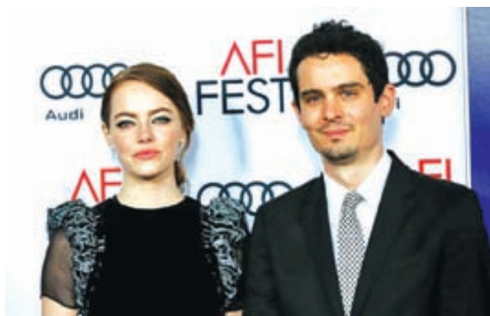
Director Damien Chazelle and cast member Emma Stone pose at the premiere of "La La Land" during AFI FEST in Hollywood, California US, on 15 November 2016.

The Critics' Choice Awards are chosen by the 300-plus mem-