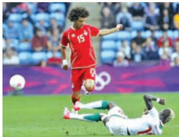
Senegal's Pape Souare (R) fights for the ball with UAE's Omar Abdulrahman during their Men's first round Group A preliminary soccer match in the London 2012 Olympic Games at the City of Coventry stadium, on 1 August 2012.