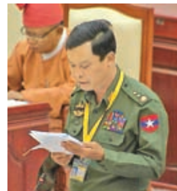
Lt-Gen Kyaw Swe.