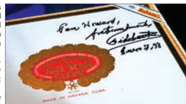
A box of cigars autographed by Fidel Castro is displayed by Julien's Auctions in New York City, US, on 1 December 2016.