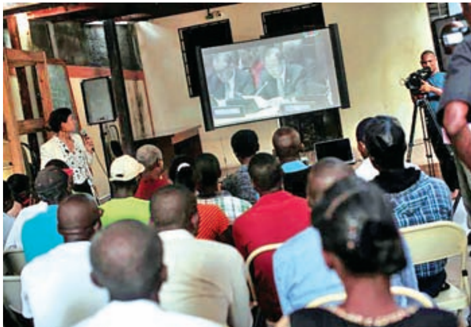
Haitians watch a broadcast of outgoing United Nations Secretary-General Ban Ki-moon's apology to the people of Haiti for the world body's role in a deadly cholera outbreak, on a screen at the Office of International Lawyers in Port-au-Prince, Haiti, on 1 December 2016.

I will never forget it," Ban said on Thursday of a