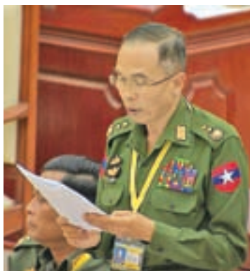
Lt-Gen Sein Win.