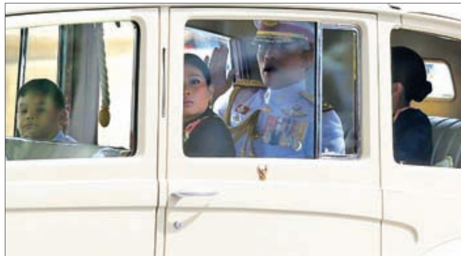
Thailand's new King Maha Vajiralongkorn Bodindradebayavarangkun is seen on his way to the Grand Palace in Bangkok, Thailand, on 2 December 2016.

Southeast Asia's second-largest economy has suffered over more than a decade of on-off political unrest stemming from confrontation between the old