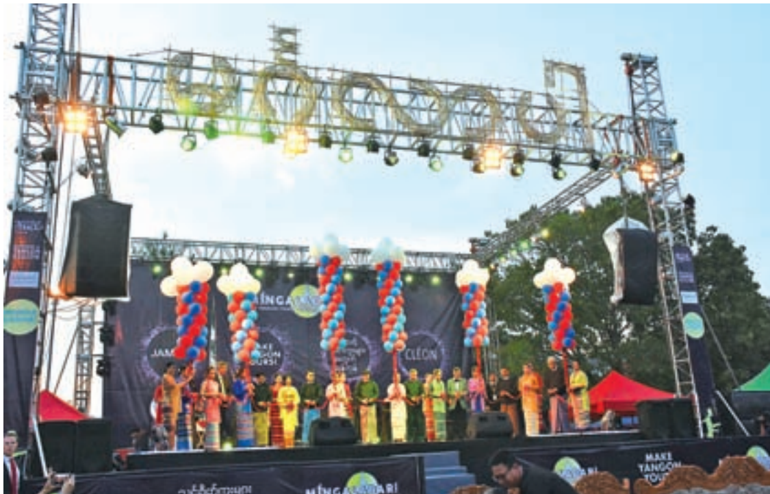
Vice President cutting the ribbon to open the festival.