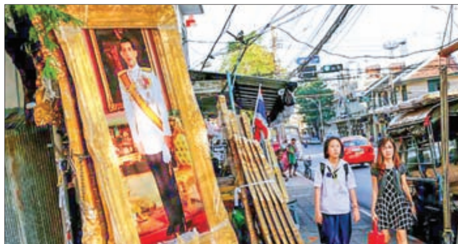
People walk past a picture of Crown Prince Maha Vajiralongkorn displayed for sale at a royal memorabilia shop in Bangkok, Thailand, on 29 November 2016.

"We can confirm that His Majesty arrived safely this morning," said a senior military official who asked