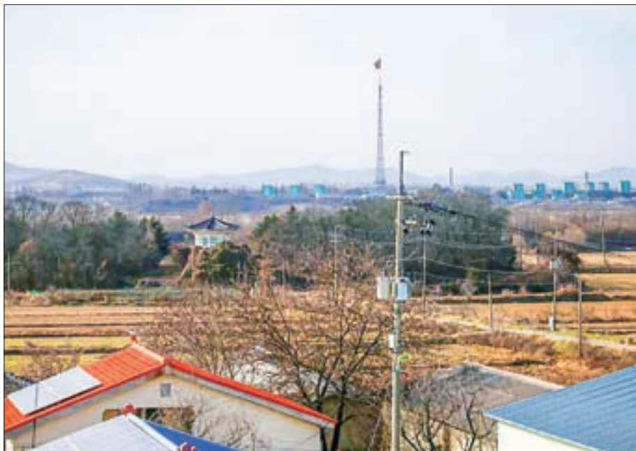
North Korean flag flutters on the top of 160-metre tower at North Korea's propaganda village of Gijungdong in this picture taken from the Tae Sung freedom village near the Military Demarcation Line (MDL), inside the demilitarised zone separating the two Koreas, in Paju, South Korea, on 22 November 2016.