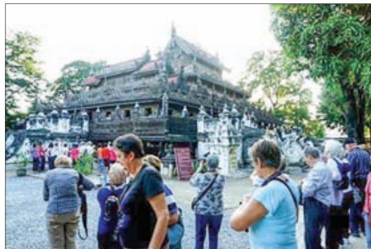
Tourists taking photographs of the Shwenandaw Monastery.

The Shwenandaw Monastery is one of major tourist attractions in Old Mandalay. Other attractions include Taungthaman Lake and U Bein Bridge, Mandalay Hill and Mandalay Royal Palace, with its moat and fortress walls. — Than Zaw Min (IPRD)