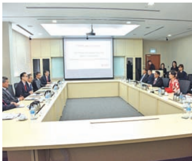
The State Counsellor at the Corrupt Practices Investigation Bureau.