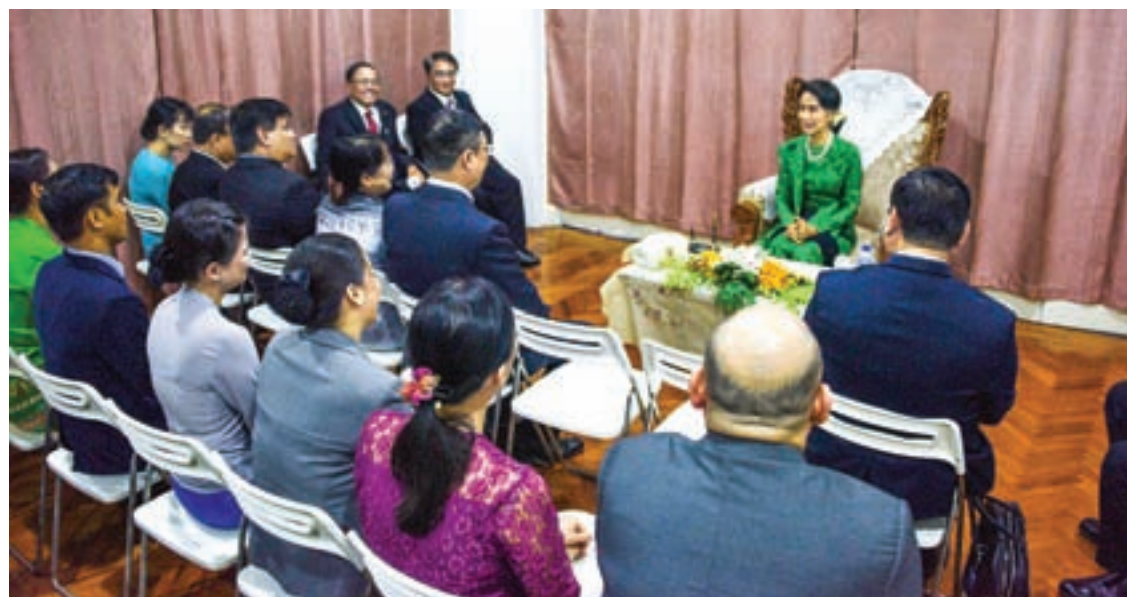
State Counsellor meeting with staff and families of the Myanmar Embassy and Military Attaché Office.