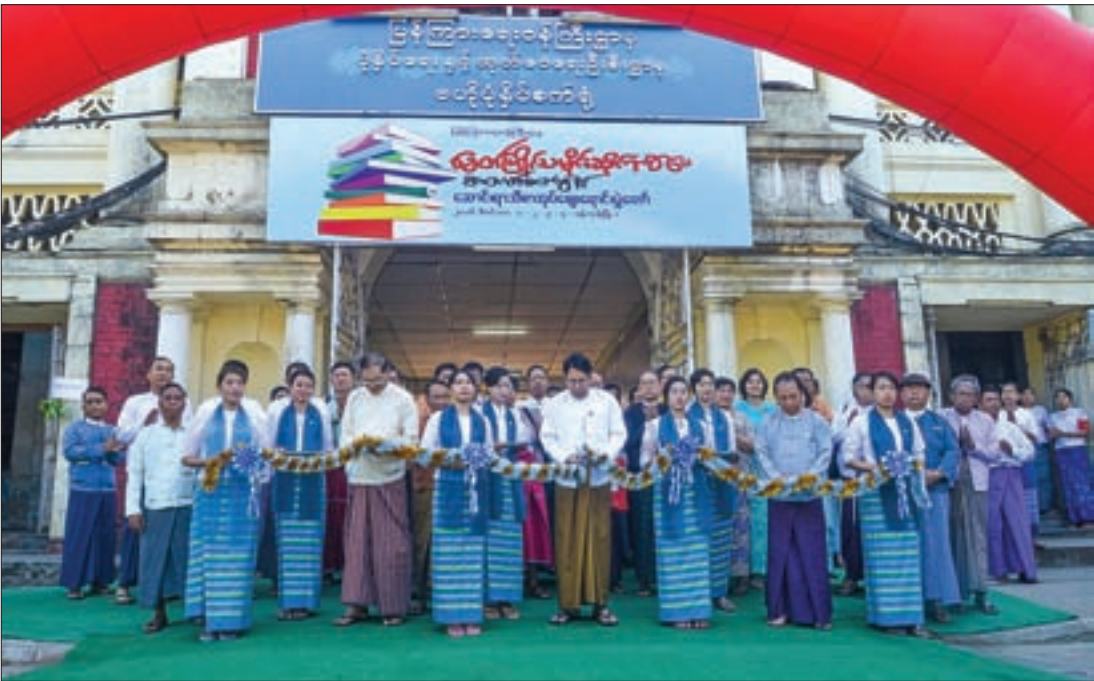
Union Minister for Information Dr Pe Myint cuts the ribbon at the ceremony of Paper Reading on contemporary historical literature and the winter season book fair festival in Yangon.

sons of committees of Amyotha Hluttaw, MPs, members of Legal Affairs and Special Cases Assessment Commission, officials from the UNAIDS and the Phoenix Association and staff from the Amyotha Hluttaw Office.—Myanmar News Agency