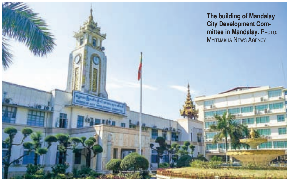
The building of Mandalay City Development Committee in Mandalay.