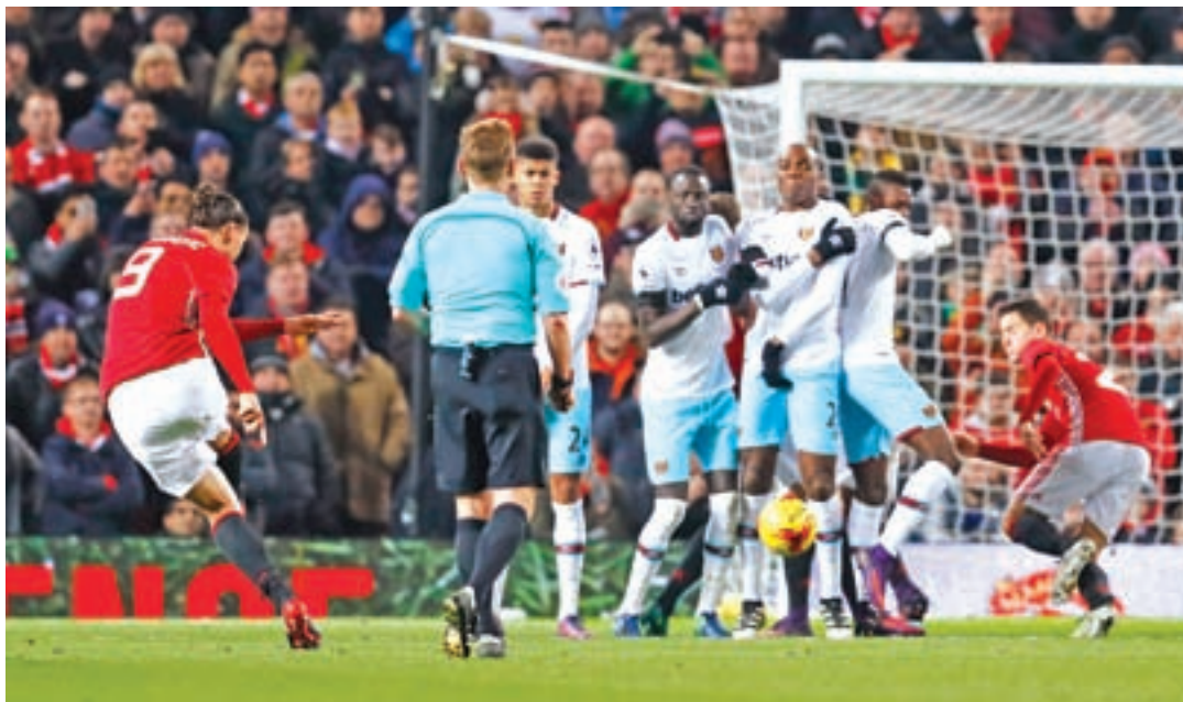
Manchester United's Zlatan Ibrahimovic shoots at goal from a free kick during EFL Cup Quarter Final, at Old Trafford, on 30 November 2016.

The Portuguese was banned from the dugout on Wednesday, but would have been delighted with the way United carved open their opponents after just two