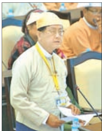
U Maung Maung Win.

THE Deputy Minister for Planning and Finance U Maung Maung Win promised to make Hpa-an Industrial Zone a success at the Amyotha Hluttaw Session yesterday.