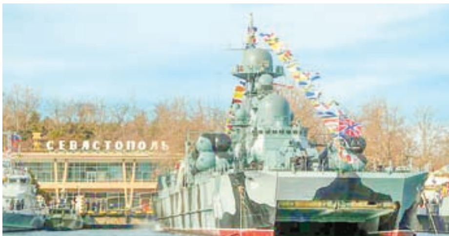
A view of a Russian warship during celebrations of the Defender of the Fatherland Day in Sevastopol, Crimea, on 23 February 2016.

"Warships of the Black Sea Fleet ... have taken up positions near Crimea's western coast for the duration of Ukraine's planned missile tests from 1-2 December," a military source in