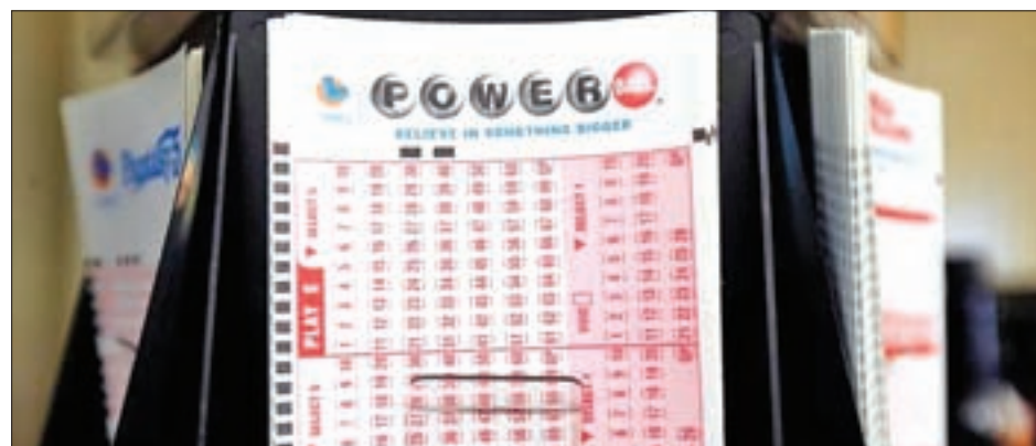
Lottery stubs are pictured at an ampm convenience store in Pasadena, California US, on 21 November 2016.

The prize was among the top 10 largest in the history of the Powerball lottery. Powerball has yielded the largest-ever US lottery prize, a $1.6 billion sum split between three winning tickets in January.—Reuters