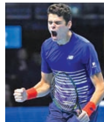
Canada's Milos Raonic. PHOTO: REUTERS

He had also worked with Croatian Ivan Ljubicic for more than two years before joining up with Moya.—Reuters