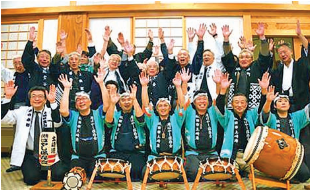
People involved in the Hikiyama float parade portion of the Tsuchizaki Shinmeisha Shrine annual celebration in the northeastern Japan city of Akita show their joy in the early morning of 1 December 2016, after the festival with 32 other traditional festivals from across Japan, was added to UNESCO's Intangible Cultural Heritage list.

tral Japan boasts five cultural properties, the most among the Japanese prefectures involved, to be inscribed on UNESCO's representative list of the intangible cultural