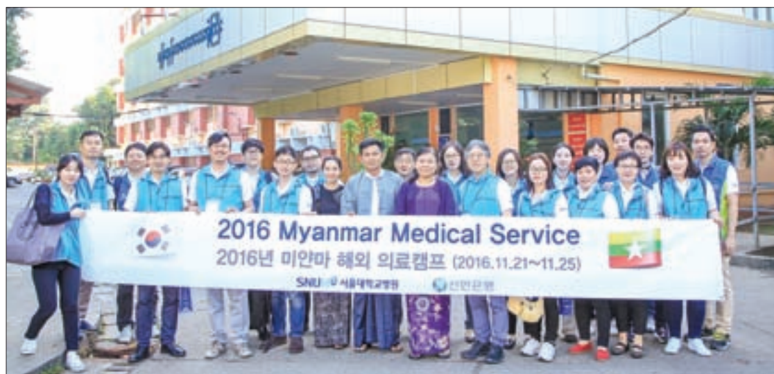
Seoul national medical team and Shinhan Bank's volunteers posing for a documentary photo.

SHINHAN Bank sponsored a medical team from the Seoul National University Hospital of the Republic of Korea to provide surgeries for cleft lip and palate as well as ultrasonic cardiography for Myanmar children at Yangon Children's Hospital and Yankin New Children Hospital from November 22th to 26th.