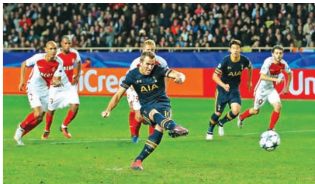
Tottenham's Harry Kane scores their first goal from a penalty against AS Monaco during UEFA Champions League Group Stage Group E, at Stade Louis II, in Monaco, on 22 November 2016.

LONDON — Tottenham Hotspur striker Harry Kane has signed a new contract that runs until 2022, the Premier League club said on their website on Thursday.