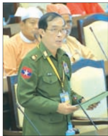
Maj-Gen Than Htut. PHOTO: MNA