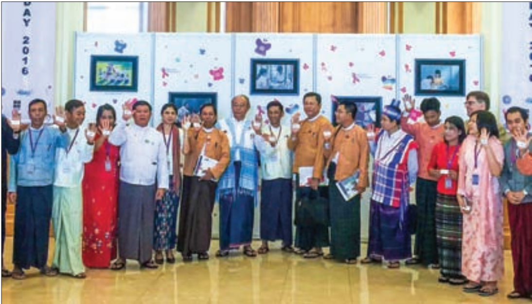
Amyotha Hluttaw Speaker Mahn Win Khaing Than posing for a group photo at world AIDS Day.

Signed, Htin Kyaw President Republic of the Union of Myanmar