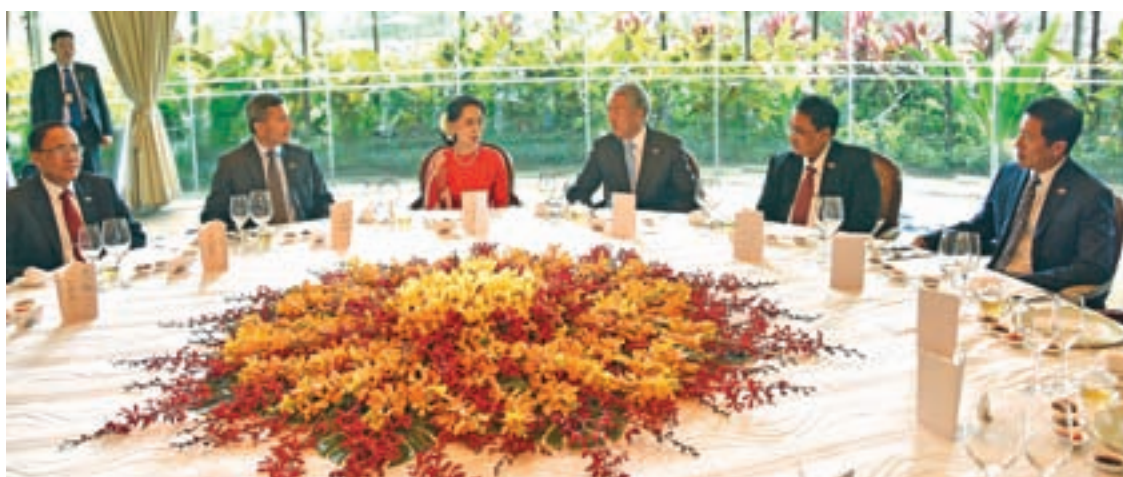
The State Counsellor seen at the luncheon hosted by Mr Toh Chin Chye.