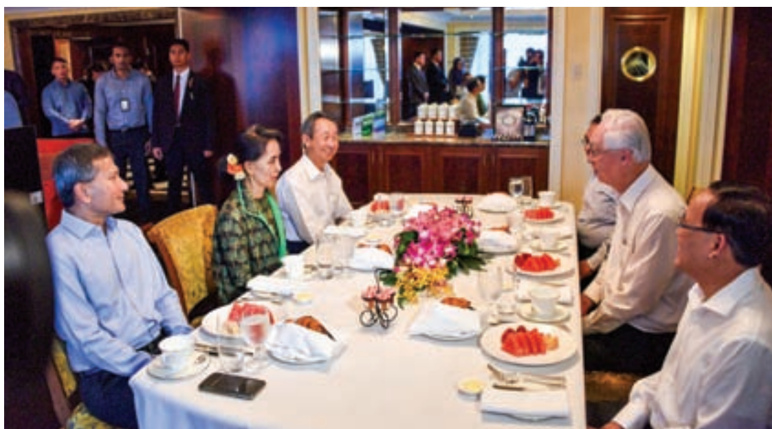
The State Counsellor talking to Senior Minister Mr Goh Chok Tong.