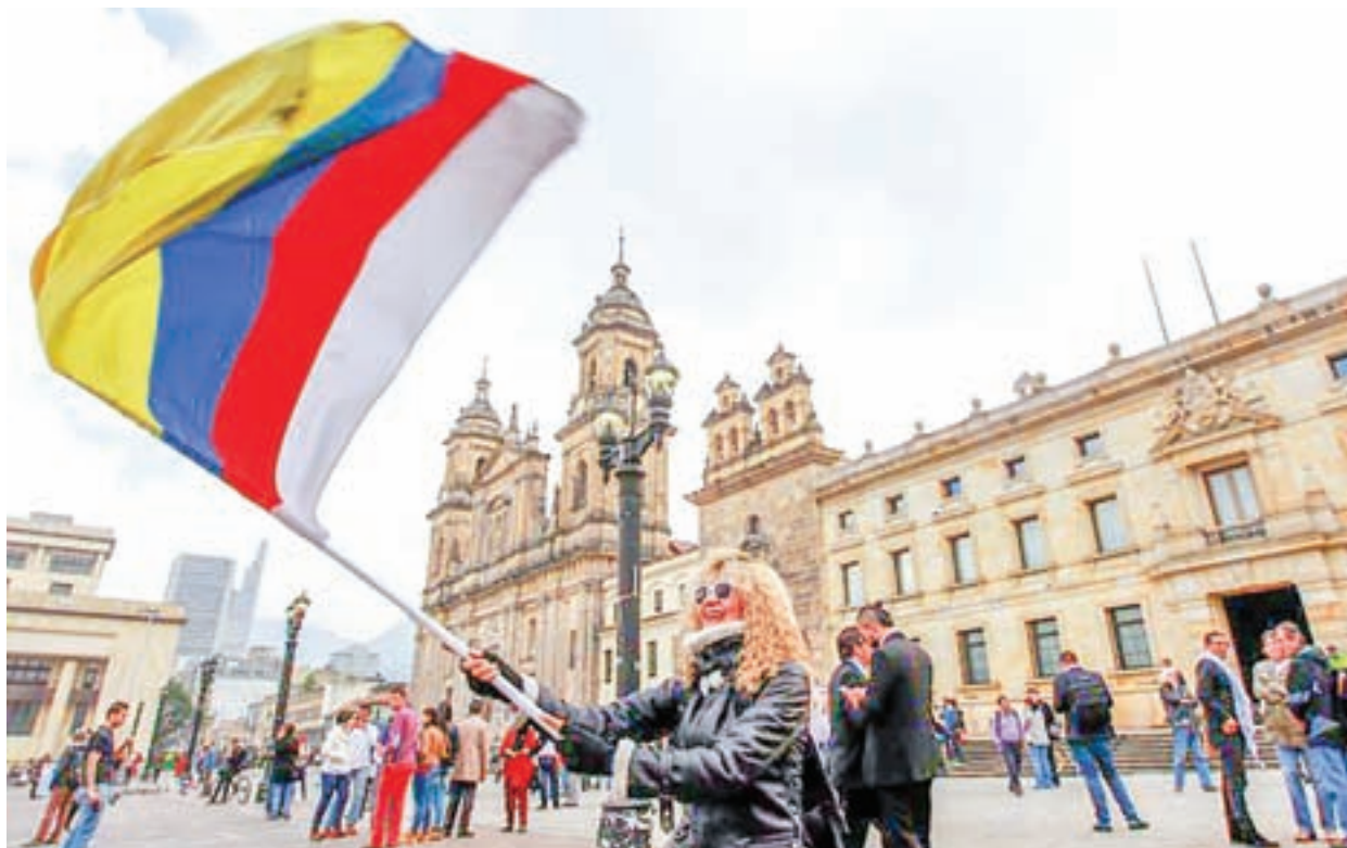
People demonstrate on the street as Colombia's President Juan Manuel Santos and Marxist FARC rebel leader Rodrigo Londono, known as Timochenko, sign a new peace accord in Bogota, Colombia, on 24 November 2016.