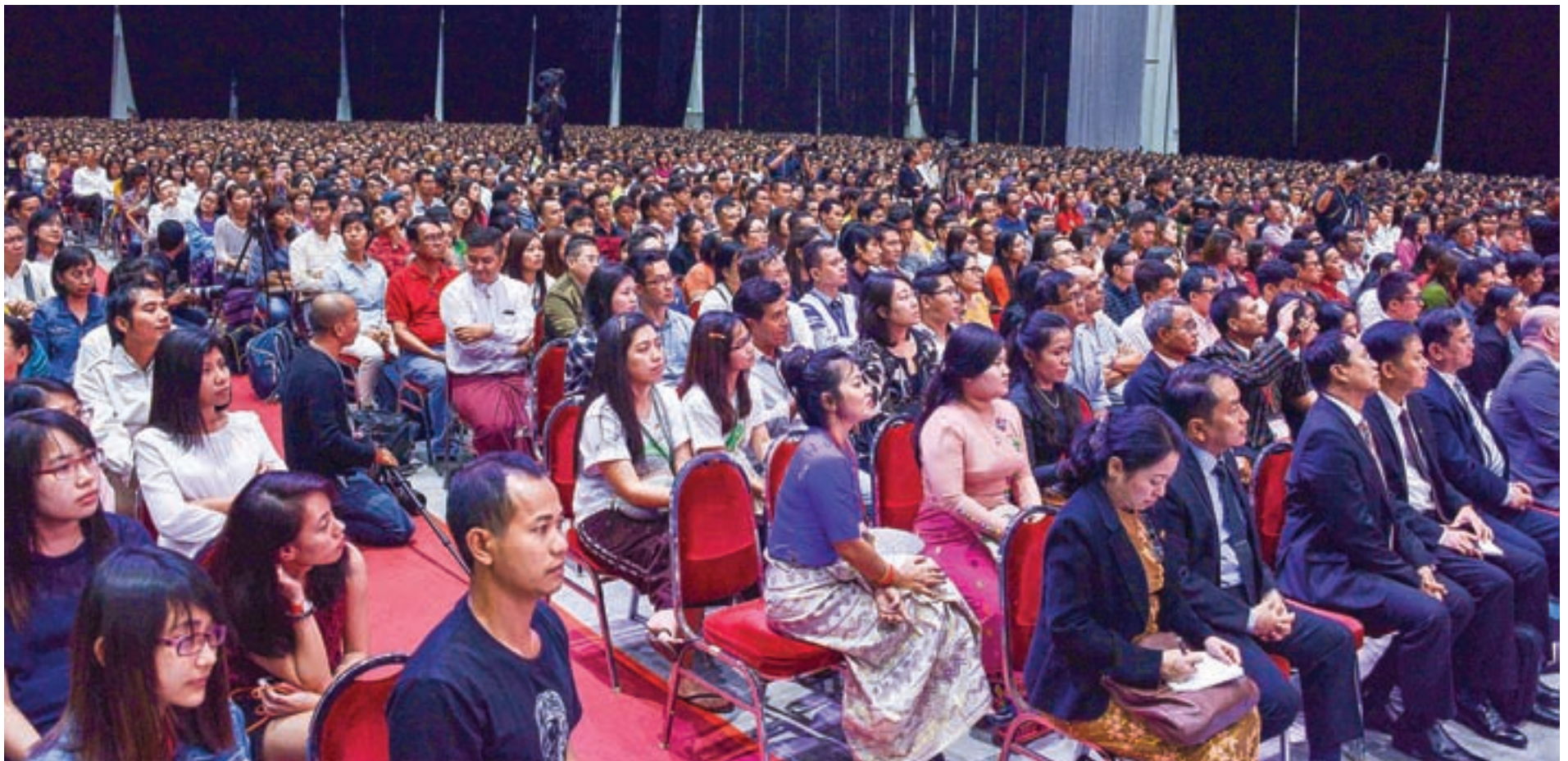
State Counsellor Daw Aung San Suu Kyi talking to Myanmar nationals living in Singapore.

PEACE and development are the priorities of the government, State Counsellor Daw Aung San Suu Kyi told Myanmar nationals living in Singapore yesterday.