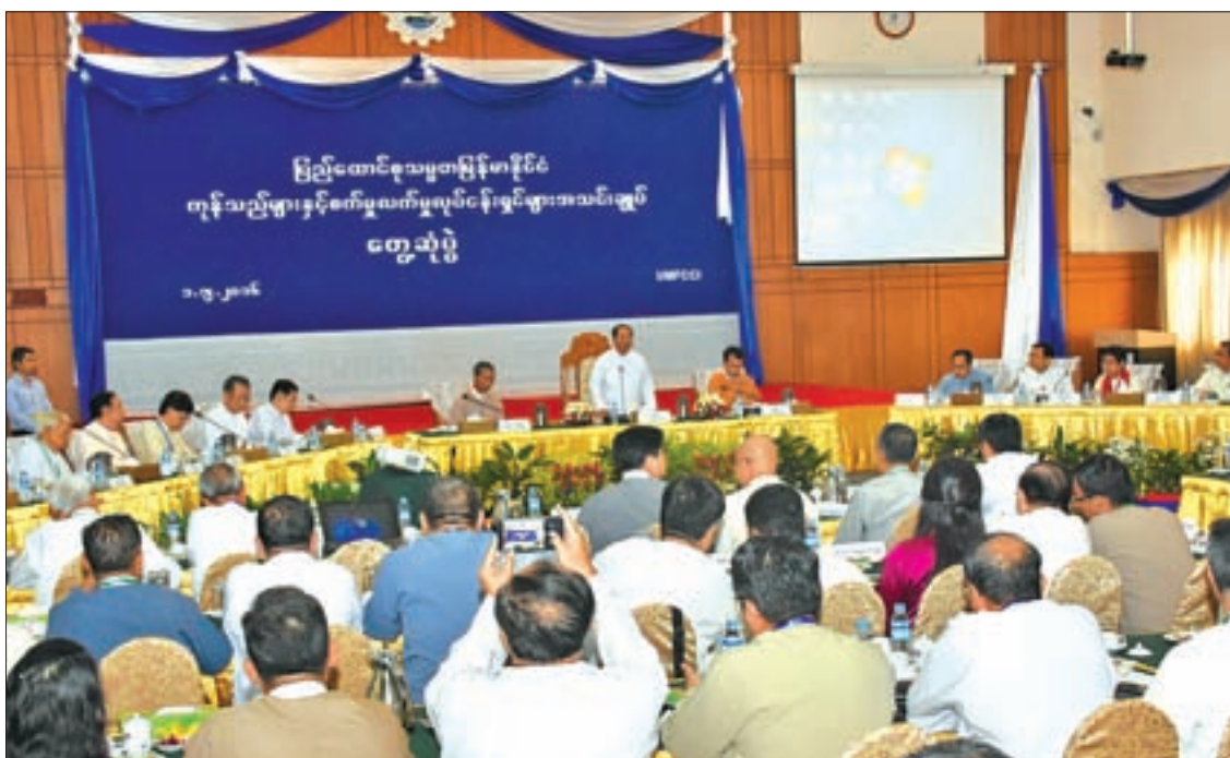
Vice President U Myint Swe speaking at UMFCCI meeting.

"With the help of Asian Development Bank, the framework and working processes of development in the private sector of the country was compiled in consultation with responsible persons. Five working committees will be formed to implement five panels. It is essential to solve problems that can be easily dealt with,