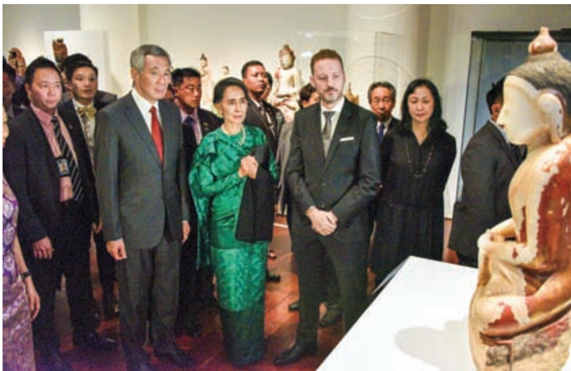
The State Counsellor observing the Buddha image.