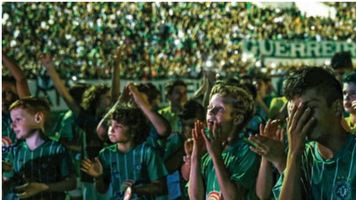
Youth players of Chapecoense soccer club pay tribute to Chapecoense's players at the Arena Conda stadium in Chapeco, Brazil, on 30 November 2016.