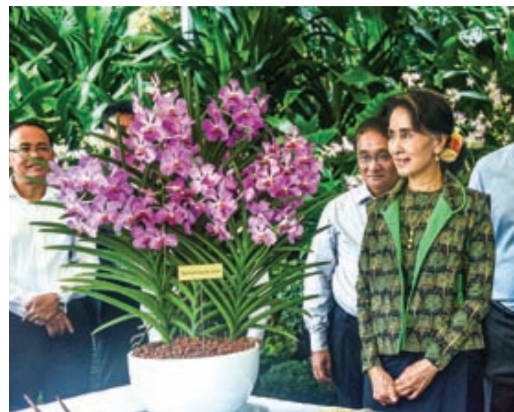
The State Counsellor and the orchid named after her.