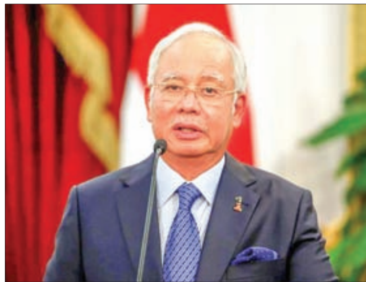
Malaysia's Prime Minister Najib Razak talks to the media beside Indonesia's President Joko Widodo after a bilateral meeting at Presidential Palace in Jakarta, Indonesia, on 1 August 2016.

Concerns are mounting among Najib's supporters that a new party, led by Najib's mentor-turned-nemesis Mahathir Mohamad and former deputy