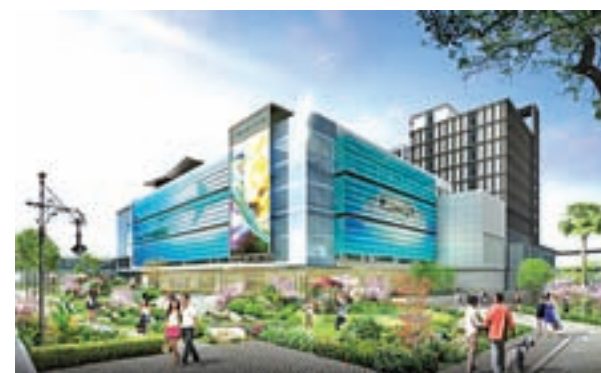
Supplied photo shows an image of an aquarium to be built by Japan's Yokohama Hakkeijima Inc. in Taoyuan, northern Taiwan, scheduled to open in 2020.

The ABS also found there was a greater discrepancy in male and female representation within university courses, depending on the subject undertaken. —Xinhua