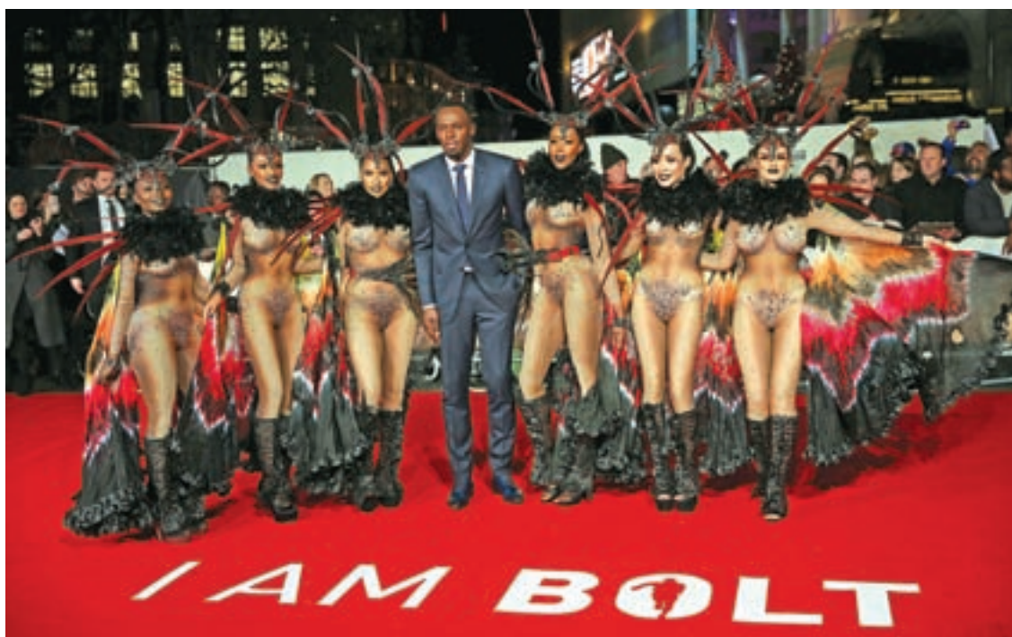
Athlete Usain Bolt (C) poses for photographers with dancers at the world premiere of the film 'I am Bolt' in London, Britain, on 28 November 2016.

The 30-year-old has said he plans to retire from the sport after the August world championships in London. He told reporters he wanted to do more charity work afterwards.—Reuters