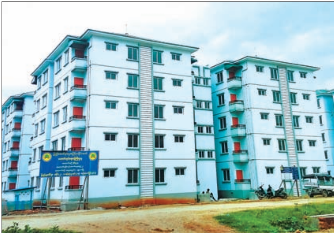
Myayinanda Apartments developed by the Construction Ministry.

The sugarcane price increased by Ks15,000 per tonne when compared to the last year. About 40,000 tonnes of sugarcane are likely to be sent to the Yedashe sugar mill. Additionally, about 10 more tonnes of sugarcane will be produced per acre compared to last year's yield, it is learnt.—200