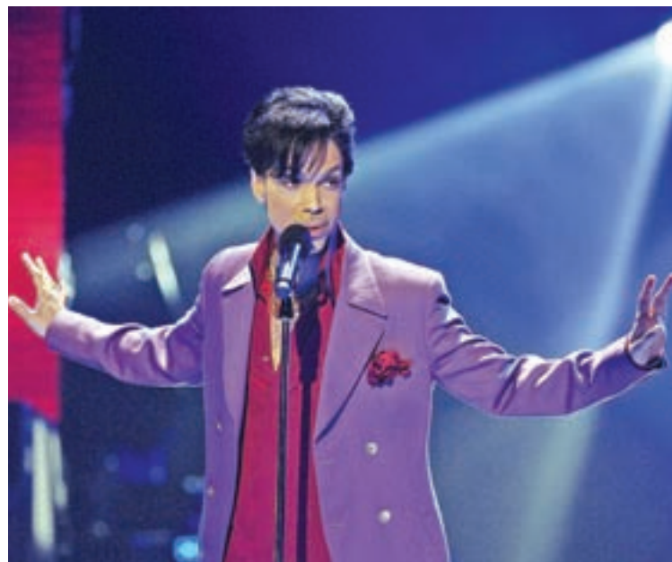
Singer Prince performs in a surprise appearance on the "American Idol" television show finale at the Kodak Theater in Hollywood, California in this 24 May 2006 file photo.