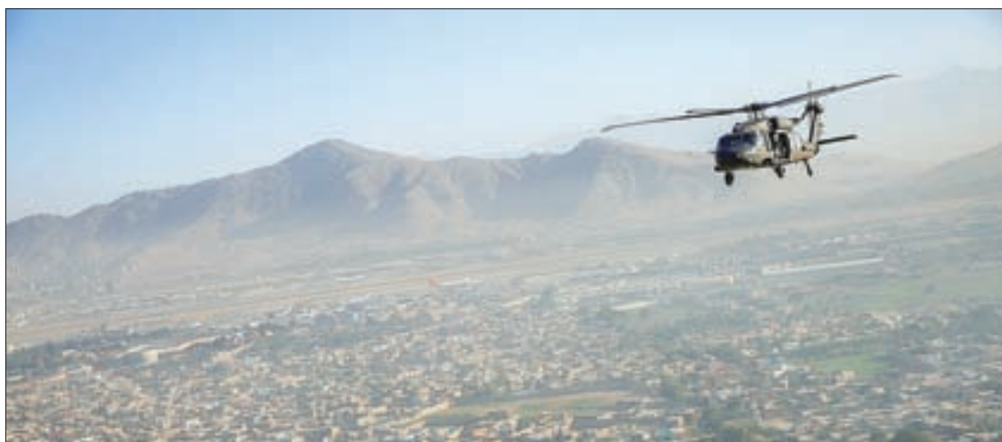
A Blackhawk helicopter flies over Kabul on 3 October 2014.

Donald Trump's victory in the US presidential election, and the prospect of warmer US-Russian ties, could yet impact the proposed move, but were it to go through, it would cost hundreds of millions of dollars and require retraining po-