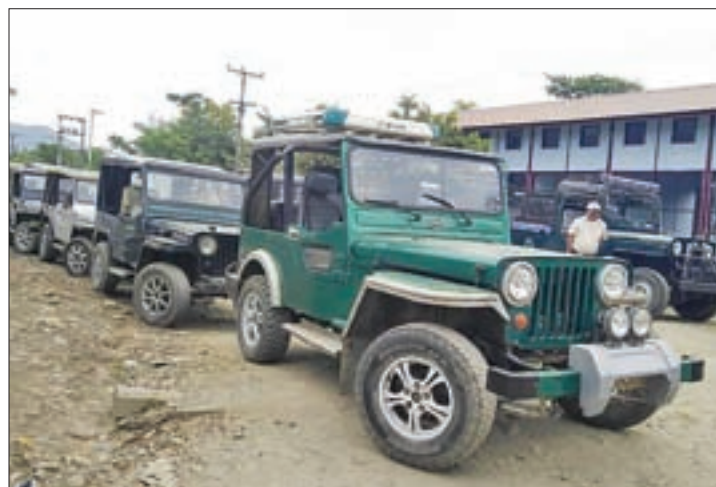
Jeeps produced from Kalay industrial zone.

The tax rate levied on MMSJ and MSJ-1,2,3 cars in this fiscal year is Ks1.2million, whereas ASJ and CDS model cars are taxed at a rate of Ks1million.— Myitmakha News Agency