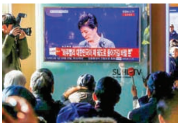
People watch a television broadcast of a news report on President Park Geun-hye releasing a statement to the public in Seoul, South Korea, on 29 November 2016.

The main opposition Democratic Party rejected Park's offer, calling it a ploy to escape being