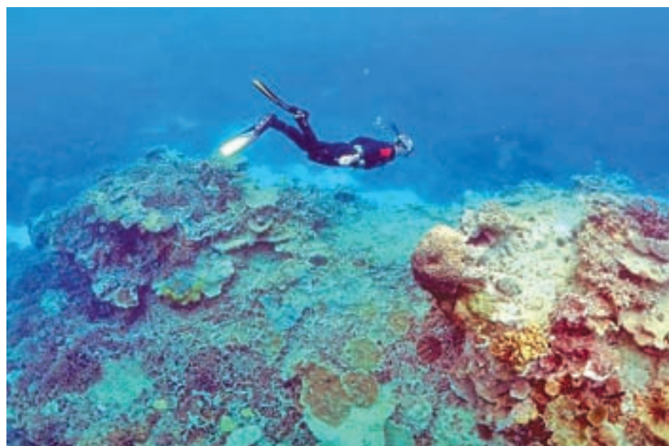
A man snorkels in an area called the 'Coral Gardens' near Lady Elliot Island, on the Great Barrier Reef, northeast of Bundaberg town in Queensland, Australia, in 2015.

He said the die-off was "almost certainly" the largest ever recorded anywhere because of the size of the Barrier Reef, which at 348,000 sq km (134,400 sq miles) is the biggest cor-