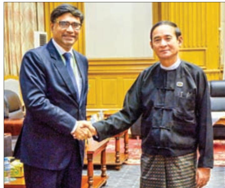
Speaker of Pyithu Hluttaw U Win Myint receives H.E. Mr Vikram Misri, the Indian ambassador to the Republic of the Union of Myanmar.