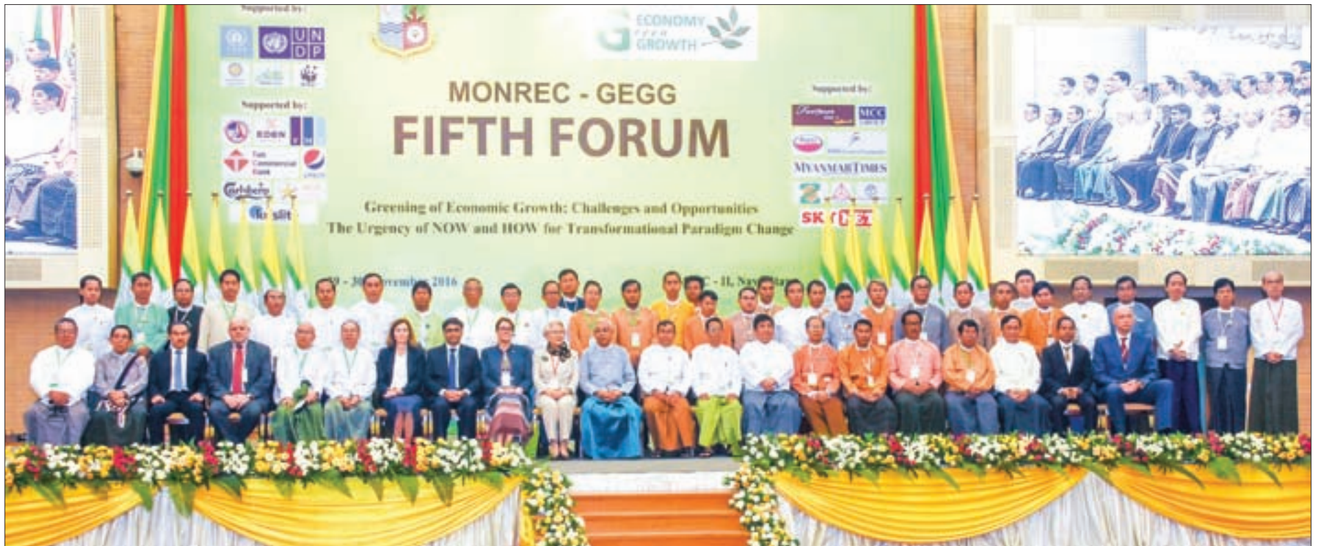
President U Htin Kyaw and dignitaries posing for a documentary photograph after the forum.

MYANMAR is encountering the consequences of climate change, deterioration of the ecosystem, deforestation, endangered species, pollution of the air, oceans, rivers, lakes and land and infectious diseases like other countries in the world, President U