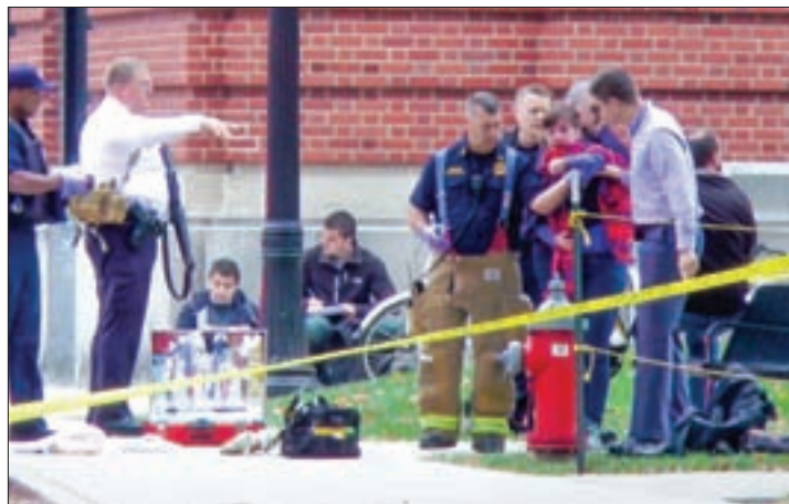
A girl is led to an ambulance by emergency personnel following an attack at Ohio State University's campus in Columbus, Ohio, US on 28 November 2016.