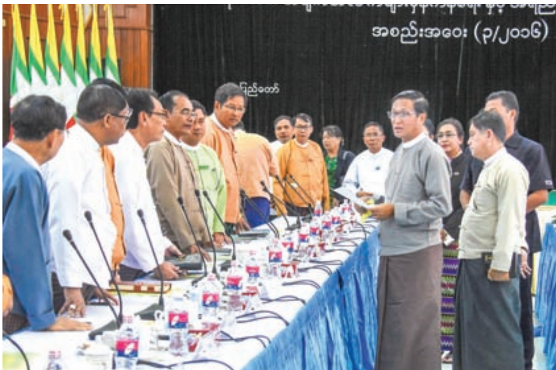
Vice President U Henry Van Thio greeting the ministers and officials.