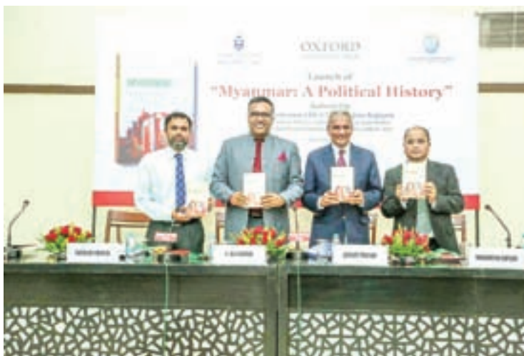
The book launching ceremony in progress.

Ambassador Gautam Mukhopadhyaya, Former Ambassador of India to Myanmar, said, "The book has been authored by a scholar from Myanmar, a country that is extremely important