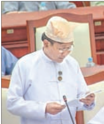
Dr Maung Thin.

The minister made the statement in response to a motion urging the union government to take action against distilleries that