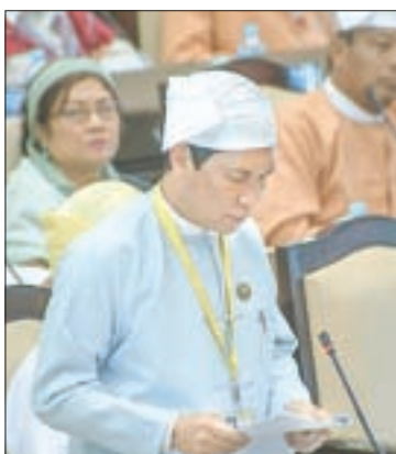
U Khin Maung Cho.

THE site of the Sittaung Paper Factory will be developed as industrial zones by the Shwe Thanlwin Company, the Union Minister for Industry U Khin Maung Cho said at the Amyotha Hluttaw Session yesterday. The Shwe Thanlwin Highway Company was already issued 30-year land grants for 698 acres of land at the site on 10 September