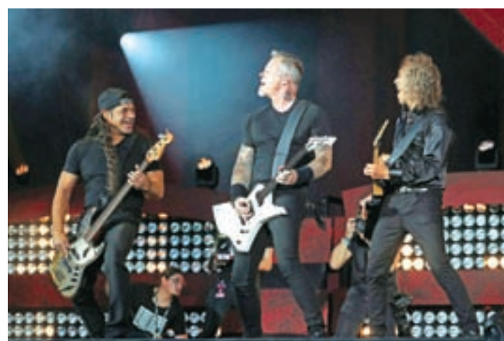
Metallica performs at the Global Citizen Festival at Central Park in Manhattan, New York, US, on 24 September 2016.

Mars' "24k Magic" debuted at No. 2 with sales of 231,000 album units, while Lambert's "Weight of These Wings"