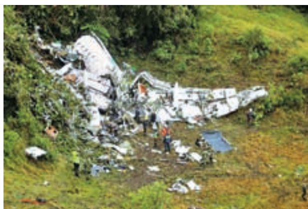
Wreckage from a plane that crashed into Colombian jungle with Brazilian soccer team Chapecoense, is seen near Medellin, Colombia, on 29 November 2016.

Chapecoense, from Brazil's top league, had