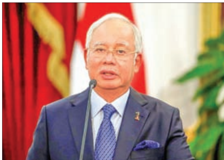
Malaysia's Prime Minister Najib Razak talks to the media beside Indonesia's President Joko Widodo after a bilateral meeting at Presidential Palace in Jakarta, Indonesia, on 1 August 2016.

KUALA LUMPUR — Malaysia's prime minister has expressed support for strict Islamic laws as he seeks to consolidate support of ethnic Malay Muslims at a party meeting this week, as frustration over graft and the economy cloud prospects for the next election.