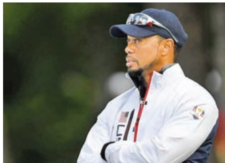
Team USA vice-captain Tiger Woods talk at the 13 th green during the practice round for the Ryder Cup at Hazeltine National Golf Club in Chaska, Minnesota, on 18 September 2016.

"The competitor inside me wanted to go so badly and was itching to go. I thought if I only have a few shots, it's good enough to get it around," he added.— Reuters