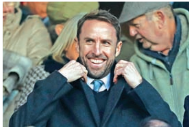
Gareth Southgate.

of players, which include midfielders Jordan Henderson and Adam Lallana, who have publicly backed Southgate for the England job.