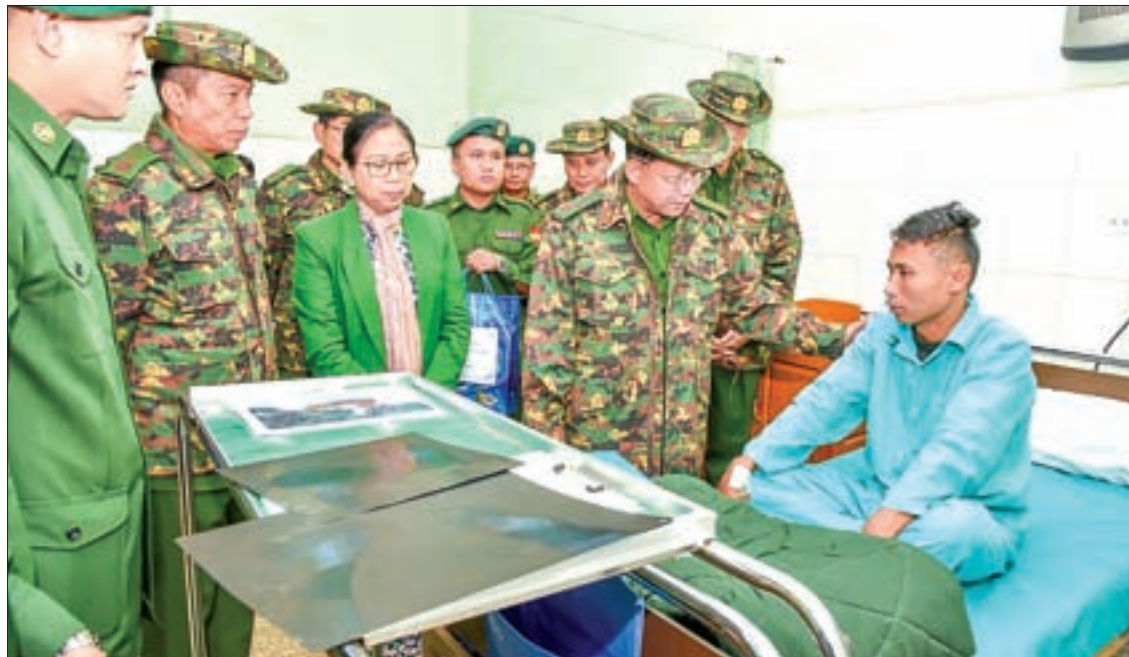
Senior General Min Aung Hlaing speaking words of encouragement to a soldier patient.