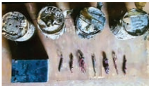
Four improvised landmines.

Government troops, while conducting area clearance operations, were attacked with grenades by 10 members of the TNLA yesterday morning but they got away when government troops returned fire.— Myanmar News Agency