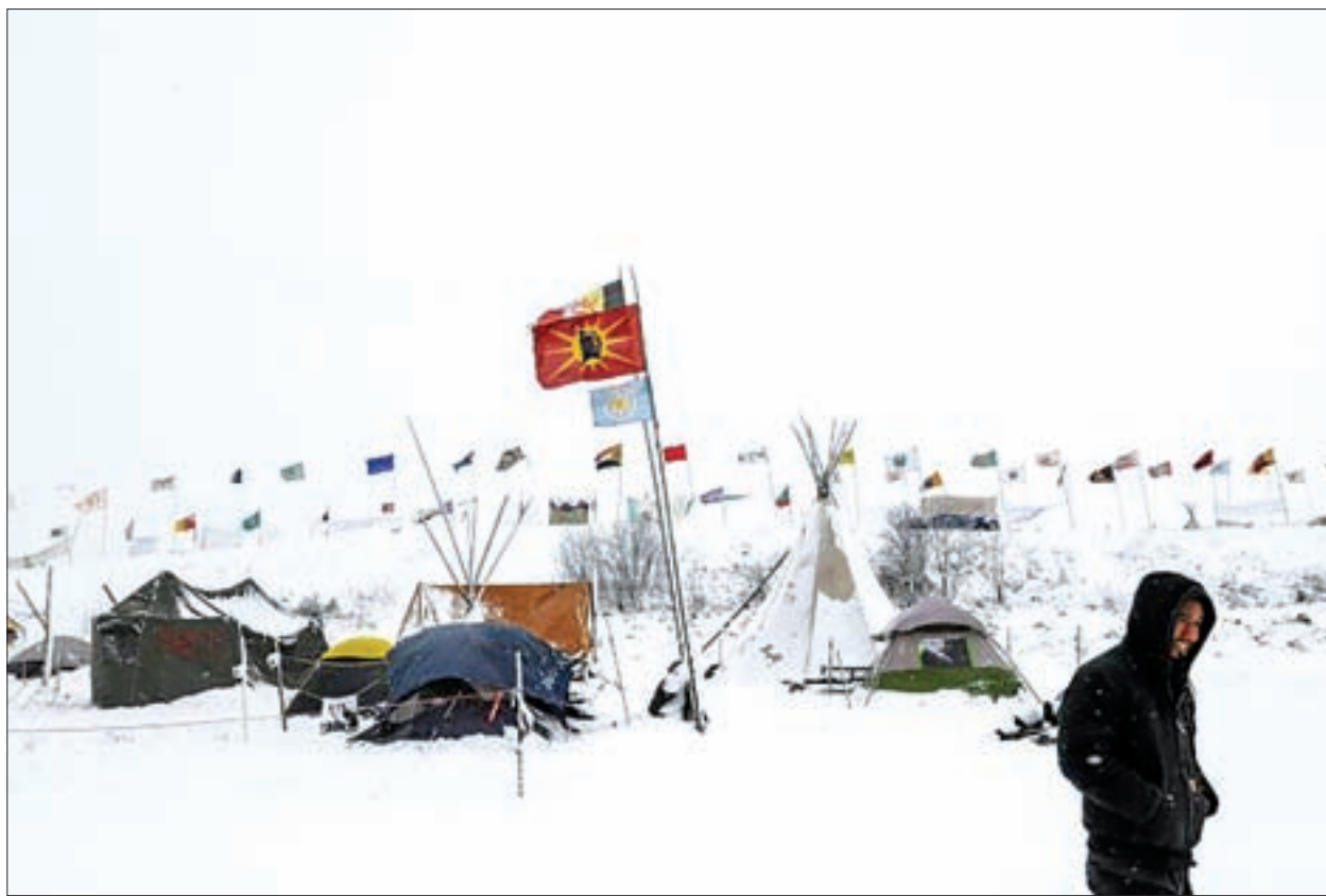
The Oceti Sakowin camp is seen in a snow storm during a protest against plans to pass the Dakota Access pipeline near the Standing Rock Indian Reservation, near Cannon Ball, North Dakota, US, on 28 November 2016.

that the evacuation order, which the governor said he issued for the campers' well-being in the face of dangerous winter weather, came a week after police turned water hoses on protesters in sub-freezing temperatures.