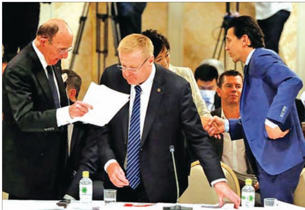
International Olympic Committee (IOC) Vice President and Chairman of the Coordination Commission for the Tokyo 2020 Games John Coates and Tokyo Governor Yuriyo Koike attend a meeting of the Four-Party Working Group, gathering representatives of the IOC, the Tokyo 2020 Organising Committee, the Tokyo Metropolitan Government and the government of Japan, in Tokyo, Japan, on 29 November 2016.

TOKYO — The Tokyo Olympic organising committee's proposed cap on its overall budget of 2 trillion yen was shot down by the International Olympic Committee at a four-party working group reviewing costs for the 2020 Games on Tuesday.