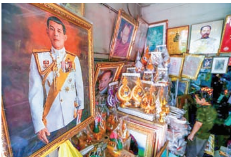
A picture of Crown Prince Maha Vajiralongkorn is displayed for sale at a royal memorabilia shop as Thailand's parliament is set to announce his ascend to the throne after revered King Bhumibol Adulyadej passed away on 13 October in Bangkok, Thailand, on 29 November 2016.

Two senior military sources said Crown Prince Vajiralongkorn would fly into Bangkok on Wednesday