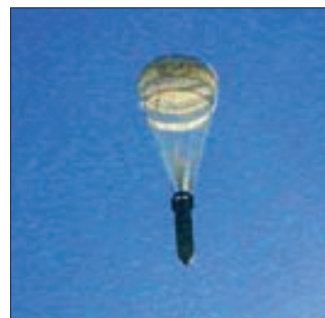
A missile hangs on a parachute while falling over the rebel-held besieged al-Qaterji neighbourhood of Aleppo, Syria, on 28 November 2016.

Hundreds of miles to the south, people started to leave the rebel-held Damascus suburb of Khan al-Shih for other parts of the country controlled by insurgents under a deal with the government, the Observatory said.