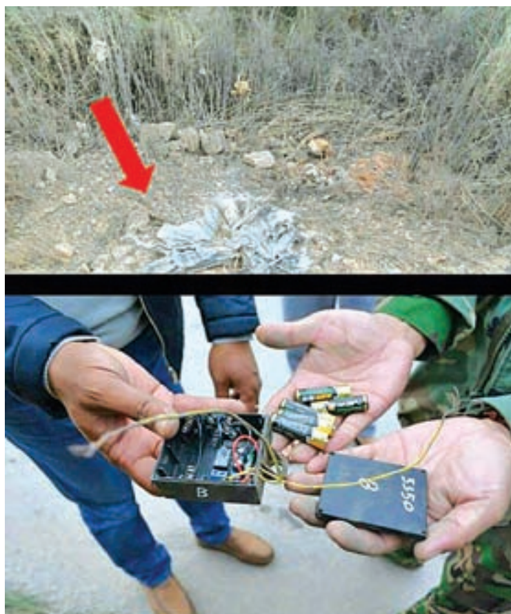
A location of explosion (above), the explosives (under).

Explosions in the wards of Kaunghmuton, Hona and Sethmu Kwethit occurred at about 9:40pm. About an hour later, more explosions occurred near Sethmu Lan and near the village of Mantmai, but caused no injuries, it is learnt. Upon learning that the KIA, TNLA armed groups had entered the wards of Kaunghmuton, Hona and Sethmu Kwethit to extort some factory workers, Security forces were dispatched to clear the area, it is learnt.— Myanmar News Agency