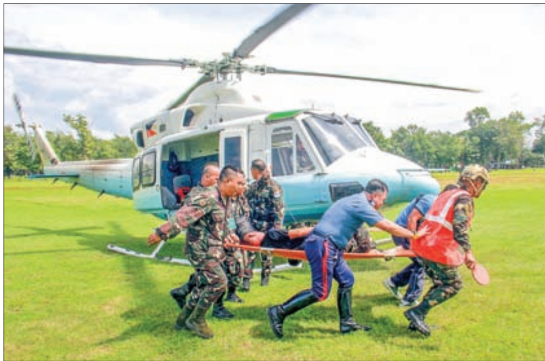
Soldiers carry on a stretcher a wounded member of Philippine President Rodrigo Duterte's presidential security group who was airlifted at an army camp in Cagayan de Oro after being hit in a roadside bomb attack in Lanao del Sur, Philippines on 29 November, 2016.

Some 40 militants from the Maute Group, which has pledged allegiance to Islamic State, have been killed during an air-and-ground assault on an old munic-