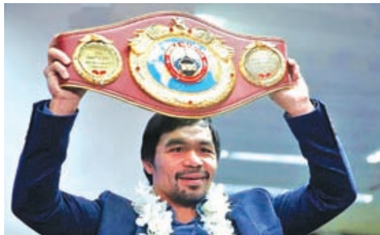
Filipino boxer and Senator Manny Pacquiao raises his boxing winning belt during a news conference upon arrival, after winning WBO welterweight bout with Jessie Vargas, at Ninoy Aquino International airport in Paranaque, Metro Manila in the Philippines, on 8 November 2016.

"I am willing to help develop and train Japanese boxers. Japanese people are disciplined and hard working. It is not difficult to produce a Japanese version of Manny Pacquiao."—Kyodo News