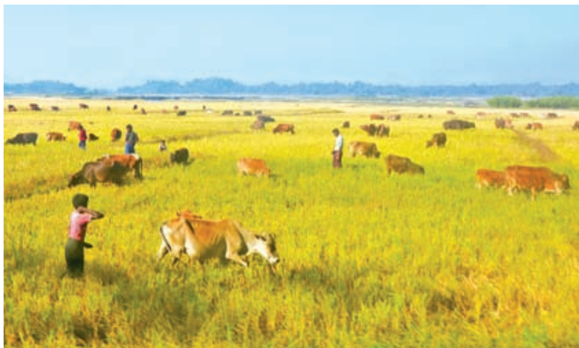
Cows are seen feeding on the grass in the paddy fields.

It is learnt that a budget has been allotted to rebuild embankments by the salt water destroyed, and the process of breeding pedigree cows and goats is being upgraded. —Myint Maung Soe