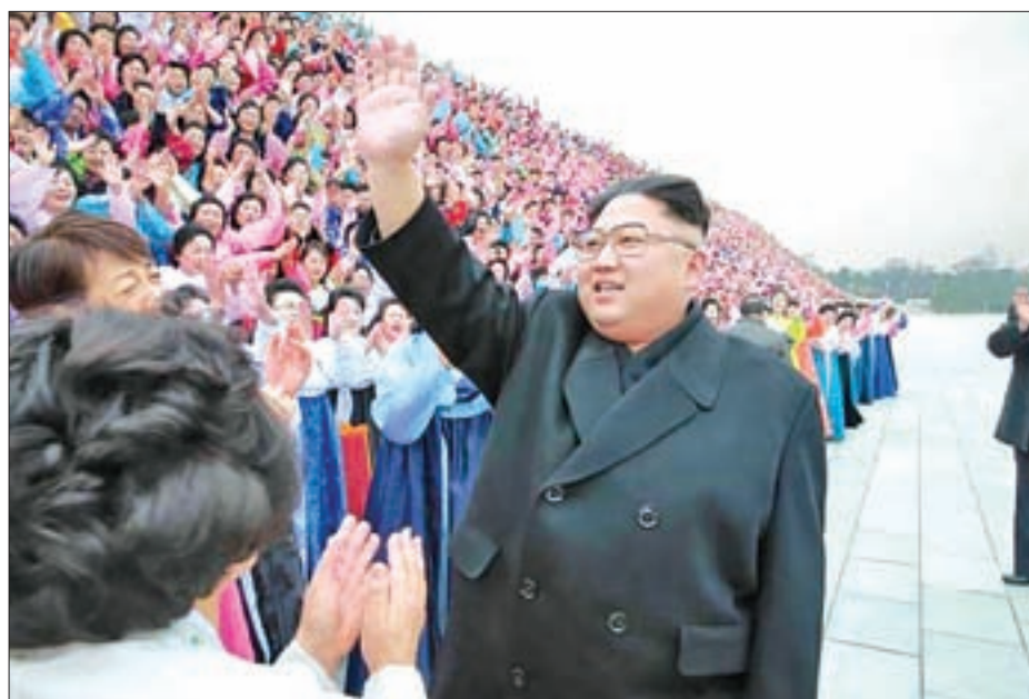
North Korean leader Kim Jong Un takes part in a photo session with the participants of the 6 th Congress of the Democratic Women's Union of Korea in this undated photo released by North Korea's Korean Central News Agency (KCNA) in Pyongyang, on 22 November 2016.

The resolution would also ban the North's export of helicopters, vessels and statues, banning contracts similar to the ones worth millions of dollars that the North had signed to build large statues in some African