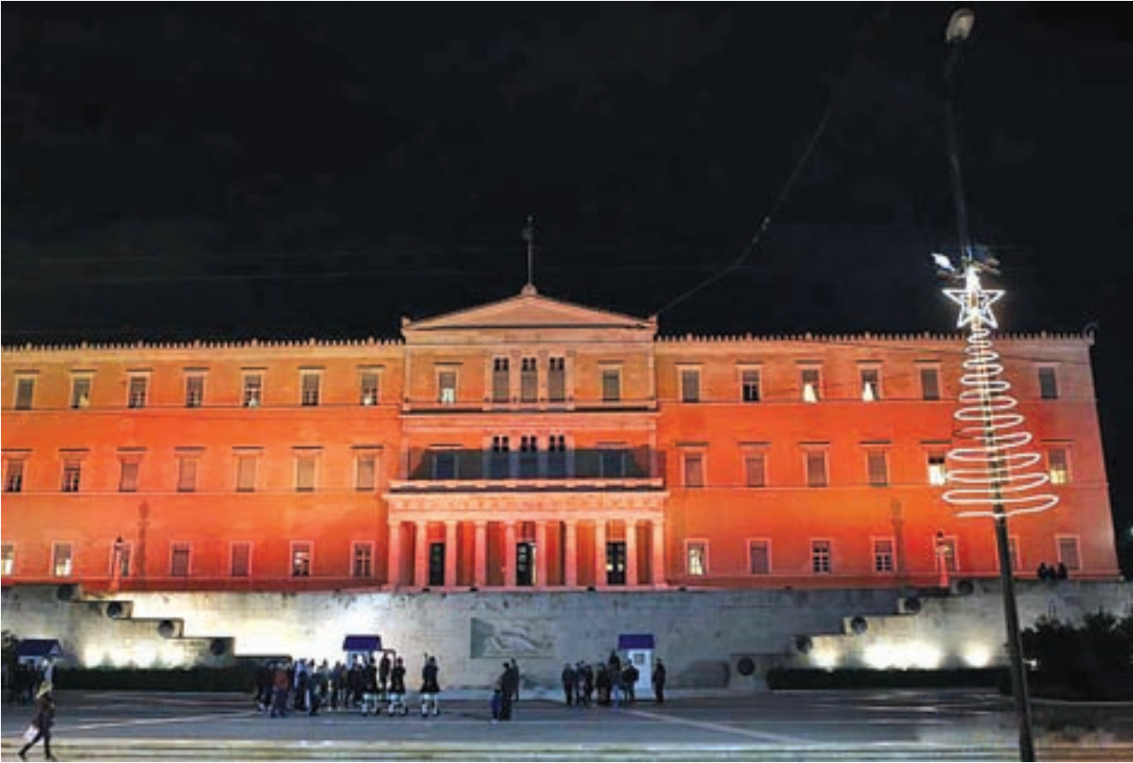
The building of Greek Parliament is lit up in pink in support of the International Day for the Elimination of Violence against Women, in Athens, capital of Greece, on 25 November 2016. In 1999, the UN General Assembly designated on 25 November as the International Day for the Elimination of Violence against Women to raise public awareness of the serious problem.

UNITED NATIONS — UN Secretary-General Ban Ki-moon on Friday called for global action to increase resources and spending to promote solutions to violence against women and girls. “Violence against women and girls imposes large-scale costs on families, communities and economies,” said Ban in a message on the day. “Violence against women also results in lost productivity for businesses, and drains resources from social services, the justice system and health-care agencies.” Ban said though there is growing global recognition that violence against women and girls is a human rights violation and serious obstacle to sustainable development, yet there is still much more to do to turn the awareness into meaningful response. Therefore, he called on governments to increase national spending in all relevant areas, including in support of women’s movements and civil society organisations. And he also encouraged the private sector and citizens to do their part in support of women and girls. In 1999, the UN General Assembly designated 25 November as the International Day for the Elimination of Violence against Women to raise public awareness of the serious problem.—Xinhua