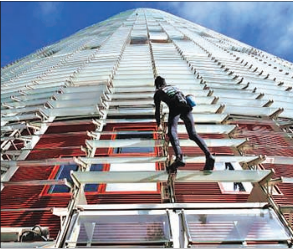
French climber Alain Robert, also known as ‘The French Spiderman’, scales the 38-story skyscraper Torre Agbar in Barcelona, Spain, on 25 November 2016.

BARCELONA — French “Spiderman” Alain Robert scaled one of the tallest skyscrapers in Barcelona without a harness on Friday. Bystanders and police watched as the 54-year-old climbed up and then descended the Torre Agbar, a glass-covered office building known for its night-time illuminations, completing the feat in around one hour. The urban climber is famous for his daredevil, harness-free approach to scuttling up buildings with nothing more than some chalk on his hands and climbing shoes on his feet. Robert has conquered over 100 structures worldwide including San Francisco’s Golden Gate Bridge, Dubai’s Burj Khalifa complex, the Eiffel Tower in Paris and the Sydney Opera House without safety equipment.—Reuters