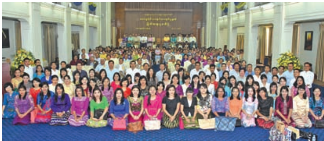
The group photo taken after the respect-paying ceremony.

A total of 240 faculty members attended the ceremony and plans are underway at least within three years.—Myat Sandi