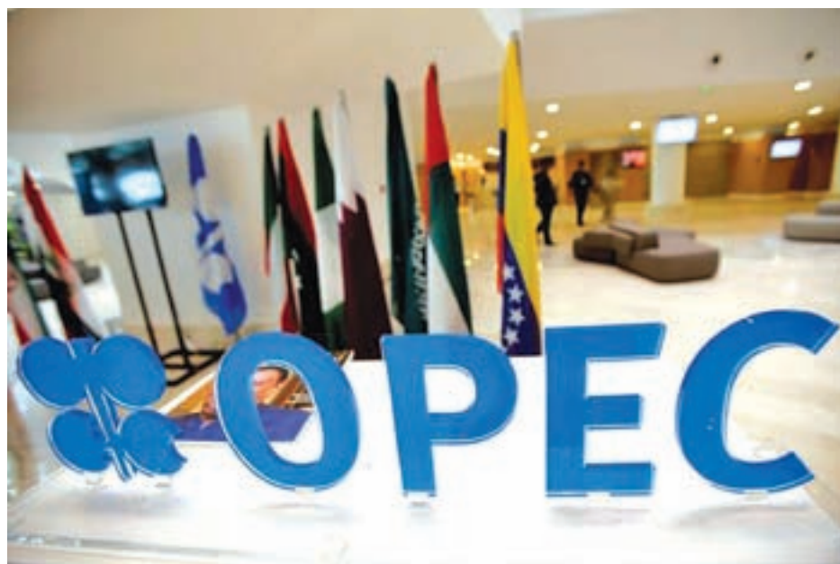
OPEC logo is pictured ahead of an informal meeting between members of the Organisation of the Petroleum Exporting Countries (OPEC) in Algiers, Algeria, on 28 September 2016.

Saudi Arabia had asked that this earlier meeting be called off, but was convinced by other members to attend in order not to embarrass the group, a source said.—Reuters