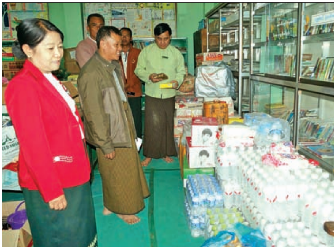
Shan State cabinet officials inspect aids delivered for internally displaced persons.