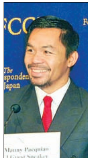
Manny Pacquiao, current WBO welterweight champion and Philippine senator, attends a press conference in Tokyo on 26 November 2016.

After explaining that he wants his legacy to be his relationship with God rather than anything linked to his