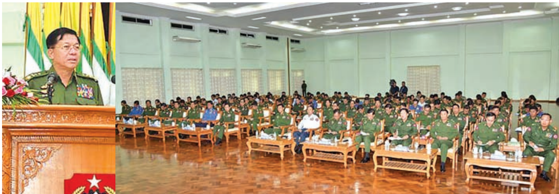
Senior General Min Aung Hlaing addressing senior military officers at National Defence University.

TATMADAW has to continued to play a role in national politics for the political stability and ethnic affairs of the country, Commander-in-Chief of Defence Services Senior General Min Aung Hlaing told senior military officers in his speech at the National Defence University yesterday morning.