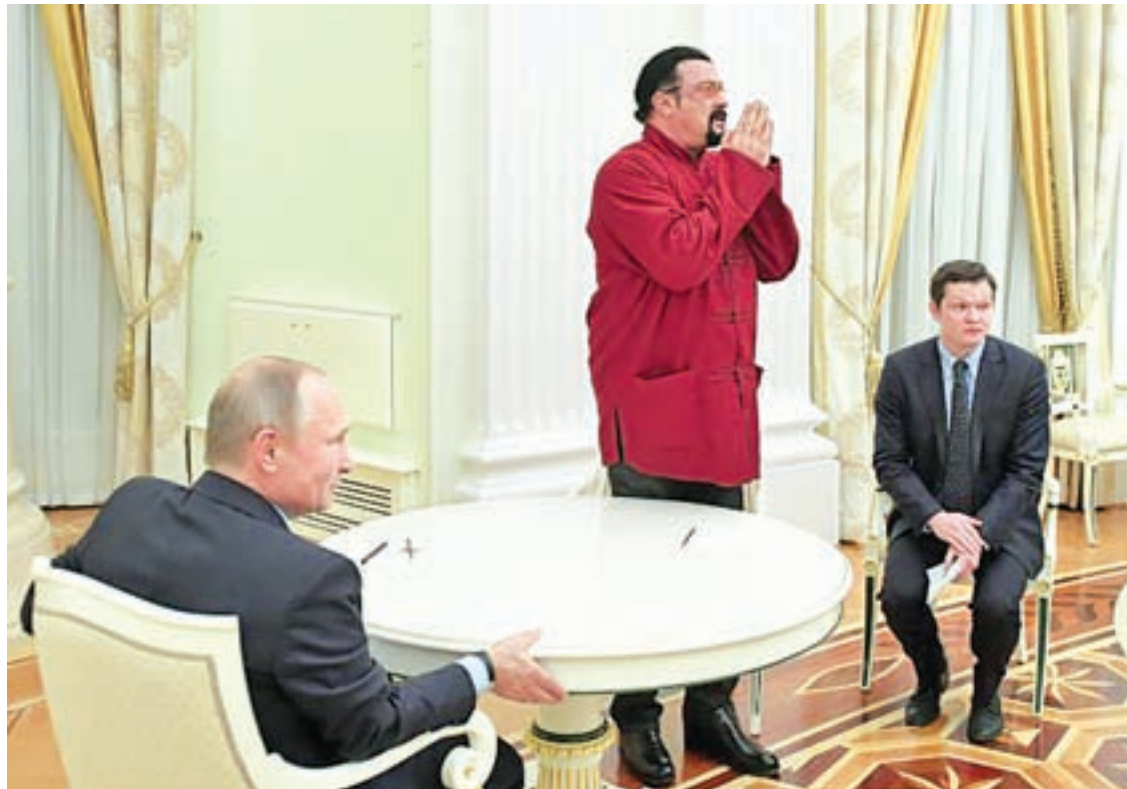
Russia's President Vladimir Putin (L) meets with US actor Steven Seagal (C) at the Kremlin in Moscow, Russia, on 25 November, 2016.

MOSCOW — Russian President Vladimir Putin presented a Russian passport to US actor Steven Seagal on Friday and said he hoped it would serve as a symbol of how the fractious ties between Moscow and Washington are starting to improve.