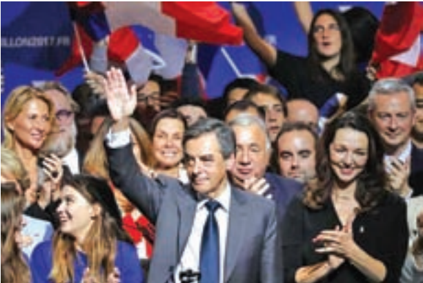
Francois Fillon, former French prime minister and member of Les Republicains political party, attends a rally as he campaigns in the second round for the French centre-right presidential primary election in Paris, France, on 25 November 2016.

PARIS — Former prime minister Francois Fillon looked on Friday to be in a strong position to claim his centre-right party’s nomination to contest next year’s French presidential election as he and rival Alain Juppe held final rallies of the primary campaign. In an impassioned speech to supporters in Paris, Fillon, 62, struck a strong patriotic note, vowing to halt “the decline of France” under the ruling Socialists by sticking to what he said was a realistic programme that included ending the 35-hour working week and making big savings by slashing public spending. Juppe, 71, also a former prime minister, defended his more moderate policies, telling supporters: “I’m not going to engage in any grandstanding against our public service. I want to manage, not demonize, it.” A new survey issued on Friday night saw Fillon as clear favorite, winning Sunday’s vote with 61 per cent against Juppe’s 39 per cent. The ballot on Sunday will send one of the two veteran conservatives into an electoral battle that opinion polls say will boil down finally to a duel with far-right leader Marine Le Pen next May. Fillon, who defied predictions to emerge as surprise winner of Les Republicain’s first-round primary on 20 November,