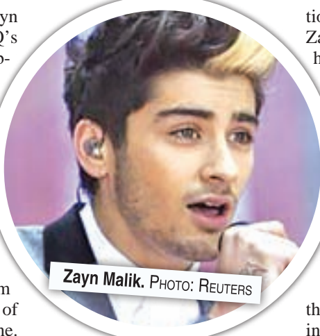
Zayn Malik.

However, this is not the first time the "Pillowtalk" has received the accolade as he was recognised for his incredible sense of style in 2013, which makes him