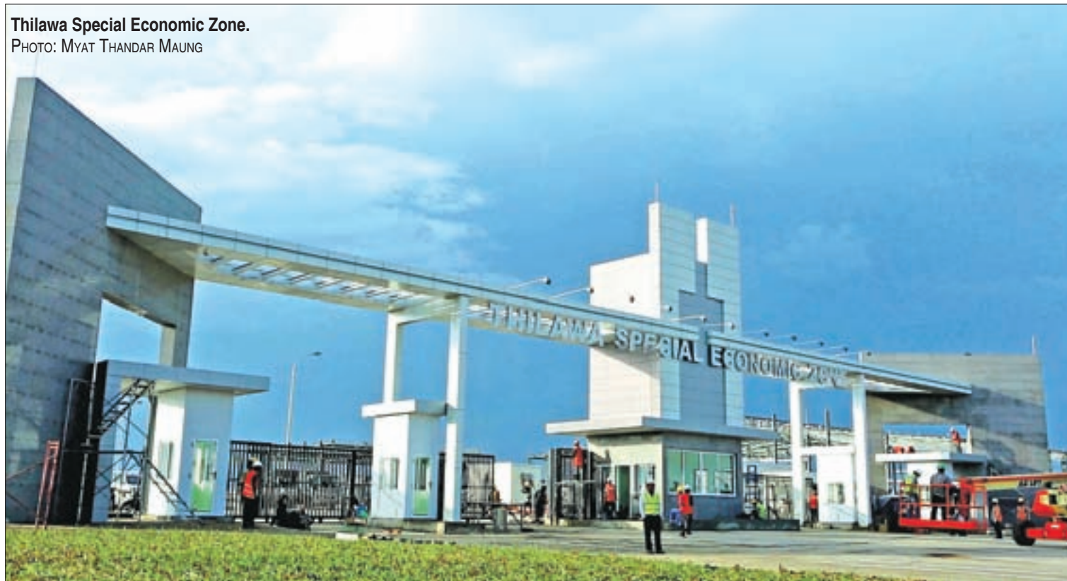
Thilawa Special Economic Zone.