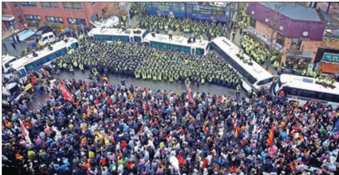
Police buses are parked on a road to block protesters at a protest calling South Korean President Park Geun-hye to step down in Seoul, South Korea, on 26 November 2016.