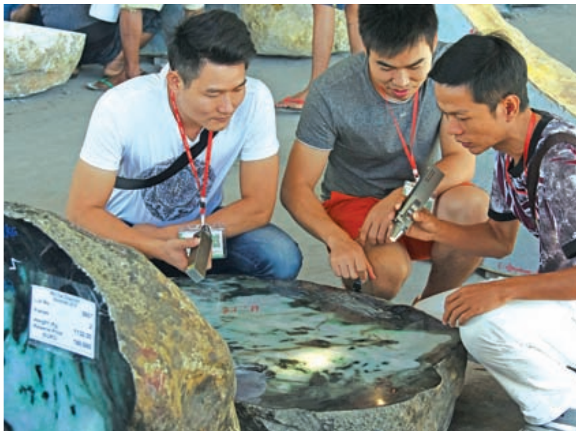
Gems and jade merchants examine jade lot at Mid-year Gem Emporium.

6. Both sides agreed to hold the (2+2) High Level Consultation annually in Myanmar and China alternatively. The Second Consultation will be held in China in 2017.