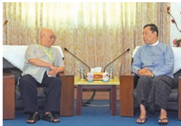
KNU chairman talks to Thura U Shwe Mann.