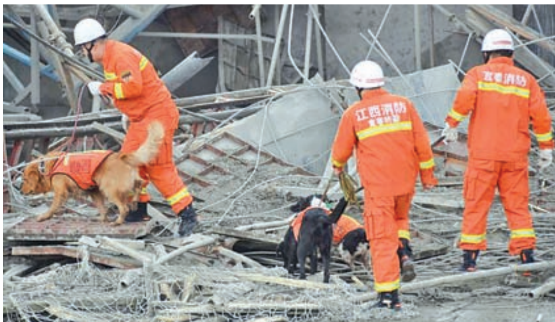
Rescue workers search at the site where a power plant's cooling tower under construction collapsed in Fengcheng, Jiangxi province, China, on 24 November 2016.

The company in charge of the power plant, Jiangxi Gan-neng Co, said in a stock exchange filing on Thursday it was cooperating with authorities.—Reuters