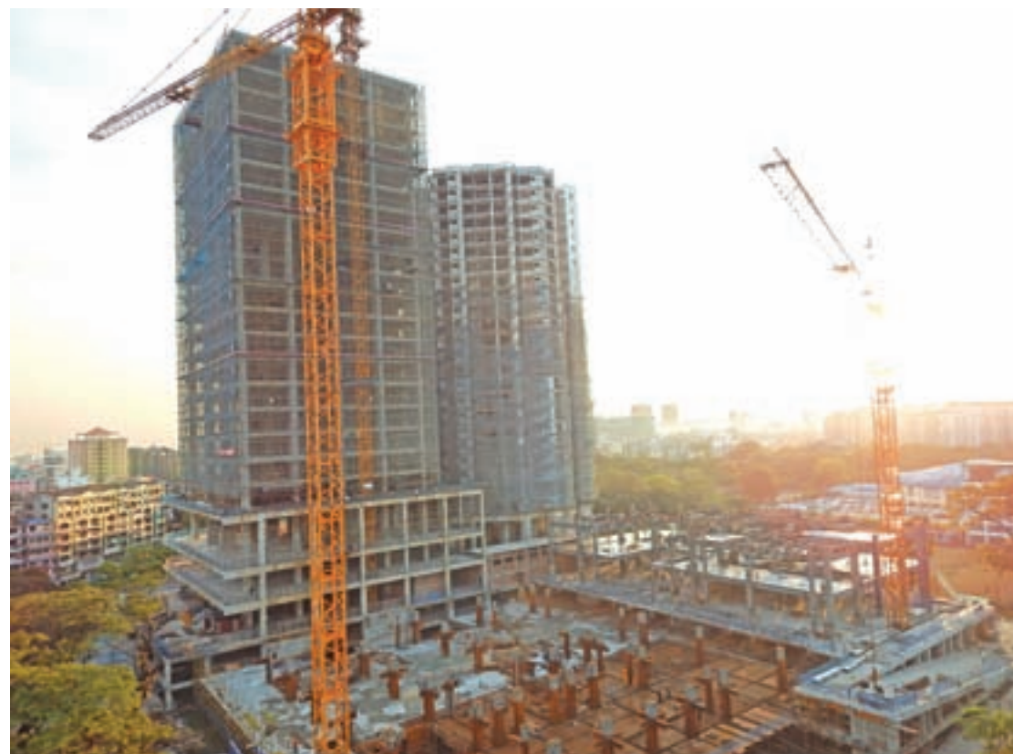
Kanthaya Tower in downtown Yangon, currently under construction .

The project is being implemented with 20 foreign engineers, 30 local engineers and over 300 workers. It is estimated that the project will create over 3,000 job opportunities after it is finished, with the project implementers planning to carry out social activities for residents living near the project area.— Soe Win (MLA)