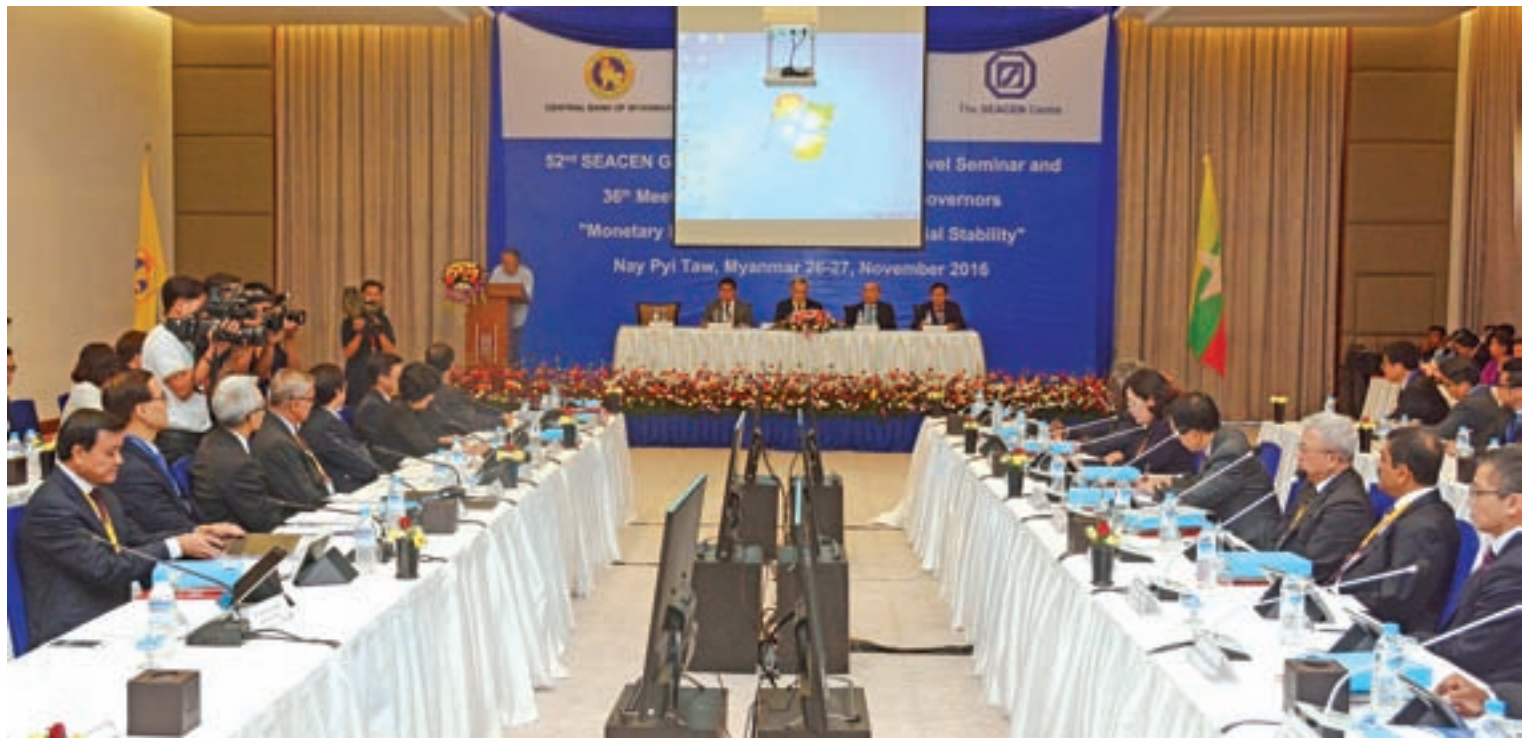
52 nd SEACEN Governors' Conference in progress.