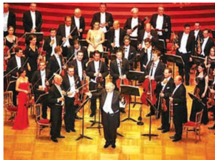
Opera singer Placido Domingo performs on stage during the opening ceremony of the Opera Ball in Vienna, on 4 February 2016.

"But when I sussed out that there were no rules regarding how we wore our school blazers, I would walk around the place with one arm in a sleeve, the other out, with my jacket dangling over a shoulder," he had said.— PTI