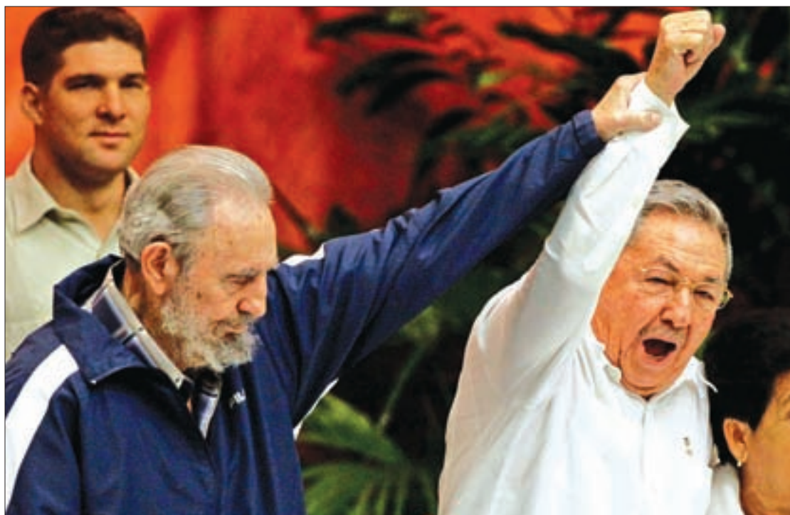
Former Cuban leader Fidel Castro (L) holds up the arm of his brother, Cuba's President Raul Castro, during the closing ceremony of the sixth Cuban Communist Party (PCC) congress in Havana in 2011 file photo.

HAVANA — Fidel Castro, the Cuban revolutionary leader who built a communist state on the doorstep of the United States and for five decades defied US efforts to topple him, died on Friday, his younger brother announced to the nation. He was 90.