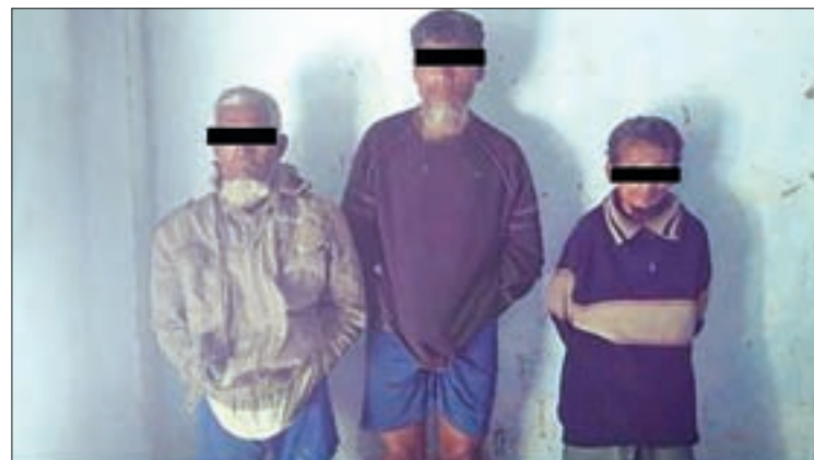
Three suspects in police custody. PHOTO: MNA

The three men will be handed over to authorities under rule of law.— Myanmar News Agency