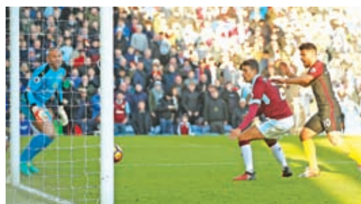
Manchester City's Sergio Aguero scores their second goal against Burnley during Premier League at Turf Moor, on 26 November 2016.