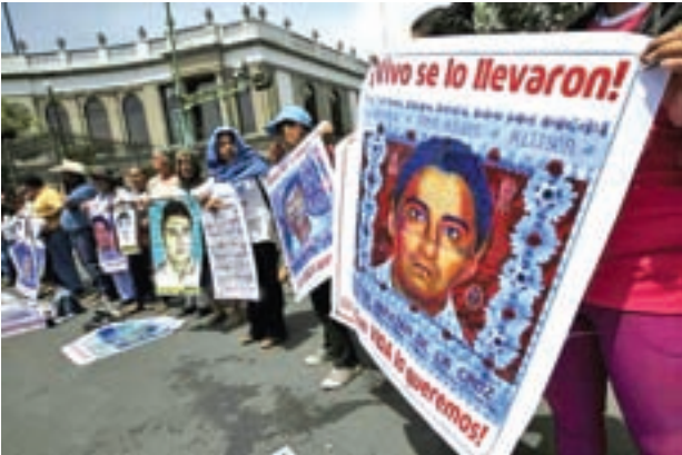
Relatives hold pictures of some of the 43 missing students of Ayotzinapa College Raul Isidro Burgos, as they take part in a protest to demand justice for the missing students, near the Interior Ministry in Mexico City, Mexico, on 15 April 2016.

appear’ them so as not to leave witnesses,” it said. Mexico’s army has been accused of human rights abuses, including extra-judicial killings in the past. Neither the Defence Ministry, nor the Interior Ministry responded immediately to requests for comment. The President’s office declined to comment.—Reuters